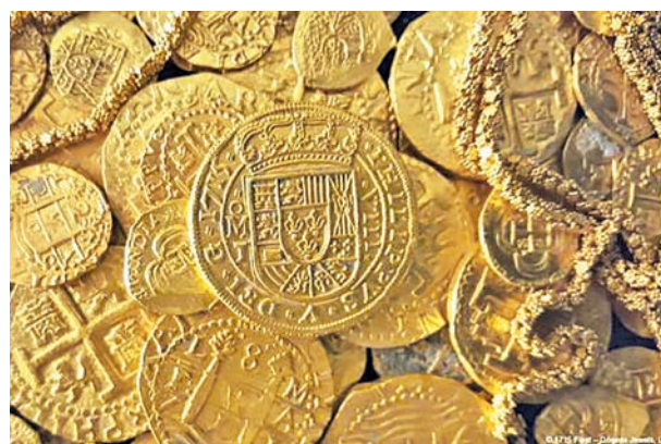
Gold coins and gold chain found in the wreckage of a 1715 Spanish fleet that sunk in the Atlantic off the Florida coast are seen in an undated handout picture courtesy of 1715 Fleet - Queens Jewels LLC.