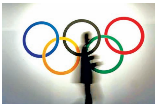
A man walks past the Olympic rings before the opening of the 127 th International Olympic Committee (IOC) session in Monaco on 8 Dec, 2014.

"USOC have made it clear that they would still very much like to see a US city host the Olympic