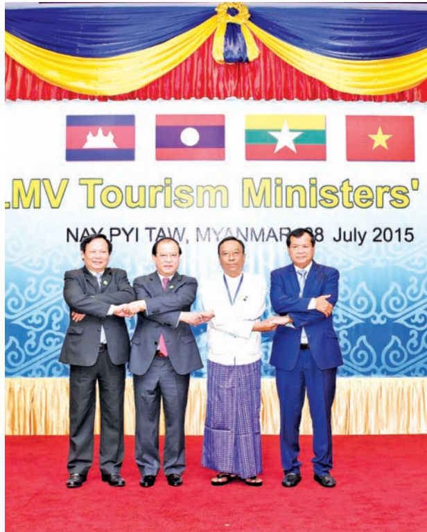
Ministers join hands at CLMV Tourism Ministers Meeting.—MNA

NAY PYI TAW, 28 July — The third meeting of tourism ministers from CLMV countries was held at the Royal Ace Hotel in Nay Pyi Taw on Tuesday afternoon.