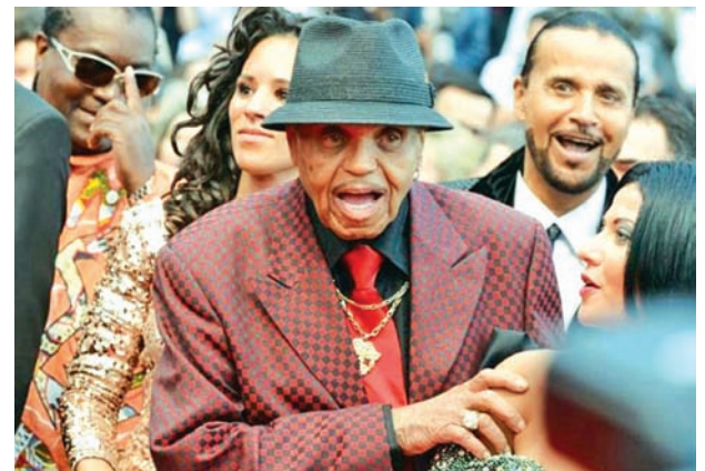
Joe Jackson (C), Michael Jackson's father, and guests pose on the red carpet as they arrive for the screening of the film "Sicario" in competition at the 68th Cannes Film Festival in Cannes, southern France, on 19 May, 2015.

A representative for Jackson could not immediately be reached.—Reuters