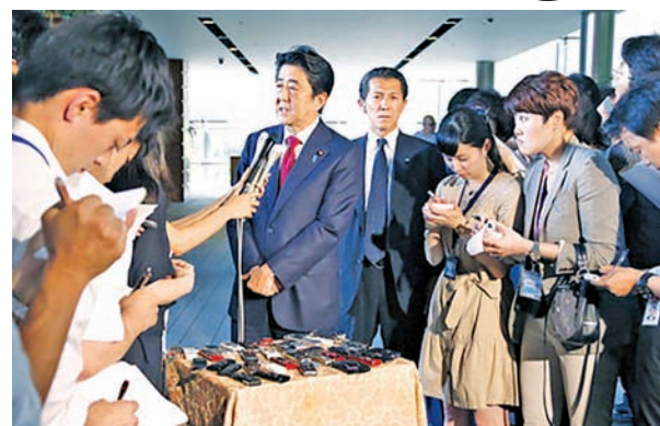
Photo taken on 17 July, 2015, shows Japanese Prime Minister Shinzo Abe announcing the government's decision to scrap the initial construction plan for the new national stadium and devise a new one from scratch following public criticism over its soaring costs. The sports ministry said on 28 July that the official in charge of stadium construction will quit and be replaced the following week.

Kubo assumed his current post in January 2012 and was involved in efforts to have Tokyo chosen to host the 2020 Summer Olympics. As head of a ministry bureau overseeing the Japan Sports Council, the operator of the venue, he was in charge of coordination with the Tokyo met-