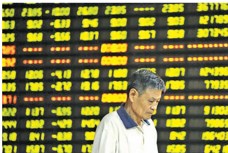
An investor stands in front of an electronic board showing stock information at a brokerage house in Huaibei, Anhui Province, on 27 July, 2015.

Monday's dramatic slide shattered three weeks of relative calm for Chinese equities, secured through heavy government intervention in which authorities pumped liquidity into the market