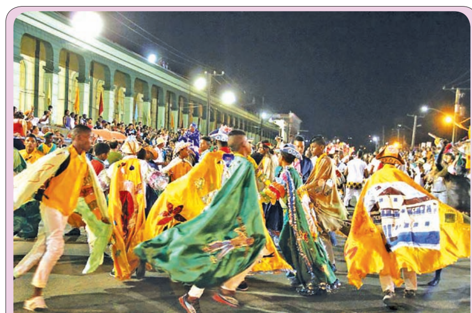
People take part in a carnival in commemoration of the 500th anniversary of the establishment of the city, in Santiago de Cuba, Cuba, on 27 July, 2015.