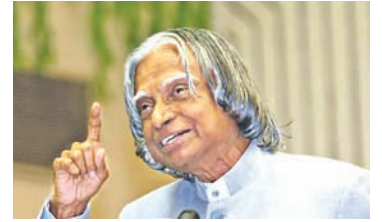
Former Indian president APJ Abdul Kalam

Kalam, who was India's 11 th president from 2002 to 2007, had collapsed earlier in the day while delivering a lecture, according to Indian media reports.