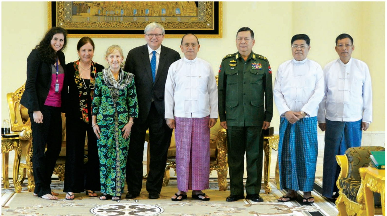
President U Thein Sein poses for documentary photo with Mr Kevin Rudd, President of US-based Asia Society Policy Institute and party.