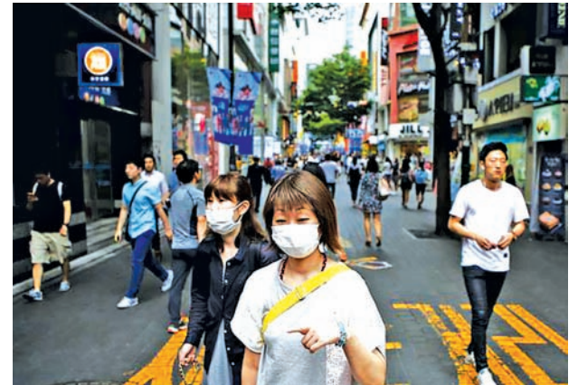
Women wearing masks to prevent contracting Middle East Respiratory Syndrome (MERS) walk at Myeongdong shopping district in central Seoul, South Korea, on 9 July, 2015.

Twelve people remain hospitalized in South Korea and under treatment for MERS although only one is still testing positive for the MERS virus, the Health Ministry said, adding that no new cases have been reported since 4 July. Health experts say the virus has an incubation period of about two weeks.