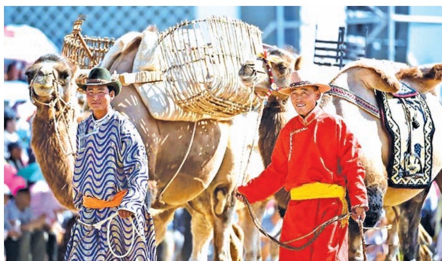
Herdsman pulling camels attend the opening ceremony of the 13 th Nadam Fair in Sunite Right Banner, Xilingol League, north China's Inner Mongolia Autonomous Region, on 28 July, 2015. Nadam is a mass traditional Mongolian festival where people celebrate harvests and pray for good luck. During the three-day event, activities including archery, wrestling, horse racing and folk performance will be held.

FORECAST FOR MANDALAY AND NEIGHBOURING AREA FOR 29 th July, 2015: Some rain or thundershowers. Degree of certainty is (100%).