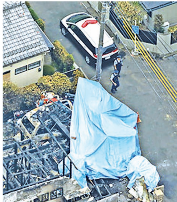
Photo taken on 28 July, 2015 from a Kyodo News helicopter shows the Piper PA-46 aircraft, covered in a blue sheet, that crashed in a residential area in western Tokyo on 26 July. Police and the Transport Safety Board are investigating whether the high temperature that day or the load weight was behind the cause of the accident, which killed three people, while also looking into the possibility of engine trouble.—KYODO NEWS

Single-engine propeller aircraft like the Piper PA-46 tend to drastically lose power when the outside temperature rises to around 35 C, the aviation sources said. Little wind and the 800-metre runway at Chofu Airfield may have also made it difficult for the plane to gain altitude bearing in mind its heavy load, they said.—Kyodo News