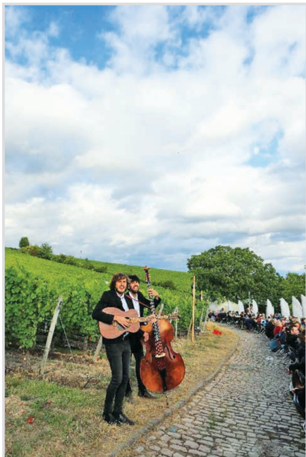
Artists perform at the Steinberg Tafelrunde during Rheingao Music Festival in Hattenheim, Germany, on 25 July, 2015. The Rheingao Music Festival is held from 27 June to 12 September.