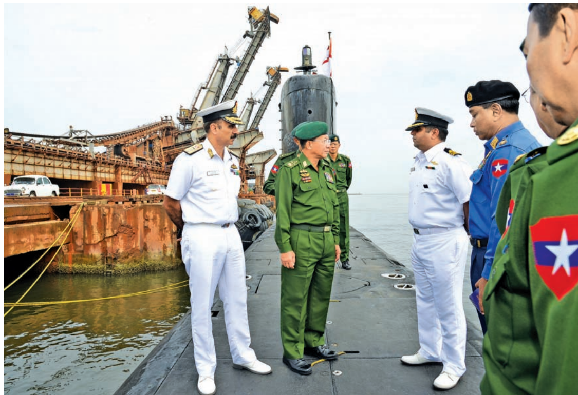
Senior General Min Aung Hlaing visits Submarine of Indian Armed Forces.