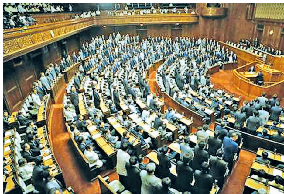
Japan's parliament passes a bill into law at a plenary session of the House of Representatives in Tokyo on 28 July, 2015, for redrawing electoral districts to narrow vote weight disparities between constituencies in upper house elections that the Supreme Court has ruled "in a state of unconstitutionality."

TOKYO, 28 July — Japan's parliament passed into law on Tuesday a bill to redraw electoral districts to narrow vote weight disparities between constituencies in upper house elections that the Supreme Court has ruled "in a state of unconstitutionality."