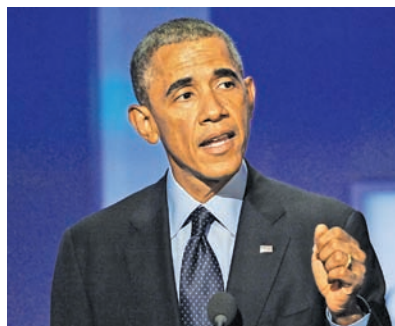
US President Barack Obama

Huckabee, one of more than a dozen candidates vying for the Republican presidential nomination, denounced a deal with world powers over Iran's nuclear programme by saying Obama was marching Israelis "to the door of the oven," a reference to the Nazi gas chambers that killed millions of Jews in the Holocaust.