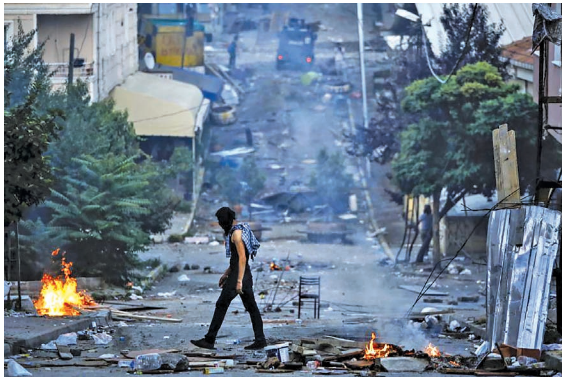
A masked far left-wing protester walks during clashes with riot police at a demonstration against the death of Gunay Ozarslan, a member of the far left People's Front who, according to local media reports, was killed by Turkish police during a security operation on Friday, in Istanbul's Gazi neighbourhood, Turkey, on 26 July, 2015.

the purpose of the operation. The purpose of the operation is to clear the border and close the border to Daesh," the official said.