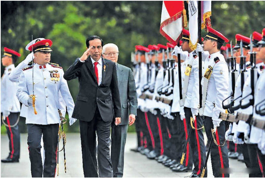
Indonesia's President Joko Widodo (2 nd R Front) inspects the guard of honour during the welcoming ceremony held by Singapore's President Tony Tan Keng Yam (R 2 nd Row) in Singapore on 28 July, 2015. Joko Widodo was on a state visit to Singapore from Tuesday.