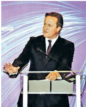
Britain's Prime Minister David Cameron

Cameron highlighted Britain's 15 billion pound Crossrail project, that will connect Heathrow airport west of London to the county of Essex in the east, through 42 km (26 miles) of new tunnels, as an example of the expertise it can bring to Indonesia's traffic-clogged capital.