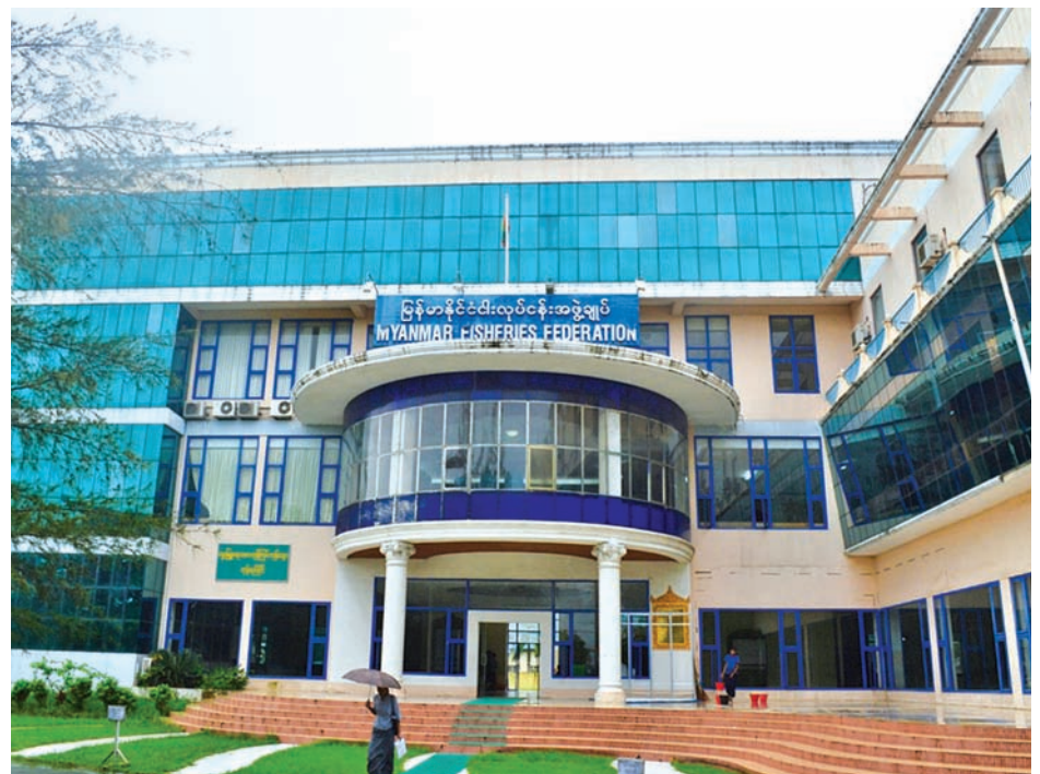
Political parties must articulate their policy stances on the livestock and fisheries sectors ahead of the 8 November general elections, the Myanmar Fisheries Federation says.