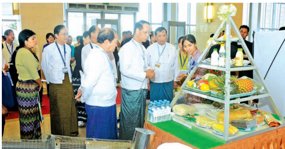
Vice President Dr Sai Mauk Kham views nutritious foods and fruits displayed at National Health Forum.

In his speech, the vice president said the government is taking measures to provide affordable health-care services to the public