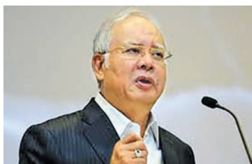
Malaysia's Prime Minister Najib Razak

KUALA LUMPUR, 28 July — Malaysian Prime Minister Najib Razak announced a cabinet reshuffle on Tuesday, appointing Ahmad Zahid Hamidi to replace Muhyiddin Yassin as his new deputy.