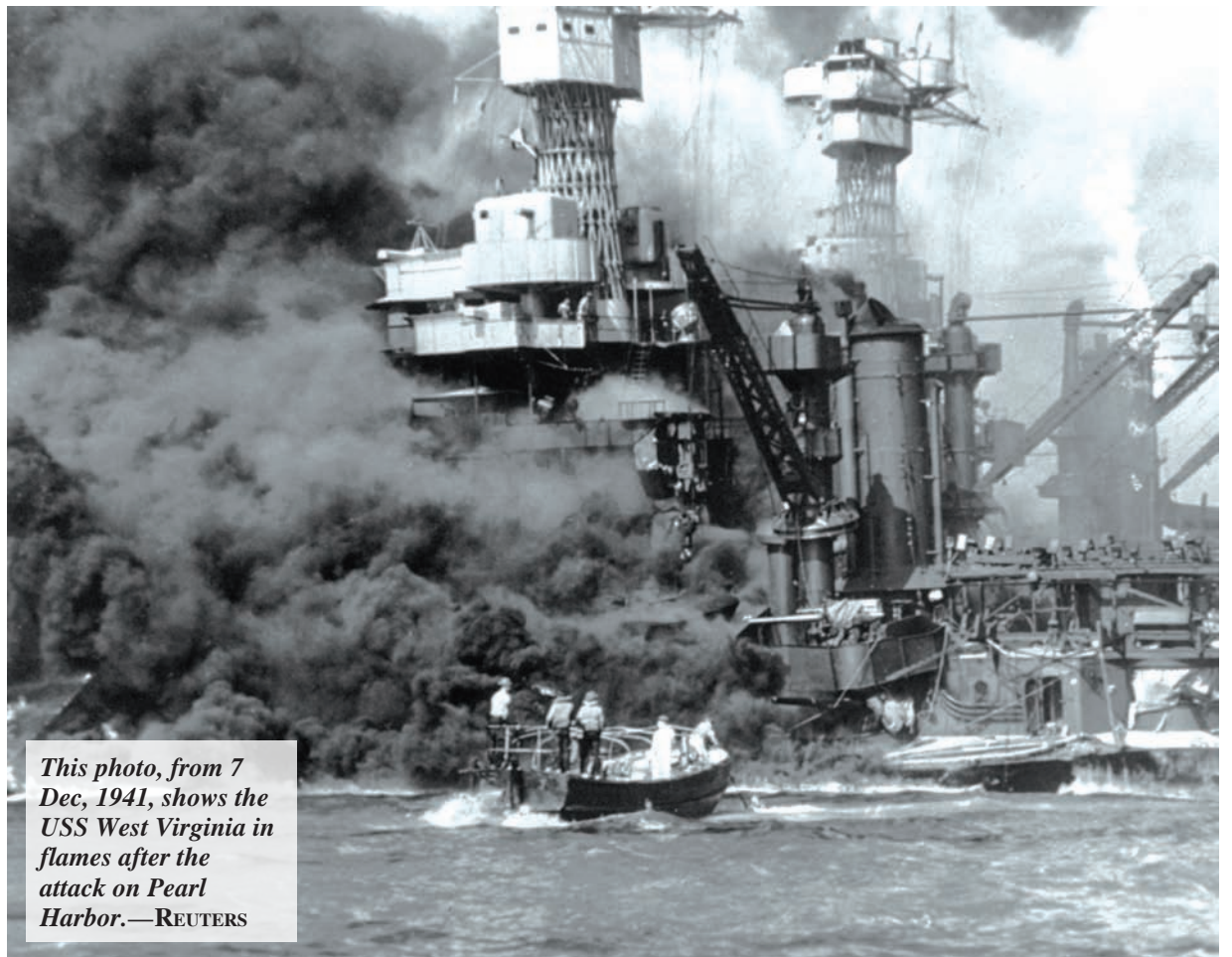
This photo, from 7 Dec, 1941, shows the USS West Virginia in flames after the attack on Pearl Harbor.

Republicans largely oppose the deal and the White House is in the midst of a vigorous campaign to shore up support in Congress. "There is a reason why 99 percent of the world thinks it's a good deal — it's because it's a good deal," Obama said when asked how the selling job with lawmakers was going. — Reuters