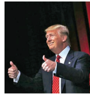
US Republican presidential candidate Donald Trump arrives to speak at the Family Leadership Summit in Ames, Iowa, United States on 18 July, 2015.

That pales in comparison to speeches he made at real estate seminars in 2006