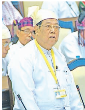
Deputy Minister for Construction U Soe Tint. MNA