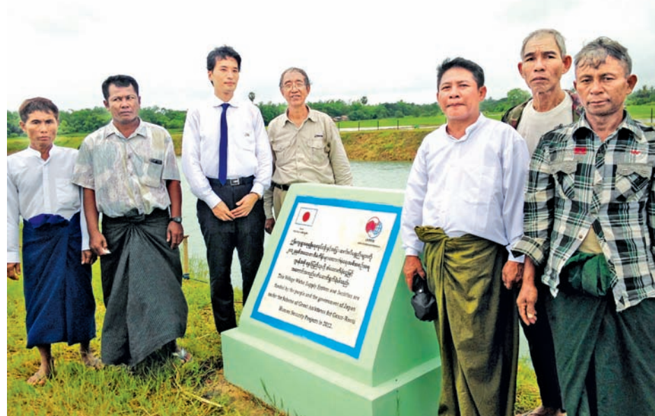
The villagers in Kyungale Village get benefits from water supply facilities constructed under Grant Assistance for Grassroots Human Security Projects (GGP) Scheme of the Japanese government.