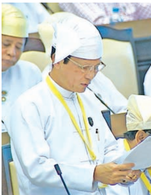
Deputy Minister for Immigration and Population U Win Myint.