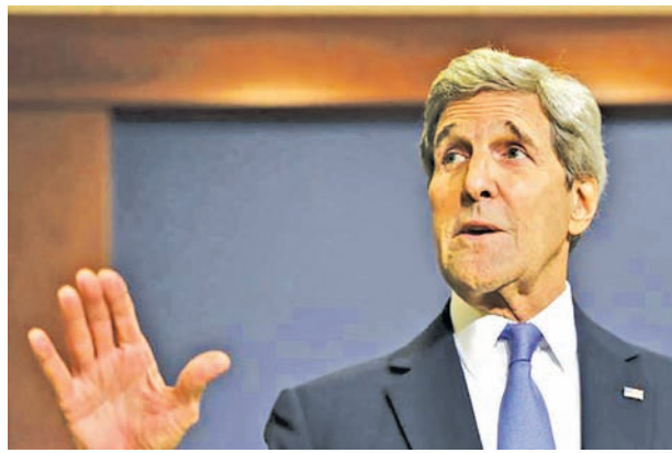
US Secretary of State John Kerry makes a statement to the media before a closed door briefing with House members on the recent Iran nuclear deal in Washington on 22 July, 2015.

“We have leverage, but in nine months, they’ll