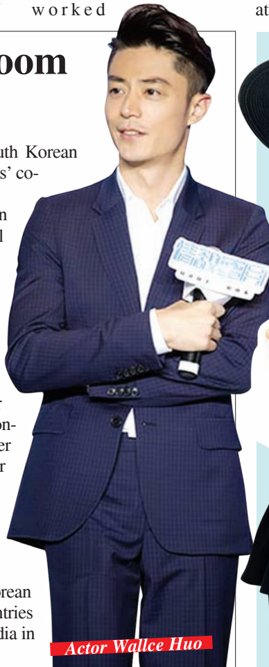
Actor Wallace Huo

"Compared to Hollywood blockbusters, South Korean movies seem more like Chinese titles as our two countries have close connections in culture," he told domestic media in an earlier interview.