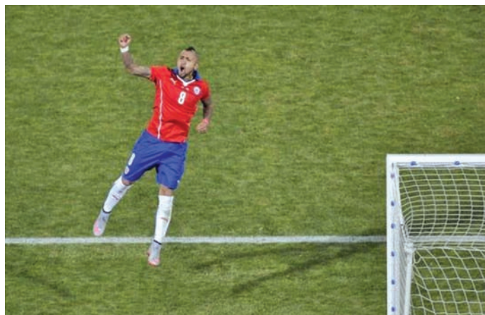
Chile's Arturo Vidal celebrates after scoring his penalty kick during a shootout against Argentina in the Copa America 2015 final soccer match at the National Stadium in Santiago, Chile, on 4 July, 2015.

BERLIN, 23 July — Bayern Munich have confirmed they have reached an agreement with Italy's Juventus to sign Chile international Arturo Vidal, the German club's CEO Karl Heinz Rummenigge said on Thursday.