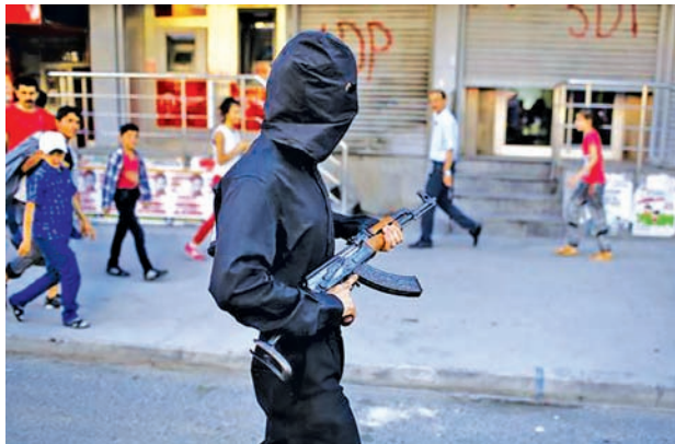
Armed men escort the coffins of victims who were killed in Monday's bomb attack in Suruc, as they arrive at Gazi Cemevi, an Alevi place of worship, in Istanbul, Turkey, on 21 July, 2015.