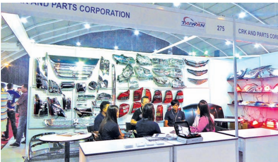
CRK and Parts Corporation displays its auto parts and accessories at 3-in-1 multi-tech shows at Myanmar Event Park in Yangon.