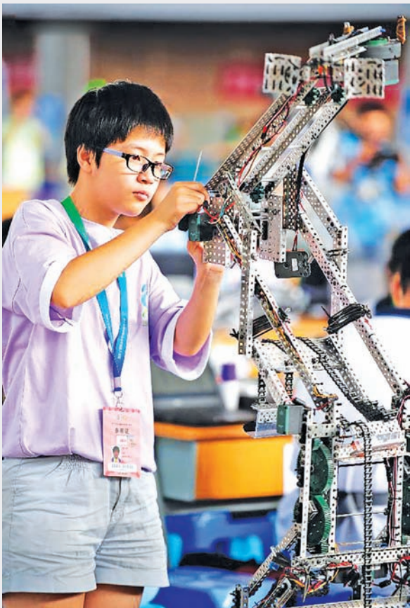
A student examines a robot during the 15 th China Youth Robot Competition in Ordos, north China's Inner Mongolia Autonomous Region, on 22 July, 2015. Nearly 1,500 teenagers all over the country took part in the competition that kicked off on Wednesday.