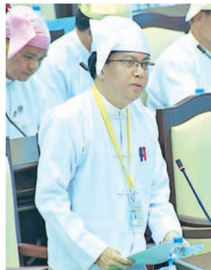
Deputy Minister for Education Dr Zaw Min Aung. MNA