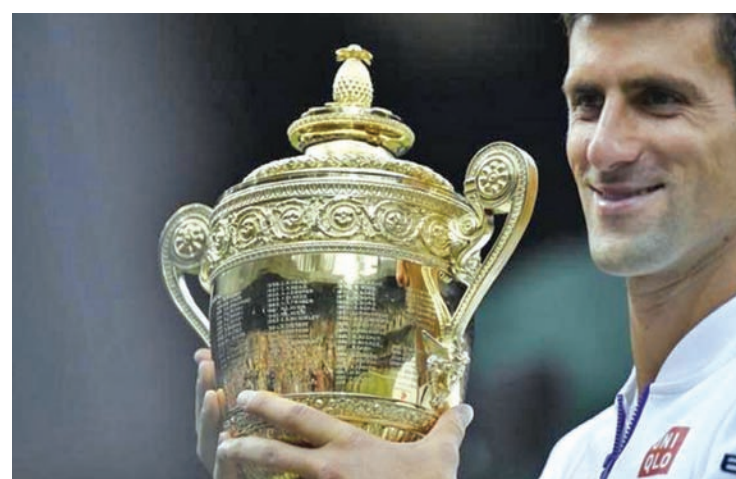
Novak Djokovic of Serbia shows off the trophy after winning his Men's Singles Final match against Roger Federer of Switzerland at the Wimbledon Tennis Championships in London, on 12 July, 2015.

Editorial Section — (+95) (01) 8604529; Fax — (01) 8604305 Advertisement & Circulation — (+95) (01) 8604532