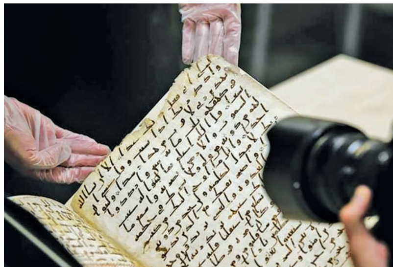
A fragment of a Koran manuscript is photographed in the library at the University of Birmingham in Britain on 22 July, 2015.

"The catalogues of which were in collections in Britain are not complete in most cases. It's quite possible we might find some further things - even in the British Library itself."