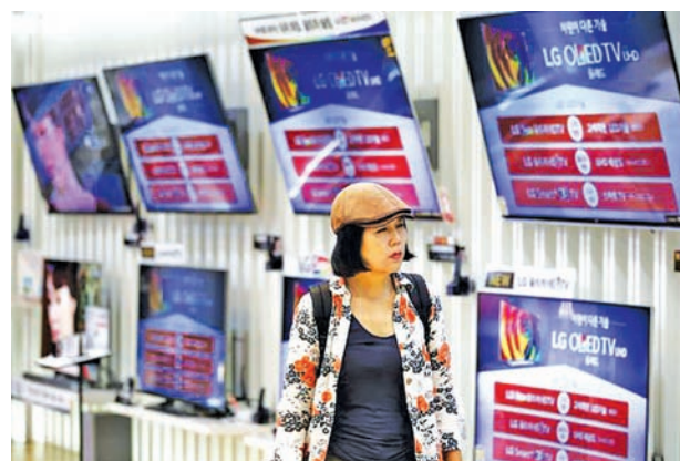
A customer browses LG Electronics' television sets, which are made with LG Display flat screens, at its store in Seoul, South Korea, on 23 July, 2015.