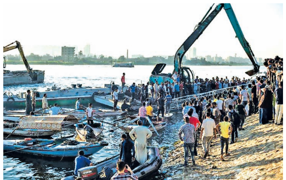
Egyptians gather at the site of a shipwreck on the Nile River in the Warraq district of Giza, southwest of Cairo, Egypt, on 23 July, 2015. At least 19 people died on Wednesday in a shipwreck on Nile River in Cairo, capital of Egypt, according to the statement from the Egyptian Interior Ministry.—XINHUA

CAIRO, 23 July — At least 19 people died on Wednesday in a shipwreck on Nile River in Cairo, capital of Egypt, according to the statement from the Egyptian Interior Ministry.