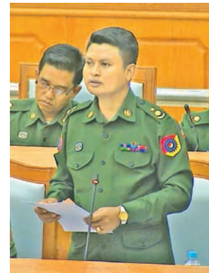
Lt-Col Thein Lwin. MNA