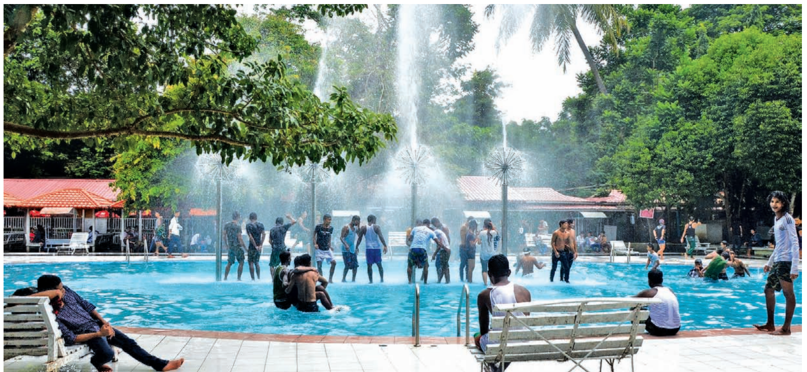
Adolescents and young people lose themselves to the temptation of over-indulgence in a swimming pool.

Shwe Taing Shwe Pyi Company leased a 3.13-acre plot to operate a recreation centre with swimming pools, water slides,