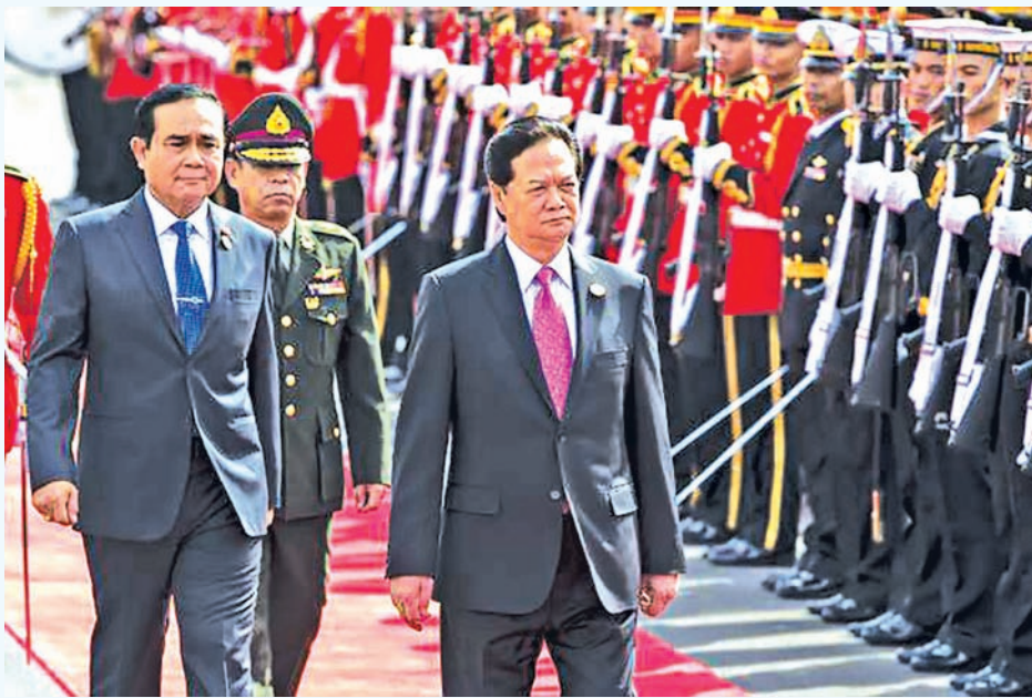
Vietnam’s Prime Minister Nguyen Tan Dung (C) and Thailand’s Prime Minister Prayuth Chan-ocha (L) review the honour guard during a welcoming ceremony at Government House in Bangkok, Thailand on 23 July, 2015.

“Today, we use the word friend and not competitor,” Prayuth told a news conference with Dung, adding that Thailand was Vietnam’s biggest trade partner in the Association of South East Asian Nations (ASEAN) region.