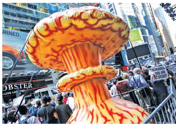
An inflatable mushroom cloud stands among demonstrators during a rally opposing the nuclear deal with Iran in Times Square in the Manhattan borough of New York City, on 22 July, 2015.

AIPAC's plans are being coordinated with allied groups such as Citizens for a Nuclear Free Iran that are sponsoring a national television advertising campaign, the pro-Israel sources said. They are expected to spend upwards of $20 million, one