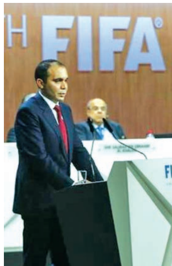
Prince Ali bin Al Hussein of Jordan, FIFA presidential candidate, speaks before the election process at the 65 th FIFA Congress in Zurich, Switzerland, on 29 May, 2015.

Wednesday, Prince Ali, who withdrew from May's FIFA presidential election after winning 73 votes to Blatter's 133 in the first round of voting, said he feared Blatter, who has ruled the body since 1998, was trying to rush through reforms before he leaves office on 26 February.