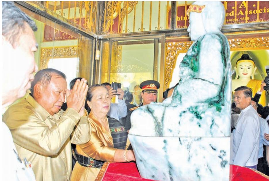
Laotian Vice President Bounnhang Vorachith pays homage to the Jade Buddha Statue at the Shwedagon Pagoda.