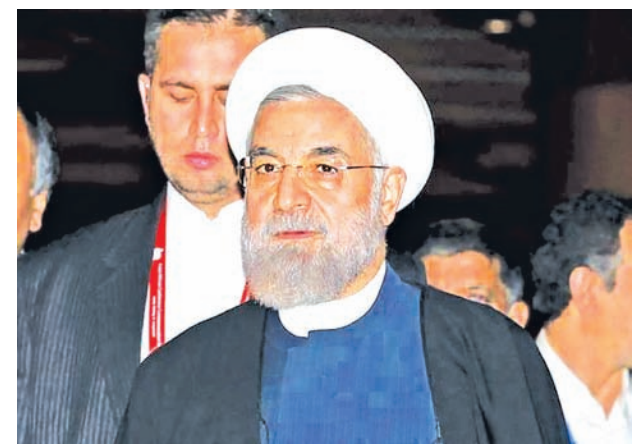
Iran’s President Hassan Rouhani

DUBAI, 23 July — President Hassan Rouhani, stepping up his defence of a nuclear deal under attack by Iran’s conservatives, said on Thursday the historic agreement with world powers was “more valuable” than a domestic debate about its fine details.