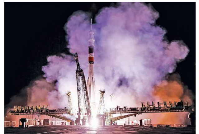
The Soyuz TMA-17M spacecraft carrying the International Space Station (ISS) crew of Kjell Lindgren of the US, Oleg Kononenko of Russia and Kimiya Yui of Japan blasts off from the launch pad at the Baikonur cosmodrome, Kazakhstan on 23 July, 2015.

A fourth station resupply line is operated by Japan, which is scheduled to fly again in August." It's certainly no fun to see several of the cargo vehicles undergo mishaps," Lindgren said. "It underscores