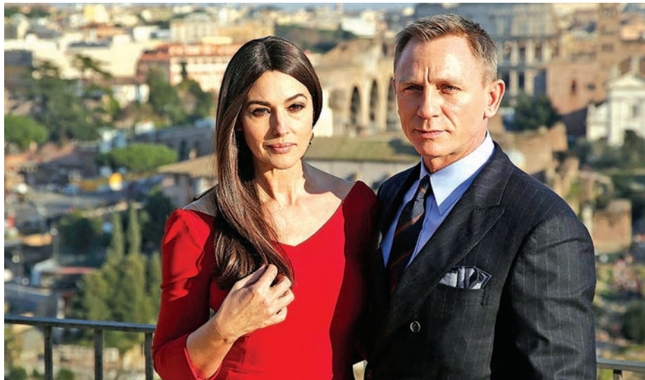
Actors Daniel Craig (R) and Monica Bellucci pose during a photo call for the new James Bond film "Spectre" in downtown Rome, on 18 Feb, 2015.

istics of a Bond film, action-packed scenes soon follow as the secret agent uncovers the shady Spectre organization and its dark link to villain Franz Oberhauser, played by Oscar winner Christoph Waltz.