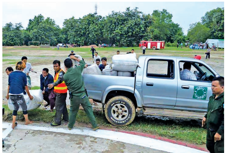
Tatmadaw men carry out evacuation of flood victims to safe places.