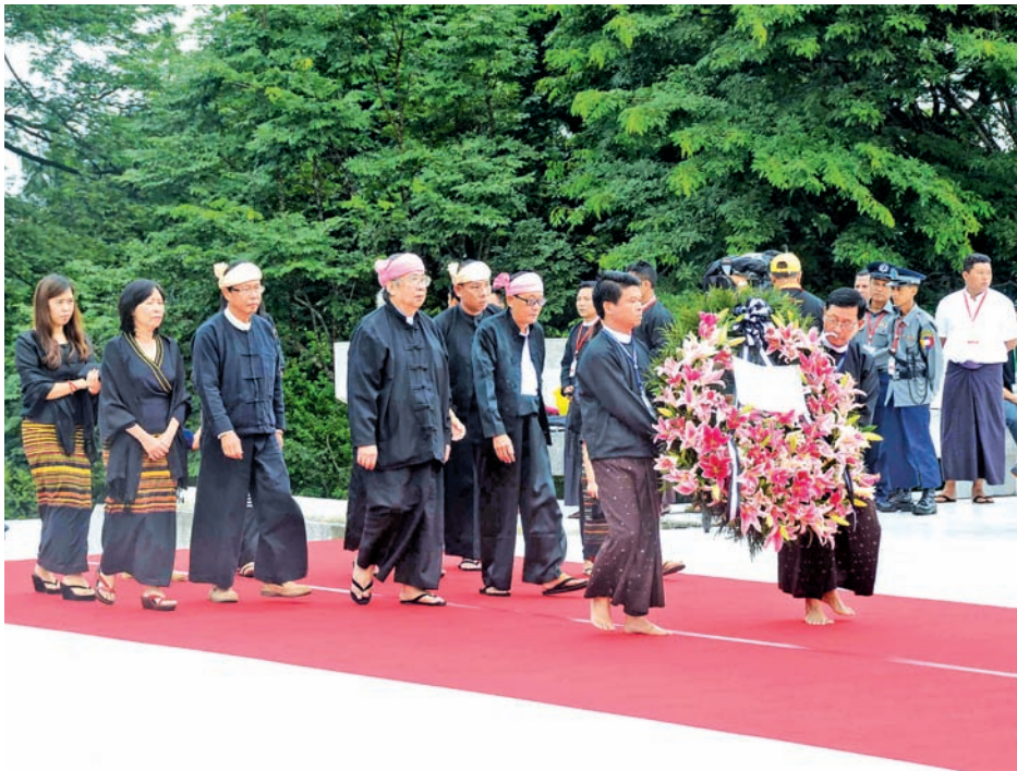
Family members of Mongpaw Sawbwa Sao San Tun arrive at mausoleum to pay tribute.