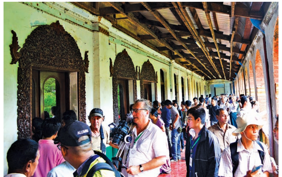
Visitors throng to view the room where General Aung San and cabinet ministers were assassinated.