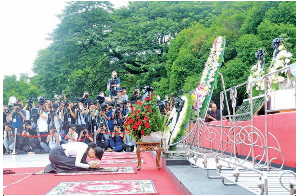
Daw Aung San Suu Kyi pays tribute to national leader General Aung San.—MNA