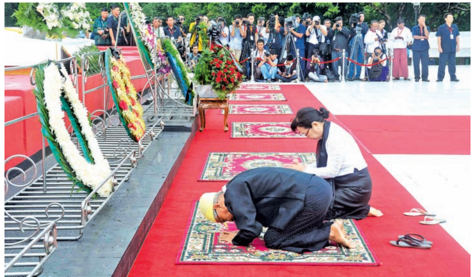
Family members of U Ba Win pay tribute at mausoleum.—MNA