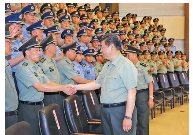
Chinese President Xi Jinping, also general secretary of the Communist Party of China (CPC) Central Committee and chairman of the Central Military Commission, meets with senior officers while visiting the 16 th army group, on 18 July, 2015.

On behalf of the CPC Central Committee and the CMC, Xi extended regards and festive greetings to military personnel during the visit.—Xinhua