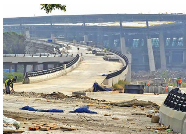
A view of the construction taking place on the new Terminal 3 at Soekarno-Hatta International airport near Jakarta, Indonesia on 7 July, 2015 is seen in this photo taken by Antara Foto.—REUTERS

Officials have locked horns over its route and how to fund it, but in the absence of significant gov-