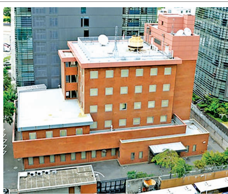
Photo taken on 17 July, 2015, shows the Japanese Embassy in Seoul. The embassy built in 1970, five years after Japan and South Korea normalized their ties, will be re-built due to aging.

As Russia is set to ban drift-net fishing in its economic waters from January to conserve natural resources, Japanese salmon and trout fishing through that method is expected to be terminated in the sea area later this month.—Kyodo News