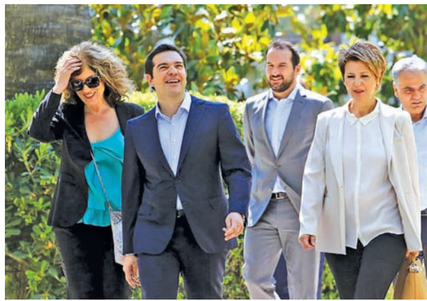
Greek Prime Minister Alexis Tsipras leaves the Presidential Palace escorted by newly appointed Energy Minister Panos Skourletis (R), manager of the PM political office Dimitris Tzanakopoulos (C), Government Spokeswoman Olga Gerovassili (2 nd R) and Deputy Foreign Minister Sia Anagnostopoulou (L) in Athens, Greece on 18 July, 2015.

But restrictions on transfers abroad and other capital controls remain in place. The move had been widely expected after the European Central Bank