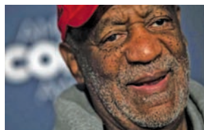
Actor Bill Cosby

The newspaper obtained the record of Cosby's testimony over four days in 2005 and 2006 and posted excerpts on its website on Saturday, with the former star of television's "The Cosby Show" providing descriptions of methods he used to pursue women and