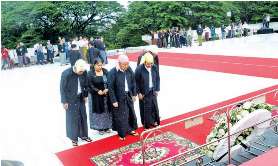
Family members of U Razak pay tribute at mausoleum.