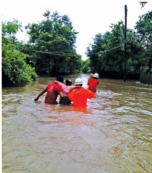
Rescuers evacuate flood victims to safe place.