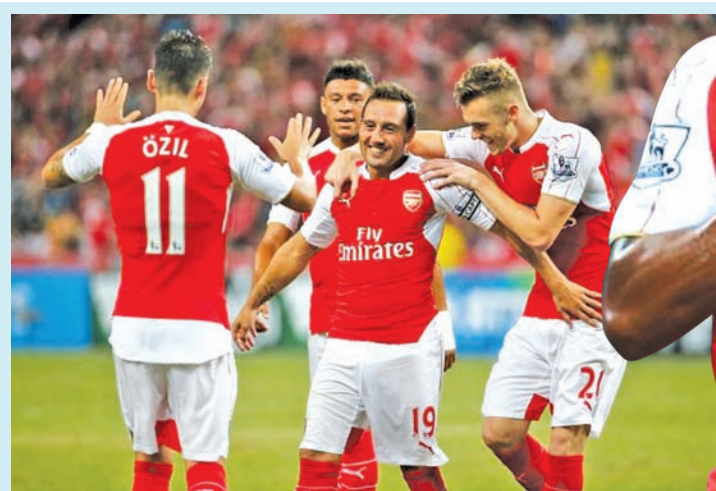
Arsenal's Santi Cazorla celebrates scoring their second goal against Everton during Barclays Asia Trophy Final at National Stadium, Singapore on 18 July, 2015.

Arsenal, who beat a Singapore Select XI 4-0 on Wednesday with a youthful lineup, then turned the screws with Cazorla orchestrating a third for Ozil four