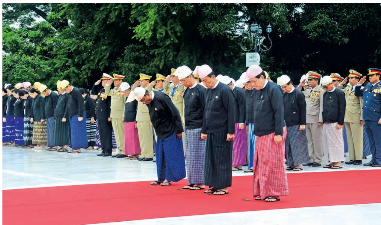
Vice President Dr Sai Mauk Kham, Speaker of Pyithu Hluttaw Thura U Shwe Mann, Speaker of Amyotha Hluttaw U Khin Aung Myint and Chief Justice of the Union U Tun Tun Oo pay tribute to martyrs.