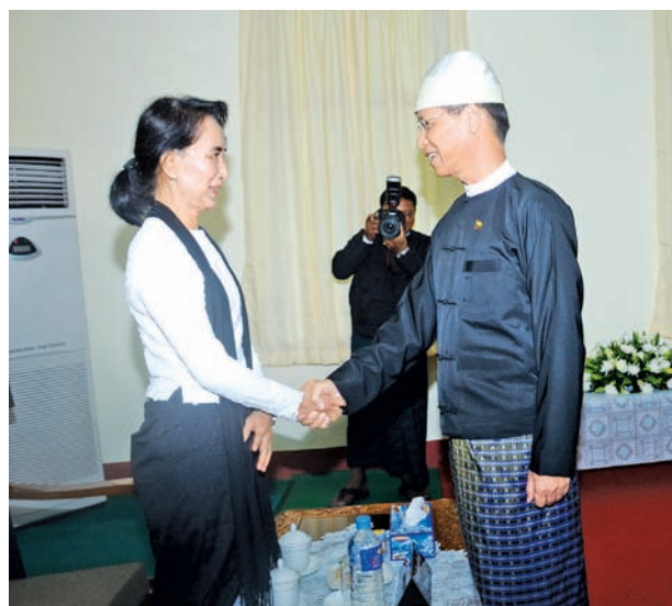
Vice President Dr Sai Mauk Kham cordially greets Daw Aung San Suu Kyi.