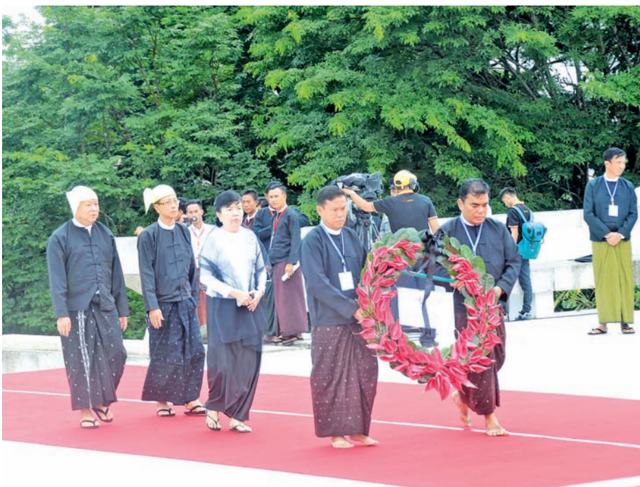
Family members of Deedok U Ba Cho pay tribute at mausoleum.