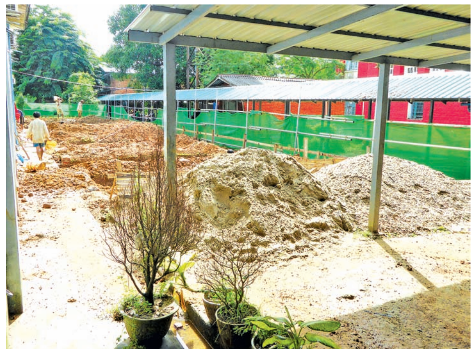
Photo shows construction site in front of Neonatal Intensive-care Unit of Central Women's Hospital.

Despite assistance from the government and NGOs, the hospital is in need of medical equipment such as ultrasound and cardiotocography (CTG) due to the growing number of hospitalized pregnant women, a hospital official said at a donation ceremony in June.