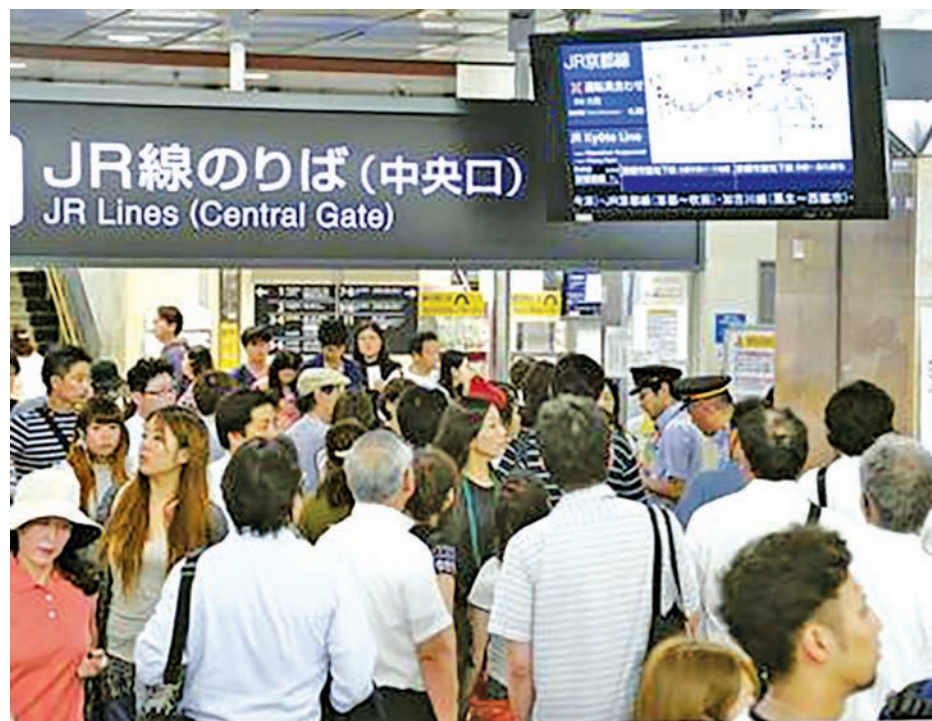
JR Osaka Station is crowded with passengers on 18 July, 2015, as West Japan Railway Co temporarily suspended services on its 14 train lines that day after a powerful typhoon brought a more than permissible level of rainfall for train operations.