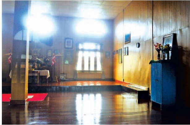
The room where General Aung San and cabinet ministers were assassinated.