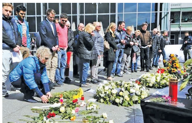
People lay flowers outside Cologne Cathedral during a memorial service for the 150 victims of Germanwings flight 4U 9525 in Cologne, on 17 April, 2015.

Germanwings, a unit of Lufthansa (LHAG.DE), was not immediately available to