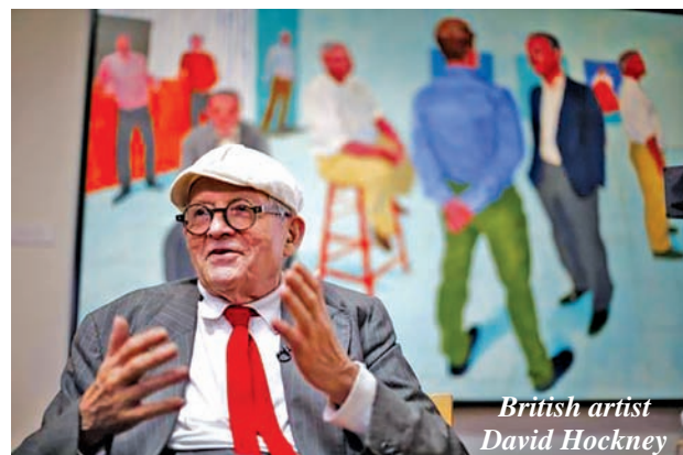
British artist David Hockney

LOS ANGELES, 19 July — From his classic 1967 Los Angeles pool scene "A Bigger Splash" to his interpretations of Yorkshire forests, British artist David