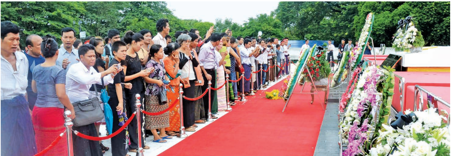
People seen at Martyrs' Mausoleum to pay tribute at mausoleum.