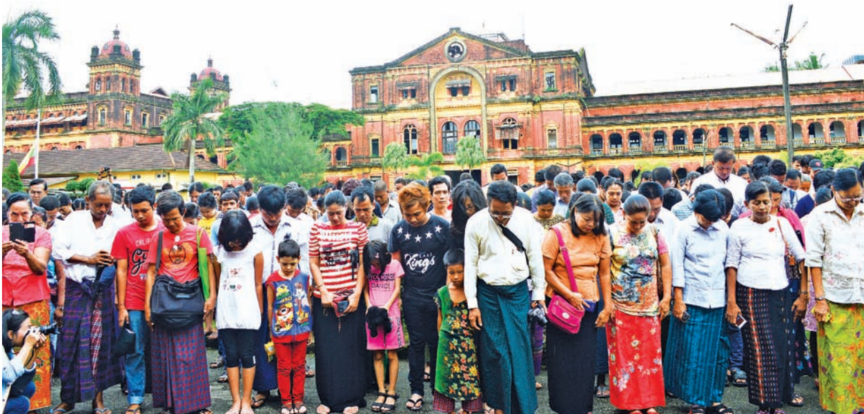
People pay respects at the Secretariat.