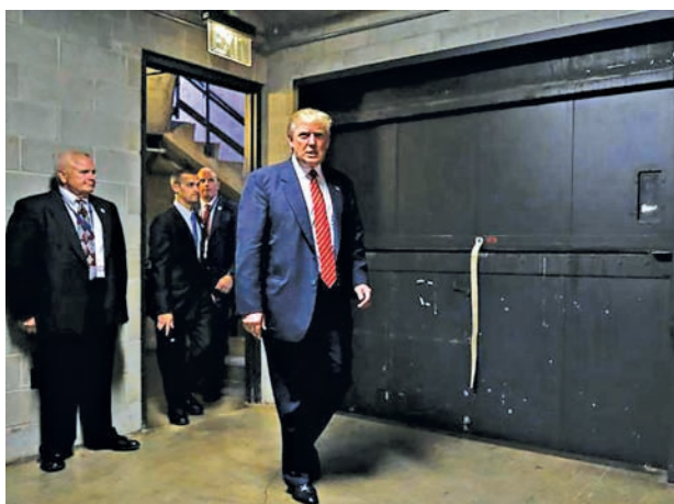
US Republican presidential candidate Donald Trump arrives for a news conference at the Family Leadership Summit in Ames, Iowa, United States on 18 July, 2015.

AMES, (Iowa), 19 July — Republican presidential contender Donald Trump disparaged US Senator John McCain’s war record on Saturday, saying the former prisoner in North Vietnam was only considered a war hero because he was captured.