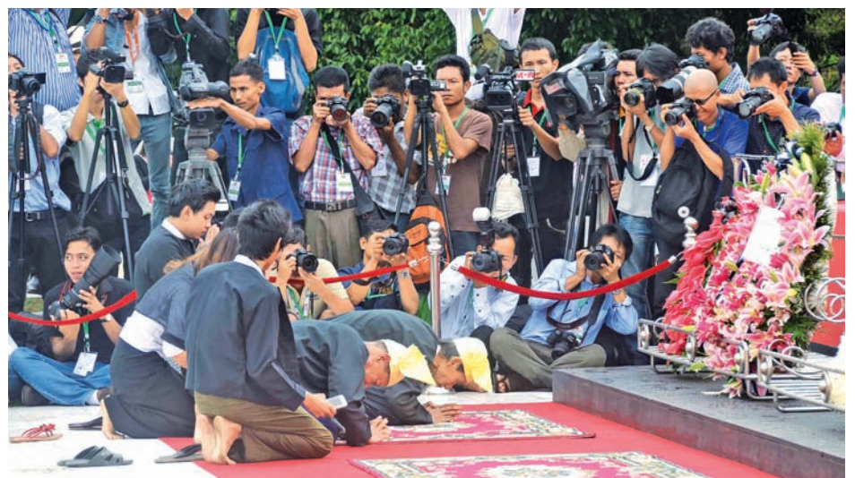
Family members of U Ohn Maung pay tribute at mausoleum.