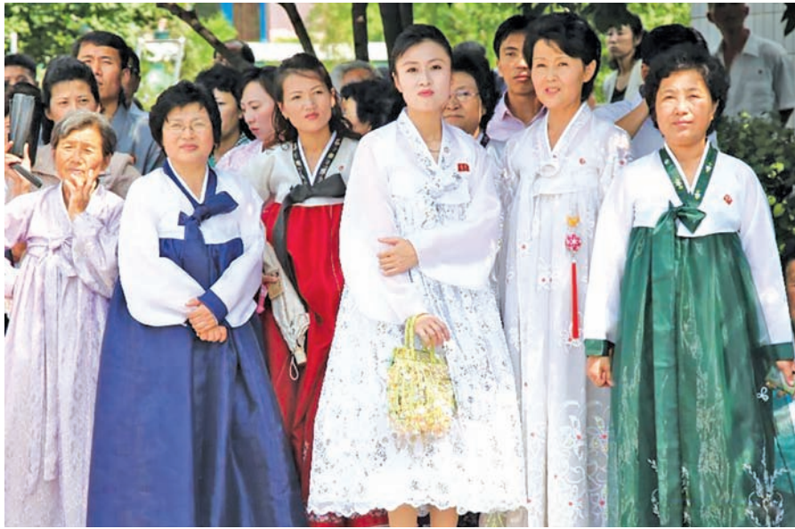
Voters queue outside a polling station in Pyongyang, the Democratic People's Republic of Korea (DPRK), on 19 July, 2015. The election of deputies to local assemblies in the DPRK started on Sunday.