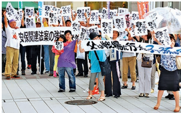
People hold papers bearing the message “We will not tolerate Abe’s politics” in front of JR Akita Station in the northeastern Japanese city of Akita on 18 July, 2015. Similar protests were held across Japan that day to express opposition to a government plan to give Japan’s Self-Defence Forces a greater role in overseas operations.

“We’d like to unite our hearts by this message,” he said. The bills would allow Japan to exercise the right to collective self-defence, or coming to the aid of the United States or other friendly nations under armed attack even if Japan