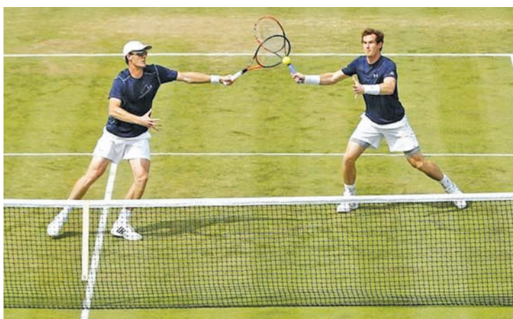
Great Britain's Andy Murray and Jamie Murray in action during their doubles match against Jo Wilfried Tsonga and Nicolas Mahut of France during Davis Cup World Group Quarter Final at Queen's Club, London on 18 July, 2015.

"I thought both of us served well apart from the first game when I was broken I don't be-