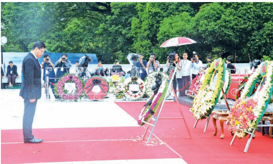
A diplomat pays tribute to martyrs at mausoleum.—MNA