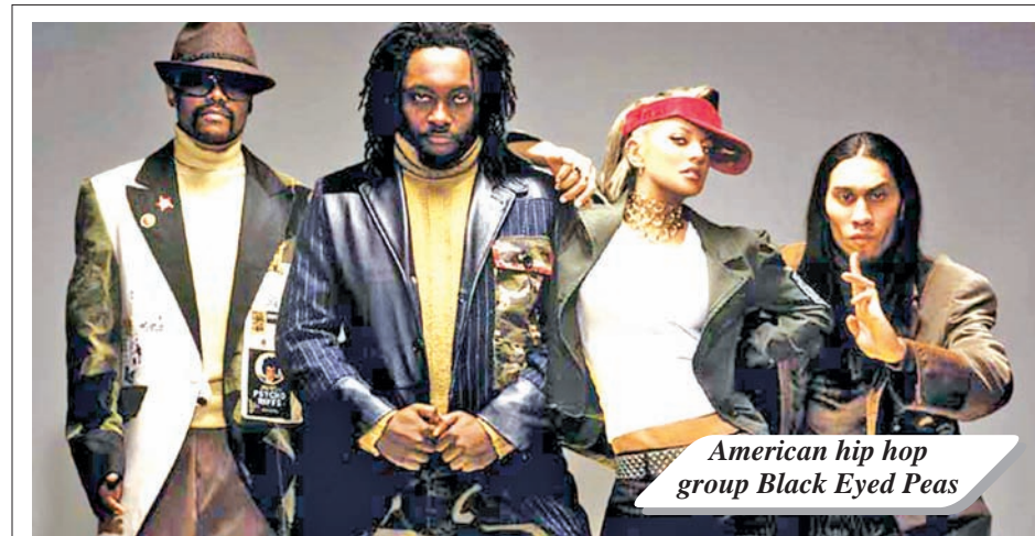
American hip hop group Black Eyed Peas