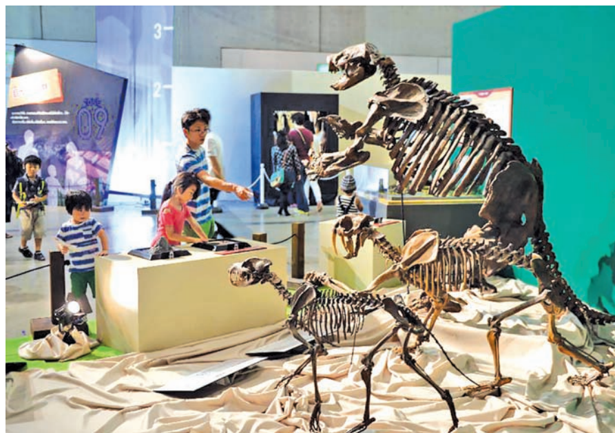
People look at replicas of dinosaur skeleton fossils during the "Mega Dinosaur Exhibition 2015" in Chiba, Japan, on 18 July, 2015.