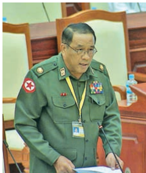
Deputy Minister for Home Affairs Brig-Gen Kyaw Kyaw Tun.