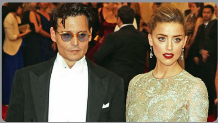
Johnny Depp and Amber Heard

SYDNEY, 16 July — Hollywood actor Johnny Depp's wife Amber Heard faces charges in Australia for breaching biosecurity laws which could bring a 10 year jail sentence and a 100,000 Australian dollar (74,000 US dollar) fine for smuggling their pet dogs into the country.