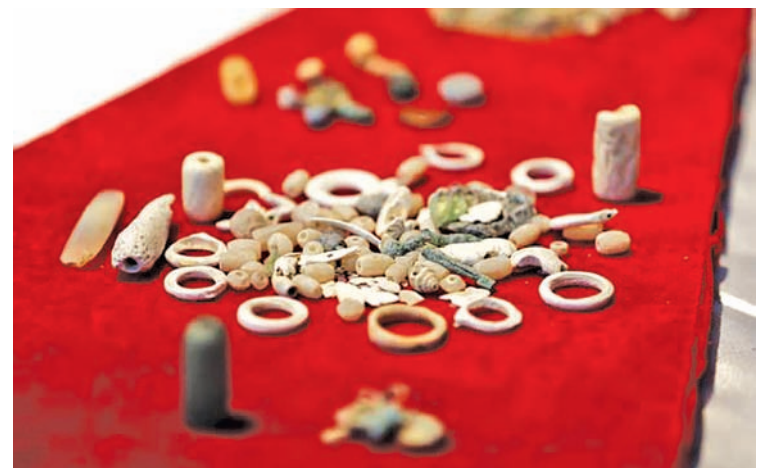
Recovered artifacts are seen at the National Museum of Iraq in Baghdad on 15 July, 2015.—REUTERS

Sporadic clashes persist in Iraq's largest oil refinery nearby as security forces fight to drive IS militants out of the refinery, which militants have seized large sections of. The security situation in Iraq has drastically deteriorated since June 2014, when bloody clashes broke out between security forces and IS militants. The IS militants took control of the country's northern city of Mosul and later seized swathes of territories after Iraqi security forces abandoned their posts in Nineveh and other predominant Sunni provinces.— Xinhua