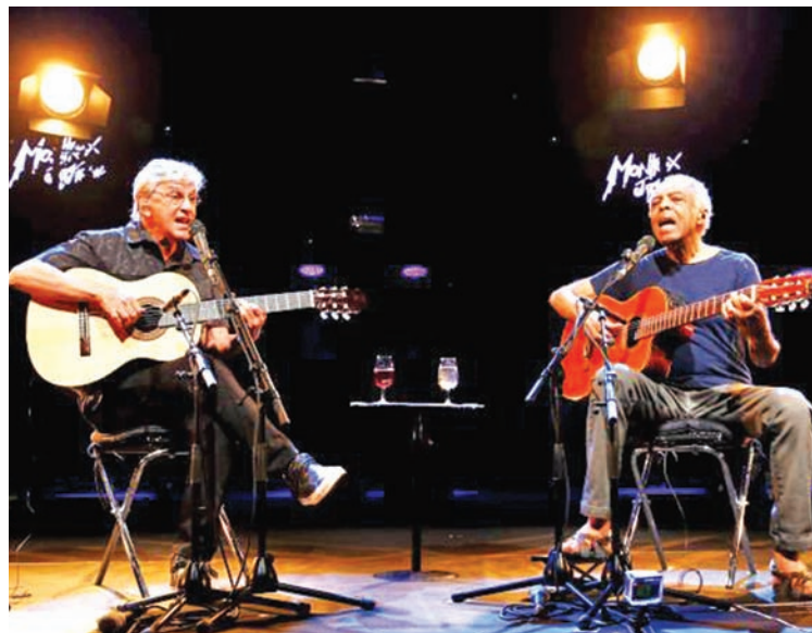
Brazilian musicians Caetano Veloso (L) and Gilberto Gil perform their 'Two Friends, a Century of Music' show during the 49th Montreux Jazz Festival in Montreux, Switzerland on 15 July, 2015.