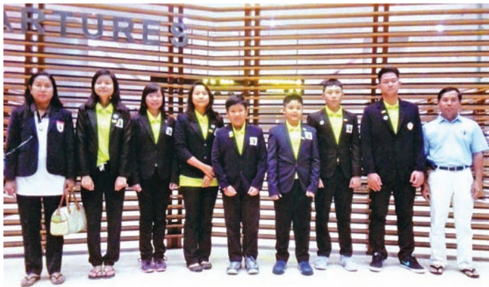
Myanmar youth golfer team seen at Yangon International Airport before departure for the United States of America.