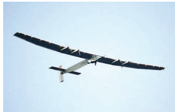
The Solar Impulse 2 airplane, piloted by Andre Borschberg, prepares to land at Kalaeloa airport after flying non-stop from Nagoya, Japan in Kapolei, Hawaii, on 3 July, 2015.

The repairs and testing will then push the next available window for completing the plane's trans-Pacific crossing to next spring, in terms of both weather conditions