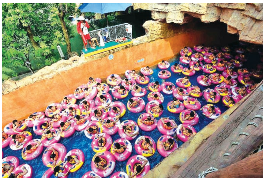
People have fun in a swimming pool in the Chimelong Water Park in Guangzhou, capital city of south China's Guangdong Province, on 15 July, 2015. The local meteorological authority degraded the alert for heat from orange to yellow on Wednesday. But the temperature in Guangzhou is expected to stay high.

Managing Director Myanma Railways Ministry of Rail Transportation