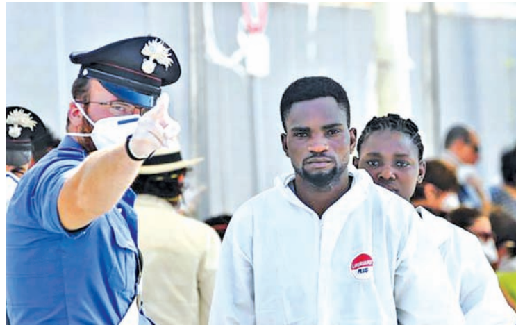
Migrants are disembarked from the Italian Coast Guard vessel Dattilo in the Sicilian harbour of Palermo, Italy on 11 July, 2015.