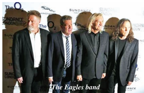
The Eagles band

The annual honors, announced on Wednesday, celebrate lifetime contributions to US culture through the performing arts.