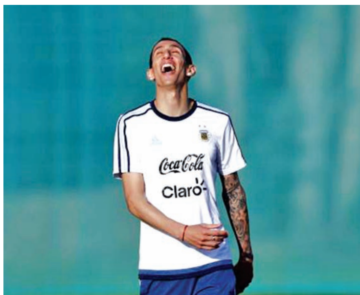
Argentina's Angel Di Maria laughs during a training session in La Serena on 23 June, 2015.

LONDON, 16 July — Manchester United manager Louis van Gaal has done little to dampen speculation that Argentine winger Angel Di Maria could