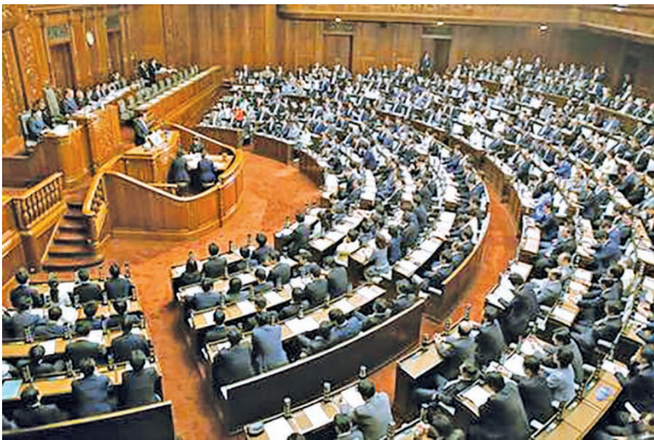
Photo shows the plenary session of the House of Representatives convened in Tokyo on 16 July, 2015. The lower house is set to pass security bills on the day that would expand the role of the Self-Defence Forces abroad amid strong objections by opposition parties and rising concerns among the public.

TOKYO, 16 July — Japan's ruling coalition pushed controversial security bills through the House of Representatives on Thursday, moving a step closer to achieving Prime Minister Shinzo Abe's goal of expanding the role of the Self-De-