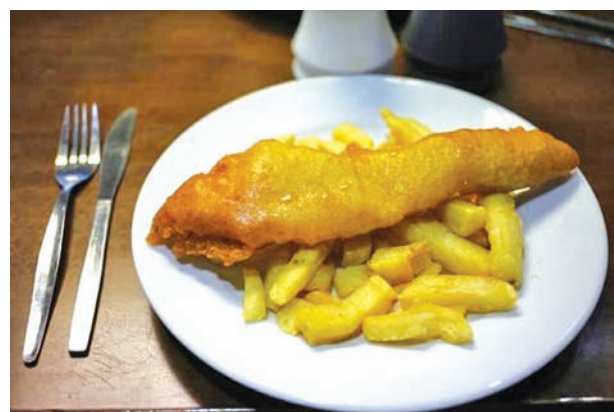
Fish and chips are seen in a sea front cafe in Blackpool, northern England on 8 Sept, 2013.

"Be mindful and slow down," she added. "Take the time to chew, taste and savor your food — you'll naturally eat less and enjoy your meal even more."—Reuters