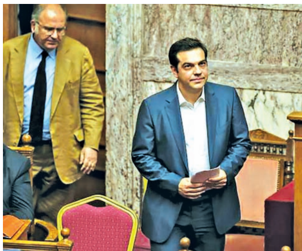
Greek Prime Minister Alexis Tsipras arrives for a parliamentary session in Athens, Greece on 16 July, 2015.

ATHENS, 16 July — Greece awoke with a political hangover on Thursday after parliament approved a stringent bailout programme, thanks to the votes of the pro-European opposition, amid the worst protest violence this year.