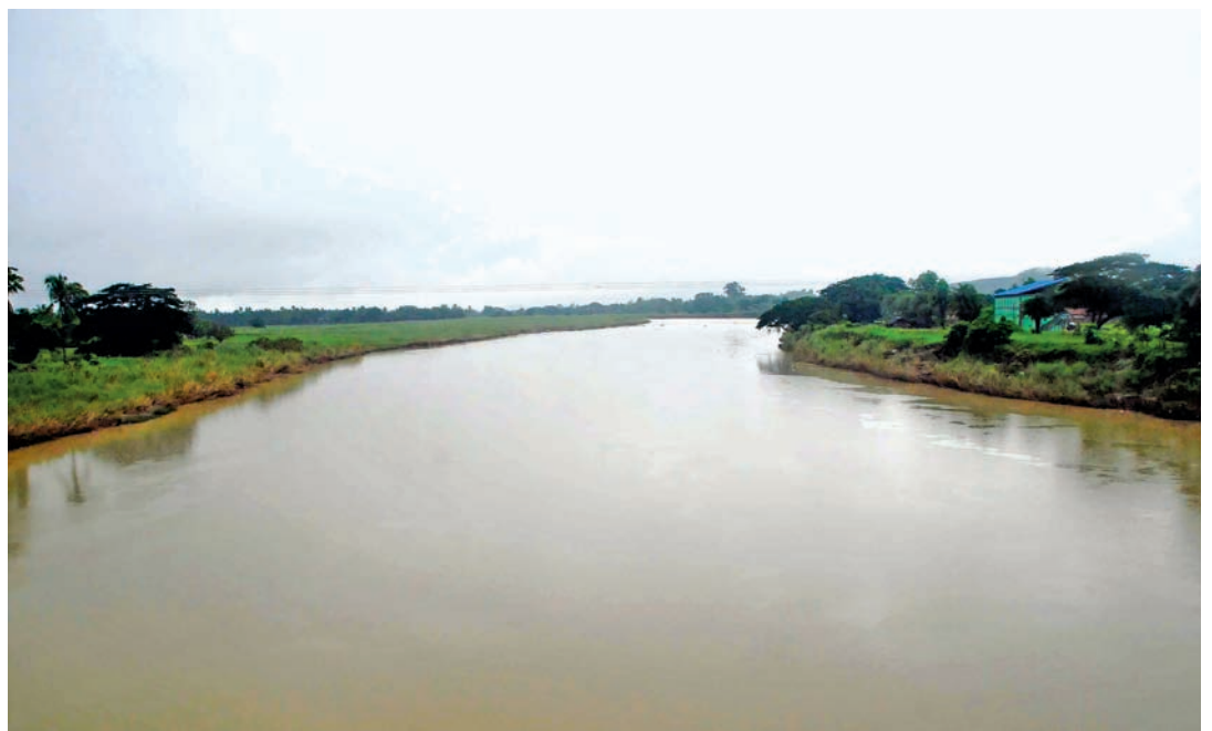
Vice President Dr Sai Mauk Kham views the site for drain to be dredged for proper flow of water in Thandwe Creek, Rakhine State.

NAY PYI TAW, 16 July — Vice President Dr Sai Mauk Kham on Thursday inspected townships flooded by heavy rains in Rakhine State and presented relief assistance to local people.