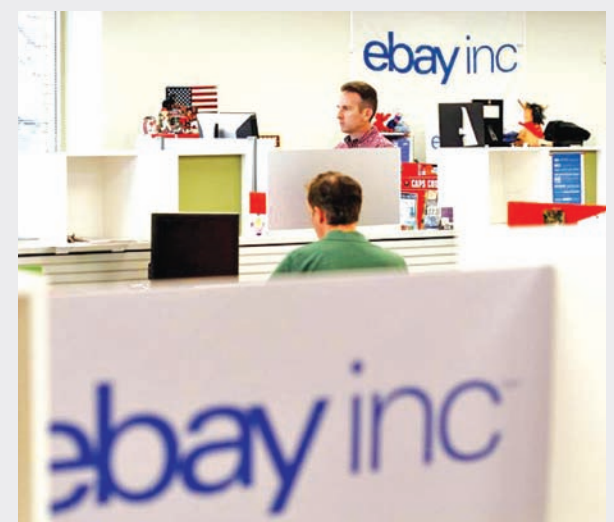
eBay signs are seen in an eBay office space in San Jose, California in a 28 May, 2014 file photo.

eBay said in January that it would explore a sale or public offering of the enterprise business, which did not fit neatly with its PayPal or