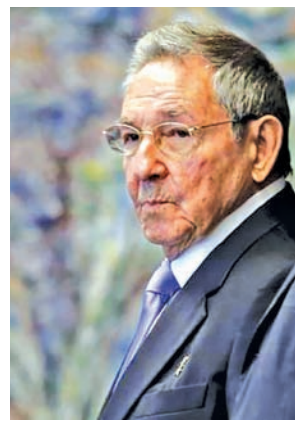
Cuba's President Raul Castro

With diplomatic ties restored, the two countries separated by 90 miles (145 km) of sea will now begin the more difficult and lengthy task of normalizing overall relations.