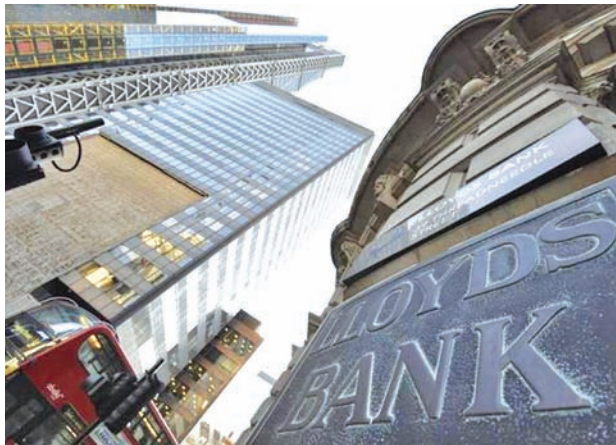
A branch of Lloyds Bank is seen in the City of London on 16 Dec, 2014.

LONDON, 16 July — Lloyds Banking Group (LLOY.L) said on Thursday the UK government had reduced its stake in the bank below 15 percent as it moves closer to full privatization.