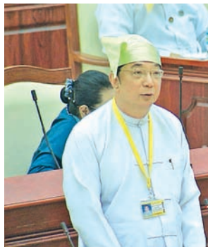
Deputy Minister for Finance Dr Maung Maung Thein.—MNA

NAY PYI TAW, 16 July — Citizenship scrutiny cards have been issued to 6.4 million citizens, Deputy Minister for Immigration and Population U Win Myint told the Thursday's session of Pyithu Hluttaw.