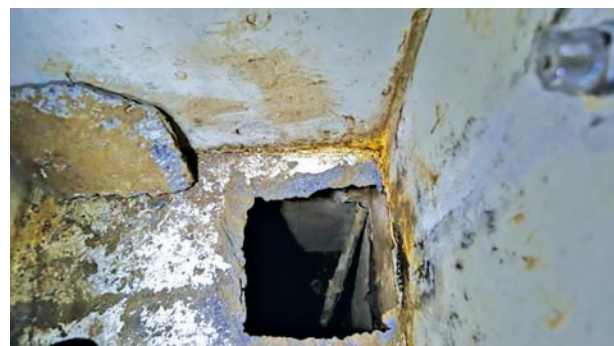
A view of the opening of a tunnel, which is connected to a warehouse, inside drug lord Joaquin ‘El Chapo’ Guzman’s cell in the Altiplano Federal Penitentiary, where he escaped from, in Almoloya de Juarez, on the outskirts of Mexico City, on 15 July, 2015.