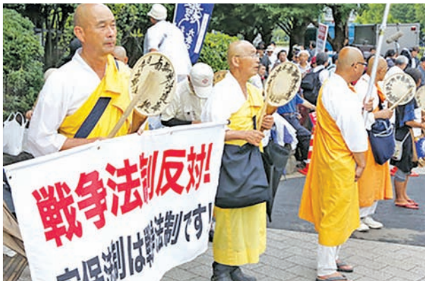
People stage a rally in front of the Diet building in Tokyo on 16 July, 2015, to show opposition to government-sponsored security bills that would expand the role of the Self-Defence Forces abroad. The House of Representatives is set to pass them the same day.