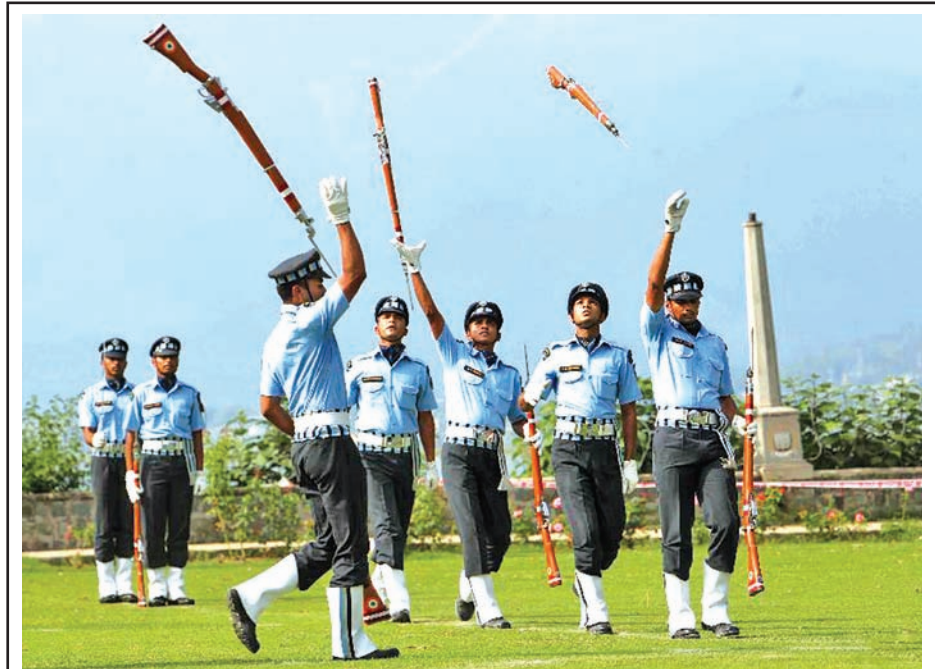
Air Warriors Drill Team (AWDT) of Indian Air Force (IAF) take part in a drill during an event in Srinagar, summer capital of Indian-controlled Kashmir, on 15 July, 2015.

The bills will be deliberated by Japan's upper house before they can become law.— Kyodo News