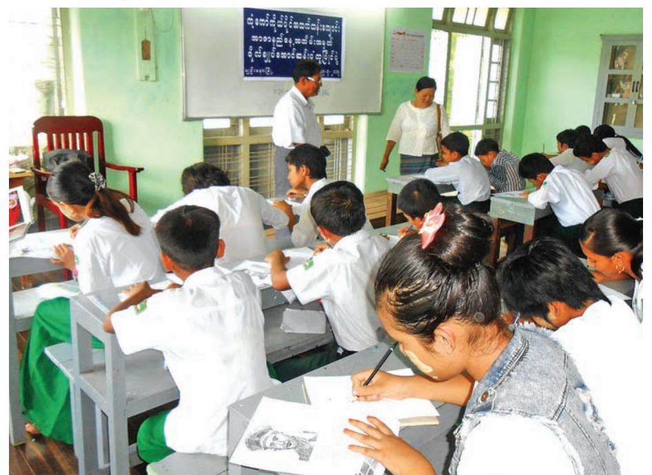
Students of Gangaw private high school in Pyinmana Township taking part in painting contest for portrait of General Aung San.