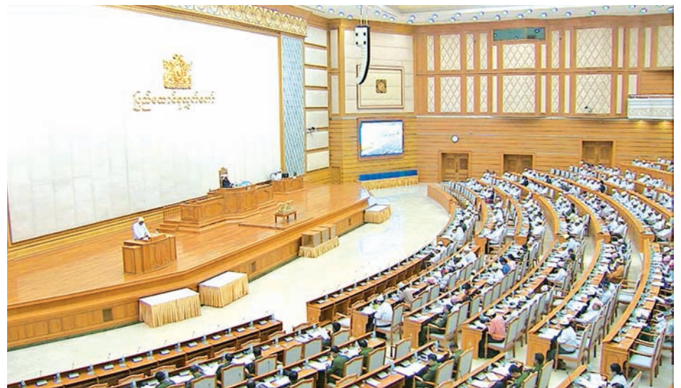
MPs of Pyidaungsu Hluttaw discuss budget affairs.

She also urged the Ministry of Social Welfare, Relief and Resettlement to explain to parliament how they spent their budget allotments.