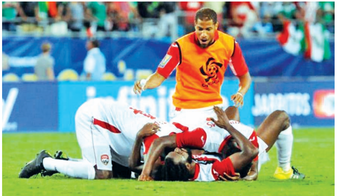
Trinidad and Tobago celebrate after scoring a goal against Mexico late in the second half of CONCACAF Gold Cup group play at Bank of America Stadium. Mexico and Trinidad and Tobago played to a 4-4 tie.

CHARLOTTE, (North Carolina), 16 July — Trinidad and Tobago left it late to salvage a 4-4 draw against Mexico that secured top spot in Group C of the CONCACAF Gold Cup on Wednesday as both teams scored in stoppage time at the end of a thrilling encounter.