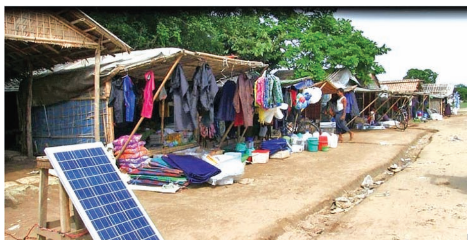
Relief items for Bengali camps are being sold at roadside shops in Darpaing (Bengali) Village in Sittway Township.