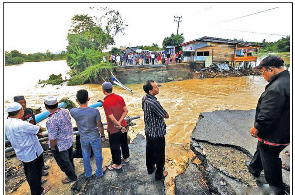
People stand near a broken bridge at Krueng Sabe, Aceh, Indonesia, on 16 July, 2015. A bridge was cut off due to flood when Muslim people moved to their hometowns to celebrate Eid al-Fitr in Aceh.