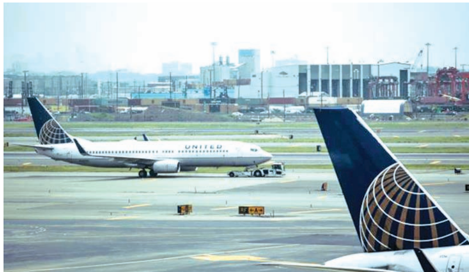
United Airlines planes are seen on platform at the Newark Liberty International Airport in New Jersey, on 8 July, 2015.

NEW YORK, 16 July — United Continental Holdings Inc has awarded millions of frequent flier miles to hackers who have uncovered gaps in the carrier's web security, in a first for the US airline industry.