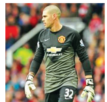
Goalkeeper Victor Valdes

"He doesn't follow our philosophy. There is no place for someone like that," said the Dutchman. "The philosophy is how you play football, and how you maintain your match rhythm. For example, he refused last (season) to play in the second team. That's also one aspect of our philosophy but there are a lot of other aspects in the philosophy of how you have to play like a goalkeeper in Manchester United. When you are not willing to follow the principles of