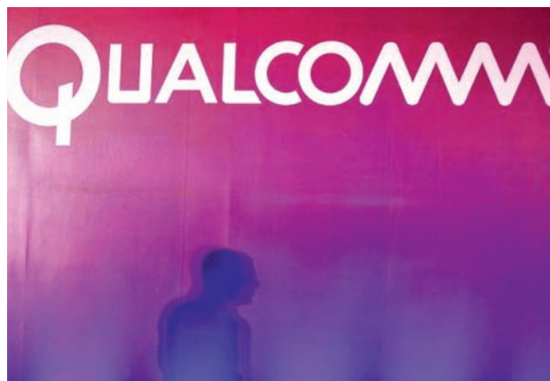
A shadow is cast near a Qualcomm logo at the 2015 Computex exhibition in Taipei, Taiwan, on 2 June, 2015.