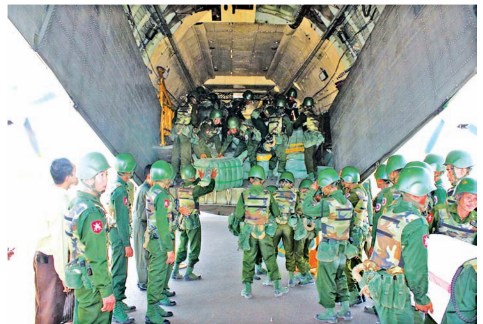
A cargo plane carrying President's assistance for flood victims in Rakhine State arrives at Sittway Airport.—MYAWADY

Ministry of Border Affairs presented the assistance including 4,000 blankets, 4,000 mosquito nets, 16 barrels of edible oil, 2,000 bags of rice, 120 bags of pulses and beans, 700 solar lamps and 700 family kits to officials.—Myawady