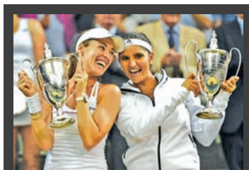
Martina Hingis of Switzerland and Sania Mirza of India pose with their trophies after winning their Women's Doubles Final match against Elena Vesnina and Ekaterina Makarova of Russia at the Wimbledon Tennis Championships in London on 11 July, 2015.

In securing her sixth Wimbledon title and first since 2012, Williams became the oldest woman to win a grand slam in the