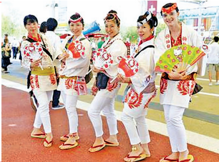
Participants in Sendai Suzume Dance festival pose for a photo at the Expo Milano, a food-themed international fair in Milan, Italy, on 11 July, 2015.

Calls of "bravo" could be heard from fairgoers as the parade of several hundred wended its way through the expo site, displaying elegant dancing punctuated by hearty cheers. The festivities drew on six traditional festivals from across the Tohoku region, including the Tanabata Festival in Sendai, Mi-