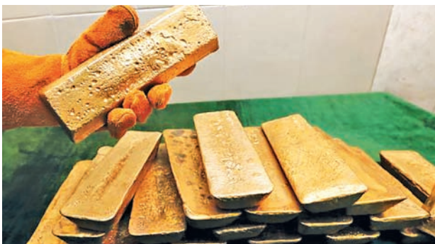
A melter places an ingot of 92.96 percent pure gold at a procession plant of the Olimpiada gold operation, owned by Polyus Gold International company, in Krasnoyarsk region, Eastern Siberia, Russia, on 30 June, 2015.

NEW YORK / LONDON, 12 July — Gold gave up earlier gains on Friday after US Federal Reserve Chair Janet Yellen said she expected the central bank to raise interest rates sometime this year but pointed to concerns that US labour markets remain weak.