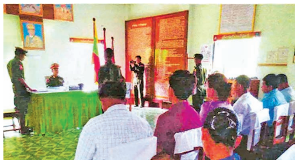
Military court of northern command sentences 7-year imprisonment to soldier.