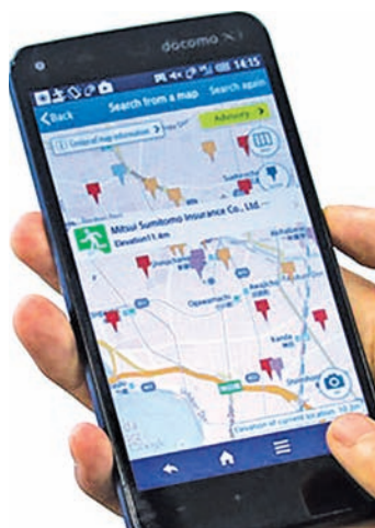
A smartphone shows a new application produced by Mitsui Sumitomo Insurance Co to help guide people during natural disasters in Japan to safety in English, Chinese and Korean. The app will be available for free download in late July 2015, aimed at tourists and exchange students from overseas.

The app by Mitsui Sumitomo Insurance Co will be available for free download in English, Chinese and Korean late this month, aimed at tourists and exchange students from over-