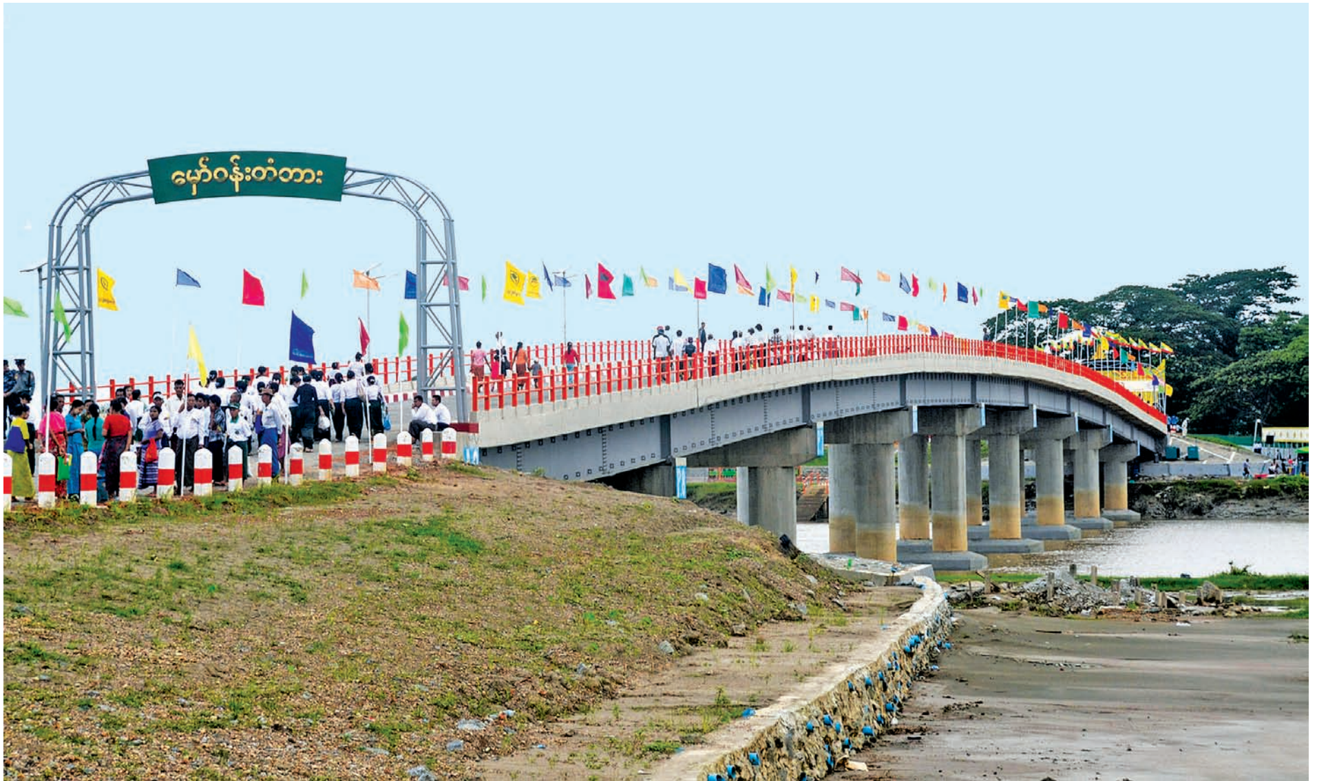
Newly-inaugurated Hmawwun Bridge linking Wegyi and Panchaung villages in Kyauktan Township.

YANGON, 12 July—President U Thein Sein on Sunday opened a new bridge in Kyauktan Township, Yangon region, shortening the travel distance between the rural area and Yangon city and the amount of time it takes