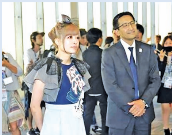
Japanese pop singer and fashion model Kyary Pamyu Pamyu (L) visits the Japan Pavilion at the Expo Milano, a food-themed international fair, in Milan, Italy on 10 July, 2015.

MILAN, 12 July — Japanese pop singer and fashion model Kyary Pamyu Pamyu on Friday visited the Japan Pavilion at the Expo Milano, a food-themed international fair, and had a look at high-tech presentations of the country's nature and culinary culture.