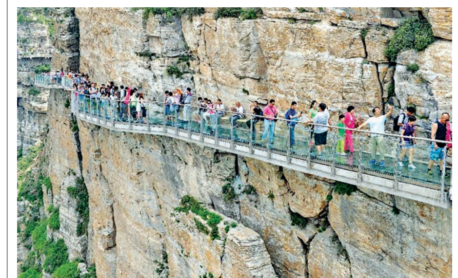
Tourists walk on a pavement built with glass on the cliff at Baishishan scenic spot in Laiyuan, north China's Hebei Province, on 12 July, 2015. The glass pavement, 95-metre-long, has an altitude of 1,900 metres.—XINHUA

A panel of experts set up by Onaga in January has been examining whether the procedure for Nakaima