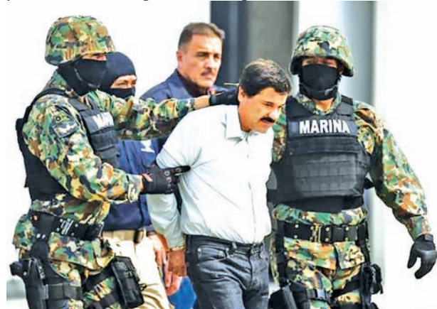
Joaquin "Shorty" Guzman (C) is escorted by soldiers during a presentation at the Navy's airstrip in Mexico City on 22 Feb, 2014.