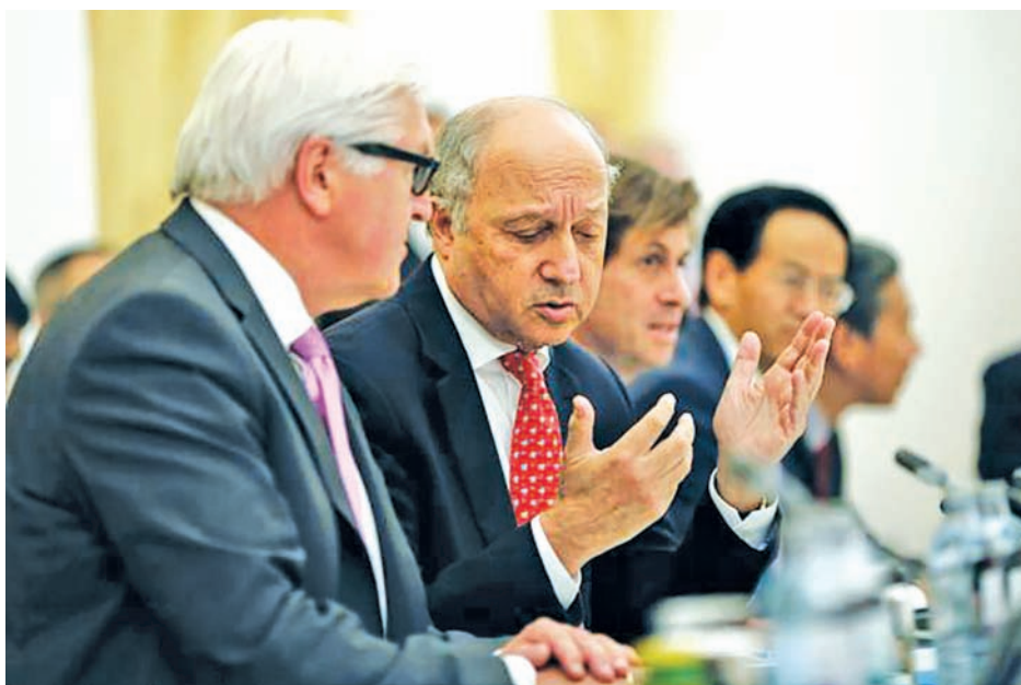
French Foreign Minister Laurent Fabius talks to German Foreign Minister Frank-Walter Steinmeier (L) during a meeting with foreign ministers and representatives of United States, China, Britain, Russia and the European Union during nuclear talks at a hotel in Vienna, Austria on 10 July, 2015.

Among the biggest sticking points this week has been Iran’s insistence