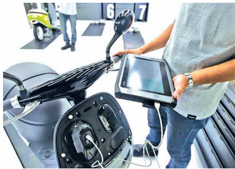
A mechanic examines a Gogoro Smartscooter which is connected to a tablet, in its shop in Taipei, Taiwan, on 6 July, 2015.

In a bid to stabilize trade and make the economy more "creativity inten-