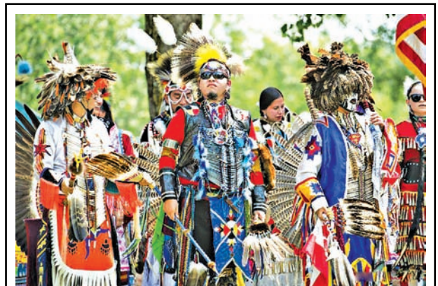
People wearing traditional costumes are pictured as they participate in the Echoes of a Nation powwow at the Kahnawake reserve near Montreal, Canada, on 11 July, 2015. The powwow is hosted annually by the local Mohawk tribe.