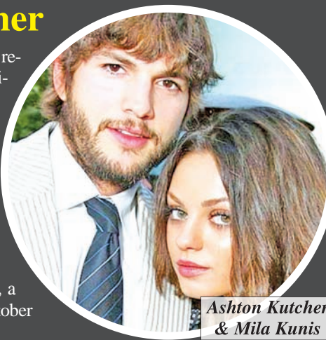
Ashton Kutcher & Mila Kunis

The couple welcomed their first child, a daughter named Wyatt, in October 2014.—PTI