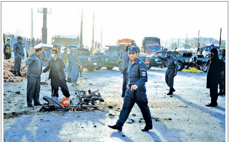
Afghan security personnel inspect the site of a suicide attack in Kabul, Afghanistan, on 11 July, 2015. Two suicide bombers died while one bystander child wounded in an explosion in Kabul on Saturday, police said.