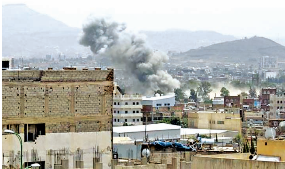
Dust rises from the site of a Saudi-led air strike in Yemen’s capital Sanaa on 10 July, 2015.

Yemeni government officials were not immediately available to comment, but the UN Secretary General’s office said before the truce that President Hadi