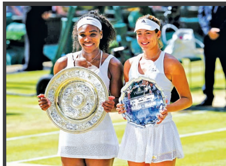
Winner Serena Williams of the USA and runner up Garbine Muguruza of Spain show off their trophies after their Women's Final Match at the Wimbledon Tennis Championships in London on 11 July, 2015.

But her anxiety was apparent when she began the game with an eighth double-fault, gesticulating to her players' box where her family and friends, including