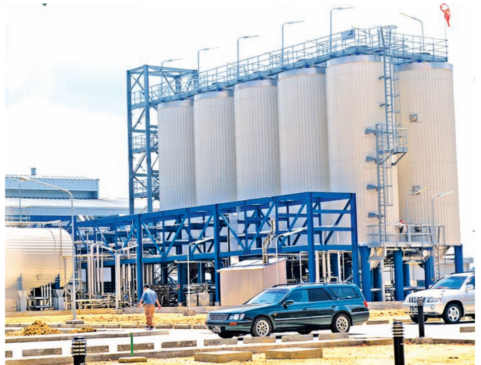
Dutch's $60 million brewery factory operates production in Hmawby.

Myanmar's beer consumption per capita is low at 3 litres per head on average, compared to the 70 litres of some European countries and 20 litres of some neighbouring countries, so there is a big opportunity for the company to win market share, van Boxmeer said.