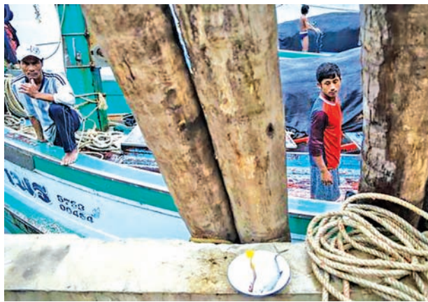
Migrant fishermen from Myanmar work on a boat after returning from the ocean to Ban Nam Khem, on 14 Dec, 2014.