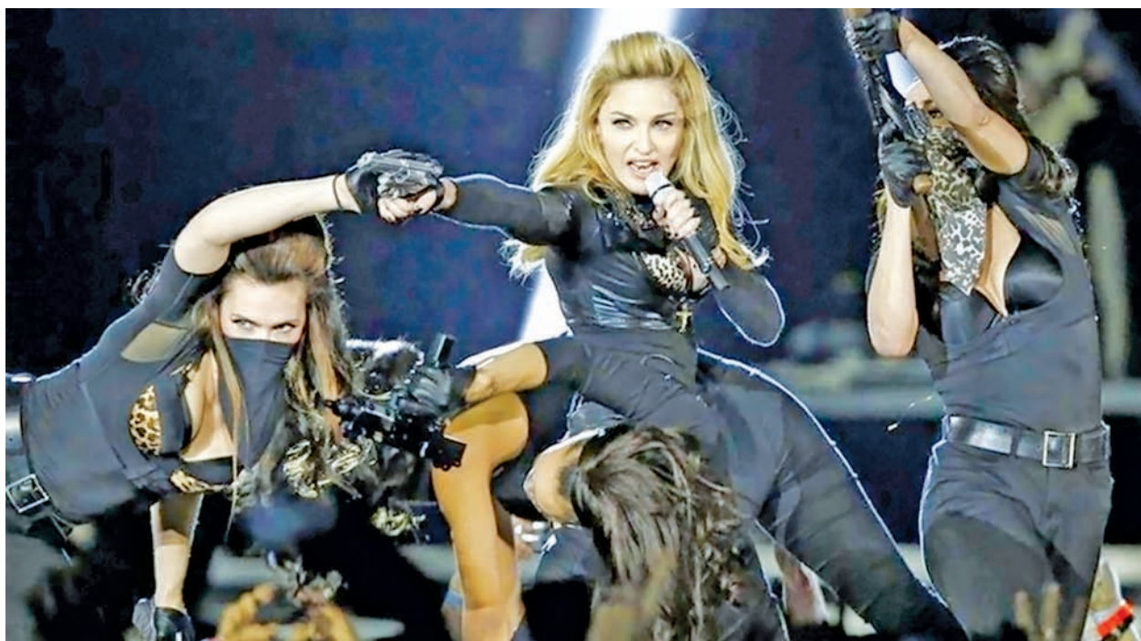
Adi Lederman, a former contestant of Israel's version of "American Idol", has been jailed for leaking singing sensation Madonna's album online.—PTI

LOS ANGELES, 12 July — Adi Lederman, a former contestant of Israel's version of "American Idol", has been jailed for leaking singing sensation Madonna's album online.