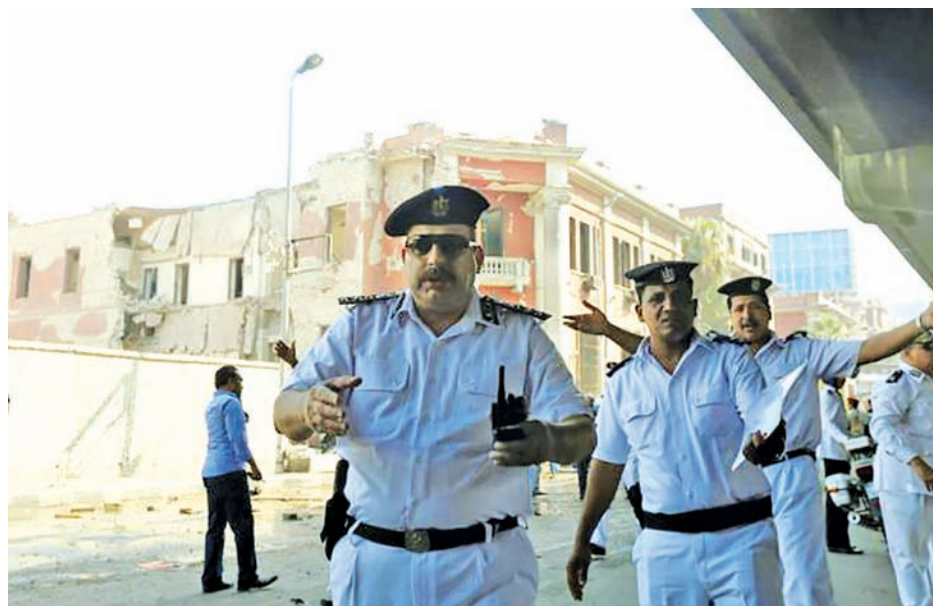
Egyptian security officials gesture at the site of a bomb blast at the Italian Consulate in Cairo, Egypt, on 11 July, 2015.

al-Sisi, the former army chief elected mostly on promises he would deliver stability, has said militancy poses an existential threat to Egypt, other Arab states and the West.