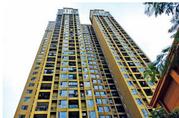
Photo taken on 12 July, 2015 shows the residential building where a fire took place in Wuhan City, capital of central China's Hubei Province. A fire at a residential building killed seven people and injured 12 others in Wuhan, local government said on Sunday. The fire broke out about 11:30 pm Saturday at the building's electric cable well.

WUHAN, 12 July — A fire at a residential building killed seven people and injured 12 others in central China's Hubei Province, local government said on Sunday.