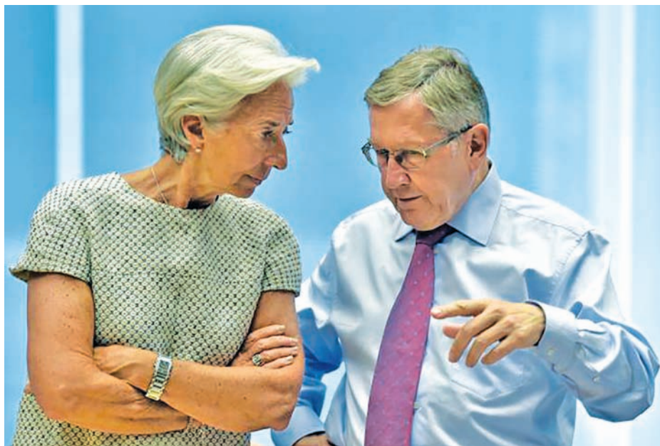
International Monetary Fund Managing Director Christine Lagarde chat with European Stability Mechanism Managing Director Klaus Regling (R) during a euro zone EU leaders summit on the situation in Greece, in Brussels, Belgium, on 11 July, 2015.

EU officials forecast a deal would be reached