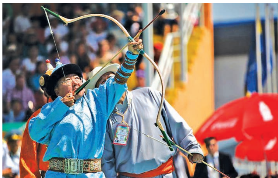
Mongolian President Tsakhia Elbegdorj attends an archery performance during the opening ceremony of the annual Nadam Fair in Ulan Bator, capital of Mongolia, on 11 July, 2015. The Nadam Fair, a traditional Mongolian pageant for entertainment and games, usually includes events of archery, wrestling, horse racing, dancing and acrobatics, which represent the traditional Mongolian culture.