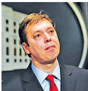
Serbian Prime Minister Aleksandar Vucic

BELGRADE, 12 July — The Serbian government held a special session in Belgrade on Saturday after the brutal attack on Serbian Prime Minister Aleksandar Vucic and his delegation at the commemoration service for the victims of crime in Srebrenica held in Potocari.