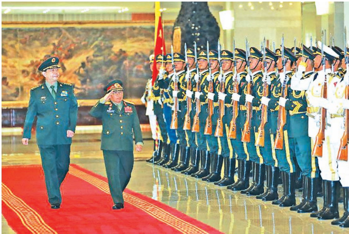
Chinese Defence Minister Chang Wanquan (L) and visiting Lao Defence Minister Sengnuan Saiyalath inspect the guards of honour before their talks in Beijing, capital of China on 8 July, 2015.

BEIJING, 9 July — China and Laos pledged closer military ties, as senior Chinese military officials met with visiting Lao Defence Minister Sengnuan Saiyalath on Wednesday in Beijing.