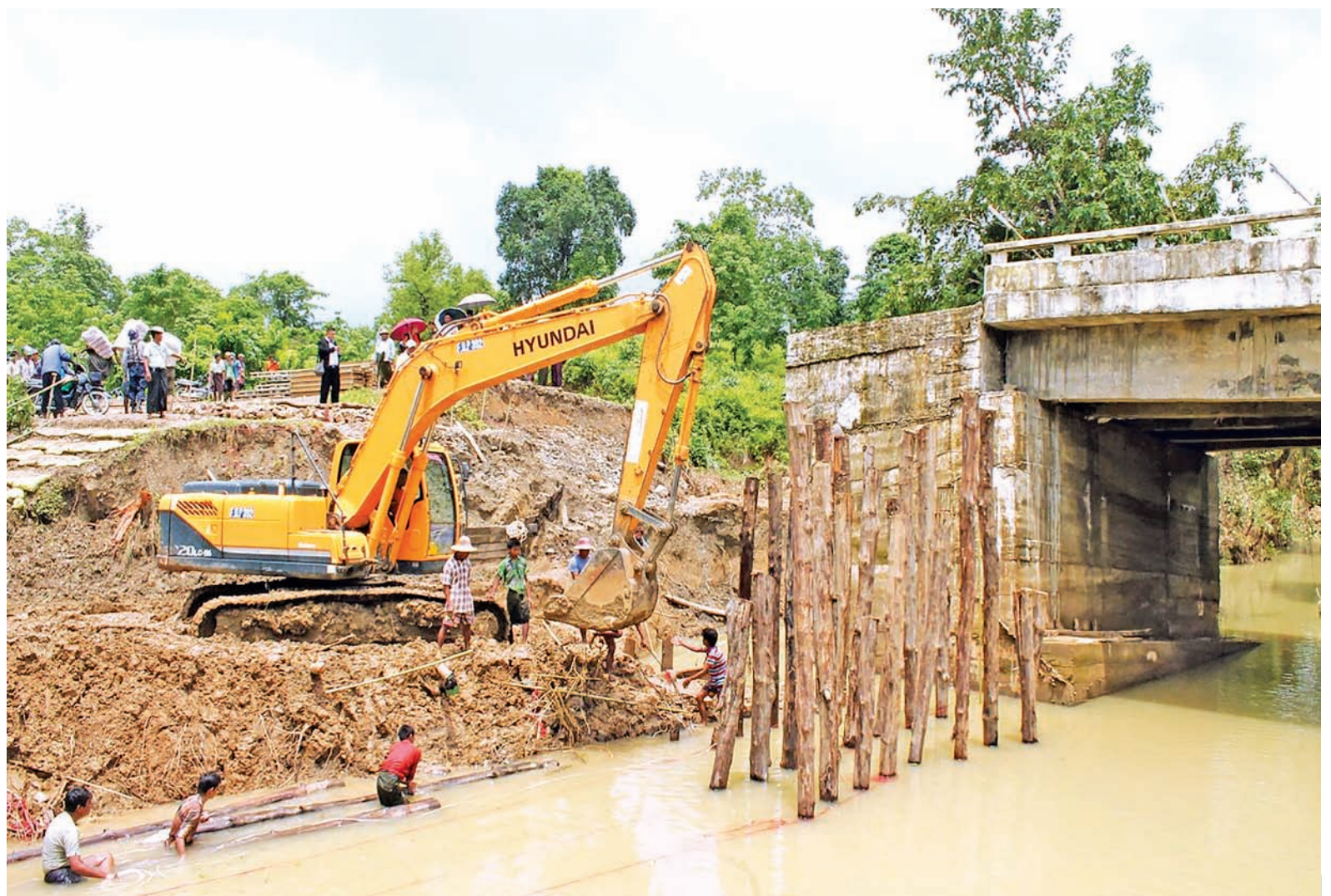
Skilled workers and engineers of Special Road Group No 18 repair damaged bridge on Taungup-Kyaukpyu road.

A delegation led by Union Minister for Border Affairs Lt-Gen Thet Naing