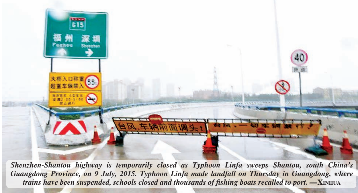
Shenzhen-Shantou highway is temporarily closed as Typhoon Linfa sweeps Shantou, south China's Guangdong Province, on 9 July, 2015. Typhoon Linfa made landfall on Thursday in Guangdong, where trains have been suspended, schools closed and thousands of fishing boats recalled to port.

GUANGZHOU, 9 July — Typhoon Linfa made landfall on Thursday in south China's Guangdong Province, where trains have been suspended, schools closed and thousands of fishing boats recalled to port.