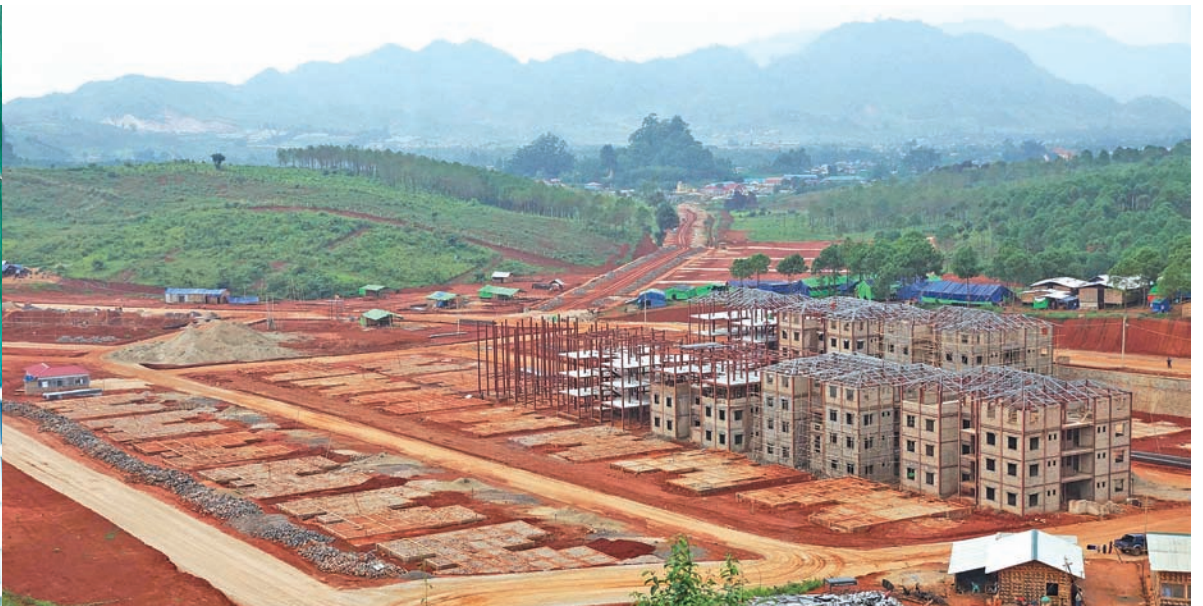
Vice President Dr Sai Mauk Kham views progress of Htinyu Myaing (Pine Villa) Urban Development Housing Complex in Lashio.