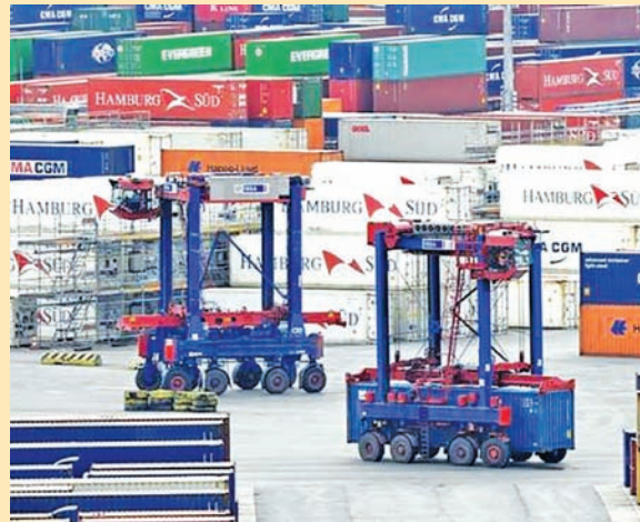
Van carriers transport containers at a shipping terminal in the harbour of Hamburg, on 9 Oct, 2014.

BERLIN, 9 July — German exports rose at their fastest pace this year in May, boosting expectations that Europe's largest economy will pull off stronger growth in the second quarter after expanding modestly in the first.