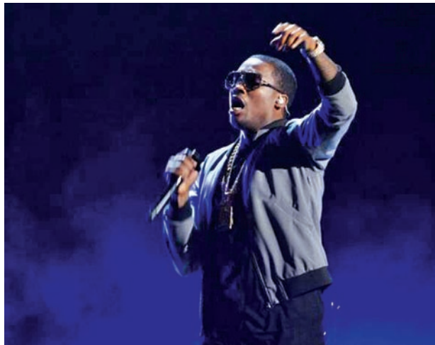
Meek Mill performs during the 2015 BET Awards in Los Angeles, California on 28 June, 2015.

tallies album sales, song sales (10 songs equal one album) and streaming activity (1,500 streams equal one album).