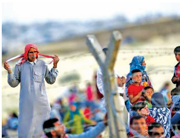
Syrian Kurds from Kobani wait behind the border fences to cross into Turkey as they are pictured from the Turkish border town of Suruc in Sanliurfa Province, Turkey, on 25 June, 2015.

GENEVA, 9 July — The number of Syrian refugees in neighbouring countries has passed 4 million, the UN refugee agency UNHCR said on Thursday, adding that the total was on course to reach 4.27 million by the end of 2015.