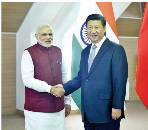
Chinese President Xi Jinping (R) shakes hands with Indian Prime Minister Narendra Modi in Ufa, Russia, on 8 July, 2015.

UFA, (Russia), 9 July — Chinese President Xi Jinping met with Indian Prime Minister Narendra Modi on Wednesday in the southwestern Russian city of Ufa ahead of two multi-