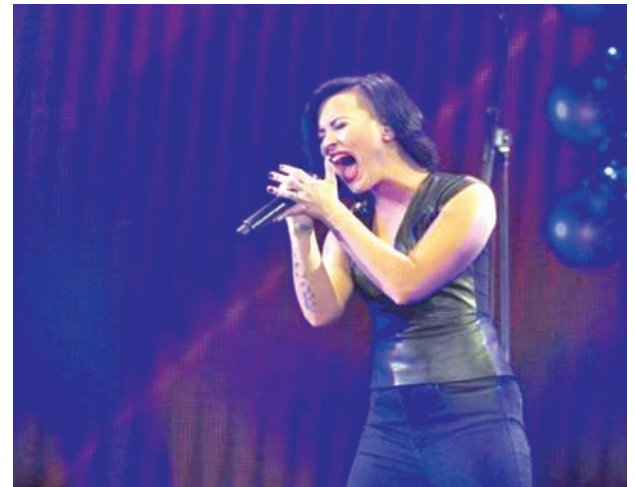
Singers Demi Lovato performs during KIIS FM's Jingle Ball 2014 at Staples Centre in Los Angeles, California on 5 Dec, 2014.

Grande, who was born in Florida and now lives in Los Angeles, said in the statement she has "always