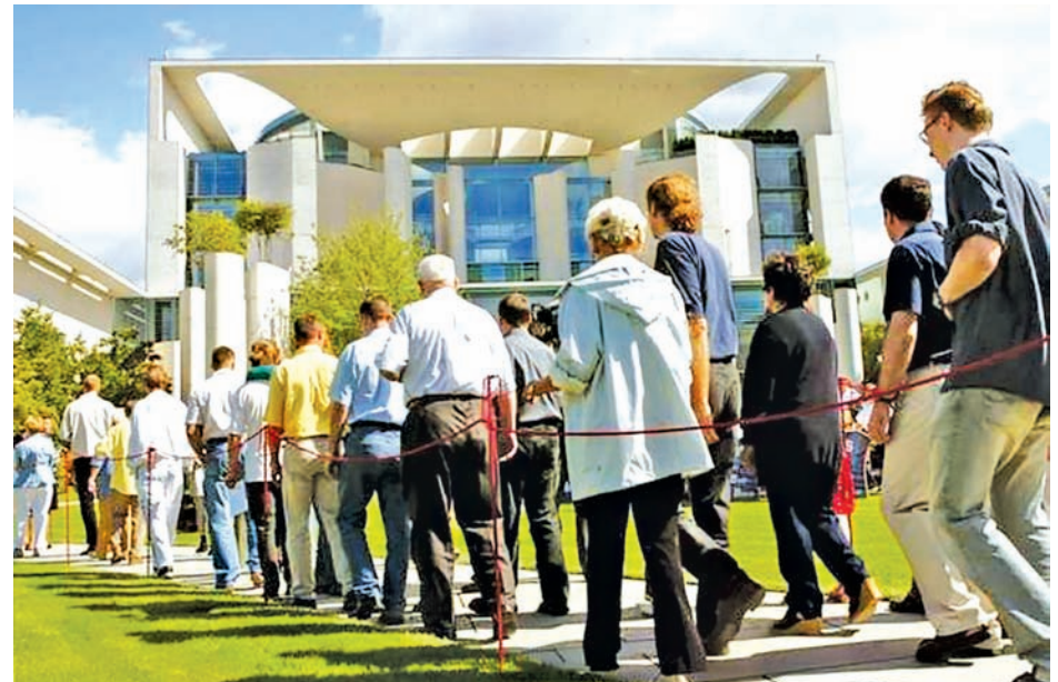
Visitors walk in front of the Chancellery during the second day of an open door weekend of several ministries in Berlin.

"The names associated with some of the targets indicate that spying on the Chancellery predates An-