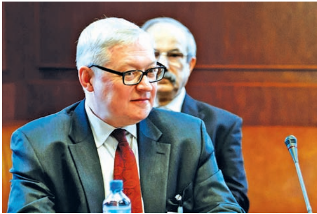
Russia's Deputy Foreign Minister Sergei Ryabkov

UFA, (Russia), 9 July — Nuclear talks between Iran and the world's six major powers have entered their most difficult phase, but all involved parties are working on new proposals submitted by Teheran, Russia's Deputy Foreign Minister Sergei Ryabkov said on Thursday.