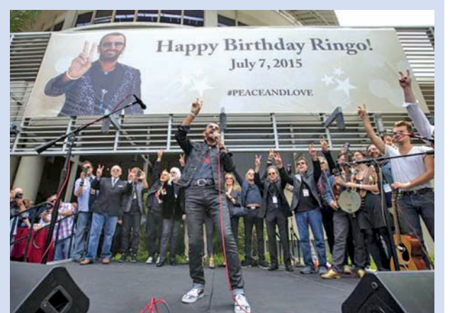
Musician Ringo Starr speaks during a 'Peace & Love' event to celebrate Starr's 75 th birthday in Los Angeles, California, on 7 July, 2015.