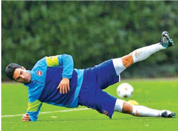
Arsenal's Mikel Arteta exercise during a training session at their training facility in London Colney, north of London, on 3 Nov, 2014.

LONDON, 9 July — Arsenal captain Mikel Arteta has signed a one-year contract extension, the Premier League club announced on Wednesday.