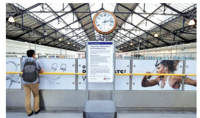
A commuter at Earls Court underground station stands next to a sign advising passengers of a planned industrial action in London, Britain, on 8 July, 2015.

"It is going to hit families, workers, and businesses across the capital," she said.—Reuters