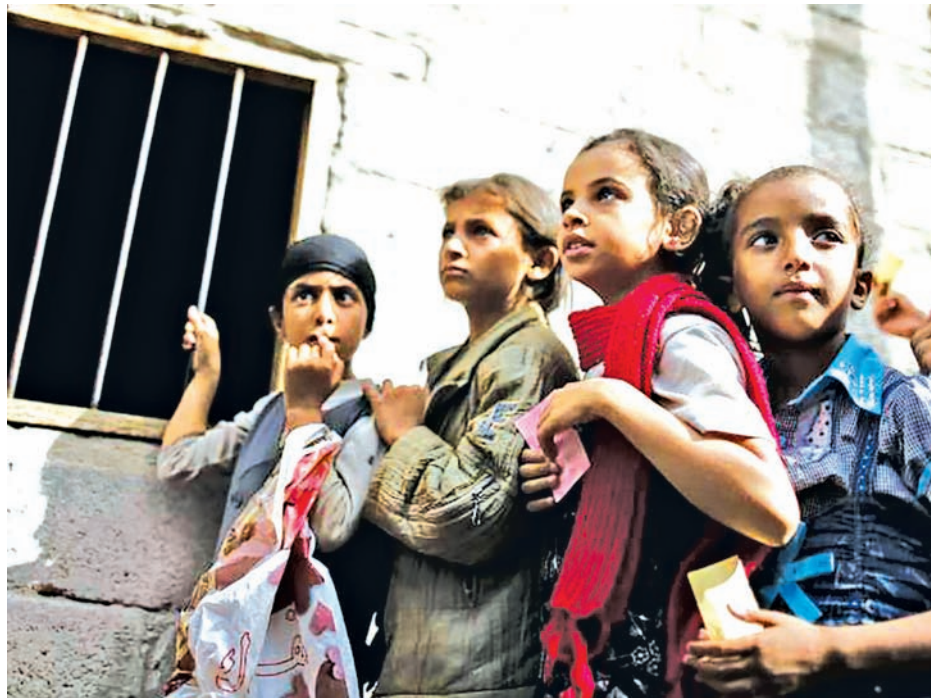
Girls wait for food rations outside a charity food assistance centre in Yemen's capital Sanaa on 1 July, 2015.

Since then, many shipping companies have pulled out. Those still willing to bring cargoes face incalculable delays and mandatory searches by coalition warships hunting for arms bound for the Houthis, the dominant warring faction.