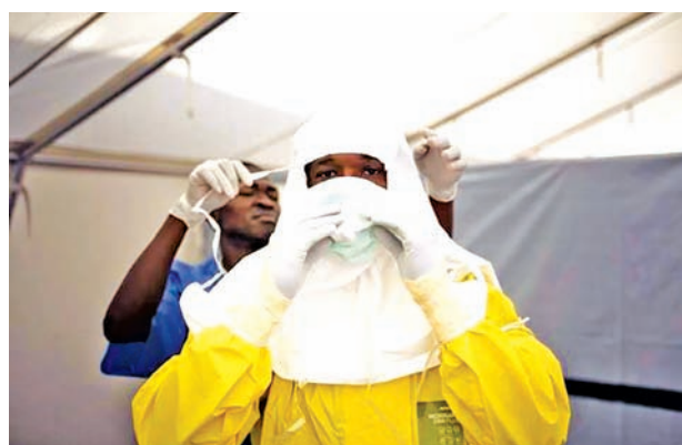
Health workers put on protective gear before entering a quarantine zone at a Red Cross facility in the town of Koidu, Kono district in Eastern Sierra Leone on 19 Dec, 2014.