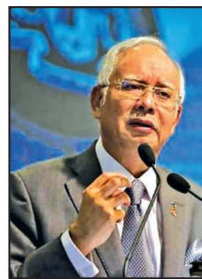
Malaysia’s Prime Minister Najib Razak speaks at a presentation for government interns at the Prime Minister’s office in Putrajaya, Malaysia on 8 July, 2015.

KUALA LUMPUR, 9 July — An interim report by the Malaysian government into debt-laden state investment fund 1Malaysia Development Berhad (1MDB) has found nothing suspicious after vetting its accounts, a parliamentary committee said on Thursday.