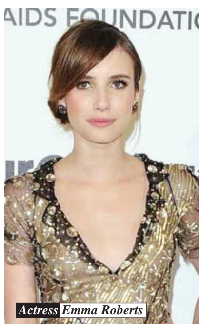
Actress Emma Roberts

LOS ANGELES, 9 July — Actress Emma Roberts says she been made fun of her pale complexion, which has made her develop insecurity about it.