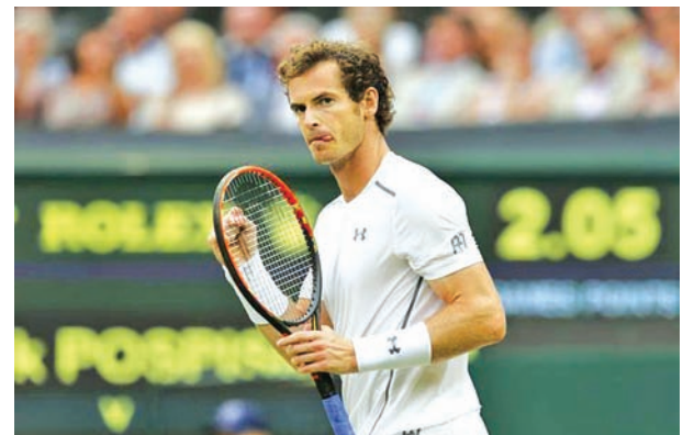
Andy Murray of Britain reacts after breaking serve during his match against Vasek Pospisil of Canada at the Wimbledon Tennis Championships in London, on 8 July, 2015.