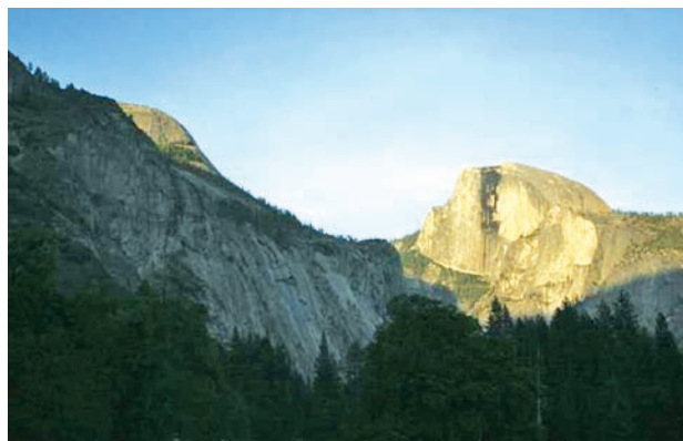
The last light of the day is reflected on Half Dome in Yosemite National Park, California on 17 May, 2009.

LOS ANGELES, 9 July — A 2,400-ton chunk of granite broke loose last week from the towering Half Dome formation in Yosemite National Park, altering one of North America’s most popular rock-climbing routes, but no one was hurt and casual visitors will probably never notice.