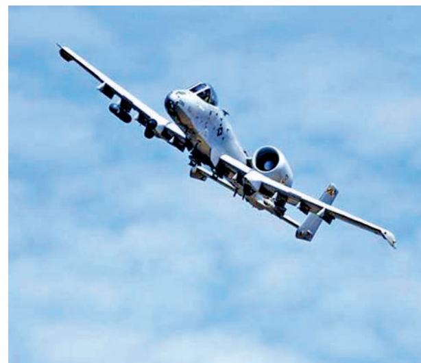
USAF ground support aircraft A-10 participates in the multinational NATO exercise Saber Strike in Adazi, Latvia, on 11 June, 2015.

James said she was disappointed that only four of NATO's 28 members had thus far met the NATO target of spending 2 percent of gross domestic product on defence.