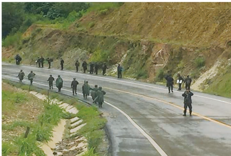
Tatmadaw columns combing areas of armed forces members along New Ashia Highway in Kawkaik Township.

NAY PYI TAW, 9 July — Myawady-Kawkaik section of Asia Highway was scheduled to commission in July, but Tatmadaw columns have to clear the areas of armed forces members who forcefully collect-