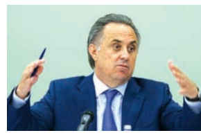
Russian Sports Minister Vitaly Mutko

Speaking to a group of foreign journalists assembling in Moscow at the start of a tour of the 11 World Cup cities, Mutko said: “No change in management at FIFA will