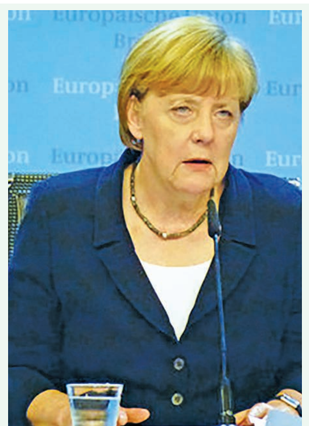
German Chancellor Angela Merkel

BERLIN, 8 July — German Chancellor Angela Merkel will arrive in Belgrade on Wednesday and meet with Serbia's most senior officials.