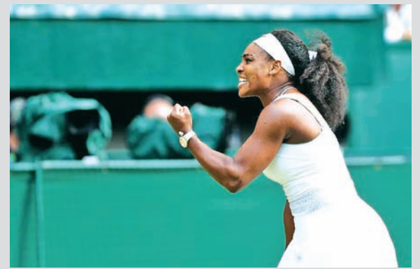
Serena Williams of the United States celebrates her victory over Victoria Azarenka of Belarus during the women's singles quarterfinal at 2015 Wimbledon Tennis Championships in London, Britain, on 7 July, 2015.

LONDON, 8 July — Five-time champion Serena Williams fought back from one set down to defeat former world No. 1 Victoria Azarenka to set up a mouth-watering semifinal clash against old rival Maria Sharapova at the Wimbledon Championships here on Tuesday.