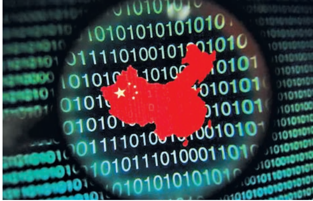
A map of China is seen through a magnifying glass on a computer screen showing binary digits in Singapore in this 2 Jan, 2014 photo illustration.

BEIJING, 8 July — China's parliament has published a draft cybersecurity law that consolidates Beijing's control over data, with potentially significant consequences for internet service providers and multinational firms doing business in the country.