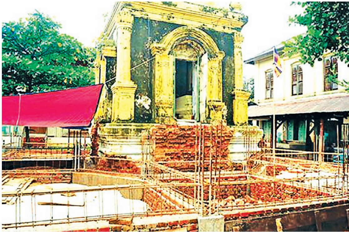
THATON, 8 July — Nearly 200 ancient votive tablets were unearthed recently at the temple of Abbot Shweminwun, founder of the Hngettwin Sangha sect, in Thaton Township of southern Myanmar's Mon State. The temple, which is more than a century old, is in the pre-