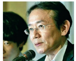
Japanese film director Masayuki Suo

Haruko gets a lucky break when she catches the