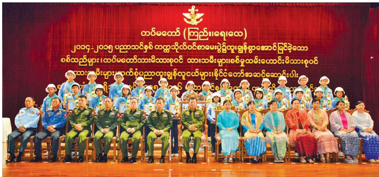
Senior General Min Aung Hlaing poses for documentary photo together with outstanding students.