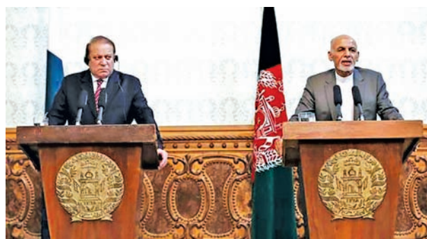
Afghan President Ashraf Ghani (R) and Pakistani Prime Minister Nawaz Sharif attend a news conference in Kabul, on 12 May, 2015.

Pakistan hosted the meeting in a tentative step towards ending more than 13 years of war in neighbouring Afghanistan, in which the Taleban have been fighting the government in hopes of re-establishing their hard-line Islamist regime that was toppled by US-sponsored military