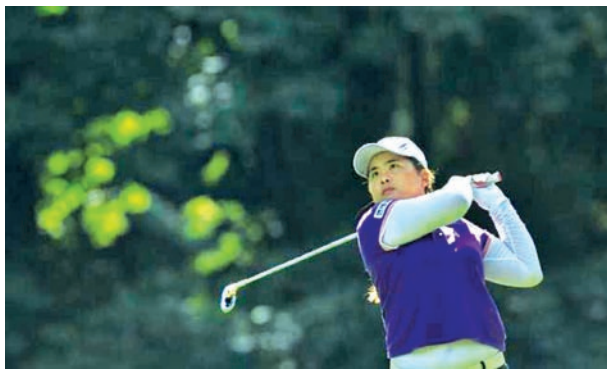
Park In-bee of South Korea hits off the ninth fairway during the first round of the LPGA Canadian Women's Open golf tournament in Coquitlam, British Columbia on 23 Aug, 2012.

Not exactly comforting to the rest of the 156-player field that in-