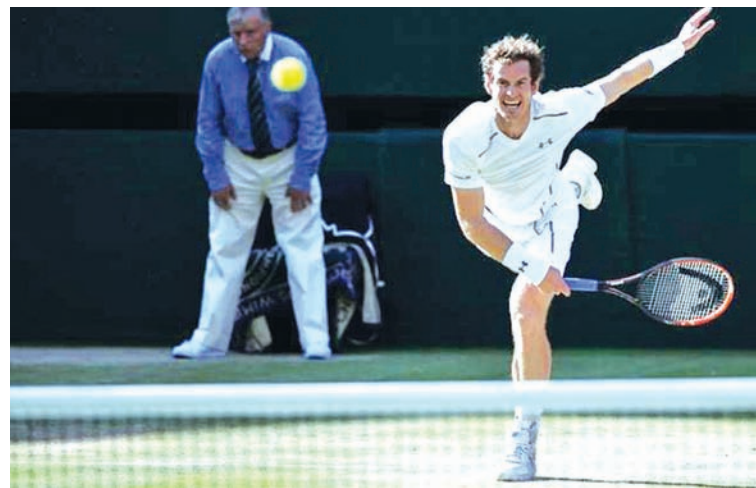
Andy Murray of Britain serves during his match against Ivo Karlovic of Croatia at the Wimbledon Tennis Championships in London, on 6 July, 2015.