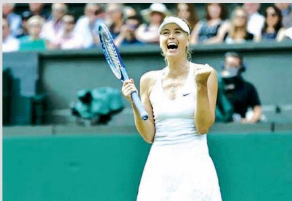
Maria Sharapova of Russia celebrates after winning her match against Coco Vandeweghe of the USA at the Wimbledon Tennis Championships in London, on 7 July, 2015.