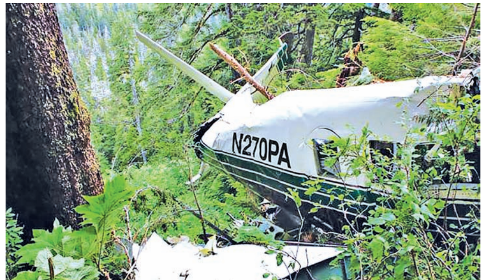
A sightseeing plane that crashed in southeast Alaska is seen in this undated picture from the National Transportation Safety Board (NTSB) released on 28 June, 2015.

The flight, an excursion booked via a cruise ship, was sold through Holland America Line, a unit of Carnival Corp, which has since stopped selling the flights.—Reuters