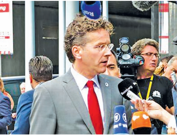
Jeroen Dijsselbloem, the Dutch finance minister who leads the Eurogroup, speaks with reporters in Brussels on 7 July, 2015. Leaders of the 19 eurozone members were called to Brussels for an emergency summit that day in the wake of Greece rejecting belt-tightening reforms proposed by its creditors in a referendum.