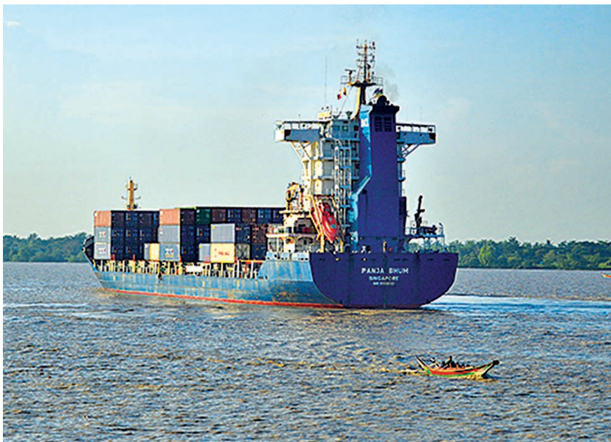
A cargo vessel in the Yangon River on its way to the Yangon Port.

New Downtown Development Public Ltd is also waiting for MIC approval on a deal with the MPA after winning a build-operate-transfer tender to upgrade the Nanthida pier and docks for the Pan-