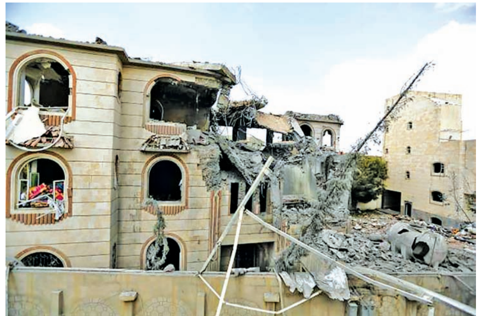
The house of Brigadier Khaled al-Anduli, an army commander loyal to the Houthi movement, is seen after it was hit by Saudi-led air strikes in Yemen's capital Sanaa on 6 July, 2015.

In the same province, about 20 fighters and civilians were killed at a Houthi checkpoint outside the main