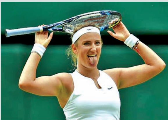
Victoria Azarenka of Belarus reacts during her match against Serena Williams of the USA at the Wimbledon Tennis Championships in London, on 7 July, 2015.