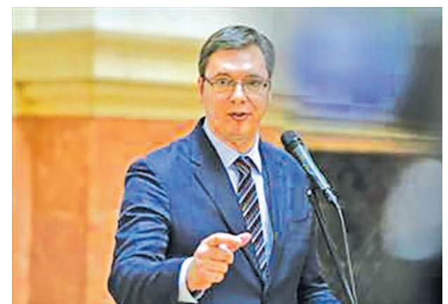
Serbian Prime Minister and President of National Minority Council Aleksandar Vucic

BELGRADE, 8 July — The government is determined to resolve the issues of all national minorities at the highest level, Serbian Prime Minister and President of National Minority Council Aleksandar Vucic said on Tuesday.