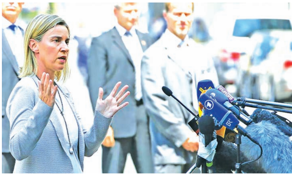
European Union foreign policy chief Federica Mogherini talks to journalists outside Palais Coburg, the venue for nuclear talks in Vienna, Austria on 7 July, 2015.

There was disagreement about whether the talks