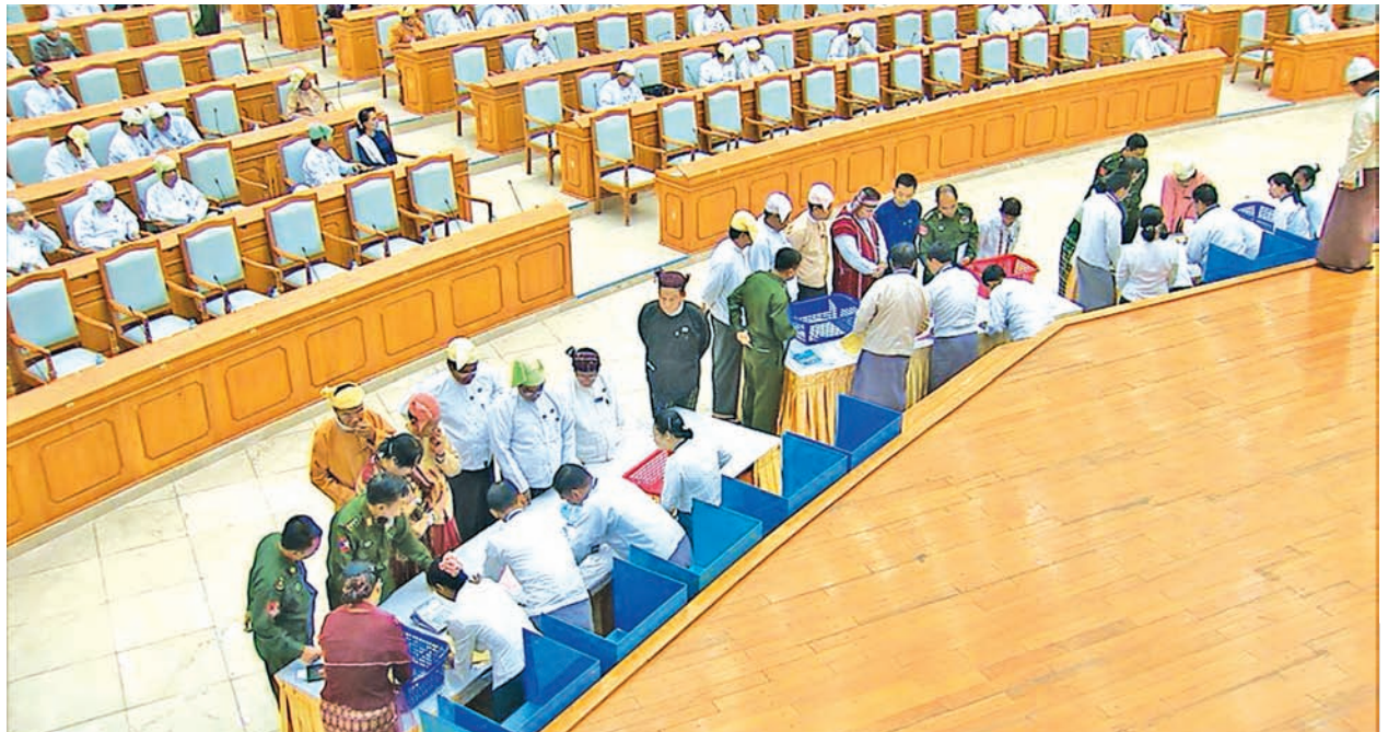
MPs voting at Pyidaungsu Hluttaw on Wednesday session.

Myanmar has a life expectancy of 66 years in average, with 64 years for men and 68 for women, he added.