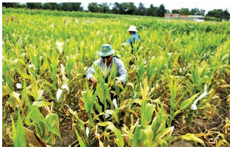
Scientists work in a field of maize plants at the International Maize and Wheat Improvement Centre (CIMMYT) in El Batan on the outskirts of Mexico City on 31 Aug, 2010.

Hydro Tasmania uses that water to generate electricity via turbines, before it flows into irrigation systems that support feed crops and pasture. That has helped boost the state’s dairy sector, where milk production is up about a tenth so far this season.—Reuters