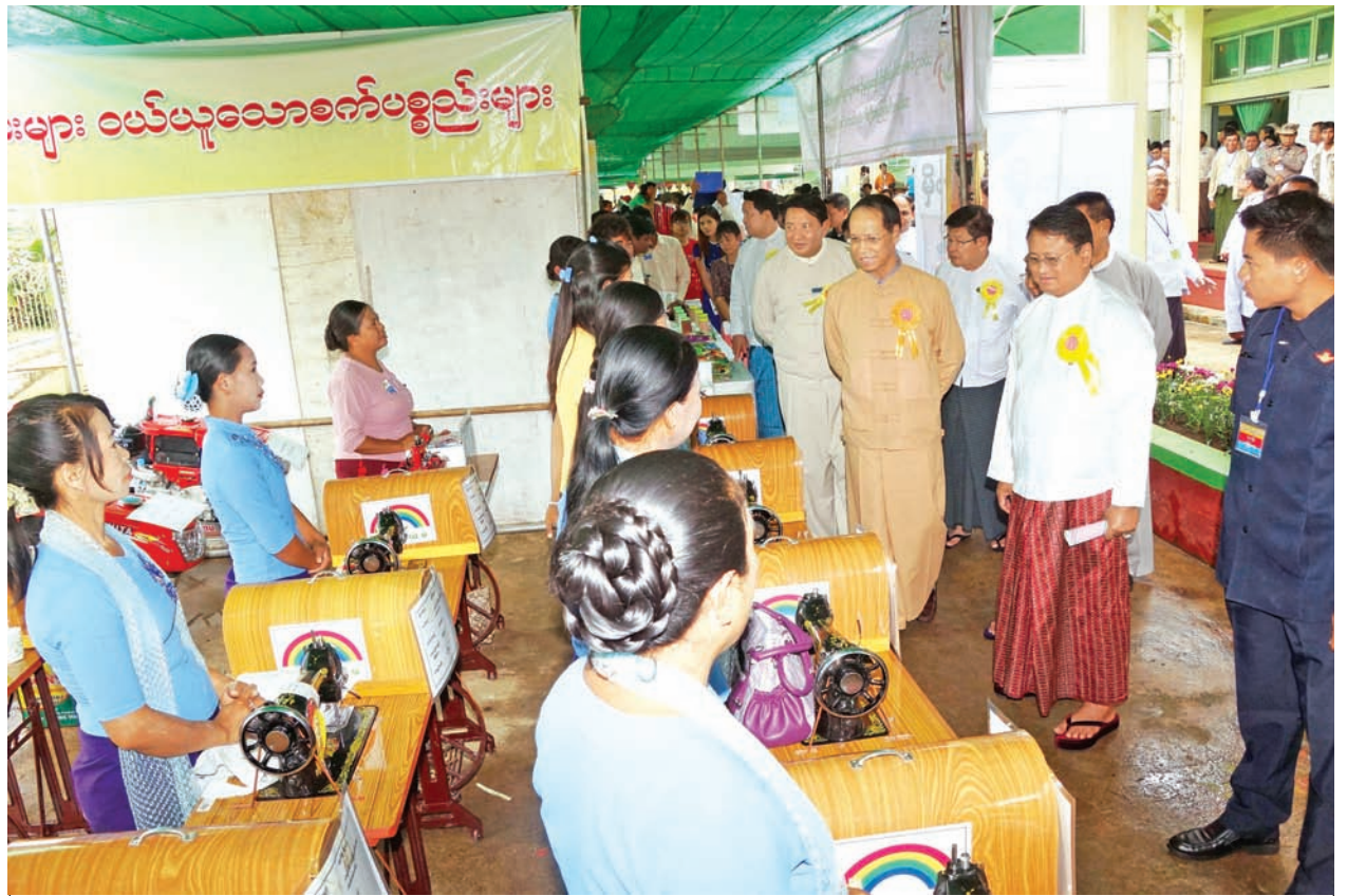
Vice President Dr Sai Mauk Kham views sewing machines purchased by cooperative members.