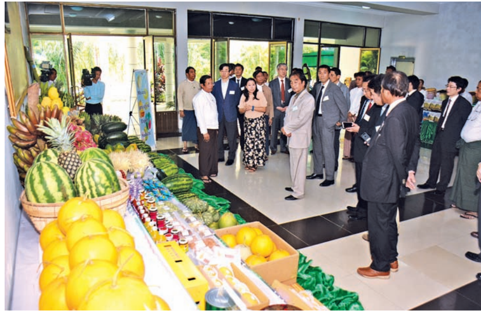
Union Minister for Agriculture and Irrigation U Myint Hlaing and Japanese officials view fruits and agricultural produce.—MNA

gian ambassador to Myanmar Ann Ollestad and UN resident representative Ms Renata Lok-Dessallien made speeches. The workshop was jointly organized by the Ministry of Environmental Conservation and Forestry and the United Nations Development Programme.—MNA