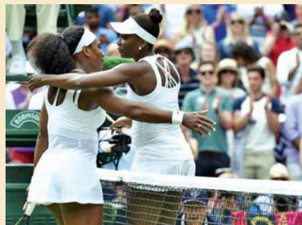
Serena Williams of the USA embraces Venus Williams of the USA after winning their match at the Wimbledon Tennis Championships in London, on 6 July, 2015.

friend in the world," said Serena, whose next step en route to a 21st grand slam title will be against Victoria Azarenka in the quarter-finals.