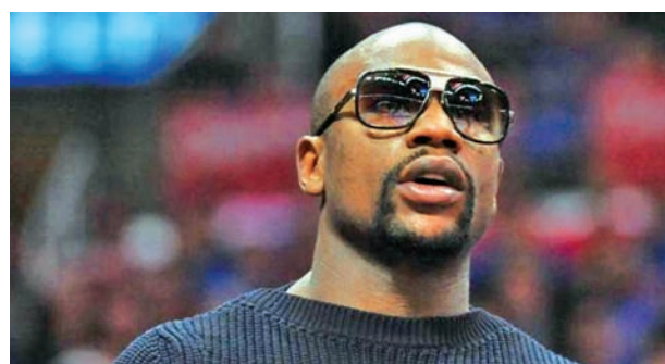
Floyd Mayweather Jr in attendance as the Houston Rockets play against the Los Angeles Clippers during the first half in game three of the second round of the NBA Playoffs at Staples Centre, Los Angeles, CA, USA on 8 May, 2015.

TORONTO, 7 July — Floyd Mayweather Jr has been stripped of the welterweight world title he won after beating Filipino Manny Pacquiao this year for failing to comply with rules, the World Boxing Organization said on Monday.