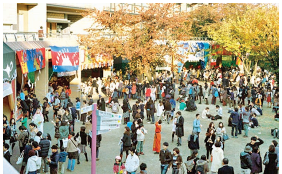
Supplied photo taken in 2013 shows a scene from the “Gaigosai” annual food festival at the Tokyo University of Foreign Studies in the city of Fuchu, Tokyo. University officials said on 7 July, 2015, that health authorities found that some of the planned dishes to be served at the festival failed to meet sanitary regulations.

Serving a variety of food “takes much time to prepare and there are fears