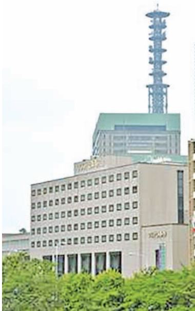
Photo taken on 6 July, 2015 shows Hotel Grand Hill Ichigaya (front) and the Defence Ministry headquarters (behind) in Tokyo. Information about defence personnel may have been leaked after a computer at the hotel, mainly used by Defence Ministry officials and runs by the mutual aid society for the ministry's employees, suffered a cyberattack in May.