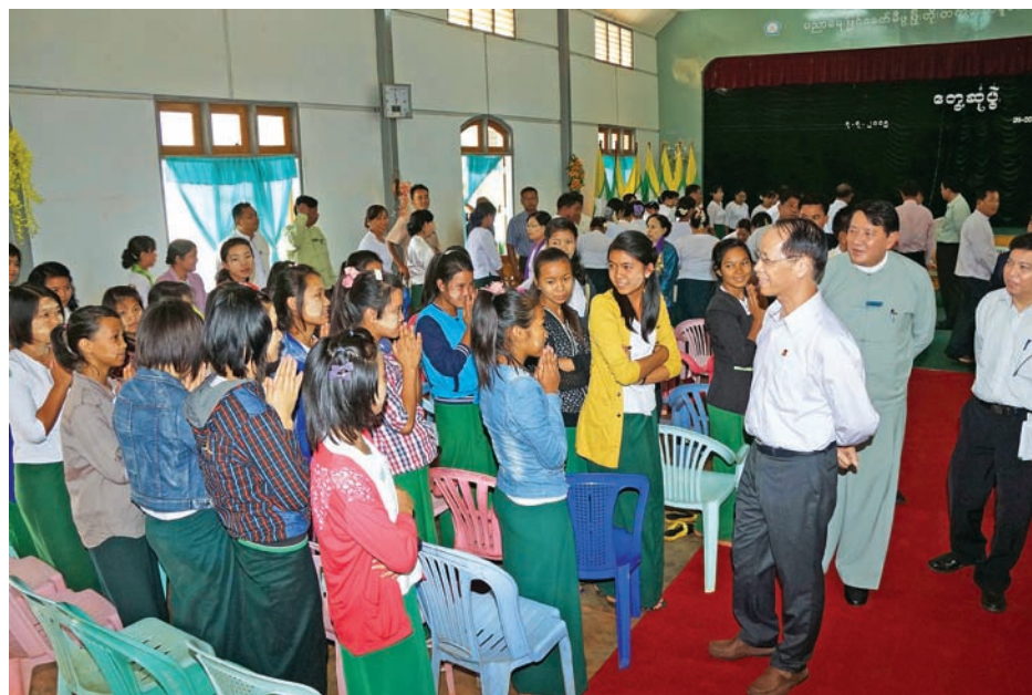
Vice President Dr Sai Mauk Kham meets basic education students in Lashio.