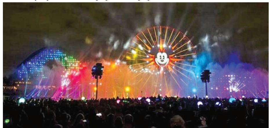
People watch “World of Colour — Celebrate! The Wonderful World of Walt Disney” during Disneyland Diamond Celebration in Anaheim, California on 22 May, 2015.