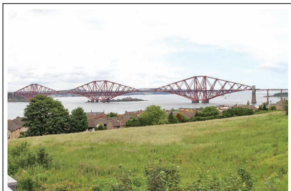
Photo taken on 6 July, 2015 shows the Forth Bridge in South Queensferry at Firth of Forth, Scotland. The Forth Bridge in Scotland in northern Britain was officially inscribed as a United Nations Educational, Scientific and Cultural Organizations (UNESCO) World Heritage site, it was announced on Sunday.