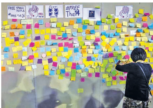
A woman posts a message to show support for 14 students who have been arrested, on a board near the Bangkok Art and Culture Centre (BACC) in Bangkok, Thailand, on 3 July, 2015.

BANGKOK, 7 July — A Thai military court on Tuesday released 14 students held for almost two weeks for holding anti-coup protests in defiance of a ban on public gatherings, but the charges against them have not been dropped.