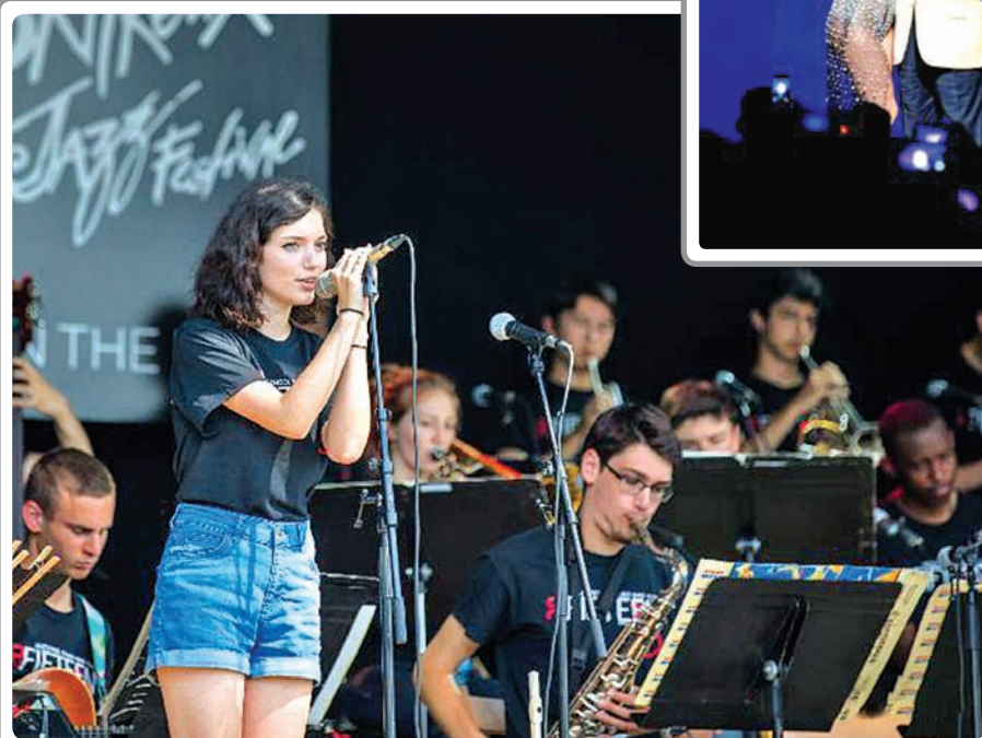
Members of a US student band perform during the 49th Montreux Jazz Festival in Montreux, Switzerland, on 6 July, 2015. The festival runs from 4 July to 18 July.

MONTREUX, (Switzerland), 7 July — Pop star Lady Gaga and crooner Tony Bennett brought a mix of Cole Porter, Duke Ellington, Frank Sinatra and even Edith Piaf to a sell-out crowd spanning generations at the Montreux Jazz Festival on Monday night.