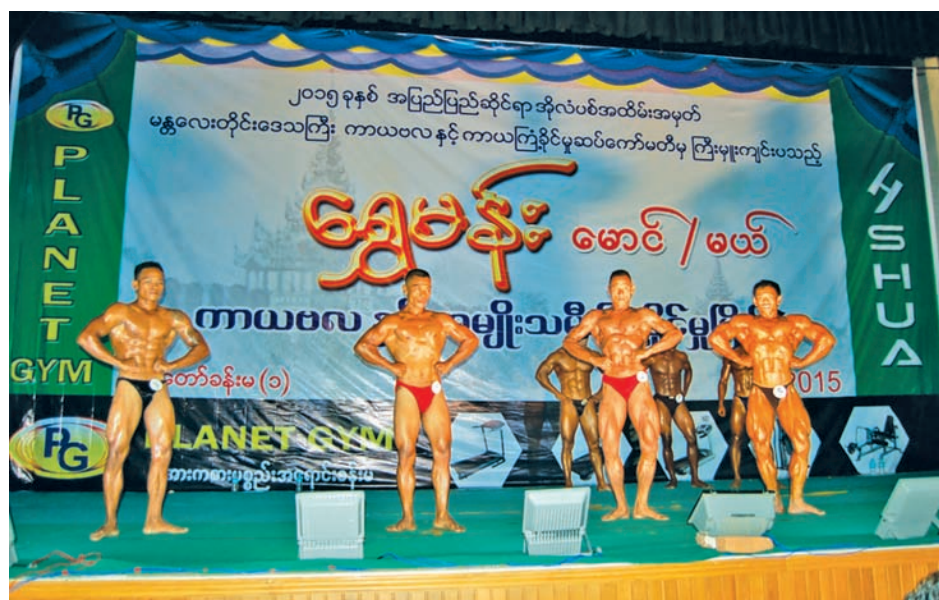
Body builders show their postures in bodybuilding contest.