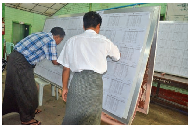
Two local people check their names in voter list. Po HTAUNG

The voters can also ask for correction of their names with the authority of polling station officers on election day, the officials said.