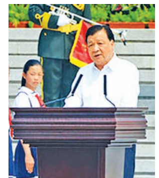
Liu Yunshan, the Chinese Communist Party's fifth-ranked leader