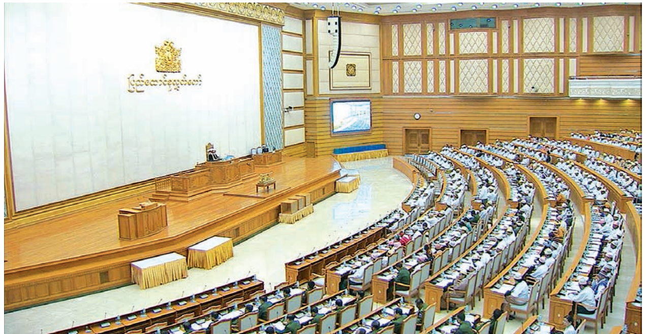
tutional amendment bill of provision 436 (b).

The Speaker of the Pyidaungsu Hluttaw told parliament to seek approval from MPs on the consti-