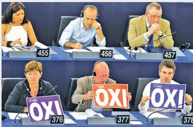
Members of the European Parliament hold posters with the word 'No' (Oxi in Greek) during a debate at the European Parliament in Strasbourg, France on 6 July, 2015.

From the Greek side, the key to making any deal politically acceptable will be to win a stronger commitment from Merkel and other lenders to reschedule Greece's giant debt