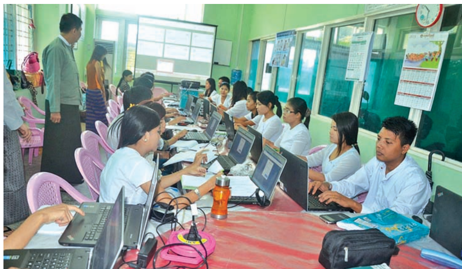
Volunteers compile voter lists at election sub-commission office.

YANGON, 7 July — Yangon electoral officials on Tuesday said human error, technical faults and a shortage of staff were to be blamed for problems with voter lists for the upcoming general election.