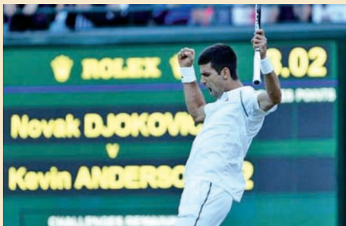
Novak Djokovic of Serbia celebrates after winning the second set during his match against Kevin Anderson of South Africa at the Wimbledon Tennis Championships in London on 6 July, 2015.