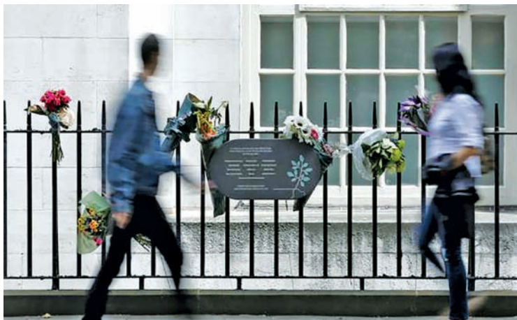
Passers-by look at a memorial plaque attached to railings in Tavistock Square, in memory of those who lost their lives on a number 30 double-decker bus during the 7/7 attack in 2005, in London, Britain on 6 July, 2015.

In the early hours of 7 July a decade ago, four young British Muslims travelled down to London