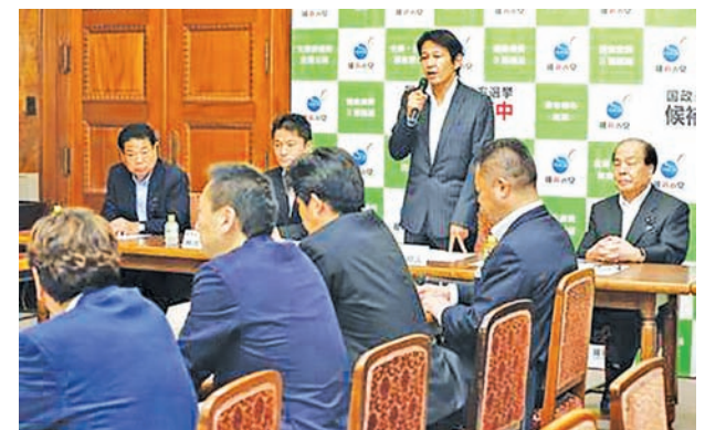
Japan Innovation Party leader Yorihisa Matsuno (standing) addresses a board meeting of the opposition party in Tokyo on 7 July, 2015.

In a meeting last month, these lawmakers close to Abe lambasted media critical of the government's security policies. The security legislation would enable Japan to exercise the right to collective self-defence, or coming to