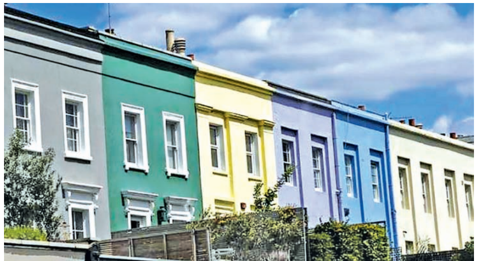
A row of houses are seen in London, Britain on 3 June, 2015.

UK Mortgages aims to pay a dividend of 3 pence per ordinary share for the financial year ending 30 June 2016 with a first interim dividend to be paid in April 2016. Numis Securities Limited acted as UK Mortgages' broker and financial adviser and will continue working with the company.—Reuters