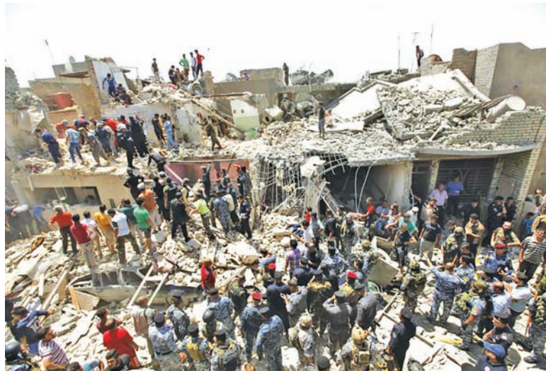
Iraqi security forces and people stand outside houses that were damaged after an Iraqi Sukhoi jet accidentally dropped a bomb in Ni'iriya district in Baghdad on 6 July, 2015.

BAGHDAD, 7 July — An Islamic State militant blew up an explosive-laden bulldozer near Haditha, killing seven Iraqi soldiers in one of a wave of bomb attacks on the northwestern town on Monday, a police source said.