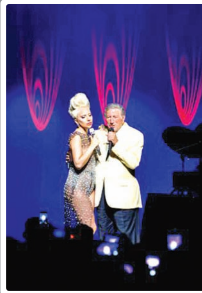
Tony Bennett and Lady Gaga perform together at the 49th Montreux Jazz Festival in Montreux, Switzerland, on 6 July, 2015, in this handout courtesy of the Montreux Jazz Festival. REUTERS