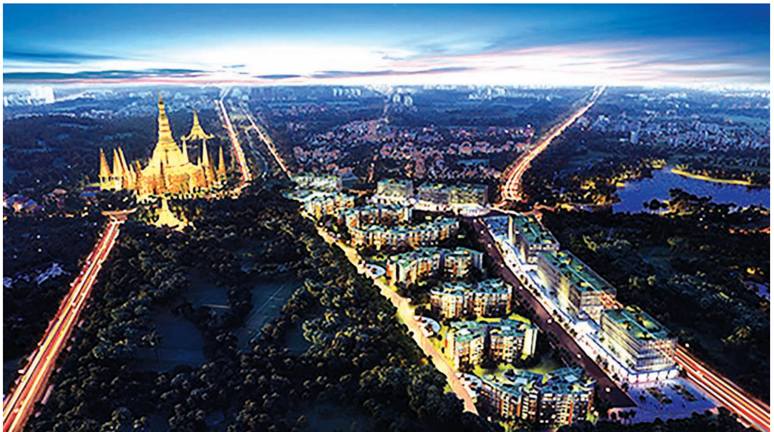
The government cancels Dagon City Project near the Shwedagon Pagoda.

As the sites are located near to the (See page 2)