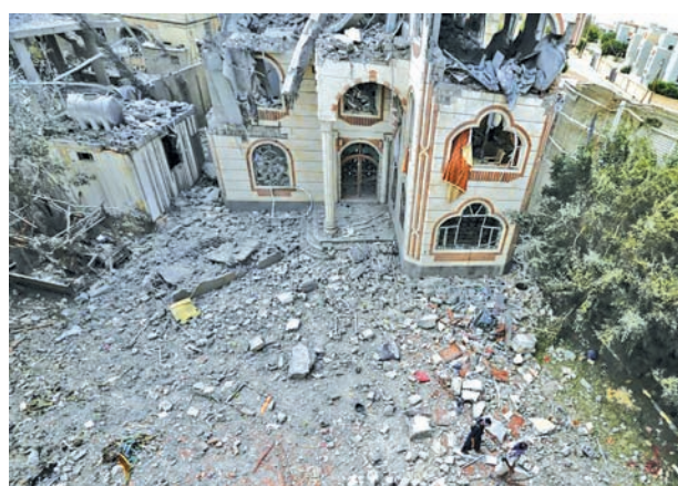
Guards walk on the rubble of the house of Brigadier Khaled al-Anduli, an army commander loyal to the Houthi movement, after it was hit by Saudi-led air strikes in Yemen's capital Sanaa on 6 July, 2015.

The Yemeni government, exiled in Riyadh, said consultations were being held on implementing an April UN resolution calling for the Houthis to quit cities seized since September and for aid supplies