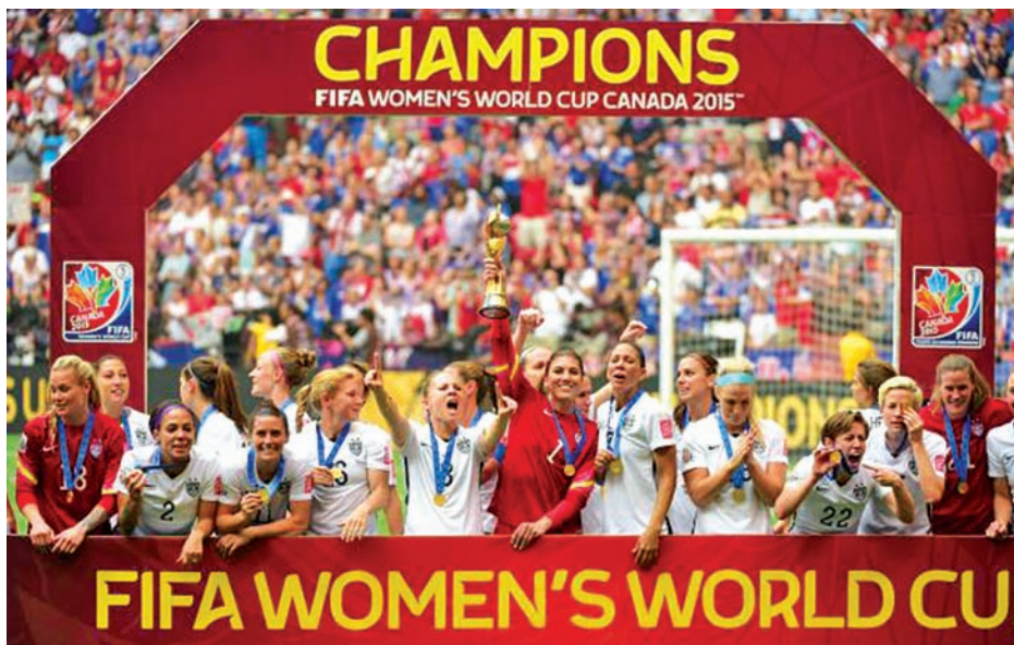
United States goalkeeper Hope Solo (1) hoists the FIFA Women's World Cup trophy as she and her teammates pose with their medals after defeating Japan in the final of the FIFA 2015 Women's World Cup in Vancouver on 5 July, 2015.

Sunday's audience also crushed the 13.5 million who watched the American