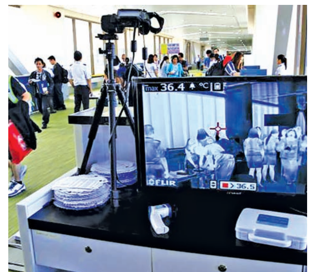
A monitor connected to a body temperature scanner shows flight passengers arriving from South Korea, at Ninoy Aquino International Airport in Manila, on 9 June, 2015.