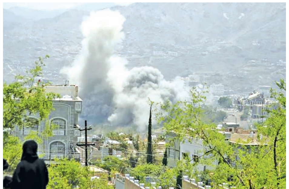
Dust rises from the site of a Saudi-led air strike in Yemen's southwestern city of Taiz on 5 July, 2015.

Saleh, the strongman who resigned following 2011 "Arab Spring" protests after more than three decades in power, has emerged as the main military ally of the Houthi Shi'ite fighters. The strikes late on Sunday also struck