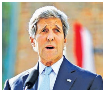
US Secretary of State John Kerry

“If hard choices get made in the next couple of days, made quickly, we could get an agreement