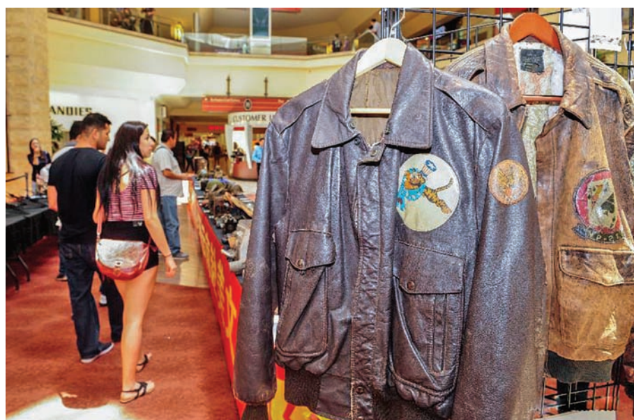
People visit the exhibition named "Welcome Home, Flying Tigers" held at Puente Hill Mall in Los Angeles, the United States, on 5 July, 2015. A cultural exhibition named "Welcome Home, Flying Tigers" is held here in order to commemorate the 70th anniversary of Chinese people's Anti-Japanese War and the World Anti-Fascist War.—XINHUA

ies of the four were found near the living room on the first floor. They believe that most of the family members were upstairs in the house when the fire broke out and fell downstairs after the flames burned through the floor.—Kyodo News