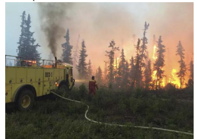
Firefighters tackle a wildfire near the town of La Ronge, Saskatchewan on 4 July, 2015 in a picture provided by the Saskatchewan Ministry of Government Relations.—REUTERS