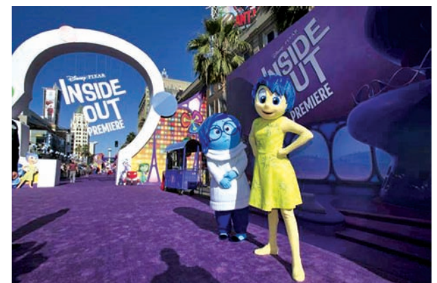
'Joy' and 'Sadness', characters of the animation film 'Inside Out', pose at its premiere at El Capitan theatre in Hollywood, California on 8 June, 2015. The movie opens in the US on 19 June.

LOS ANGELES, 6 July — "Inside Out" delivered the firepower at the five-day holiday weekend box office as it finished in first ahead of "Jurassic World" and new entries "Terminator: Genisys" and "Magic Mike XXL."