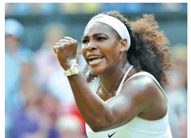
Serena Williams of the USA celebrates winning a game during her match against Heather Watson of Britain at the Wimbledon Tennis Championships in London, on 3 July, 2015.

The 33-year-old American, who plays her big sister Venus in the fourth round of the grass court championships later on Monday, has won 20 grand slam singles titles