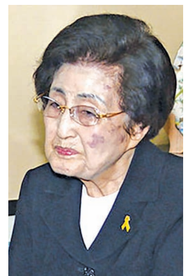
Photo taken in May 2015 in Seoul shows Lee Hee-ho, the widow of former South Korean President Kim Dae-jung. Lee is scheduled to make a four-day visit to North Korea from 5 Aug, 2015, where she will visit a children’s hospital, a maternity hospital and a nursery.