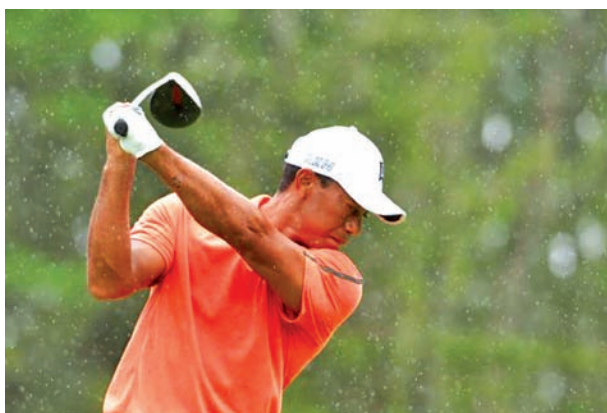
Tiger Woods takes a practice swing on the 11 th tee at The Old White TPC.

NEW YORK, 6 July — Tiger Woods declared his tie for 32 nd at the Greenbrier Classic a "very positive week" and sounded genuinely excited about his prospects ahead of this month's British Open at St Andrews starting on 16 July.