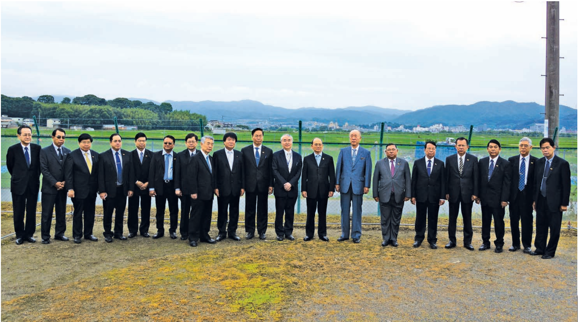
President U Thein Sein poses for documentary photo together with officials at Hoju collective farm outside Kyoto, Japan.