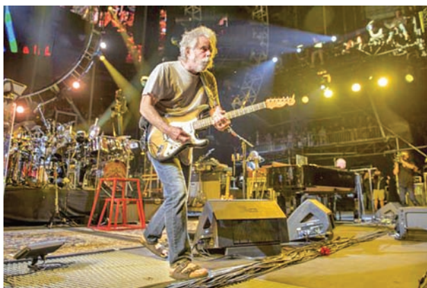
Guitarist Bob Weir of veteran rock band The Grateful Dead performs during the second day of their last three concerts at Soldier Field stadium in Chicago, Illinois on 4 July, 2015

CHICAGO, 6 July — The Grateful Dead gave what they say will be their last group performance on Sunday, playing to some 70,000 singing, dancing and tearful fans in Chicago's Soldier Field.