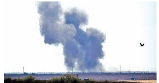
Smoke rises in Egypt's North Sinai along the border with southern Israel, on 1 July, 2015.