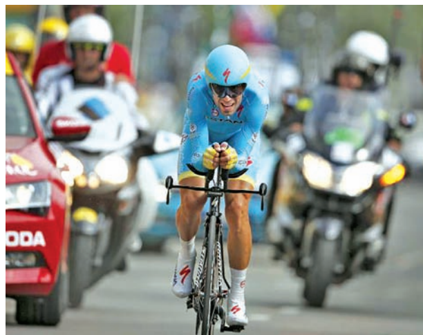
Astana rider Vincenzo Nibali of Italy cycles during the 13.8 km (8.57 miles) individual time-trial first stage of the 102nd Tour de France cycling race in Utrecht, Netherlands, on 4 July, 2015.

"Last year everything was great, less so this year, but that's cycling," the Italian told reporters.