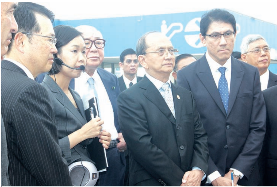
President U Thein Sein visits natural gas power plant in Iwasaki, Osaka City.