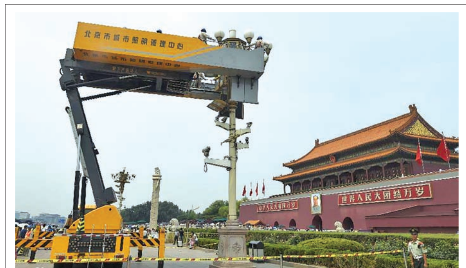
Workers clean and overhaul a lamp during the annual maintenance of city lamps near Tian’anmen Square, in Beijing, capital of China, on 6 July, 2015.