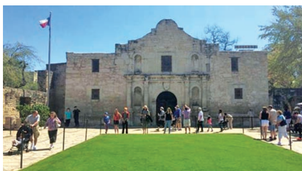
Visitors walk at the entrance to the Alamo, the most-visited tourist site in the state, in San Antonio, Texas on 2 March, 2015.