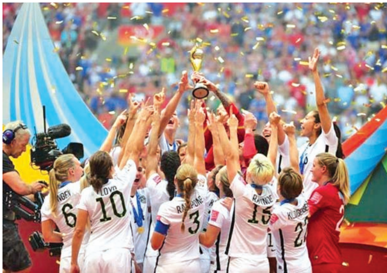
United States players react as they receive the FIFA Women's World Cup trophy after defeating Japan in the final of the FIFA 2015 Women's World Cup at BC Place Stadium.

"We have had the pressure of being champions these past four years but to get to this stage the players