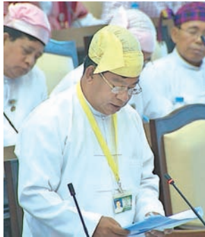
Deputy Minister for Education U Thant Shin.