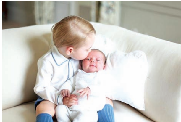
Prince George and Princess Charlotte are seen in this undated handout photo taken by the Duchess in mid-May at Anmer Hall in Norfolk and released by the Duke and Duchess of Cambridge on 6 June, 2015.