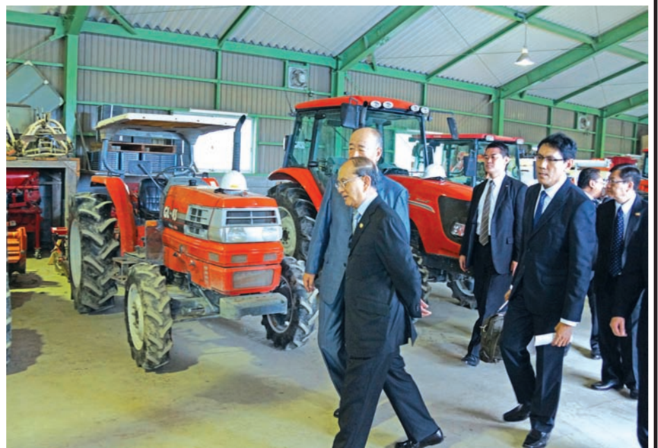
President U Thein Sein views agricultural machinery at Hoju agricultural farm outside Kyoto.—MNA