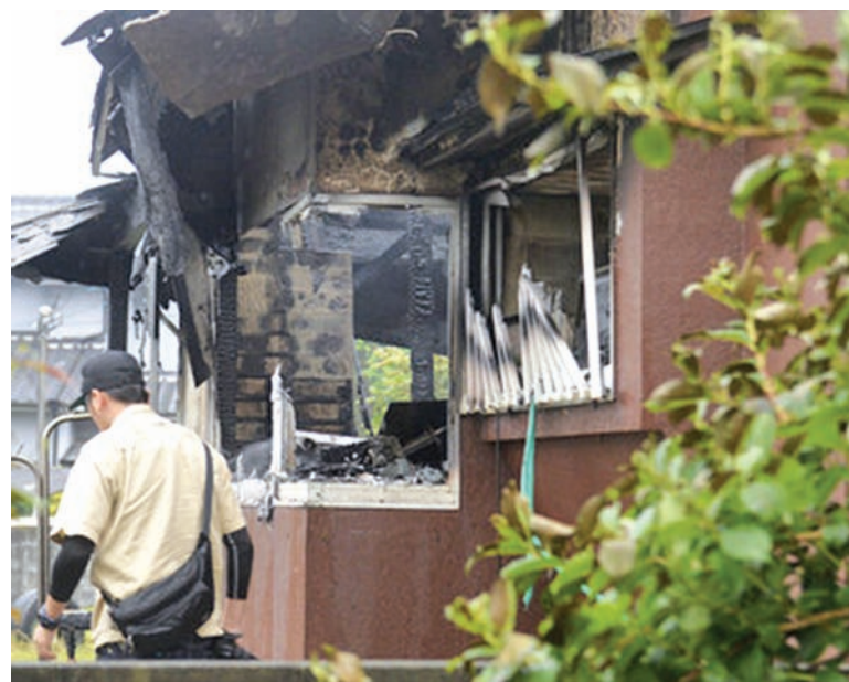
Photo taken on 6 July, 2015 shows a burnt two-story wooden house in Oita Prefecture, southwestern Japan. Four bodies of children were found at the site, and their father Kenichiro Suemune, 40, was arrested the same day on suspicion of arson.

The fire broke out shortly before midnight Sunday at the two-story wooden house in the city of Kitsuki and was put out about 100 minutes later, the police said. Suemune's wife, 42, and eight children lived in the house. The missing four are the eldest daughter Yukari, 14, the