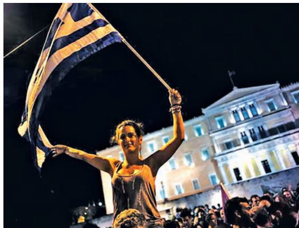
Greek Finance Minister Yanis Varoufakis leaves after making a statement in Athens, Greece on 5 July, 2015.

Public opinion in Europe's biggest economy is fast turning against any