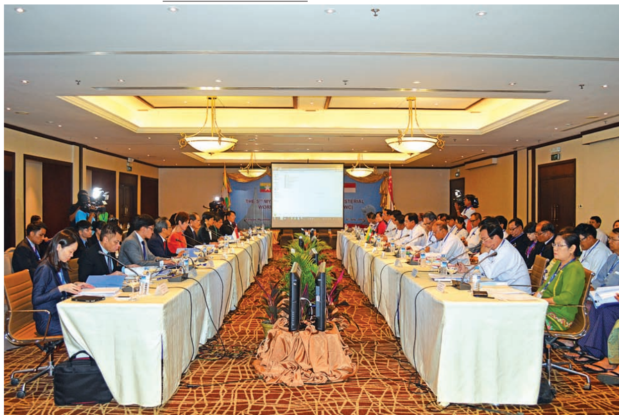
Sectoral cooperation between Myanmar and Singapore are discussed at 5 th Singapore-Myanmar Joint Ministerial Working Committee meeting.