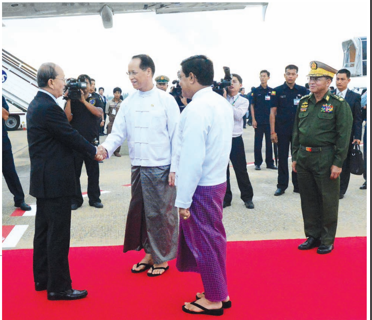
President U Thein Sein being welcomed back by Vice Presidents Dr Sai Mauk Kham and U Nyan Tun and Senior General Min Aung Hlaing at Nay Pyi Taw Airport.