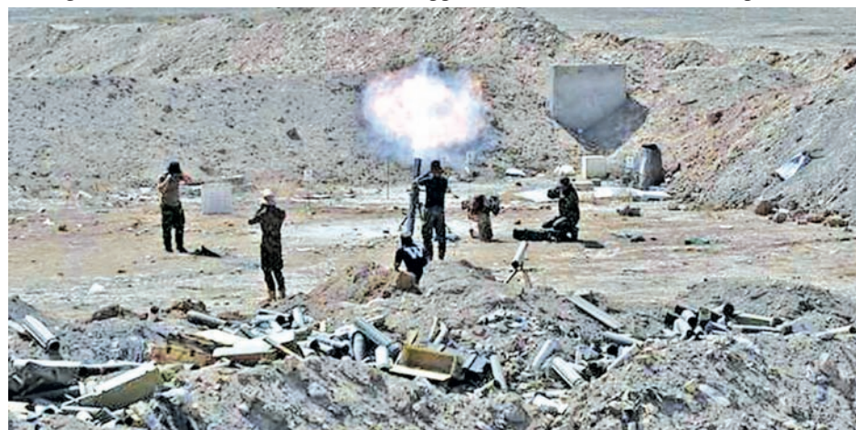
Members of the Iraqi army and Shi'ite fighters launch a mortar toward Islamic State militants outskirts the city of Falluja, Iraq on 19 May, 2015.