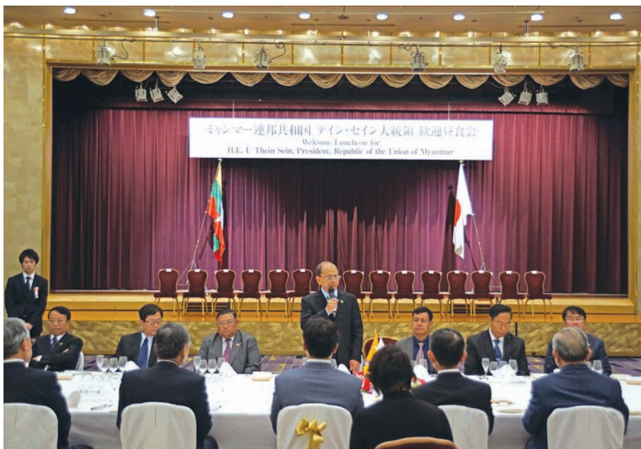
President U Thein Sein delivers speech at luncheon by private entrepreneurs at Rihga Royal Hotel.