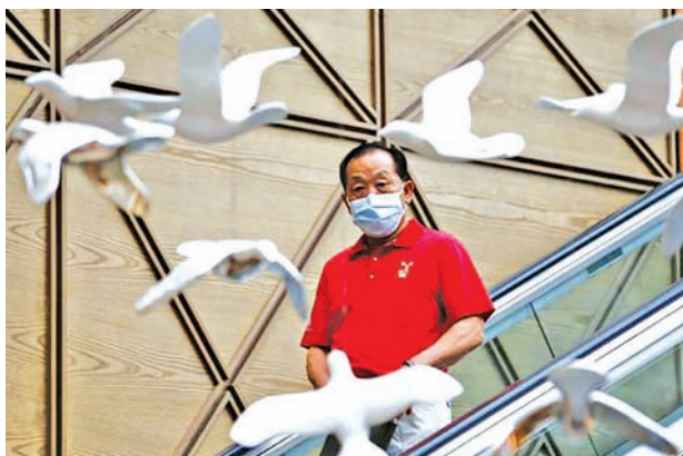
A man wearing a mask to prevent contracting Middle East Respiratory Syndrome (MERS) rides an escalator in Seoul, South Korea, on 19 June, 2015.

Thailand, which discovered its first case last week, says 175 people were exposed to its single patient,