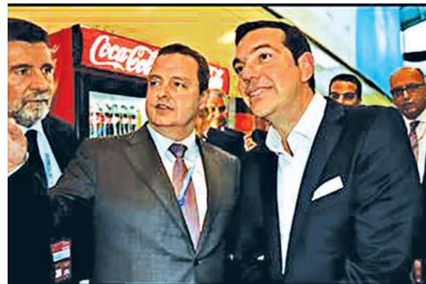
Serbian Deputy Prime Minister and Foreign Minister Ivica Dacic (L) and Prime Minister of Greece Alexis Tsipras (R).

SAINT PETERSBURG, 21 June — Serbian Deputy Prime Minister and Foreign Minister Ivica Dacic has met with Prime Minister of Greece Alexis Tsipras in St Petersburg to discuss setting up a joint company to construct a gas pipeline.