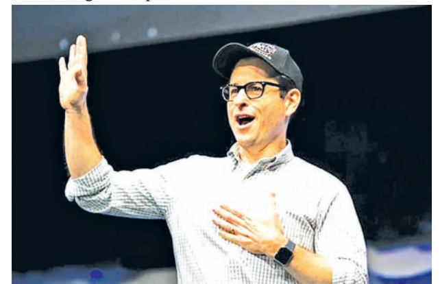
‘Star Wars: The Force Awakens’ writer, director and producer JJ Abrams appears at the kick-off event of the Star Wars Celebration convention in Anaheim, California, on 16 April, 2015.