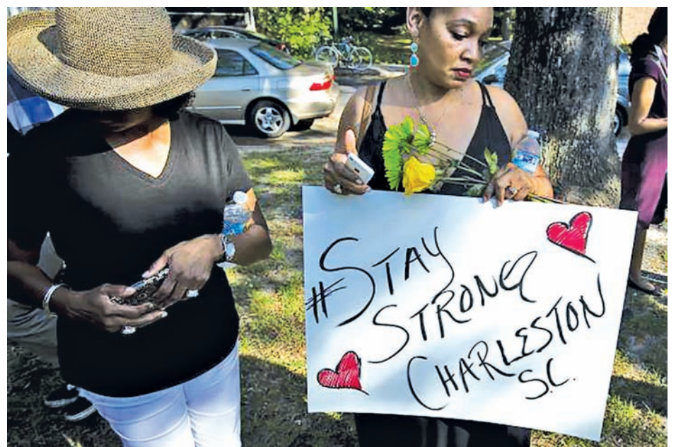
People take part in a ‘Black Lives Matter’ march around Emanuel African Methodist Episcopal Church in Charleston on 20 June, 2015.

is there a way of accommodating that legitimate set of traditions with some common-sense stuff that prevents a 21-year-old who