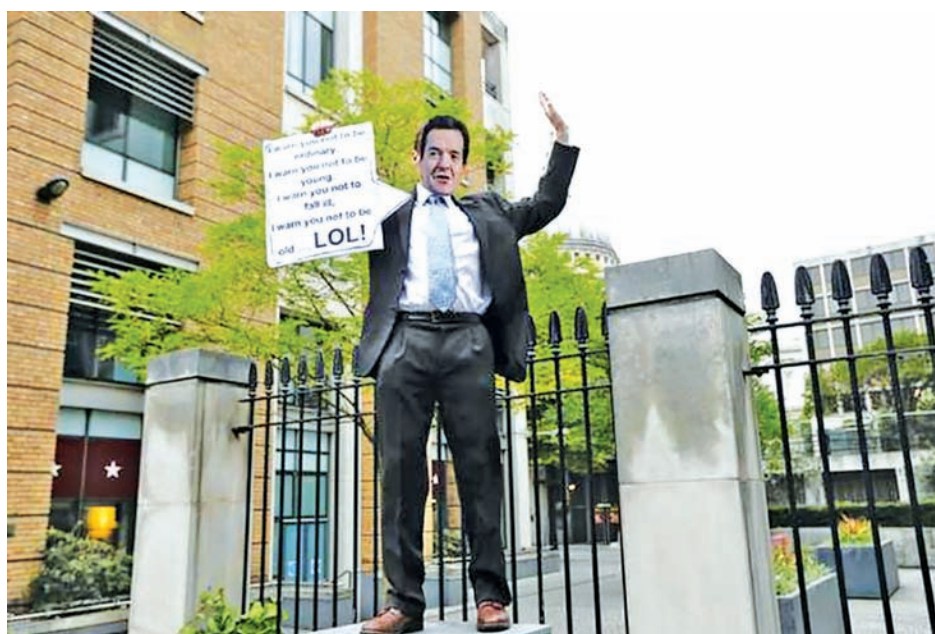
A demonstrator wears a face mask of Britain’s Chancellor George Osborne during an anti-austerity protest in central London, Britain on 20 June, 2015.