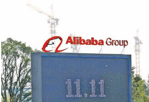
The logo of the Alibaba Group is seen inside the company's headquarters in Hangzhou, Zhejiang Province on 11 Nov, 2014.

BEIJING, 21 June — China will increase support for cross-border e-commerce as the world's second-largest economy shifts from manufacturing to higher-value services, the