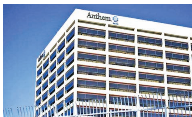
The office building of health insurer Anthem is seen in Los Angeles, California on 5 Feb, 2015.

Cigna shares closed on Friday at $155.26, down $1.15 or 0.7 percent, making the $184 offer a premi-