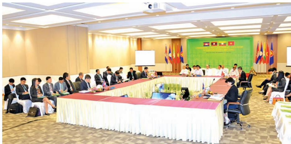
The Senior Officials’ Meeting for the 7 th CLMV Summit in progress.

NAY PYI TAW, 21 June — The Senior Officials’ Meeting for the 7 th CLMV Summit was held in Nay Pyi Taw, MICC I on 21 June 2015 with the active participation of SOM Leaders from the Kingdom of Cambodia, the Lao People’s Democratic Republic, the Republic of the Union of Myanmar and the Social-