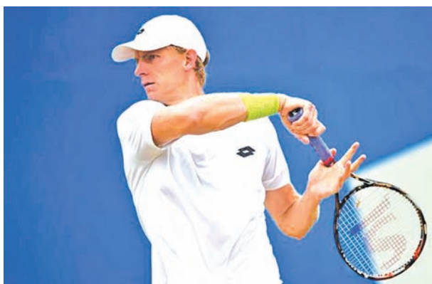
South Africa's Kevin Anderson in action during his semi final match during Aegon Championships at Queens Club, London on 20 June, 2015.

World number three Murray, bidding for a fourth Queen's Club title,