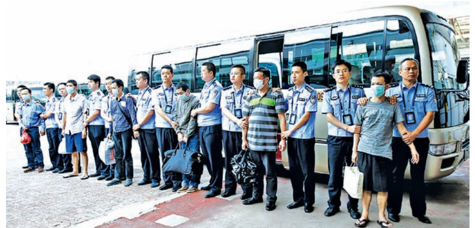
Six fugitives involved in economic crimes are taken back under escort from Indonesia at Capital International Airport in Beijing, capital of China, on 21 June, 2015. A total of 256 suspects have been captured since "Fox Hunt 2015" began in April. "Fox hunt 2015", part of the "Skynet" operation, targets economic crime suspects, many of them corrupt officials of government departments and state-owned-enterprises.