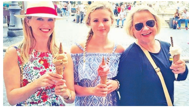
Reese Witherspoon, took to Instagram to share a photo of her, Ava and Betty each holding an ice cream.