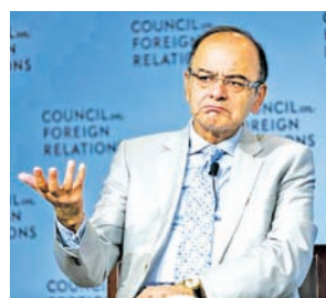
India's Finance Minister Arun Jaitley speaks at the Council on Foreign Relations in New York on 18 June, 2015.

Intellectual property concerns and trade protectionism have long been cited by US companies as obstacles to doing more