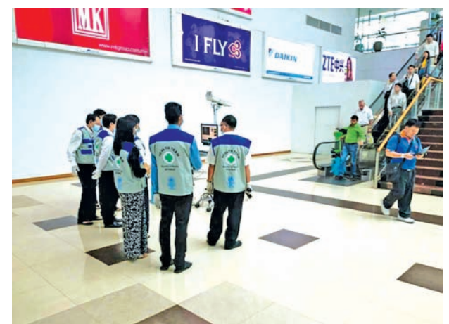
Surveillance activities on infectious disease like MERS-CoV virus being carried out at international airport by well-trained staff.

mar, the health ministry is monitoring every point of entry into the country for the virus, especially in Yangon, Mandalay, the capital Nay Pyi Taw and NyaungU