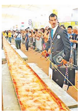
A judge from Guinness World Records measures the length of a giant pizza made by 80 chefs in Italy at the Expo Milano 2015 in Milan on 20 June, 2015.

The rectangular pizza, measuring 1,595.45 metres long, set a new Guinness World Record, beating a 1,141.5-metre long pizza made in Spain.