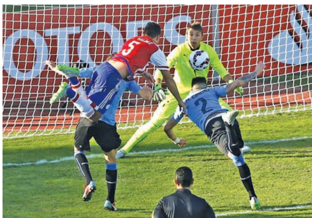
Paraguay's Bruno Valdez (5) heads the ball past Uruguay's Christian Stuani and Jose Gimenez (R) near the Uruguay net during their first round Copa America 2015 soccer match at Estadio La Portada in La Serena, Chile, on 20 June, 2015.

LA SERENA, (Chile), 21 June — Paraguay drew 1-1 with Uruguay at the Copa America to go top of Group B, one point ahead of Argentina before the tournament favourites take on eliminated Jamaica later on Saturday.