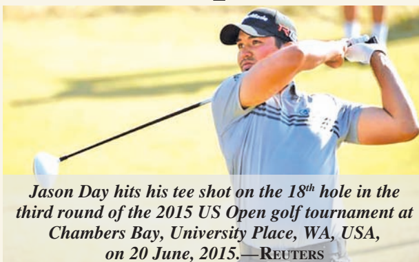
Jason Day hits his tee shot on the 18 th hole in the third round of the 2015 US Open golf tournament at Chambers Bay, University Place, WA, USA, on 20 June, 2015.

Day took only a moment to savour the applause as he gingerly made his way to a waiting van where he slumped into the back seat with closed eyes and laid his