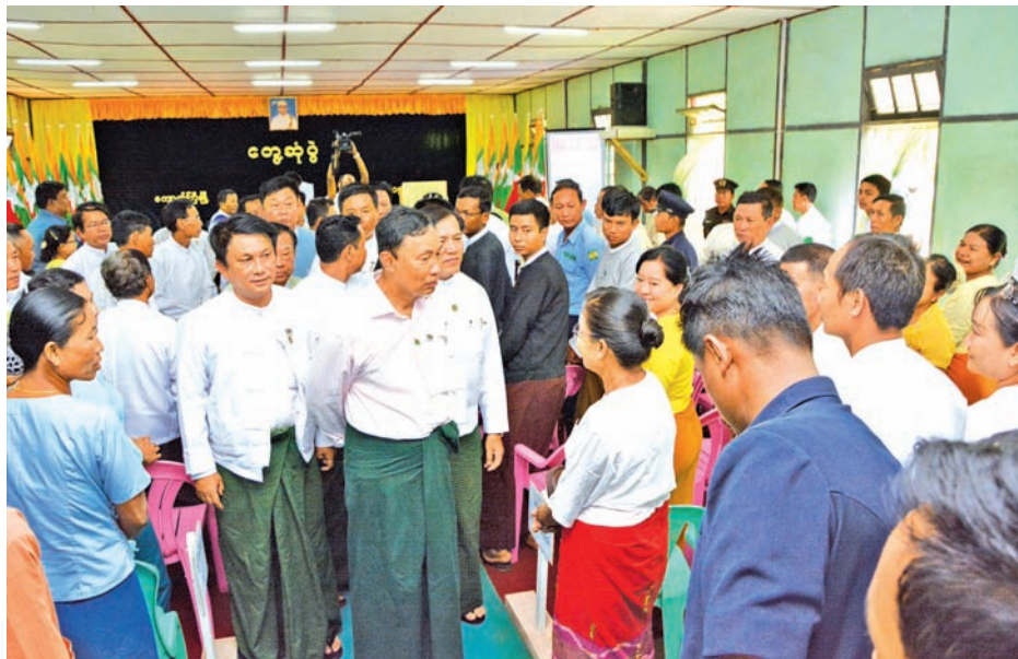
Speaker of Pyithu Hluttaw Thura U Shwe Mann meets with local people in Kyaukkyi, Bago Region, and urges them to work for development of their region.

Then, chairmen of the township development supporting committee and the township development affairs committee and local people reported to the speaker on education, transportation and health requirements for hilly areas in the township, farmland issues, environmental conservation, right to vote