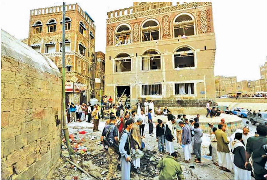
People and police gather at the site of a car bomb attack outside the Qubbat al-Mahdi mosque in Yemen's capital Sanaa on 20 June, 2015.

SANAA, 21 June — Saudi-led airstrikes killed 15 people and wounded dozens across Yemen late on Saturday, the Houthi-run Saba news agency reported.