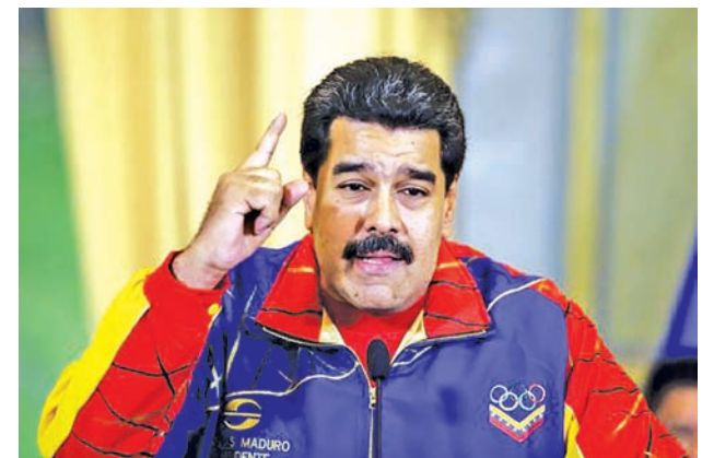
Venezuela’s President Nicolas Maduro speaks after handing the national flag to a Venezuelan delegation to participate in the 2015 Pan American Games, at the Miraflores Palace in Caracas, on 16 June, 2015.