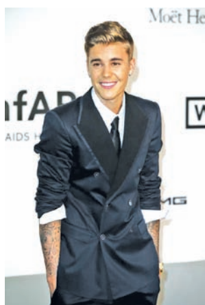
Pop star Justin Bieber

LONDON, 21 June — Pop star Justin Bieber does not think it is fair that people expect him to apologize for his actions over the past eighteen months.