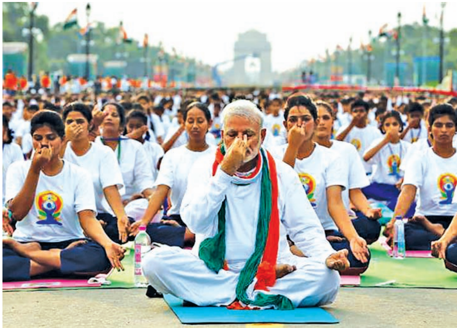
India's Prime Minister Narendra Modi performs yoga with others during a yoga camp to mark the International Day of Yoga, in New Delhi, India, on 21 June, 2015.

"This program is only about human welfare, about freeing the universe from stress and about spreading