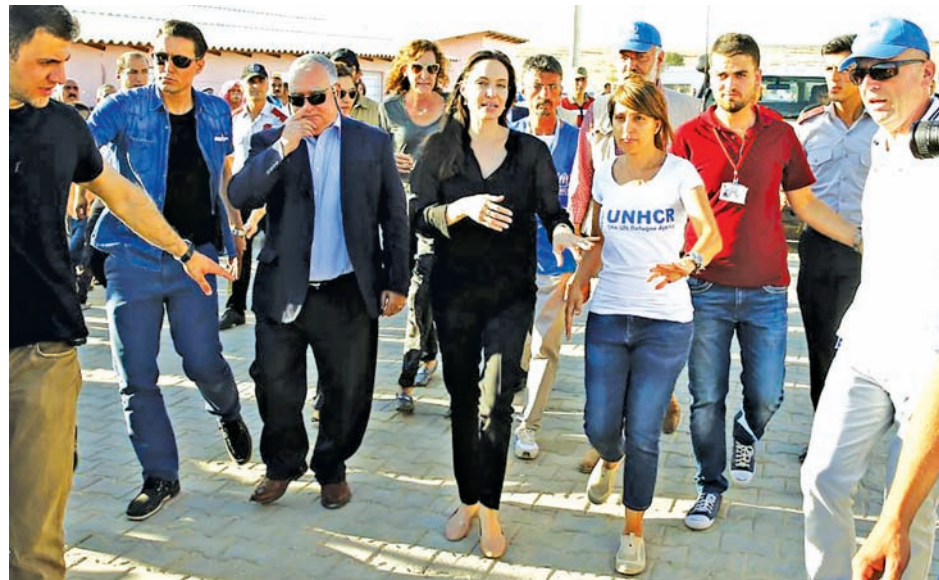
United Nations High Commissioner for Refugees (UNHCR) Special Envoy Angelina Jolie (C) arrives at a Syrian and Iraqi refugee camp in the southern Turkish town of Midyat in Mardin Province, Turkey, on 20 June, 2015.—REUTERS

The Greek prime minister said his visit to Serbia depended on Greece's negotiations with financial institutions, the Foreign Ministry said.—Tanjung