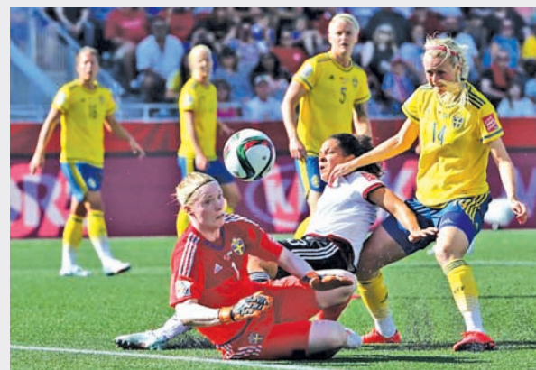
Germany forward Celia Sasic (13) collides with Sweden goalkeeper Hedvig Lindahl (1) as defender Amanda Ilestedt (14) defends during the second half in the round of sixteen in the FIFA 2015 women's World Cup soccer tournament at Lansdowne Stadium Ottawa, Ontario, CAN, on 20 June, 2015.

"We played well but we're not world champions