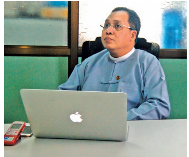
Special economic zone management committee chairman U Set Aung.

system to be applied by the SEZ allows the government to levy all kinds of taxes that would otherwise be lost outside the SEZ, including trading taxes, value taxes and council taxes. Companies prefer the system as it collects taxes more transparently and recognizes taxpayers, the chairman said.