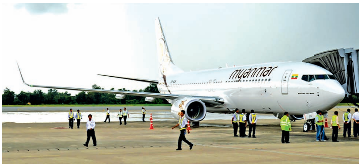
Myanmar National Airlines introduces its new arrival of Boeing 737 aircraft at Yangon International Airport on Monday.