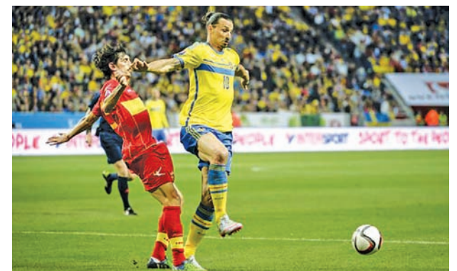
Montenegro’s Stefan Savic fights for the ball with Sweden’s Zlatan Ibrahimovic during the UEFA Euro 2016 Group G qualifying soccer match between Sweden and Montenegro at Friends Arena in Stockholm, Sweden on 14 June, 2015.