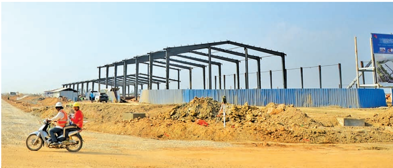
Buildings under construction in Thilawa Special Economic Zone, 20 km from Yangon.

companies have reached reservation agreements with the management committee and received investment permission. Operations of the SEZ are set to start in September, a little later than scheduled, according to the chairman.