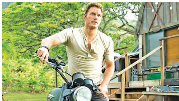
Chris Pratt: I liked to entertain people and I liked comedy and I liked to escape with a movie now and then.