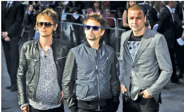
Dominic Howard, Matthew Bellamy and Chris Wolstenholme (L-R) from the British rock band Muse arrive for the world premiere of the film "World War Z" in London on 2 June, 2013.

LONDON, 15 June — British rock band Muse scored their fifth British number one album on Sunday when "Drones" went straight into the chart in the top spot, the Official Charts Company said.