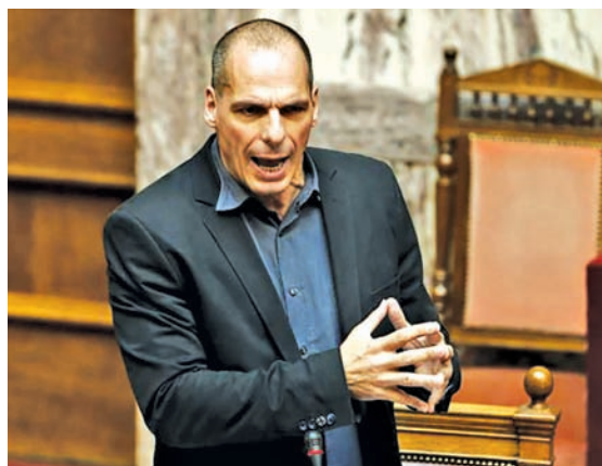
Greek Finance Minister Yanis Varoufakis answers a question during a parliamentary session in Athens on 11 June, 2015.

He added that his government wanted to prevent a 'Grexit' but needed "a restructuring. That's the only way possible that