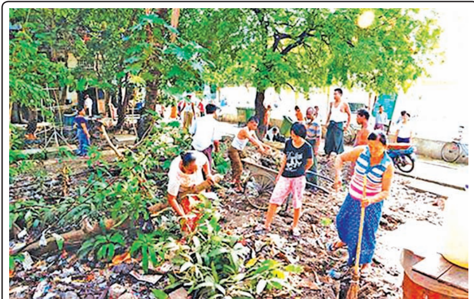
Staff of Township Development Affairs Committee and General Administration Department together with residents carrying out sanitation in Mithasu Ward, Seikkan Township, on 13 June.