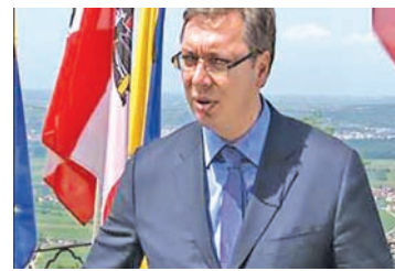
Serbian Prime Minister Aleksandar Vucic

people expect, Vucic told reporters after attending the European Forum Wachau in Austria. Serbia will not accept pressure from the Pristina side in the dialogue in order to be able to open the first chapters in the accession talks as soon as possible, and Belgrade cannot accept Pristina's proposals that are unacceptable to Kosovo-Metohija Serbs, Dacic said. Talks are ahead on four topics in the dialogue with Pristina — on