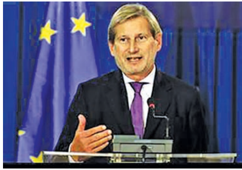
European Commissioner for Enlargement and European Neighbourhood Policy, Johannes Hahn

Serbia is an anchor in the region and has a relevance that is bigger than the country itself, Hahn noted, adding that the path Serbia chooses towards a pro-European future is therefore important as well.