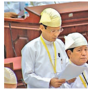
Deputy Minister U Win Myint.