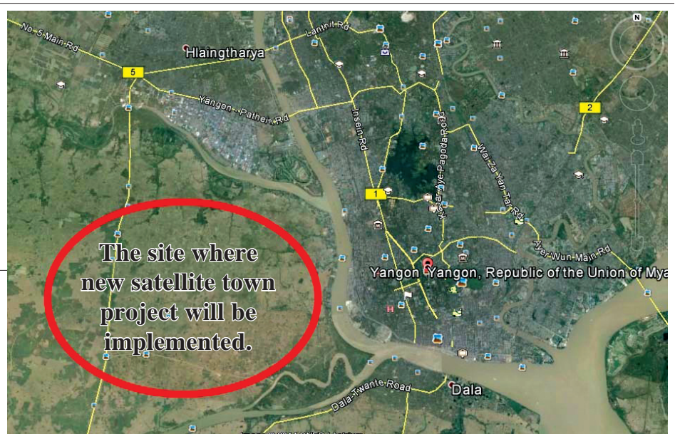
The site where new satellite town project will be implemented.

A map show a site for implementation of new satellite town of Yangon.