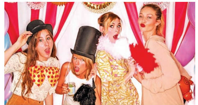
Taylor Swift shared a photo collage of her, Jaime, Gigi and Alana Haim funnily posing in a photo booth.

LOS ANGELES, 15 June — Pop star Taylor Swift threw a baby shower for her best friend Jaime King. The "Shake It Off" hitmaker took to Twitter and Instagram to share photos from the celebration. She brought her other friends, including Sarah Hyland, Gigi Hadid, Serayah, HAIM and Hailee Steinfeld, to the bash, reported Ace Showbiz.