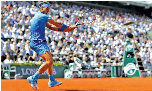
Rafael Nadal of Spain returns the ball to Novak Djokovic of Serbia during their men's quarter-final match during the French Open tennis tournament at the Roland Garros stadium in Paris, France, on 3 June, 2015.

STUTTGART, 15 June — Rafa Nadal claimed his first grasscourt title for five years when he beat Serbian Viktor Troicki 7-6(3), 6-3 to win the Mercedes Cup in Stuttgart on Sunday.