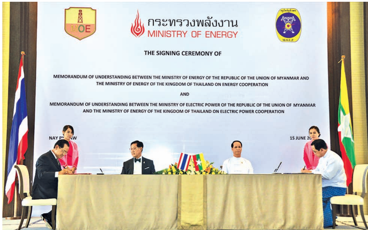
Vice President Dr Sai Mauk Kham and Thai Deputy Prime Minister Mr Pridiyathorn Devakula attend signing ceremony of MoU on energy and electric power sectors.

The MoU will speed up the 26-year Myanmar-Thai oil and natural gas cooperation agreement. It will benefit en-