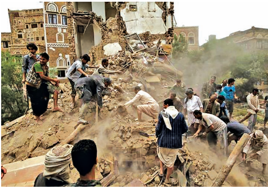
People search for survivors under the rubble of houses destroyed by an air strike in Sana'a on 12 June, 2015.

meet initially in separate rooms for talks with UN officials, who will try to bring them closer together with the ultimate aim of getting