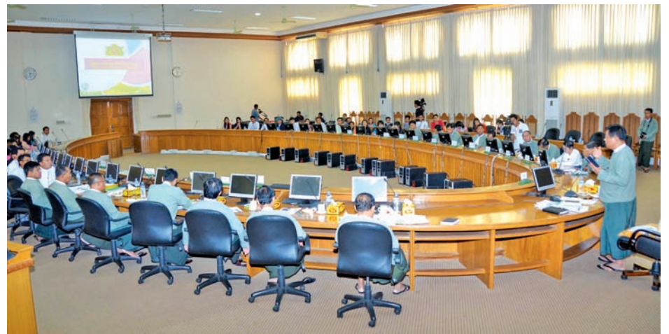
UEC chairman U Tin Aye meets trainees of NPO Myanmar Egress.