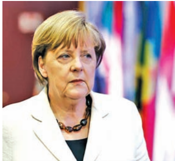
German Chancellor Angela Merkel

BERLIN, 15 June — Greece is gambling too far and the patience of its creditors is running out, said a senior official in Chancellor Angela Merkel's conservative Christian Democrats on Monday.