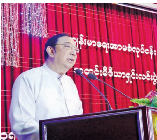
Deputy Minister Dr Maung Maung Thein clarifies health insurance policies of Myanmar Insurance.