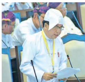
Deputy Minister Dr Zaw Min Aung. MNA

NAY PYI TAW, 15 June — A college needs 2,000 students in minimum, buildings, faculty members, staff, teaching aid and furniture for its establishment, Deputy Minister for Education Dr Zaw Min Aung replied to the question of U Aung Chit Lwin of Sagaing Region Constituency No 11 on Monday