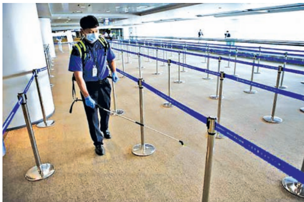
An employee wearing a mask to prevent contracting Middle East Respiratory Syndrome (MERS) disinfects the floor at the Incheon International Airport in Incheon, South Korea on 14 June, 2015.

SUWON, (South Korea), 15 June — Thousands of South Korean schools that were shut by worries over Middle East Respiratory Syndrome (MERS) reopened on Monday as the country sought to return to normal, nearly four weeks into an outbreak that showed signs of slowing.