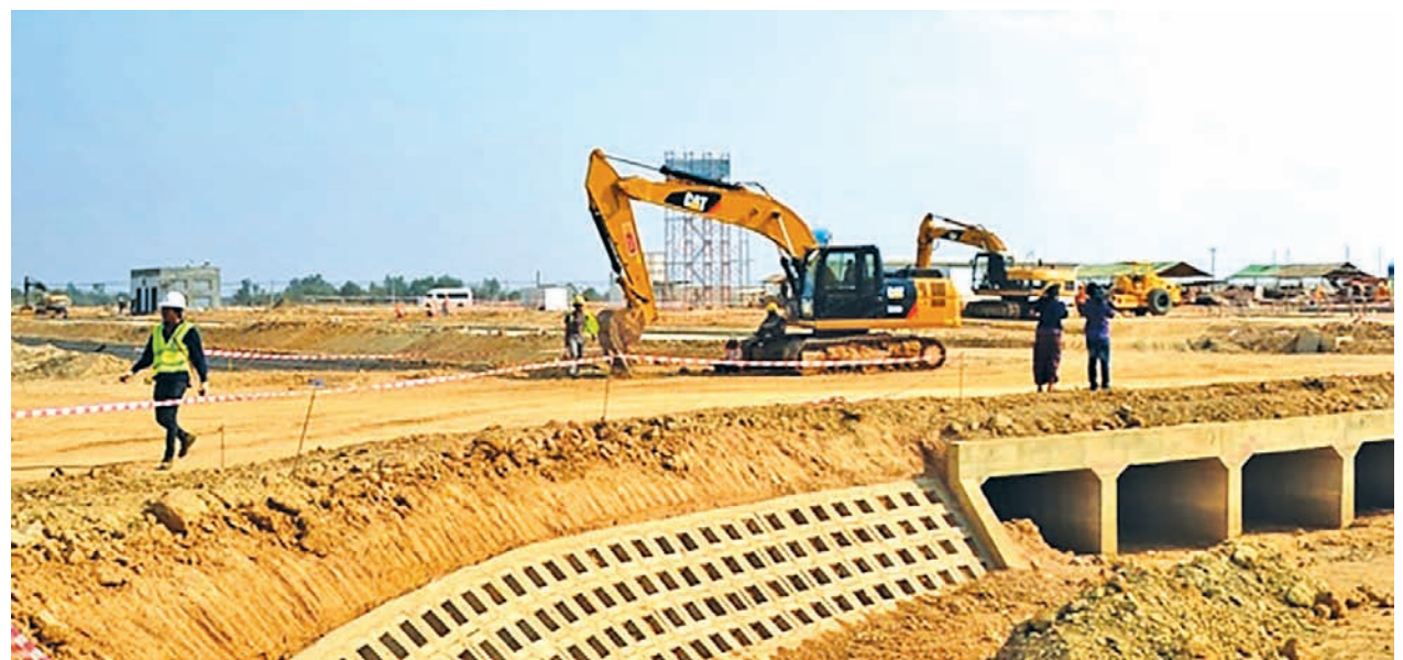
Heavy machinery at work at Thilawa Special Economic Zone.

For human resource development of people around the SEZ, vocational training centres will be set up in the zone, according to the chairman. One of the professional vocational training centres was opened on 9 June by Fuji World Company and the management committee is arranging skill training courses for 40 local people who had to move to nearby place due to the SEZ project.