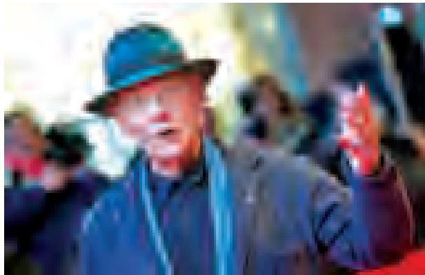
Actor Ian McKellen arrives for a screening of the movie 'Mr Holmes' at the 65th Berlinale International Film Festival, in Berlin on 8 Feb, 2015.

"This Holmes ... is 93 years old when we first meet him at the end of a