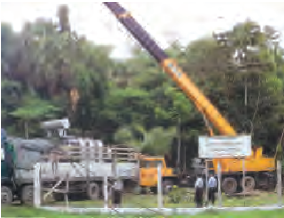
Engineers and skilled workers carry out substitution of 2500-KVA transformer in place of 1250-KVA transformer at sub-power station in Kyaunggon Township, Ayeyawady Region, on 10 June, under supervision of the Patheingyi District Electrical Engineer.