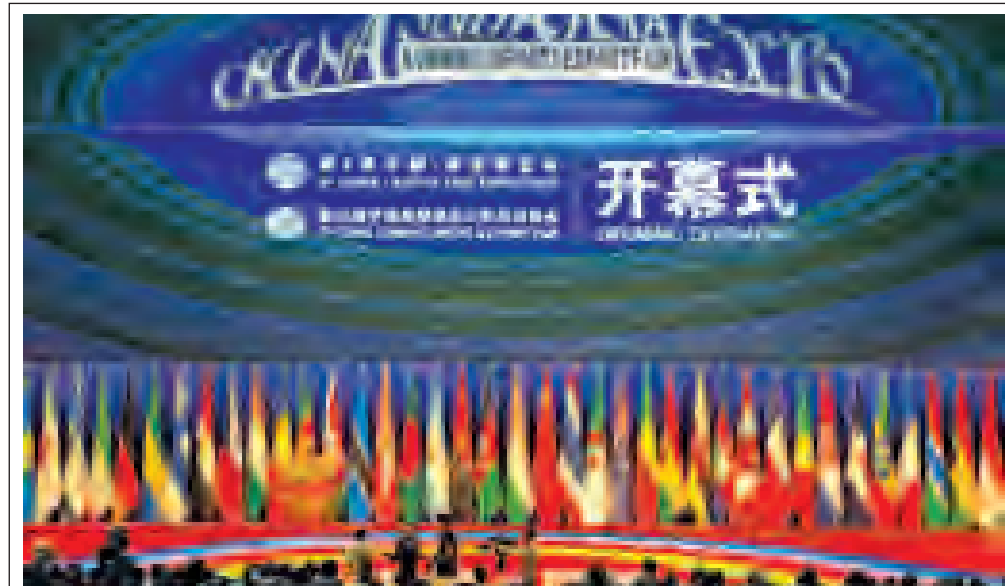
Photo taken on 12 June, 2015 shows the opening ceremony of the 3rd China-South Asia Exposition in Kunming, capital of southwest China's Yunnan Province. The 3rd China-South Asia Exposition opened here on Friday.

The punishment for the rumour-spreading shows the Communist Party's growing determination to control information about alleged official misbehaviour, to avert triggering public dissatisfaction.—Reuters