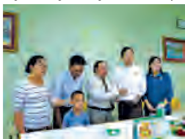
Well-wisher offers cash assistance for a patient with congenital hearing loss through Cochlear Implant Program.

set to receive free cochlear implant surgery at Yangon’s Victoria Hospital