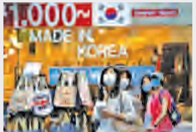
Tourists wearing masks to prevent contracting Middle East Respiratory Syndrome (MERS) look around Myeongdong shopping district in central Seoul, South Korea, on 11 June, 2015.

All but one of South Korea's cases have been confirmed as originating with the