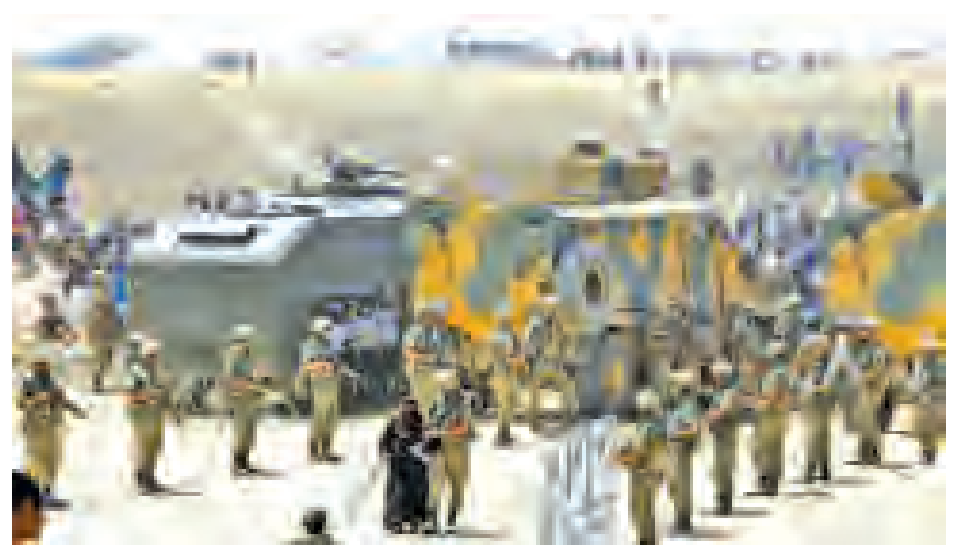
A Syrian refugee woman is helped by a Turkish soldier after crossing into Turkey near Akcakale in Sanliurfa Province, Turkey, on 10 June, 2015.

The group last week launched an offensive on the provincial capital, the city of Hasaka, which is divided into zones run separately by the government of President Bashar al-Assad and a Kurdish administration. But Syria’s Kurds have also sought to take advantage of Syria’s complex war to expand their control over a region, stretching from Kobani to Qamishli, that they see as part of a future Kurdish state.—Reuters