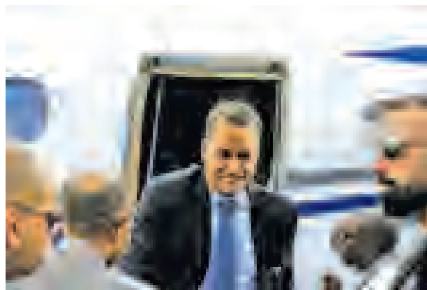
United Nations envoy to Yemen Ismail Ould Cheikh Ahmed steps out of a plane upon arrival at the international airport of Sanaa, Yemen on 29 May, 2015.

He added: “The Special Envoy hopes, and the Secretary-General hopes, that the Geneva consultation on Yemen will create a new dynamic that will build confidence between the Yemeni actors and yield concrete