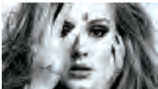
British singer Adele

recording has sold more than 30 million copies worldwide following its