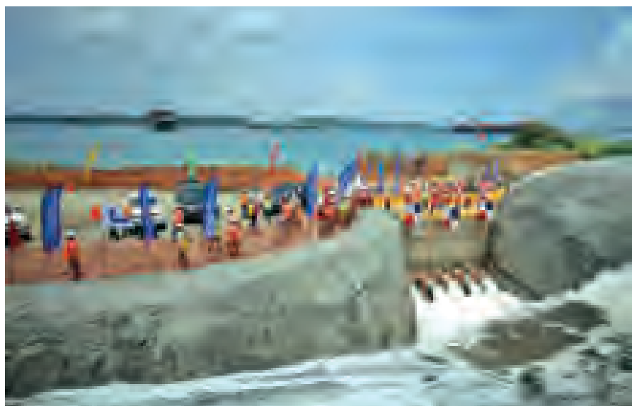
Workers stand by the pipes as they flood the Panama Canal Expansion project on the outskirts of Colon City, Panama, on 11 June, 2015. Engineers began flooding a newly enlarged section of the Panama Canal on Thursday as authorities prepare to test a series of new locks that will allow the waterway to accommodate much bigger ships, affecting trade around the world.