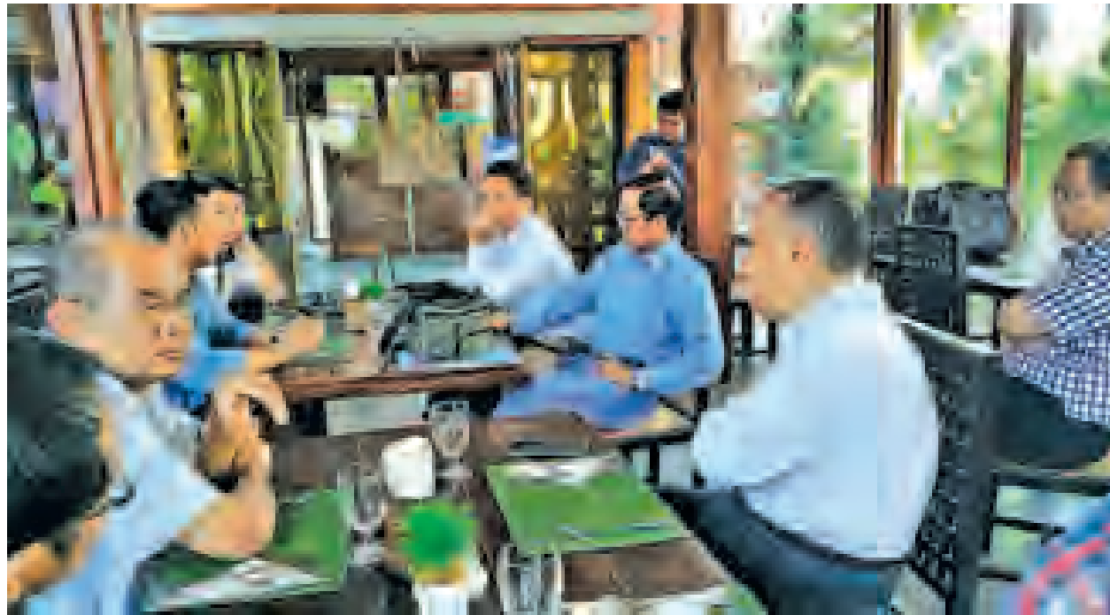
An MPC team holds discussions with ethnic peace negotiators at a restaurant in Chiang Mai, Thailand, on Thursday.

“My understanding is that it is the time for the (government’s) Union Peace-Making Cen-