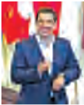
Greek Prime Minister Alexis Tsipras shows his watch while leaving the European Council headquarters on the first day of an EU-CELAC Latin America summit in Brussels, Belgium on 11 June, 2015.

Renewed uncertainty sent Greece's top share index .ATX down 4 percent on Friday morning. The German tabloid Bild reported that the German