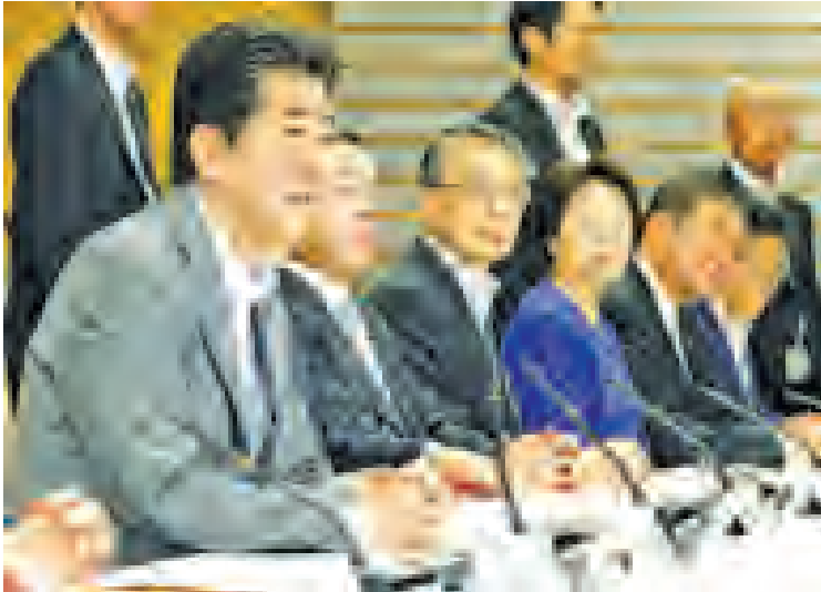
Japanese Prime Minister Shinzo Abe (far L) addresses a meeting of the Nuclear Emergency Response Headquarters at the prime minister's office in Tokyo on 12 June, 2015. In the meeting, the government decided on a plan to lift evacuation orders covering many of the areas affected by the Fukushima nuclear disaster by the end of fiscal 2016, despite strong public concerns over radiation contamination.

TOKYO, 12 June — The government decided on Friday on a plan to lift evacuation orders covering many of the areas affected by the Fukushima nuclear disaster by the end of fiscal 2016, despite strong public concerns over radiation contamination.