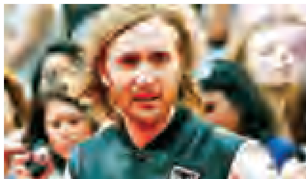
David Guetta will perform during the opening ceremony of the football tournament at Stade de France in Paris on 10 June, 2016.

LONDON, 12 June — DJ and music producer David Guetta will write and produce the anthem for UEFA EURO 2016. The 47-year-old star will perform during the opening ceremony of the football tournament at Stade de France in Paris on 10 June, 2016, reported Daily Mirror .