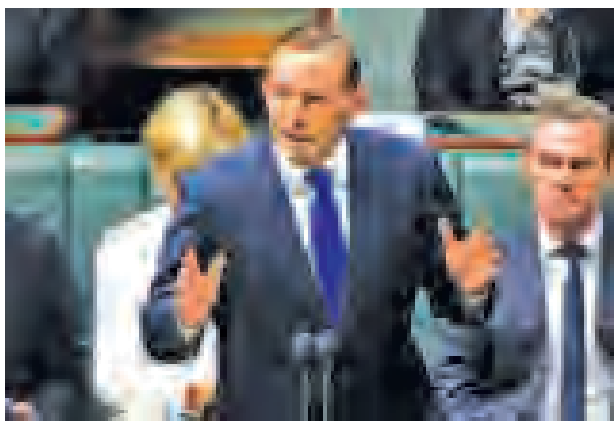
Australia's Prime Minister Tony Abbott

CANBERRA, 12 June — Australia's Prime Minister Tony Abbott launched another attack on "ugly," "noisy" wind turbines on Friday, prompting Labour's environment spokesman saying the matter has become "more than a joke."