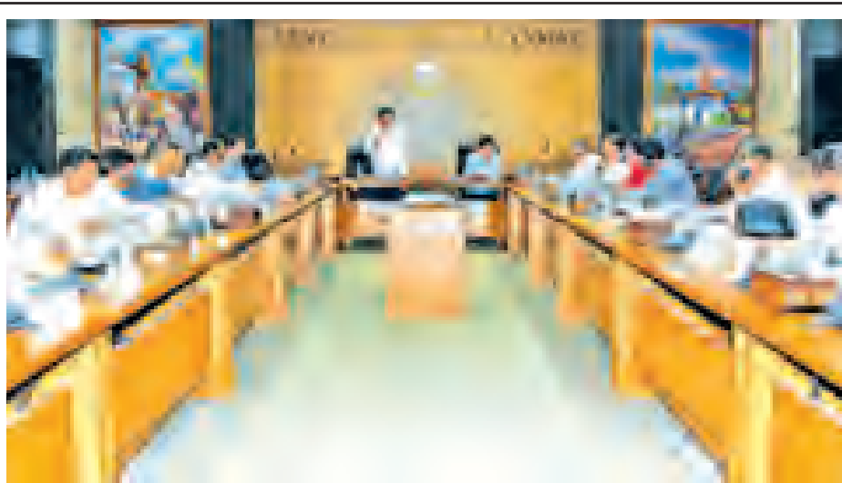
Union Minister U Soe Thane speaking at meeting on financial institutions.