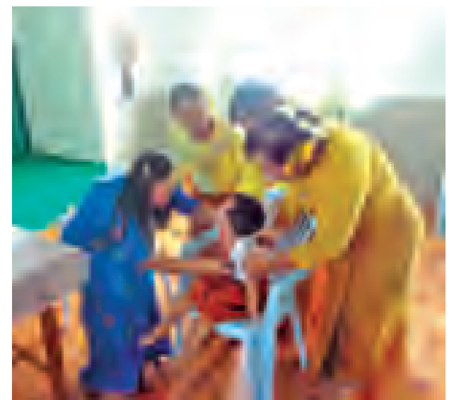
MCWA members and medical officer perform medical checkup on children from pre-primary school.

NAY PYI TAW, 12 June — Zabuthiri Township Maternal and Child Welfare Association and Public Health Department jointly provided health care services at the pre-primary school in Shwekyabin Ward, Zabuthiri Township, on Thursday.