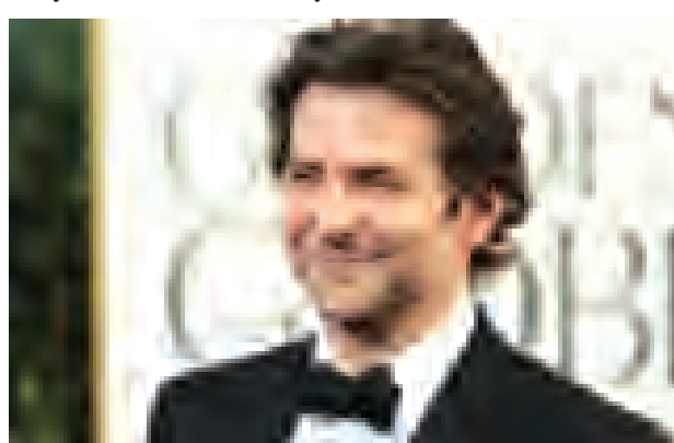
Actor Bradley Cooper