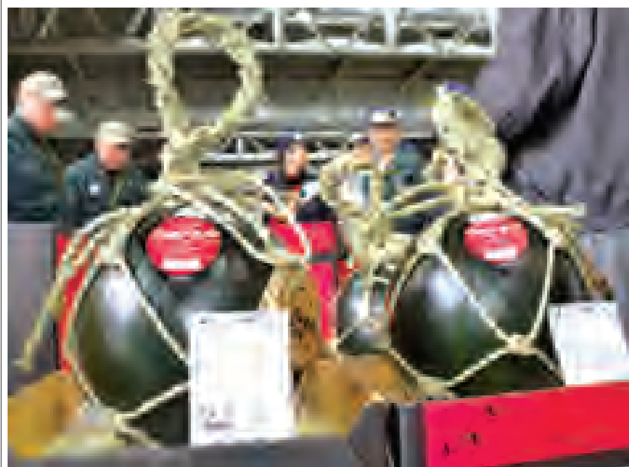
The black-rind Densuke watermelon, a signature product of the northern Japanese town of Toma, Hokkaido, is priced at as high as 350,000 yen at this year's first auction in Asahikawa, Hokkaido, on 12 June, 2015.

North Korea is one of the world's most isolated and secretive countries, and there was still no mention of the fire in state media by about midday on Friday. In May last year, North Korean state media said the government had apologized to bereaved families after an apartment building collapsed in Pyongyang, possibly killing hundreds. Unlike the unfinished 105-storey pyramid-shaped Ryugyong Hotel, the plush Koryo Hotel has for years been the go-to place to stay for foreign tourists visiting North Korea.—Reuters