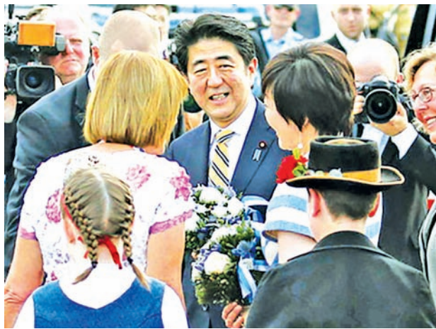
Japanese Prime Minister Shinzo Abe arrives at Munich International Airport on 6 June, 2015, for Group of Seven summit talks beginning the following day. Abe will seek to drum up the major democracies' opposition to attempts by Russia and China to "change the status quo" by force in Ukraine and the East and South China seas, respectively.

"The situation in Ukraine is shaking the foun-