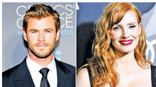
Chris Hemsworth &amp; Jessica Chastain

As for Chastain, she sported a black dress with a braided hair style. Some of the photos showed Hemsworth's character and Chastain's character conversing in a boat. The scenes are seemingly taken in a lake, reported Ace Showbiz.