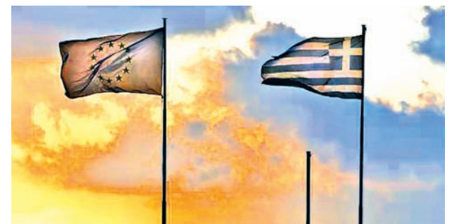
A European Union flag flatters next to a Greek flag atop the Greek Ministry of Finance during sunset in central Athens, Greece on 5 June, 2015.

BERLIN, 7 June — European Parliament President Martin Schulz urged Greece in a newspaper interview to accept a proposal by its international lenders for a cash-for-reforms deal, warning Athens that failing to reach an agreement would have "dramatic" consequences.