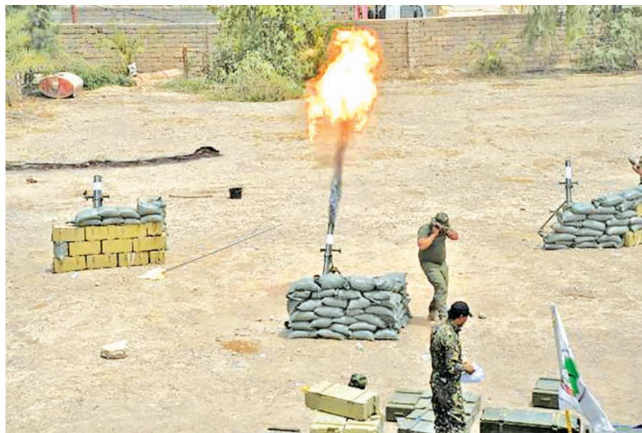
An Iraq Shiite paramilitary personnel launches a mortar round toward Islamic State militants on the outskirts of Bayji on 3 June, 2015.

meant to relieve pressure on hardline jihadists who have otherwise lost signif-