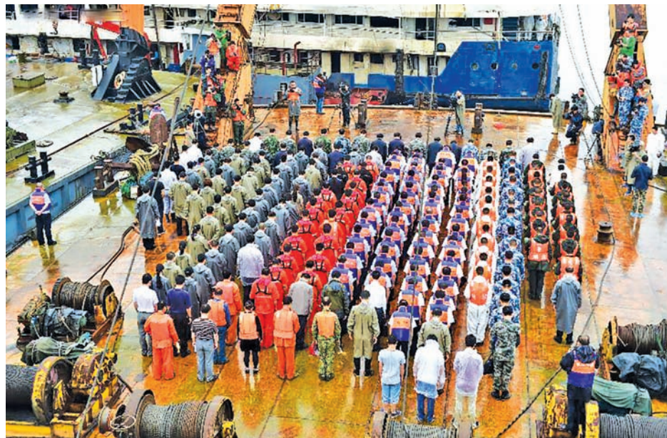
A mourning ceremony is held for 406 deceased people on the capsized ship Eastern Star at the sinking site in the Jianli section of the Yangtze River, central China's Hubei Province, on 7 June, 2015.