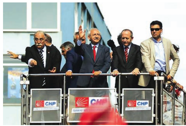
Turkey's main opposition Republican People's Party (CHP) leader Kemal Kilicdaroglu (C) waves to his supporters from the top of a campaign bus during an election rally for Turkey's 7 June parliamentary election, in Istanbul, Turkey, on 6 June, 2015.

While constitutionally required to stay above party