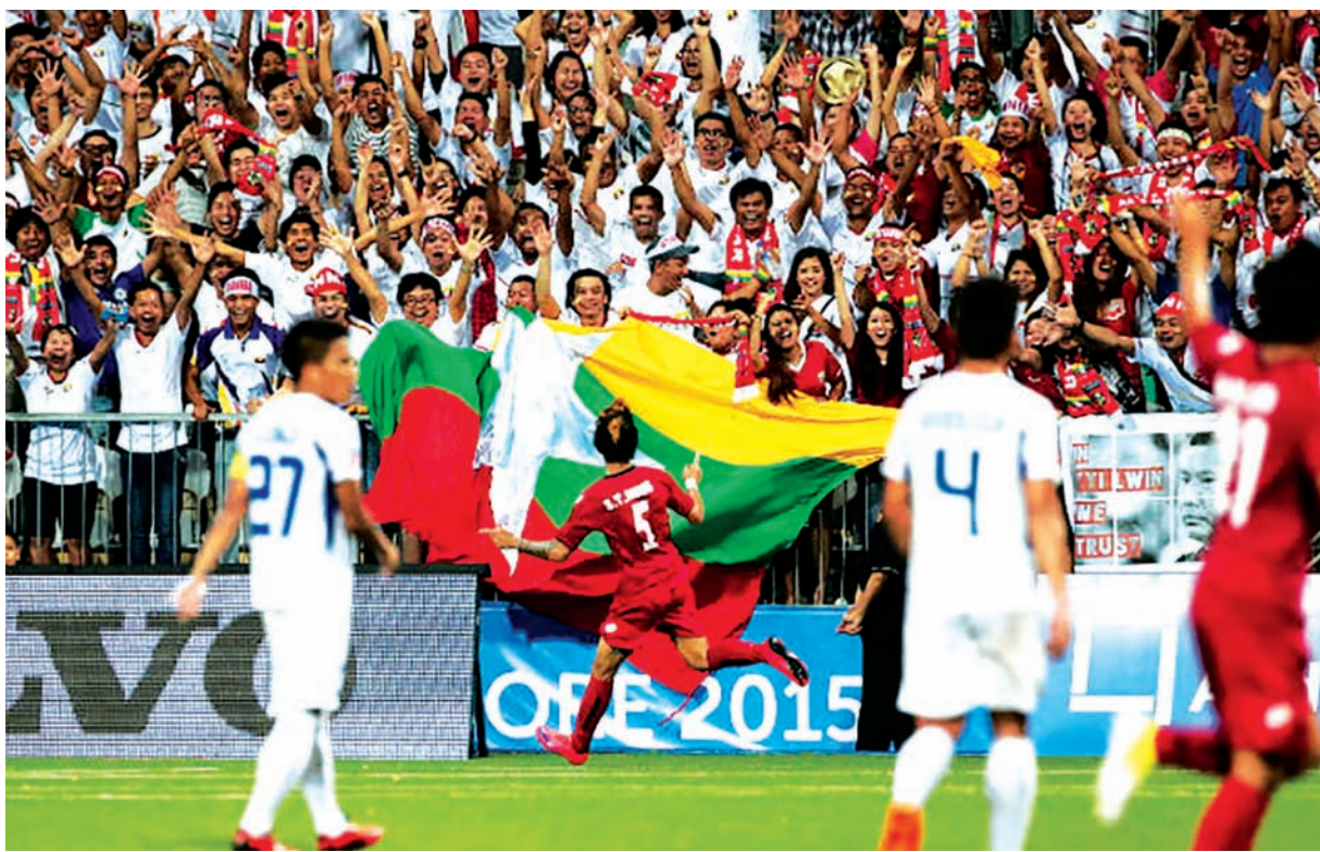
The Philippine U23 football team was eliminated from contention after losing to Myanmar.