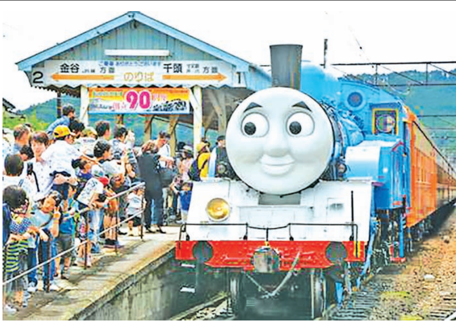
A Thomas the Tank Engine steam train commences operation in Shizuoka Prefecture, central Japan, on 7 June, 2015. Oigawa Railway Co will run the train through 12 October, mainly on weekends.—KYODO NEWS