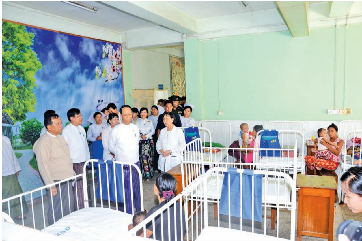
Vice President Dr Sai Mauk Kham visits child ward at West Yangon General Hospital in Kyimyindine Township.

At the meeting with responsible persons, Dr Sai Mauk Kham said renovation and development works at the hospital will be carried