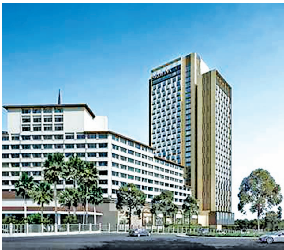
Photo shows Sedona Hotel in Yangon.

When it opens, the new Inya Wing will offer visitors to Yangon a retreat from the rigors of travel, with its signature Sedona services, products and