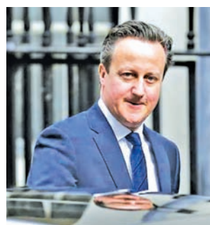
Britain's Prime Minister David Cameron leaves Number 10 Downing Street to attend Prime Minister's Question Time in Parliament, in London, Britain on 3 June, 2015.

The TTIP has faced opposition from protesters in Germany, however, and has also stumbled on US demands for an investor protection clause.