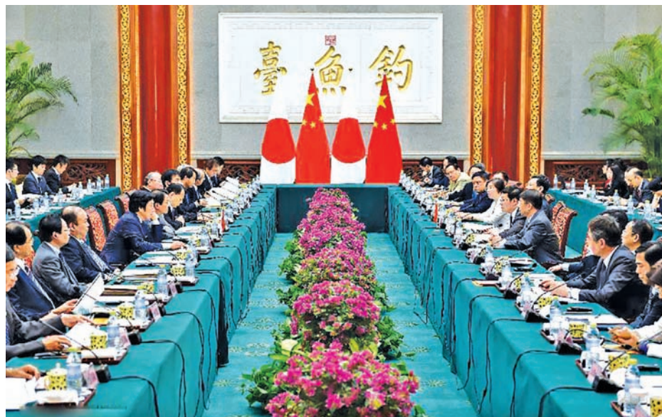
The Fifth China-Japan Finance Dialogue is held in Beijing, capital of China, on 6 June, 2015, after about two years of delay due to sour relations.

The two ministers emphasized the need to further deepen bilateral pragmatic cooperation in finance, enhance policy communication