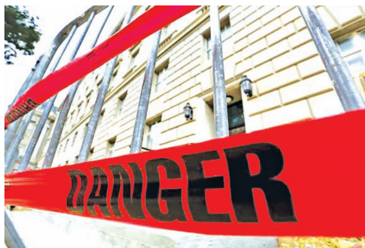
Plastic caution tape marks a small construction area on the exterior of the US Internal Revenue Service (IRS) building in Washington on 27 May, 2015.

Admiral James Winnefeld, vice chairman of the Joint Chiefs of Staff, told a cyber conference at West Point military academy