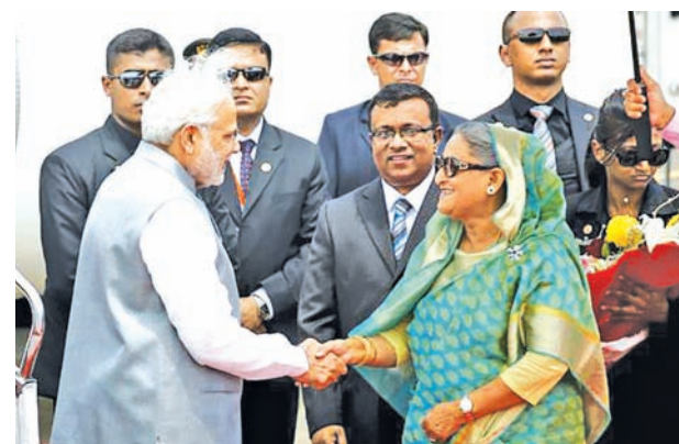
Prime Minister Narendra Modi shakes hands with Bangladesh's Prime Minister Sheikh Hasina at Shahjalal International Airport in Dhaka on 6 June, 2015.

Established by a treaty between two former princely states, the 106 Indian enclaves in Bangladesh and 92 Bangladeshi enclaves in India are islands of foreign territory inside each coun-