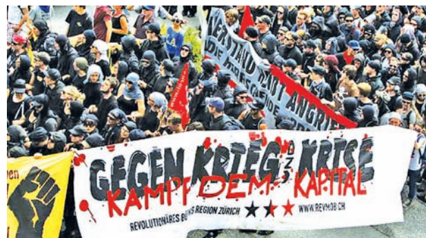
Anti-G7 protestors march during a demonstration in Garmisch-Partenkirchen, southern Germany, on 6 June, 2015.

But on the evening before the German chancellor welcomes the leaders of Britain, Canada, France, Italy, Japan and the United States, she and French President Francois Hollande were forced into their fourth emergency phone call in 10 days with Greek Prime Minister Alexis Tsipras to try to break a deadlock between Athens