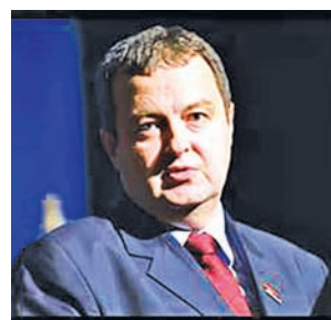
Serbian Minister of Foreign Affairs Ivica Dacic

VIENNA, 7 June — OSCE Chairperson in Of-