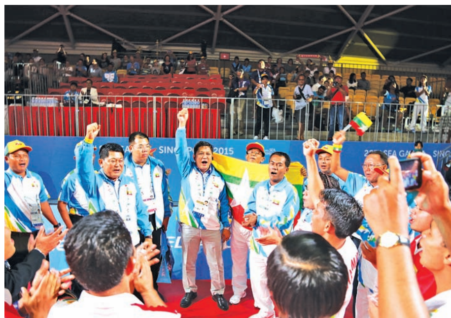
Union Minister for Sports U Tint Hsan, officials and Myanmar athletes celebrate victory in 28 th SEA Games.

SINGAPORE, 7 June — Union Minister for Sports U Tint Hsan awarded winners in the sports competitions in the 28 th SEA Games Sunday.