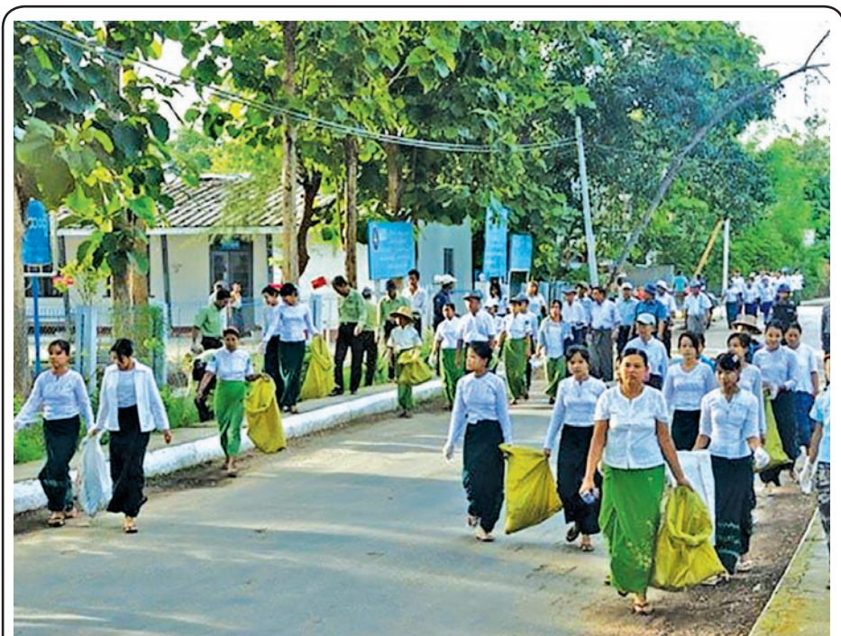
Township authorities, departmental personnel, members of political parties and social organizations collect garbage in urban area of Myanaung, Ayeyawady Region, on 6 June to be pastic-free town as part of efforts for environmental conservation.