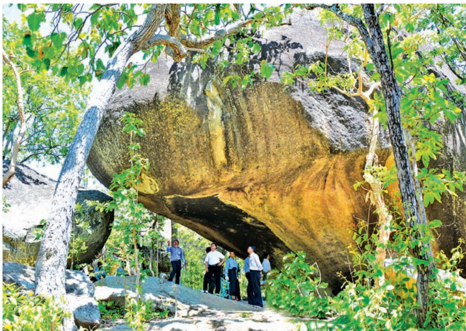
Union Minister for Culture U Aye Myint Kyu views stone age mural paintings at large rock in Ywangan Township.—MNA

YANGON, 7 June — A team of archaeologists and experts led by Union Minister for Culture U Aye Myint Kyu on Saturday visited the site where