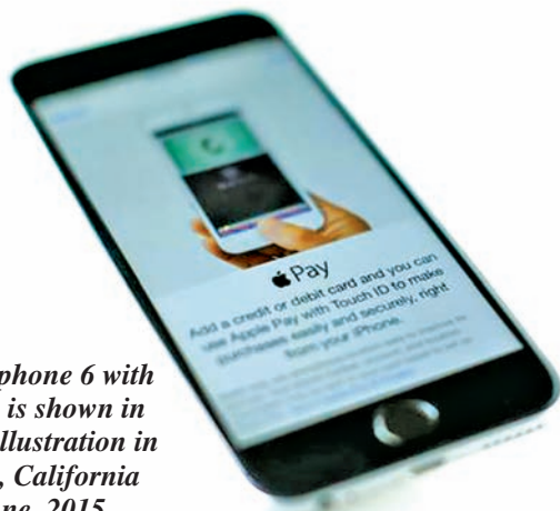
An Apple iPhone 6 with Apple Pay is shown in this photo illustration in Encinitas, California on 3 June, 2015.