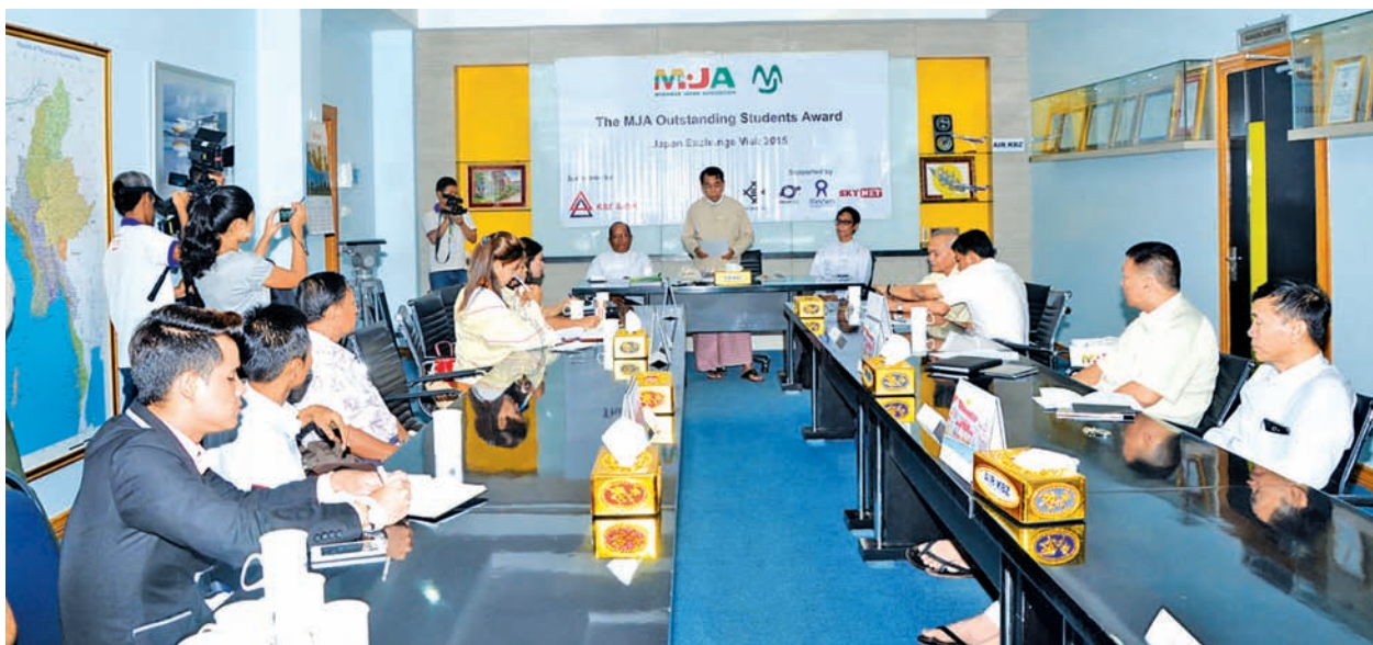
A meeting on MJA outstanding students award in progress.