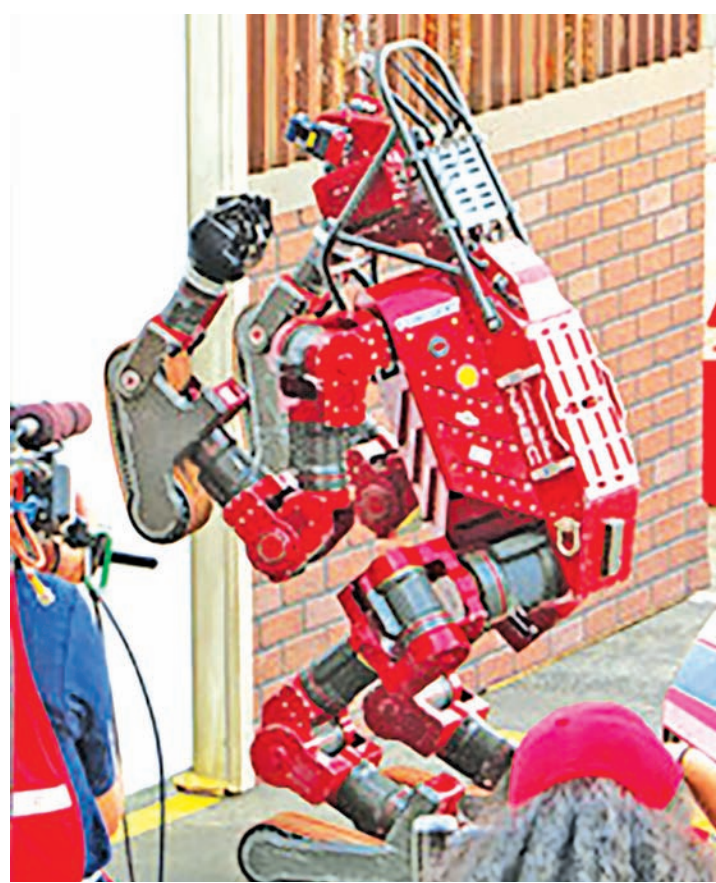
Photo taken on 6 June, 2015 shows a humanoid robot developed by Carnegie Mellon University's team on the final day of an international robot competition in Pomona, California, on 6 June, 2015. Team KAIST from South Korea won $2 million for securing first place in the DAPRA Robotics Challenge.