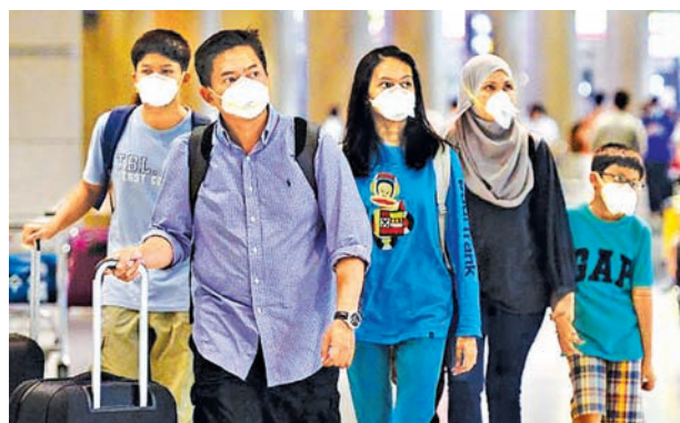
Tourists wearing masks to prevent themselves from contracting Middle East Respiratory Syndrome (MERS) arrive at the Incheon International Airport in Incheon, South Korea, on 7 June, 2015.

Nearly 2,000 people in South Korea are under quarantine, some in health