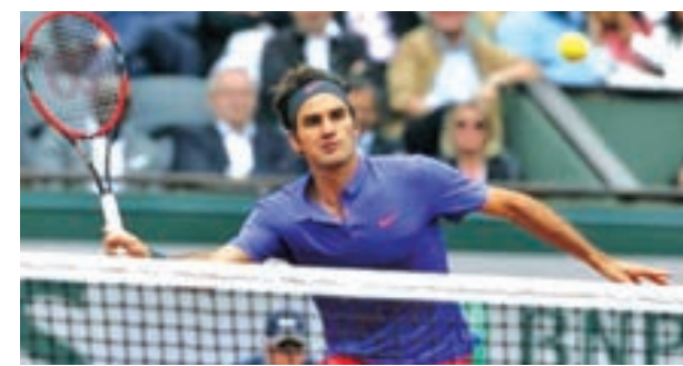
Roger Federer of Switzerland plays a shot to Damir Dzumhur of Bosnia and Herzegovina during their men's singles match at the French Open tennis tournament at the Roland Garros stadium in Paris, France on 29 May, 2015.