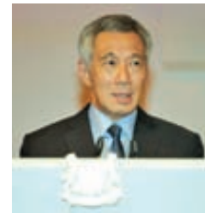
Singapore's Prime Minister Lee Hsien Loong delivers his keynote address of the International Institute for Strategic Studies (IISS) Shangri-La Dialogue in Singapore on 29 May, 2015.

SINGAPORE, 30 May — Singapore's prime minister called on countries on Friday to break the "vicious cycle" of the South China Sea row, as the United States and China exchanged increasingly angry barbs over reclaimed islands in the disputed waterway.