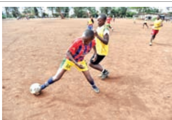
School girls from the Beijing Raiders football team take part in a training match at Mathare slums in Nairobi, Kenya, on 28 May, 2015. Located at the heart of the populous Mathare slums, Mcedo-Beijing School accommodates more than 600 students with disadvantaged background. Despite the hardships, many students here still enjoy the pleasure brought by football. Founded in 2007, the Beijing Raiders football team of the school has been a source of joy for the girls growing up inside the Mathare slums and collected dozens of trophies from local to national level.

"It could be a retaliatory attack of the Abu Sayyaf group," he said.—Xinhua