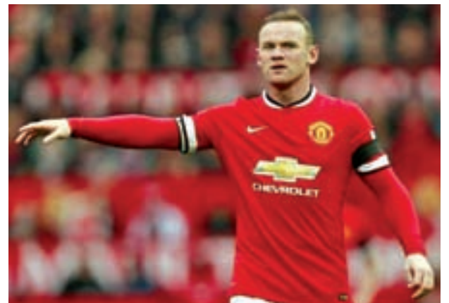
Manchester United’s Wayne Rooney

LONDON, 30 May — Manchester United captain Wayne Rooney believes finishing in the Premier League’s top four last season was essential for the record 20-times English champions.