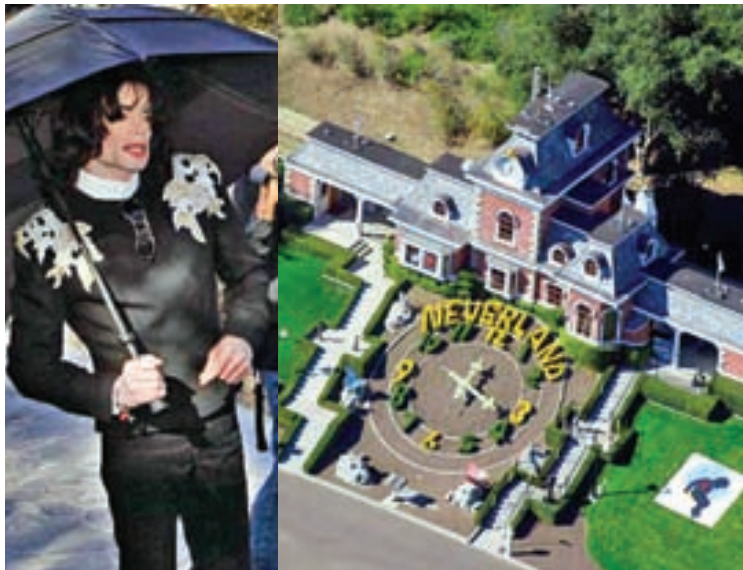
King of Pop Michael Jackson's former Neverland ranch estate in California has been put on the market for USD 100 million.

LOS ANGELES, 30 May — King of Pop Michael Jackson's former Neverland ranch estate in California has been put on the market for USD 100 million.