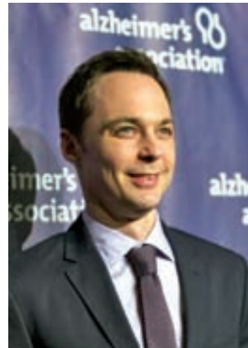
Actor Jim Parsons poses at the 23rd annual "A Night at Sardi's" benefit for the Alzheimer's Association in Beverly Hills, California on 18 March, 2015.

"Where were you during the Holocaust? Or when they green-