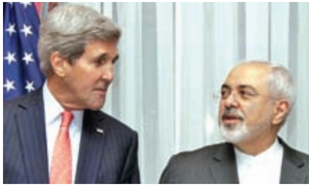
US Secretary of State John Kerry (L) and Iran's Foreign Minister Mohammad Javad Zarif pose for a photograph before resuming talks over Iran's nuclear programme in Lausanne on 16 March, 2015.

right now to make progress and we absolutely believe it is possible we can get this done by 30 June," the senior State Department official said, adding that Kerry's schedule for June had been cleared to focus on the Iran talks.