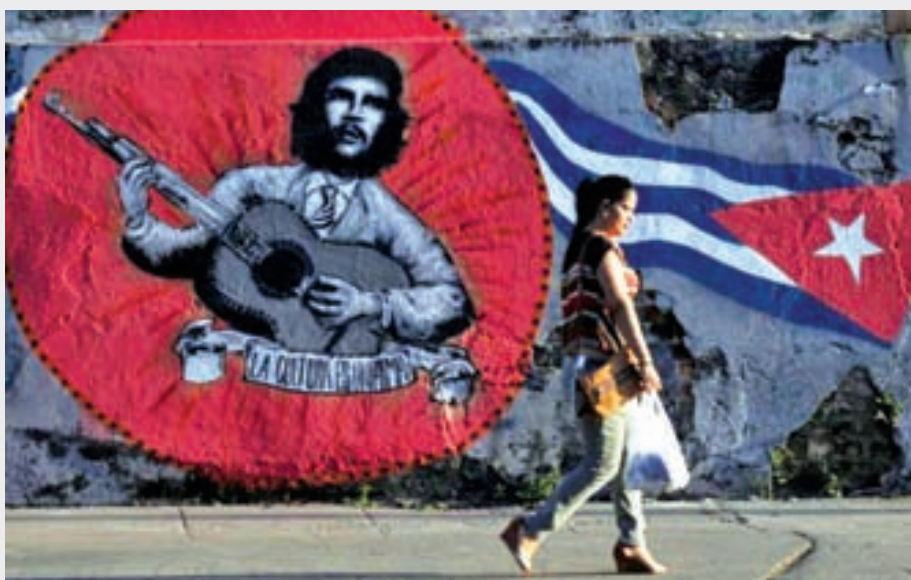
A woman walks past graffiti of revolutionary hero Ernesto "Che" Guevara and a Cuban flag of Mexican artistic group Azaro for the 12 th Havana Biennial, in Havana, on 28 May, 2015.