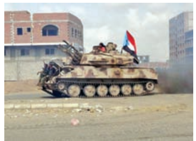
Anti-Houthi fighters of the Southern Popular Resistance ride a military vehicle in Yemen’s southern port city of Aden on 28 May, 2015.

Intense air raids by the Arab alliance were also reported overnight by residents of Saada, a province