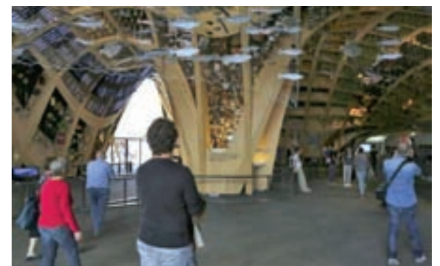
People visit the France pavilion at the Expo 2015 in Milan, northern Italy, on 6 May, 2015.