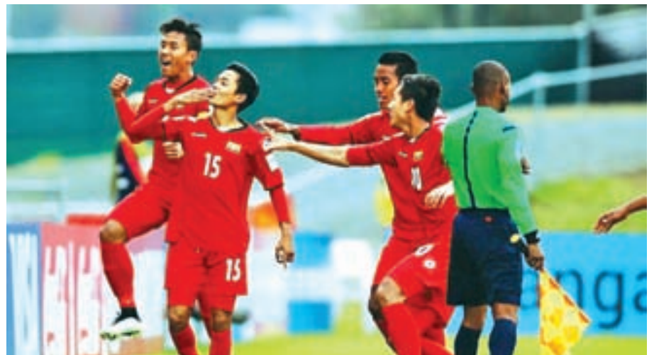
Myanmar's Yan Naing Oo celebrates with team mates after scoring the tournament's opening goal during the Group A FIFA U-20 World Cup New Zealand 2015 match at Northlands Events Centre in Whangarei, New Zealand on 30 May, 2015.—FIFA

The jovial mood soon subsided as USA regained their footing. A steady increase in pressure saw Kelllyn Perry-Acosta's cross scrambled behind for a corner, but captain Emerson Hyndman's dead-ball was clinical. Cameron Carter-Vickers' flick-on made its way to the back post, where Maki Tall was on hand to volley into the roof of the net.