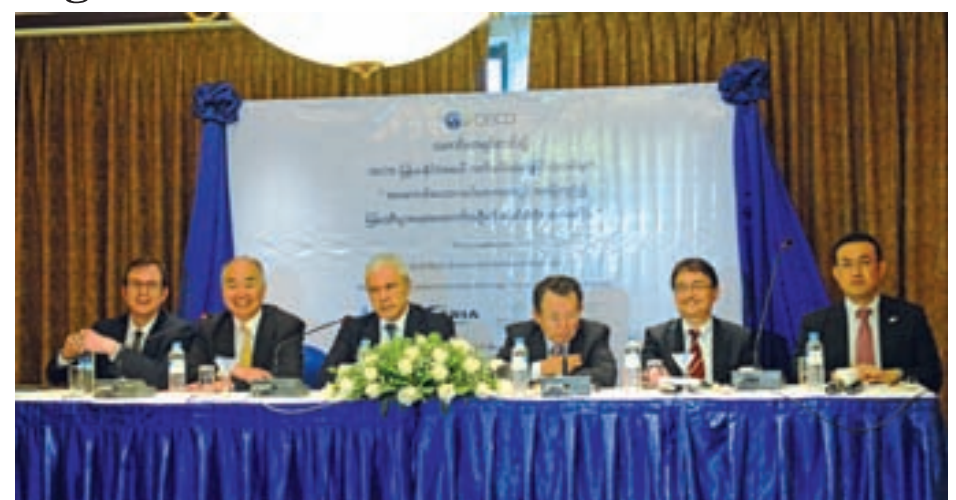
OECD officials address media at press conference on the sidelines of a workshop on modernizing Myanmar in Yangon.

There will be concerns about agriculture investment unless land ownership is opened to foreign (See page 3)