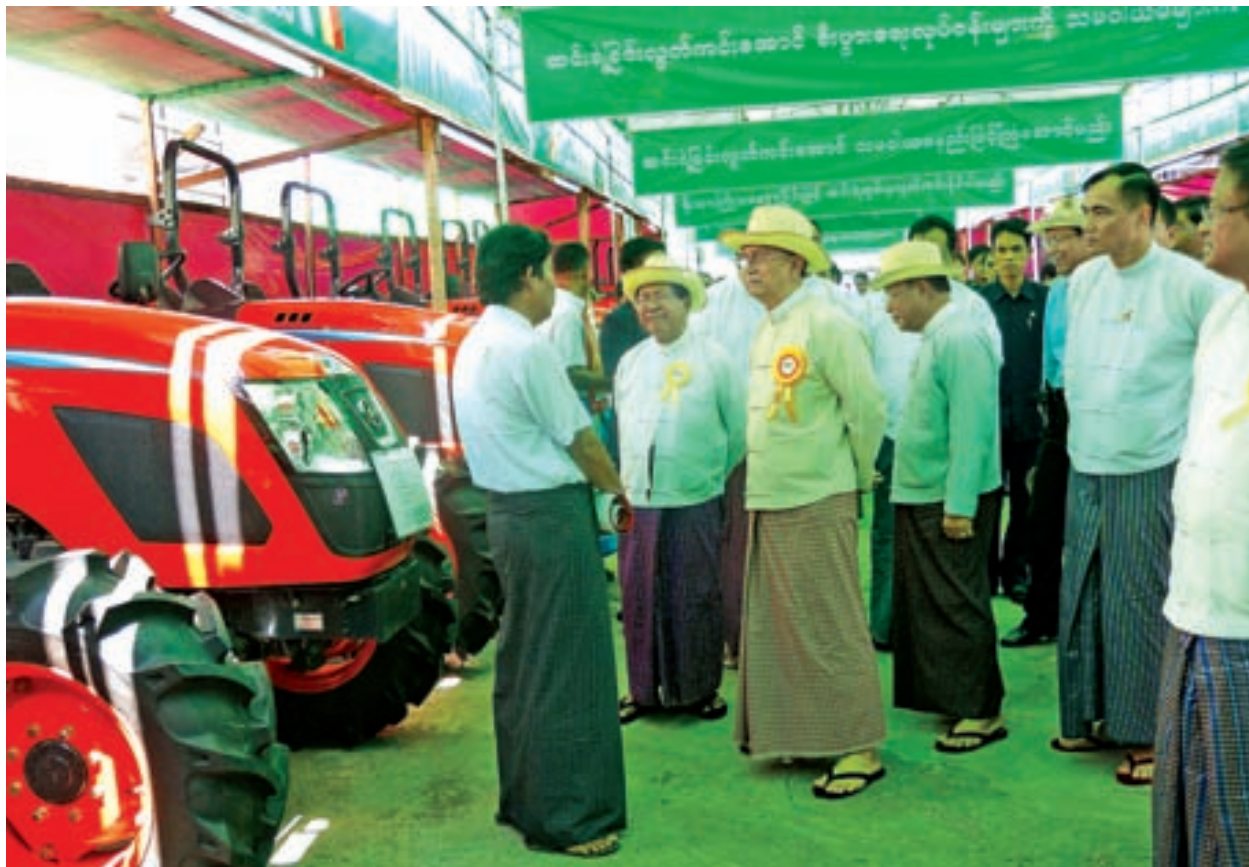
President U Thein Sein observes farm machinery provided to cooperatives members.—MNA

New momentum must be added to agricultural development, which he said