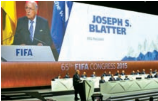
FIFA President Sepp Blatter delivers an opening speech at the 65 th FIFA Congress in Zurich, Switzerland on 29 May, 2015.

ZURICH, 30 May — Sepp Blatter won re-election as FIFA president for a fifth term on Friday, despite the latest wave of corruption allegations engulfing soccer's world governing body that had led to growing lack of confidence in the sport's kingpin.