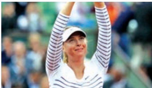
Maria Sharapova of Russia celebrates after beating Samantha Stosur of Australia during their women's singles match at the French Open tennis tournament at the Roland Garros stadium in Paris, France, on 29 May, 2015.

PARIS, 30 May — No 2 seed Roger Federer has set up a last 16 face-off with local favourite Gael Monfils while leading a charge through Friday's third round matches for the standout names at Roland Garros.