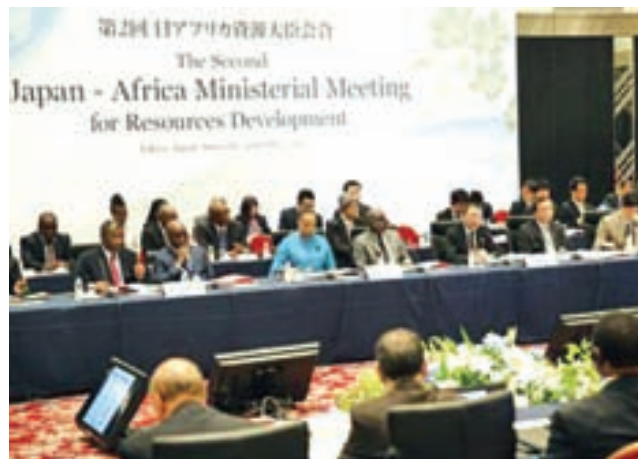
Photo taken on 30 May, 2015, shows the Japan-African Ministerial Meeting for Resources Development held in Tokyo, with Japan's trade minister Yoichi Miyazawa attending. Miyazawa and representatives of 16 African nations agreed to enhance their cooperation in boosting resource development.

TOKYO, 30 May — Ministers from Japan and 16 African countries agreed on Saturday to enhance their cooperation in developing natural resources while addressing issues that have prevented foreign investment in the fast-growing continent.