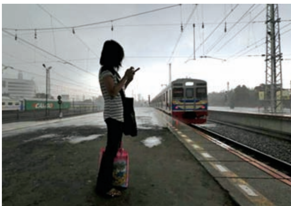
A woman uses her mobile phone as she waits for a train during a rainy day at a train station in Jakarta, Indonesia on 4 May, 2015.

Like any investment, this phenomenon has its risks and the stars of the apps can also lead people into losses, however good their records may appear.