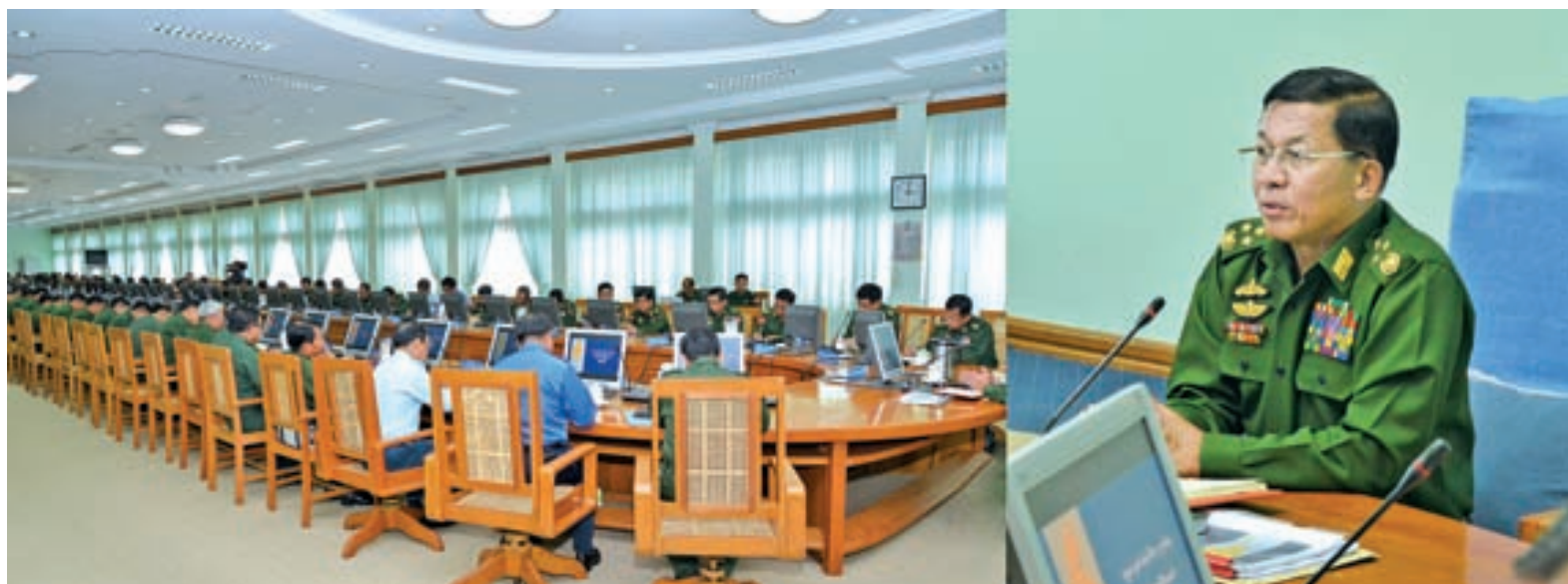
Commander-in-Chief of Defenses Senior General Min Aung Hlaing holds a meeting with senior military officers.

He noted that the military needs to possess fighting power to be able to clear the threats. It also needs to