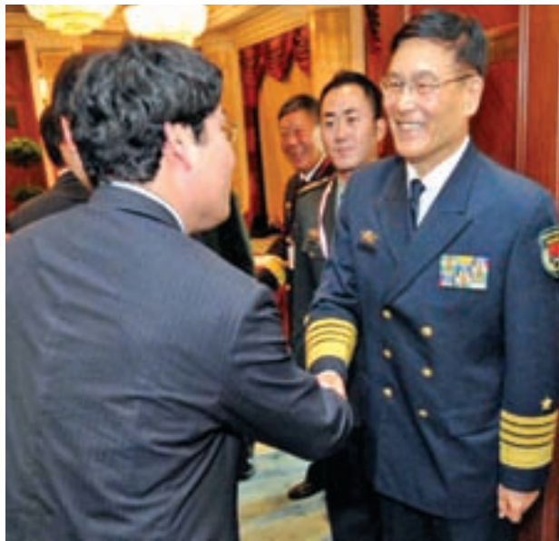
Admiral Sun Jianguo (R), vice chief of staff of China's People's Liberation Army (PLA), meets with Hideshi Tokuchi, Japanese vice minister of Defence for International Affairs, on the sidelines of the 14 th Shangri-La Dialogue in Singapore, on 29 May, 2015.

Organized by the Britain-based International Institute for Strategic Studies, the Shangri-La Dialogue, widely recognized as Asia-Pacific's foremost defence and security summit, brings together defence ministers, senior officials and security experts to exchange views on key issues that shape the defence and security landscape of the region.—Xinhua