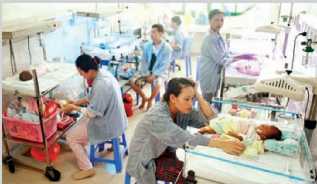
Sick children struck by the heat receive treatment at a hospital in Hai Phong city, northern Vietnam, on 30 May, 2015. A heat wave with temperature constantly rising over 40 degree Celsius hits northern Vietnam, which has badly affected local people's life.

"The idea that ISIS can turn Southeast Asia into a wilayat — a province of a worldwide Islamic caliphate — is a grandiose, pie-in-the-sky idea," he said. "But it is not so far-fetched that ISIS could establish a base somewhere in the region, somewhere where the governments' writs do not run."—Reuters