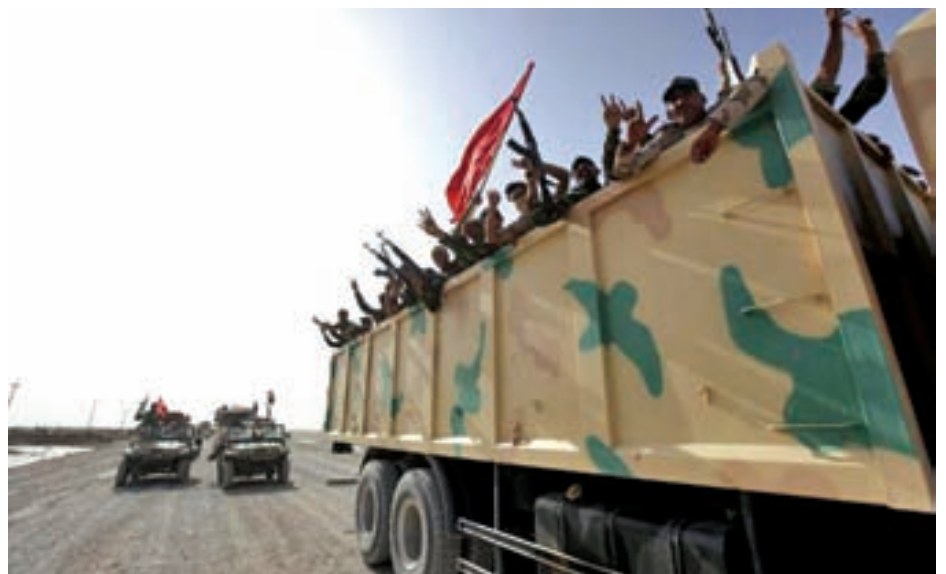
Shi'ite paramilitaries riding military vehicles travel from Lake Tharthar toward Ramadi to fight against Islamic state militants, west of Samarra, Iraq on 27 May, 2015.

BAGHDAD, 29 May — The blind man with just one hand arrived at the main mosque in the centre of the Iraqi city of Ramadi at dusk on Wednesday, flanked by Islamic State fighters.