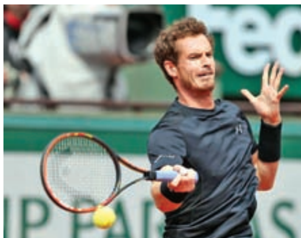
Andy Murray of Britain hits a return during the men's singles second round match against Joao Sousa of Portugal at 2015 French Open tennis tournament at Roland Garros, in Paris, France on 28 May, 2015. Andy Murray won 3-1.

"I feel like one thing Venus always tells me: A win is a win, and as long as you live to survive the next day, you can always