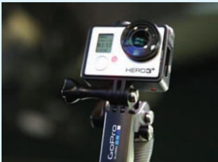
A GoPro Hero 3+ camera is seen at the Nasdaq Market Site before GoPro Inc's IPO in New York City, on 26 June, 2014.