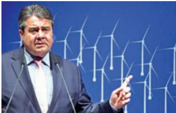
Sigmar Gabriel, German Minister for Economic Affairs

BERLIN, 29 May — German Vice Chancellor Sigmar Gabriel said that Europe may have to move at different speeds in the future, with Germany and France taking the lead and leaving others to follow later.