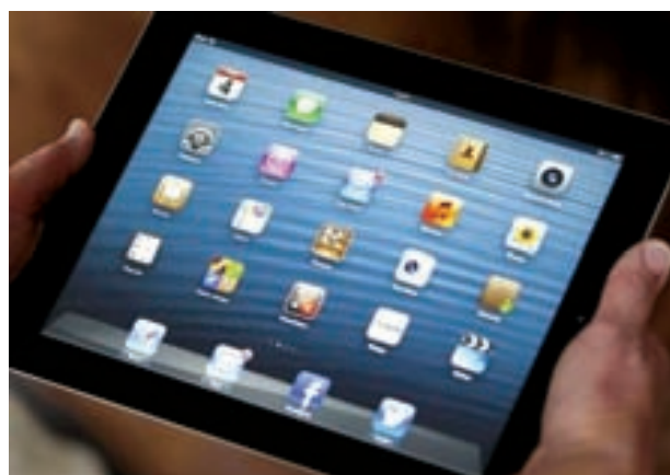
An illustration picture shows application icons on an Apple iPad tablet held by a woman in Bordeaux, Southwestern France on 4 Feb, 2013.

Apple had claimed that Bromwich collaborated improperly with the Justice Department and the states, was too aggressive in demanding interviews with executives, and