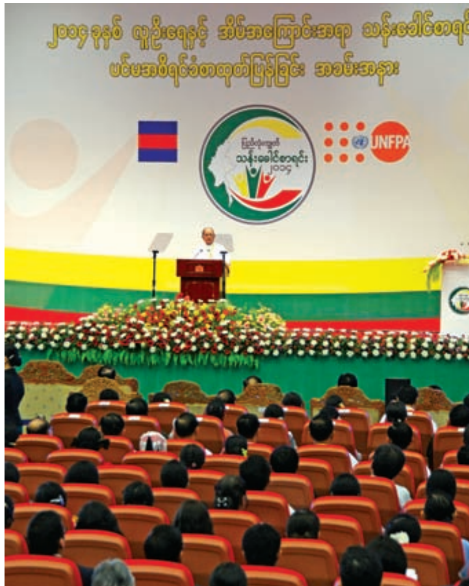
President U Thein Sein addresses launching ceremony of the main results of the 2014 population and housing census.

As you all know, just as it is important for a country to have geographical territory, equally important are the size, distribution and characteristics of its population. The census information will enable us to take evidence-based decisions made on the basis of credible data, both at national and state/regional levels. We will then be able to devise and implement more appropriate and effective policies where no one will be left behind. Every citizen, irrespective of gender, race, status, or disabilities, will have equal access to education, health care and social services. On the other hand, the census information will provide us with an accurate data