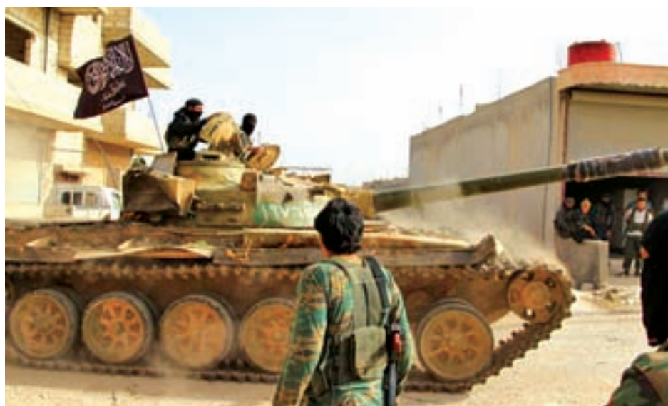
Members of al-Qaeda's Nusra Front ride on a tank as they head towards their positions during an offensive to take control of the northwestern city of Ariha from forces loyal to Syria's President Bashar al-Assad, in Idlib Province on 28 May, 2015.

Rebel sources say they have secured more US-made TOW missiles in recent months that have helped them to gain a military edge over the Syrian army.