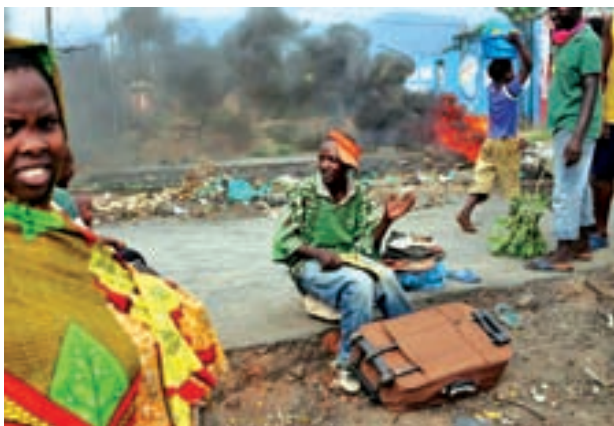
A man works at his street workshop in front of a burning barricade during a protest against President Pierre Nkurunziza's decision to run for a third term in Bujumbura, Burundi, on 27 May, 2015.

BUJUMBURA, 29 May — The European Union and Burundi's influential Roman Catholic Church on Thursday pulled out from observing elections in the African country, saying that next month's vote cannot be fair because of daily unrest and a crackdown on media.