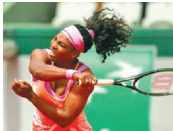
USA's Serena Williams