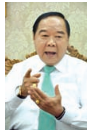
Thai Deputy Prime Minister and Defence Minister Prawit Wongsuwan

Amid a long-standing political gridlock, Prime Minister Prayut Chan-o-cha came to power in a coup in May last year shortly after the civilian government of Yingluck Shinawatra, sister