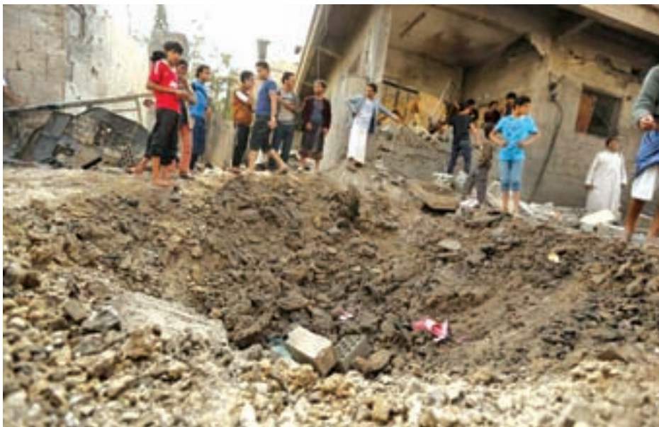
People gather at a site hit by a Saudi-led air strike in Yemen's capital Sanaa on 27 May, 2015.

Saudi state news agency SPA said the border guards were killed at a military post in Dhahran al-Janoub, along the border with Yemen, when projec-