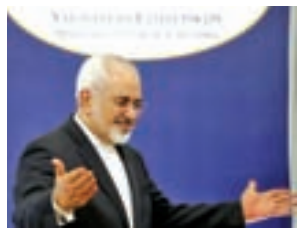
Iranian Foreign Minister Mohammad Javad Zarif gestures after a joint news conference with his Greek counterpart Nikos Kotzias in Athens on 28 May, 2015.

ATHENS, 29 May — Iranian Foreign Minister Mohammad Javad Zarif said on Thursday he hoped Teheran and world powers would reach a final nuclear deal "within a reasonable period of time" but this would be hard if the other side stuck to what he called excessive demands. Iran, the United