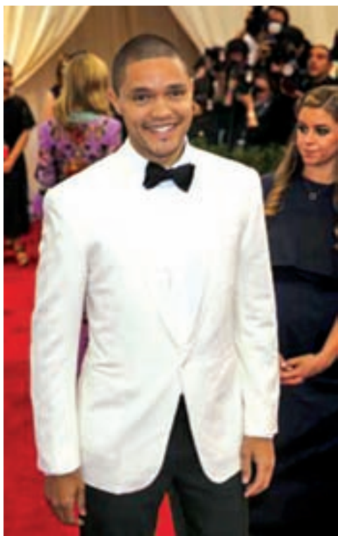
Television personality Trevor Noah arrives at the Metropolitan Museum of Art Costume Institute Gala 2015 celebrating the opening of 'China: Through the Looking Glass,' in Manhattan, New York on 4 May, 2015.

NEW YORK, 29 May — Jon Stewart as the host of South African comedian Trevor Noah will replace