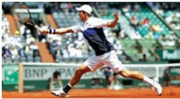
Kei Nishikori of Japan plays a shot to Thomaz Bellucci of Brazil during their men's singles match at the French Open tennis tournament at the Roland Garros stadium in Paris, France, on 27 May, 2015.

Bellucci on Wednesday, makes the fourth round for the first time in two years. Nishikori will face either Lukas Rosol of the Czech Republic or Russian Teymuraz Gabashvili for a place in the last eight. Becker upset 32 nd seed Fernando Verdasco of Spain 6-4, 0-6, 1-6, 7-5, 10-8 in the third round. Kyodo News