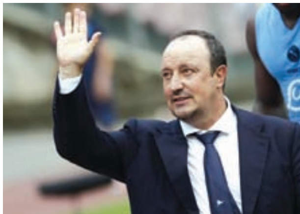
Napoli's coach Rafa Benitez waves at the end of his Italian Serie A match against Livorno at the San Paolo stadium in Naples on 6 Oct, 2013.

"I want to thank the president, the club and all the fans because after two years my experience here at Napoli is coming to an