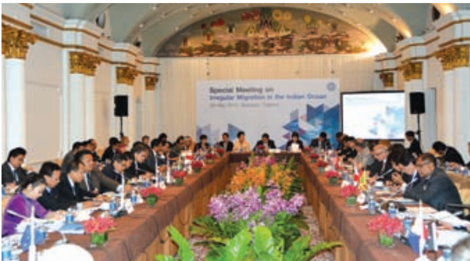
Special meeting on irregular migration in the Indian Ocean in progress in Bangkok.