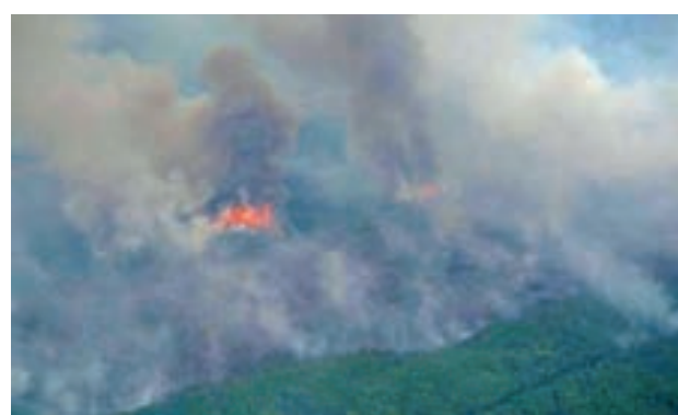
Smoke rises from a wildfire north of Cold Lake, Alberta on 27 May, 2015 in a photo supplied by the Alberta Wildfire Info department.

CALGARY, (Alberta), 29 May — Firefighters battled wildfires in northern Alberta, Canada's biggest crude-producing region, for a sixth day on Thursday, with two blazes near oil sands facilities still out of control.