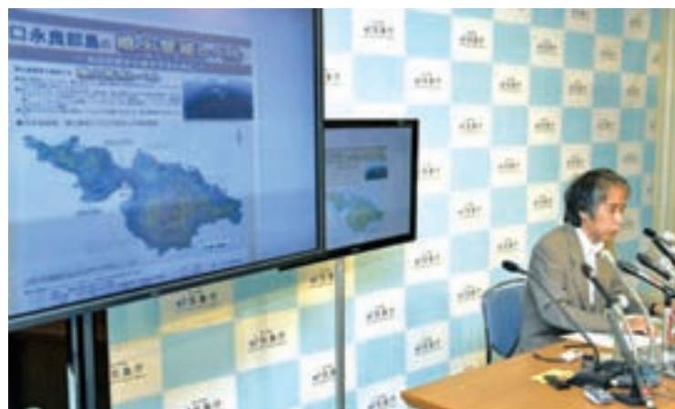
Sadayuki Kitagawa, chief of the department for volcanic affairs at the Japan Meteorological Agency, holds a Press conference at the agency in Tokyo on 29 May, 2015, following the eruption of a volcano on Kuchinoerabu Island in Kagoshima Prefecture, southwestern Japan. The 9:59 am “explosive” eruption of Mt Shindake caused a plume over 9 kilometers above the crater and a pyroclastic flow to reach the coast, the agency said.

A 64-year-old guesthouse manager on the island in the East