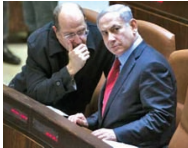
Israel's Defence Minister Moshe Yaalon (L) speaks with Prime Minister Benjamin Netanyahu during a session of the Knesset, the Israeli parliament, in Jerusalem on 1 Dec, 2014.

TEL AVIV, 29 May — US defence aid to Israel is likely to increase after 2017, sources on both sides said on Thursday, seeing a possible link to Washington's efforts to assuage its ally's fears over nuclear diplomacy with Iran.