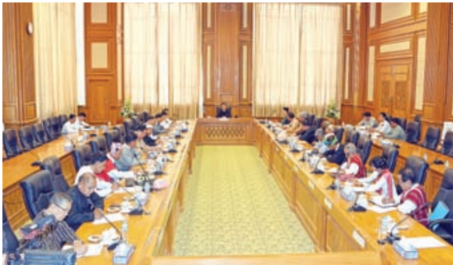
Speaker Thura U Shwe Mann meets leaders of political parties.

NAY PYI TAW, 29 May — Speaker of Pyidaungsu Hluttaw and Pyithu Hluttaw Thura U Shwe Mann met with leaders of political parties at the Pyithu Hluttaw, Hluttaw Complex, on Friday.