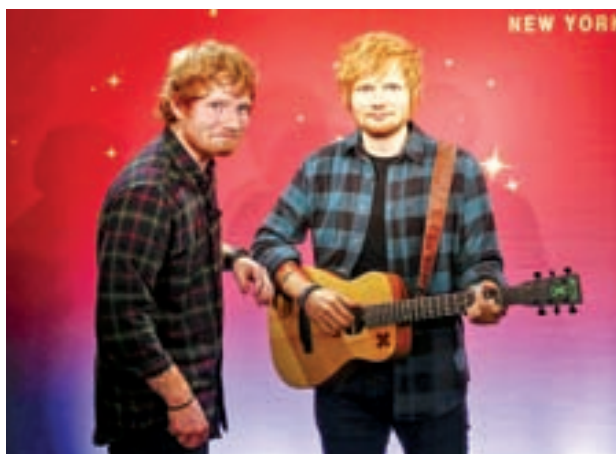
Musician Ed Sheeran poses with his wax figure at Madame Tussauds museum in the Manhattan borough of New York on 28 May, 2015.

NEW YORK, 29 May — After six Grammy nominations, several hit songs and numerous sold-out concerts, singer Ed Sheeran donated a few hours to Madame Tussauds sculptors who worked to create his likeness, revealed on Thursday.