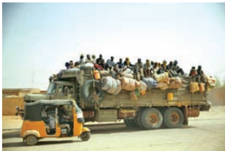
Migrants sit on their belongings in the back of a truck as it is driven through a dusty road in the desert town of Agadez, Niger on 25 May, 2015.

The death of 92 migrants from thirst — mostly women and children — when their vehicle