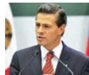
Mexico’s President Enrique Pena Nieto

Under a public information request, Reuters reviewed documents showing that Pena Nieto actually purchased the property in question — a 1,000 square metre piece of land in the town of Valle de Bravo — in 1988 from a third party. He paid 11.2 million pesos, equivalent to about $5,000 (3,261.58 pounds) at the time, the registry shows. His wealth declaration lists the property as being valued at just 11,200 “old” pesos, the equivalent to about $5 at the time.