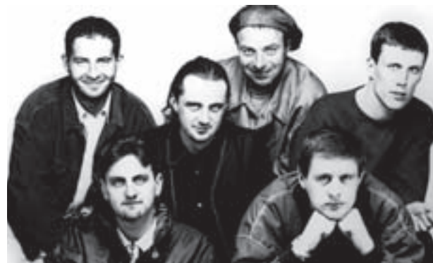
Happy Mondays, Scouting for Girls and ex-Busted singer Charlie Simpson are collaborating with tribes around the world.—PTI

LONDON, 29 May — Happy Mondays, Scouting for Girls and ex-Busted singer Charlie Simpson are collaborating with tribes around the world.