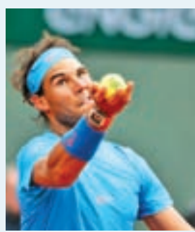
Rafael Nadal of Spain serves during the men's singles second round match against his compatriot Nicolas Almagro at 2015 French Open tennis tournament at Roland Garros, in Paris, France on 28 May, 2015. Rafael Nadal won 3-0.

PARIS, 29 May — Serena Williams and Andy Murray survived big scares here on Thursday, advancing to respective last 32 after a fight, while No 5 seed Caroline Wozniacki and Chinese Taipei's Lu Yen-Hsun were ousted at Roland Garros.