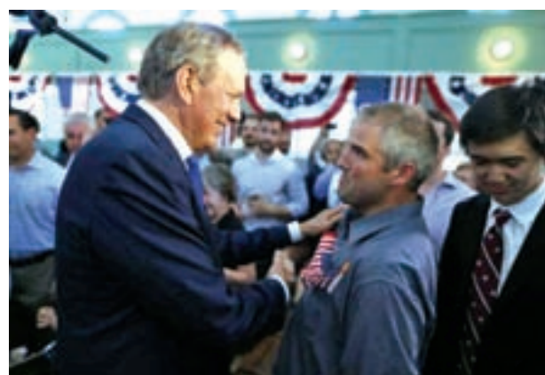
Republican presidential candidate and former New York Governor George Pataki (L) greets supporters after formally announcing his candidacy for the 2016 Republican presidential nomination in Exeter, New Hampshire, on 28 May, 2015.

Lacking name recognition, Pataki might struggle to make it into the first Republican debate in August on Fox News, which will be limited to the top 10 Republicans in national opinion polls.