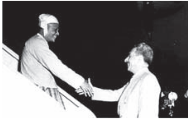
U Nu, Prime Minister of Burma (now Myanmar), was greeted by Prime Minister Moshe Sharret at Lod Airport

YANGON, 29 May — marks an important day The 29 th of May 2015 in the ongoing friendship