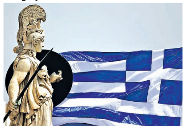
A Greek national flag flutters next to a statue of ancient Greek goddess Athena, in Athens on 21 May, 2015.