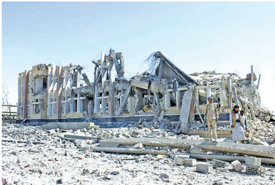
Houthi militants stand near a government building destroyed by a Saudi-led air strike in Yemen's northwestern city of Saada on 23 May, 2015.

Saudi Arabia has led an Arab coalition bombing the Houthis and backing southern Yemeni fighters