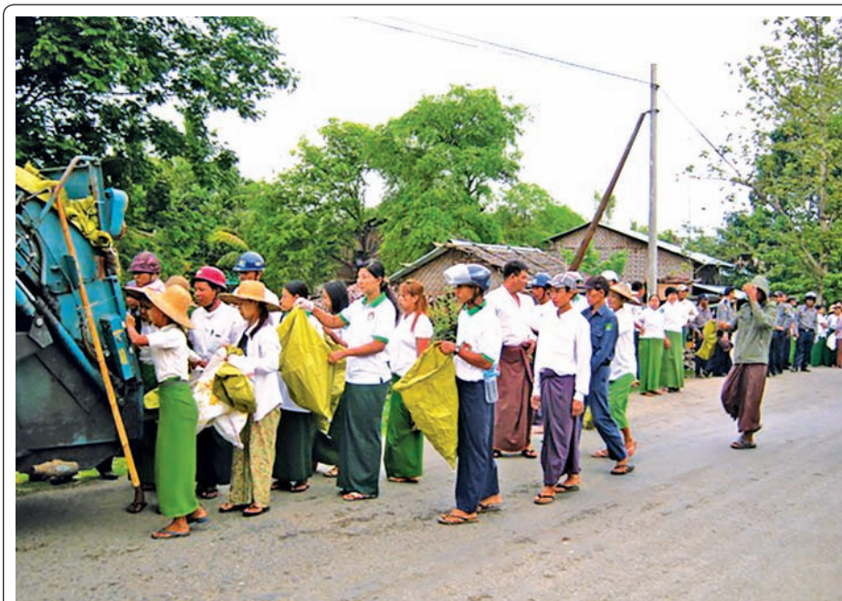
Departmental personnel, members of political parties and social organizations on 23 May participate in collection of garbage on roads in Myanaung, Ayeyawady Region, for the second time with a view to keeping urban area clean and pleasant.

of a 160x12x22-foot bridge to link Hinthada and Kyonpyaw townships.