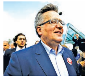
Poland's President Bronislaw Komorowski

WARSAW, 24 May — Poles vote for a president on Sunday in a run-off that is too close to call but already spells trouble for the ruling Civic Platform as it looks to re-election later in the year.