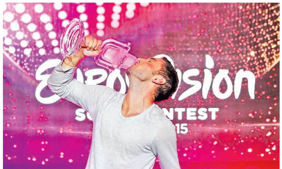
Singer Mans Zelmerlow representing Sweden poses with the trophy after winning the final of the 60th annual Eurovision Song Contest in Vienna, Austria, on 24 May, 2015.

Eurovision is hugely popular in Australia, where about 3 million people watched it last year, and