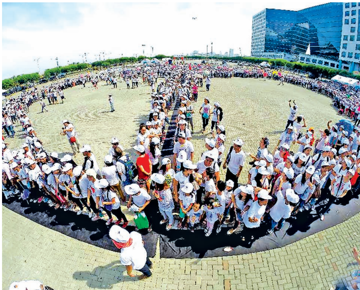
Participants form a giant peace sign during the “Handshake for Peace” event in Pasay City, the Philippines on 24 May, 2015.