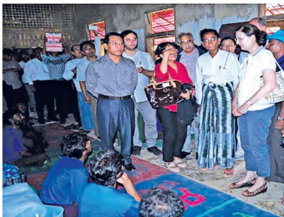
Chief Minister of Rakhine State U Maung Maung Ohn and officials of UN agencies comfort boat people at the relief camp in Ale Thankyaw village in Maungtau Township, Rakhine State.—MNA

back the 208 Bangladeshi citizens rescued by the Myanmar Navy on May 22.