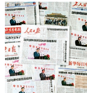
Photo shows various Chinese newspapers dated on 24 May, 2015, reporting on President Xi Jinping’s attendance at an event aimed at promoting exchanges between China and Japan held the previous day in Beijing’s Great Hall of the People.

The 76-year-old lawmaker from the Liberal Democratic Party said he will inform Abe of all the details of his discussions with Xi and other senior Chinese officials after he returns to Tokyo on Tuesday.—Kyodo News