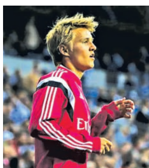
Real Madrid's Martin Odegaard warms up during their Spanish first division soccer match against Getafe at Santiago Bernabeu stadium in Madrid, Spain on 23 May, 2015.

Guardiola has repeatedly committed to seeing out his contract that ends in 2016 and any extension talks will take place later this year the club and coach have said.