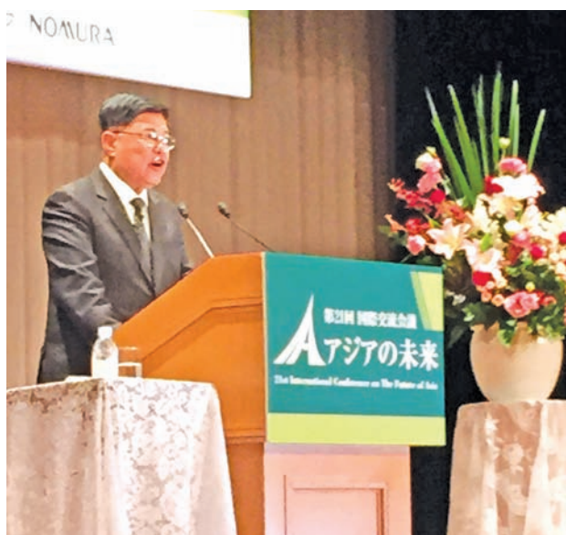
Union Minister U Soe Thane addresses 21 st International Conference on the Future of Asia.—MNA

NAY PYI TAW, 24 May — Union Minister at the President Office U Soe Thane spoke about formation of ASEAN Economic Community and its effectiveness on Asia, remaining reform process and Myanmar's future at the 21 st International Confer-