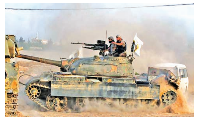
Al-Rahman corps and the Islamic Union for Recruiting the Levant demonstrate their skills during a military training in Marj Al-Ashari, eastern Ghouta of Damascus on 22 May, 2015.

military intervention is a remote possibility since Russia and China have al-