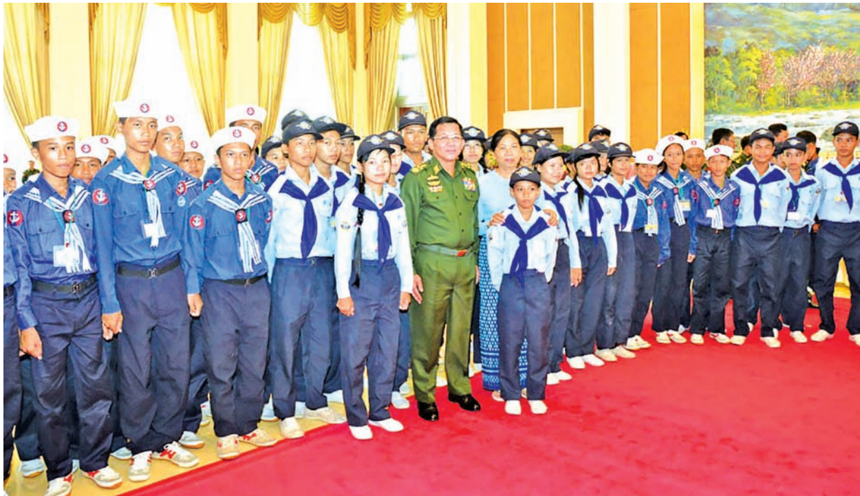
Senior General Min Aung Hlaing and wife Daw Kyu Kyu Hla seen with new generation youths.

NAY PYI TAW, 24 May — Commander-in-Chief of Defence Services Senior General Min Aung Hlaing attended the ceremony to honour new generation youths of navigation and aviation courses at Zeyar-thiri Beikman on Sunday.