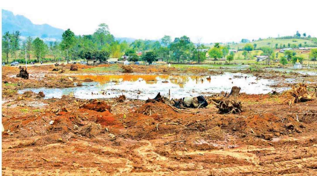
Vice President Dr Sai Mauk Kham views site chosen for construction of fire station near Naungmon Village in Lashio Township.

during the four years of the term of the government such as availability of mobile SIM cards, electricity, better transportation services, compulsory education and free health care