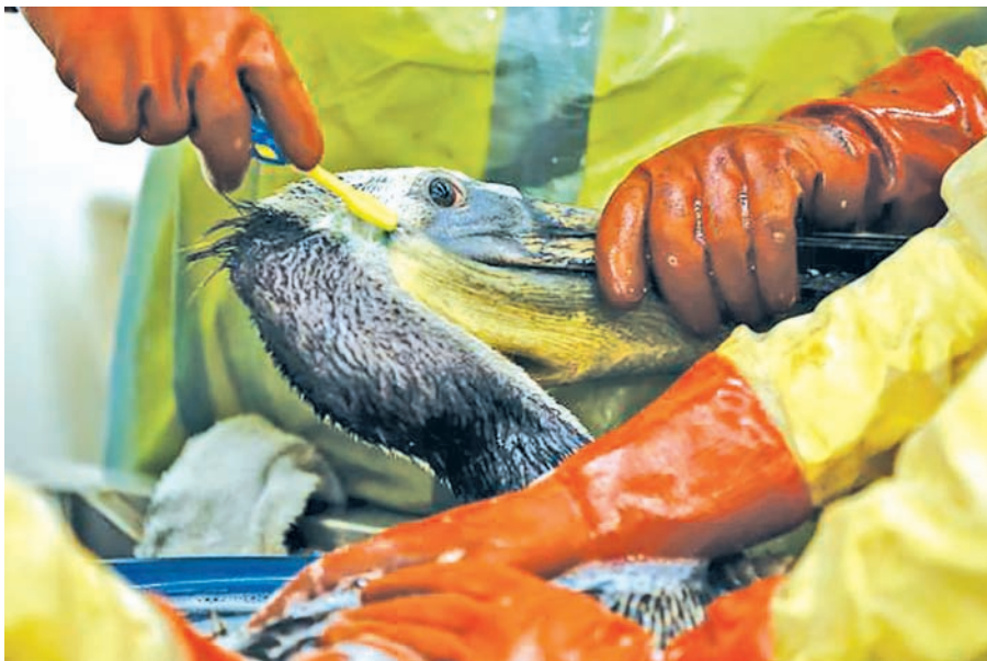
Staff and volunteers work to clean a brown pelican at the International Bird Rescue centre in San Pedro, Los Angeles, California, United States, on 22 May, 2015.

Correction: Please see the photo published on Page 15 of this daily issued on 23-5 2015 as follows:(Ed)