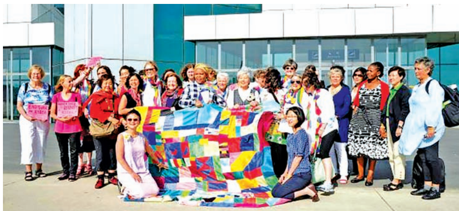
Female activists from around the world arrive at Pyongyang airport in Pyongyang, North Korea, in this photo taken and released by Kyodo on 19 May, 2015.—REUTERS

The group, which had initially set out to embark on a symbolic walk across the DMZ at the Panmunjom “Truce Village”, instead crossed from North Korea in a bus flanked by South Korean military and police cars at a customs area which connects to the jointly-operated Kaesong Industrial Zone.