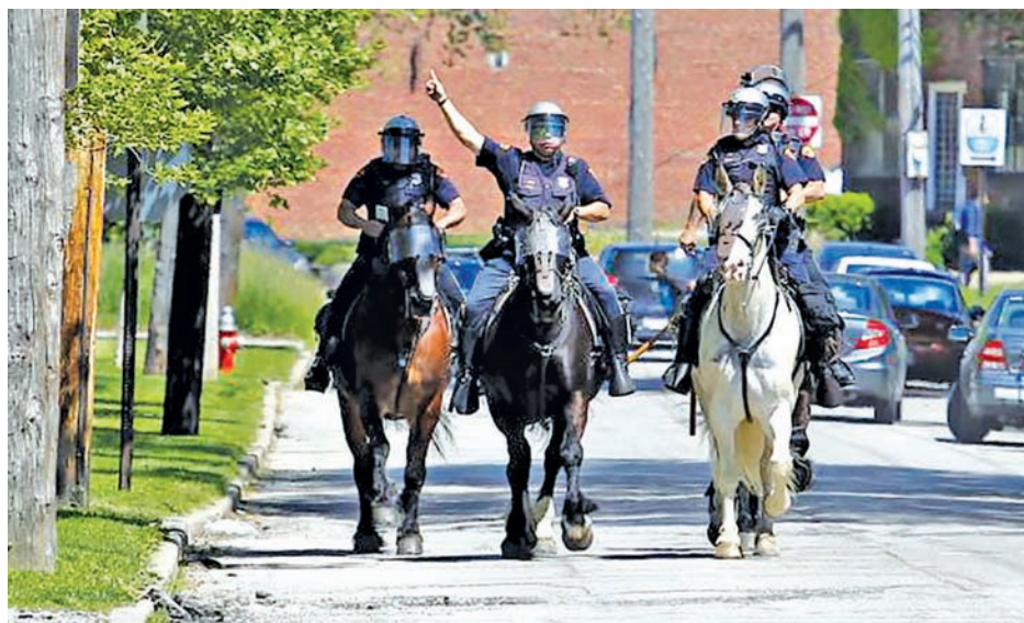
Cleveland mounted police patrol the streets as protesters march out of the city following the not guilty verdict for Cleveland police officer Michael Brelo on manslaughter charges in Cleveland, Ohio, on 23 May, 2015.