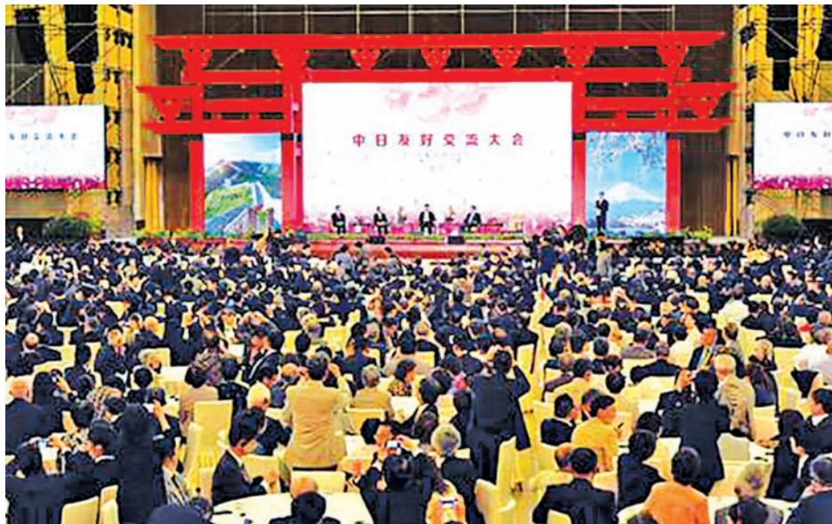
An event aimed at promoting exchanges between China and Japan is held in Beijing’s Great Hall of the People on 23 May, 2015. Chinese President Xi Jinping attended in his first appearance at such an event involving Japan since taking office in 2012.

In his first appearance at such an event involving