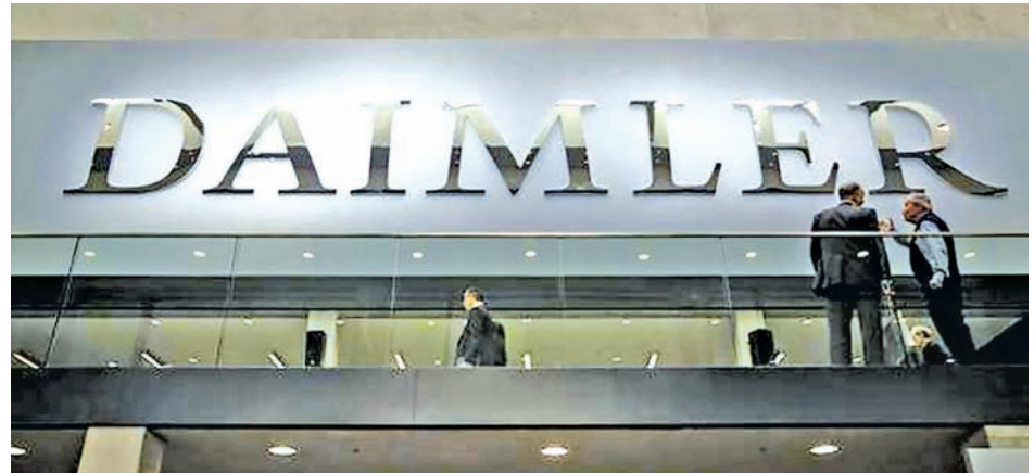
Shareholders arrive for the Daimler annual shareholder meeting in Berlin on 1 April, 2015.

Germany’s premium auto makers are currently on a tear to bulk up their technology expertise, and are readying an offer for Nokia’s mapping division HERE.