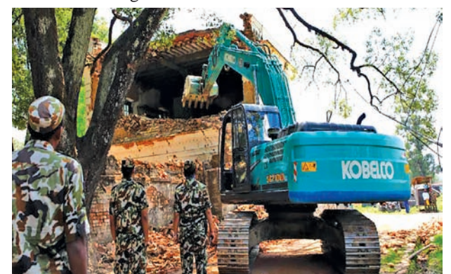
Nepal Army personnel demolish a damaged house in Kathmandu, Nepal, on 23 May, 2015.

The home ministry also informed that a chopper with six rescue personnel have been mobilized in Myagdi this morning for the rescue efforts. Nepal Police, Nepal Army and officials from the home ministry are already on the scene.