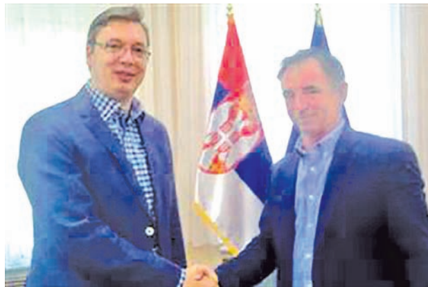
Serbian Prime Minister Aleksandar Vucic and Milorad Pupovac, president of the Serb National Council (SNV) in Croatia.

Vucic and Pupovac exchanged opinion on solving problems that Serbs in Croatia are facing, reads a statement by the Serbian