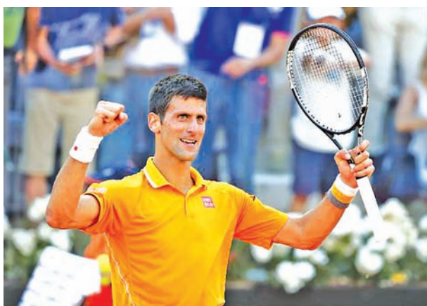
Novak Djokovic of Serbia celebrates winning against Roger Federer of Switzerland after their final match at the Rome Open tennis tournament in Rome, Italy on 17 May, 2015.

"It is obviously very encouraging knowing that