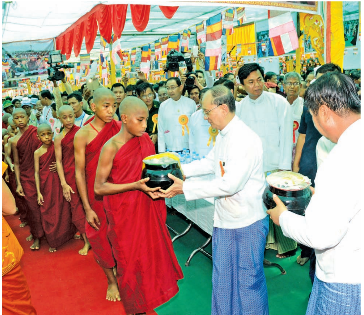
President U Thein Sein offers eight prerequisites to novices in Bukaing Village, Myaung township.—IPRD

The president also inspected the condition of Chindwin River and its environs.—MNA