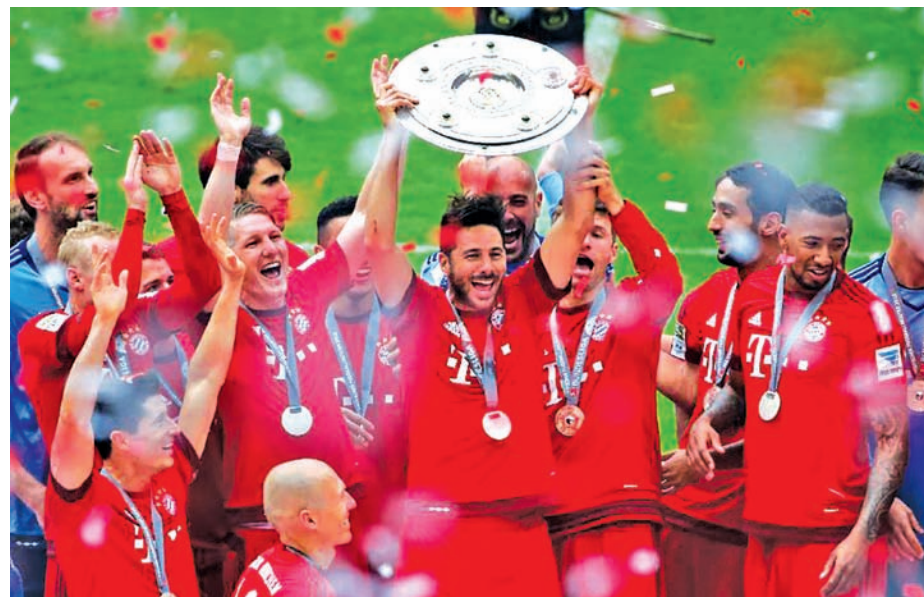
Bayern Munich's players celebrate after the German first division Bundesliga football match between Bayern Munich and Mainz in Munich, Germany, on 23 May, 2015. Bayern Munich won 2-0 and claimed their 25 th Bundesliga title.

MADRID, 24 May — Teenage Norway midfielder Martin Odegaard