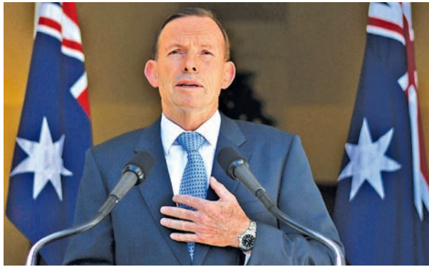
Australian Prime Minister Tony Abbott

Earlier this year, the government said it would amend the Citizenship Act so that dual nationals could be stripped of their Australian citizenship if