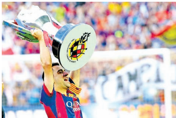
Barcelona's captain Xavi Hernandez holds up the trophy after winning the Spanish League title, at the end of the Spanish BBVA La Liga (first division soccer league) match between FC Barcelona and RC Deportivo La Coruna at Camp Nou stadium in Barcelona, Spain, on 23 May, 2015. Xavi announced on Thursday his retirement from Barcelona at the end of the current season. He will play next season at Al Sadd in Qatar.

BARCELONA, 24 May— There will never be another player like Xavi and Barcelona will have to adapt accordingly now he is leaving, coach Luis Enrique said after the midfielder's final La Liga game for the club on Saturday.