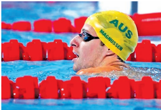
James Magnussen of Australia reacts after competing in the men’s 50m freestyle heats during the World Swimming Championships at the Sant Jordi arena in Barcelona on 2 Aug, 2013.

“I will now focus all my time and effort on pre-