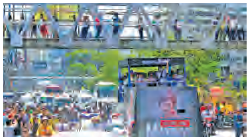
Boxer Manny Pacquiao waves to the crowds during a motorcade in Manila on 13 May, 2015 after arriving back from Las Vegas.

Pacquiao opted against getting into a verbal sparring match over Mayweather's criticism.