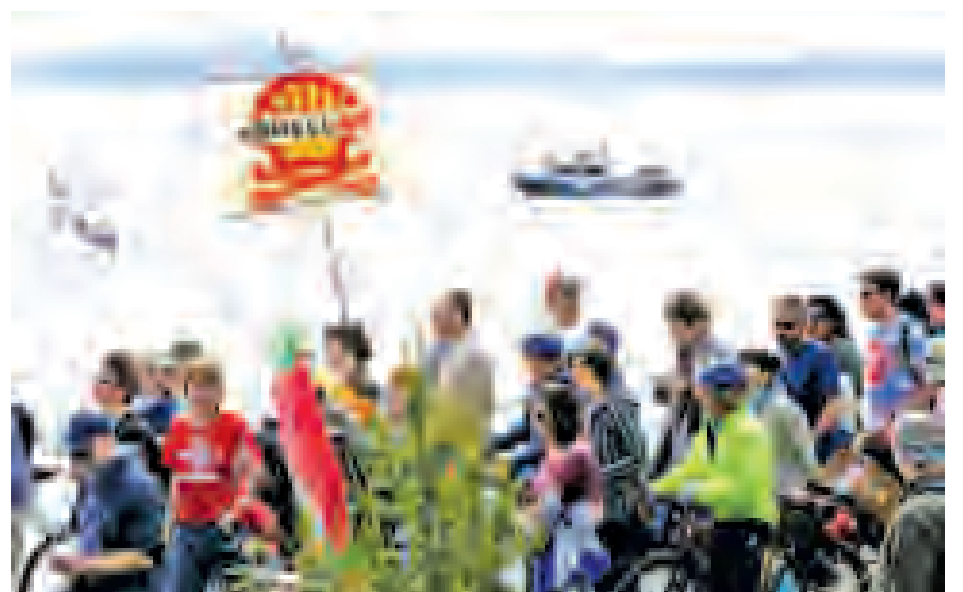
A police boat patrols as activists protest the Polar Pioneer, an oil rig leased by Royal Dutch Shell Plc that is bound for the Arctic, at a rally and march in Seattle, Washington, United States on 26 April, 2015.—REUTERS

The Puget Sound region has a decades-long history as a hub for equipment used in energy drilling in Alaska even as some environmental groups and politicians have pushed for the region's economy to move beyond oil, gas and coal and into clean energy.— Reuters