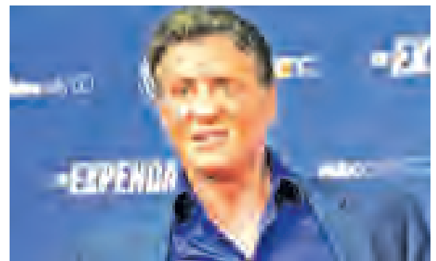
Hollywood action star Sylvester Stallone

LONDON, 13 May — Hollywood action star Sylvester Stallone will exhibit his artwork in Nice, France, from this weekend.