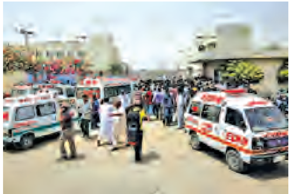
Ambulances and people gather outside the hospital after an attack on a bus in Karachi, Pakistan on 13 May, 2015.

Karachi, a megacity of 18 million that is Pakistan’s financial heart, is also under the responsibility of the paramilitary Rangers, who report to the generals.