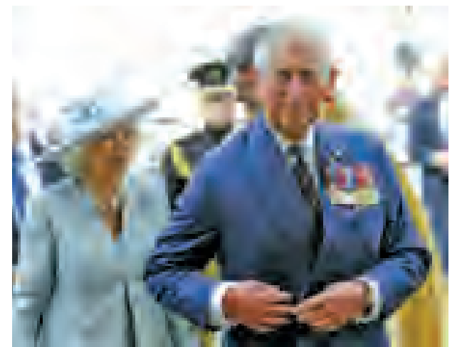
Britain's Prince Charles and his wife Camilla, Duchess of Cornwall arrive at Westminster Abbey for a thanksgiving service on the final day of 70 th anniversary Victory in Europe (VE) day commemorations in central London on 10 May, 2015.

Queen Elizabeth has kept her opinions to herself during her 63-year reign, but