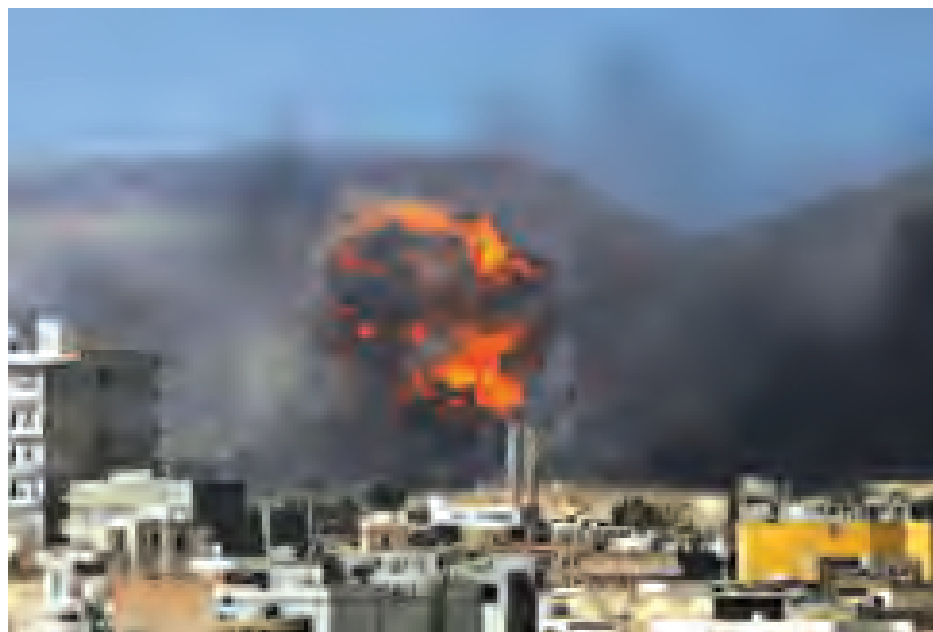
An air strike hits a military site controlled by the Houthi group in Yemen’s capital Sanaa on 12 May, 2015.

After the ceasefire formally began, fighting continued in al-Dhala and Marib provinces in southern and eastern Yemen, said residents and tribal sources. The sound of shelling continued until morning in the city of Taiz,