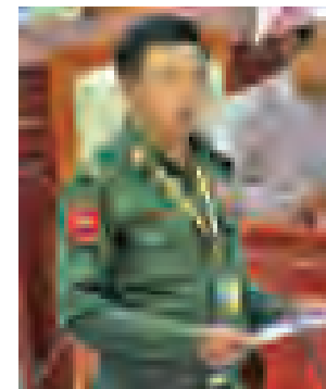
Deputy Minister for Home Affairs Brig-Gen Kyaw Zan Myint.—MNA