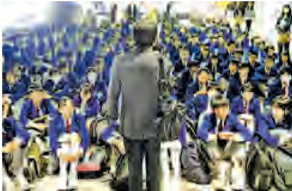
Junior high school students wait for a shinkansen bullet train at the main station in Sendai, northeastern Japan, after a powerful earthquake caused a delay in train services on 13 May, 2015. No tsunami warning was issued.

TOKYO, 13 May — A magnitude 6.8 earthquake rocked a wide area of Japan centering on the northeast early on Wednesday, the Japanese weather agency said. No tsunami warning was issued.