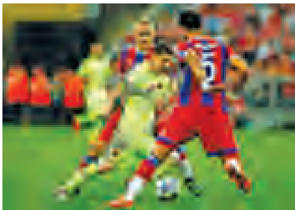
Barcelona's Lionel Messi fights the ball against Bayern Munich's Sebastian Rode and Mehdi Benatia during UEFA Champions League Semi Final Second Leg at Allianz Arena, Munich, Germany on 12 May, 2015.

MUNICH, 13 May — Barcelona's Neymar struck twice to put the Spanish side in the Champions League final despite a 3-2 loss at Bayern Munich on Tuesday as they progressed 5-3 on aggregate and will face Real Madrid or Juventus next month.