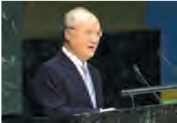
Yukiya Amano, Director General of the International Atomic Energy Agency (IAEA) speaks during the Opening Meeting of the 2015 Review Conference of the Parties to the Treaty on the Non-Proliferation of Nuclear Weapons (NPT) at United Nations headquarters in New York on 27 April, 2015.

VIENNA, 13 May—The UN nuclear watchdog can push for access to Iranian military sites under the terms of a preliminary deal with Teheran, the head of the body told the Associated Press in an interview.