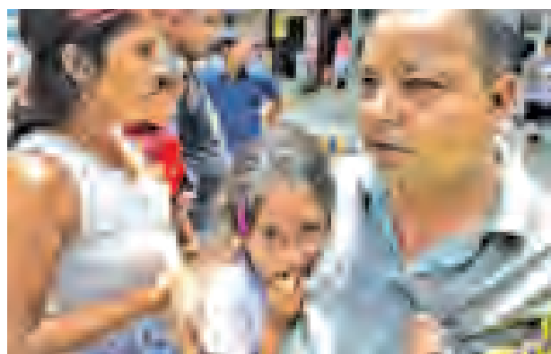
Local residents evacuate onto a street minutes after an earthquake in central Kathmandu, Nepal on 12 May, 2015.

CHARIKOT, (Nepal), 13 May — Hundreds of Nepali troops were searching for a missing US Marines helicopter with eight people on board on Wednesday,