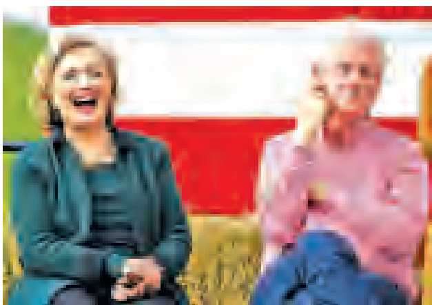
Former US Secretary of State Hillary Clinton (L) and her husband former US President Bill Clinton listen to remarks at the 37th Harkin Steak Fry in Indianola, Iowa on 14 Sept, 2014.

WASHINGTON, 13 May — Former US President Bill Clinton said on Tuesday he will move back into the White House if his wife Hillary wins the presidency next year — “if I'm asked.”