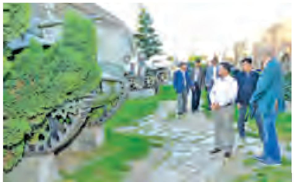
Senior General Min Aung Hlaing and party visit Belgrade Fortress in capital of Serbia.—MYAWADY

The senior general and party proceeded to Abu Dhabi of UAE in the afternoon.—Myawady