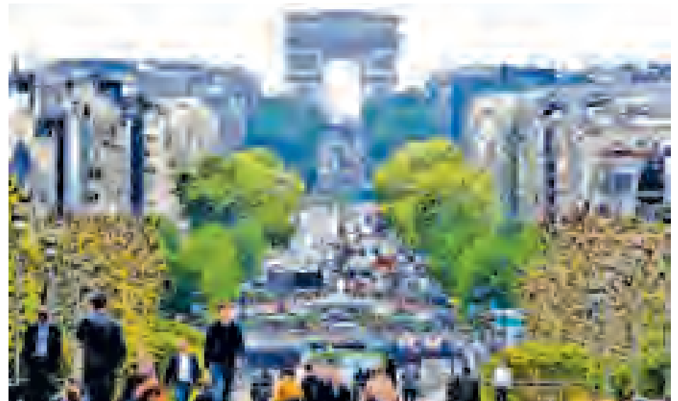
People walk on the esplanade of La Defence in the financial and business district west of Paris, on 7 May, 2015.

PARIS, 13 May — Cheap oil and a weak euro lifted the French economy in the first quarter to growth of 0.6 percent, its fastest rate in two years and easily beating analysts' expectations.