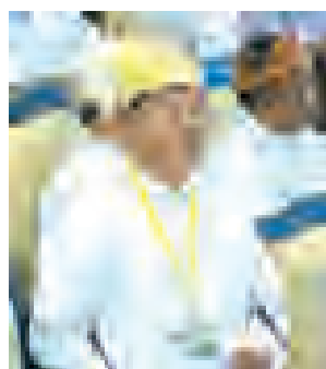
Deputy Minister for Education U Thant Shin.