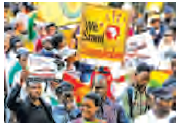
Demonstrators carry placards during a march against xenophobia in downtown Johannesburg on 23 April, 2015.