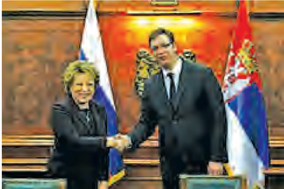
Chairman of the Russian Federation Council Valentina Matviyenko and Serbian Prime Minister Aleksandar Vucic

BELGRADE, 13 May—Serbian Prime Minister Aleksandar Vucic conferred with Chairman of the Russian Federation Council Valentina Matviyenko on Tuesday concerning friendly bilateral