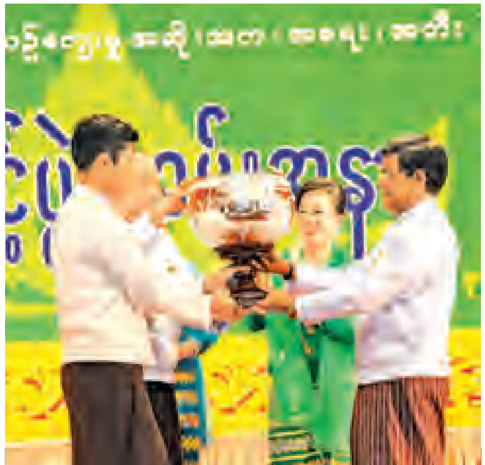
Vice President U Nyan Tun presents championship trophy to Yangon Region team in 21 st Performing Arts Competition.