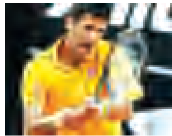
Novak Djokovic of Serbia returns the ball to Nicolas Almagro of Spain during their match at the Rome Open tennis tournament in Rome, Italy, on 12 May, 2015.

Djokovic looked poised for victory when he built a 5-2 lead in the tie-break but Almagro fought back and when Djokovic netted a tame forehand at 5-5 Almagro seized his