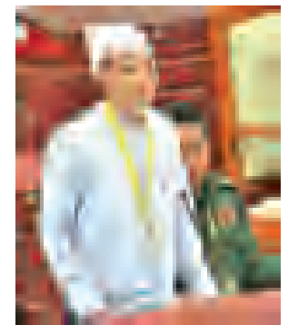
Deputy Attorney-General U Tun Tun Oo.—MNA