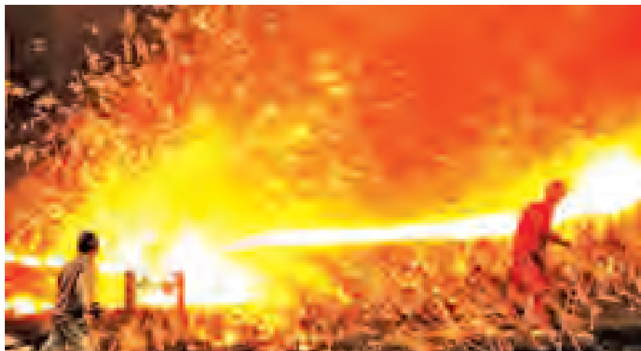
Employees work at a steel factory in Dalian, Liaoning Province in this 16 March, 2015 file picture.