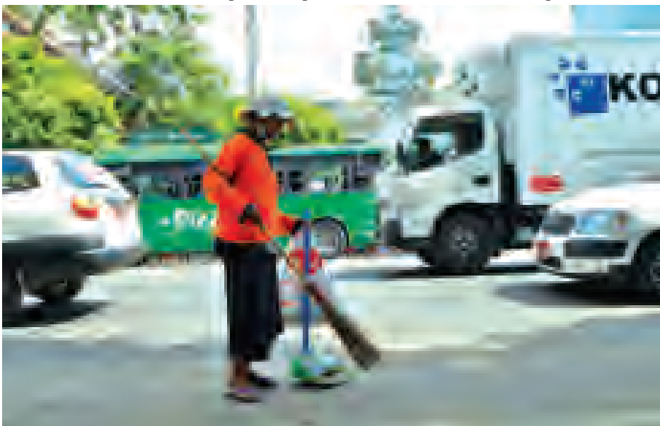
A sweeper cleans Bogyoke Road in downtown Yangon, where waste management services are targeted for privatization from September.

"Privatized garbage pickup in Yangon will be given the go-ahead by the region government only when the majority of Yangon residents show support (See page 2)