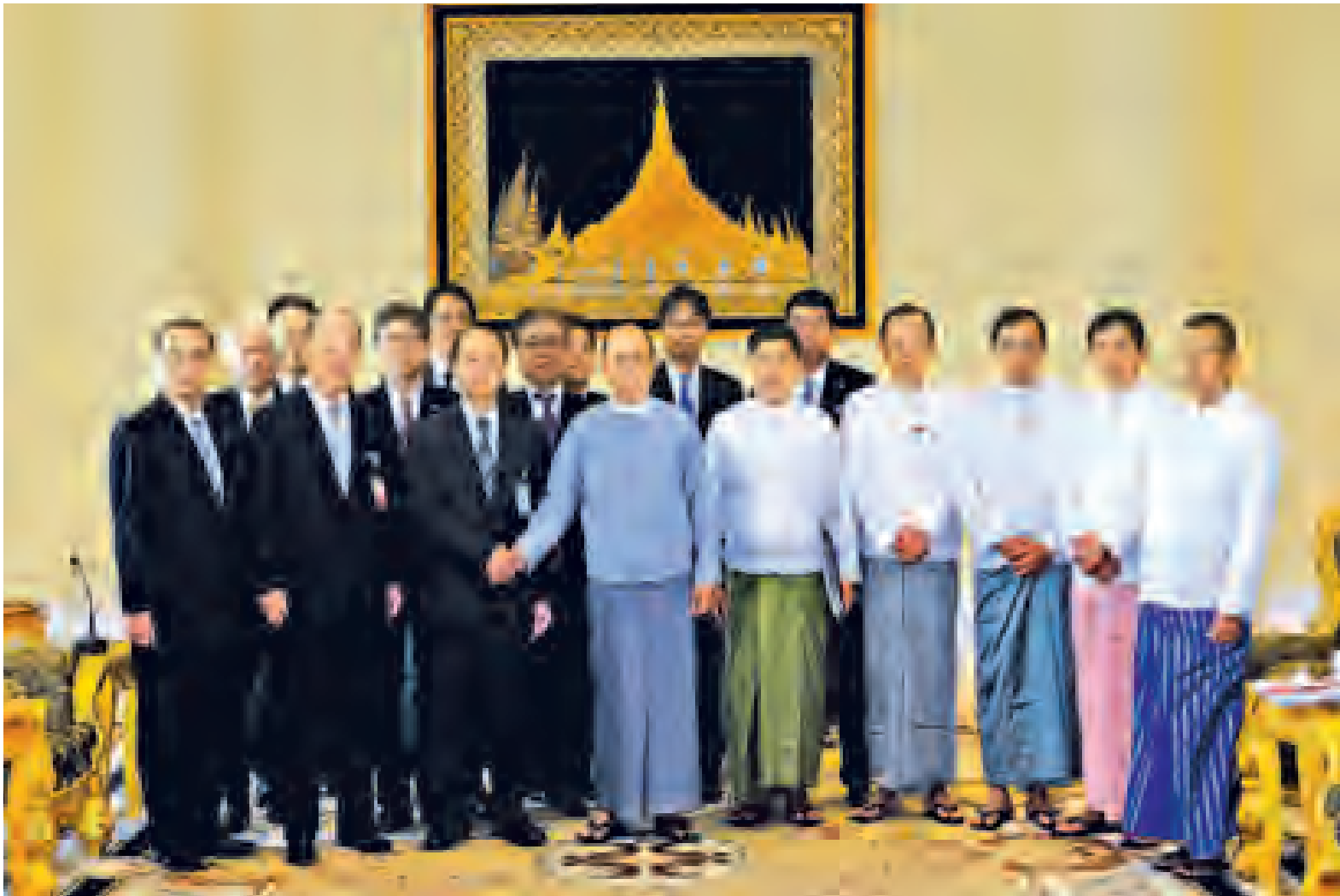
President U Thein Sein poses for documentary photo with Hiroto Izumi, Special Adviser to the Prime Minister of Japan.—MNA

NAY PYI TAW, 13 May— President U Thein Sein met a Japanese delegation led by Hiroto Izumi, Special Adviser to the