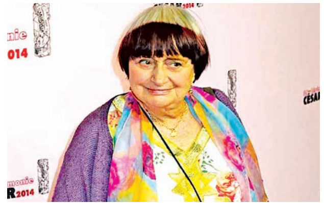
French director professor Agnes Varda

LOS ANGELES, 11 May — French director professor Agnes Varda will be honoured with the prestigious Palme d’Or at the upcoming Cannes International Film Festival for the global impact of her body of work.