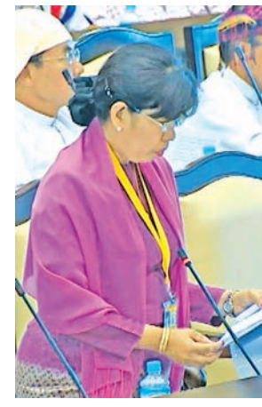
Deputy Minister for Health Dr Daw Thein Thein Htay.

NAY PYI TAW, 11 May—The Department of Medical Care has a plan to provide ambulances to township-level people's hospitals in fiscal 2015-2016, but not to station hospitals in remote areas at this stage, Deputy Minister for Health Dr Daw Thein Thein Htay told the Amyotha Hluttaw on Monday.