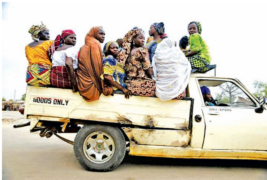
Women travel in the back of a truck in the town of Mararaba, after the Nigerian military recaptured it from Boko Haram, in Adamawa state on 10 May, 2015.