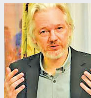
WikiLeaks founder Julian Assange

One of the five Supreme Court judges dis-