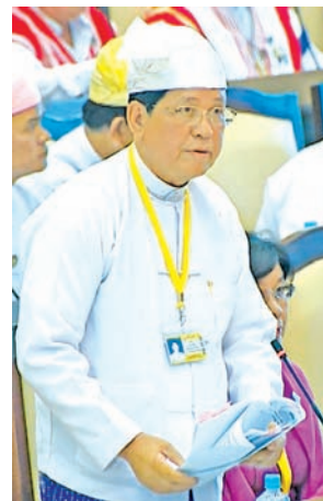
Deputy Minister for Livestock, Fisheries and Rural Development U Tin Ngwe.