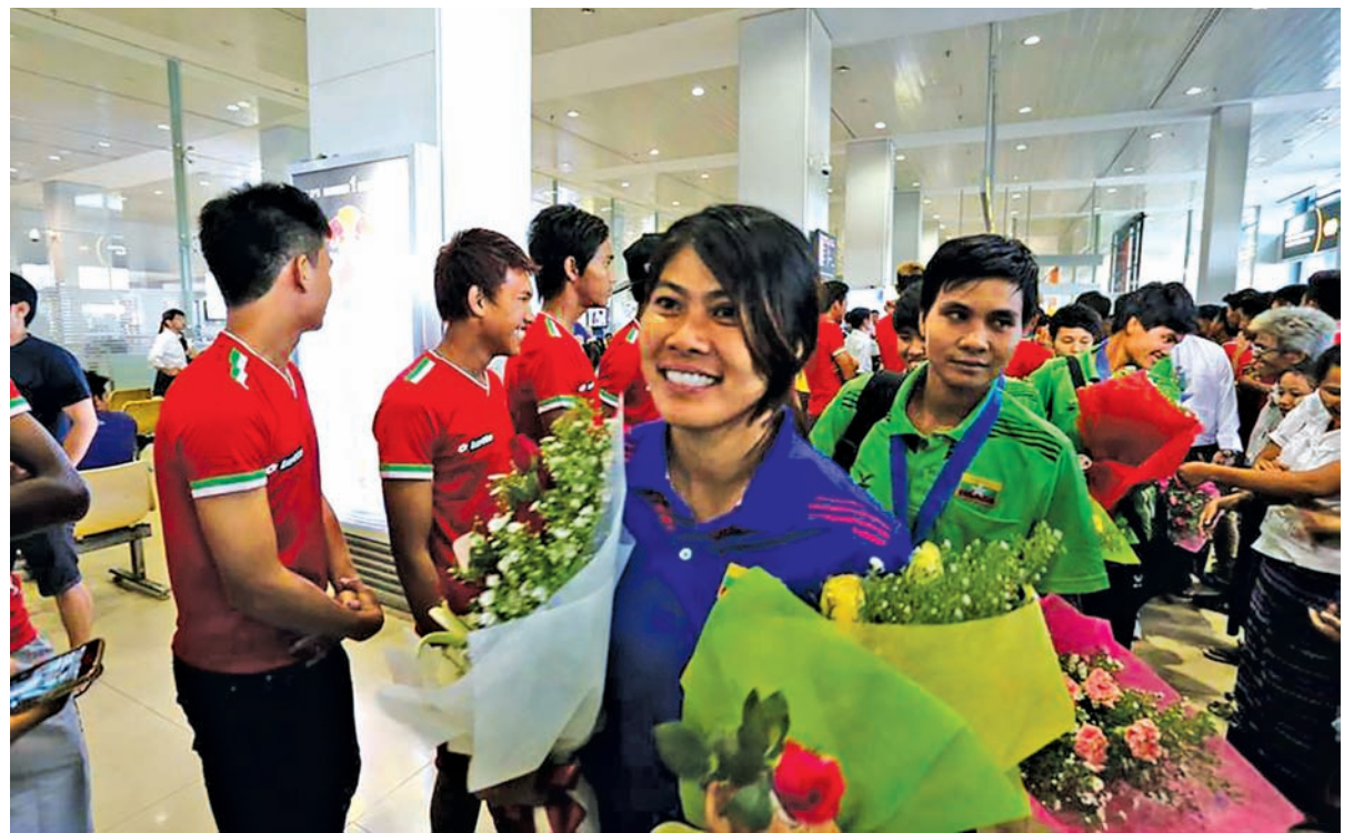
Players of silver medalist Myanmar women's football team in AFF Women's Championship 2015 being welcomed back at Yangon International Airport by officials of Myanmar Football Federation, staff of Ayeyawady Bank, players of Myanmar U-19 women's team and Myanmar U-18 men's team and families on 11 May afternoon.