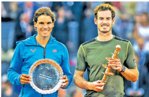
Britain's Andy Murray (R) and Spain's Rafael Nadal hold their trophies after their final match at the Madrid Open tennis tournament in Madrid, Spain on 10 May, 2015.

It was Murray's 10 th Masters crown and 33 rd career title, while Nadal missed out on a record-extending 28 th Masters and 66 th title overall. Nadal needed a win to stay fourth in the world rankings and he will drop to seven when they are updated, putting him outside the top five for the first time in a decade.—Reuters