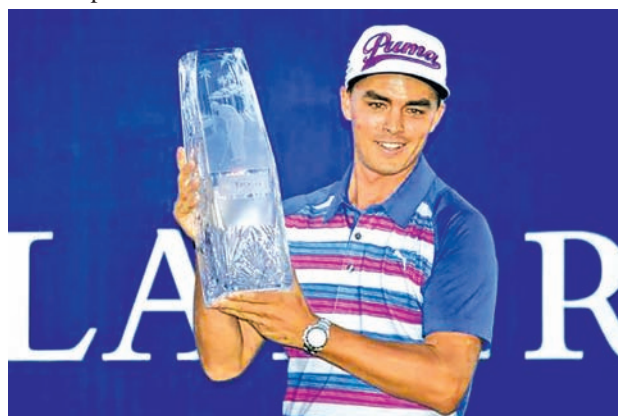
Rickie Fowler holds up The Players Championship trophy after winning the final round of The Players Championship at TPC Sawgrass, Stadium Course, Ponte Vedra Beach, FL, USA on 10 May, 2015.

"I wasn't able to end up as the last guy standing then but it feels good to be back in that position, and I'm hoping to be back in the same position more often."