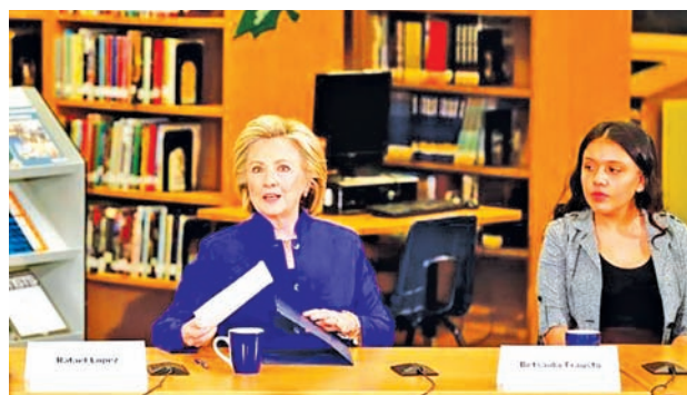
Former US Secretary of State Hillary Clinton (L) takes part in roundtable of young Nevadans discussing immigration as she campaigns for the 2016 Democratic presidential nomination at Rancho High School in Las Vegas, Nevada on 5 May, 2015.

The foundation's acknowledgement means precise totals for government grants to the charity for the last three years of Clinton's four-year tenure as secretary of state have still not been publicly disclosed. All US charities have to separately disclose each year how much they get in government funding, both domestic and foreign. Shortly before taking office in 2009, Clinton promised the Obama administration heightened transparency concerning donors to her family's charities to avoid accusations of