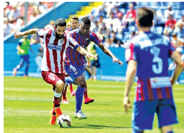
Atletico Madrid's Arda Turan (L) and Levante's Kalu Uche fight for the ball during their Spanish first division soccer match at the Ciudad de Valencia stadium in Valencia, Spain on 10 May, 2015.