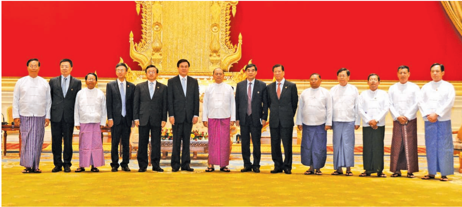
President U Thein Sein poses for documentary photo with State Councillor and Secretary General of China's State Council Mr. Yang Jing.

NAY PYI TAW, 11 May — President U Thein Sein welcomed the State Councillor and Secretary General of China's State Council Mr. Yang Jing, at the Presidential Palace on Monday.