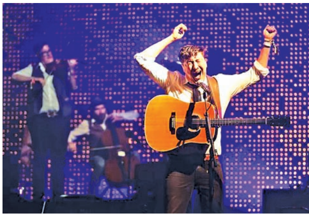
Marcus Mumford, lead singer of Mumford & Sons, performs on the Pyramid Stage at the Glastonbury music festival at Worthy Farm in Somerset on 30 June, 2013.

LONDON, 11 May — Folk-rock band Mumford & Sons captured top spot in the UK album charts on Sunday with their third album “Wilder Mind”, the Official Charts Company said, matching the success of its predecessor “Babel”. British band Blur slipped a place to number two with “The Magic Whip”, their first chart-topping album in 12 years. Sam Smith’s “In The Lonely Hour” bounced to number three, and Ed Sheeran’s “x” climbed three places to four. Sia’s “1,000 Forms