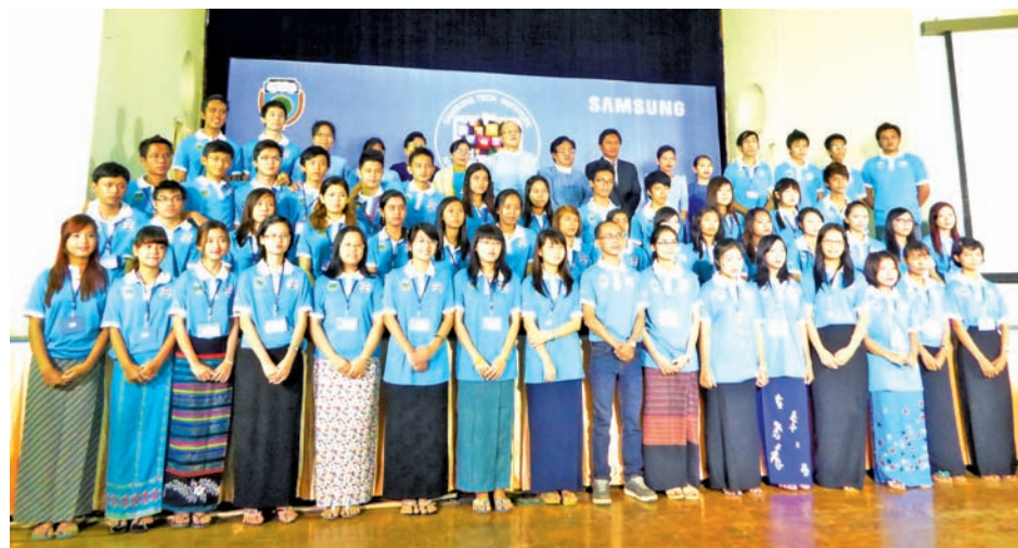
Officials from Samsung Electronics and universities together with selected students for Android mobile application development training are in group photo.