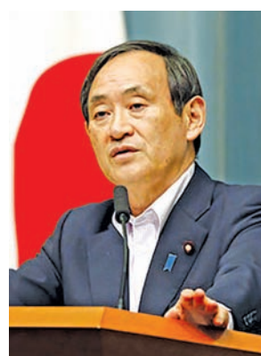
Photo taken on 11 May, 2015, shows Chief Cabinet Secretary Yoshihide Suga attending a press conference at the prime minister's office in Tokyo.

During Thursday's meeting, the Cabinet will also give approval for the swift dispatch of the SDF