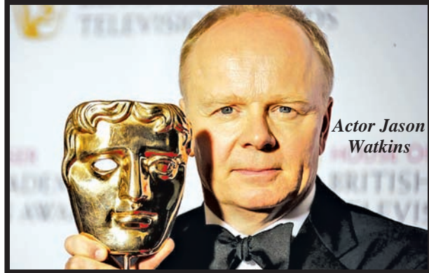
Actor Jason Watkins