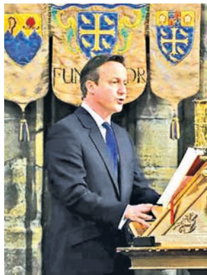
Britain's Prime Minister David Cameron

But he faces a strong contingent of doubters within his own party who loathe what they see as the dead hand of Brussels bureaucracy and will take plenty of convincing to accept anything other than a British exit.