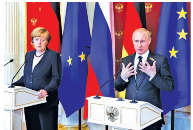
Russian President Vladimir Putin and German Chancellor Angela Merkel attend a news conference after talks at the Kremlin in Moscow, Russia on 10 May, 2015.

Moscow, 11 May — Russian President Vladimir Putin said after talks with German Chancellor Angela Merkel on Sunday that the peace process in eastern Ukraine was progressing despite difficulties.