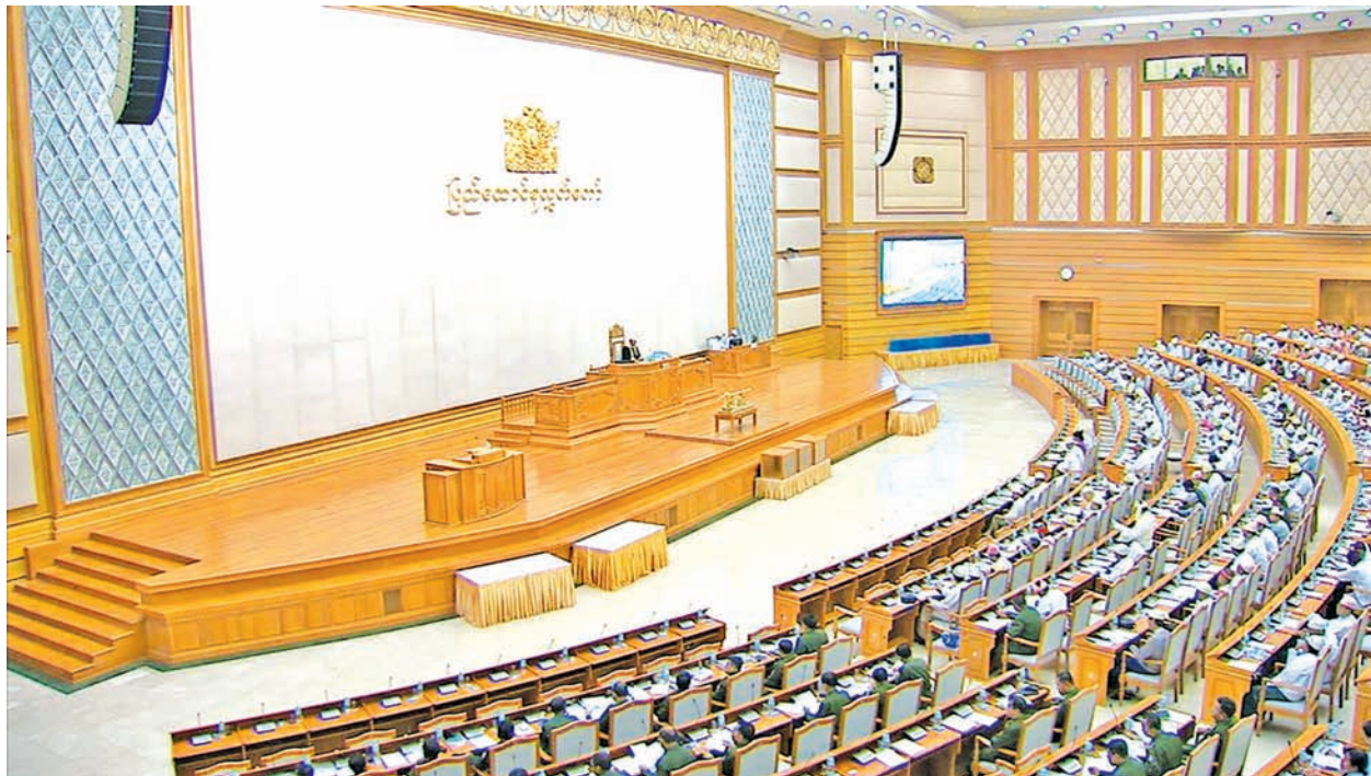
Pyidaungsu Hluttaw representatives attend 43 rd day session—MNA