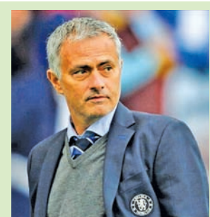
Chelsea manager Jose Mourinho

Chelsea have 84 points from 36 games, 11 more than second-placed Man-