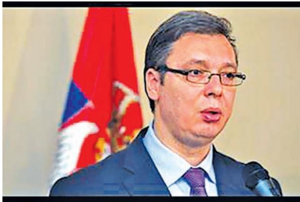
Serbian Prime Minister Aleksandar Vucic

BELGRADE, 11 May — Serbia sacrificed itself in WWII for the great idea of anti-fascism, which lies at the foundation of today's Europe, Serbian Prime Minister Al-