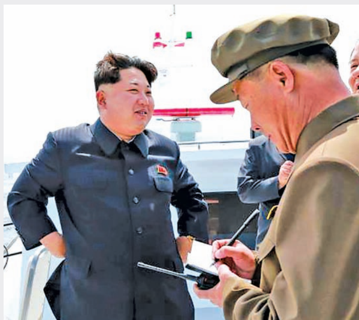
North Korean leader Kim Jong Un watches the test-fire of a strategic submarine underwater ballistic missile (not pictured), in this undated photo released by North Korea’s Korean Central News Agency (KCNA) in Pyongyang on 9 May, 2015.

SEOUL, 11 May — North Korea could build a fully operational submarine equipped with ballis-