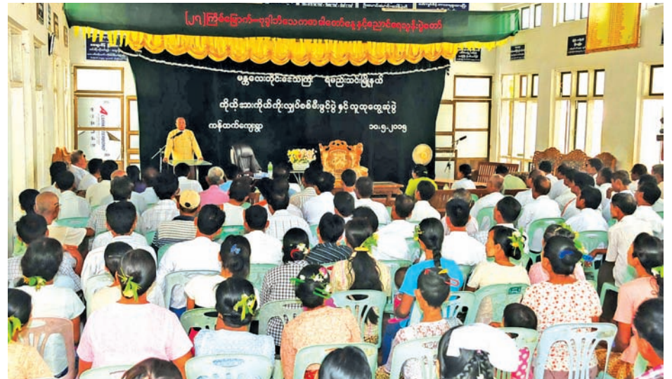
Speaker U Khin Aung Myint meets local residents at launching of electricity supply in rural area of Yamethin Township.

NAY PYI TAW, 10 May — As supply of electricity contributes to development of industries by creating job opportunities for local residents, it needs to efficiently use electricity in their works, Speaker of Amyotha Hluttaw U Khin Aung Myint told the ceremony to launch electrification on a self-reliant basis in Kyanbin Village, Yamethin Township, on Sunday.