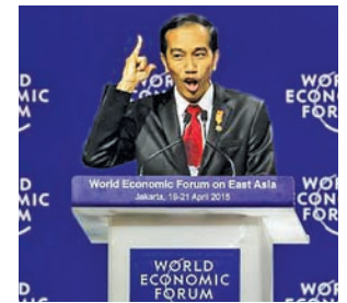
Indonesia's President Joko Widodo

JAKARTA, 10 May — Indonesia's president said on Sunday that foreign journalists no longer need special permission to travel to the politically-sensitive Papua province, lifting decades-old restrictions imposed due to a long simmering secessionist movement.