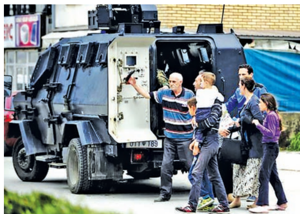
People are evacuated with an armoured vehicle near a police checkpoint in Kumanovo, Macedonia on 9 May, 2015.