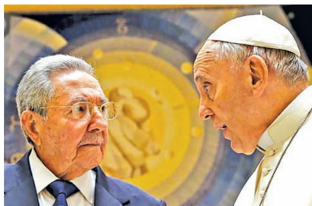
Pope Francis meets Cuban President Raul Castro during a private audience at the Vatican on 10 May, 2015.

VATICAN CITY, 10 May — Pope Francis, who helped broker a historic thaw between the United States and Cuba, held talks with Cuban President Raul Castro on Sunday ahead of the pontiff's trip to both countries in September.