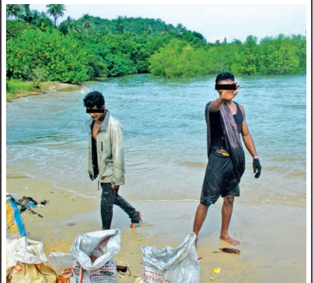
Two persons seen with bags of sand on beach of Salon Island in Kawthoung Township.