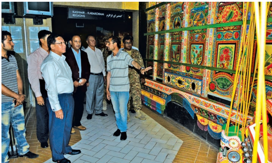
Senior General Min Aung Hlaing views round paintings at Lok Virsa National Heritage Museum in Islamabad.