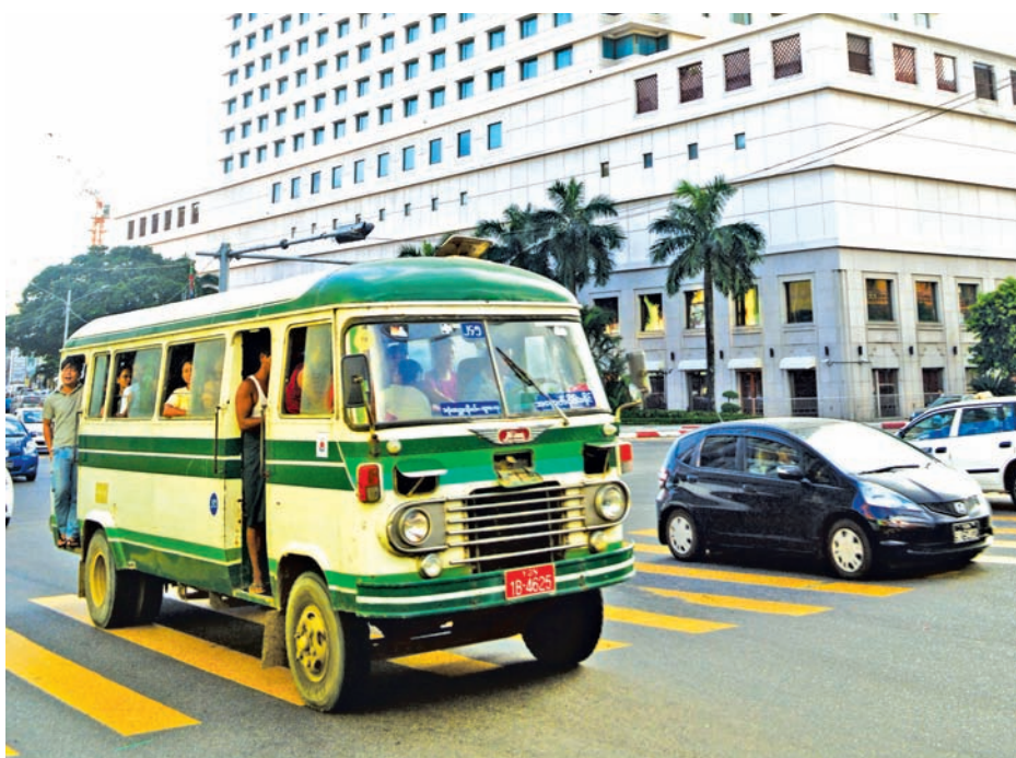
Just more than 3,000 buses of All Bus-Line Control Service can operate daily due to the scarcity of drivers and conductors and the difficulty in securing a license for running bus services.

Established in 2010, VIP is also planning to offer scholarships to needy outstanding students across the nation. It is currently providing financial assistance to two university students.—GNLM