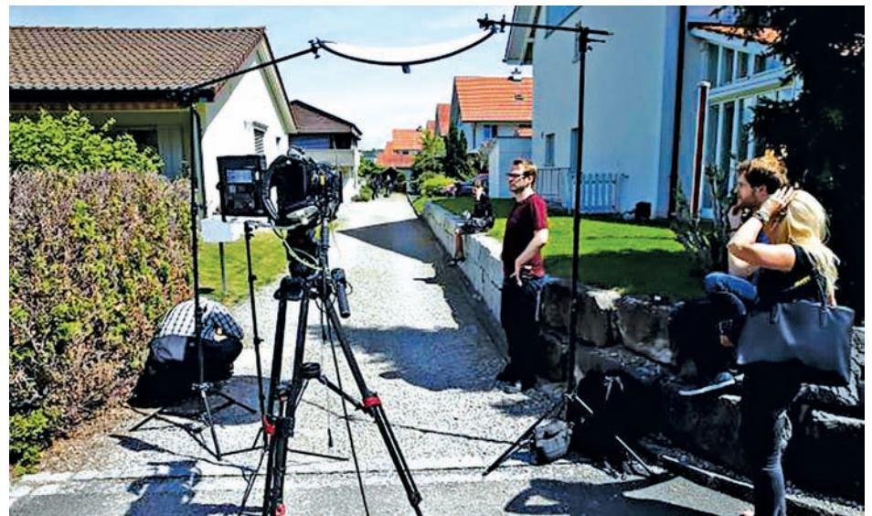
TV crews prepare for a statement in front of a house in Wuerenlingen, Switzerland on 10 May, 2015.