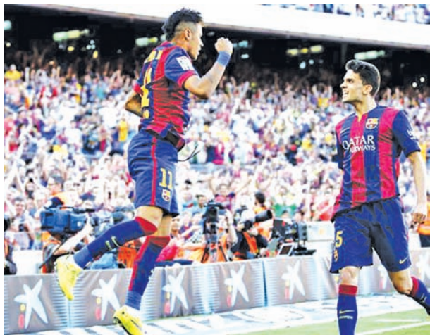
Barcelona's Neymar (L) celebrates his goal against Real Sociedad with teammate Marc Bartra during their Spanish first division soccer match at Nou Camp stadium in Barcelona, Spain, on 9 May, 2015.

MADRID, 10 May — Real Madrid's hopes of overhauling La Liga leaders Barcelona suffered a stinging blow when they were held to a 2-2 draw at home to Valencia on Saturday to slip four points behind their arch rivals with two games left.