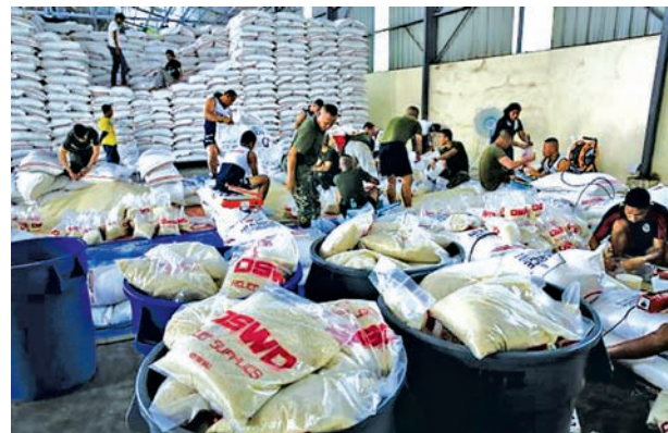
Members of the Armed Forces of the Philippines help out volunteers repacking food rations for victims of Typhoon Noul at the Department of Social Welfare Development (DSWD) headquarters in Pasay city, south of Manila on 9 May, 2015.

But British-based Tropical Storm Risk forecast the super typhoon would just miss Philippine provinces and veer north over the East China Sea towards Japan. More than 5,000 passengers and about 100 vessels were stranded in various ports in the country as of Saturday, mostly along its eastern seaboard. Airline Cebu Pacific cancelled at least six domestic flights to the northern Philippines. Officials in northern Philippine provinces have alerted rescue units and positioned relief goods. The government readied trucks to ferry people away