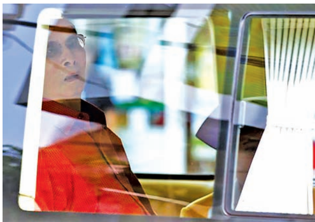
Thailand's King Bhumibol Adulyadej sits in a vehicle as he leaves Siriraj Hospital in Bangkok, Thailand on 10 May, 2015.

The monarch made a rare public appearance last week when he attended a ceremony marking his official coronation in 1950 at the