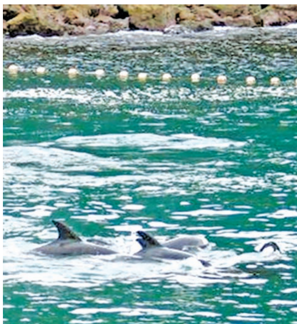
File photo taken in September 2006 shows dolphin hunting off the coast of Taiji, Wakayama Prefecture. The World Association of Zoos and Aquariums suspended its Japanese member in April 2015 on the grounds that Japanese aquariums have “violated the code of ethics” by using dolphins caught during a hunt in Taiji, which has drawn international criticism.

The issue was discussed again in November at WAZA’s international conference, where the Japanese side failed to agree to restrict taking animals from such hunting practices, the statement said. “WAZA’s mission is to serve as the voice of a worldwide community of zoos and aquariums and a catalyst for their joint conservation action,” it said.