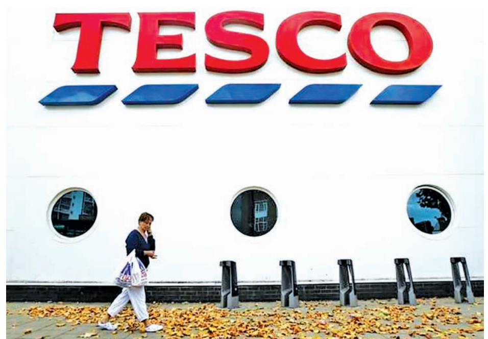
A shopper passes a Tesco supermarket in London on 5 Oct, 2011.

to comment. TalkTalk could not be immediately reached for comment out-