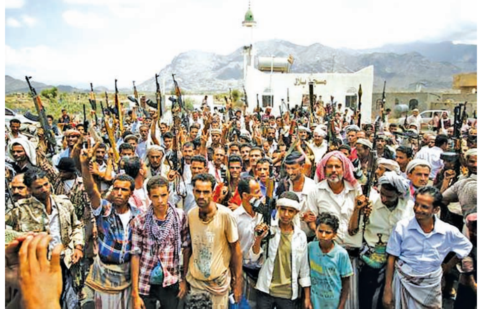
Tribesmen gather to show support to fighters of the anti-Houthi Popular Resistance Committee near Yemen’s southwestern city of Taiz on 9 May, 2015.

cy Khabar said the former president and his family were unhurt.