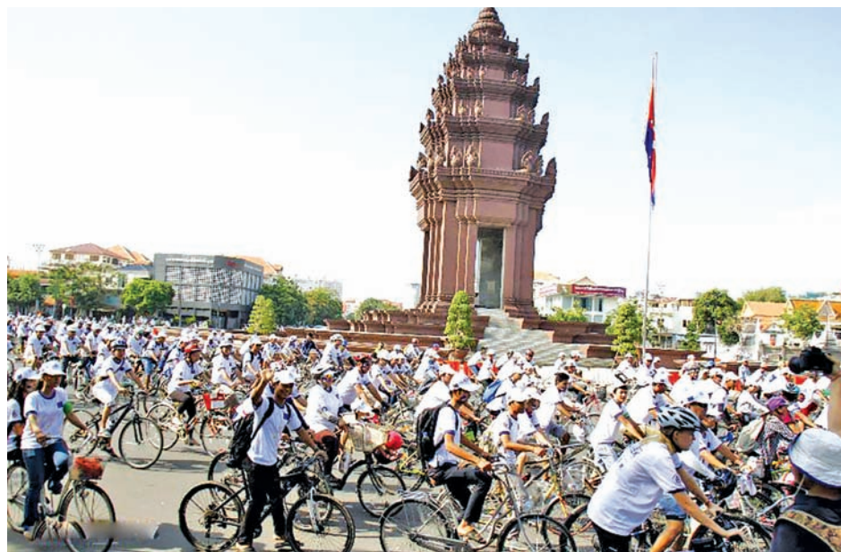
People ride bicycles through streets in Phnom Penh, Cambodia, on 10 May, 2015. Thousands of people in Cambodia cycled on Sunday to mark the Europe Day and to raise awareness of green environment.

Europe Day, 9 May, is celebrated every year in Europe and throughout the world in remembrance of the historical speech of Minister Robert Schuman in 1950, which triggered the European Union's construction.—Xinhua