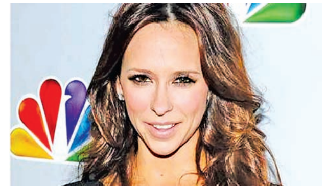
Actress Jennifer Love Hewitt

LOS ANGELES, 10 May — Pregnant actress Jennifer Love Hewitt has left the TV show "Criminal Minds" a season after she joined it.