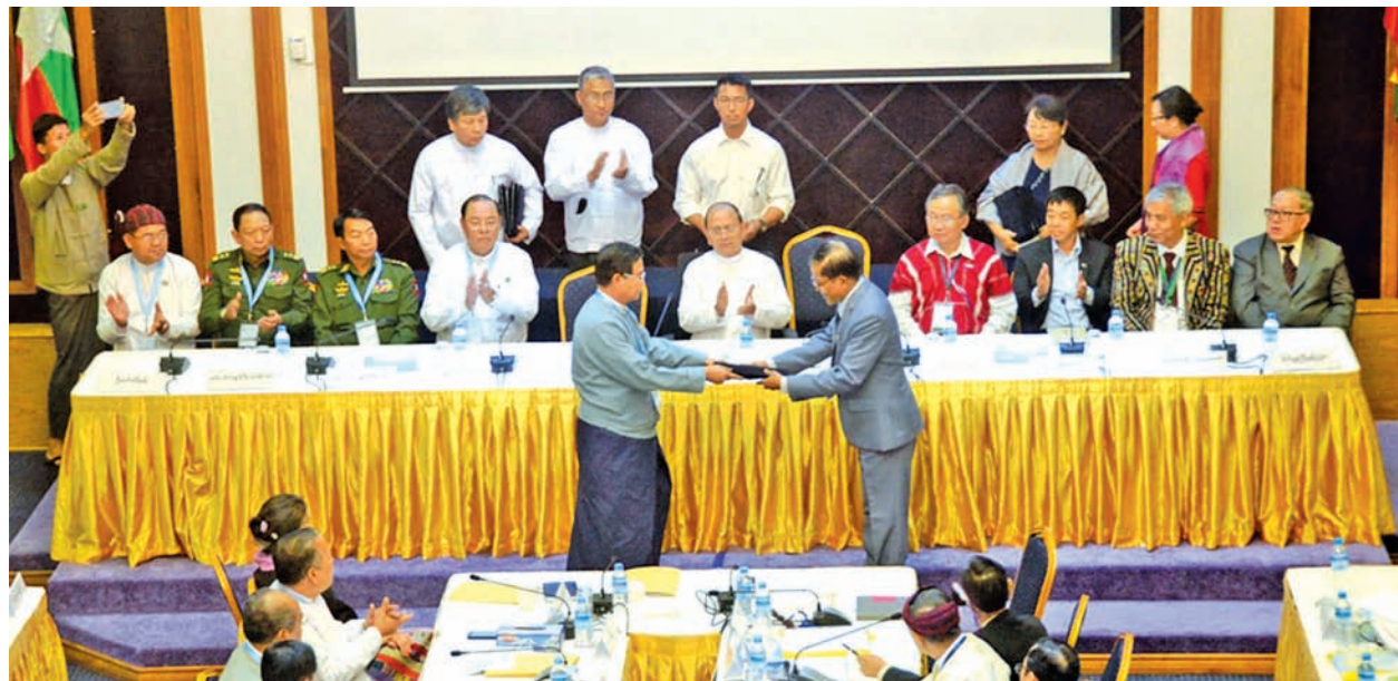
President U Thein Sein attends signing of draft nationwide ceasefire agreement between NCCT and UPWC on 31 March 2015.

“Invitations will be sent to all ethnic groups, both members and non-members of NCCT, a