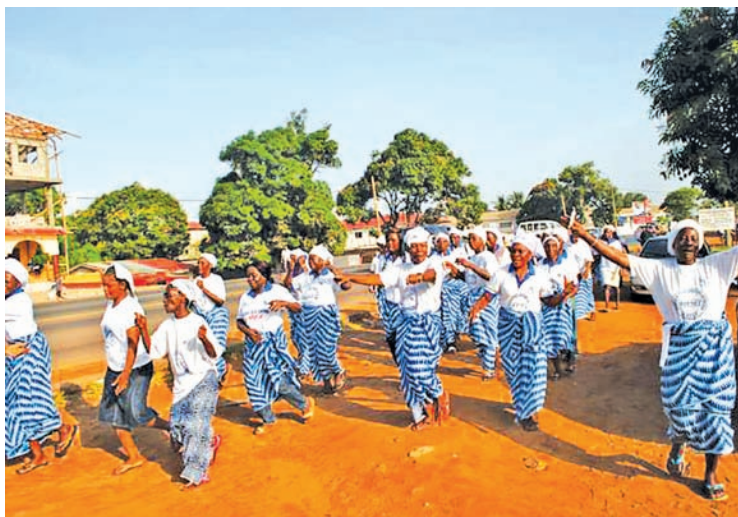
Women from an evangelical Christian community locally referred to as ‘prayer warriors’ celebrate after the WHO declared the country Ebola-free in Monrovia, Liberia on 9 May, 2015.

Also critical in Liberia was the government’s national aware-