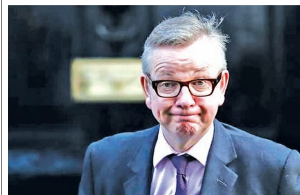
Britain's Conservative Party's Chief Whip Michael Gove leaves 10 Downing Street in central London, on 18 March, 2015.

LONDON, 10 May — Newly re-elected British Prime Minister David Cameron restored one of his most outspoken and combative allies to a leading cabinet role by naming Michael Gove as justice secretary on Sunday.