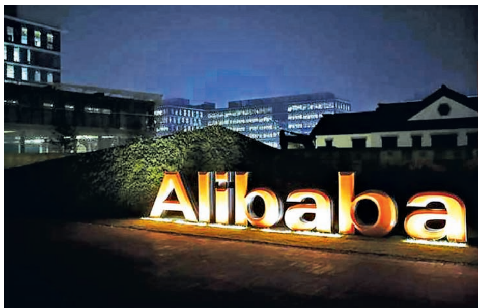
The logo of Alibaba Group is seen inside the company’s headquarters in Hangzhou, Zhejiang Province early on 11 Nov, 2014.

WASHINGTON, 10 May — Chinese e-commerce giant Alibaba Group Holding Ltd has reached a 9.2 percent stake in US online retailer Zulily Inc, after sweeping up shares at rock-bottom prices last week.