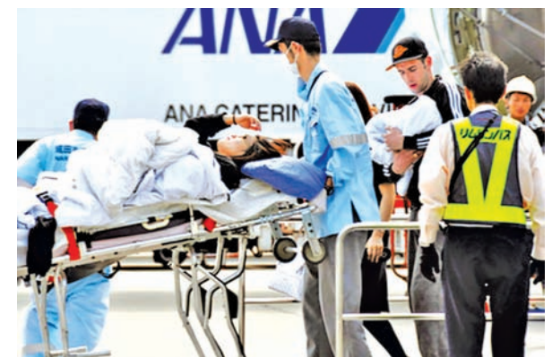
A woman, who gave birth to a baby while flying over the Pacific Ocean aboard an Air Canada Boeing 767 bound for Japan’s Narita airport from Calgary in Canada, is carried by stretcher after arriving at Narita International Airport, near Tokyo, on 10 May, 2015. A man carrying the newborn can be seen to the right. The 23-year-old Canadian mother and baby are in good condition.

The emergency was declared on Flight 9 from Calgary to Narita at about 12:50 pm around 565 kilometres northeast of the Japanese airport and the plane landed an hour later.—Kyodo News