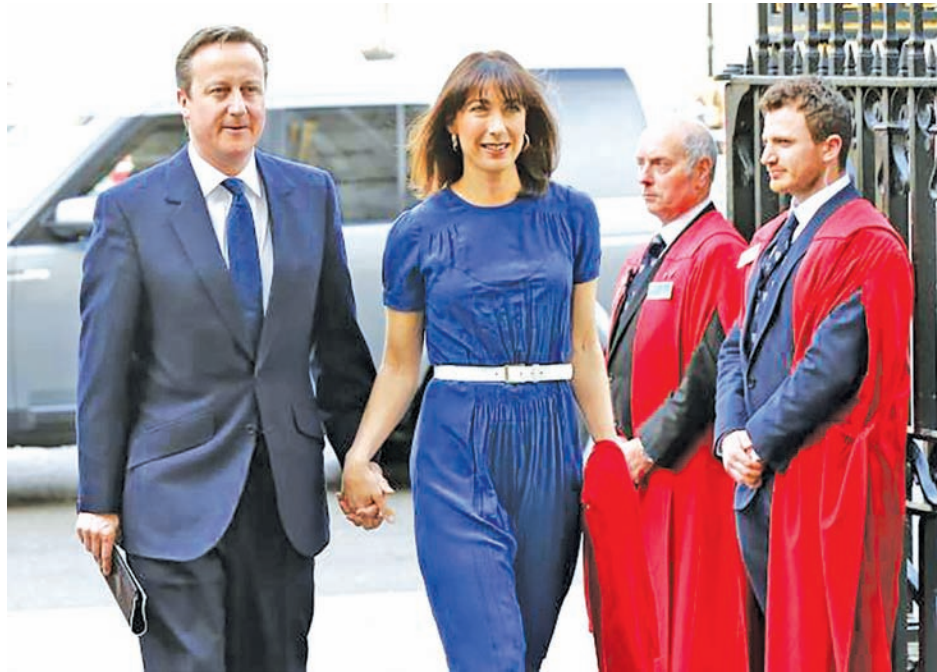
Britain's Prime Minister David Cameron and his wife Samantha arrive at Westminster Abbey for a thanksgiving service on the final day of 70 th anniversary Victory in Europe (VE) day commemorations in central London on 10 May, 2015.

LONDON, 10 May — David Cameron can thank Britain's winner-takes-all voting system for handing him an outright majority in parliament on just 37 percent of the vote. But by boosting the power of Scottish nationalists, it has also intensified one of his biggest headaches.