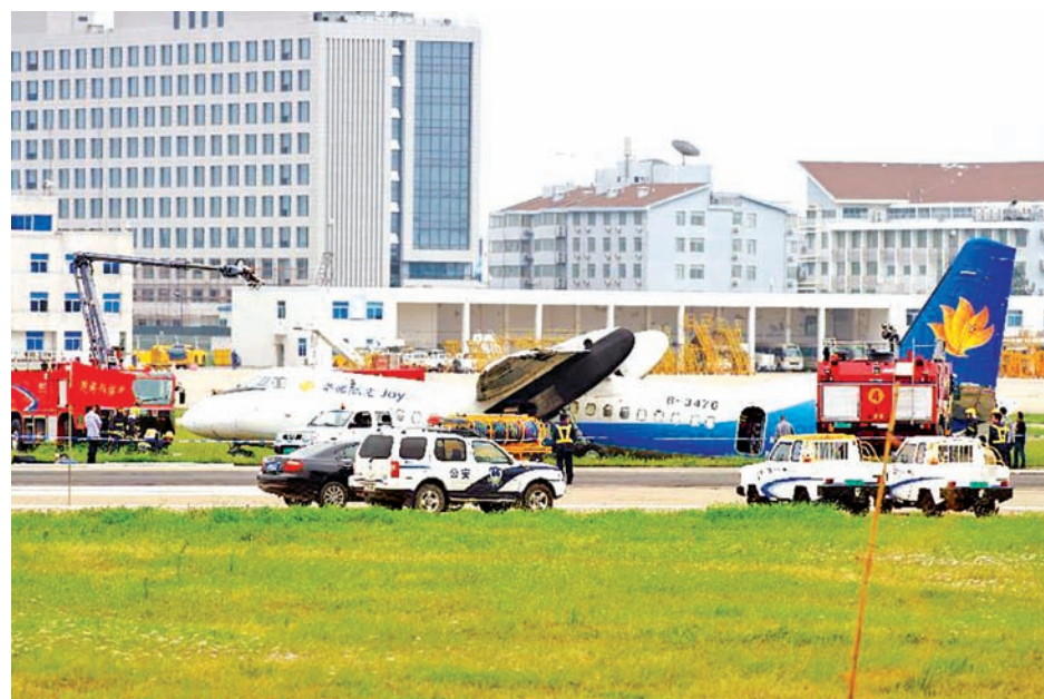
Photo taken on 10 May, 2015 shows the accident scene where a plane skidded off the runway at Changle International Airport in Fuzhou, capital of southeast China’s Fujian Province. A Joyair plane skidded off the runway while taxiing at Changle International Airport on Sunday, leaving five passengers slightly injured.