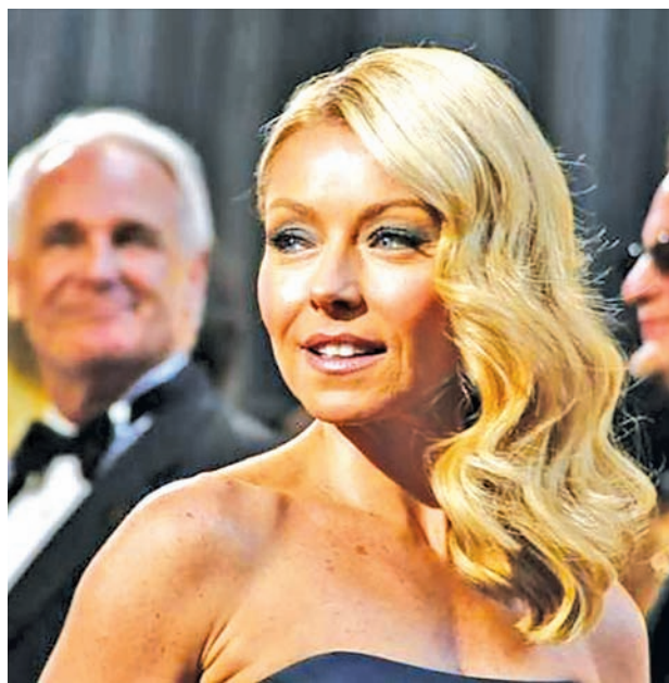
Television personality Kelly Ripa arrives at the 85 th Academy Awards in Hollywood, California on 24 Feb, 2013.