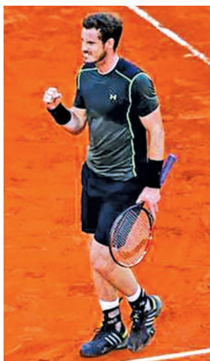
Britain's Andy Murray

high level today to have any chance and I think it was without doubt one of the best matches I have played this year," a jubilant Nadal told Spanish television.