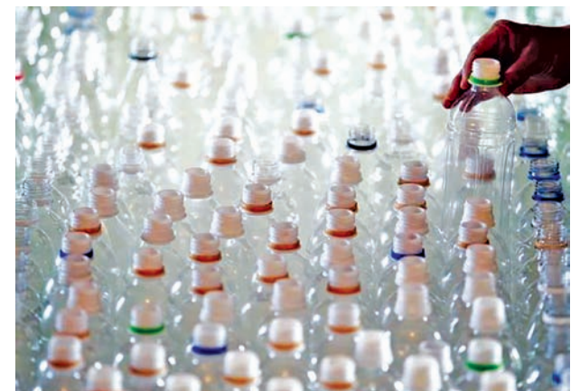
A worker picks up a plastic bottle before a news conference in Taipei on 4 Nov, 2009.