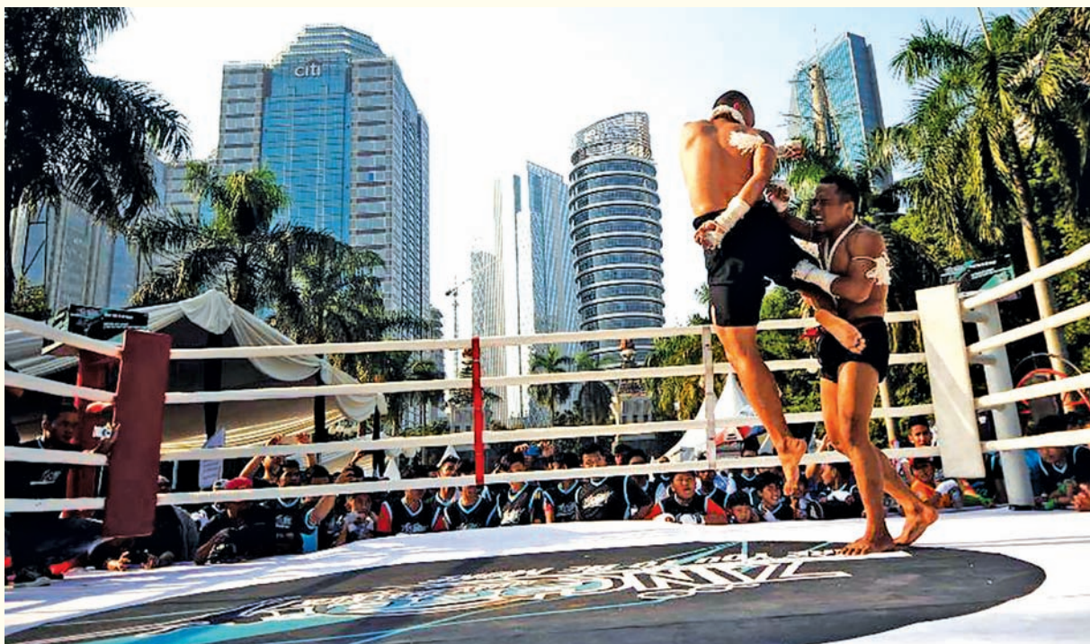
Fighters perform during a Muay Thai kick competition in Jakarta, Indonesia on 10 May, 2015.