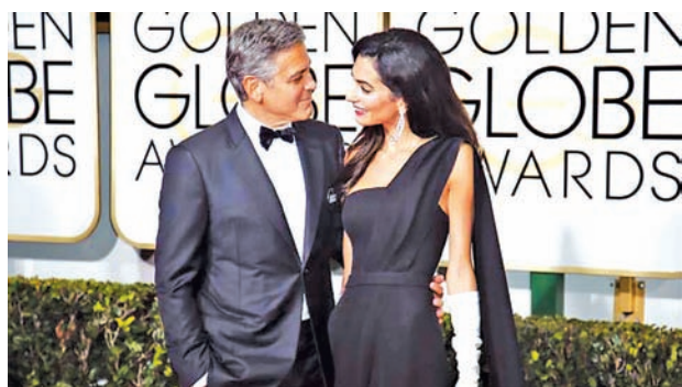
Hollywood star George Clooney & his wife Amal Alamuddin

LOS ANGELES, 10 May — Hollywood star George Clooney is all praise for his wife Amal Alamuddin's beauty, style and her high intelligence.