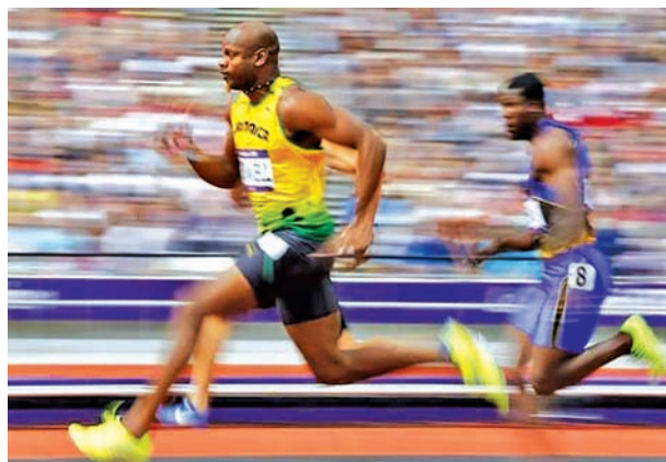
Asafa Powell of Jamaica runs on his way to winning his 100m heat round 1 during the London 2012 Olympic Games at the Olympic Stadium on 4 Aug, 2012.

Diamond League champion Nickel Ashmeade ran 20.25 to win the 200, and Elaine Thompson, already the year's fastest,