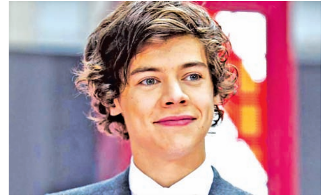
Singer Harry Styles

LONDON, 10 May — Singer Harry Styles has reportedly been giving his One Direction bandmate Louis Tomlinson the cold shoulder after his Twitter spat with former member Zayn Malik.