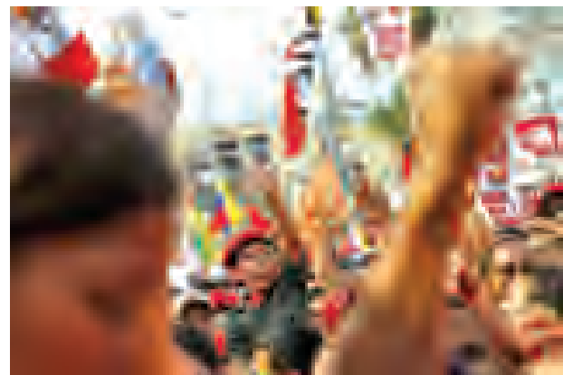
Supporters of Venezuela's President Nicolas Maduro attends a rally to celebrate May Day in Caracas on 1 May, 2015.