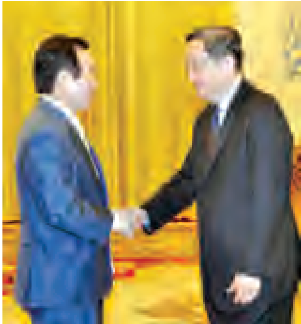
Former Japanese Finance Minister Fukushiro Nukaga (L) and Yu Zhengsheng, ranked fourth in China's Communist Party, shake hands ahead of their talks in Beijing's Great Hall of the People on 8 May, 2015. The meeting between Nukaga and Yu, chairman of the Chinese People's Political Consultative Conference, is the latest sign of increasing high-level exchanges between the two countries.—KYODO NEWS

BEIJING, 8 May — China's fourth highest-ranking leader Yu Zhengsheng said on Friday that Japanese Prime Minister Shinzo Abe needs to more readily admit Tokyo's wartime mistakes.