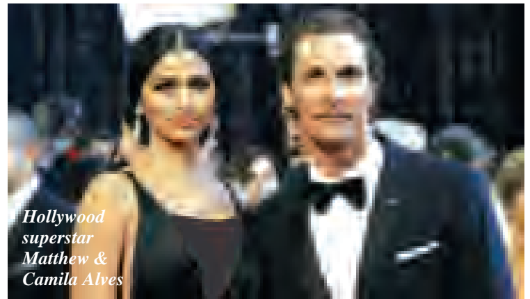
Hollywood superstar Matthew & Camila Alves

LOS ANGELES, 8 May — Hollywood superstar Matthew McConaughey says Camila Alves is a huge reason why he is so happy.