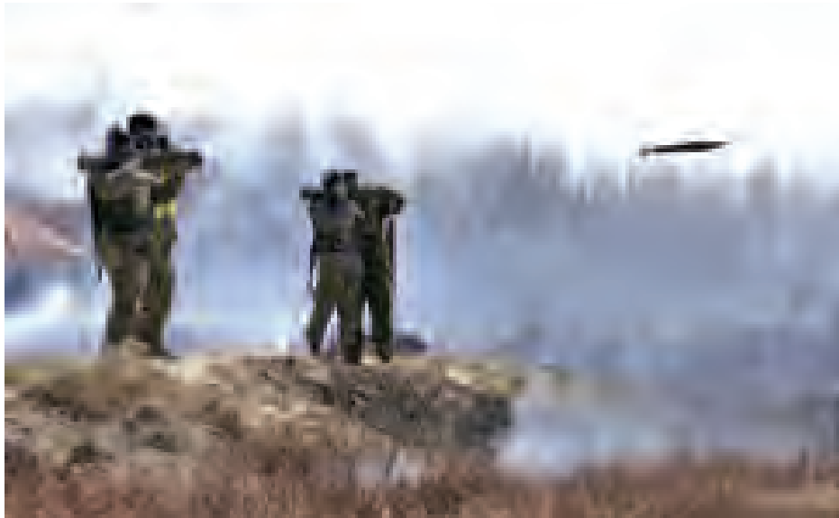
Newly mobilized Ukrainian paratroopers fire anti-tank grenade launchers during a military drill near Zhytomyr on 9 April, 2015.