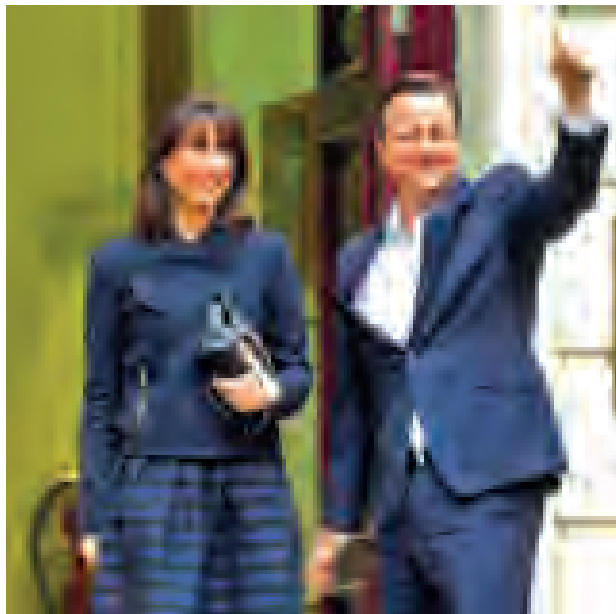
Prime Minister David Cameron gives a thumb up as he arrives with his wife Samantha at the Conservative Party headquarters in London, Britain on 8 May, 2015.