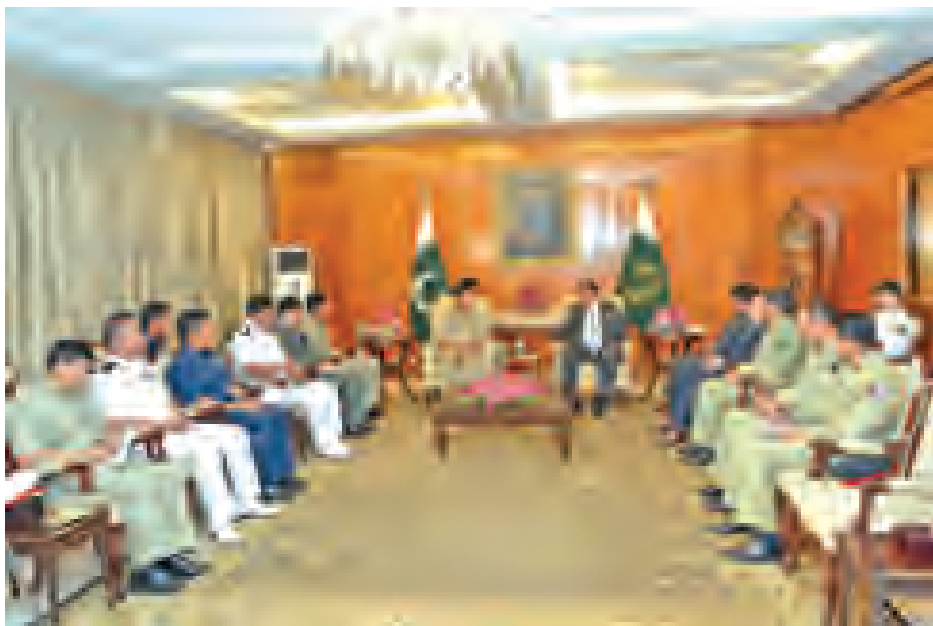
Senior General Min Aung Hlaing meets Pakistan's President Mr Mamnoon Hussain.

ISLAMABAD, 8 May—Commander-in-Chief of Defence Services Senior General Min Aung Hlaing called on Pakistan's President Mr Mamnoon Hussain at his office in Islamabad on Thursday. They discussed further strengthening bilateral relations and trade.