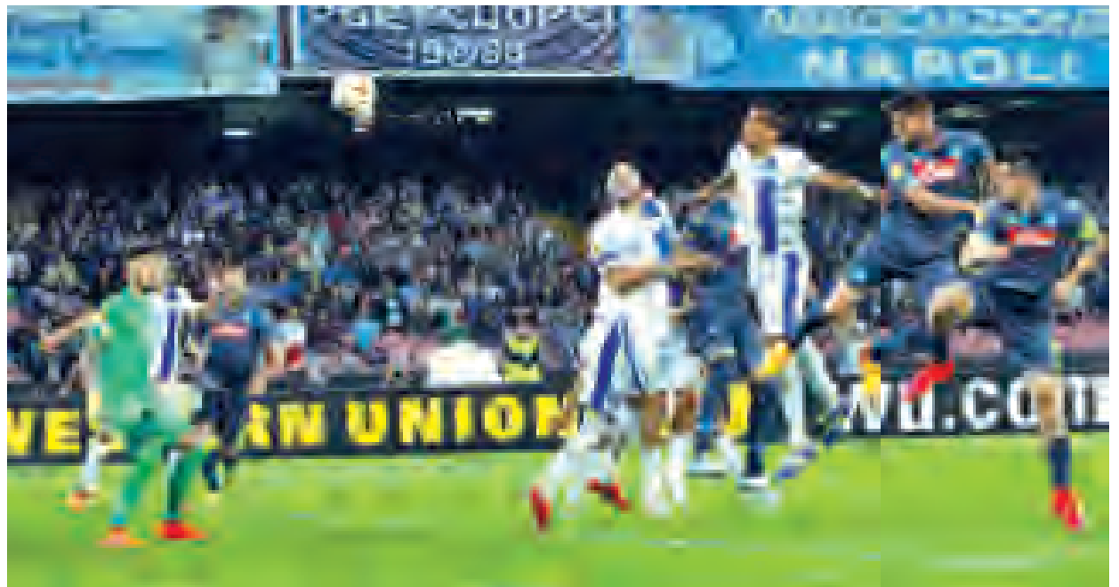
Napoli's Silva David Lopez (2 nd R) heads the ball to score against Dnipro during their Europa League semi-final first leg soccer match at the San Paolo stadium in Naples, Italy, on 7 May, 2015.