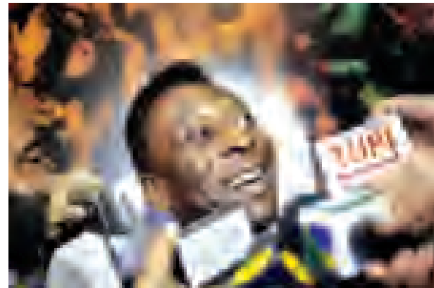
Legendary Brazilian soccer player Pele speaks to journalists during an exhibition.

Pele, whose given name is Edson Arantes do Nascimento, was released from the same hospital in early December following a two-week stay with kidney problems. With more than