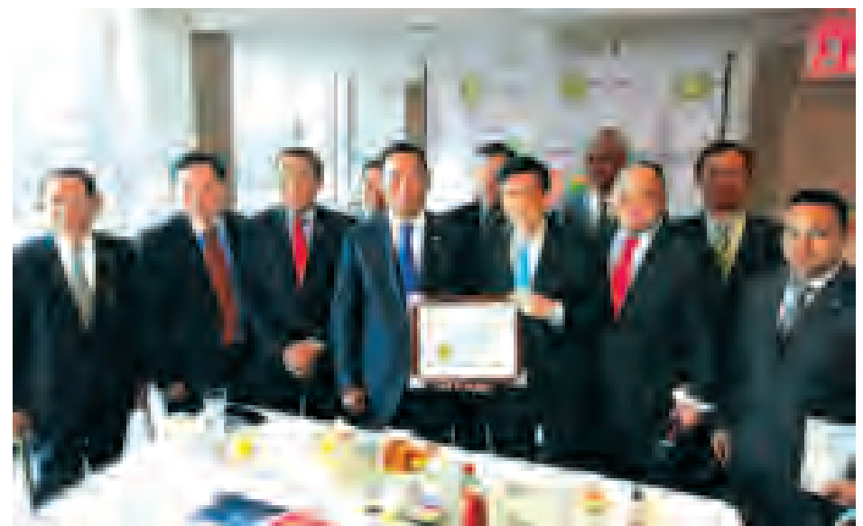
Speaker Thura U Shwe Mann seen with officials of Myanmar-US Chamber of Commerce (New York).

YANGON, 8 May — Speaker of Pyidaungsu Hluttaw and Pyithu Hluttaw Thura U Shwe Mann and party arrived at Yangon International Airport via Incheon International Airport of Republic of Korea on Thursday evening.