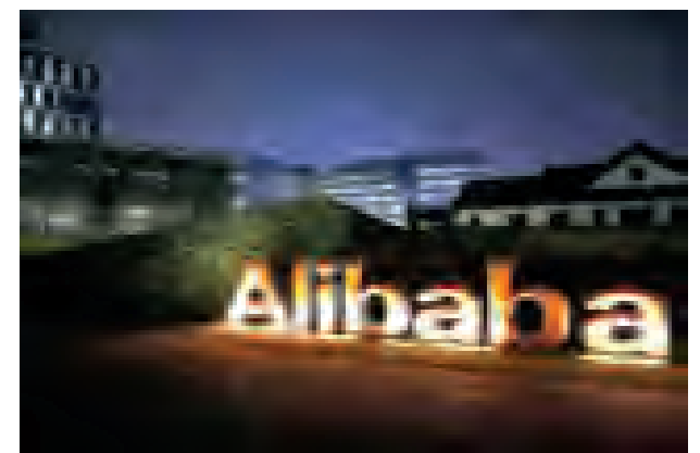
The logo of Alibaba Group is seen inside the company's headquarters in Hangzhou, Zhejiang Province early on 11 Nov, 2014.

All the sources involved in the process declined to