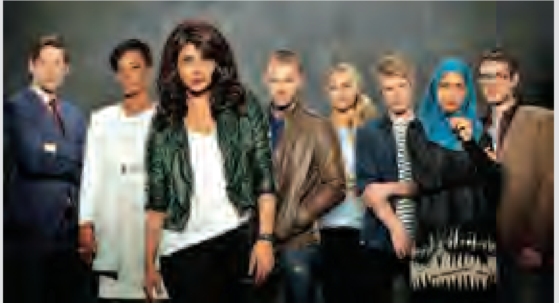
Actress Priyanka Chopra's debut American TV project "Quantico" is set to air this fall.

MUMBAI, 8 May — Actress Priyanka Chopra's debut American TV project "Quantico" is set to air this fall.