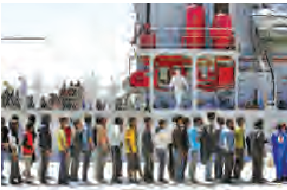
Migrants are disembarked from the Italian navy ship Vega in the Sicilian harbour of Augusta, southern Italy, on 4 May, 2015.

ROME, 8 May — Italy's navy said on Thursday it believed it had found the wreck of a boat that sank last month killing up to 900 migrants off the coast of Libya, the Mediterranean's most deadly migrant tragedy in living memory.