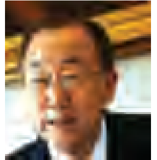
United Nations Secretary-General Ban Ki-moon

UNITED NATIONS, 8 May — United Nations Secretary-General Ban Ki-moon said on Thursday that after a new Israeli government has been sworn in he will investigate whether there are "realistic options" for a return to peace talks between Israel and the Palestinians.