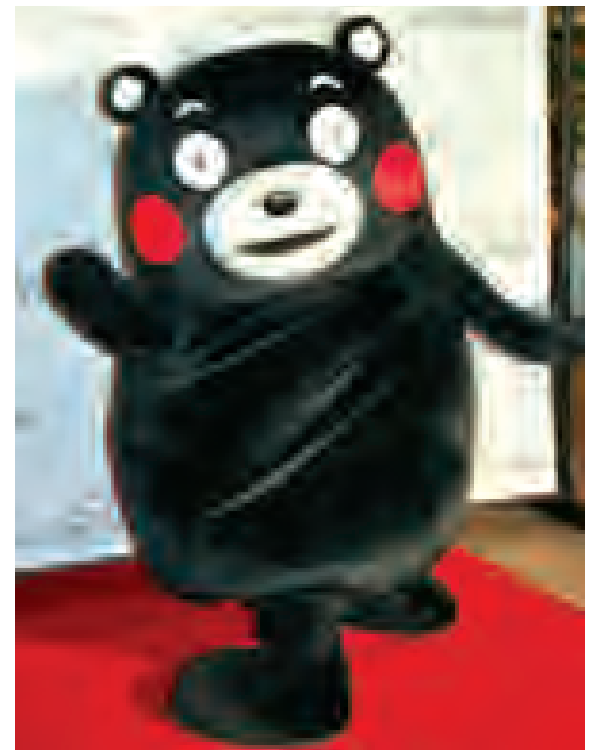
File photo taken on 19 Nov, 2014, shows “Kumamon,” one of the most popular regional mascots created by Japan’s southwestern prefecture of Kumamoto. Kumamoto Gov Ikuo Kabashima said on 7 May, 2015, that Kumamon will appear at the Japan Pavilion at the Cannes International Film Festival in France.