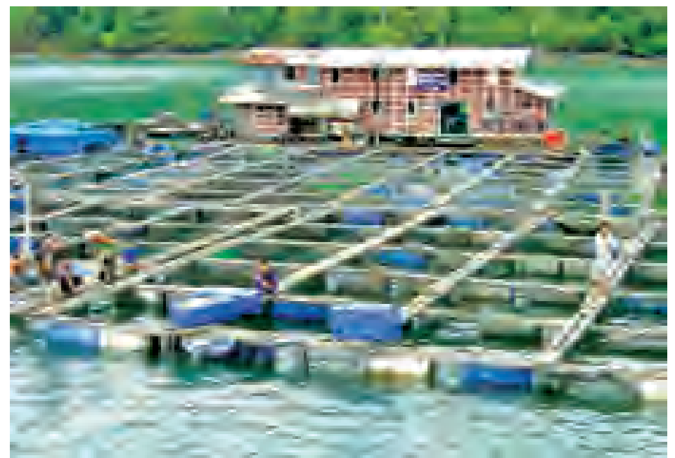
Fish are farmed in an artificial pond in Ayeyawady Region, where fish and shrimp farming businesses are likely to receive funding as part of an EU aquaculture project.

According to the ministry's data, aquaculture is integral to the country's fishery sector. Between 1991 and 2013, the area of aquaculture cultivation increased from 12,225 to 180,614 hectares, while production rose from 6,397 to 944,809 metric tons. The sector employed around 130,000 farm workers in 2014.—GNLM