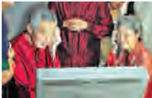
Singapore’s Prime Minister Lee Hsien Loong (L) and his wife Ho Ching attend the opening ceremony of Singapore’s Indian Heritage Centre (IHC), on 7 May, 2015. The Indian Heritage Centre, located in Singapore’s Little India, held an official opening ceremony on Thursday.

SINGAPORE, 8 May — The Indian community has contributed to Singapore “in deep ways,” Singapore’s Prime Minister Lee Hsien Loong said here on Thursday. During the launch of the Indian Heritage Centre which is located at the heart of Little India and blends traditional Indian and modern architectural elements, Lee said that Indians have contributed a lot to Singapore and the four-story centre “affirms the importance and vibrancy of the Indian community in Singapore.”