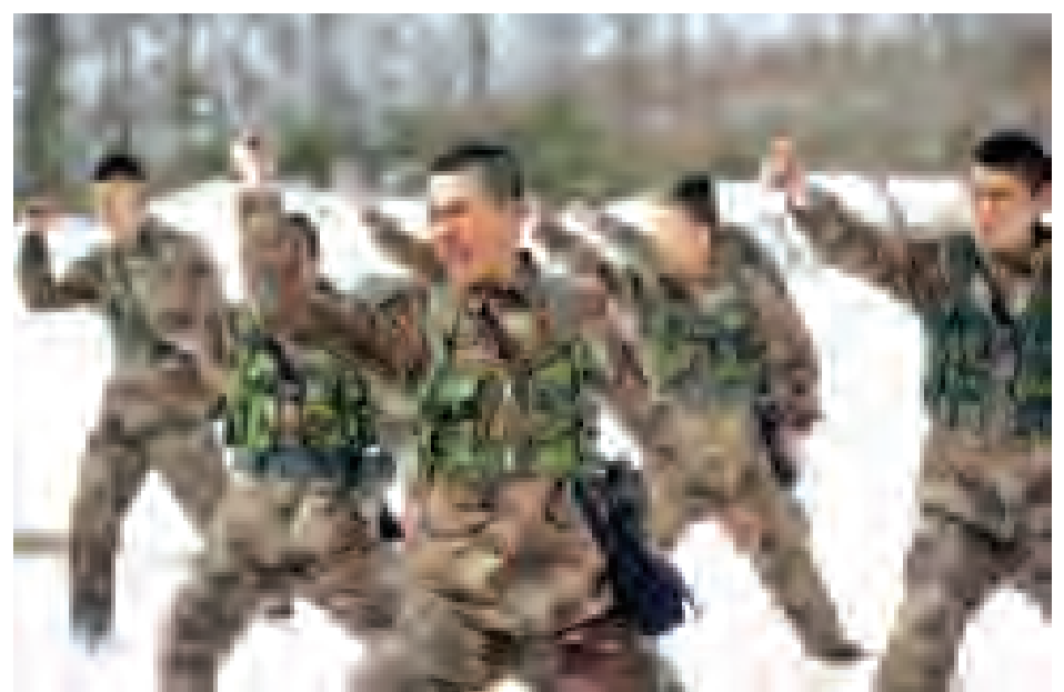
People's Liberation Army (PLA) soldiers shout as they practise with knives during a training session on snow-covered ground at a military base in Heihe, Heilongjiang Province on 18 March, 2015.

China will boost its military spending by 10.1 percent this year to 886.9 billion yuan ($142.86 billion), an increase which will outpace China's slowing, single-digit GDP growth, and builds on a nearly unbroken two-decade run of annual double-digit rises in the defence budget.