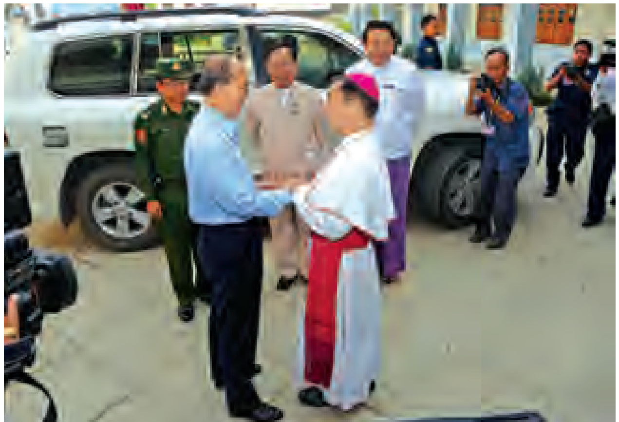
President U Thein Sein cordially greets Catholic Bishop of Kengtung.

In conclusion, the president urged local peo-