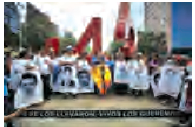
Relatives of missing students of the Ayotzinapa Teacher Training College Raul Isidro Burgos stand in front of a monument of the number 43 during a protest to mark the seven months of the Ayotzinapa students' disappearance in Mexico City on 26 April, 2015.