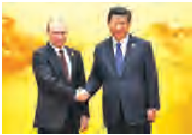
Russia's President Vladimir Putin (L) shakes hands with China's President Xi Jinping during a welcoming ceremony at the Asia Pacific Economic Cooperation (APEC) summit at the International Convention Centre at Yanqi Lake in Beijing, on 11 Nov, 2014.

"The tragedy of war is not allowed to be replayed," said the Chinese president.