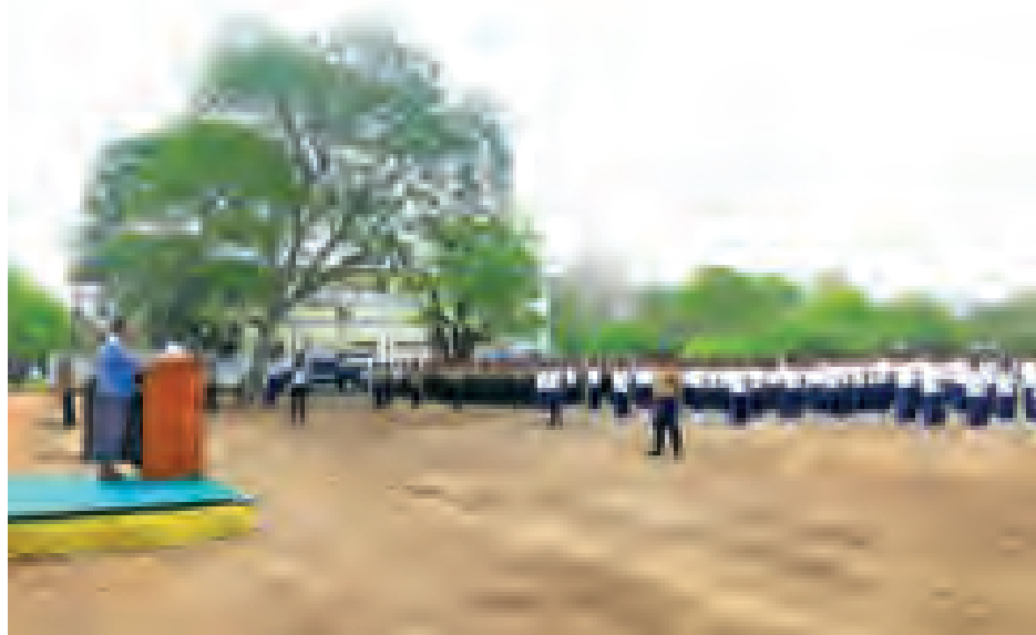
Speaker of Amyotha Hluttaw U Khin Aung Myint meets Red Cross members in Yamethin.—MNA

its office. The speaker said that Myanmar is practising multi-party democracy and market economic system. He invited U.S. businessmen to invest in Myanmar for further strengthening friendly relations through economic cooperation between the two countries.—MNA