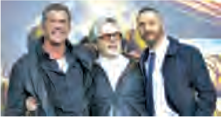
Director of the movie George Miller (C) poses with cast member Tom Hardy (R) and actor Mel Gibson at the premiere of "Mad Max: Fury Road" in Hollywood, California on 7 May, 2015.

LOS ANGELES, 8 May —The much-anticipated rebooted version of "Mad Max" has seen cast members old and new unite on the red carpet with Mel Gibson, who starred in the original 1979 action film, making a surprise appearance.