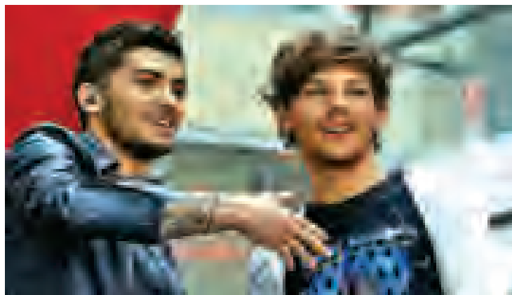
Zayn Malik & Louis Tomlinson