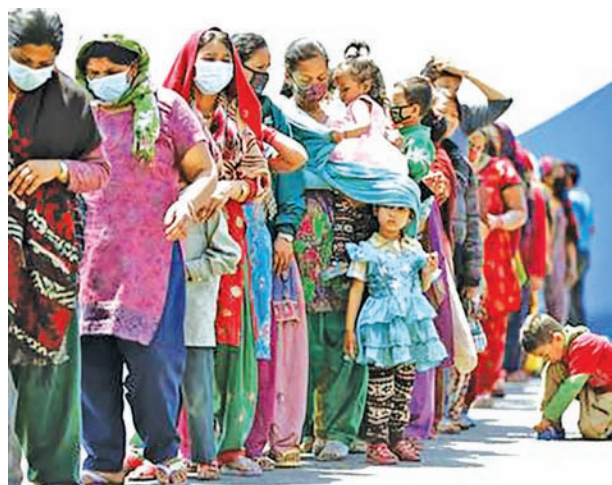
People line up to receive relief supplies in the Nepali capital Kathmandu on 2 May, 2015, a week after a devastating earthquake struck the Himalayan country.