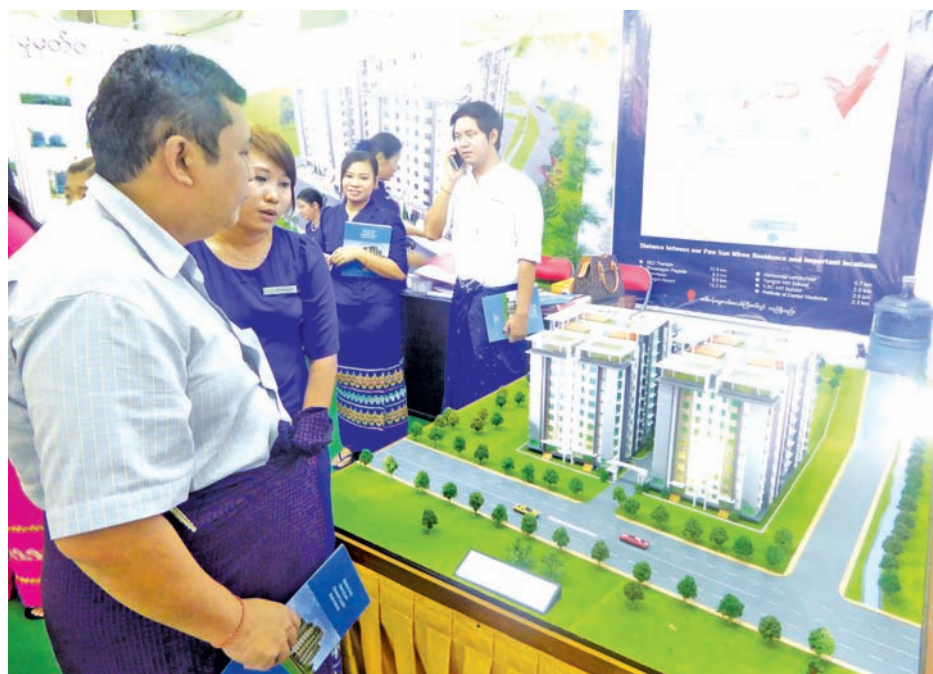
Visitors view scale model of high-rise buildings at Myanmar's biggest property expo.

nies should place emphasis on the safety of construction workers and following international standards