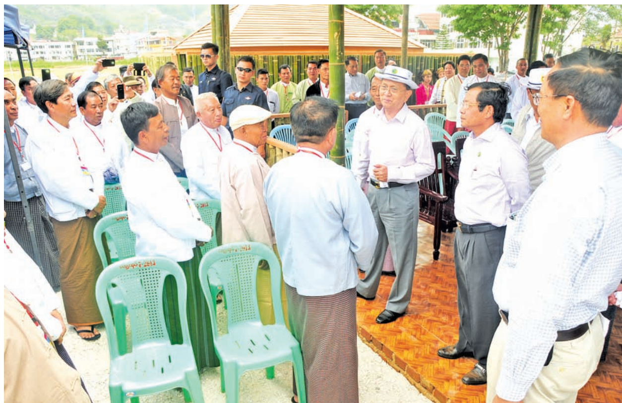
President U Thein Sein cordially meets townselders and local residents in Mogok.

signed in the guest book of the camp before receiving a souvenir of the camp presented by the scouts.