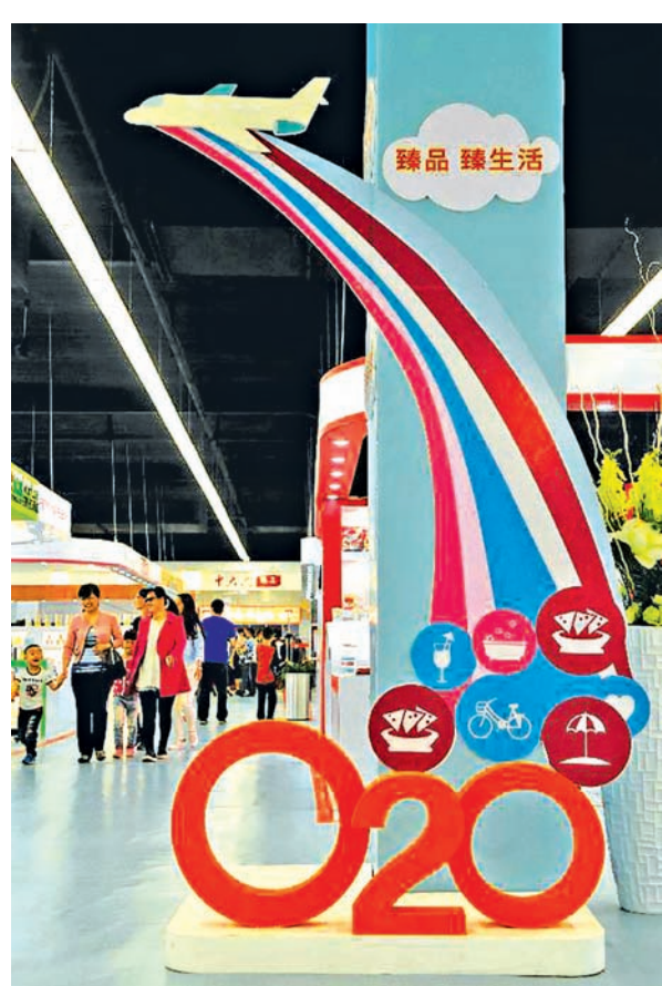
Customers select bonded goods at the Zhongdamen Bonded Commodity O2O shopping centre in Zhengzhou, capital of central China's Henan Province, on 2 May, 2015. As a project of the "Belt and Road", the bonded shopping centre selling bonded goods from over 60 countries and regions opened on Saturday.