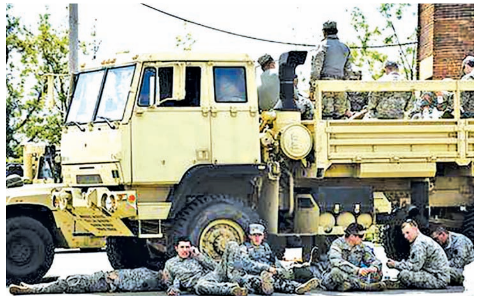
Soldiers rest near the intersection of North and Pennsylvania Avenues in Baltimore on 2 May, 2015.