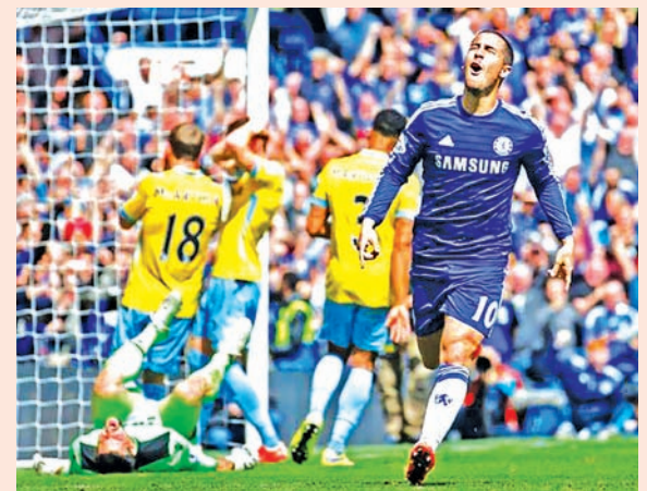
Eden Hazard celebrates scoring the first goal for Chelsea during their Barclays Premier League at Stamford Bridge on 3 May, 2015.

LONDON, 3 May — Chelsea clinched their first Premier League title for five years with a 1-0 victory against Crystal Palace at a jubilant Stamford Bridge on Sunday.