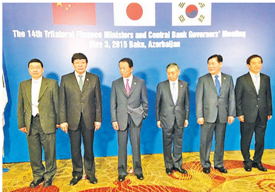
Japanese Finance Minister Taro Aso (3 rd from L) and Bank of Japan Gov Haruhiko Kuroda (3 rd from R) pose for a group photo with their counterparts from China and South Korea in Azerbaijan capital Baku on 3 May, 2015, before their meeting.

"We are committed to continue implementing timely and effective macro-economic policies in order to help boost demand," the statement said.