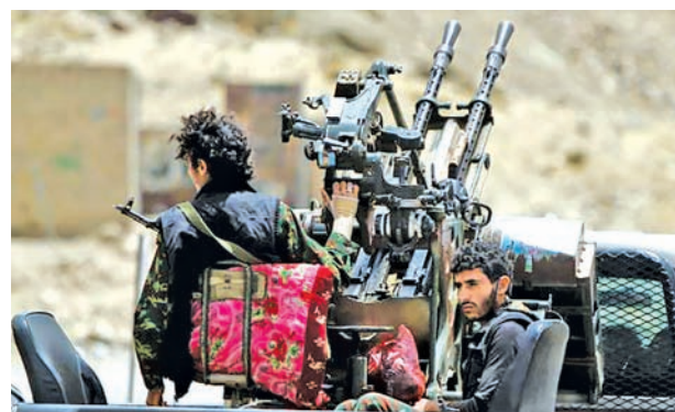
Houthi militants ride in a patrol truck in Sanaa on 2 May, 2015.

Saudi Arabia, which sees itself as the guardian of Sunni Islam, has long vied