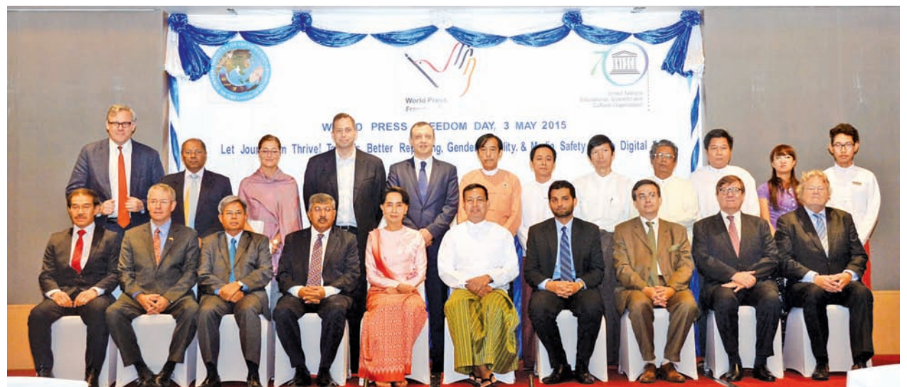
Union Minister U Ye Htut, Pyithu Hluttaw Committee Chairperson Daw Aung San Suu Kyi and officials pose for documentary photo at World Press Freedom Day 2015 ceremony.