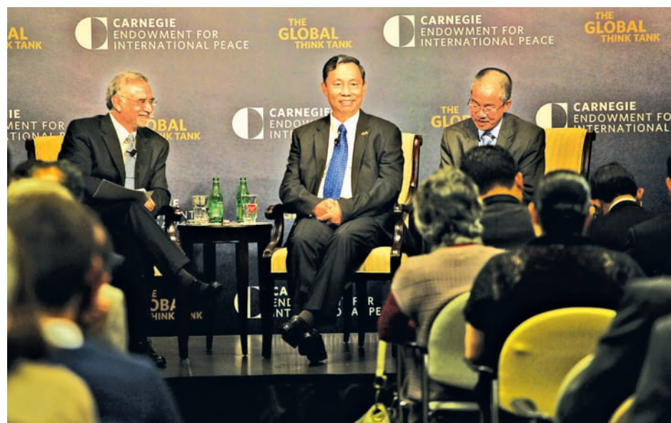
Speaker Thura U Shwe Mann holds talks at seminar on elections at Carnegie Endowment in Washington DC.

WASHINGTON DC, 3 May — Pyidaungsu Hluttaw and Pyithu Hluttaw Speaker Thura U Shwe Mann attended a seminar on Elections 2015 in Myanmar held in the headquarters of