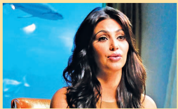
Reality TV star Kim Kardashian

LOS ANGELES, 3 May — Reality TV star Kim Kardashian says even though she loves her platinum blonde hairdo, it has damaged the texture of her hair.