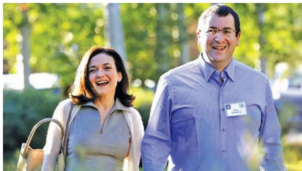
File photo of Sheryl Sandberg, Chief Operating Officer (COO) of Facebook with her husband David Goldberg, CEO of SurveyMonkey in Sun Valley, Idaho on 9 July, 2014.