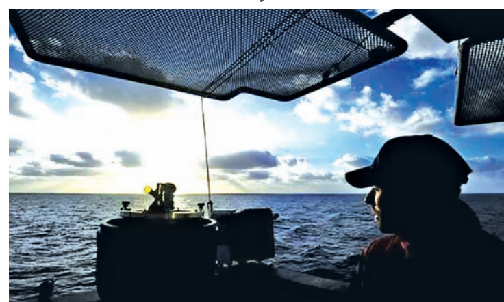
A crew member of Italy's Navy ship San Giorgio watches the sunshine during a patrol in open international waters in the Mediterranean Sea between the Italian and the Libyan coasts, on 16 May, 2014.

A migrant boat sank with the loss of more than 700 lives last month, raising pressure for action by EU countries, who pledged to step up search and rescue operations in the southern Mediterranean.—Reuters