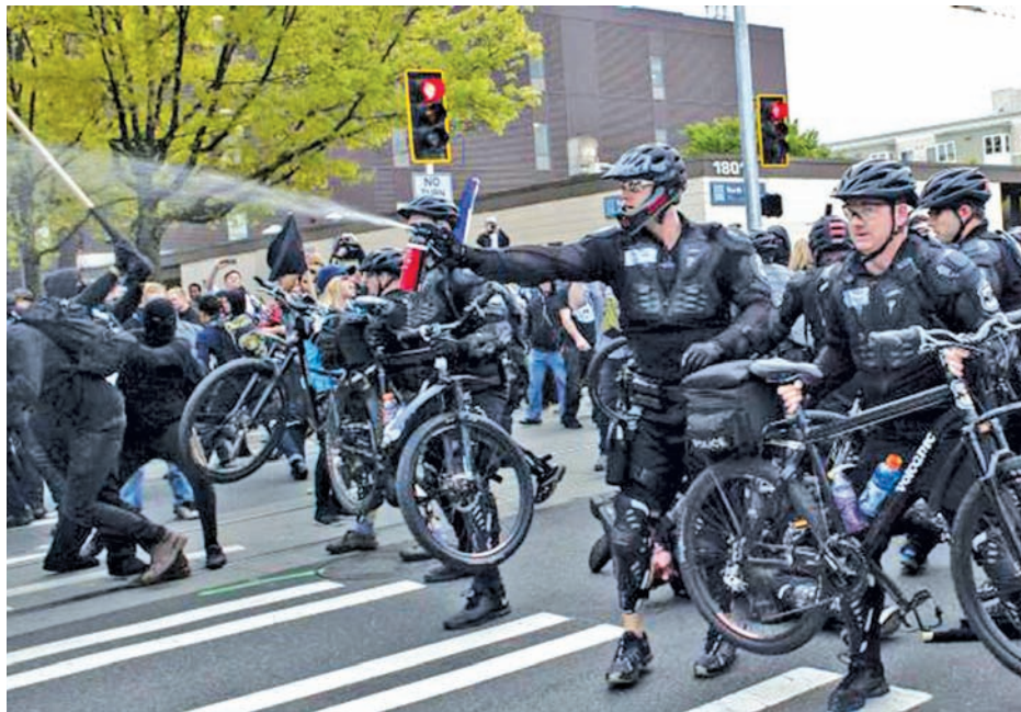
Police use pepper spray against demonstrators during an anti-capitalist protest in Seattle, Washington on 1 May, 2015.

Protesters annually assemble on 1 May as a day to focus attention on labour and immigration issues, but demonstrators in cities across the country also used the occasion to rally against