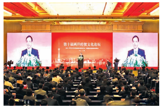
Photo taken on 3 May, 2015 shows the opening ceremony of the 10 th Cross-Strait Economic, Trade and Culture Forum in Shanghai, east China. The 10 th Cross-Strait Economic, Trade and Culture Forum, a regular forum between the Chinese mainland and Taiwan, opened in Shanghai on Sunday.

Yu asked the forum to continue its focus on welfare with exchanges of economic policy and industrial plans. Efforts to help ordinary people, small and medium-sized enterprises as well as farmers and fisher-