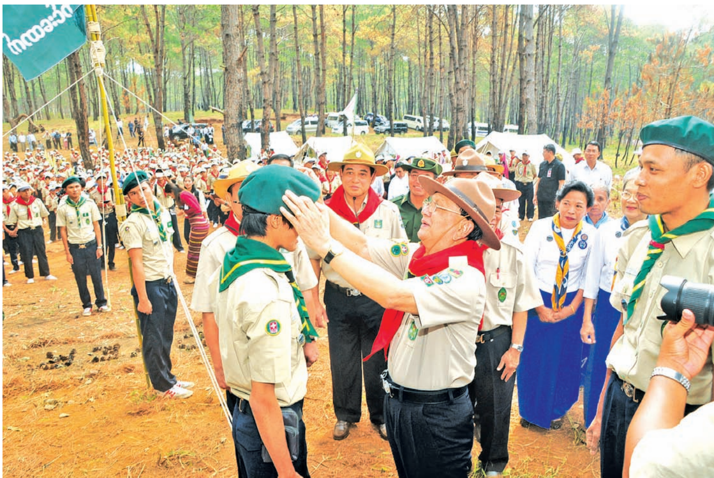
President U Thein Sein cordially meets with scout youths at PyinOoLwin Camp. IPRD

The president attended the third jungle camp meeting of boy scouts and girl guides on Sunday morning at the jungle camp of boy (See page 3)