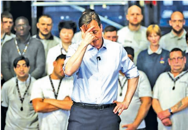
Britain's Prime Minister David Cameron gestures as he delivers an election speech at an engineering factory in Birmingham, Britain on 29 April, 2015.

LONDON, 3 May— Prime Minister David Cameron's Conservative Party has taken a one point lead over the opposition Labour Party, according to a YouGov poll for The Sunday Times .