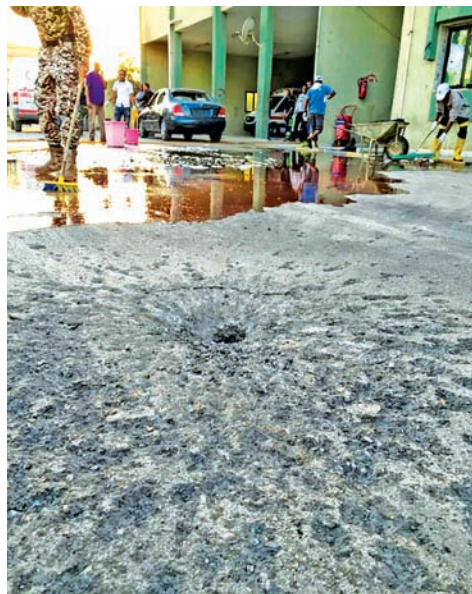
A hole is seen in the ground after a rocket hit a medical centre on Friday, killing three people, medics said, in eastern Benghazi, Libya on 1 May, 2015.

The North African country has two governments allied to armed factions fighting for power and territory.—Reuters