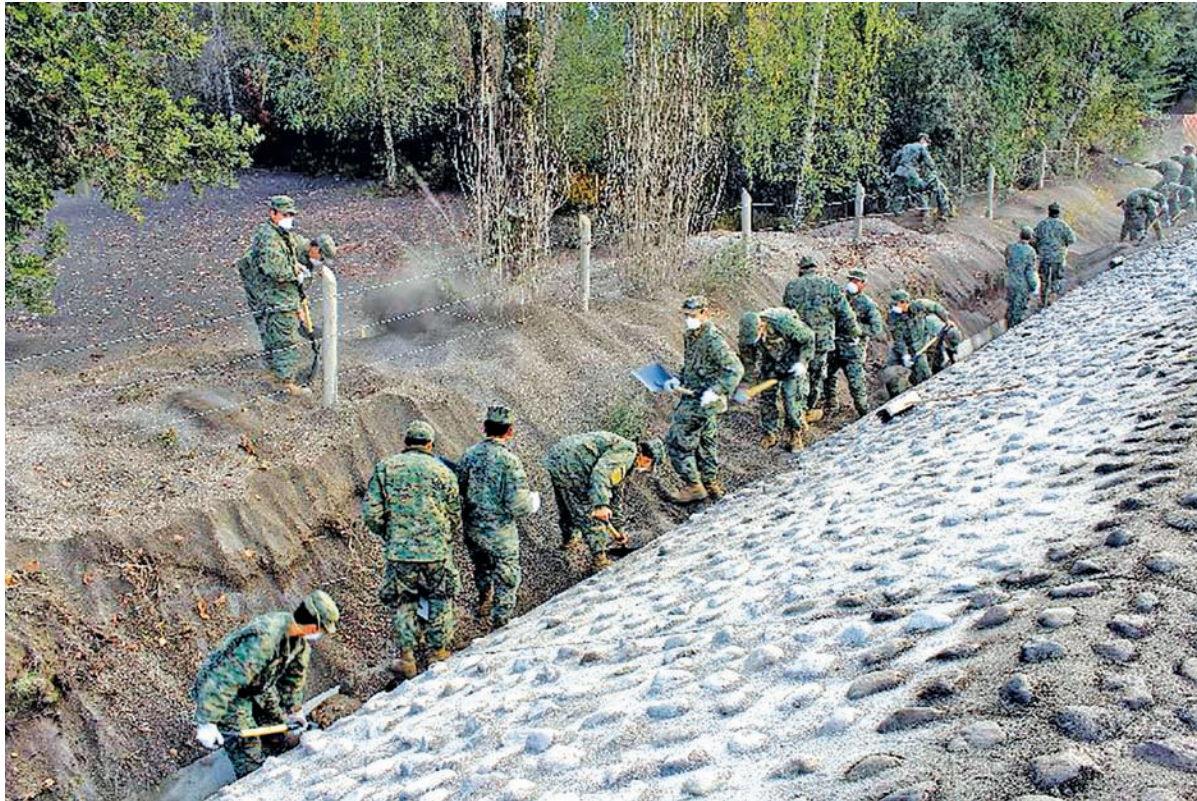
Soldiers clean ashes in Ensenada, Llanquihue Province, Chile, on 2 May, 2015. The Chilean government on Thursday declared a state of "maximum alert" against the latest Calbuco volcanic eruption in the southern region of Los Lagos, adopting precautionary measures to face the emergency.