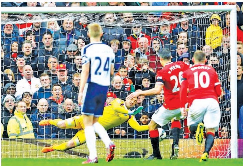
Manchester United’s Robin Van Persie has his penalty saved by West Bromwich Albion’s Boaz Myhill during their Barclays Premier League at Old Trafford on 2 May, 2015.

Chelsea have 83 points from 35 games and cannot be surpassed by closest rivals Manchester City, who visit Tottenham Hotspur later on Sunday, and Arsenal both of whom trail by 16 points. Palace remain 12 th with 42 points.—Reuters