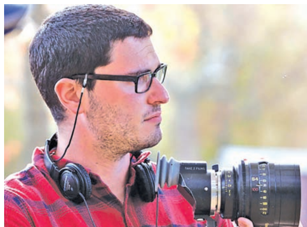
Director Josh Trank is no longer attached to helm the upcoming spin-off of popular action franchise “Star Wars”.