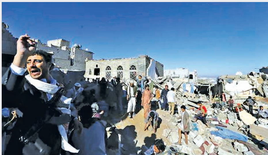
People gather near houses destroyed by an overnight Saudi-led air strike on a residential area in Yemen’s capital Sanaa on 1 May, 2015.

“We look forward to your active humanitarian role...to put an end to the Saudi aggression against our people without any justification or reason,” the letter said, listing a number of areas and damage the