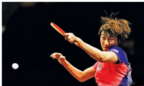
China's Ding Ning competes during Women's Singles Final against her compatriot Liu Shiwen at the 53rd Table Tennis World Championships in Suzhou, city of east China's Jiangsu Province, on May 2, 2015. Ding Ning won the match 4-3 and claimed the title.