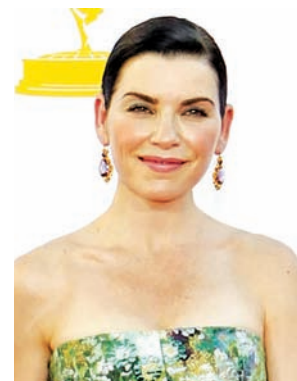
“The Good Wife” star Julianna Margulies