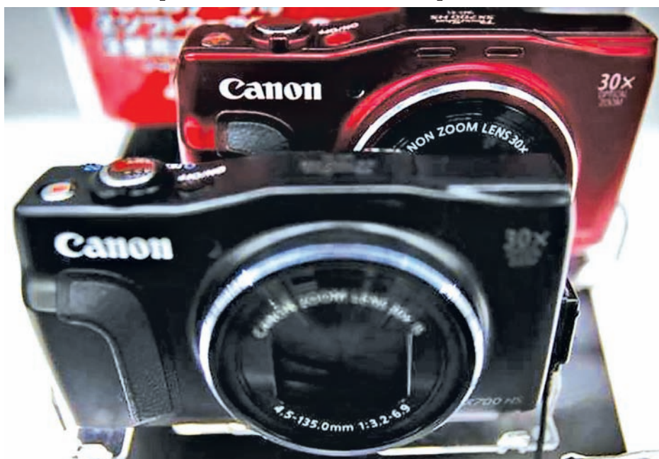
Canon's logos are seen on compact digital camera on display at an electronics retail store in Tokyo on 24 July, 2014.

Canon also said it expects to sell 7.0 million compact cameras in 2015,