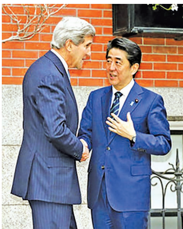
Japan’s Prime Minister Shinzo Abe (R) shakes hands with US Secretary of State John Kerry in front of Kerry’s private residence in Boston on 26 April, 2015. During an eight-day official visit, Abe will hold talks with President Barack Obama and deliver a speech to a joint session of Congress, the first Japanese prime minister to do so.

October 2013 in Tokyo, Japan and the United States agreed to revise the guidelines, which set the roles and missions of the SDF and US military.