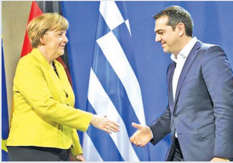
German Chancellor Angela Merkel and Greek Prime Minister Alexis Tsipras go to shake hands after addressing a news conference at the Chancellery in Berlin on 23 March, 2015.