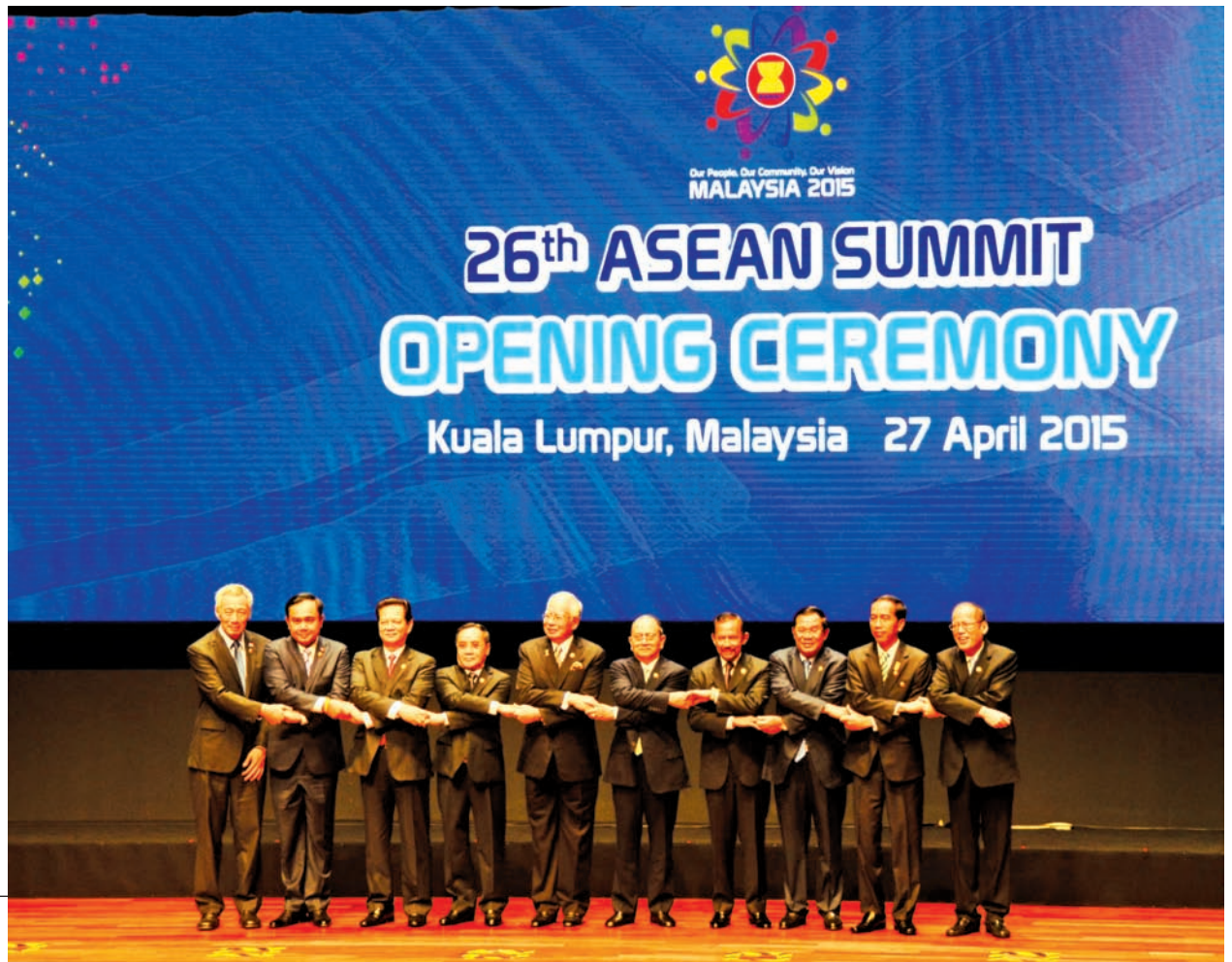
President U Thein Sein poses for documentary photo with leaders of ASEAN countries.