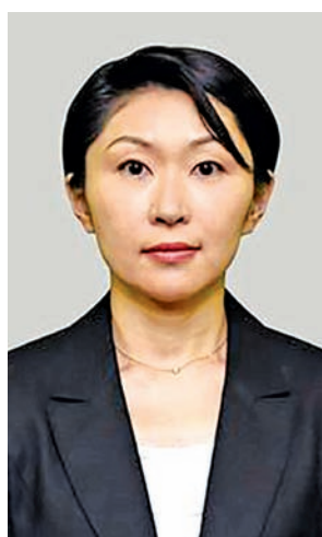
Undated photo shows Yuko Obuchi, who resigned as minister of economy, trade and industry in October 2014 to take responsibility for the alleged misuse of political funds. Prosecutors have questioned the daughter of the late Prime Minister Keizo Obuchi on a voluntary basis over the scandal, sources close to the matter said on 27 April, 2015.

In addition, no outlays or income were reported for a 2012 theater visit, a