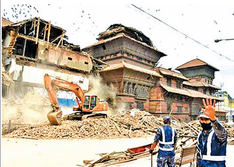
Photo taken on 26 April, 2015, in Kathmandu shows a historic building that was partly destroyed by an aftershock following the magnitude 7.8 earthquake that struck Nepal on 25 April. The guard held back people.