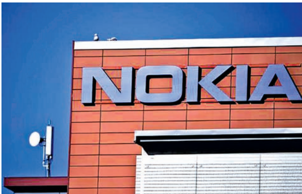
A view of Nokia's head offices in Espoo, Finland, on 15 April, 2015.

HELSINKI, 27 April — Finland's Nokia (NOK1V.HE) denied reports in Chinese media that it planned to return to manufacturing phones.