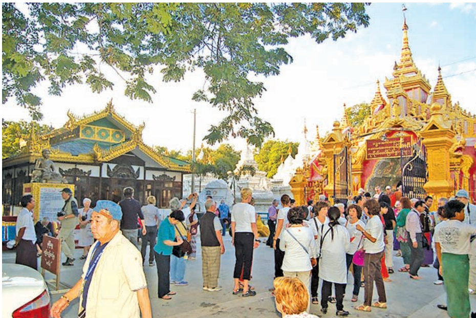
Maha Muni Buddha Image, Mandalay Hill, Yankin Hill, Taungthaman Lake, Myananda and Taungthaman Bridge. Sankyaw Golden Palace, Golden monastery, ancient Inwa city, Kuthodaw Pagoda and Taungthaman Bridge.

The top tourists attractions in the city include the