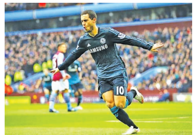
Eden Hazard of Chelsea celebrates scoring against Aston Villa during their English Premier League soccer match at Villa Park, Birmingham on 7 Feb, 2015.

"I've always believed in my ability and wanted to get the chance to prove myself. I've managed to ride the wave and this season has got better and better and this has topped it off. This is hopefully the beginning and there's more to come."—Reuters