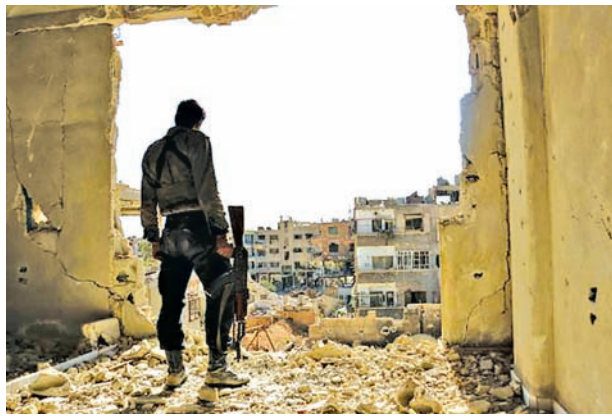
A rebel fighter stands on a damaged building near the frontline during what the rebel fighters called a battle to unite rebel factions against forces loyal to Syria's President Bashar al-Assad in Jobar, a suburb of Damascus on 21 April, 2015.

US officials say several hundred US and coalition personnel are preparing to start training, initially at sites in Jordan, Turkey, and later in Saudi Arabia and Qatar. The sessions, which were originally expected to