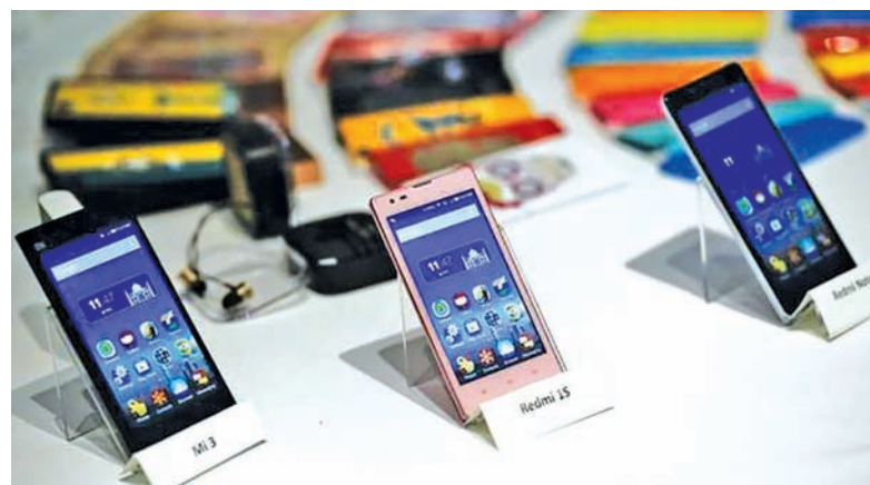
Three models of China's Xiaomi Mi phones are pictured during their launch in New Delhi on 15 July, 2014.