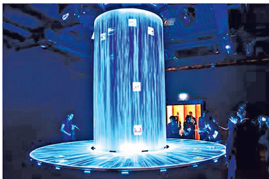
Photo shows an information display apparatus called the "diversity waterfall" within the Japan Pavilion of the Expo Milano 2015 in the northern Italian city of Milan on 24 April, 2015, the day when the pavilion was unveiled to the press ahead of the opening of the world exposition themed on food on 1 May.