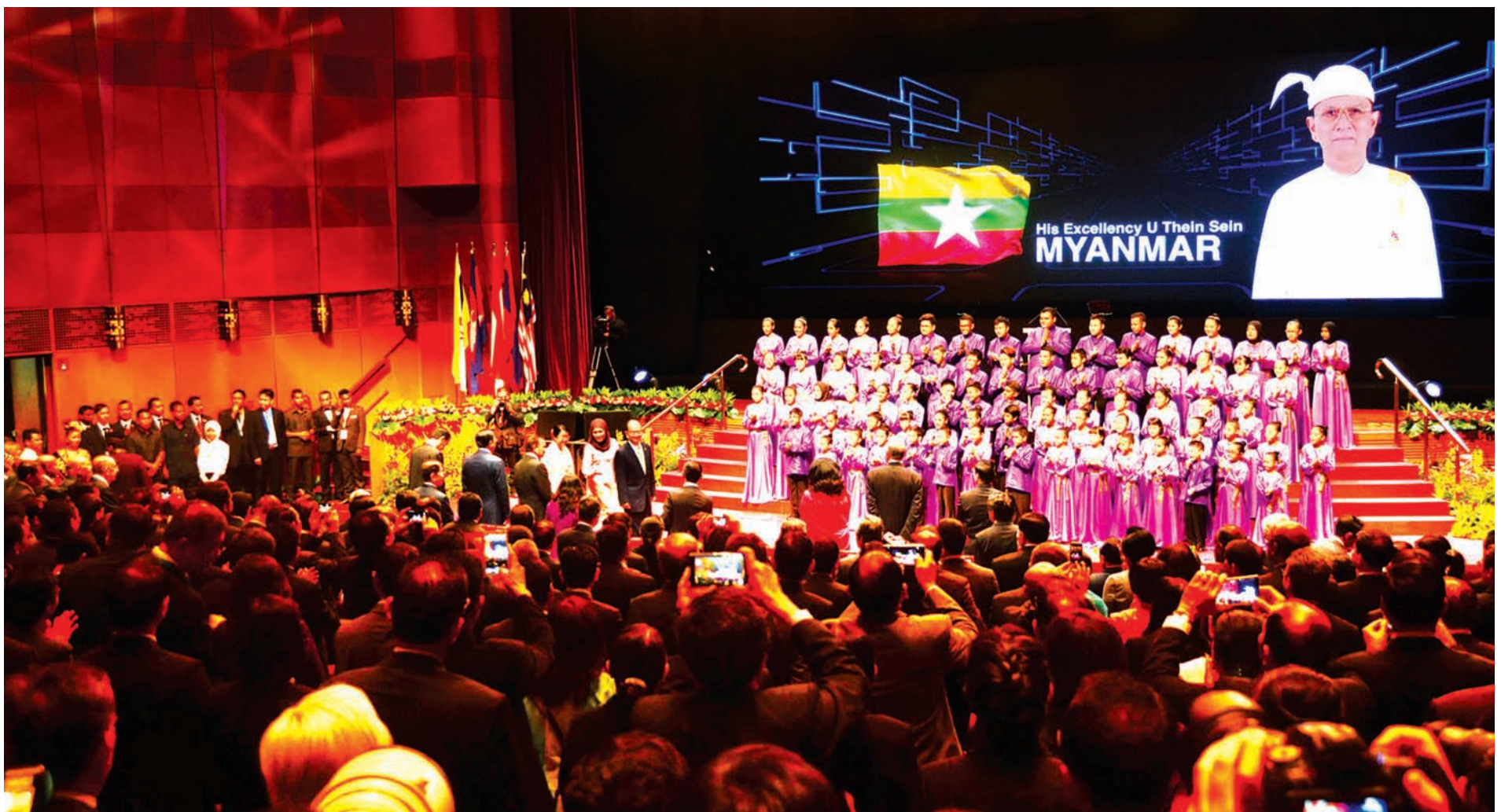
President U Thein Sein being welcomed by officials at 26 th ASEAN Summit.