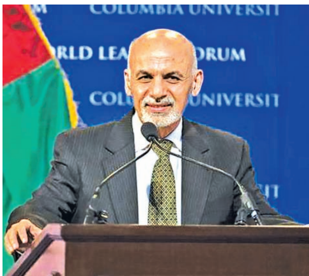
Afghan President Ashraf Ghani participates in "The New Beginning in Afghanistan: A Conversation with HE Dr Mohammad Ashraf Ghani, President of the Islamic Republic of Afghanistan" at Columbia University in New York on 26 March, 2015.