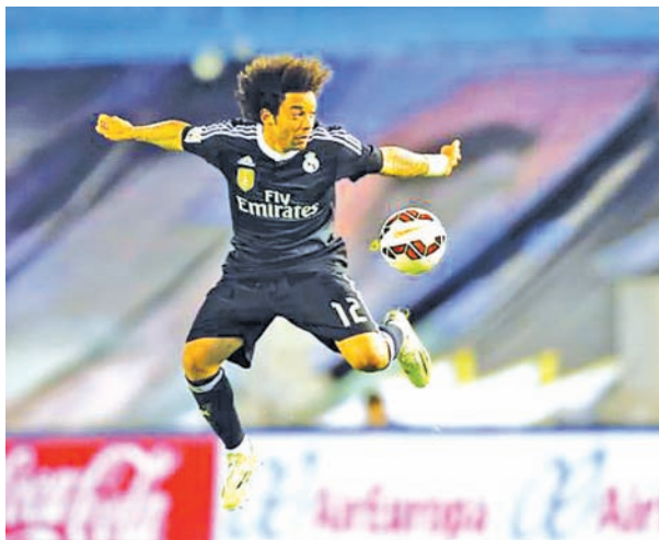
Real Madrid's Marcelo Vieira tries to control the ball during their Spanish first division soccer match against Celta Vigo at Balaidos stadium in Vigo on 26 April, 2015.

In a busy week before the Champions League resumes, Barca host Getafe on Tuesday and Real are at home to Almeria on Wednesday before the leaders play at bottom side