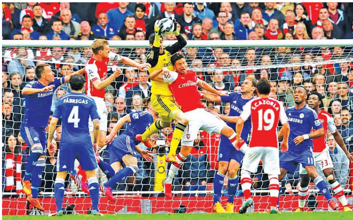
Chelsea's Thibaut Courtois in action with Arsenal's Olivier Giroud during their Barclays Premier League at Emirates Stadium on 26 April, 2015.

LONDON, 27 April — The man selling 'Chelsea Champions 2015' scarves outside The Emirates was a little premature but he is unlikely to be asked for refunds after they ground out a 0-0 Premier League draw at Arsenal on Sunday.