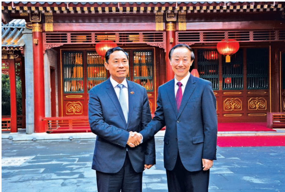
Speaker Thura U Shwe Mann shakes hands with Wang Jiarui, the head of International Department of the Communist Party of China.

GUANGZHOU, 27 April — A Myanmar delegation led by Thura U Shwe Mann, the speaker of the Pyiduangu Hluttaw and