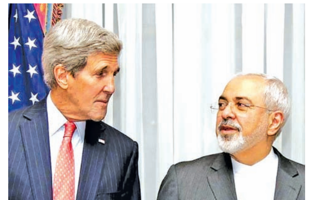
US Secretary of State John Kerry (L) and Iran’s Foreign Minister Mohammad Javad Zarif pose for a photograph before resuming talks over Iran’s nuclear programme in Lausanne on 16 March, 2015.