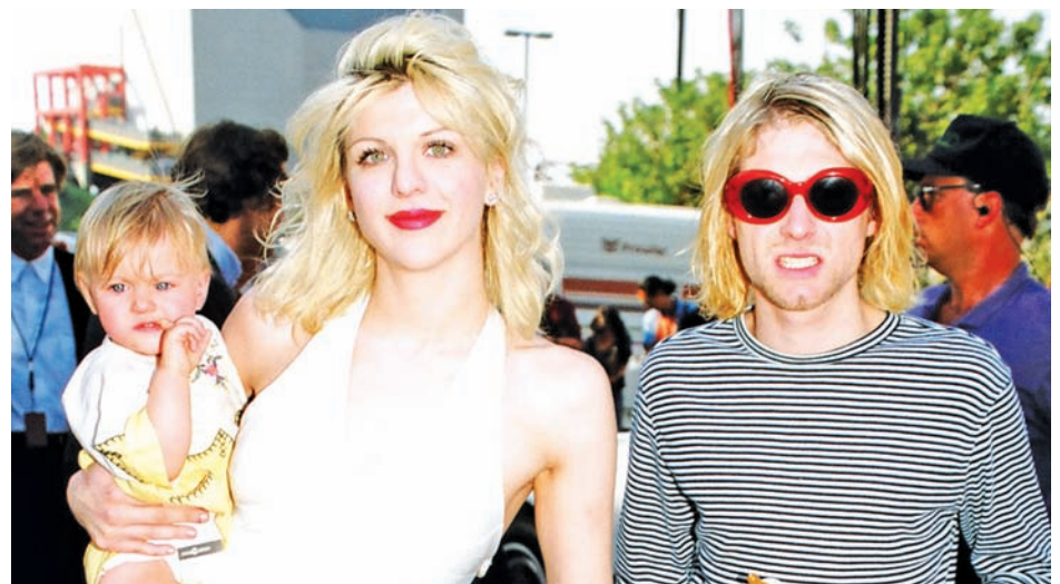
Kurt Cobain and Courtney Love

LOS ANGELES, 27 April — Kurt Cobain and Courtney Love's old apartment in Los Angeles is available to rent on Airbnb.