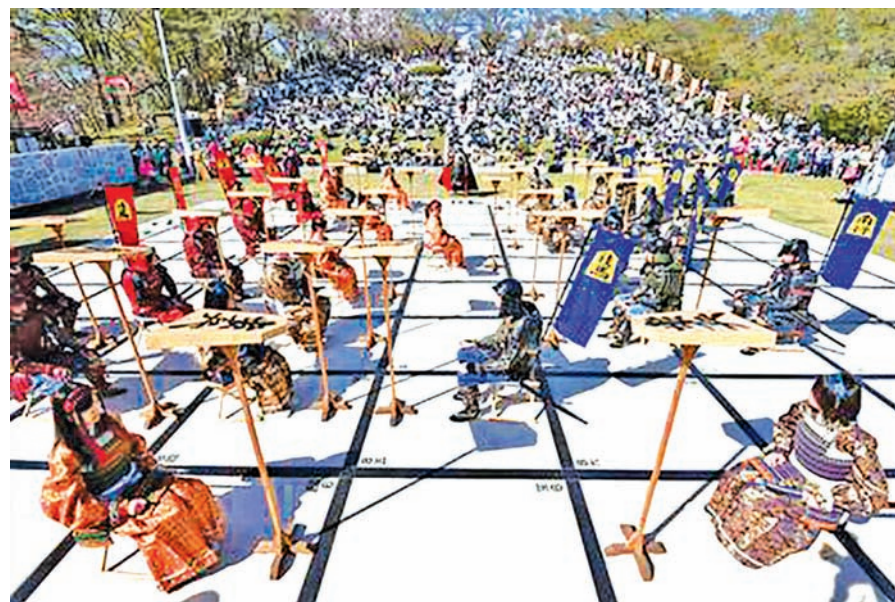
A shogi, or Japanese chess, game with "human pieces" is played on 25 April, 2015, in the Japanese northeastern city of Tendo, Yamagata Prefecture, the largest producer in Japan of Shogi pieces. High school students in armor or kimono moved on a 15-metre square shogi board under instructions from two female professional shogi players. Some 100,000 people are expected to see the two-day event.

A ministry spokesman declined to comment further.—Reuters