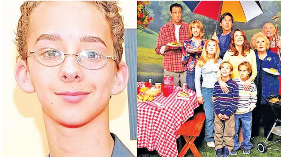
Sawyer Sweeten, the actor who starred as Ray Romano's twin kid Geoffrey Barone on hit sitcom "Everybody Loves Raymond", has committed suicide. He was 19.