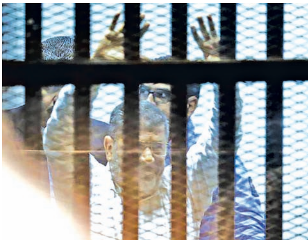
Ousted Egyptian President Mohamed Mursi gestures after his trial behind bars at a court in the outskirts of Cairo, on 21 April, 2015.

"Whatever political responsibility (Mursi) may have, the prosecution didn't establish his criminal guilt in this case", the rights group said in a statement