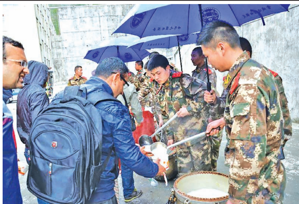
Soldiers of the local public security frontier corps give tourists free porridge at a checkpoint of Zhangmu Township in Nyalam County, on 25 April, 2015. More than 500 tourists stranded by a powerful earthquake in Nepal have been properly relocated at the Zhangmu checkpoint.

ASEAN groups Brunei, Cambodia, Indonesia, Laos, Malaysia, Myanmar, the Philippines, Singapore, Thailand and Vietnam.— Kyodo News