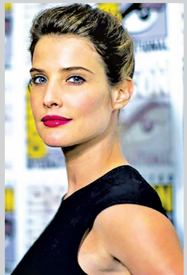
Cobie Smulders: I had tumors on both ovaries, and the cancer had spread into my lymph nodes and surrounding tissues.

"I don't think I'll ever feel like I'm cancer-free. Now that I'm