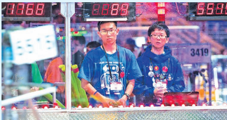
Contestants from Shanghai, China, participate in the Robotics Competition final for high-school students in St. Louis, the United States, on 23 April, 2015. 15,000 high-school students of 608 teams participated in the competition, one of the biggest in the world. Teams from China’s Beijing, Shanghai and Shenzhen have fought all the way to the final contest.