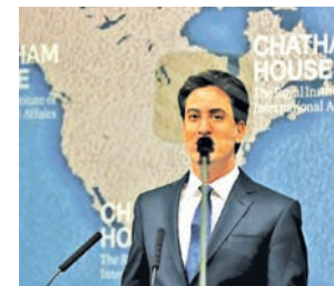
Britain’s opposition Labour party leader Ed Miliband addresses an audience behind a teleprompter during a campaign event in London, Britain, on 24 April, 2015.

Scots voted to preserve the United Kingdom in a 18 September referendum last year. But opinion polls indicate the once marginal pro-independence Scottish National Party (SNP) is on course to take the lion’s