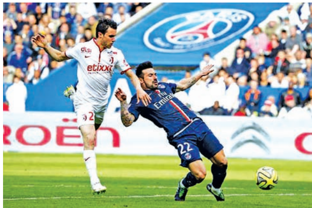
Paris Saint-Germain’s Ezequiel Lavezzi (R) fights for the ball with Lille’s Sebastien Corchia during their French Ligue 1 soccer match at Parc des Princes stadium in Paris, France, on 25 April, 2015.

Lille, who grabbed a consolation goal through Marko Basa in the 59 th minute, finished with 10 men after Sebastien Corchia was sent off in the 72 nd . PSG have 68 points with five matches left, three ahead of second-placed Olympique Lyonnais who have played the same number of games and travel to