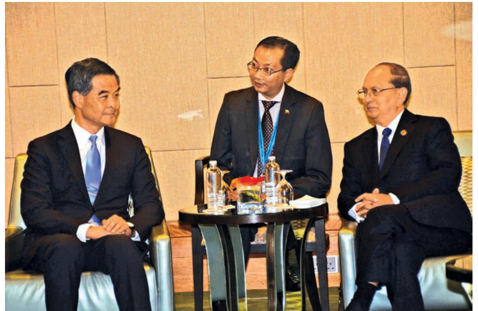
President U Thein Sein holds talks with Chief Executive of Hong Kong Special Administrative Region Mr Leung Chun-ying.

Then, the president continued to say that the forum, which has been organized for twelve years, is a regional leadership programme that enables ASEAN leaders, regional business leaders, civil society organizations, experts and scholars to meet one another. As the forum is scheduled to discuss