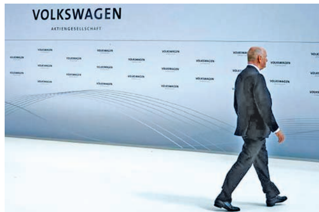
Ferdinand Piech, chairman of the supervisory board of Volkswagen, is pictured during a welcoming ceremony at the plant of German carmaker Volkswagen in Wolfsburg on 23 April, 2012.

HAMBURG / FRANKFURT, 26 April — Ferdinand Piech, a towering figure at Volkswagen (VOWG_p.DE) for more than two decades, resigned as its chairman on Saturday after losing a showdown he had provoked with Chief Executive Martin Winterkorn, ending an era at the iconic German carmaker.