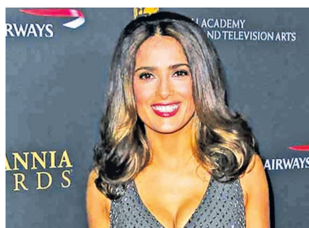
The 48-year-old actress was, however, quick to regain her balance and she avoided hitting the pavement.

Hayek was photographed wearing casual outfits combined with a pair of towering platform boots during the outing. She completed her look