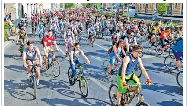
Thousands of bicycle lovers participate in the event named “I Bike Budapest” to demonstrate the importance and popularity of bicycle as a means of everyday city transportation in Budapest, Hungary on 25 April, 2015.