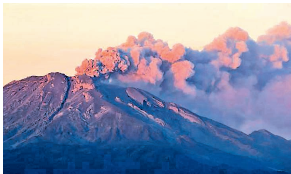
A general view of Calbuco Volcano spewing ash and smoke is seen during sunset from Alerce town on 24 April, 2015.

SANTIAGO, 26 April—Ash from the Chilean volcano Calbuco, which erupted without warning this week, reached as far as southern Brazil on Saturday and prompted some airlines to cancel flights to the capitals of Chile, Argentina and Uruguay.