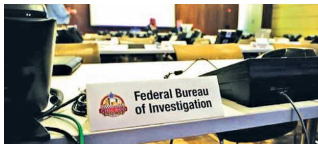
Phone banks dedicated to the Federal Bureau of Investigation are shown during a tour of the Multi-Agency Communications Center (MACC) at an undisclosed location in the Chicago suburbs on 17 May, 2012.

WASHINGTON, 26 April — CNN reported on Saturday that the FBI was investigating a possible Islamic State-inspired terrorism plot in California but a US law enforcement official in Los Angeles denied there was any such threat.