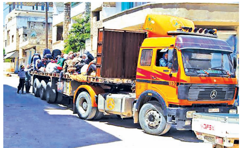
Residents flee Jisr al-Shughour town after rebels took control of the area on 25 April, 2015.—REUTERS

The Islamist alliance calls itself the Army of Fatah, a reference to the conquests that spread Islam across the Middle East from the 7 th century.—Reuters