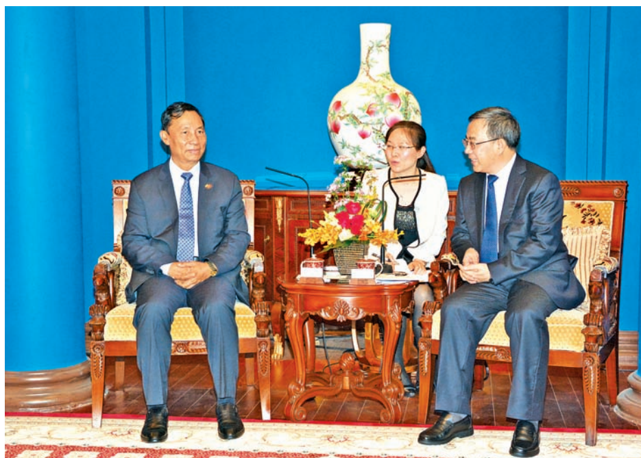
Pyidaungsu and Pyithu Hluttaw Speaker Thura U Shwe Mann meets Mr Hu Chunhua, Secretary of Guangdong Province's Communist Party of China.

GUANGZHOU, 26 April — At the invitation of the Communist Party of China (CPC), Pyidaungsu and Pyithu Hluttaw Speaker Thura U Shwe Mann paid an official visit to China on 25 April.