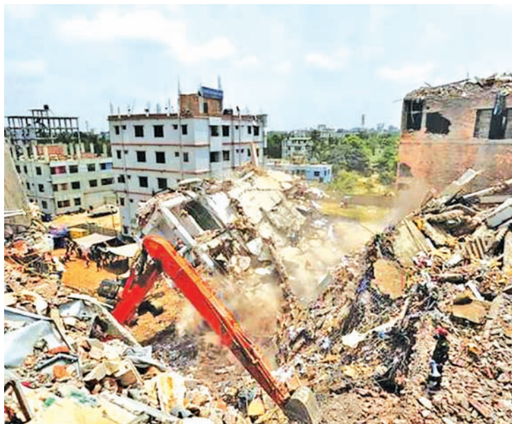
The remaining standing part of the collapsed Rana Plaza building collapses during a rescue operation by the army in Savar on 2 May, 2013.

"A number of factories were shut down, but those are small factories and did not have direct