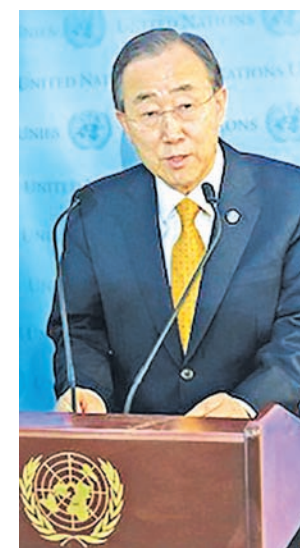
UN Secretary General Ban Ki-moon

The UN chief welcomed the continuous decline in the overall global stockpile of nuclear weapons since the last NPT review meeting in 2010. But he criticized nuclear weapon states for continuing to modernize their nuclear weapons and related infra-