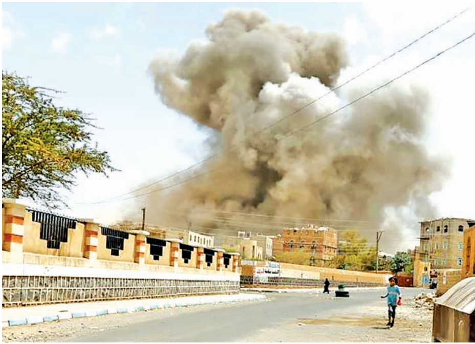
A girl runs for shelter during an air strike in Sanaa on 8 April, 2015.

"The explosions were so big they shook the house, waking us and our kids up. Life has really