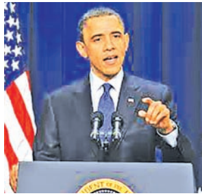
US President Barack Obama

Obama was angered when Boehner, the Republican leader of the House