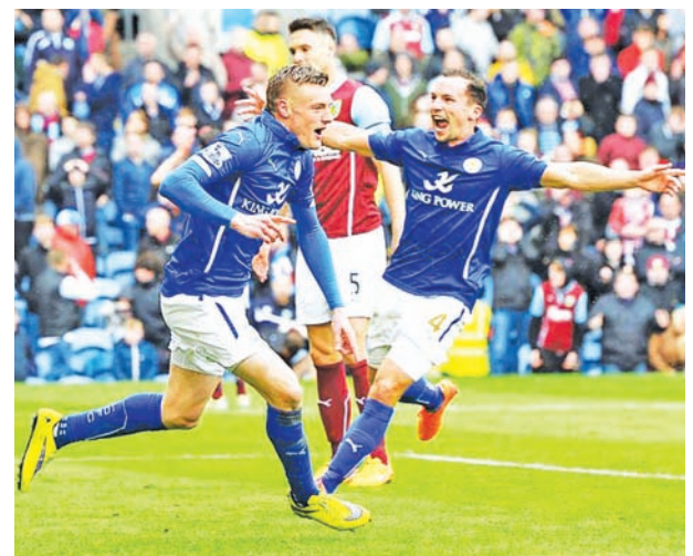
Leicester City's Jamie Vardy celebrates scoring their first goal against Burnley during their Barclays Premier League at Turf Moor on 25 April, 2015.

from bottom after a 1-1 draw at Stoke City.