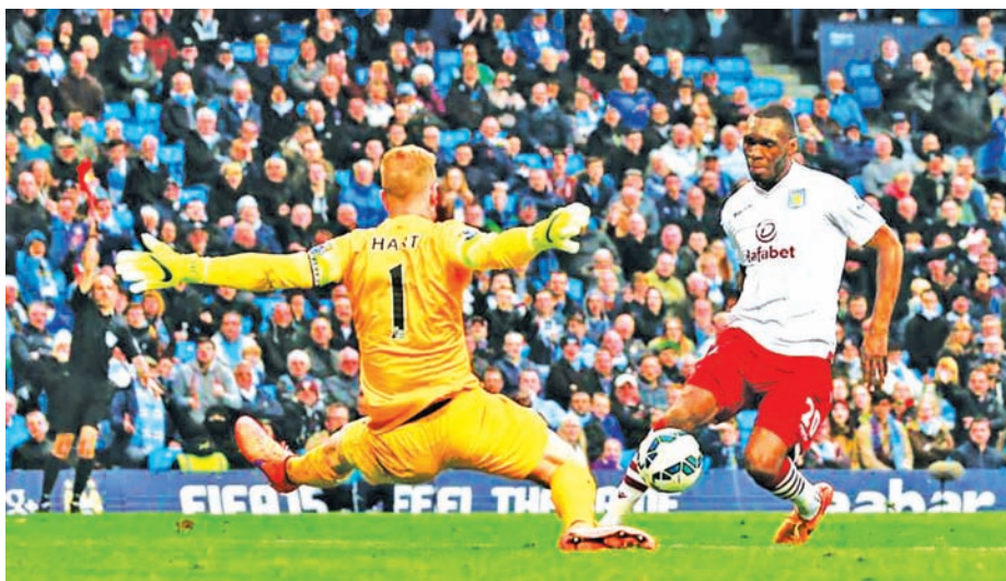
Aston Villa's Christian Benteke goes through on goal against Manchester City's Joe Hart however is later adjudged to have been offside.