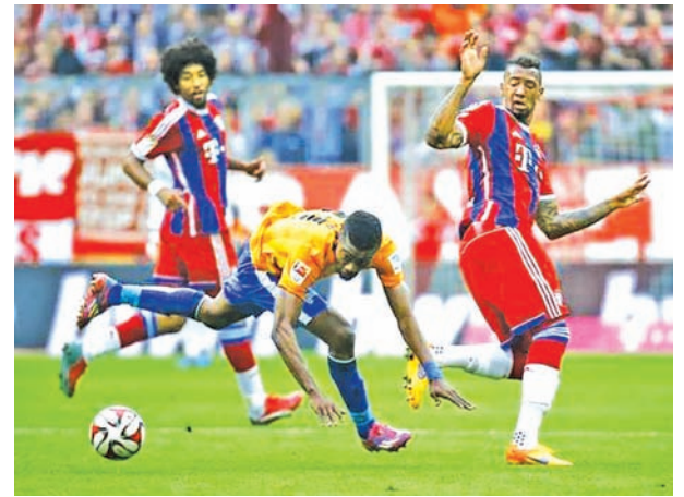
Bayern Munich's Jerome Boateng watches as Hertha Berlin's Salomon Kalou (L) stumbles during their German Bundesliga first division soccer match in Munich on 25 April, 2015.

Treble-chasing Bayern had Schweinsteiger fit again and Spaniard Javi Martinez back on the bench for the first time since tearing knee liga-