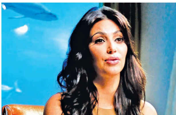
The 'Keeping Up with the Kardashians' star is executive producer for the TV documentary.

LOS ANGELES, 26 April — Reality TV star Kim Kardashian is making her production debut with a mental health awareness documentary called #RedFlag.