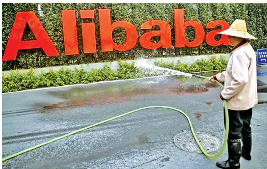
A cleaner waters the flowers below a logo of Alibaba (China) Technology Co Ltd at the company’s headquarters on the outskirts of Hangzhou, Zhejiang province on 21 Nov, 2013.

Six models produced by Coolpad, Hisense and TCL would come with the Mobile Taobao app pre-installed. Mobile Taobao is China’s most popular mobile shopping app with