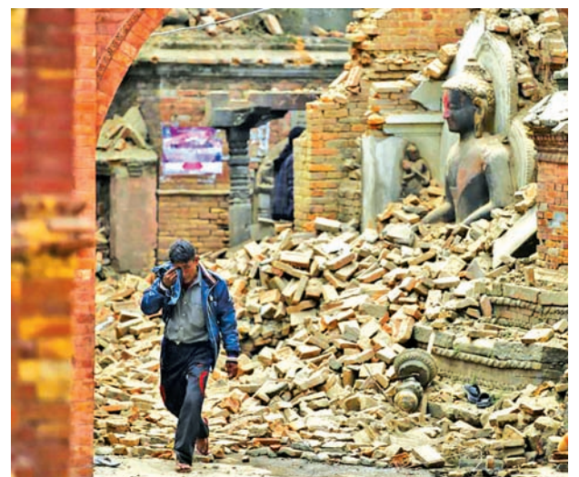
A man cries as he walks on the street while passing through a damaged statue of Lord Buddha a day after an earthquake in Bhaktapur, Nepal on 26 April, 2015.

UN Secretary General Ban Ki Moon said in a statement, “The United Nations is supporting the government of Nepal in coordinating international search and rescue operations and is preparing to mount a major relief