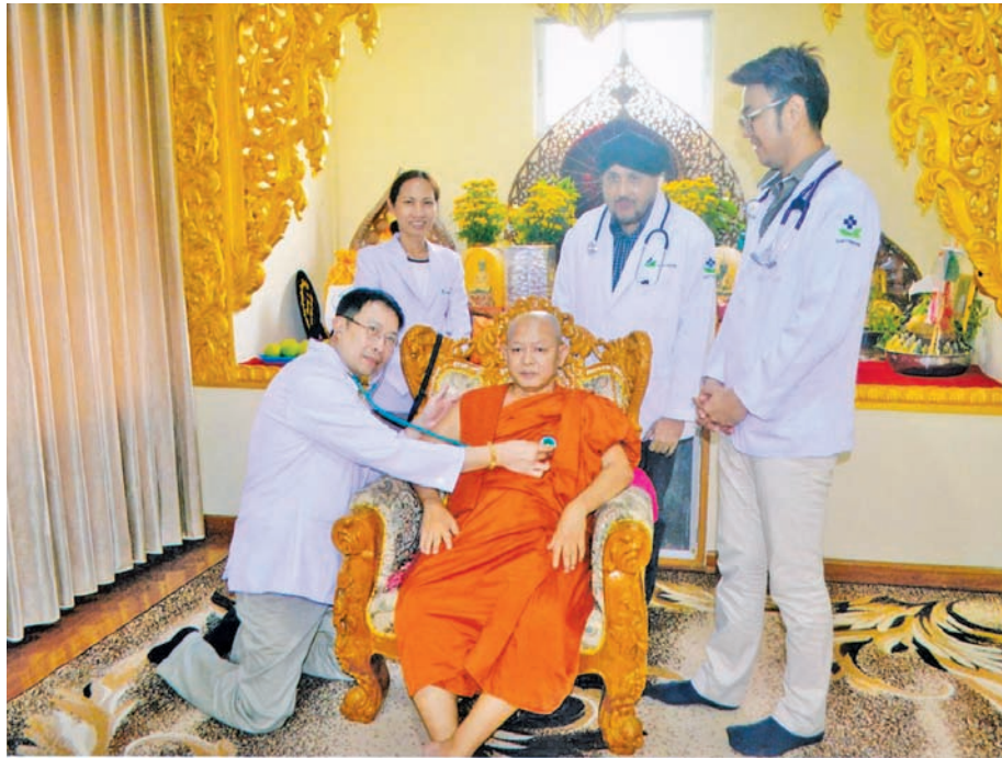
Specialists from Suksawat Hospital in Thailand gave health care services to more than 300 monks, nuns and laypersons free of charge with the use of ECG and Echo machines in the precinct of Nanda Aungmyay Monastery of Leikpyakan Kyaungtaik on Shwegondine Road in Bahan Township on 25 and 26 April.