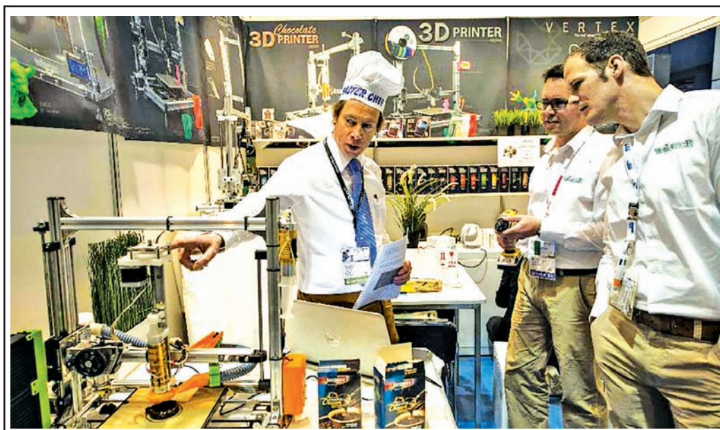
An exhibitor introduces 3D printing technology at the Hong Kong Electronics Fair (Spring Edition) in south China's Hong Kong, April 13, 2015. The four-day fair, Asia's largest of this industry, kicked off here Monday at the Hong Kong Convention and Exhibition Centre.