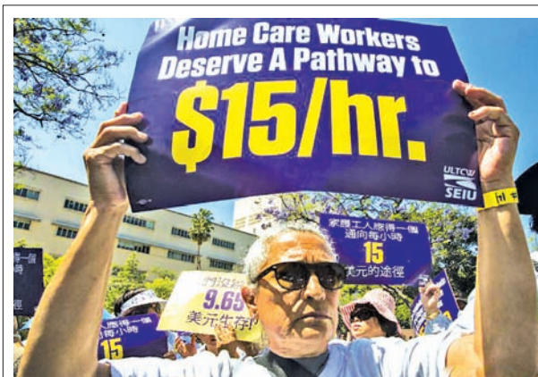
A man takes part in a rally for better wages in Los Angeles on 14 April, 2015. The union representing home care workers demanded better wages as many of those workers in LA County live in poverty despite their heavy task of caring for the elderly and disabled people at home.