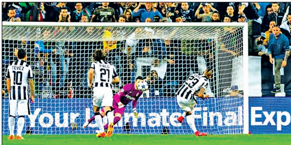
Arturo Vidal scores the first goal for Juventus from the penalty spot during UEFA Champions League Quarter Final First Leg at Juventus Stadium, Turin, Italy on 14 April, 2015.

Editorial Section — (+95) (01)8604529; Fax — (01) 8604305 Advertisement & Circulation — (+95) (01) 8604532 gnmindaily@gmail.com www.globalnewlightofmyanmar.com www.facebook.com/globalnewlightofmyanmar