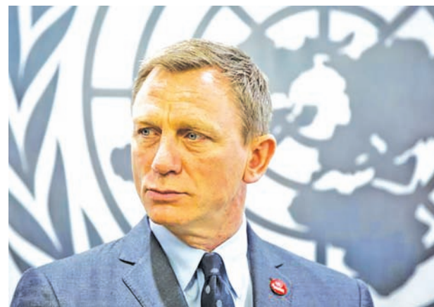
Actor Daniel Craig

The plot sees Tony Stark try to jumpstart a peacekeeping programme. When things go wrong, the superheroes — Iron Man, Captain America, Thor, The Incredible Hulk, Hawkeye and Black Widow — have to stop villain Ultron’s destructive plans.—Reuters