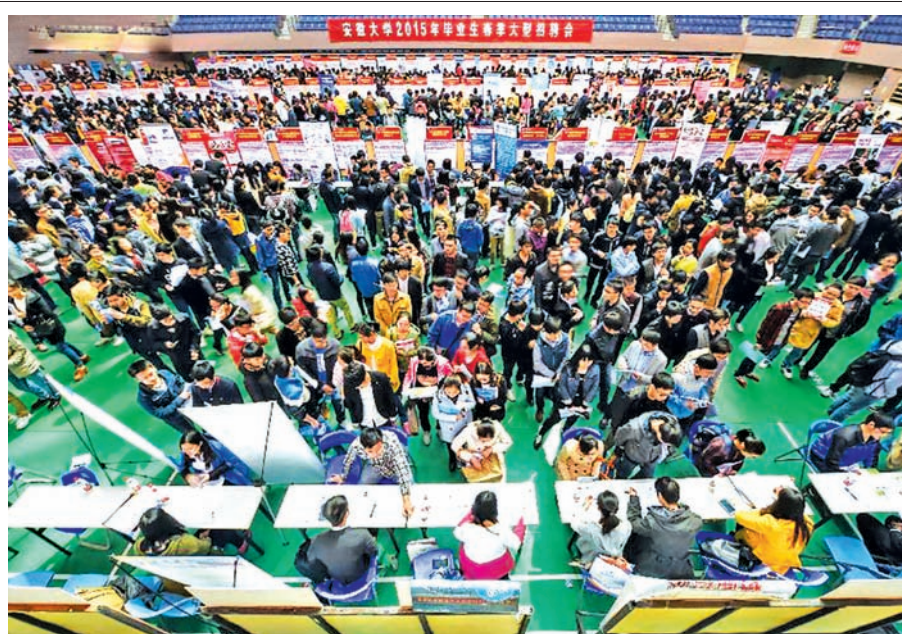
Graduates look for employment opportunities at a job fair in Anhui University in Hefei, capital city of east China's Anhui Province on 15 April, 2015. A total of 190 companies offered vacancies at the fair.