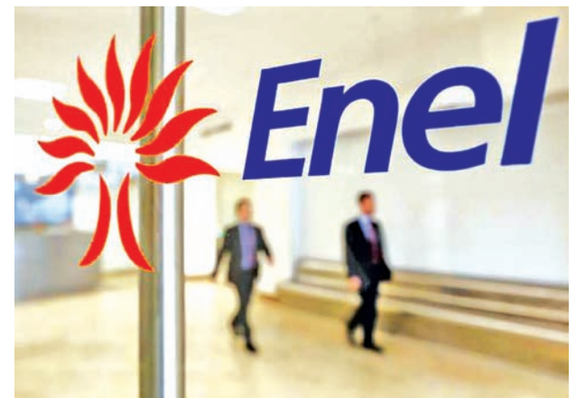
People walk past the logo of Italy's biggest utility Enel at their Rome headquarter on 11 Nov, 2014.