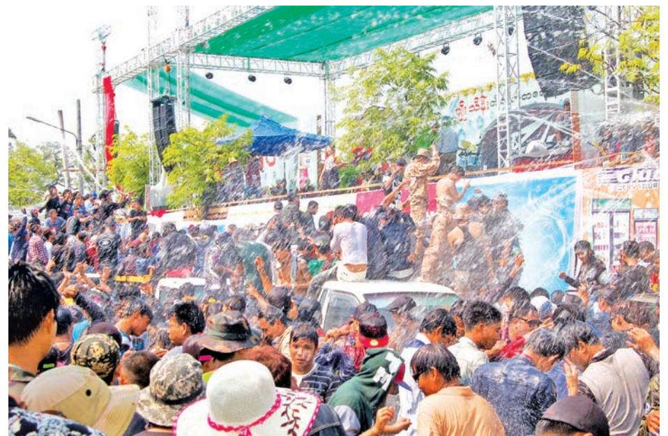
Thingyan revellers enjoy water festival in Mandalay on Akyat Day.