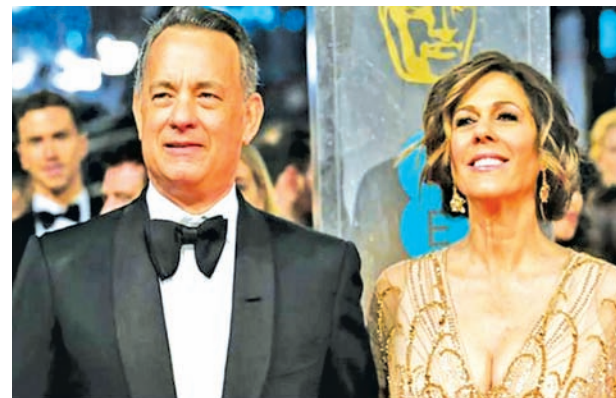
Actor Tom Hanks and his wife Rita actress Wilson

LOS ANGELES, 15 April — Rita Wilson, the actress and wife of actor Tom Hanks, said she underwent a double mastectomy and reconstructive surgery after being diagnosed with an invasive form of breast cancer.