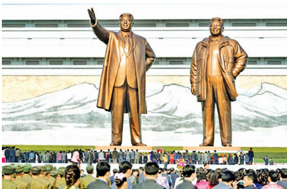
North Korean citizens and military personnel lay flowers before giant statues of Kim Il Sung and Kim Jong Il on Mansu Hill in Pyongyang on 15 April, 2015, as the country marked the 103 rd anniversary of the birth of the late founder, Kim Il Sung.

As always for the anniversary, citizens and military personnel on Wednesday laid flowers and bowed deeply before giant statues of the founder and Kim Jong Il, North Korea's previous leader who died in 2011, on Mansu Hill in the heart of Pyongyang and other monuments from early morning. North Korean