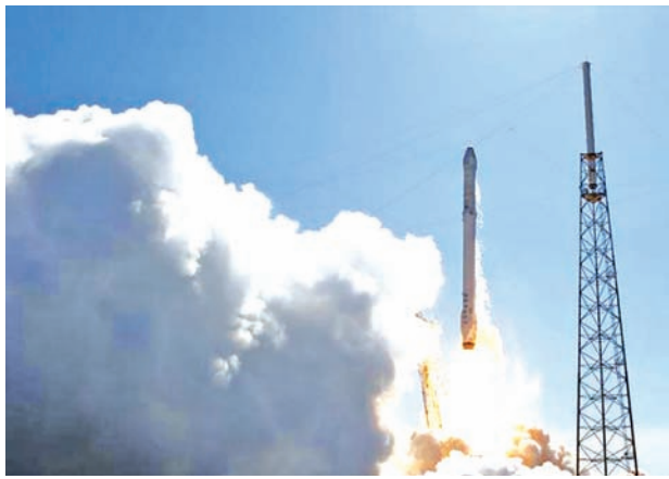
The unmanned SpaceX Falcon 9 rocket with Dragon lifts off from launch pad 40 at the Cape Canaveral Air Force Station in Cape Canaveral, Florida on 14 April, 2015.

WASHINGTON, 15 April — An unmanned SpaceX rocket blasted off from Florida on Tuesday to send a cargo ship to the International Space Station, then