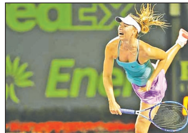
Maria Sharapova serves against Daria Gavrilova (not pictured) on day three of the Miami Open at Crandon Park Tennis Centre, Key Biscayne, FL, USA on 26 March, 2015.

Moscow, 15 April — Maria Sharapova has pulled out of Russia's Fed Cup semi-final against Germany in Sochi this weekend with a leg injury, the Russian Tennis Federation said on Tuesday.