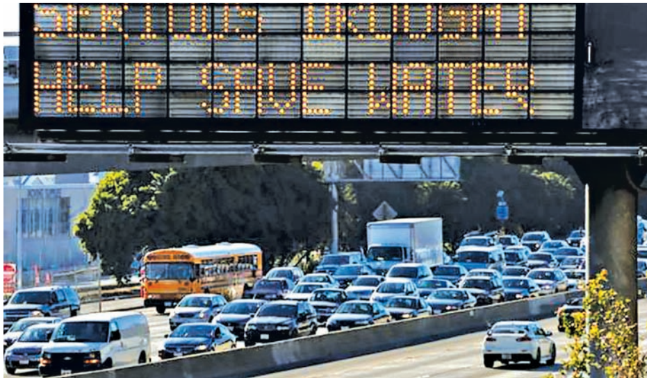
A Caltrans information sign urges drivers to save water due to the California drought emergency in Los Angeles, California on 13 Feb, 2014.

LOS ANGELES, 15 April — Southern California’s water wholesaler voted on Tuesday to cut its deliveries to cities and communities by 15 percent as the state clamps down on water usage amid a devastating four-year drought.