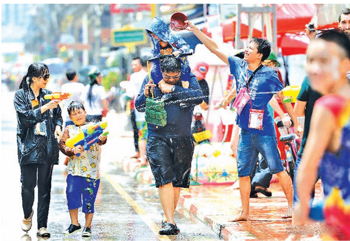
People take part in water-splashing battles in Vientiane, Laos on 14 April, 2015. People celebrated the water-splashing festival or the traditional New Year from 14 to 16 April.