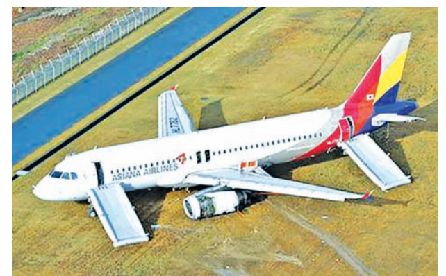
Photo taken from a Kyodo News helicopter on 15 April, 2015, shows an Asiana Airlines Airbus A320 from Seoul, which ran off of runway soon after landing at Hiroshima Airport in the evening of 14 April, 2015. Marks from the tires are seen on the grass. It was reported that more than 20 people on board sustained minor injuries.

airport are from the west, but because of northwesterly winds the aircraft instead came in to land from the east, outside the path of the system’s ground transmitter.