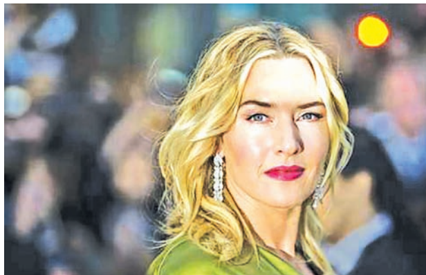
Oscar winner Kate Winslet

“I’m not a gardener. I wish I was,” Winslet