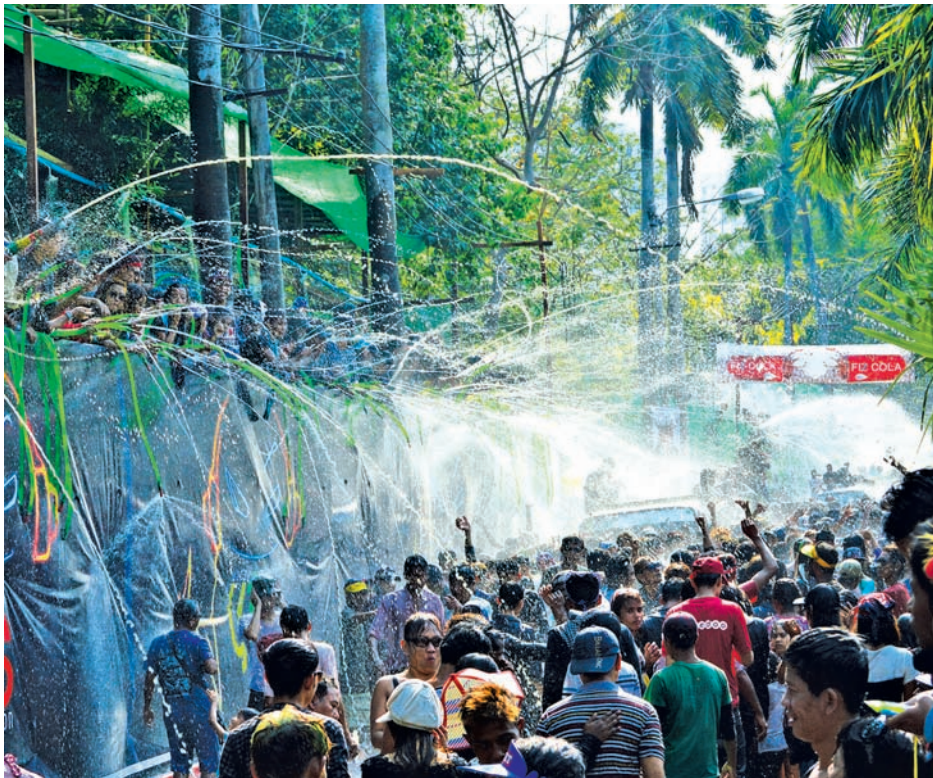
Thingyan revellers celebrate the Myanmar New Year Water Festival in front of a water-throwing pavilion on the Kandawgyi Ring Road's Kanyeiktha Street.