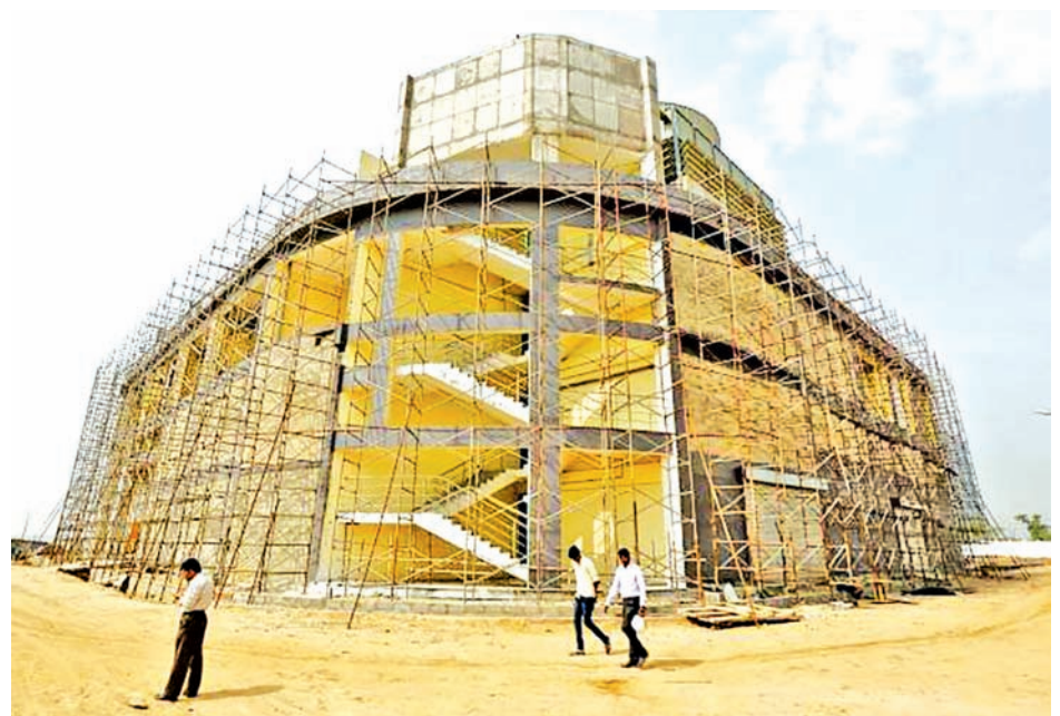
Engineers walk past a cooling system plant under construction inside Gujarat International Finance Tec-City (GIFT) at Gandhinagar, in the western Indian state of Gujarat on 10 April, 2015.

"To get the private sector in, there is a lot of risk mitigation that needs to happen because nobody wants a risky proposition," he told Reuters , stressing the need for detailed planning. To build smart cities, India allocated 60 billion rupees ($962 million) in its annual federal budget for the financial year starting on 1 April, even as it spent just a fraction of last year's allocation of 70.6 billion