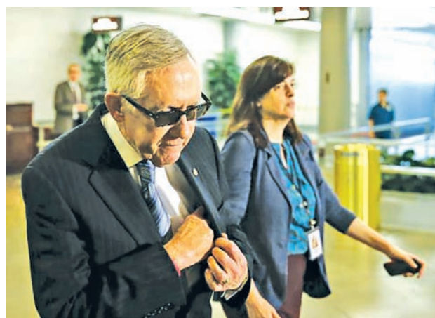
US Senate Minority Leader Harry Reid (D-NV) (L) walks to closed door briefings with US Senators and Secretary of State John Kerry (not pictured) on nuclear negotiations with Iran on Capitol Hill in Washington on 14 April, 2015.