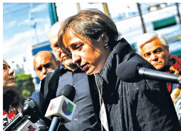
Mexican journalist Carmen Aristegui speaks with journalists outside MVS radio station in Mexico City on 16 March, 2015.

Aristegui was dismissed by MVS Radio after it accused her and her team of offering, without prior authorization, the broadcaster's name and funding for a new platform for investigative journalism called Mexicoleaks,