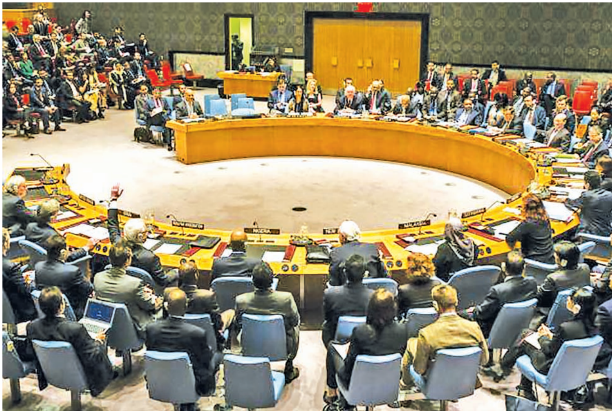
The Russian ambassador to the United Nations Vitaly Churkin abstains from a vote in the United Nations Security Council attempting to halt the escalating conflict in Yemen in New York on 14 April, 2015.