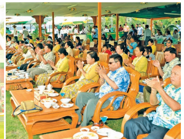
Commander-in-Chief of Defence Services Senior General Min Aung Hlaing enjoys entertainment programmes of water festival in Nay Pyi Taw.

NAY PYI TAW, 14 April — Commander-in-Chief of Defence Services Senior General Min Aung Hlaing, and wife joined the Thingyan New Year Water Festival of the families of the Office of the Commander-in-Chief on Tuesday, the first official day of the festival.