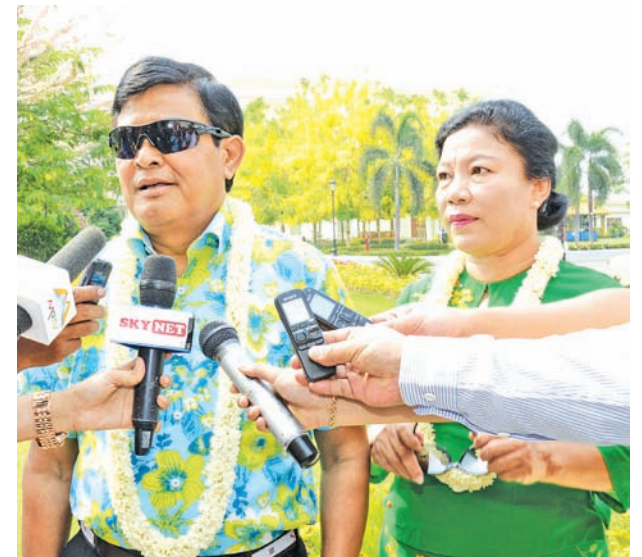
President U Thein Sein, Vice Presidents Dr Sai Mauk Kham and U Nyan Tun and their wives express their wishes all citizens possessing “peace of mind, health of body and a fulfilling life”.