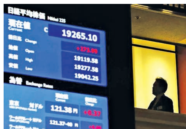
A man stands next to a stock quotation board displaying Japan's Nikkei Average (top) and the exchange rates between the Japanese yen and the US dollar at the Tokyo Stock Exchange in Tokyo on 13 March, 2015.—REUTERS

Japan's Nikkei dithered around 19,900 having struggled to sustain a break above the 20,000 barrier.