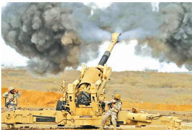
A Saudi artillery unit fires shells towards Houthi positions from the Saudi border with Yemen on 13 April, 2015.—REUTERS

Hammad said the situation was under control, although the refinery is within range of fire from outside the perimeter of the complex, which covers an area of around 20 square kilometres.—Reuters