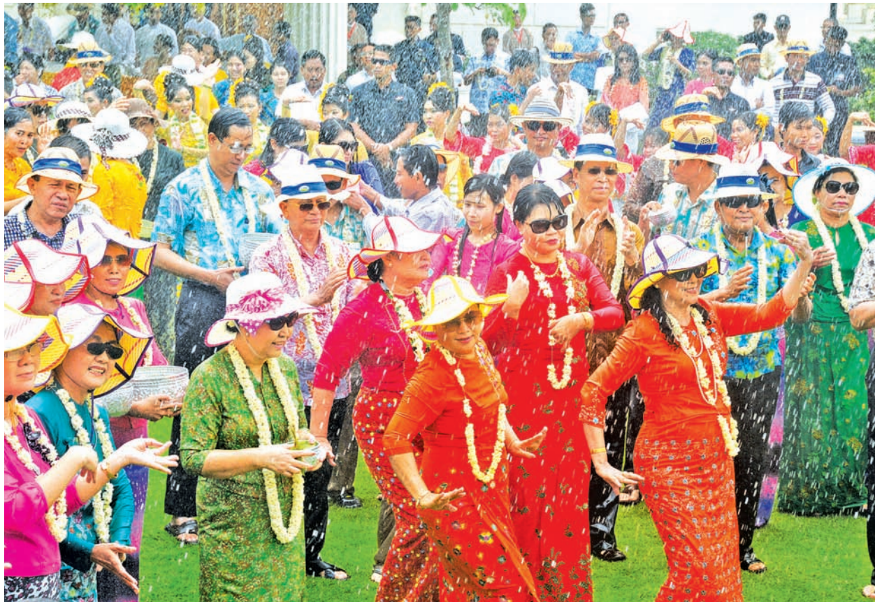
President U Thein Sein enjoys Maha Thingyan Festival at Presidential Palace.