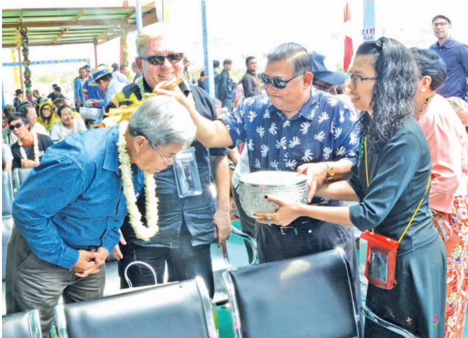
Union Minister U Wunna Maung Lwin sprinkling fragrant water on a diplomat on Myanmar New Year water festival's Akya Day.

NAY PYI TAW, 14 April — Diplomats of foreign missions, officials of UN agencies and family members led by Union Minister for Foreign Affairs U Wunna Maung Lwin and wife Tuesday enjoyed water-throwing festival at pandals of Nay Pyi Taw FC, Tawwin Nay Pyi Taw and Shwe Than Lwin Company in Nay Pyi Taw Hotel Zone.