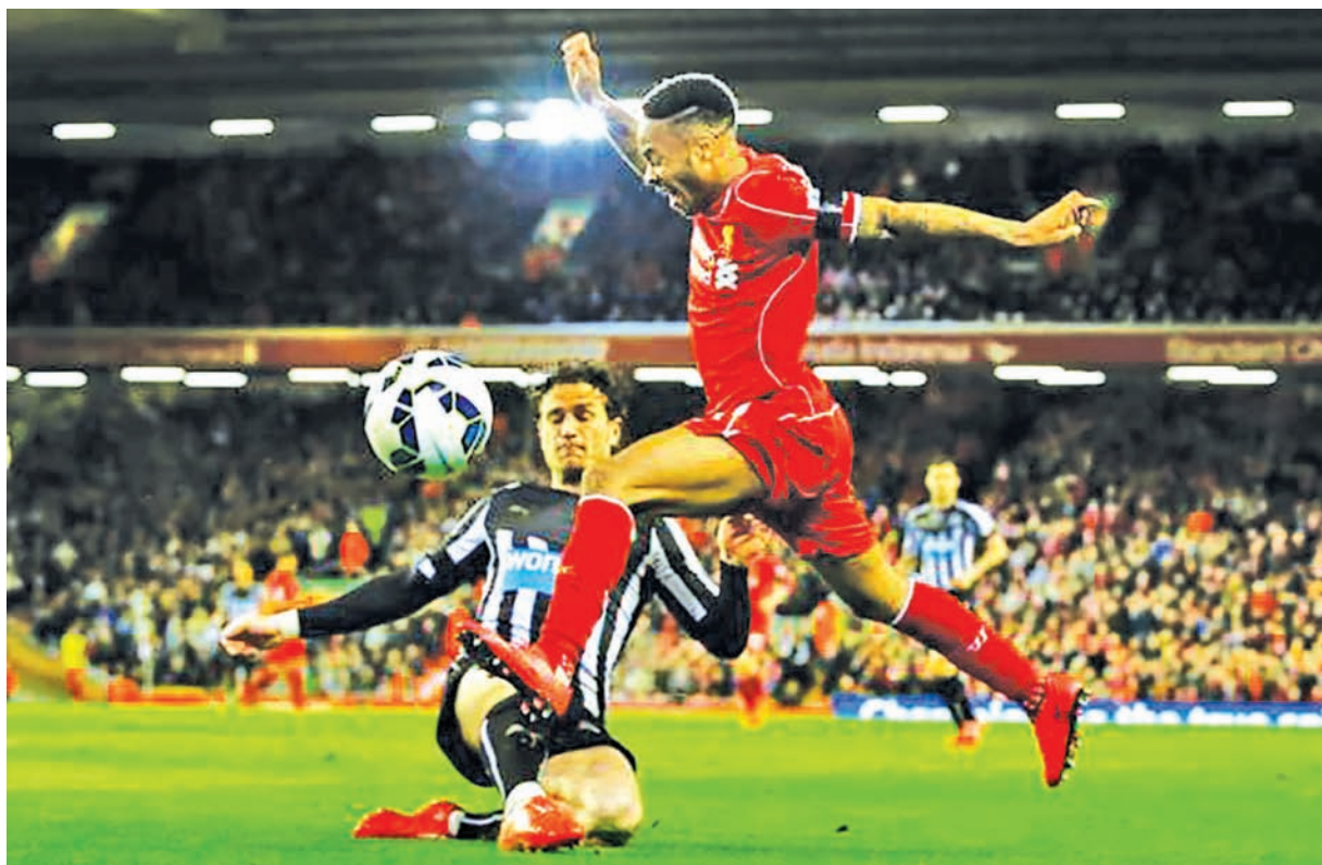
Liverpool's Raheem Sterling in action with Newcastle's Daryl Janmaat during their Barclays Premier League at Anfield on 13 April, 2015.

LIVERPOOL, 14 April — Liverpool kept alive their hopes of Champions League football next season with a comfortable 2-0 Premier League victory on Monday against a Newcastle United side who finished with 10 men.