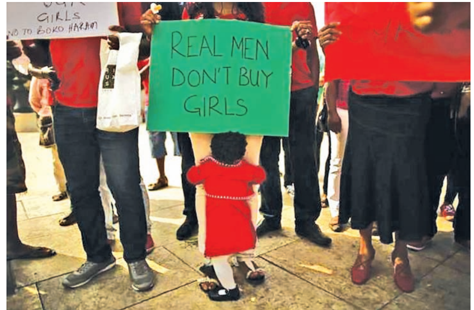
Nigerians take part in a protest, called by Malaga's Nigerian women Association, for the release of the abducted secondary school girls in the remote village of Chibok in Nigeria, at La Merced square in Malaga, southern Spain on 13 May, 2014.

"These appalling executions, the sexual violence, the recruitment of child soldiers, these are war crimes and crimes against human-