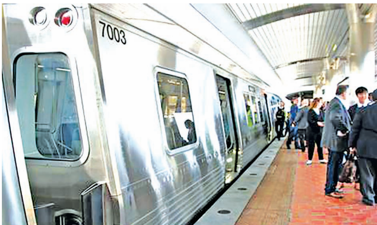
A new train developed by Japan's Kawasaki Heavy Industries Ltd is introduced at a subway station near Washington on 13 April, 2015, for a test-ride event, prior to the start of service the following day. The operator of the Washington subway system is expected to introduce up to 748 trains from the Japanese manufacturer by the end of 2018.