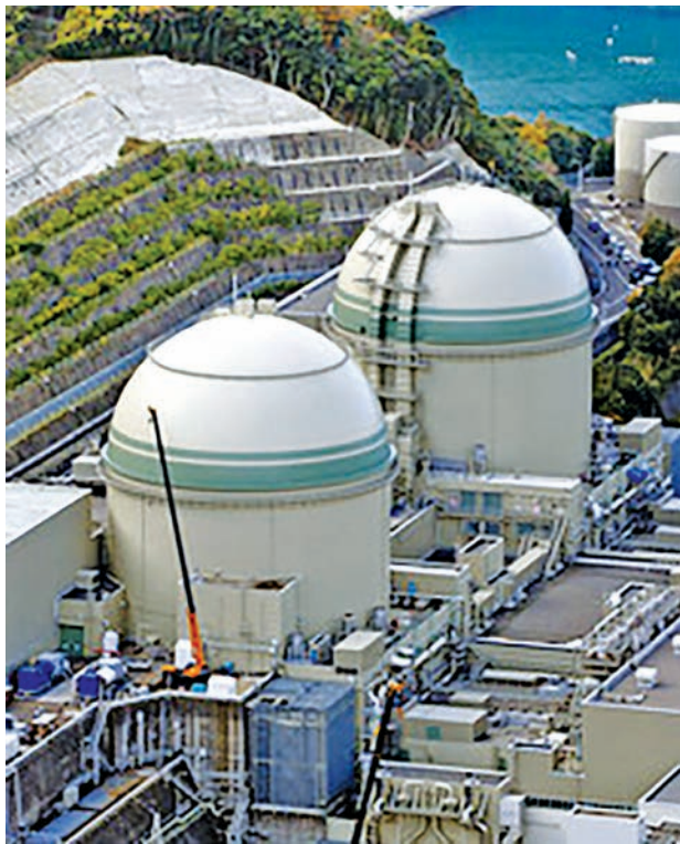
File photo taken in November 2014 shows the Nos 3 (front) and 4 reactor buildings at Kansai Electric Power Co's Takahama nuclear power plant in the town of Takahama on the Sea of Japan coast. The Fukui District Court issued an injunction on 14 April, 2015, ordering the utility not to restart the reactors at the plant that have cleared safety screening by the nation's nuclear safety regulator.

FUKUI, (Japan), 14 April — A court issued an injunction on Tuesday ordering Kansai Electric Power Co. not to restart two reactors at its Takahama nuclear power plant on the Sea of Japan coast that have cleared safety screening by the nation's nuclear safety regulator.