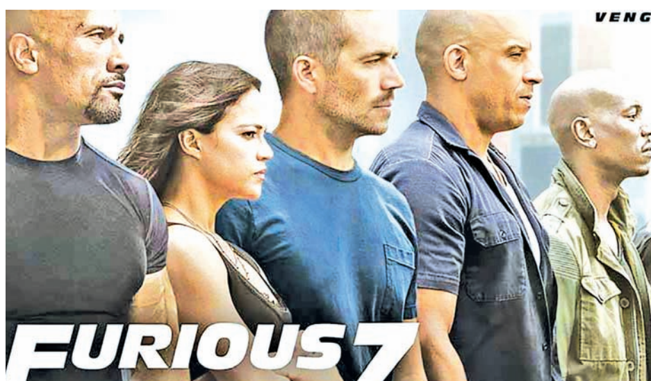
'Furious 7' collection in India stands at USD 20.8 million.—PTI

million to end the week-end with a 10-day total of USD 252.2 million, which is more than the USD 239 that "Furious 6" collected in entire run, said the Hollywood Reporter.