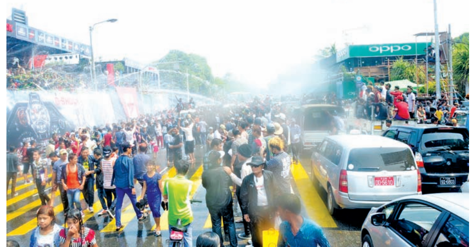
Kabar Aye Pagoda Road, Pyay Road and Kandawgyi Road, attracting throngs of revelers.—GNLM

For revelers, a hired car costs around K150,000 per day. The Yangon City Development Committee has allowed the construction of more than 200 pandals of varying sizes to celebrate the traditional Myanmar New Year Water Festival in Yangon. More than 40 big water-throwing pandals are lined up along