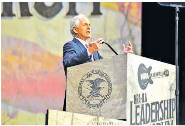
US Senator Bob Corker (R-TN) speaks during the National Rifle Association's annual meeting in Nashville, Tennessee on 10 April, 2015.

WASHINGTON, 14 April — US senators scrambled to shore up bipartisan support for a controversial Iran nuclear bill before a committee meeting on Tuesday that could determine whether the legislation will survive President Barack Obama's promised veto.