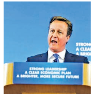
Britain's Prime Minister David Cameron delivers a speech at St Luke's Church Hall in Cheltenham, England on 12 April, 2015.

LONDON, 14 April — British Prime Minister David Cameron is expected to use the launch of his party's manifesto on Tuesday to promote a "Conservative dream" aimed at seducing low-paid workers as he seeks to make a shift towards more positive campaigning.