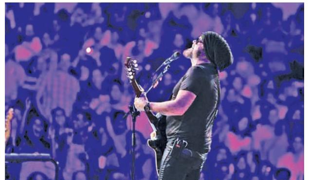
Musician Carlos Varela, dubbed "The Poet of Havana," known for his subtle political lyrics, performs in concert at the National Theater in Havana on 7 Jan, 2013 in this photo released to Reuters on 12 April, 2015.

TAMPA, (Fla), 14 April — Singer-songwriter Carlos Varela, dubbed "The Poet of Havana," has walked a cultural tightrope in Cuba for decades, questioning the island's communist government in his lyrics, while also hitting out at Washington's five-decades-old trade embargo.