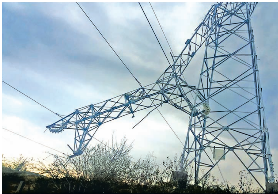
Photo shows damages of Z2 suspension tower number 144 linking Patpin and Kalaw townships near Taunggyi Township.—MNA

After the power line was temporarily substituted with 132 KV national grid number 2 by the 35 staff members of electricity department, power could be re-distributed at around 3 p.m.—MNA