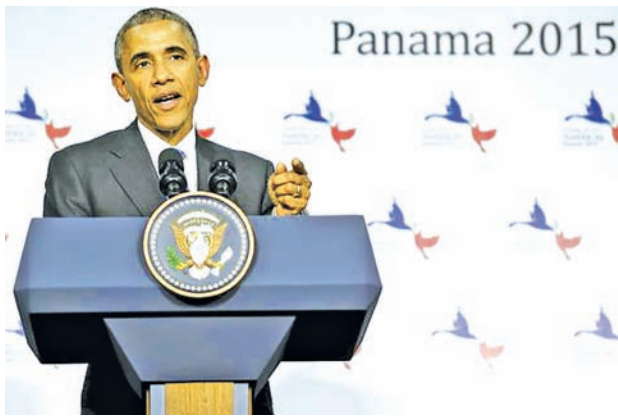
US President Barack Obama holds a news conference at the conclusion of the Summit of the Americas in Panama City, Panama on 11 April, 2015.