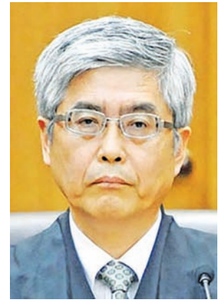
Photo shows Hideaki Higuchi, a judge at the Fukui District Court. In a trial in which Higuchi served as the presiding judge, the court issued an injunction on 14 April, 2015, ordering Kansai Electric Power Co. not to restart two reactors at the Takahama nuclear power plant on the Sea of Japan coast that have cleared safety screening by the nation's nuclear safety regulator.