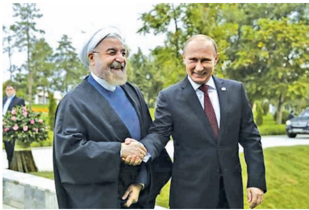
Russia's President Vladimir Putin (R) shakes hands with his Iranian counterpart Hassan Rouhani at the welcoming ceremony during a summit of Caspian Sea regional leaders in the southern city of Astrakhan, on 29 Sept, 2014.

Moscow, 14 April — Russia paved the way on Monday for missile system deliveries to Iran and started an oil-for-goods swap, signaling that Moscow may have a head-start in the race to benefit from an eventual lifting of sanctions on Teheran.