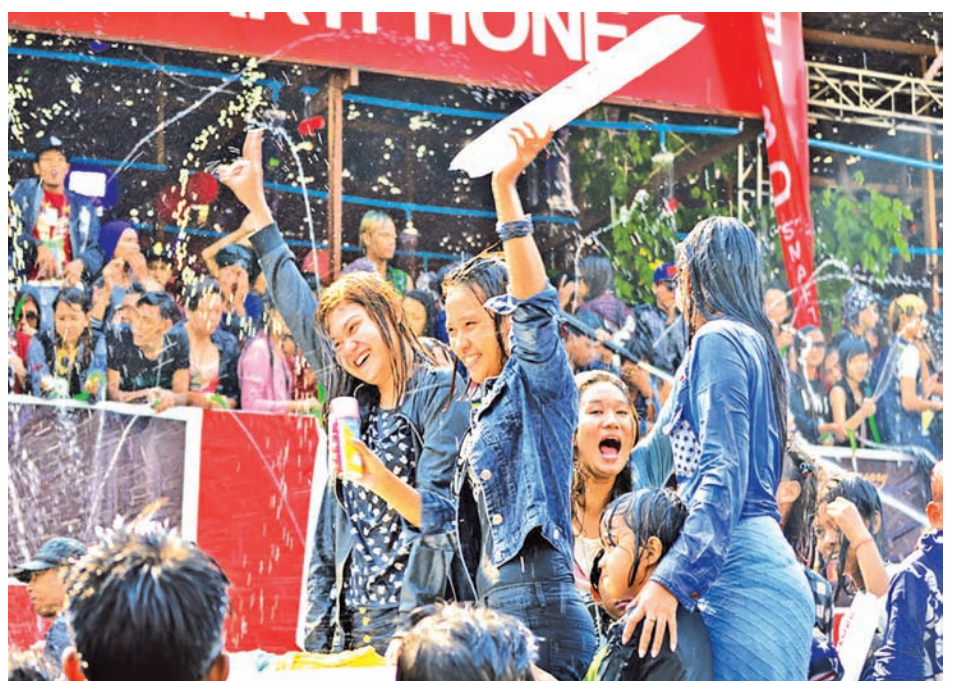
Cheerful Thingyan revelers enjoy Akyo Day, the second day of the Myanmar New Year Water Festival, on Kaba-Aye Pagoda Road in Yangon on Tuesday.—PHOTO: YE MYINT

Pyay Road, where there are few entertainment stages with water-throwing pavilions, was also filled with merrymakers in cars.—GNLM