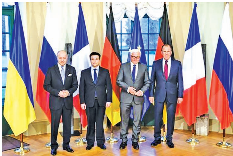
French Foreign Minister Laurent Fabius, Ukrainian Foreign Minister Pavlo Klimkin, German Foreign Minister Frank-Walter Steinmeier and Russian Foreign Minister Sergei Lavrov pose for a group photo in Berlin on 13 April, 2015.

The talks took place amid a sharp spike in hostilities in eastern Ukraine over the weekend. On Monday one Ukrainian serviceman was killed and six were