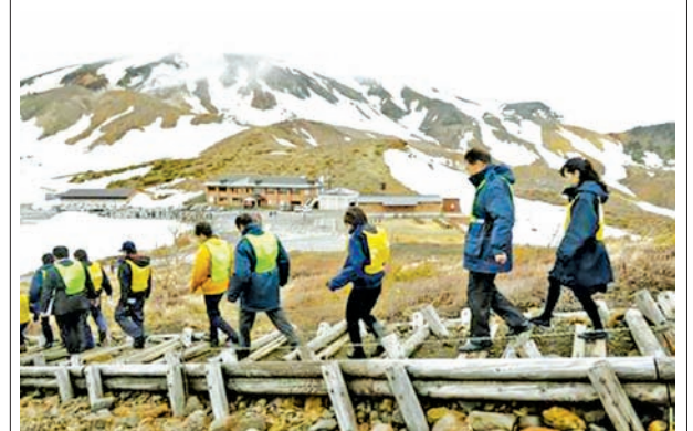
Local officials take part in a drill simulating a volcanic eruption at Mt Azuma in Fukushima city in northeastern Japan on 14 April, 2015, prior to the loosening of restrictions of entry to the mountain on 17 April.