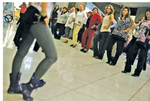
Local government employees participate in a mandatory physical activity session at their office in downtown Mexico City on 14 Aug, 2013.

Hitchens believes companies have a long way to go before they see their employ-