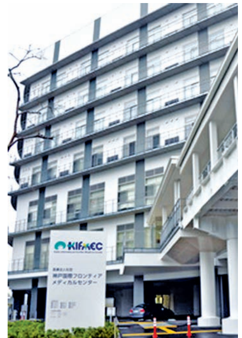
Photo taken on 14 April, 2015 shows the Kobe International Frontier Medical Centre in Kobe, western Japan.