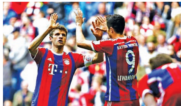
Bayern Munich's Thomas Mueller (L) and Robert Lewandowski celebrate their team's third goal against Eintracht Frankfurt during their German first division Bundesliga soccer match in Munich, on 11 April, 2015.

Winger Ricardo Quaresma was again on target for them taking his tally to three goals in two matches.