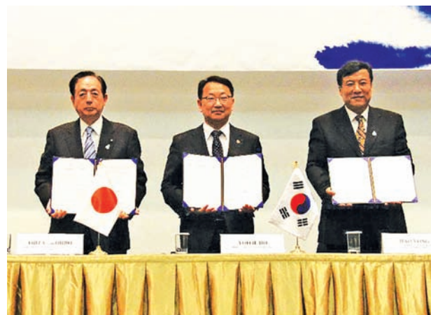
China's Vice Minister of Water Resources Jiao Yong, South Korea's Minister of Land, Infrastructure and Transport Yoo Il-ho and Japan's Minister of Land, Infrastructure, Transport and Tourism Ohta Akihiro (R-L) pose for photo after signing a joint statement during a trilateral ministerial meeting at the seventh World Water Forum held in Gyeongju, South Korea, on 13 April, 2015. China, South Korea and Japan on Monday agreed to strengthen trilateral cooperation on water policy innovation during the seventh World Water Forum held in South Korea's southeastern cities of Daegu and Gyeongju.

The three sides signed a joint statement to strengthen trilateral cooperation on water-related issues under the topic "Water Policy Innovation in Response to Persistent and Emerging Water Challenges".