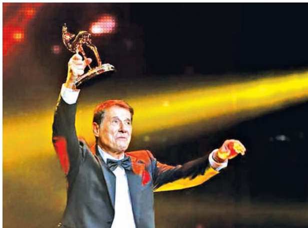
Udo Jürgens holds up his trophy for Lifetime Achievement during the Bambi 2013 media awards ceremony in Berlin on 14 Nov, 2013.

BERLIN, 14 April — A German musical celebrating 20 of the top hits from pop star Udo Jürgens has become the show to see in Berlin after the German-speaking world's answer to Frank Sinatra died at the age of 80 late last year.