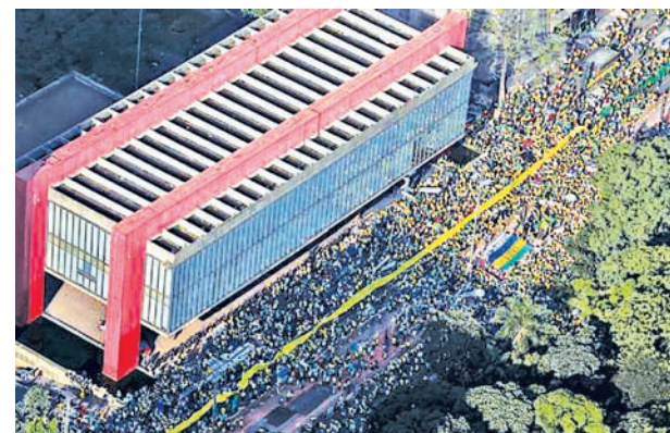
Demonstrators take part in a protest against Brazil's President Dilma Rousseff in front of Sao Paulo Art Museum on 12 April, 2015.

"Impeachment Now" read a banner stretching