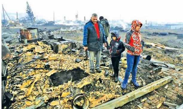
Local residents stand amidst the debris of a burnt building in the settlement of Shyra, damaged by recent wildfires, in Khakassia region on 13 April, 2015.