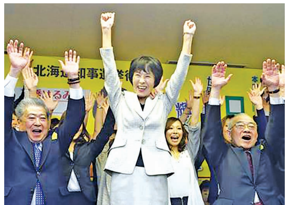
Harumi Takahashi (C) and her supporters celebrate her victory in the Hokkaido gubernatorial race on 12 April, 2015, in Sapporo. Incumbent Takahashi, backed by Prime Minister Shinzo Abe's ruling Liberal Democratic Party and its junior coalition partner the Komeito party, was projected to have beaten Noriyuki Sato, a former television anchor backed by the Democratic Party of Japan and other opposition parties.

Among the five mayoral elections, the battle in Sapporo was the only one fought between the two