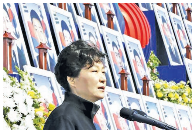
South Korean President Park Geun-hye.

SEOUL, 13 April—South Korean President Park Geun-hye will not attend an event in Moscow to mark the end of World War Two in Europe and instead send an envoy, an official