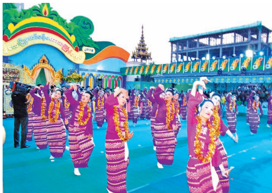
Damsels perform entertainment at Mayor's pandal in Mandalay Maha Thingyan festival.—TIN MAUNG (MANDALAY)