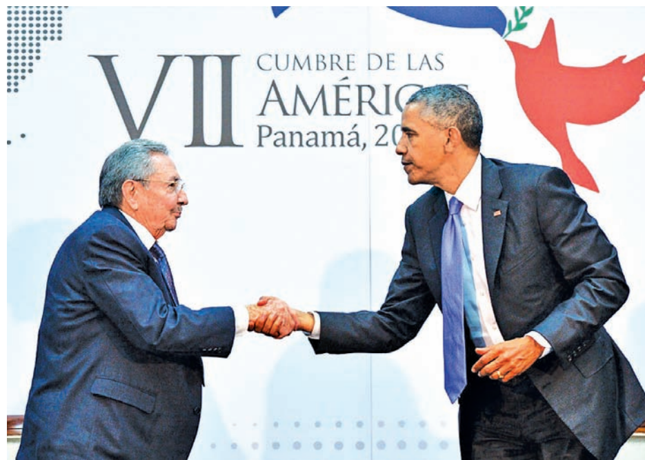
Cuban leader Raul Castro and US President Barack Obama.

Cuba has shown no signs that it is willing to allow wider political rights. The government dismisses dissidents as mercenaries,