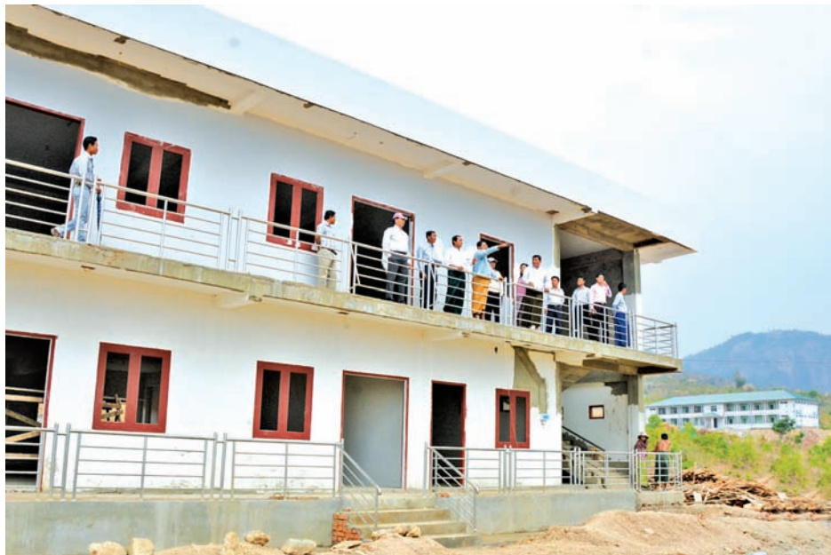
Photo shows completion of buildings for Fine Arts College (Nyaungshwe) in Shan State.