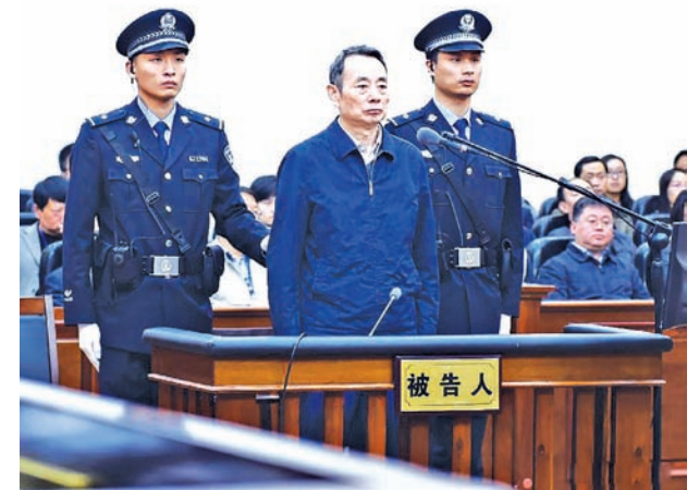
Jiang Jiemin (C), former head of the State-owned Assets Supervision and Administration Commission, stands trial at the Hanjiang Intermediate People's Court in central China's Hubei Province on 13 April, 2015. Jiang went on trial Monday on charges of taking bribes, possessing a large number of assets from unidentified sources and abusing power while performing duty for the state-owned China National Petroleum Corporation.