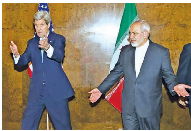
US Secretary of State John Kerry (L) and his Iranian counterpart Mohammad Javad Zarif discuss seating arrangements for a meeting during a new round of nuclear negotiations in Montreux on 2 March, 2015.