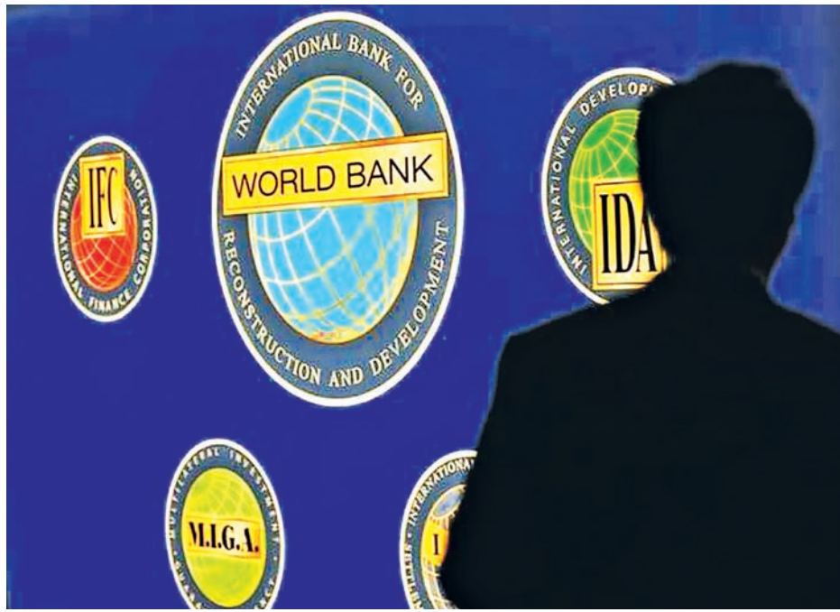
A man is silhouetted against the logo of the World Bank at the main venue for the International Monetary Fund (IMF) and World Bank annual meeting in Tokyo on 10 Oct, 2012.

While the impact of low oil prices will vary from country to country, the World Bank said the