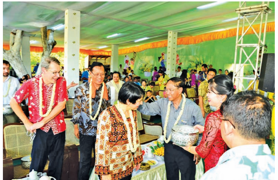
Yangon Region Chief Minister U Myin Swe sprays fragrant water on a diplomat at Yangon Region Government Office pandal.

YANGON, 13 April—As Myanmar New Year Water Festival was launched Monday nationwide, Yangon Region Chief Minister U Myin Swe and officials from foreign embassies enjoyed the festival at Yangon Region Government Office pandal.