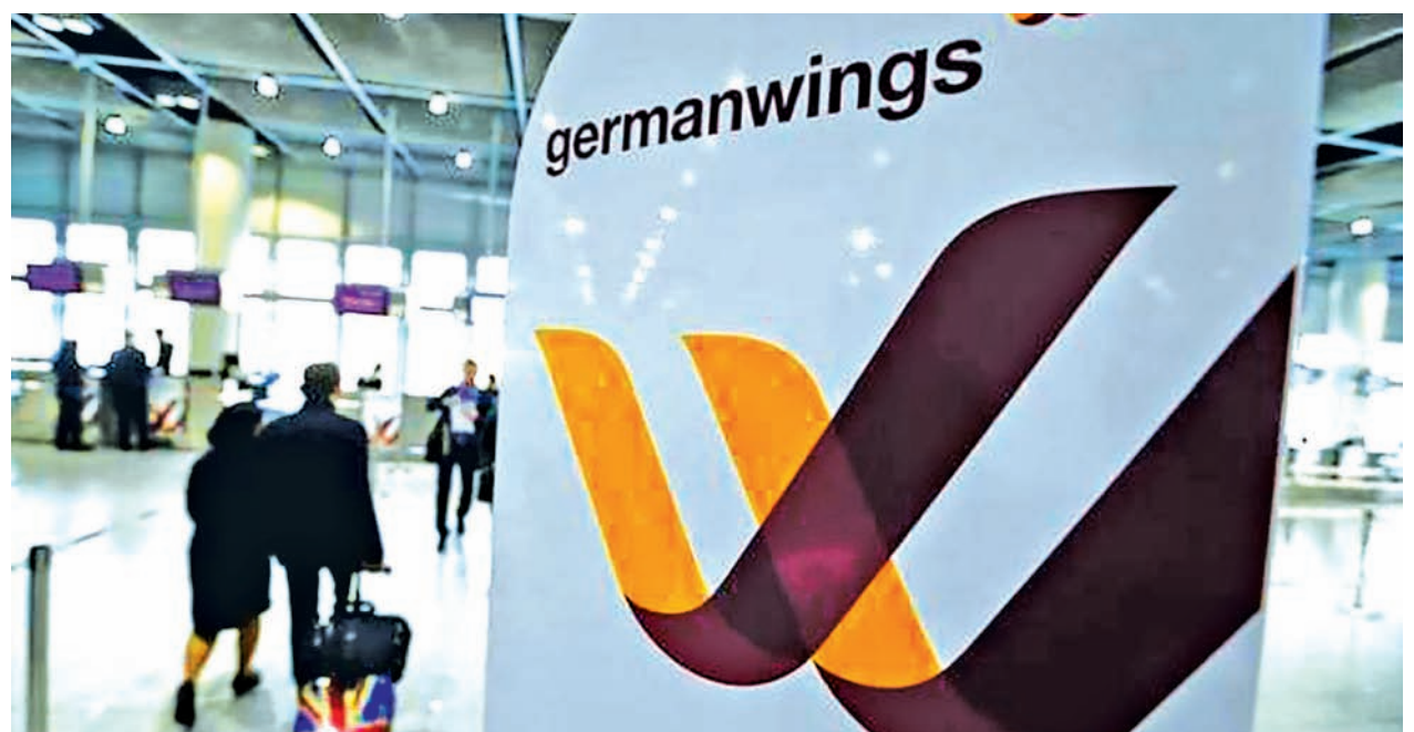
The logo of Germanwings is pictured in Duesseldorf airport on 24 March, 2015.

A total of 132 people were aboard the plane, including 126 passengers and six crew members, Spiegel-Online reported.