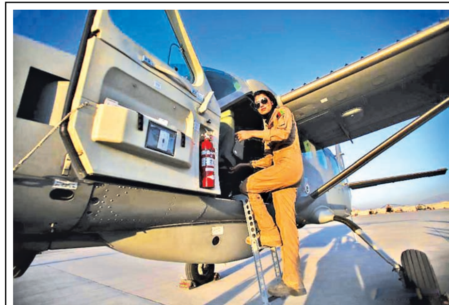
Niloofar Rahmani gets on a military plane at a military airport in Kabul, Afghanistan on 12 April, 2015. Born in 1992, Rahmani is the first Afghan female fixed-wing Air Force aviator.

“The airport is working with our IT service providers to review website security protocols.”—Xinhua