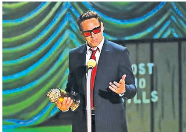
"Iron Man" Robert Downey Jr

LOS ANGELES, 13 April — In a night of vagina jokes, naughty humour and a crotch-grab at the irreverent MTV Movie Awards, teen cancer romance "The Fault In Our Stars" walked away the big winner while "Iron Man" Robert Downey Jr delivered wise words for the youth-orientated show.