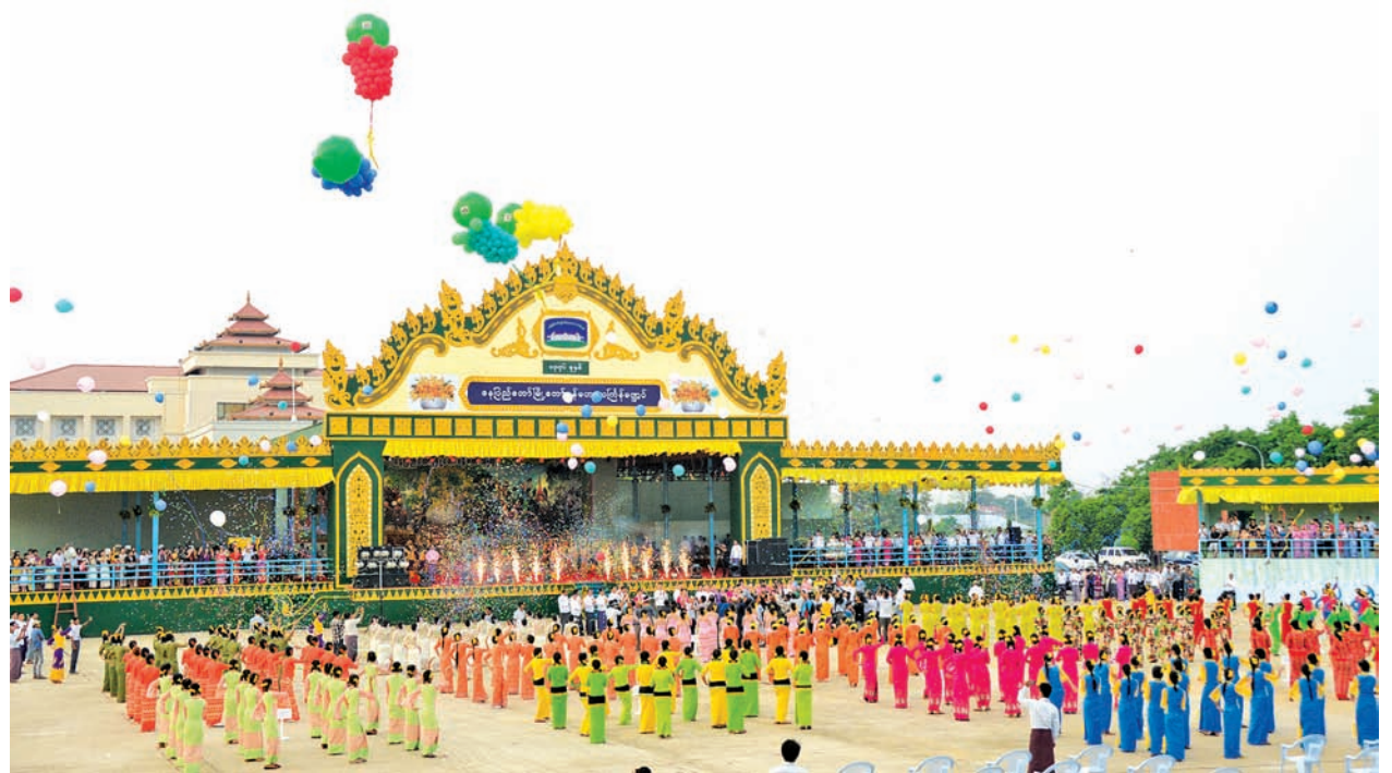
The opening ceremony of Mayor's central pandal in progress in Nay Pyi Taw Maha Thingyan festival.—MNA