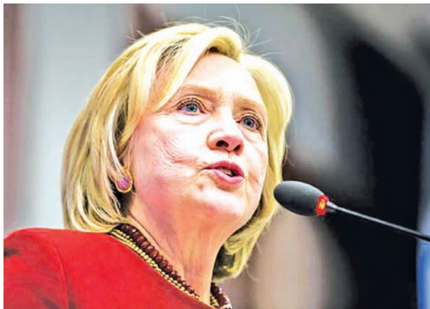
Former US Secretary of State Hillary Clinton delivers remarks during the 2015 Toner Prize for Excellence in Political Reporting award in Washington on 23 March, 2015.

NEW YORK/ WASHINGTON, 13 April — Hillary Clinton cast herself as a champion for everyday Americans on Sunday, kicking off her long-awaited second run for the White House with a vow to fight for those recovering from tough economic times.