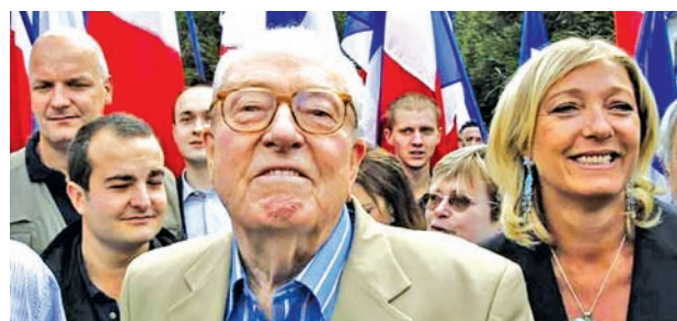
Marine Le Pen (R), France's National Front political party leader, and her father Jean-Marie Le Pen arrive for a meeting in Cormont, in this file picture taken on 29 Aug, 2010.

PARIS, 13 April — Jean-Marie Le Pen, founder of France's far-right National Front, has said he will not seek the party's ticket for regional polls later this year after a damaging public row with his daughter Marine, now the party leader.