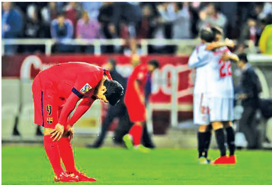
Barcelona's Luis Suarez is seen after the end of their Spanish first division soccer match against Sevilla at Ramon Sanchez Pizjuan stadium in Seville, 11 April, 2015.