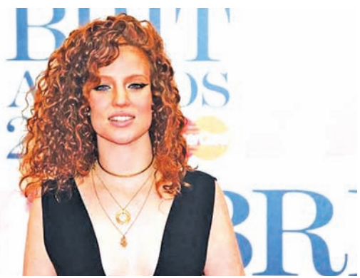
Singer Jess Glynne arrives for the BRIT music awards at the O2 Arena in Greenwich, London, on 25 Feb, 2015.