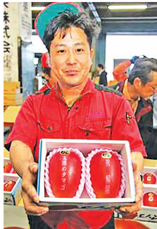
A man holds a box of two mangoes under the brand “Taiyo no Tamago” (Egg of the Sun) at the local central wholesale market in the city of Miyazaki, southwestern Japan, on 13 April, 2015. The pair fetched 300,000 yen at the year’s first auction of mangoes the same day, tying the record high.

MIYAZAKI, (Japan) 13 April—A brand-name pair of mangoes from Miyazaki Prefecture fetched 300,000 yen ($2,495) on Monday in this season’s first auction at a local wholesale market, setting the same record high as marked last year. Mangoes of this variety, called “Taiyo no Tamago” (Egg of the Sun), are selected under strict criteria such as weight of more than 350 grams each and a high level of sugar content. This year’s production is