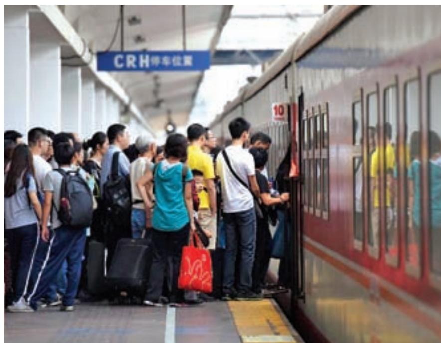
Passengers queue to get on train at the Guangzhou Railway Station in Guangzhou, capital city of south China's Guangdong Province, on 4 April, 2015. Guangzhou received a travel rush during China's traditional Qingming Festival, or Tomb-sweeping Day, which falls on 5 April this year.