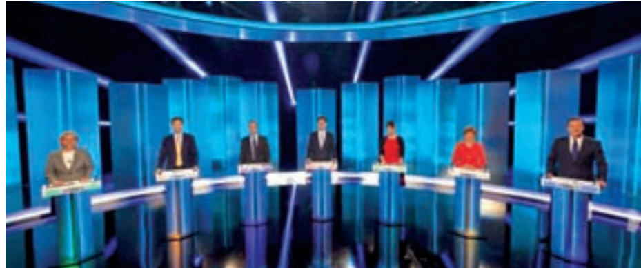
(L-R) Natalie Louise Bennett the leader of the Green Party, Nick Clegg the leader of the Liberal Democrats, Nigel Farage the leader UKIP, Ed Miliband the leader of the Labour Party, Leanne Wood the leader of Plaid Cymru, Nicola Sturgeon the leader of the Scottish National Party (SNP) and David Cameron the leader of the Conservative Party and Britain's current Prime Minister stand during the leaders televised election debate at Media City in Salford in North England, in this 2 April, 2015 handout picture provide by ITV.

SALFORD, (England), 4 April — The main TV debate of Britain's national election campaign yielded no clear victor with four opinion polls producing four different winners, but David Cameron's attempt to appear the most statesman-like appeared to have paid off.