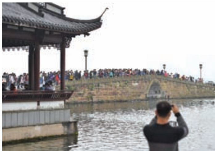
Tourists walk on the Bai Causeway at the West Lake in Hangzhou, capital city of east China's Zhejiang Province, on 4 April, 2015. Saturday was the first day of three-day-long holiday of Qingming Festival, or Tomb-sweeping Day.