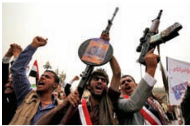
Supporters of Yemen's former President Ali Abdullah Saleh, hold up their weapons during a rally against airstrikes, in Sanaa on 3 April, 2015.

The Houthis, fighting alongside soldiers loyal to former president Ali Abdullah Saleh, emerged as the