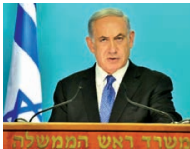
Israeli Prime Minister Benjamin Netanyahu delivers a statement to the press at the Prime Minister's office in Jerusalem, on 3 April, 2015. Israeli Prime Minister Benjamin Netanyahu said on Friday any framework agreement between Iran and the international community must commit to recognizing Israel's right to exist.

Obama, who called Thursday's agreement a "historic understanding", called Netanyahu within hours of the talks concluding, saying the deal represented progress toward a lasting solu-