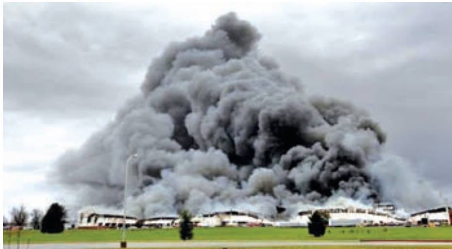
Nearly 200 firefighters battle a massive five-alarm fire at in building six General Electric Appliance Park in Louisville, Kentucky, on 3 April, 2015.

Smoke from the fire at GE's Appliance Park could be seen more than 10 miles (16 km) away, and debris was found more than a half-mile away. Televised aerial footage showed a raging fire, dense dark smoke and collapsed building walls.