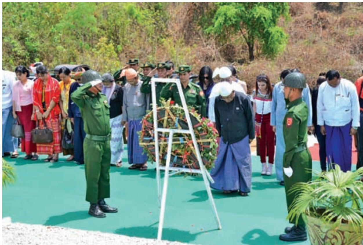
Speaker of Amyotha Hluttaw U Khin Aung Myint lays a wreath at the Memorial for Fallen Heroes in Lashio.—MNA

Yangon Region Chief Minister U Myint Swe observes booths displayed at ceremony to mark International Day of Mine Awareness and Assistance in Mine Action.—MNA