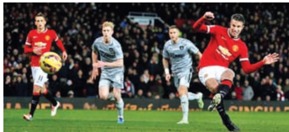
Manchester United's Robin van Persie (R) scores his team's third goal from a penalty during their English Premier League soccer match against Burnley at Old Trafford in Manchester, northern England on 11 February, 2015.

Van Gaal explained later in his news conference: "We have a process for injured players in the medical department, they then go to a football coach for tests and then to me. "Robin still isn't with the football coach. Reuters