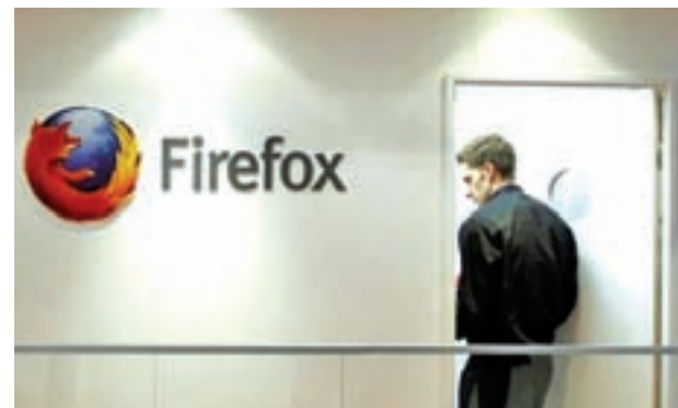
A man is seen next to a Firefox logo at a Mozilla stand during the Mobile World Congress in Barcelona, on 28 Feb, 2013.