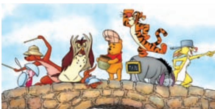
Disney is working on a new adaptation of A A Milne’s “Winnie the Pooh (2017)”.

Disney remakes include “The Jungle Book” from director Jon Favreau, “Beauty and the Beast (2017)” from director Bill Condon, and “Dumbo” from director Tim Burton. They join “Alice in Wonderland”, “Maleficent”, and “Cinderella”.