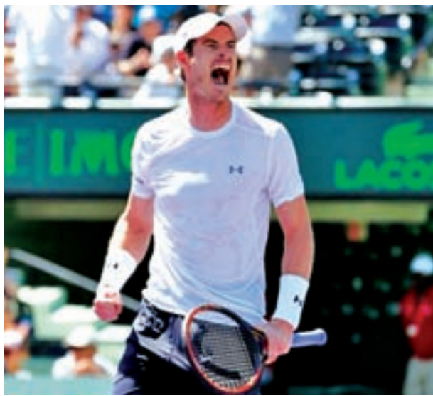
Andy Murray celebrates after his match against Tomas Berdych in a men's singles semi-final on day twelve of the Miami Open at Crandon Park Tennis Centre, Key Biscayne, FL, USA on 3 April, 2015.

The big-serving American was unable to create a