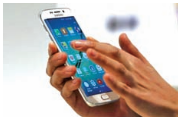
A hostess displays the new Samsung Galaxy S6 Edge smartphone during the Mobile World Congress in Barcelona on 2 March, 2015.—REUTERS

Samsung and Qualcomm did not immediately reply to requests for comment.—Reuters