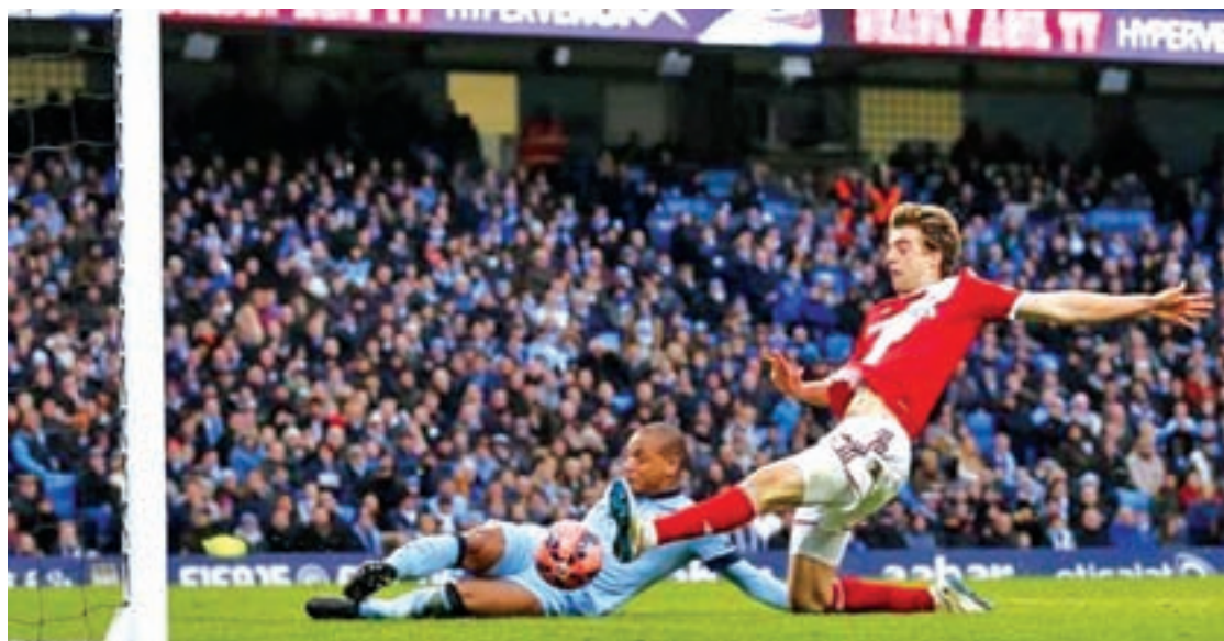
Middlesbrough's Patrick Bamford (R) scores past Manchester City's Fernando Reges during their English FA Cup 4 th round soccer match at the Etihad Stadium in Manchester, northern England on 24 Jan, 2015.