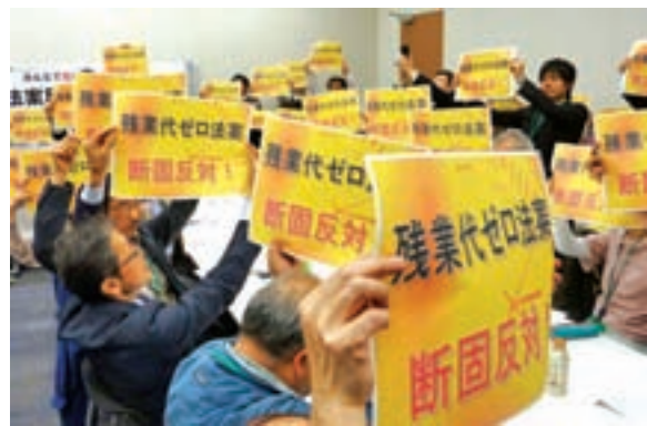
Participants in a rally held in Tokyo by the Labour Lawyers Association of Japan on 3 April, 2015, raise signs bearing a message expressing their opposition to a planned bill to scrap working-hour limits for high-income professionals with annual salaries of 10.75 million yen ($90,000) or more. Under the so-called white-collar exemption system, people who engage in research and development, and other professionals such as dealers at financial institutions will be given the option of being exempt from working-hour regulations.