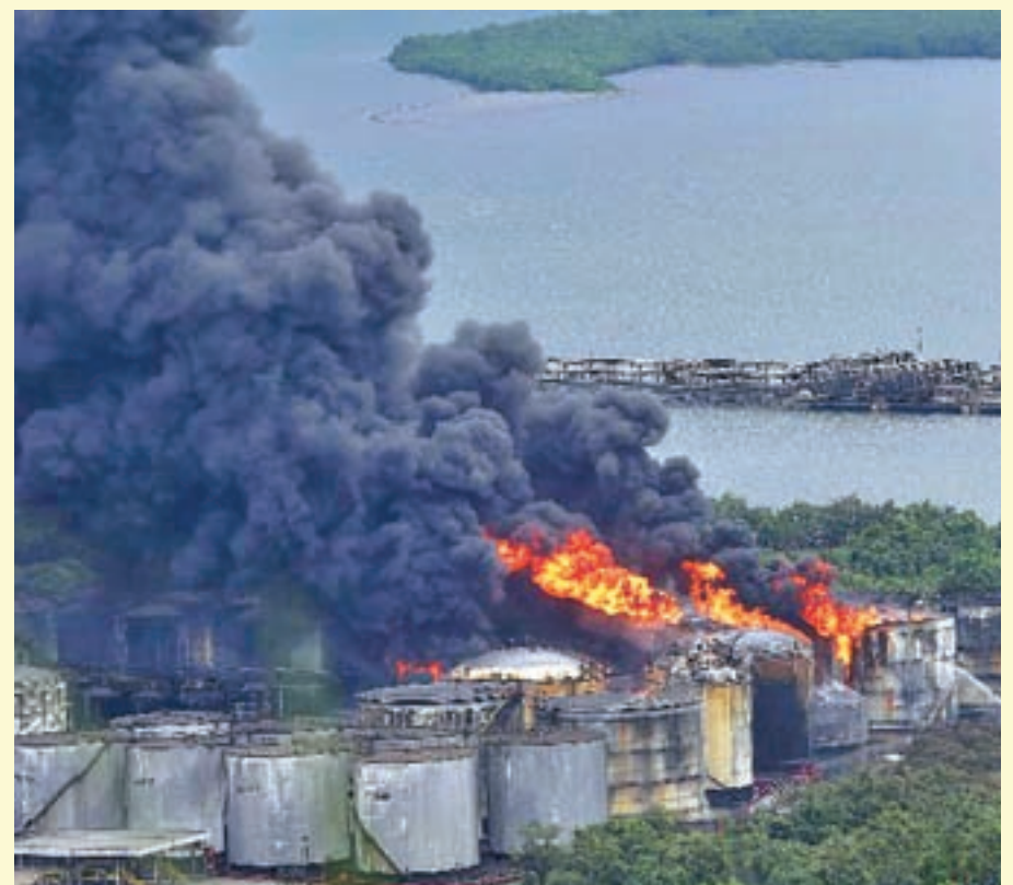
Heavy smoke and blaze are seen at a liquid storage facility of Ultracargo, one of the major liquid storage companies of Brazil, in Santos, Sao Paulo state in Brazil, on 3 April, 2015. The fire broke out here on Thursday, according to the local press.