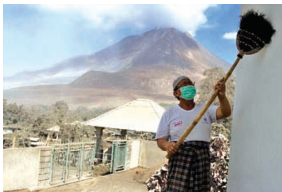
A man cleans the ash from volcanic eruption of Mount Sinabung at Kuta Tengah village in Karo district of Indonesia's North Sumatra Province, on 3 April, 2015. Mount Sinabung volcano in Karo district of Indonesia's North Sumatra province erupted on Thursday afternoon, spewing a column of ash by up to 2 km to the sky and triggering small-scale evacuation, official said here earlier on Friday.