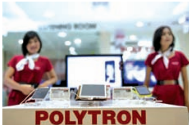
Employees at a Polytron showroom pose with the company's line of smartphones and tablets in a shopping mall in Jakarta on 1 April, 2015.