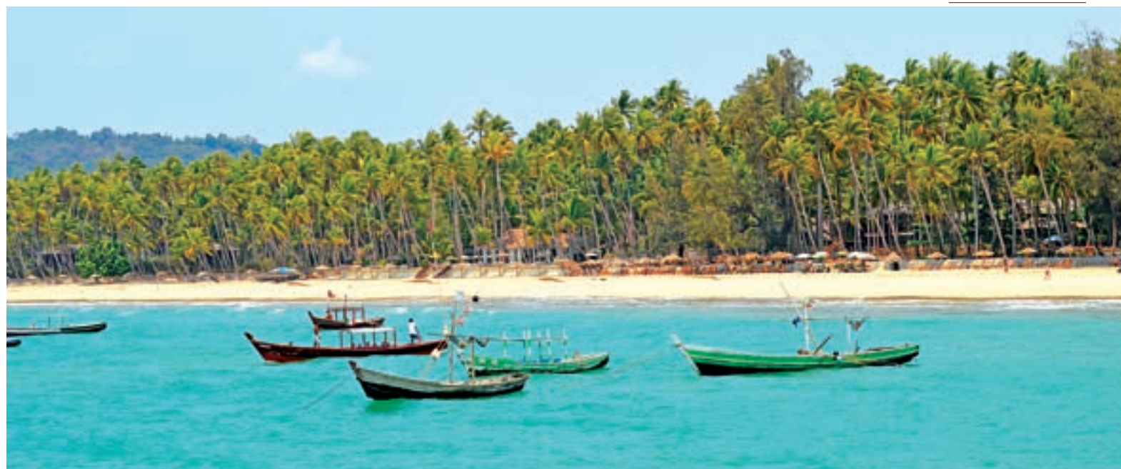
Ngapali is increasingly famed for its pristine natural environment.

According to the Ministry of Hotels and Tourism, measures are being taken to preserve Ngapali’s ecosystem and environment by banning taking sand from beach, destroying submerged rocks and reefs, and littering.