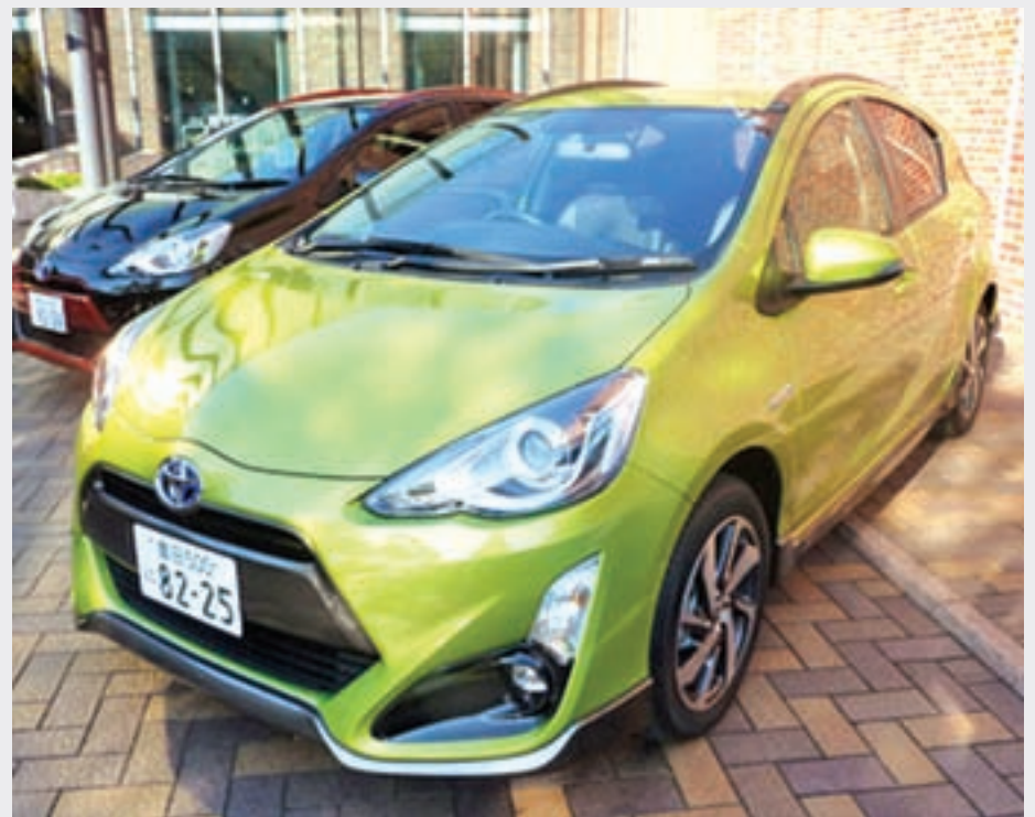
File photo taken in December 2014 in Nagoya, central Japan, shows a model of Toyota Motor Corp’s Aqua hybrid. The Aqua is likely to have been the top-selling car in Japan in fiscal 2014, maintaining top spot for the third straight year, with sales estimated at about 228,000 vehicles, industry sources said on 3 April, 2015.

The Tanto is believed to have ranked second in fiscal 2014 with estimated sales of about 215,000, the sources said.