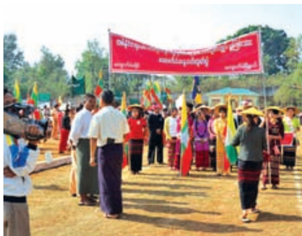
People take to street to show their support for draft peace deal between the government and armed groups.