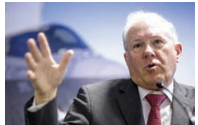
US Defense Acquisition Chief Frank Kendall speaks to journalists at a news conference at the 2014 Farnborough International Airshow in Farnborough, southern England on 14 July, 2014.

WASHINGTON, 4 April — The US government would support selling General Atomics' electromagnetic launching system for aircraft carriers, and other key technologies, to India, the Pentagon's chief weapons buyer told Reuters on Friday.