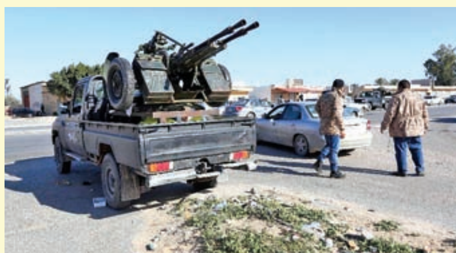
Libya Dawn fighters check passing cars near a local checkpoint in the al-Tusha area, west of al-Azizia, Libya, on 3 April, 2015. Clashes continued in al-Azizia on Wednesday between pro-government forces and the Islamist armed coalition Libya Dawn.

Britain's government said last week it would reinforce its military presence on the Falklands to counter the "very live threat" posed by Argentina. Argentina dismisses such talk as posturing ahead of upcoming British elections.— Reuters