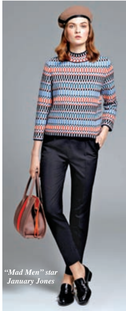
“Mad Men” star January Jones

LONDON, 4 April — “Mad Men” star January Jones says marriage isn’t important to her because she does not “need the tax write-off”.