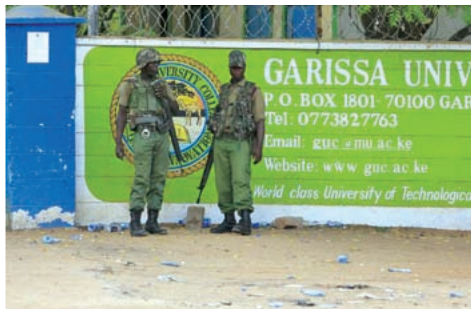
Kenya Administration policemen stand in front of Garissa University College in Garissa on 4 April, 2015.—REUTERS

The raid on Thursday was the biggest attack on Kenya since 1998, when al-Qaeda bombed the US embassy in the capital Nairobi and killed more than 200 people.— Reuters