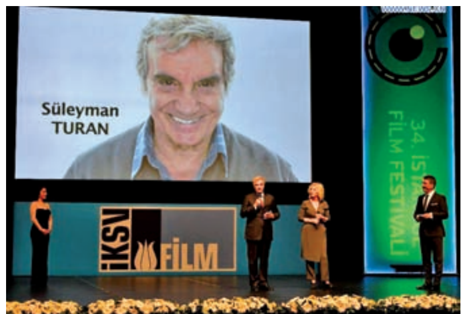
Turkish director Suleyman Turan (2 nd L) makes a speech at the opening ceremony of 34 th Istanbul International Film Festival in Istanbul, Turkey on 3 April, 2015. Over 200 films from Turkey and around the world, including Chinese movie “The Golden Era”, will be shown in the following 16 days of 34 th Istanbul International Film Festival.