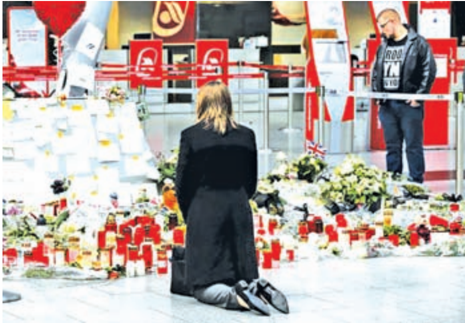
A woman kneels in front of candles and flowers as she prays for the victims of Germanwings Flight 4U9525 at Duesseldorf airport on 1 April, 2015.

Bild said that documents available to the investigators had also revealed that Lubitz had said he was involved in a car crash at the end of 2014. He was apparently injured when the airbag opened and had complained of trauma and vision problems since the incident.