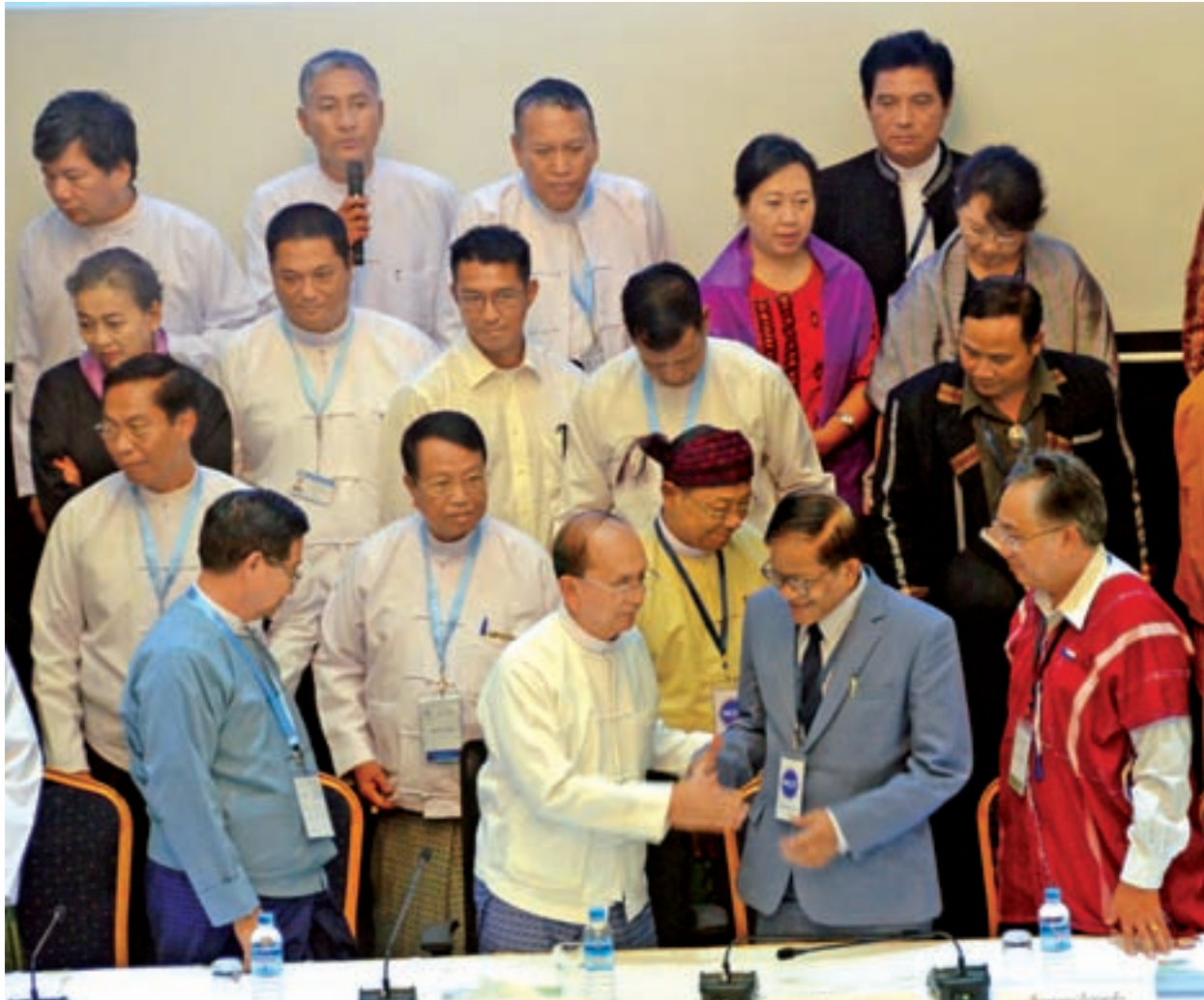
The two respective negotiating teams of the government and ethnic armed organizations take a step toward a lasting ceasefire and a political dialogue that includes all stakeholders in the country's peace process on 31 March 2015.

brate the cooperative culture which once flourished when the Panglong agree-