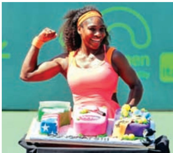
Serena Williams poses with a cake celebrating her 700 th WTA win after her match against Sabine Lisicki on day ten of the Miami Open at Crandon Park Tennis Centre.