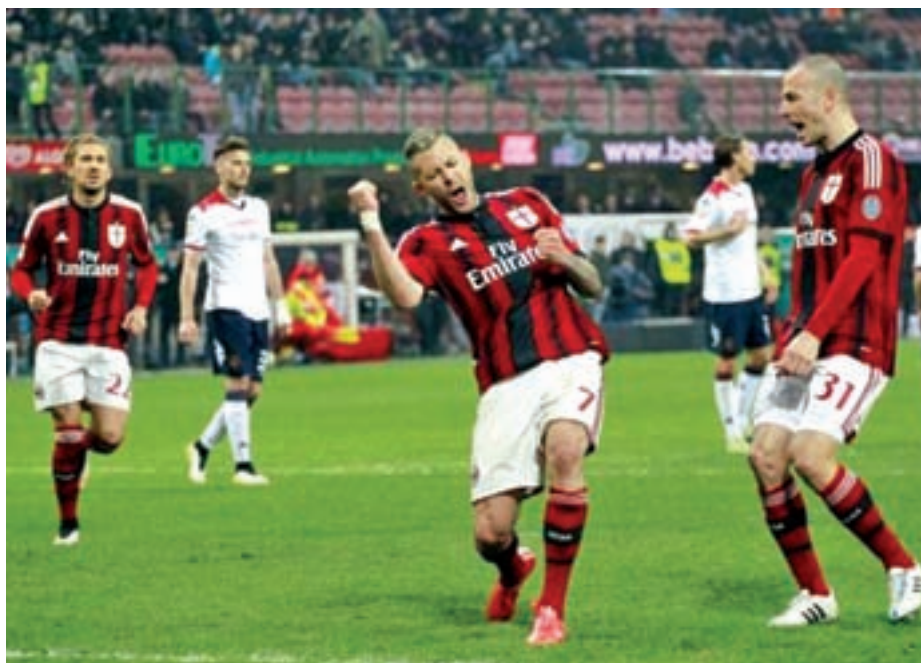
AC Milan's Jeremy Menez (C) celebrates after scoring against Cagliari during their Italian Serie A soccer match at the San Siro stadium in Milan on 21 March, 2015.