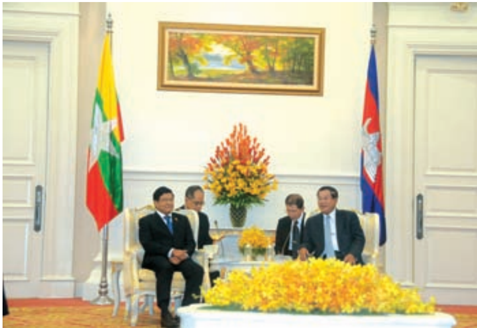
Vice President U Nyan Tun holds talks with Prime Minister of Cambodia Hun Sen at the Peace Palace in Cambodia.

PHNOM PENH, 2 April—Vice President of the Republic of the Union of Myanmar U Nyan Tun met with Prime Minister of Cambodia Hun Sen at the Peace Palace on Thursday morning.