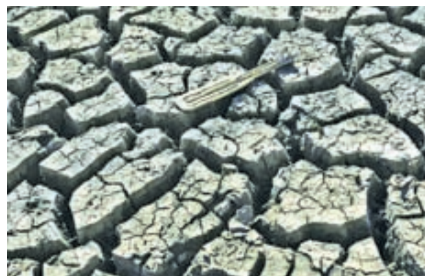
A boat paddle is shown on the bottom of the nearly dry Almaden Reservoir near San Jose, California on 21 Jan, 2014.

The move comes as California’s snowpack, which generally provides about a third of the state’s water, is at its lowest level on record in a sign the