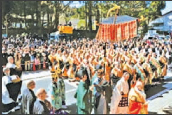
Monks attend a ceremony on 2 April, 2015, to commemorate the 1,200 th anniversary of a monastic settlement started by renowned monk Kukai at Mt. Koya in Wakayama Prefecture, western Japan. Buddhist services will be held daily through on 21 May.