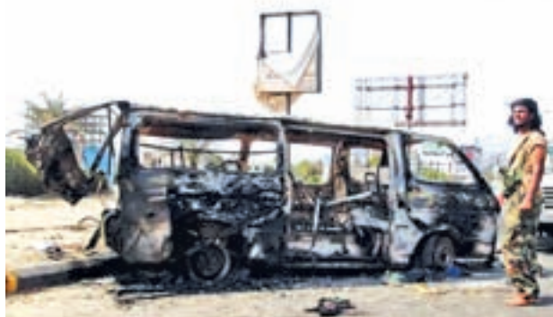
A man stands by the wreckage of a van hit by an air strike in Yemen's southern port city of Aden on 31 March, 2015.

ter Reyad Yassin Abdulla appealed on Wednesday for more effective international action to halt the Shi'ite, Iran-allied fighters before they take over the city entirely.