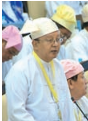
Supreme Court Judge U Soe Nyunt.