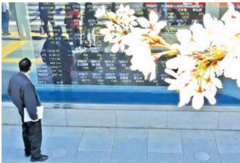
A Tokyo businessman looks at an electronic stock quotation board, as cherry blossoms bloom, outside a brokerage in Tokyo on 30 March, 2015.—REUTERS

The euro was bolstered by Wednesday's data showing manufacturing activity across the euro zone is accelerating. Oil prices were off their session lows but still down on the day, giving back some of the sharp gains made in the previous session after US crude output fell for the first time in two months and the government announced a smaller-than-feared rise in weekly stockpiles. —Reuters