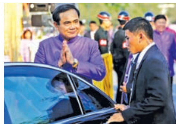
Thailand's Prime Minister Prayut Chan-o-cha gestures the traditional greeting as he gets in his car after the merit-making ceremony on the occasion of Princess Maha Chakri Sirindhorn's birthday at Sanam Luang in Bangkok on 2 April, 2015.