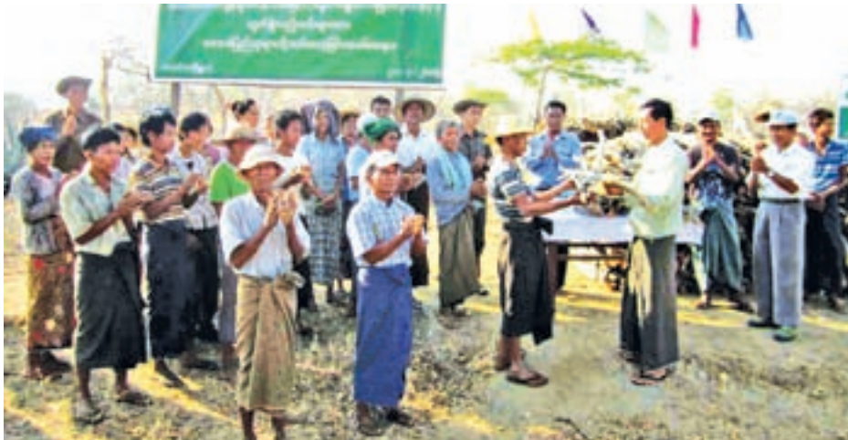
Departmental officials share firewood to local residents in Kyigon Village, Taungtha Township.

TAUNGTHA, 2 April — The Dry Zone Greening Department in Taungtha Township, Mandalay Region, is carrying out conservation of natural forests in the township.