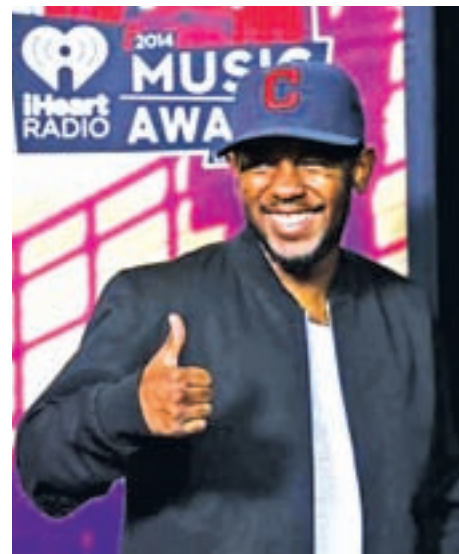
Hip hop recording artist Kendrick Lamar poses backstage during the iHeartRadio Music Awards in Los Angeles, California on 1 May, 2014.

Mark Ronson and Bruno Mars' upbeat track "Uptown Funk!" held steady at No 1 on the Digital Songs chart, selling 165,000 downloads in its 20th week on the chart.—Reuters