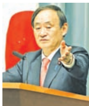
Chief Cabinet Secretary Yoshihide Suga announces on 2 April, 2015, at a Press conference in Tokyo that he plans to meet with Okinawa Gov Takeshi Onaga on 5 April for talks over the planned relocation of a US air base within the island prefecture, which has sparked a conflict between the central and local governments.

The move comes as the central and Okinawa governments are at odds over the planned transfer of the Futenma base, located in a densely populated area in Ginowan, to the less