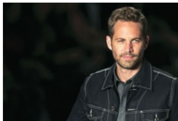
US actor Paul Walker at Sao Paulo FashionWeek on 21 March, 2013.

LOS ANGELES, 2 April — When actors from the "Fast & Furious" films gathered recently in the parking lot at Dodger Stadium to promote the seventh installment, they spent a lot of time talking about a cast member who wasn't there: Paul Walker.