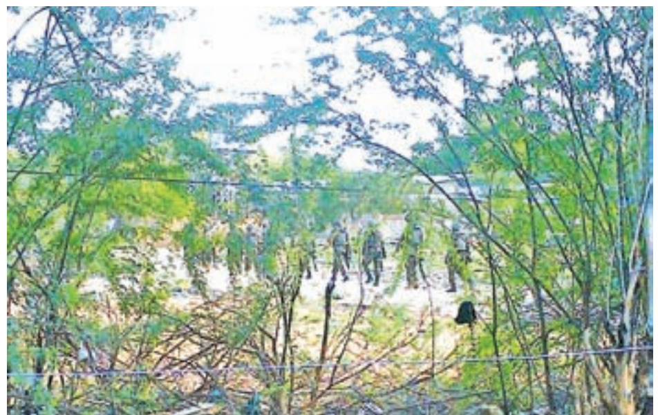
Kenya Defence Forces soldiers move behind a thicket in Garissa town in this photograph taken from a mobile phone on 2 April, 2015.

Al Shabaab, which was responsible for an