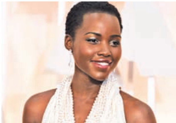
Oscar-winning actress Lupita Nyong'o says life is not easy when you are in showbiz.—PTI

LOS ANGELES, 2 April — Oscar-winning actress Lupita Nyong'o says life is not easy when you are in showbiz.