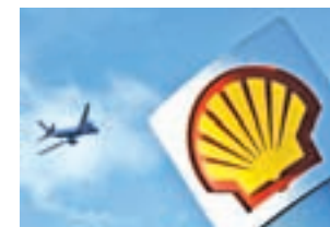
A passenger plane flies over a Shell logo at a petrol station in west London, on 29 Jan, 2015.

SINGAPORE, 2 April—Royal Dutch Shell (RD-Sa.L) has finished upgrading its Singapore ethylene cracker complex at its integrated-refining-chemicals site, boosting production of ethylene by 20 percent, the company said on Thursday.