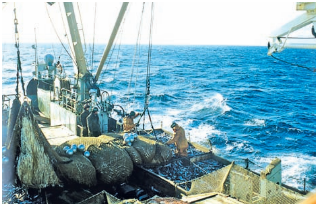
Photo shows a fishing trawler off Kamchatka coast. At least 54 people are dead as a result of a trawler sinking in the Sea of Okhotsk off the Kamchatka peninsula in Russia's Far East.

A criminal case has been opened into violation of safety rules and operating water transport that resulted in the death of two or more people. The investigation into the criminal case is under control of the Investigative Committee.