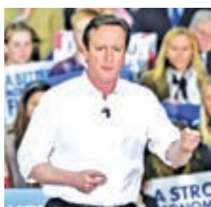
Britain’s Prime Minister David Cameron

The debate, to be held in a former pie factory near the northern city of Man-