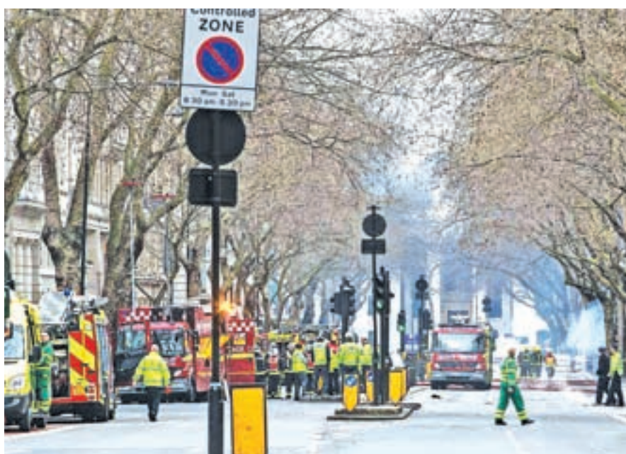
Photo taken on 1 April, 2015 shows a general view of the fire in Central London's Holborn area, Britain. More than 2,000 people were evacuated on Wednesday from a number of buildings in London's Holborn area due to an electrical fire among cables under a pavement, London Fire Brigade (LFB) said.

Please email wallace.tun@gmail.com (+95) (01) 8604532