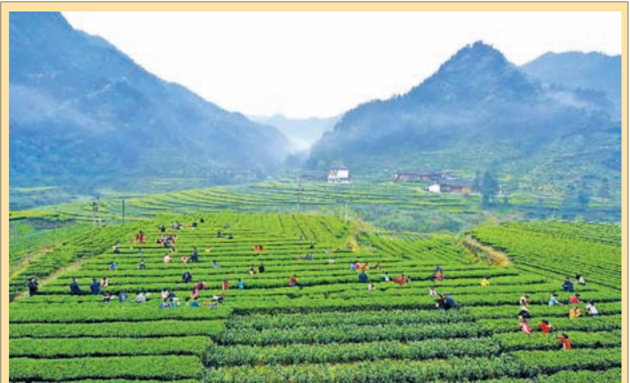
Children pick tea leaves during their farm vacation in Laozhaixi Village of Xuanen County, central China's Hubei Province on 1 April, 2015. Farm vacation is an unfixated vacation in some regions for school children to go back home to help their family in busy farming seasons.—XINHUA

Critics, however, say the new decree may prevent any changes from the status quo under martial law.—Kyodo News