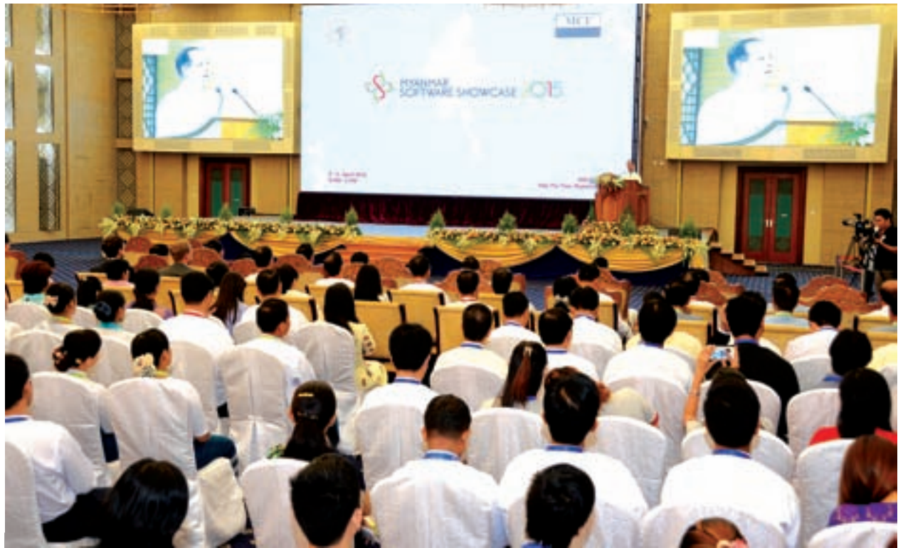
Vice President Dr Sai Mauk Kham delivers speech at opening of Myanmar Software Showcase 2015.

The Myanmar Software Showcase 2015 drew 400 students from technical colleges and technological universities.