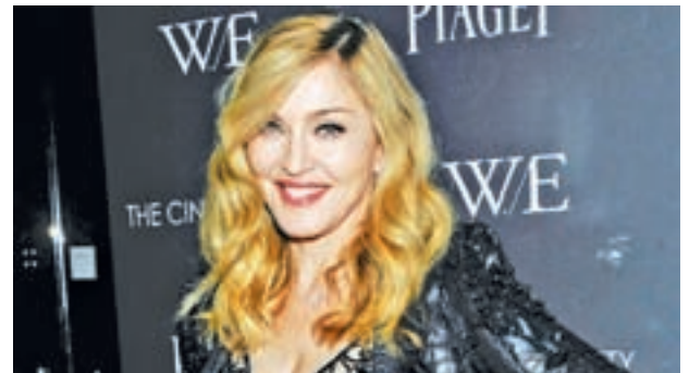
Madonna: I've got so many tales to tell. If I wrote my book, that would be from start to finish.

LONDON, 2 April — Pop diva Madonna is "sure" that she will publish an autobiography in the future. Asked by Jo Whiley on BBC Radio 2, the 'Iconic' singer said that there is "a whole lot of ground to cover" in a book about her life and career.