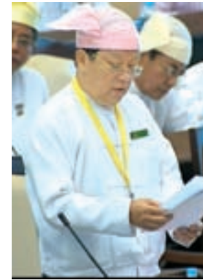
Deputy Minister at the President Office U Aung Thein.

According to the WHO report, there are 500,000 people with MDR-TB around the world. In Myanmar, it is found that about 5 per cent of new TB patients have MDR-TB. Myanmar is one of the 27 high MDR TB burdened countries worldwide.—GNLM