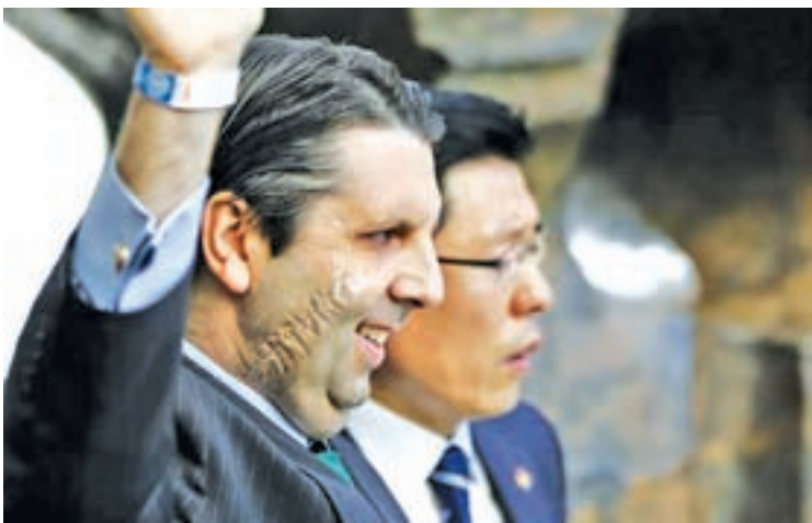
US ambassador Mark Lippert

SEOUL, 1 April — Prosecutors have formally charged a South Korean man with attempted murder after the US ambassador in Seoul was slashed in the face in a knife attack last month, leaving him with wounds needing 80 stitches, prosecutors said on Wednesday.