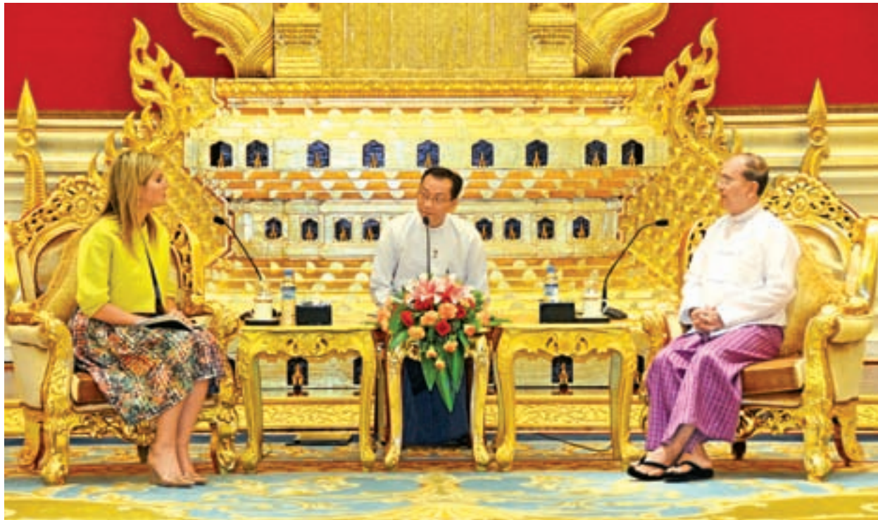
President U Thein Sein (R) meets Queen Máxima of the Netherlands at Credentials Hall of Presidential Palace.—MNA

Also present at the call were union ministers U Soe Thane, U Tin Naing Thein, U Win Shein and U Ye Htut, Governor of the Central Bank of Myanmar U Kyaw Kyaw Maung, deputy minister U Tin Oo Lwin and officials. The queen was accompanied by the Netherlands Ambassador to Myanmar.