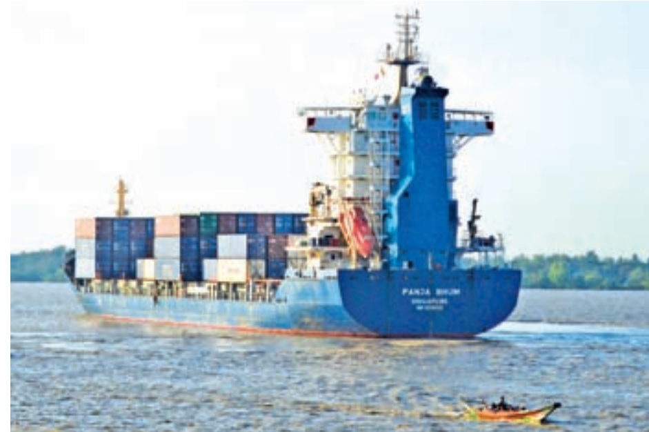
Imports of capital goods into Myanmar constitute 40-45 percent of the country's trade deficit in the 2014-2015 FY while the imports of oil stand at 30 percent and consumer goods 20 per cent), according to data of Ministry of Commerce.

The Ministry of Commerce will give priority to export sectors in an attempt to boost the country's economy, said U Win Myint, Union Minister for Commerce, at parliament recently.