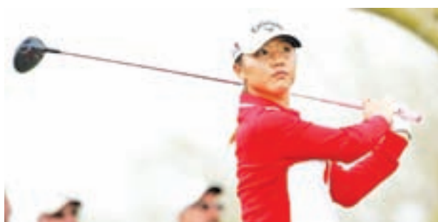
Lydia Ko tees off on the 11th hole during round one action of the JTBC Founders Cup at Wildfire Golf Club at JW Marriott Phoenix Desert Ridge Resort & Spa.

"I got to play with her last week, and it's just incredible," reigning champion Lexi Thompson told reporters at Mission Hills Country Club on Tuesday while preparing for the first women's major of the