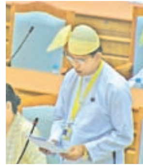
Deputy Minister for Finance Dr Lin Aung.