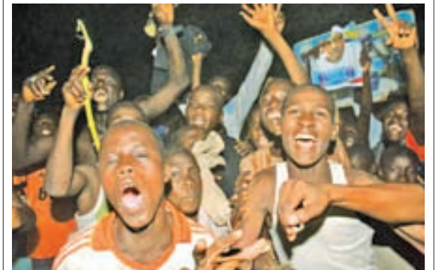
Young people celebrate in Yola, northeastern Nigeria, on 31 March, 2015, as Muhammadu Buhari, former military council head, defeated President Goodluck Jonathan in the nation's presidential election. It is the country's first regime change since the shift to civilian rule in 1999.

The election was effectively a one-on-one fight between Jonathan from the south and Buhari from the north.— Kyodo News