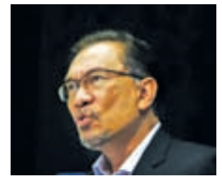
Malaysia’s opposition leader Anwar Ibrahim speaks to the media ahead of the verdict in his final appeal against a conviction for sodomy in Kuala Lumpur on 4 Feb, 2015.

Anwar’s daughter, PJP member of parliament Nurul Izzah, was caught up in a recent crackdown by the government and police