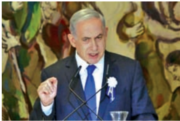
Israel’s Prime Minister Benjamin Netanyahu

“A better deal would significantly roll back Iran’s nuclear infrastructure. A better deal would link the eventual lifting of the restrictions on Iran’s