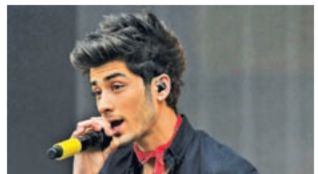
Singer Zayn Malik

LOS ANGELES, 1 April — Demo of singer Zayn Malik's first song "I Won't Mind", post his departure from band One Direction, has been released. The song is a collaboration between Malik and Naughty Boy and its demo was posted by the British producer on his SoundCloud page.