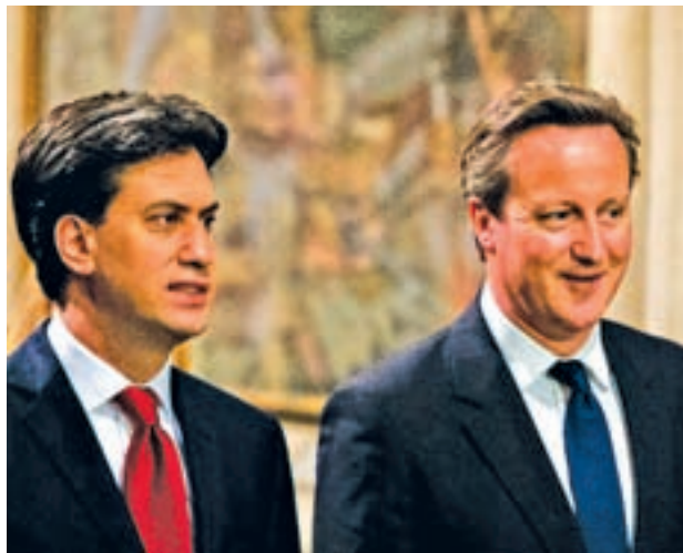
Leader of the opposition Labour Party Ed Miliband and British Prime Minister David Cameron.

"We believe this Conservative-led Government