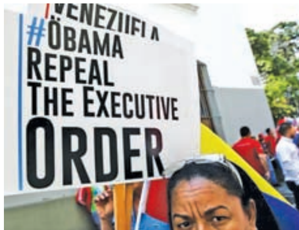
A supporter of Venezuela's President Nicolas Maduro holds a placard during a protest against imperialism, in Caracas on 24 March, 2015.

Opponents say many Venezuelans are being coerced to sign, especially in state institutions, and decry the move as a waste of time intended to hide the nation's economic crisis and boost the government's popularity ahead of parliamentary elections.