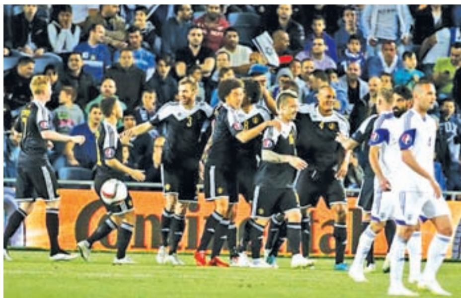
Belgium's players celebrate after scoring a goal against Israel during their Euro 2016 Group B qualifying soccer match at Teddy Stadium in Jerusalem on 31 March, 2015.

JERUSALEM, 1 April — Marouane Fellaini grabbed an early goal as 10-man Belgium survived Israel's spirited second-half performance to earn a 1-0 win in Euro 2016 qualifying Group B in Jerusalem on Tuesday.