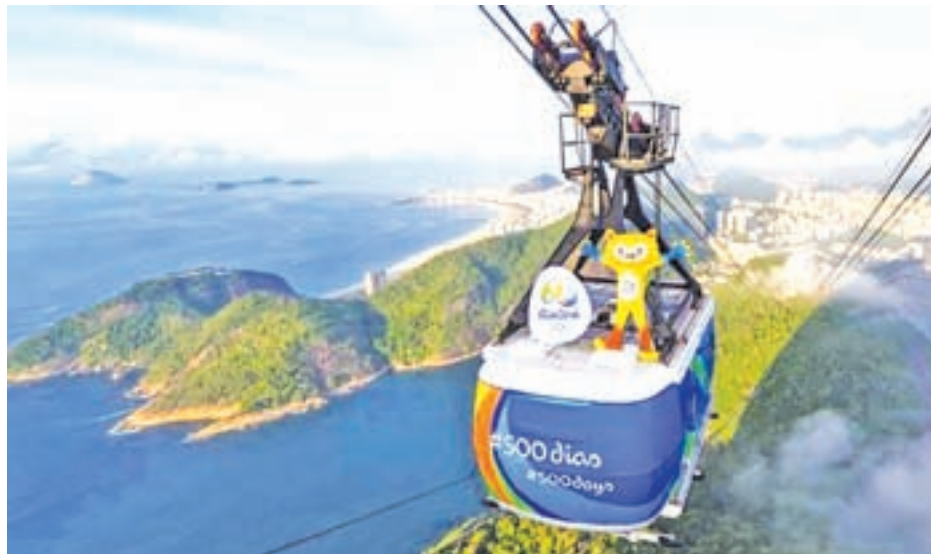
Rio 2016 Olympic mascot Vinicius is seen on the top of the Sugarloaf cable car, to mark 500 days to go until the Opening Ceremony of the 2016 Olympic Games in Rio de Janeiro, in this handout photograph released on 24 March, 2015.

The announcement came as many Brazilians struggle to keep their heads above water amid a deepening economic crisis.