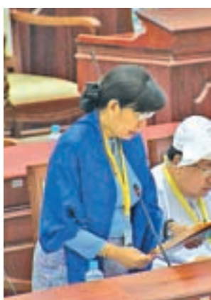
Deputy Minister for Health Dr Daw Thein Htay.

NAY PYI TAW, 1 April — Pyithu Hluttaw approved on Wednesday extension of the term for the Legal Affairs and Special Issues Assessment Commission till January 31, 2016 after suggestion of Thura U Shwe Mann, Speaker of Pyithu Hluttaw (Lower House).