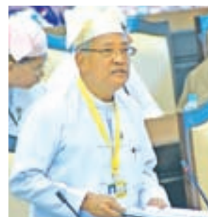
Deputy Minister for Communications and Information Technology U Win Than.—MNA