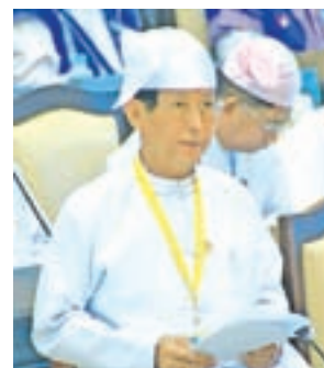
Deputy Minister for Mines U Than Tun Aung.—MNA

that the company will also release a residential ward and a village to the local authorities.