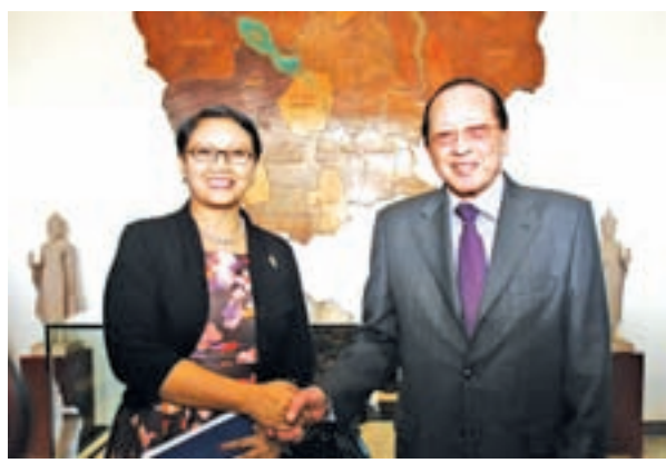
Cambodian Foreign Minister Hor Namhong (R) shakes hands with his Indonesian counterpart Retno Marsudi in Phnom Penh, Cambodia on 1 April, 2015. Cambodian and Indonesian foreign ministers discussed ways to further enhance ties and cooperation between the two countries on Wednesday.