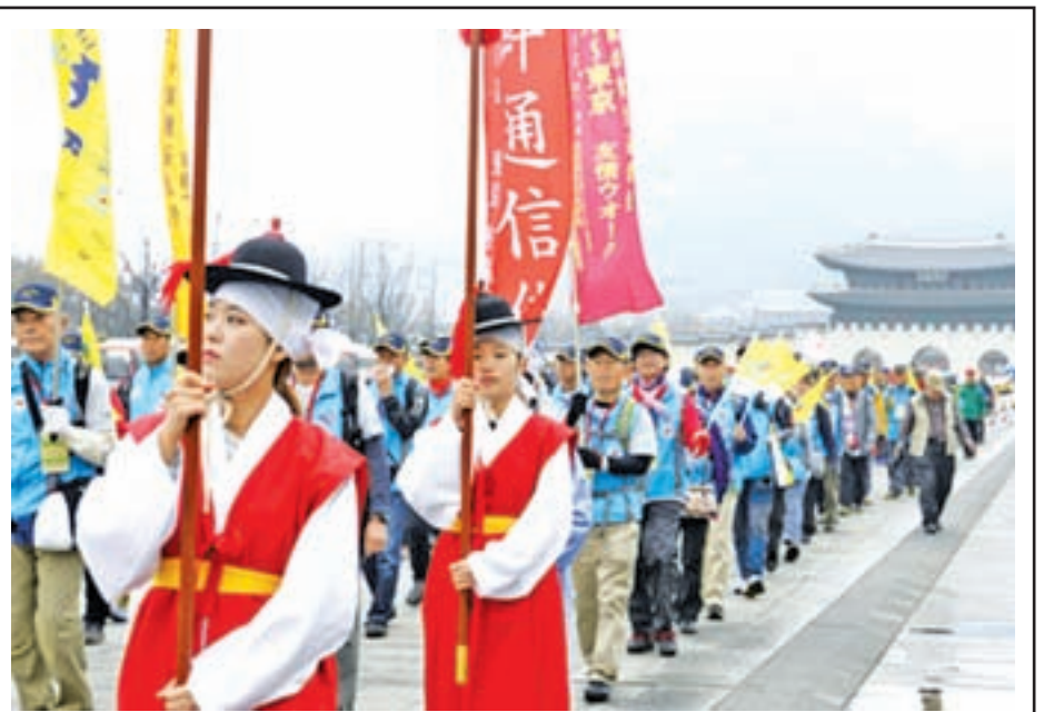
Participants of a friendship walk event to reenact a procession of Korean envoys to Japan dispatched by the Joseon Dynasty during Japan's Edo period leave Gyeongbokgung (back), a former royal palace in downtown Seoul, and walk along the historic route on 1 April, 2015.—KYODO NEWS