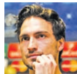
Borussia Dortmund's Mats Hummels addresses a news conference in Dortmund on 17 March, 2015.

"Just to be clear. This alleged "promise" is sim-