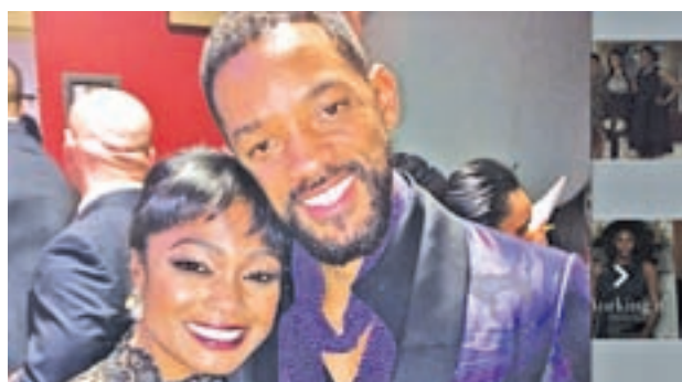
Tatyana Ali shared a quick selfie of her and Will Smith on Instagram.