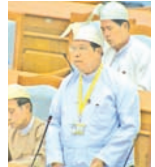
Deputy Minister for Construction U Soe Tint.—MNA