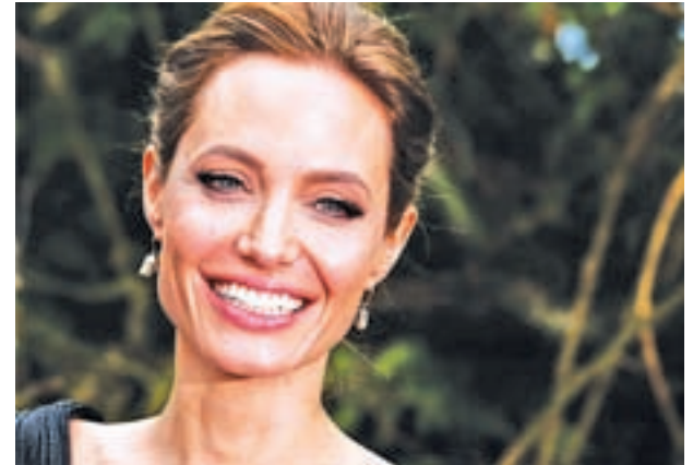
Actress-director Angelina Jolie, who recently underwent cancer preventative surgery and had her ovaries and fallopian tubes removed, feels by overcoming difficulties, one gains strength and maturity.

LOS ANGELES, 1 April, — Actress-director Angelina Jolie, who recently underwent cancer preventative surgery and had her ovaries and fallopian tubes removed, feels by overcoming difficulties, one gains strength and maturity. Jolie, 39, reflected on what she learned from the late Louis Zamperini, a World War II war survivor who was the focus of her directorial venture "Unbroken", reported Us