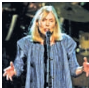
Musician Joni Mitchell performs during the filming of a television tribute to her in New York, in this file photo taken on 6 April, 2000.

ing medical testing in the hospital's intensive care unit but was "awake and in good spirits," the statement said. Further details on her condition and the nature of the medical emergency were not immediately provided. Representatives for the musician did not respond to requests for comment.