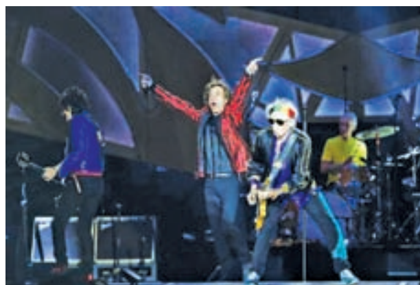
Mick Jagger, Keith Richards, Ron Wood and Charlie Watts of The Rolling Stones perform during their "14 on Fire" concert at Santiago Bernabeu Stadium in Madrid on 25 June, 2014.

The Rolling Stones last performed across North America for "A Bigger Bang Tour" between 2005 and 2007. The band more recently toured Europe, Asia, Australia and New Zealand in 2014, but was