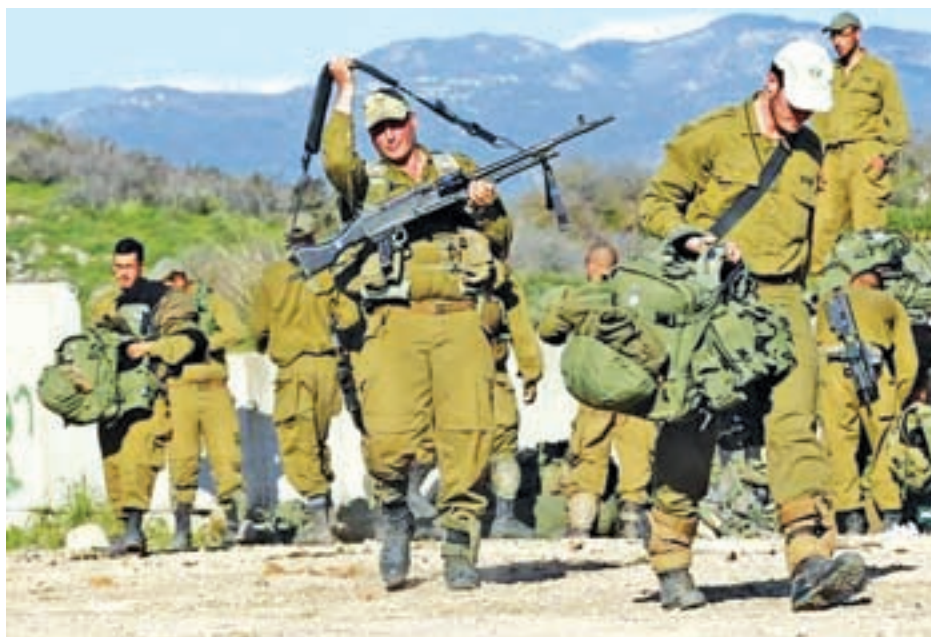
Israeli soldiers carry their belongings in an area near the Israel-Lebanon border on 29 Jan, 2015.

JERUSALEM, 1 April — Israel could suffer hundreds of civilian deaths and damage to its vital infrastructure from Hezbollah rockets if it fights another war with the Iranian-backed Lebanese guerrilla group, according to Israeli military assessments.