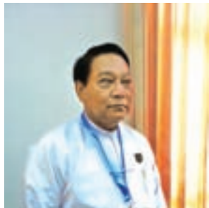
Union Minister U Khin Yi.

Union Minister U Khin Yi, a member of UPWC, recounted peace broker body's efforts to overcome many differences and disputes to sign the peace deal after nearly four years through eagerness of participant groups and peace roadmap laid by state leaders.