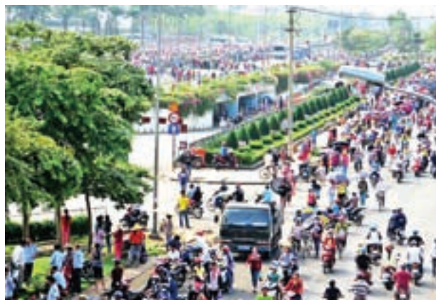
Workers of Pou Yuen Vietnam gather at their factory on the fifth day of a strike in Vietnam’s southern Ho Chi Minh City on 31 March, 2015.

That has earned Vietnam a reputation as a safe bet for firms like Gap, H&M and Inditex’s Zara. Such companies have helped fuel annual export