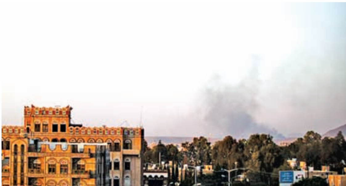
Smoke billows near military barracks in the Jabal al-Jumaima mountain following an air strike near Sanaa on 30 March, 2015.

ADEN, 31 March — Air raids by a Saudi-led coalition again hit Houthi militia targets across Yemen on Monday night, striking the group's northern stronghold of Saadeh, the capital, Sanaa, and the central town of Yarim, residents and media said.