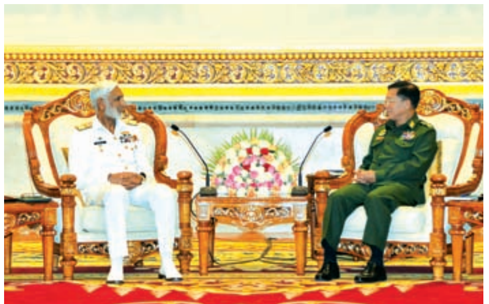
Senior General Min Aung Hlaing holds talks with Admiral Muhammad Zakaulah NI(M), Chief of Naval Staff of Pakistan.

Admiral Muhammad Zakaulah NI(M) won the coveted Sword of Honour from Pakistan Naval Academy and was also awarded Chief of the Naval Staff Gold Medal at his graduation. He is the twentieth Chief of Naval Staff of Pakistan.—Myawady