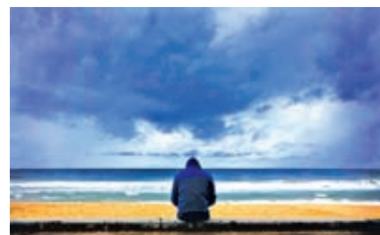
A surfer looks at waves as storm clouds move in from the Pacific Ocean at Sydney's Manly Beach on 26 August, 2014.

GrainCorp said in February its 2015 full-year earnings are expected to hit a five-year low as drought along the east coast curbs grain production.— Reuters