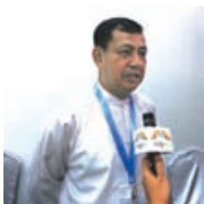
Union Minister U Ye Htut. MNA

(from page 1) He said his congratulation to all the participants of supporting groups and policymakers in peace-making efforts.