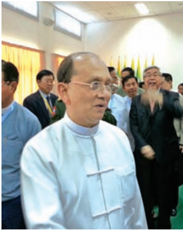
President U Thein Sein.