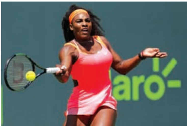
Serena Williams hits a forehand against Svetlana Kuznetsova (not picture) on day eight of the Miami Open at Crandon Park Tennis Centre, on 30 March, 2015.