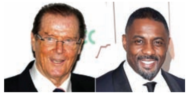
Actor Roger Moore has denied accusations that he said "something racist" about "The Wire" star Idris Elba.