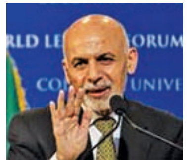
Afghan President Ashraf Ghani

A US official said the Saudis had shown little appetite for a ground invasion if it can be avoided. "The objective here is to get to a point where the Houthis halt their destabilizing actions and come back to the table," the official said.— Reuters