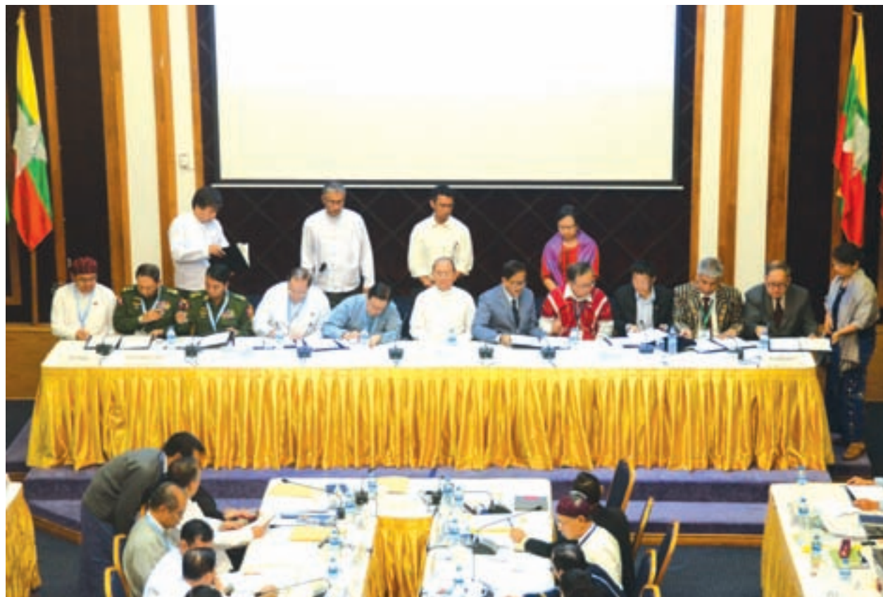
President U Thein Sein attends signing ceremony of draft nationwide ceasefire agreement between Union Peace-making Working Committee and Nationwide Ceasefire Coordination Team.

The move was seen as the “Second Panglong Victory”, which is historic