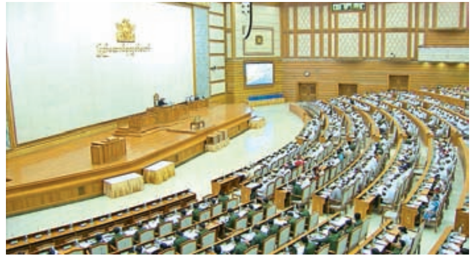
Pyidaungsu Hluttaw representatives discuss Union Budget Bill for 2015.