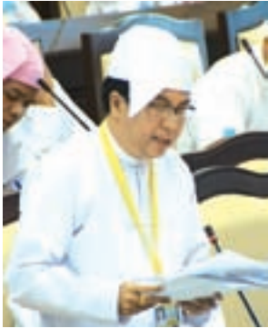
Deputy Minister Dr Zaw Min Aung.—MNA