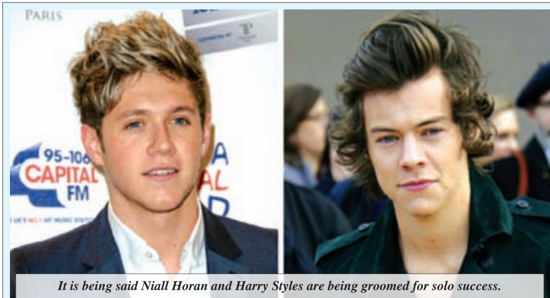
It is being said Niall Horan and Harry Styles are being groomed for solo success.

"The album is a guarantee but next year is all up in the air. Harry and Niall are already being groomed for solo success and both could have huge solo careers if they wanted," a source said.—Reuters