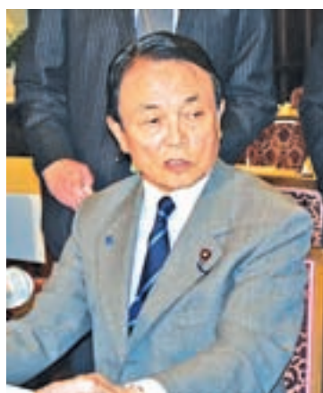
Finance Minister Taro Aso

Abe also pointed to such remaining concerns as governance standards and the screening process for providing loans at the institution. The prime minister added, "The United States now knows that Japan is trustworthy," after Tokyo sided with Washington in keeping its careful stance toward the AIIB, though most of other Group of Seven nations such as Britain and Germany have announced they will take part. Finance Minister Taro Aso restated his cautiousness, telling a Press conference, "We have no choice but to be very cautious about participation" unless the proposed institution clears such conditions as securing fair govern-