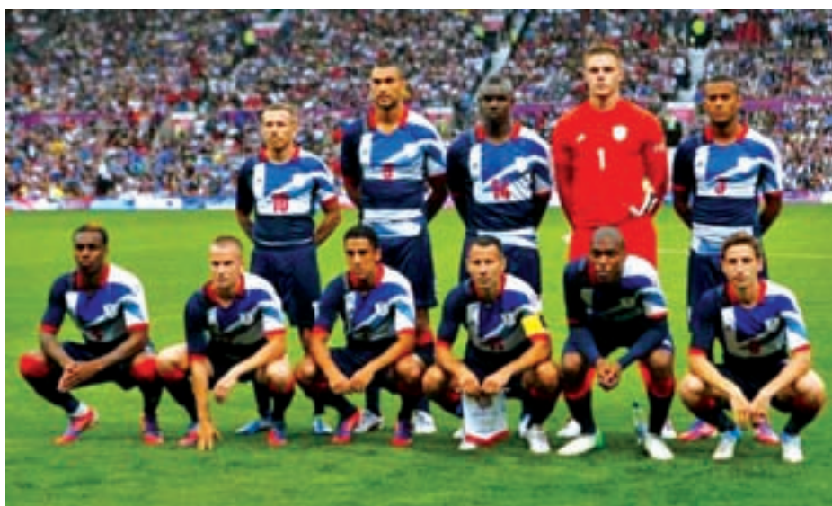
File photo of members of Britain's national team pose for a photo before their men's Group A football match against Senegal at the London 2012 Olympic Games in Old Trafford, Manchester, northern England on 26 July, 2012.