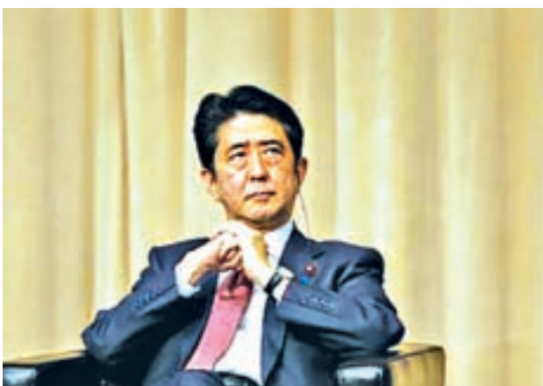
Japan's Prime Minister Shinzo Abe