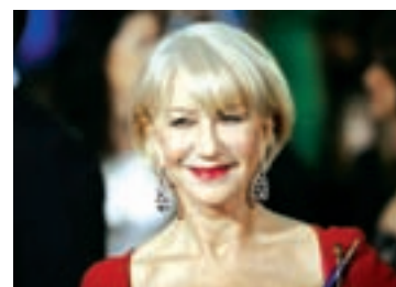
Actress Helen Mirren arrives at the 72nd Golden Globe Awards in Beverly Hills, California in this on 11 Jan, 2015 file photo.

"All the good roles are on the last page and if they are not on