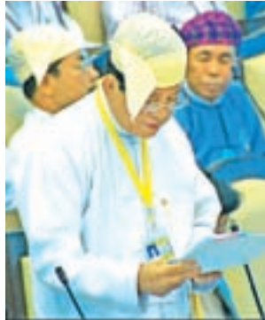
Deputy Minister U Tin Ngwe.

NAY PYI TAW, 31 March — Amyotha Hluttaw continued for the 37th day session, here, Tuesday.