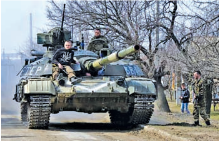
Members of the Ukrainian armed forces drive a tank in the settlement of Luhanske, Donetsk region on 27 March, 2015.