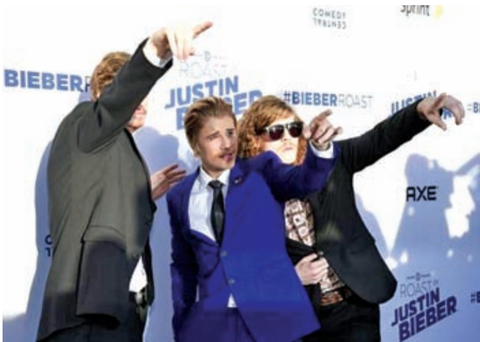
Actor Anders Holm (L), singer Justin Bieber (C) and actor Blake Anderson pose during Comedy Central Roast of Justin Bieber at Sony Studios in Culver City, California on 14 March, 2015.

NEW YORK, 31 March — Pop sensation Justin Bieber, the subject of some unflattering headlines in recent years, suffered the slings and arrows of fellow entertainers, from Kevin Hart to Martha Stewart, as they skewered his looks, music and public antics during a celebrity roast broadcast on Monday.