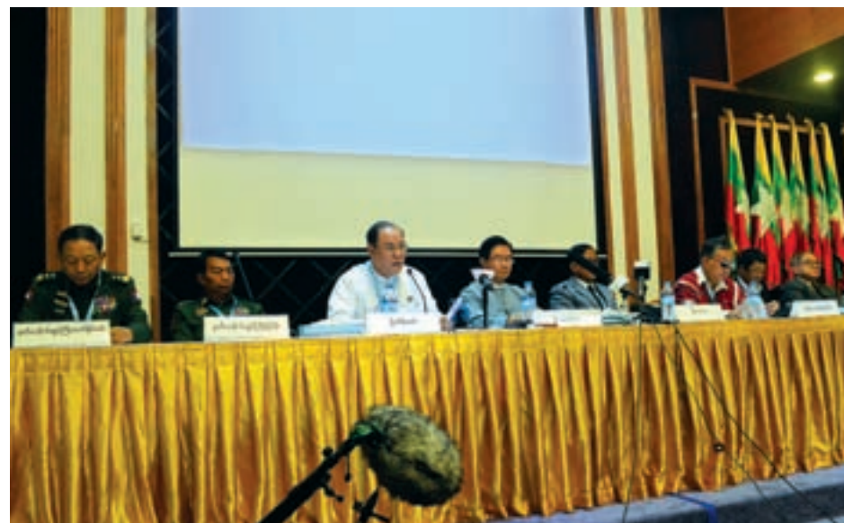
Peace negotiators from the UPWC and NCCT open the floor to questions from the media at the Myanmar Peace Centre in Yangon on Tuesday.