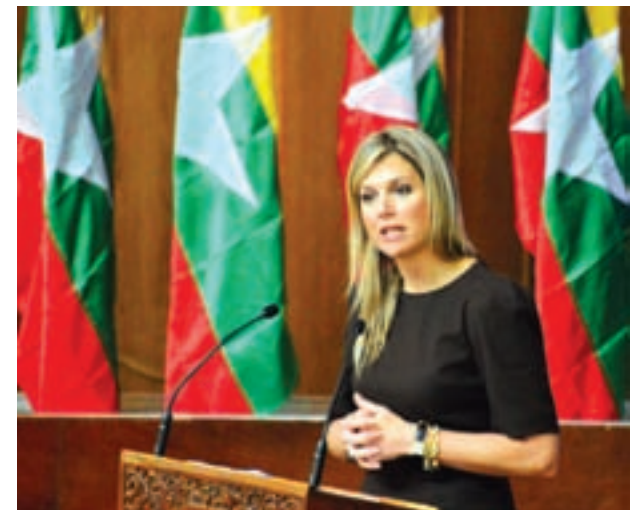
Queen Máxima of the Netherlands gives a key note speech at Convocation Hall of Yangon University.