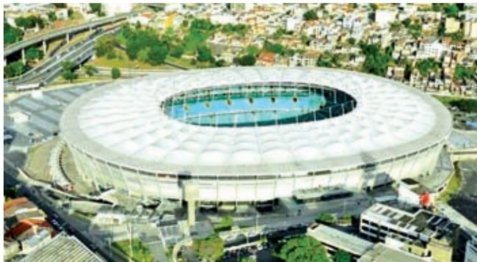
An aerial shot shows the Arena Fonte Nova stadium, in Salvador, in the state of Bahia, northern Brazil on 28 March, 2014.

SAO PAULO, 31 March — Esporte Club Bahia, one of the biggest clubs in Salvador, said on Monday they were abandoning the