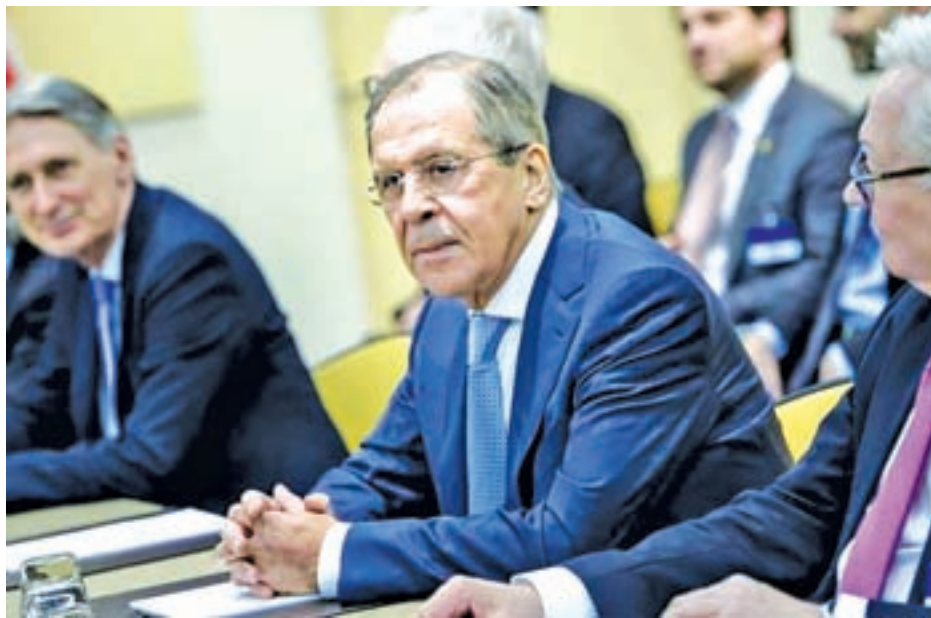
Russian Foreign Minister Sergei Lavrov (C) waits with others for a P5+1 meeting at the Beau Rivage Palace Hotel in Lausanne, Switzerland on 29 March, 2015. —REUTERS

Moscow, 31 March — Russian Foreign Minister Sergei Lavrov said he would rejoin talks on Iran's nuclear programme in Lausanne later on Tuesday