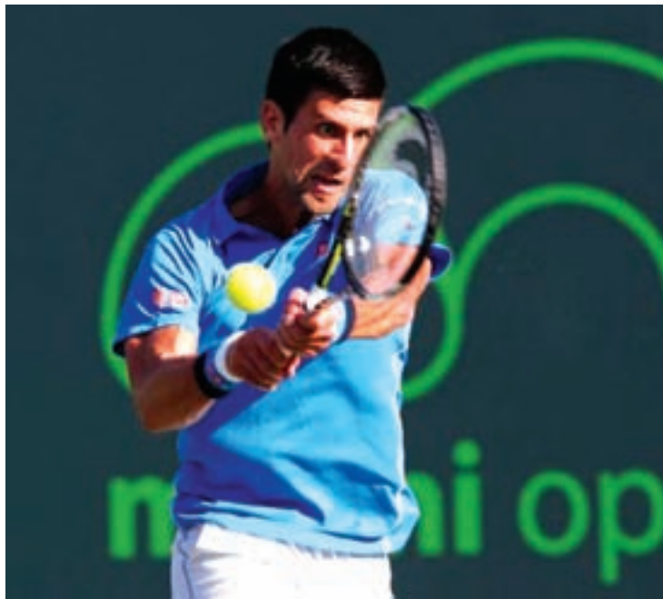
Novak Djokovic hits a backhand against Steve Darcis (not picture) on day eight of the Miami Open at Crandon Park Tennis Centre, on 30 March, 2015.

MIAMI, 31 March — Defending champion Novak Djokovic defeated Belgium's Steve Darcis 6-0, 7-5 on Monday to power into the last 16 of the Miami Open along with Japan's Kei Nishikori, Canada's Milos Raonic and American John Isner.