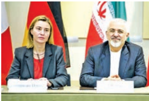
European Union High Representative Federica Mogherini (L) and Iranian Foreign Minister Javad Zarif wait for a meeting with officials from P5+1, the European Union and Iran at the Beau Rivage Palace Hotel in Lausanne on 31 March, 2015.

"We need to get this done now," a Western official told Reuters on condition of anonymity. "We only have a few hours left to get a framework agreement or the job is going to become much, much more