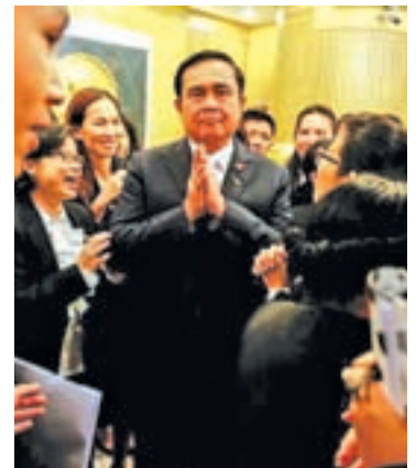
Thailand’s Prime Minister Prayuth Chan-ocha (C) gestures in a traditional greeting after a speech at the Stock Exchange of Thailand in Bangkok on 26 Feb, 2015.