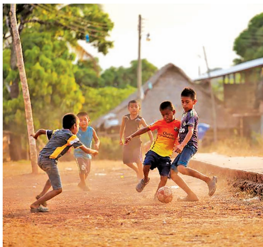
Image taken on 27 March, 2015, shows children of the Wounaan indigenous ethnic group playing soccer in the Maje community in Panama Province, Panama. According to local press, the Wounaan are one of the seven indigenous ethnic groups in the Panamanian territory, and are dedicated mainly to fishing and the elaboration of crafts of cocobolo wood. However, the illegal logging of the cocobolo trees by settlers and companies have caused clashes between the indigenous group and loggers recently. The Wounaan asked Panama's government to provide protection in the zone and to enforce laws that define the regional territory and collective lands they inhabit.