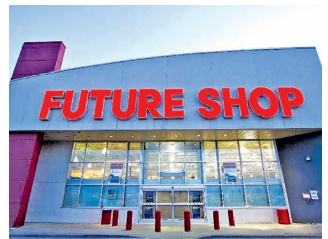
A man looks at a sign posted on a Future Shop store's door, notifying customers that the location has closed in Mississauga, Ontario, Canada, on 28 March, 2015. Best Buy Canada Ltd announced that it decided to close 66 of the 131 Future Shop electronics chain stores and consolidated the rest in the country on Saturday. As the largest Canadian retailer of computer and consumer electronics, the Future Shop established in 1982 and was acquired by the American consumer electronics store chain Best Buy for $580 million in November 2001.