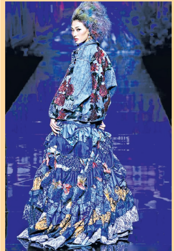
A model presents a creation of D'Nim art jeans by designer Chen Wen during the China Fashion Week Autumn/Winter 2015/2016 in Beijing, capital of China on 27 March, 2015.