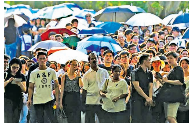
People queue up to pay their respects to the late first prime minister Lee Kuan Yew at the Padang grounds outside the Parliament House in Singapore on 28 March, 2015.

Earlier, booms from a 21-gun salute had reverberated around the city's business district, fighter jets had flown overhead in a "missing man" formation and two navy ships near the marina made an 'L' 'K' 'Y' signal with their flags as Lee's coffin was taken from the country's parliament to the funeral. Singaporeans, many dressed in the mourning