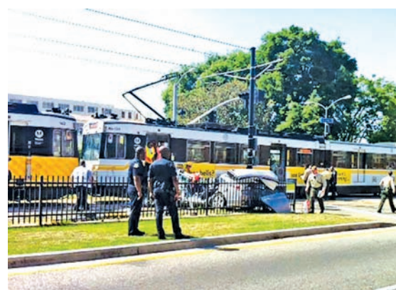
A Los Angeles commuter train that struck a vehicle on the tracks near the University of Southern California campus, is seen in this picture in Los Angeles, California, on 28 March, 2015.

Officials said the investigation would determine