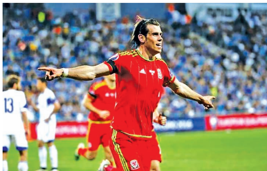
Wales' Gareth Bale celebrates scoring a goal against Israel during their Euro 2016 Group B qualifying soccer match at the Sammy Ofer Stadium in Haifa on 28 March, 2015.

HAIFA, (Israel), 29 March — Gareth Bale forgot all about his recent troubles at Real Madrid when scoring twice in a superb Wales victory over Israel on Saturday that kept them on course for next year's Euro 2016 finals in