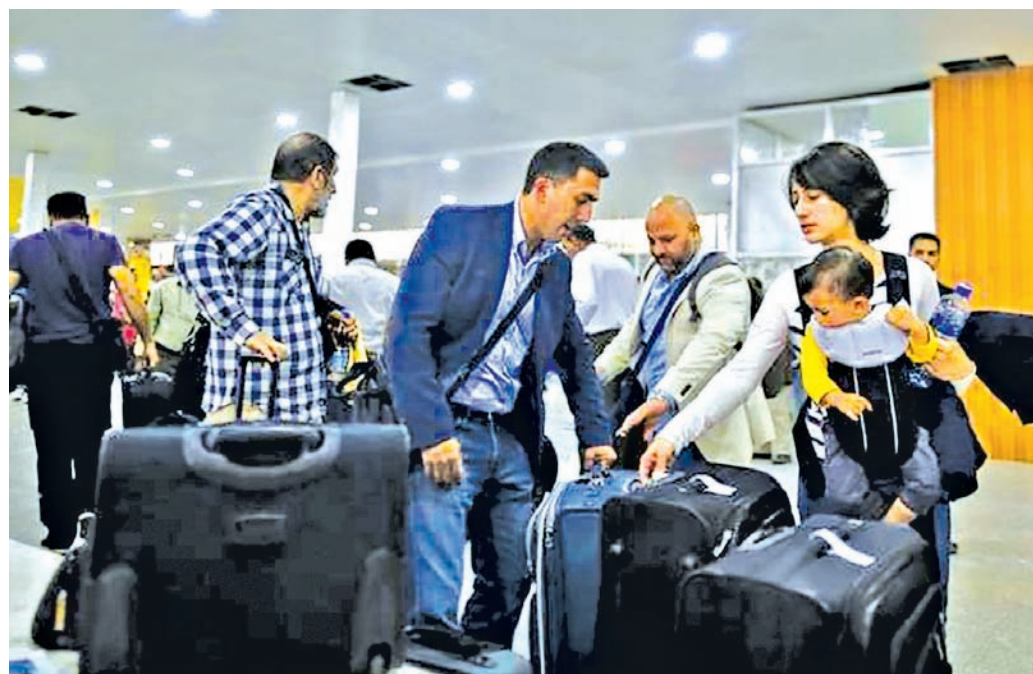
Foreigners wait for their flights as they prepare to leave Yemen via Sanaa Airport on 28 March, 2015.—REUTERS

Saudi Arabia last year loaned $1.5 billion to Pakistan to help Islamabad shore up its foreign exchange reserves, meet debt-service obligations and undertake large energy and infrastructure projects.—Reuters