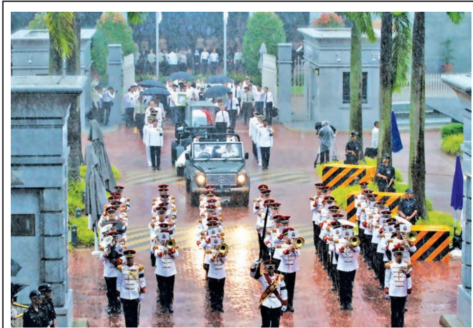
Funeral procession of former Prime Minister of Singapore Mr. Lee Kuan Yew in progress. (News on page 1)