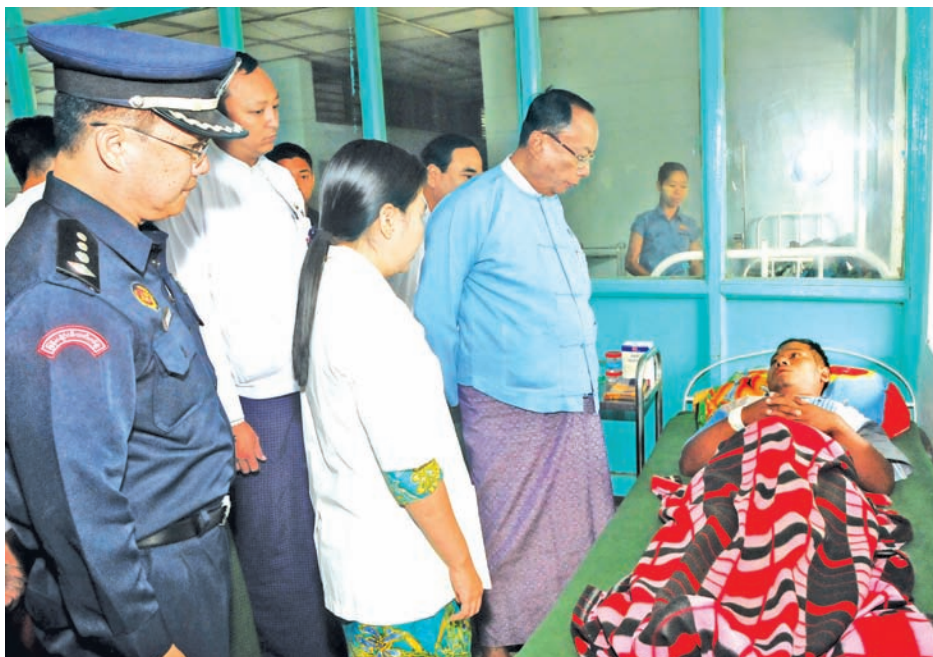
Speaker U Khin Aung Myint comforts patient at station hospital in Thazi Township.

NAY PYI TAW, 29 March — Amyotha Hluttaw Speaker U Khin Aung Myint honoured fallen firefighters at a ceremony held in the district of Yamethin, Mandalay Region, on 27 March, according to officials.