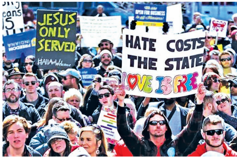
Demonstrators gather at Monument Circle to protest a controversial religious freedom bill recently signed by Governor Mike Pence, during a rally in Indianapolis on 28 March, 2015.

INDIANAPOLIS, 29 March — Thousands of people marched in Indiana’s largest city on Saturday to protest a state law that supporters contend promotes religious freedom but detractors see as a covert move to support discrimination against gay people.