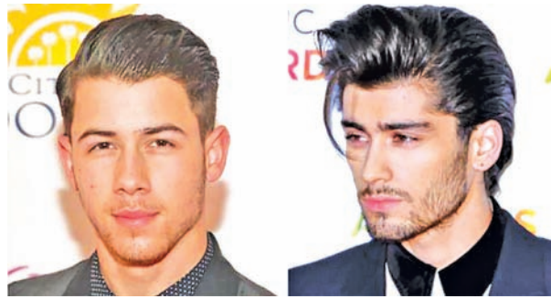
Nick Jonas & Zayn Malik

LOS ANGELES, 29 March — Singer Nick Jonas has showed his support for Zayn Malik after the British hunk announced his departure from One Direction.