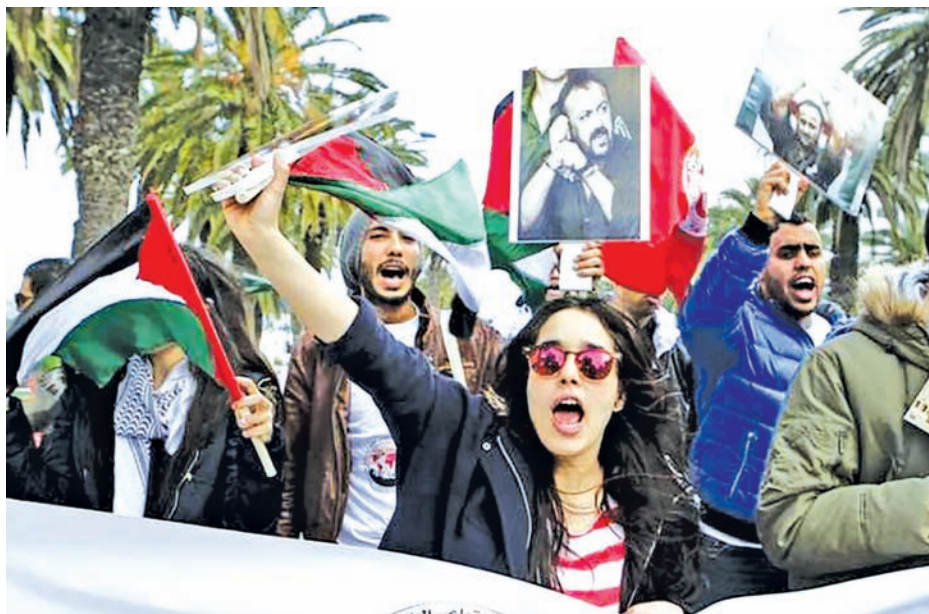
Participants at the World Social Forum hold Palestinian flags during a march at the end of the 2015 World Social Forum (WSF) in solidarity with Palestinians, in Tunis on 28 March, 2015.

21 tourists at the Bardo Museum nearly two weeks ago, in one of the worst at-