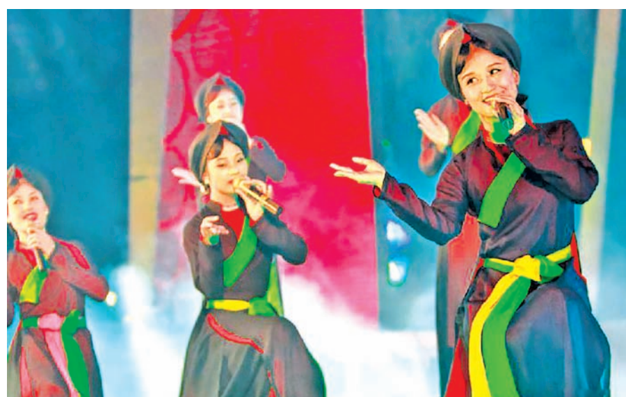
Actors perform world heritage Quan Ho Bac Ninh during Tourism Festival 2015 in Ho Chi Minh city, Vietnam, on 27 March, 2015. Tourism Festival 2015 of Ho Chi Minh city is held from 26 to 29 March, 2015.