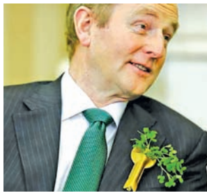
Ireland's Prime Minister Enda Kenny

DUBLIN, 29 March — Support for Ireland's governing parties has increased sharply since December and support for left-wing challenger Sinn Fein has fallen in the same period, a leading pollster said on Saturday.