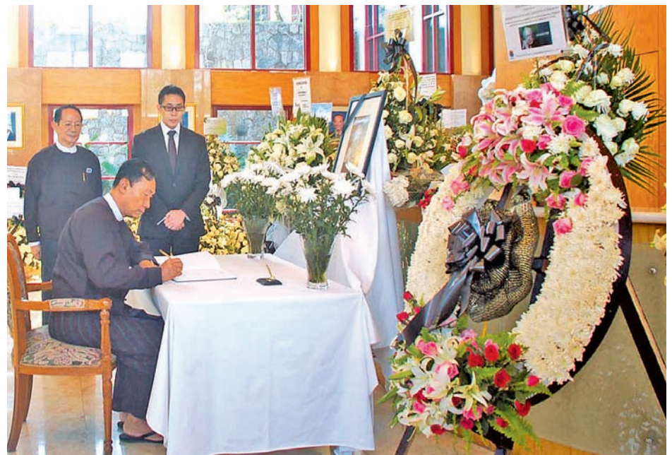
Speaker Thura U Shwe Mann signs book of condolences for the demise of former Singaporean Prime Minister Mr. Lee Kuan Yew.

YANGON, 29 March — Speaker of Pyithu Hluttaw Thura U Shwe Mann signed the book of con-