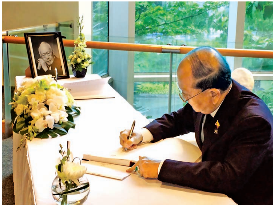
President U Thein Sein signs book of condolences for demise of former Prime Minister of Singapore Mr. Lee Kuan Yew.

The president and party arrived at Changi International Airport at 11.40 am and were greeted by officials of the Ministry of Foreign Affairs of Singapore, Myanmar Ambassador to Singapore U Htay Aung, Military Attaché Brig-Gen Ko Ko Naing