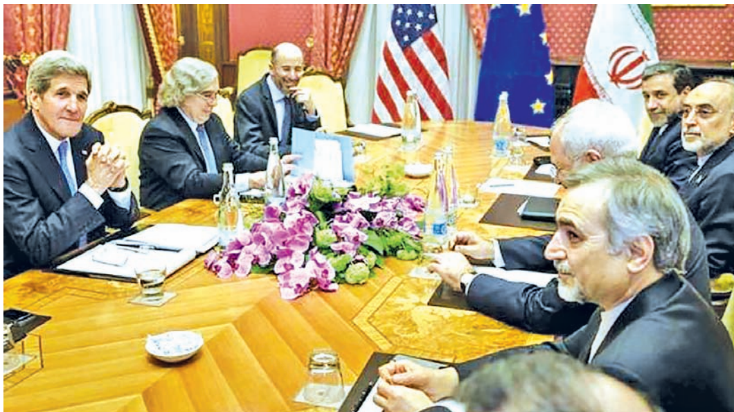
US Secretary of State John Kerry (L) waits to start a meeting with Iranian officials at the Beau Rivage Palace Hotel in Lausanne on 29 March, 2015.

LAUSANNE, 29 March — US Secretary of State John Kerry cancelled plans to fly to Boston for a ceremony in honour of his late friend Edward Kennedy as talks on Iran's nuclear programme intensified in Switzerland, with two days left to a deadline.