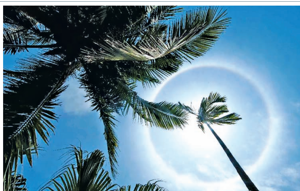
Solar halo appears in the sky over Boao where the 2015 Boao Forum for Asia (BFA) takes place, south China’s Hainan Province on 29 March, 2015.

Some 45 percent of British-born Commission staff are aged 55 and over, heading towards retirement, and Britons make up less than 2 percent of new recruits. They are a wasting asset with uncertain career prospects.— Reuters