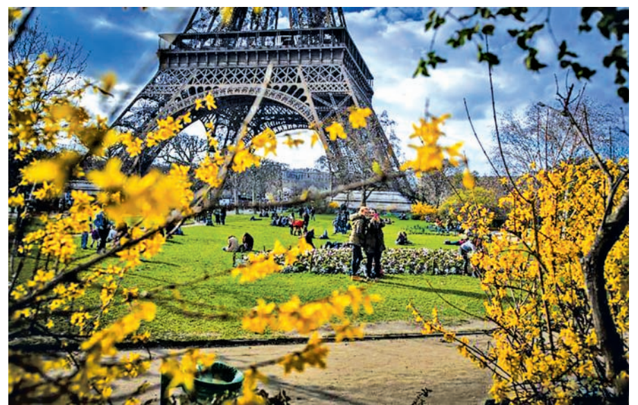
Tourists take photos at the Eiffel Tower in Paris, France, on 28 March, 2015. Tourists enjoy the scenery as the spring flowers blossom in Paris.