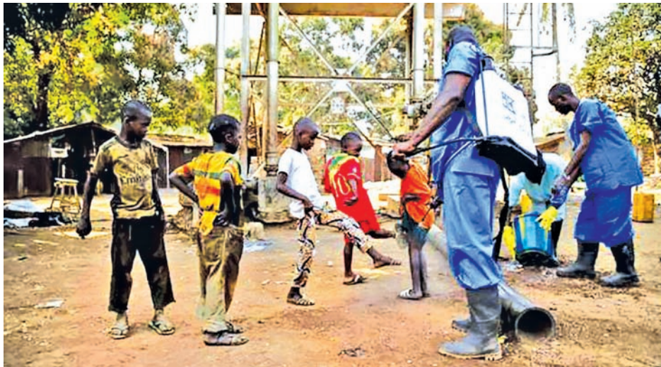
Children come forward to get their feet disinfected after a Red Cross worker explained that they are spraying bleach, and not spraying the village with the Ebola virus, in Forecariah on 30 Jan, 2015.

CONAKRY, 29 March — Guinea's President Alpha Conde announced on Saturday new emergency measures enabling authorities to restrict movements in western Guinea where Ebola transmission continues a year after the epidemic was declared.