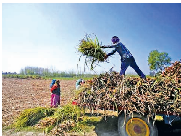
Workers unload stacks of sugarcane on a farmland at Sisola Khurd village in Uttar Pradesh, on 24 March, 2015.