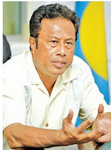
Palauan President Tommy Remengesau attends an interview with Kyodo News in Koror, Palau on 27 March, 2015. He expressed gratitude for the decision by Japanese Emperor Akihito and Empress Michiko to visit the West Pacific island nation next month on the 70 th anniversary of the end of World War II.

An estimated 10,000 Japanese soldiers died in a fierce battle with the US military on Peleliu