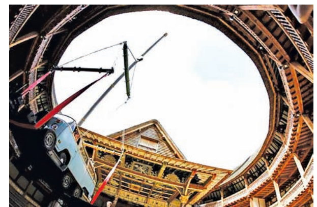
A camper van is lifted by a crane to be placed on the stage at London's Globe theatre on 17 June, 2007.