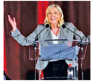
France’s far-right National Front leader Marine Le Pen gestures as she speaks during a political rally as part of the campaign for the second round in the French local elections in Henin-Beaumont, northern France on 25 March, 2015.

France’s two biggest cities, are excluded from Sunday’s election. In these cities the FN vote tends to be smaller than in the rest of the country.—Reuters