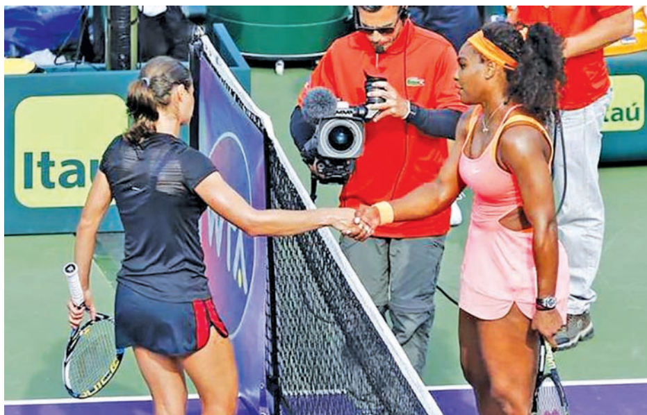
Serena Williams (R) shakes hands with Monica Niculescu (L) after their match on day six of the Miami Open at Crandon Park Tennis Centre, Key Biscayne, FL, USA on 28 March, 2015. Williams won 6-3, 6-1.

uled for Friday but was postponed following a rainstorm in South Florida meaning Williams will be back on court on Sunday against fellow American, qualifier Catherine Bellis. Canadian Bouchard lost 6-0, 7-6(4) to Maria.