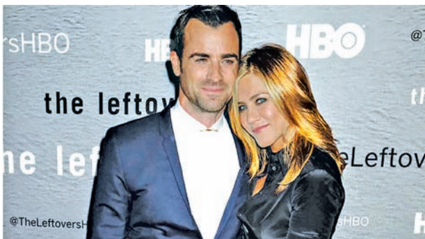
Justin Theroux & Jennifer Aniston

LONDON, 29 March — Former “Friends” star Jennifer Aniston has reportedly asked a hotel maitre'd to help plan her and Justin Theroux's wedding.