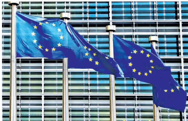
European Union flags flutter outside the EU Commission headquarters in Brussels on 2 Feb, 2015.

BRUSSELS, 29 March — After decades of punching above its weight in Europe, Britain’s influence in the European Union is waning, even before we know whether a promised referendum on “Brexit” will go ahead.