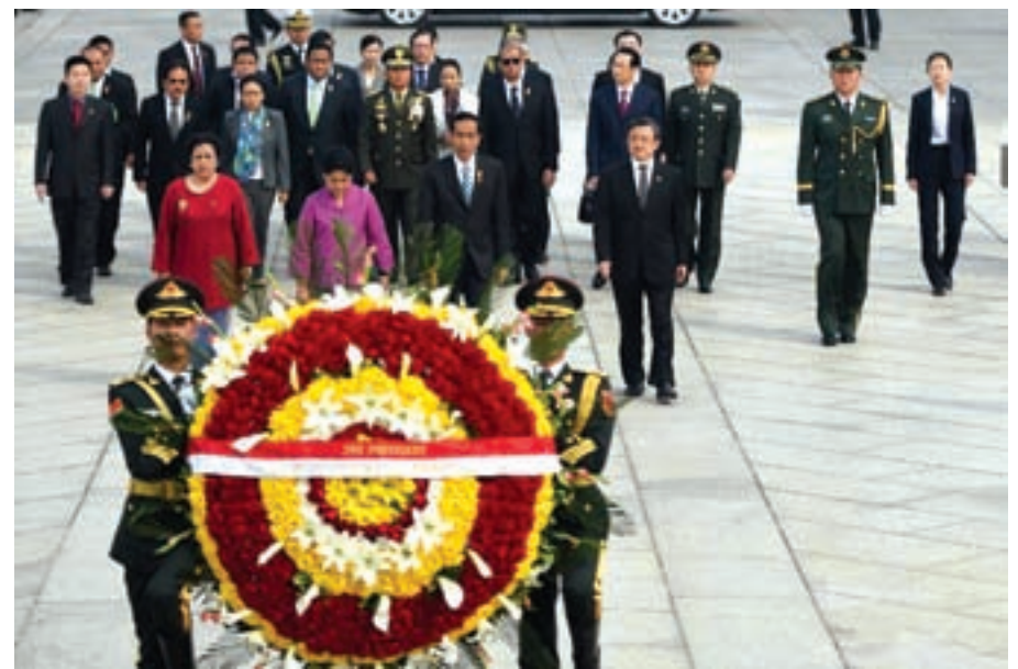
Visiting Indonesian President Joko Widodo offers a flower basket at the Monument to the People's Heroes in Tian'anmen Square, in Beijing, capital of China, on 27 March, 2015.