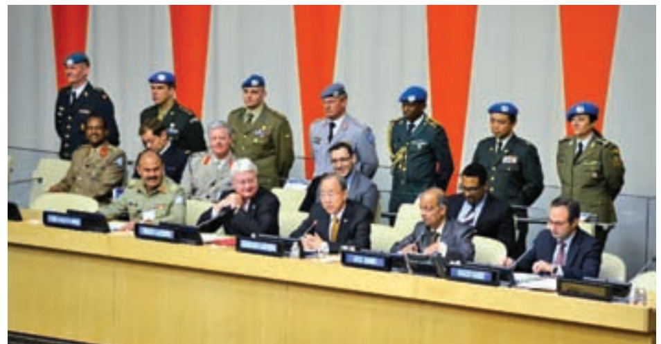
UN Secretary-General Ban Ki-moon (C) addresses the first-ever UN Chiefs of Defence Conference at the UN headquarters in New York on 27 March, 2015. The first-ever United Nations Chiefs of Defence Conference was held here Friday with UN Secretary-General Ban Ki-moon appealing to senior military officials for more contributions and political will to boost peacekeeping operation.

The historic event brings together chiefs of defence and senior military officials from more than 100 member states to discuss issues central to UN