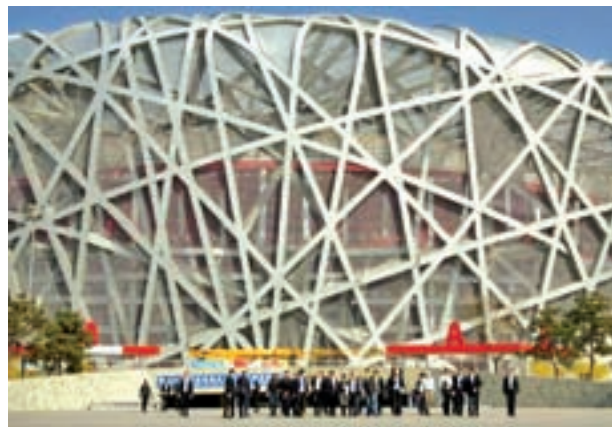
Members of the 2022 Evaluation Commission for the International Olympic Committee (IOC) and representatives of Beijing’s 2022 Winter Olympics bid committee walk outside Beijing National Stadium, also known as the Birds’ Nest, in Beijing on 24 March, 2015.

importance of sustainable development. “To host an economical Games we must ensure sustainable development,” he said.