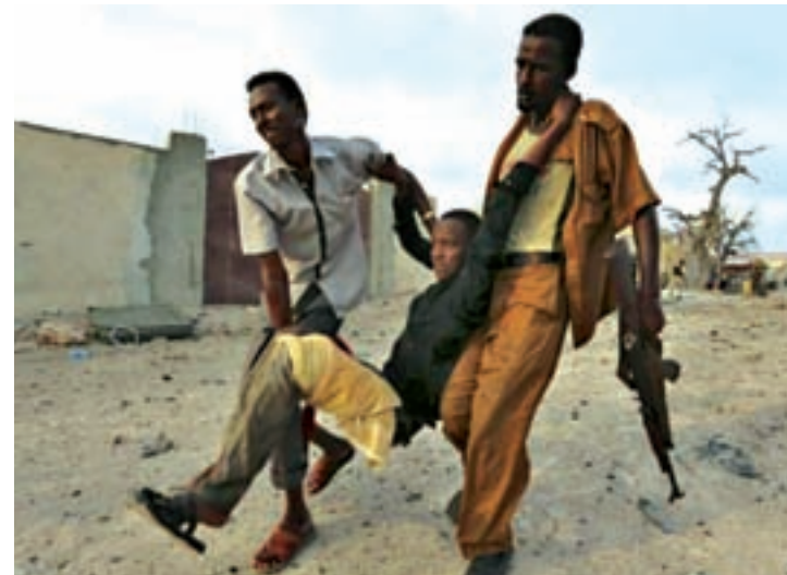
Residents evacuate an injured boy after Islamist group al Shabaab attacked Maka Al-Mukaram hotel in Mogadishu, on 27 March, 2015.

"Those who died include civilians, hotel guards and government soldiers."