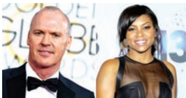
Oscar-nominated actor Michael Keaton and Empire star Taraji P Henson will both host "Saturday Night Live" in April.

NEW YORK, 28 March — "Birdman" star Michael Keaton and Taraji P Henson will both host "Saturday Night Live" in April.