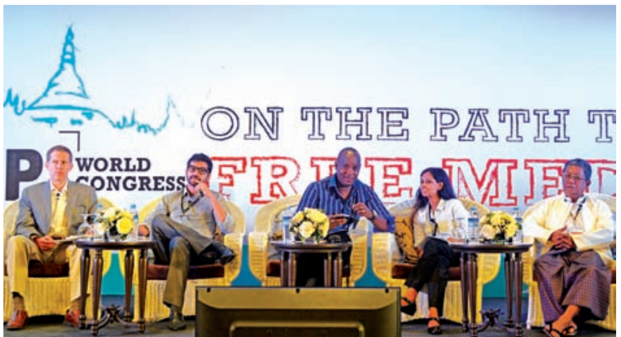
Panel members discuss hate speech at the IPI 2015 World Congress, with speakers encouraging members of the media to promote alternative narratives to combat harmful messages.

controlled through "ownership" rather than "censorship" under the former regime in her country. Media ownership became more consolidated, with many private outlets bought by (See page 3)