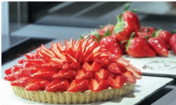
A fruit tart using "Akai Shizuku," a variety of strawberries produced in Ehime Prefecture, is shown in Tokyo on 25 Feb, 2015. Prefectural governments in Japan are aggressively promoting locally produced high-quality strawberries.

Shizuoka Prefecture in central Japan has developed the Kirapika (Glitter) strawberries as a successor to its Beni Hoppe (Red Cheek) brand. The product has a jewel-like glitter and its growers are eager to beat rival Amaou.