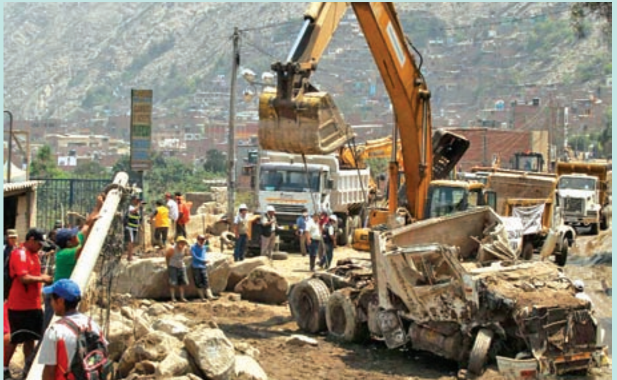
People clear up the blocked road after the landslides in Chosica district of Lima, Peru, on 27 March, 2015. At least nine people were killed and four others were missing in Peru after a massive landslide buried parts of a town amid heavy rains on the last hours, Operations Centre of National Emergency said on Tuesday.

Saudi Arabia and some other Muslim countries have launched a military operation against rebel forces in Yemen.