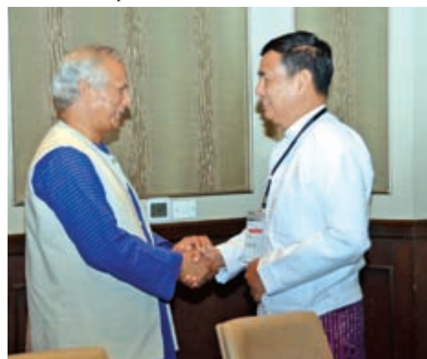
Union Minister for Information U Ye Htut converses with Nobel Laureate and Grameen Bank Bhaban Chairman Professor Mohammad Yunus at IPI World Congress.

The panel discussion was one of the sessions organized at the International Press Institute’s 2015 World Congress that began on Friday at Chatrium Hotel in Yangon with the theme “On the Path to a Free Media.”