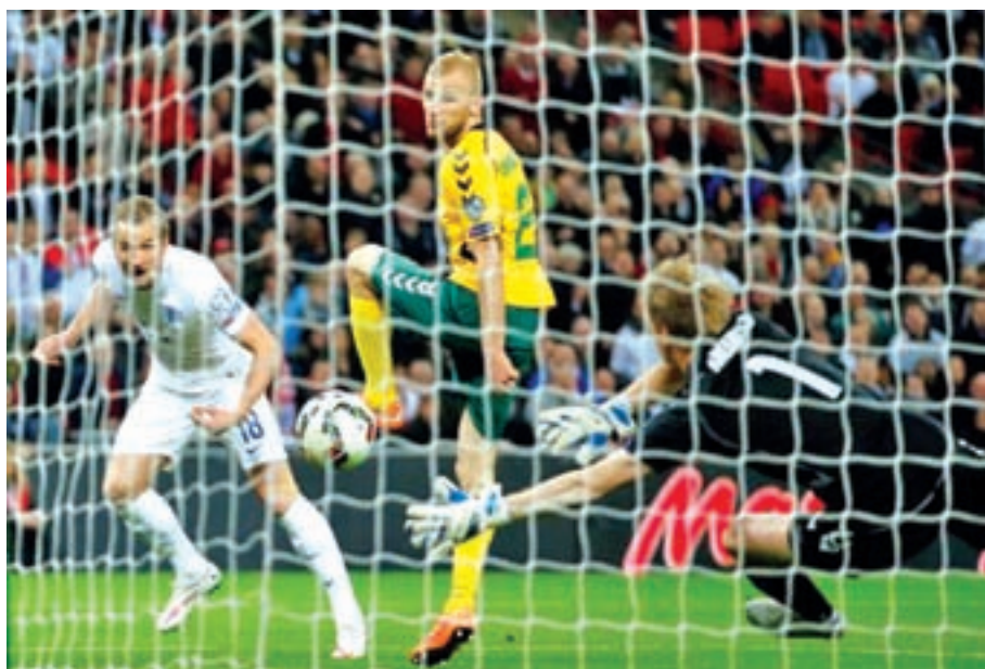
England's Harry Kane scores their fourth goal against Lithuania during their UEFA Euro 2016 Qualifying Group E at Wembley Stadium, London, England on 27 March, 2015.

LONDON, 28 March — England's Harry Kane scored on his debut less than two minutes after coming on as they brushed Lithuania aside 4-0 at Wembley on Friday to maintain their grip at the top of the Euro 2016 qualifying Group E standings.