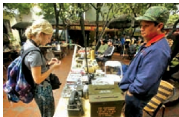
US military items used during the Vietnam War are seen displayed for sale at an old items market in Hanoi on 14 March, 2015.

“These things help me feel the lives of the soldiers,”