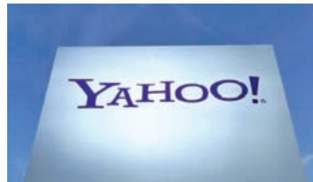
A Yahoo logo is pictured in front of a building in Rolle, 30 km (19 miles) east of Geneva, in this file picture taken on 12 Dec, 2012.

According to a filing with the US Securities and Exchange Commission on Friday, Yahoo and Microsoft mutually agreed to extend that deadline to a 60-day period following 23 February. "We value our