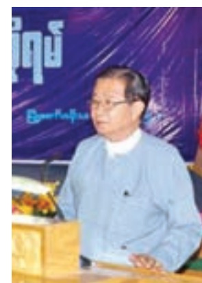
Union Peace Making Working Committee Vice Chairman U Aung Min. MNA