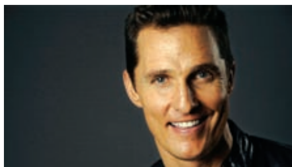
Oscar-winning actor Matthew McConaughey has come on-board for Sony's new project "The Billionaire's Vinegar".

LOS ANGELES, 28 March — Oscar-winning actor Matthew McConaughey has come