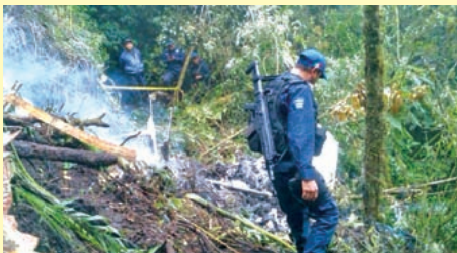
Photo taken with a mobile phone shows the crash site of a helicopter in Santa Maria Chilchota municipality, Oaxaca state, south of Mexico, on 27 March, 2015. According to local press, the helicopter crashed on Friday, leaving at least 3 people dead and another injured.