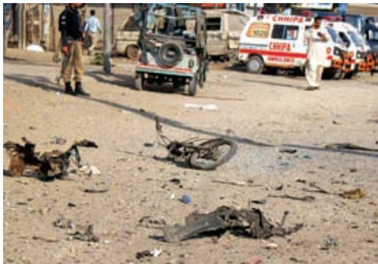
Police officials inspect the blast site in southern Pakistani port city of Karachi, on 27 March, 2015. —XINHUA

Officials said that the cops conducted a search operation on