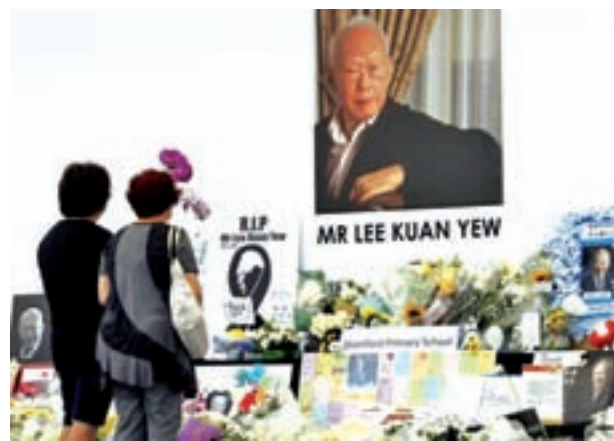
People pay their respects to the late first prime minister Lee Kuan Yew at a community tribute site in Singapore on 28 March, 2015.

The casino at Genting Singapore’s Resorts World Sentosa will be closed on Sunday from 2 pm to 6 pm