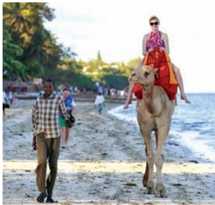
A tourist rides on a camel's back at the Jomo Kenyatta public beach in Kenya's coastal city of Mombasa on 24 March, 2013.