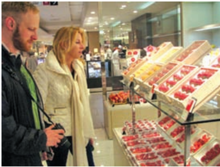
Foreign tourists look at Amaou strawberries from the southwestern Japanese prefecture of Fukuoka on 20 March, 2015, at Mitsukoshi department store in Tokyo's Ginza shopping district. Growers of giant, juicy and sweet strawberries have been competing to make their produce the country's top strawberry brand in recent years.