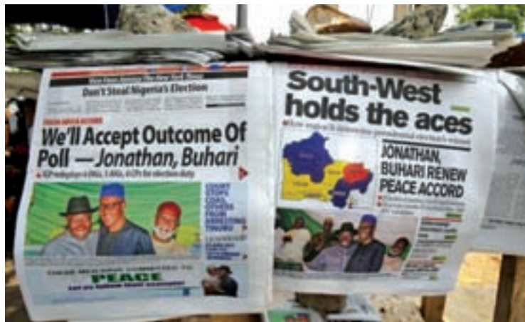
Newspaper headlines are seen on a newspaper at a vendor's stand along a road, in Katsina city on 27 March, 2015.

When Buhari, a northern Muslim, lost to Jonathan, a south-