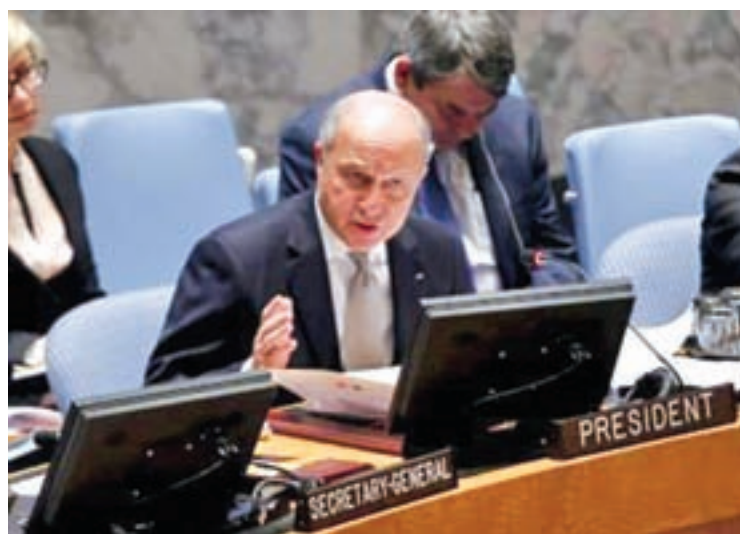
French Foreign Minister Laurent Fabius addresses a United Nations Security Council meeting on the Crisis in the Middle East in his capacity as the current President of the Council at UN headquarters in New York on 27 March, 2015.

"A plane of the F-15S type was stricken by a technical fault