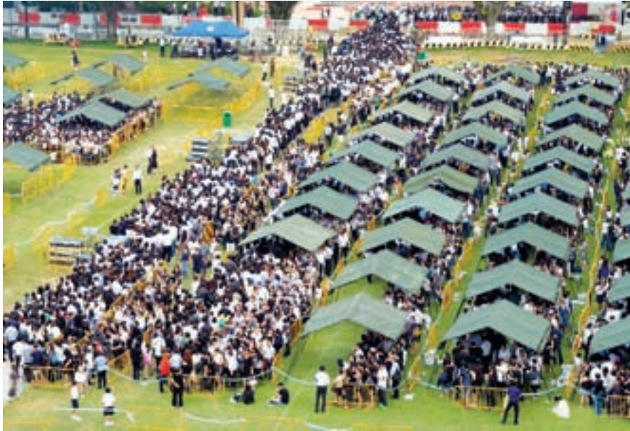
People queue in line at Singapore's Padang to get into Parliament House to pay their last respects to Singapore's founding Prime Minister Lee Kuan Yew on 26 March, 2015. The body of Singapore's founding Prime Minister Lee Kuan Yew will be laid in state at Parliament House from 25 March to 28 March for public to pay their last respects.