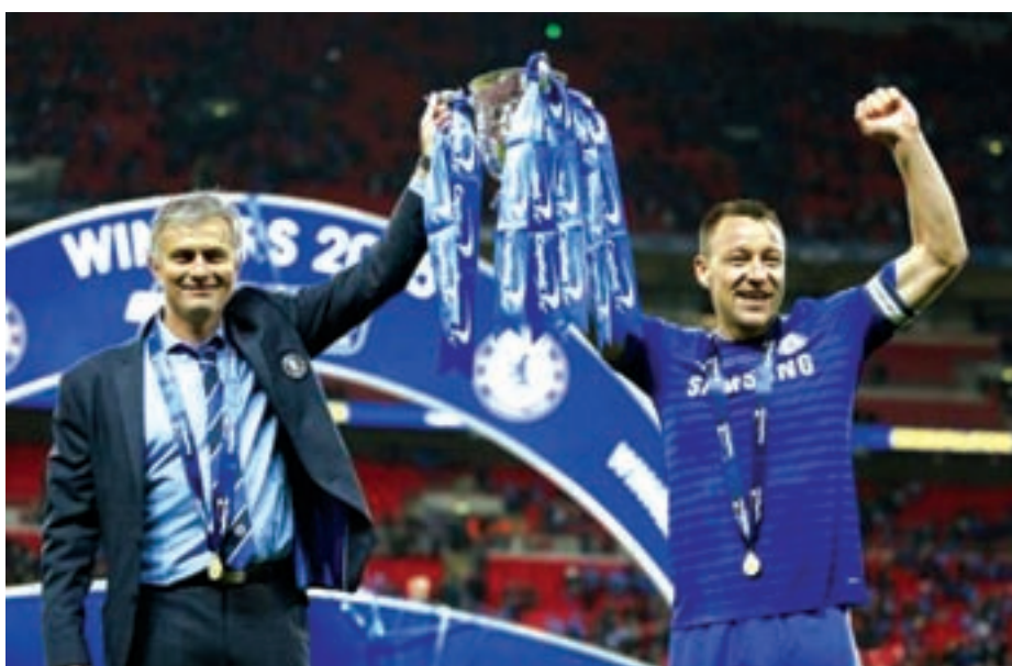
Chelsea's manager Jose Mourinho and John Terry pose with the Capital One Cup in Capital One Cup Final at Wembley Stadium on 1 March, 2015.

under Benitez for Terry who, for the first time in his Chelsea career, was not regarded as a first-choice starter. The former England captain did struggle with injuries in season 2012-13 but even when he was fit, Gary Cahill and David Luiz were the preferred options in central defence. Terry did not have Benitez's 100 per cent trust and backing but that quickly changed when Mourinho returned for a second stint in charge at the beginning of last season.