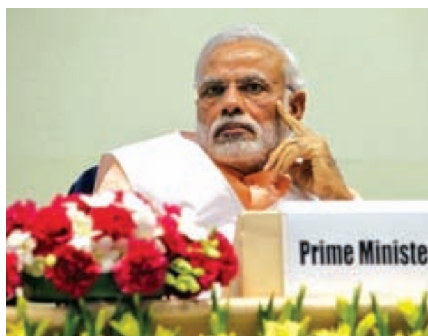
India's Prime Minister Narendra Modi

The meeting was held in January and the discussions were not made public. All of the sources declined