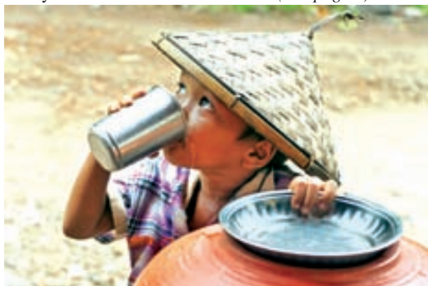
A boy drinks water from a pot after playing with his friends in this image captured by Myanmar photographer Thandar Soe for a photo contest organised by ICIMOD. In some villages in Myanmar, traditional drinking water pots are found throughout the village for all to use.

Myanmar-ICIMOD Partners Day was aimed at strengthening Myanmar’s involvement with the eight-member ICIMOD, which works closely with (See page 3)