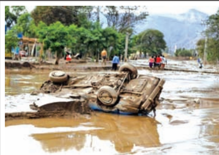
A damaged car covered in mud lies on a street at Copiapo City, on 26 March, 2015. The death toll in Chile rose to seven after rains battered the north and caused flooding, the government said on Thursday, while 19 others were unaccounted for as the military rushed to rescue stranded villagers. The downpours in the usually arid region have been the heaviest in about 80 years, although the worst of the bad weather appeared to be over, meteorologists said.