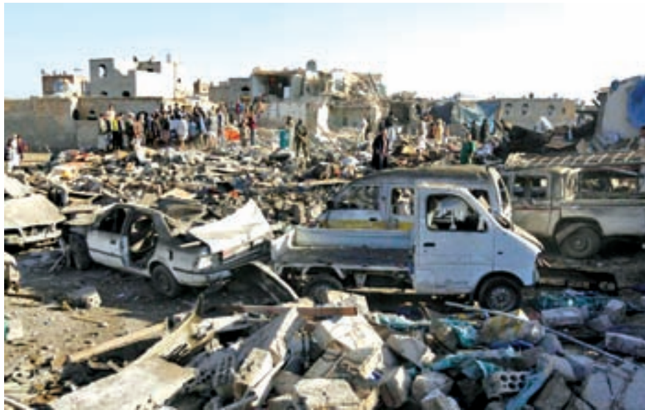
People gather at the site of an air strike at a residential area near Sanaa Airport on 26 March, 2015.

SANAA, 27 March — Warplanes hit Yemen's Houthi-controlled capital and the Shi'ite Muslim group's northern heartland on Friday, the second day of a Saudi-led campaign to stop the militia establishing its rule across the country.