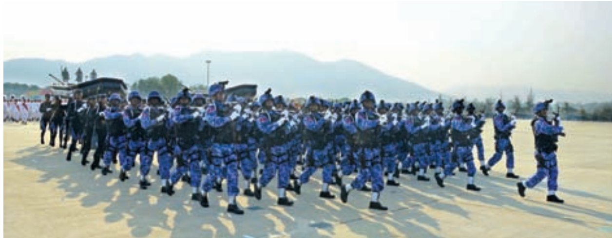
Military servicemen from Myanmar Navy participate in parade of 70 th Anniversary of Armed Forces Day parade 2015.