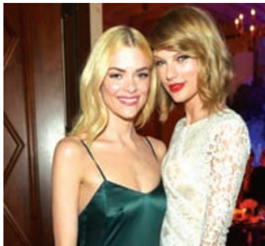
Actress Jaime King says singer and close friend Taylor Swift's "thoughtfulness and kindness" is so effective that she could not think of anyone else as her upcoming baby's godmother.