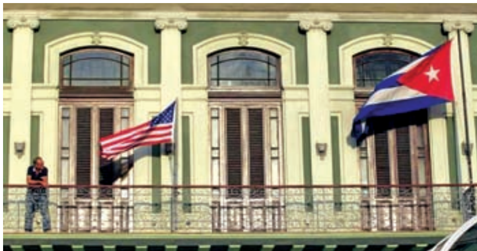
A man stands near the national flags of the US and Cuba (R) on the balcony of a hotel being used by the first US congressional delegation to Cuba since the change of policy announced by US President Barack Obama on 17 December, in Havana, on 19 Jan, 2015.

Those talks continued in Washington in February and again in Havana this month, but the two sides have not announced when they might have their next session. Obama and Cuban President Raul Castro are both due to attend the Summit of the Americas in Panama on 10-11 April, which could mark their first face-to-face meeting since the two leaders simultaneously announced the new direction for US-Cuban relations on 17 December.—Reuters