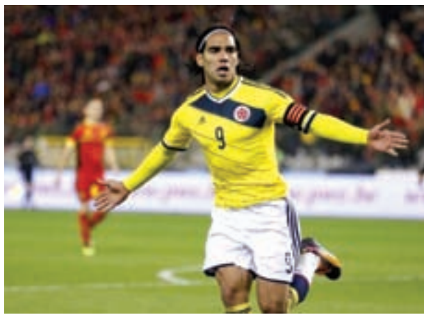
Colombia's Radamel Falcao