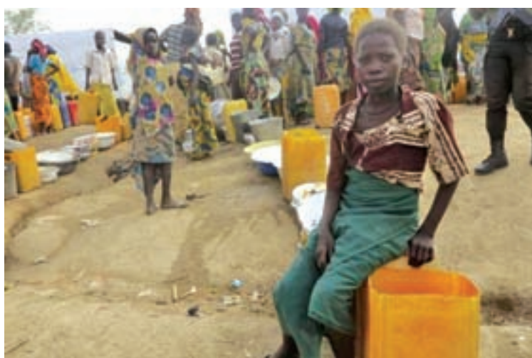
A girl waits in line for water at the Minawao refugee camp, northern Cameroon, on 18 Feb, 2015. Picture taken on 18 Feb, 2015.

DAKAR / YAOUNDE, 27 March — The number of people in northern Cameroon who have fled their homes fearing the violence in neighbouring Nigeria and cross-border raids by Islamist sect Boko Haram doubled in March to 117,000, a United Nations survey showed.