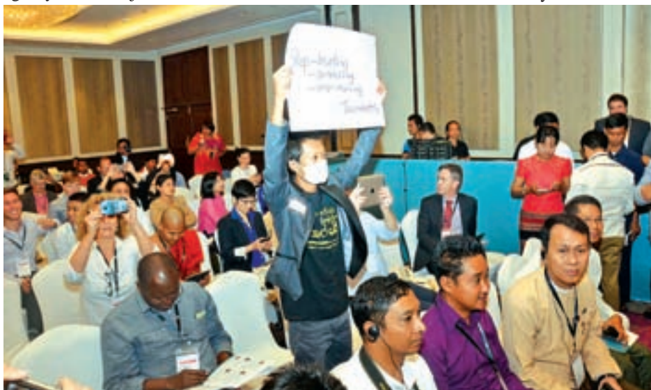
A journalist in protest calling for freedom of expression at IPI World Congress.