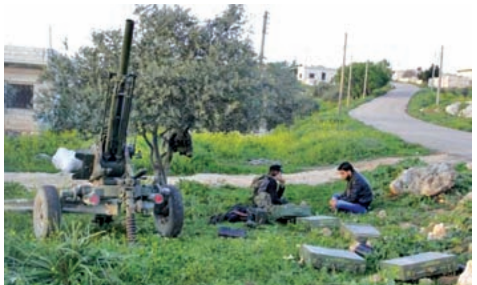
Ansar Al-Sham Brigade fighters rest with their weapons near Jisr al-Shoghour, Idlib Province on 25 March, 2015. — REUTERS

Syria slid into civil war after a crackdown on peaceful protests against President Bashar al-Assad in March 2011. The United Nations says more than 220,000 people have been killed.—Reuters