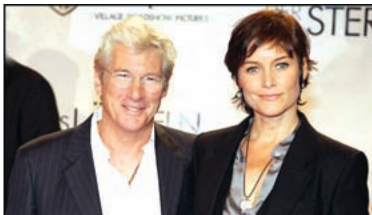
The cast of Pretty Woman were reunited on a TV show, to celebrate the film's 25 th anniversary.

LOS ANGELES, 27 March — The cast of Pretty Woman were reunited on a TV show, to celebrate the film's 25 th anniversary.