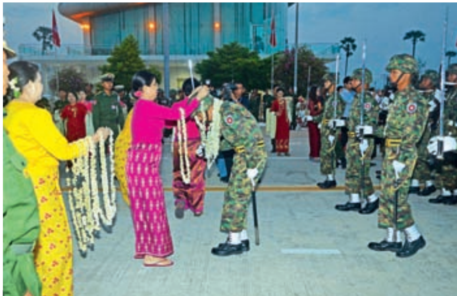
People garlands military servicemen of parade columns.—MNA