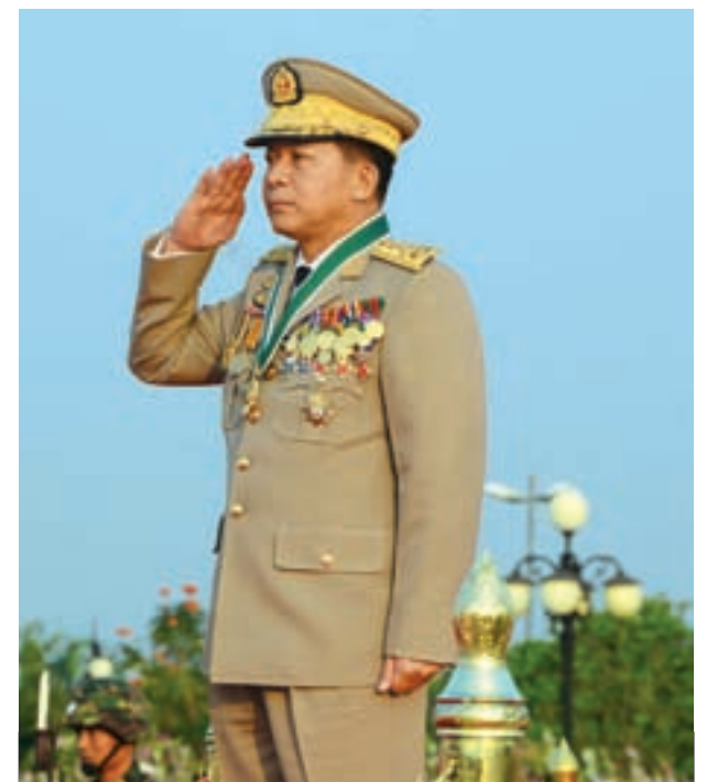
Commander-in-Chief of Defence Services Senior General Min Aung Hlaing takes salute of military columns at 70 th Anniversary Armed Forces Day.—MNA