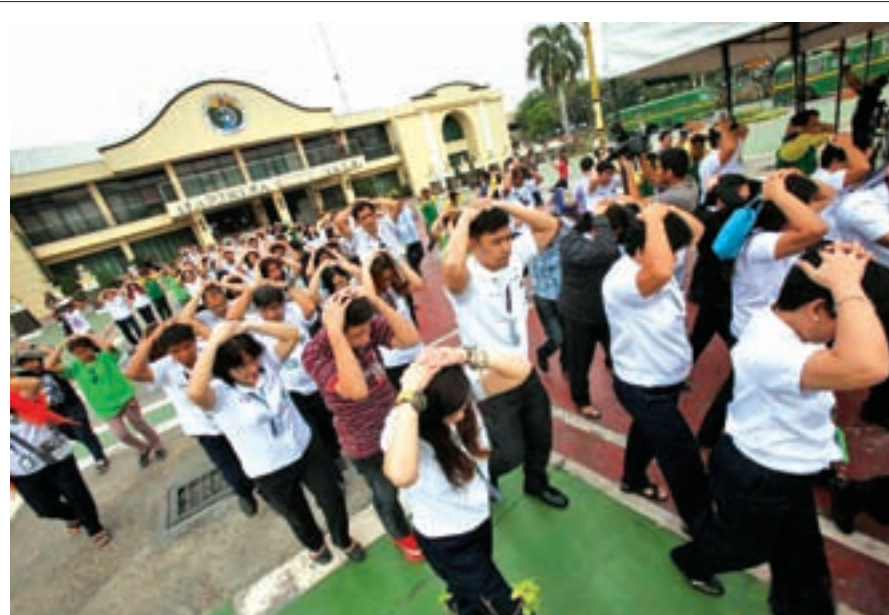
Employees protect their heads as they evacuate during the Nationwide Simultaneous Earthquake Drill in Marikina City, the Philippines, on 27 March, 2015.

Incomplete applications will not be considered.