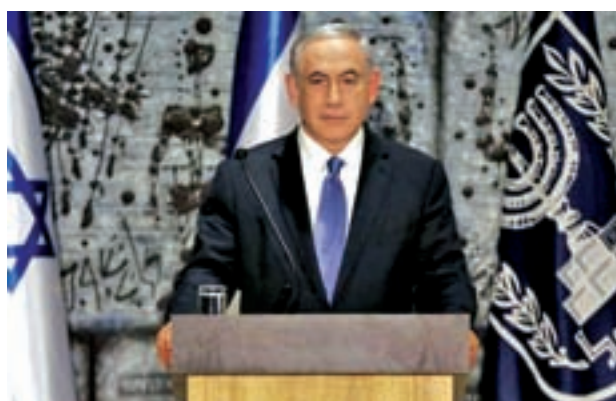
Israeli Prime Minister Benjamin Netanyahu speaks during a ceremony at President Reuven Rivlin's residence in Jerusalem on 25 March, 2015.

But faced with Western impatience and White House wrath over the calls to avoid a "very bad deal" — while offering no detailed alternative of his own — Netanyahu and his