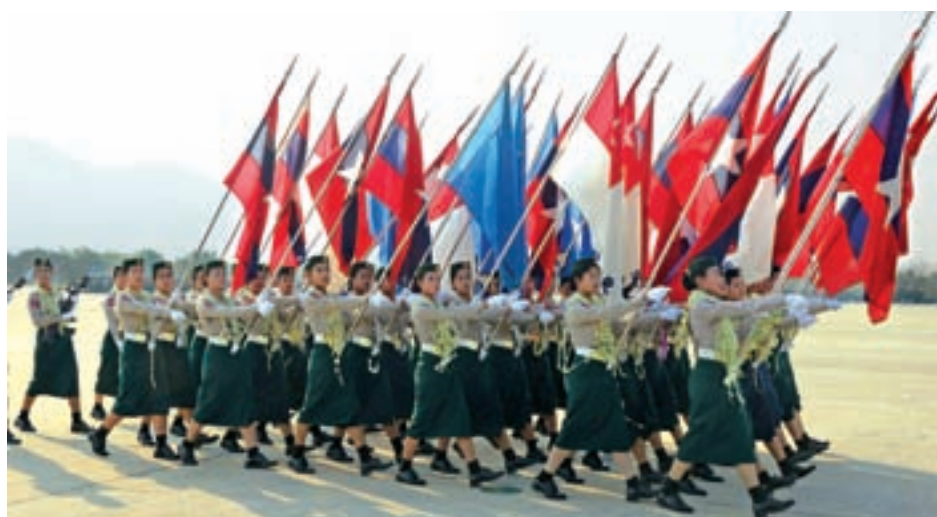
Military servicewomen marching in parade ground in Nay Pyi Taw.