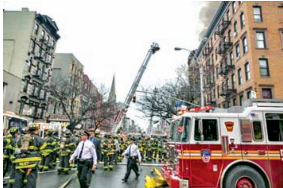
Police and firefighters surround the site of a building fire in the East Village neighbourhood of New York City on 26 March, 2015.