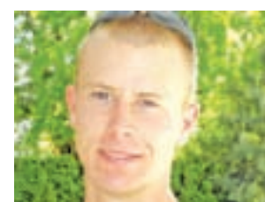
US Army Sergeant Bowe Bergdahl is pictured in this undated handout photo provided by the US Army and received by Reuters on 31 May, 2014.

An initial wave of euphoria over Bergdahl's release was followed by a backlash among US