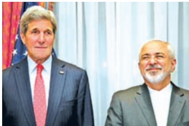
US Secretary of State John Kerry (L) and Iran's Foreign Minister Mohammad Javad Zarif pose for a photograph before resuming talks over Iran's nuclear programme in Lausanne on 16 March, 2015.

Those elements include the different pathways to a nuclear weapon, ensuring that it would take Iran at least one year to produce enough high enriched uranium for a single bomb, research and