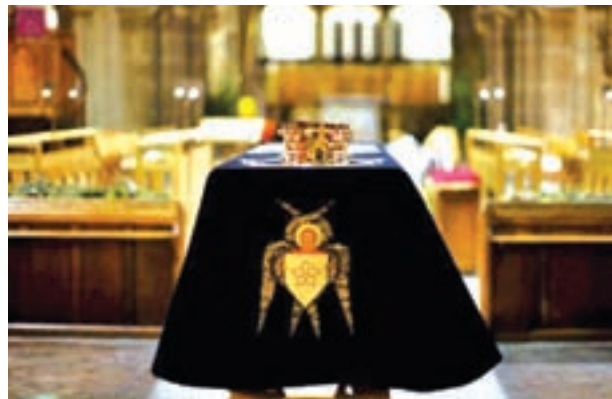
A crown sits on the coffin of King Richard III as it stands in Leicester Cathedral, central England, on 22 March, 2015.

The ceremony will feature a message from Queen Elizabeth, who will be represented by minor members of the royal family.