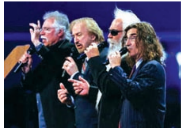
The Oak Ridge Boys sing the song “Amazing Grace” during the second day of the Republican National Convention in Tampa, Florida on 28 Aug, 2012.