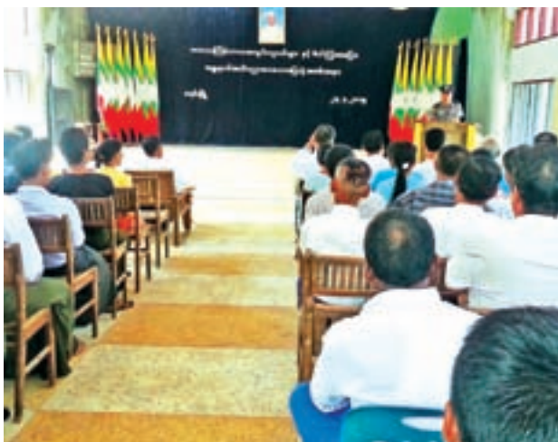
Police officer gives talks on danger of narcotic drugs to be combated and crime reduction in MahaThingyan festival period to local residents.