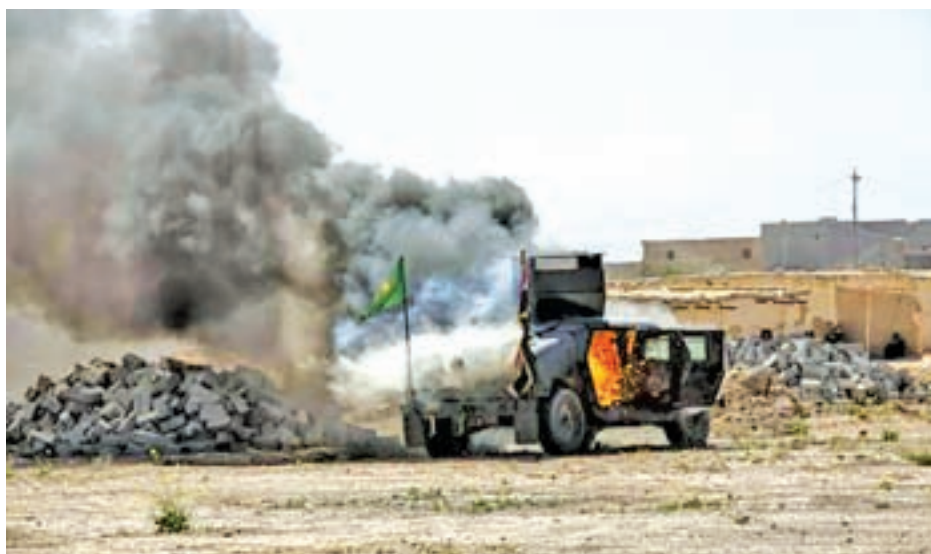
A military vehicle, belonging to Shi'ite fighters known as Hashid Shaabi, burns after being hit by Islamic State militants, during clashes in northern Tikrit on 11 March, 2015.