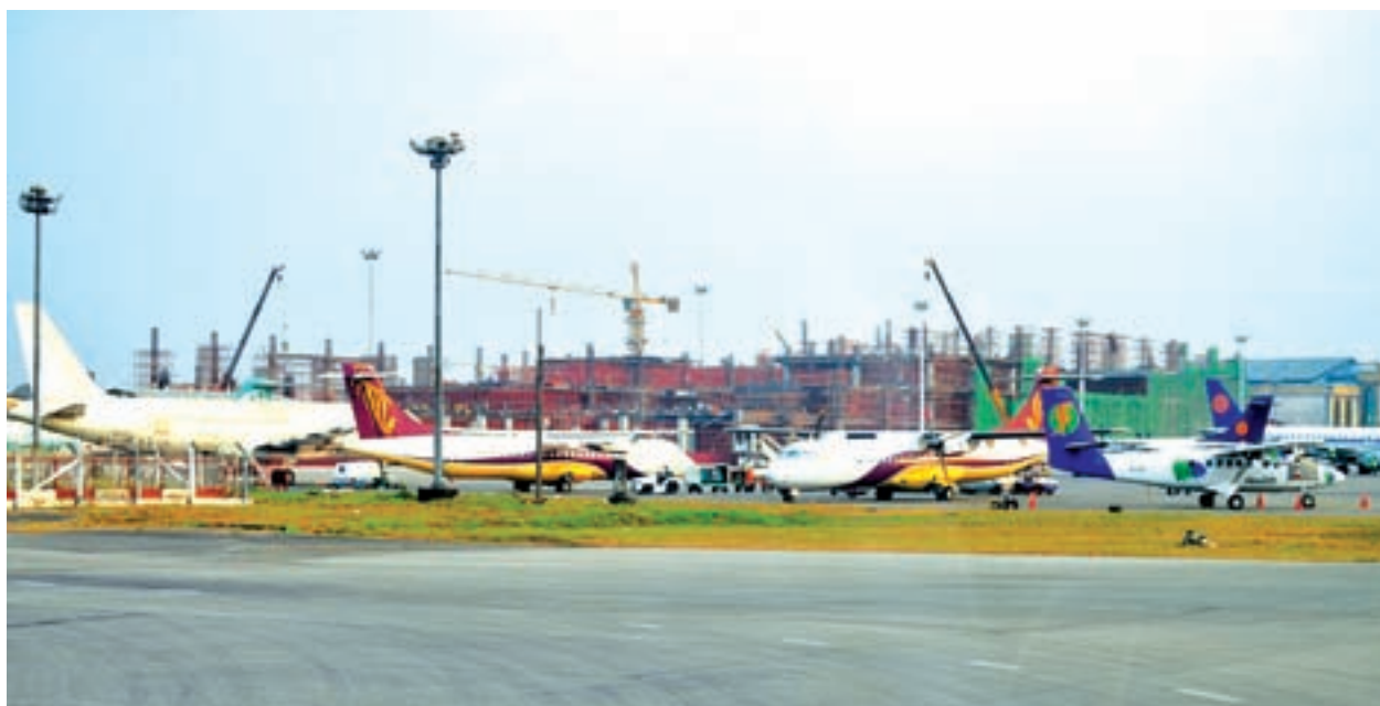
A domestic passenger aircraft lands at Myanmar's busiest airport in Yangon. The country's tourism boom is a welcome development for the aviation market.