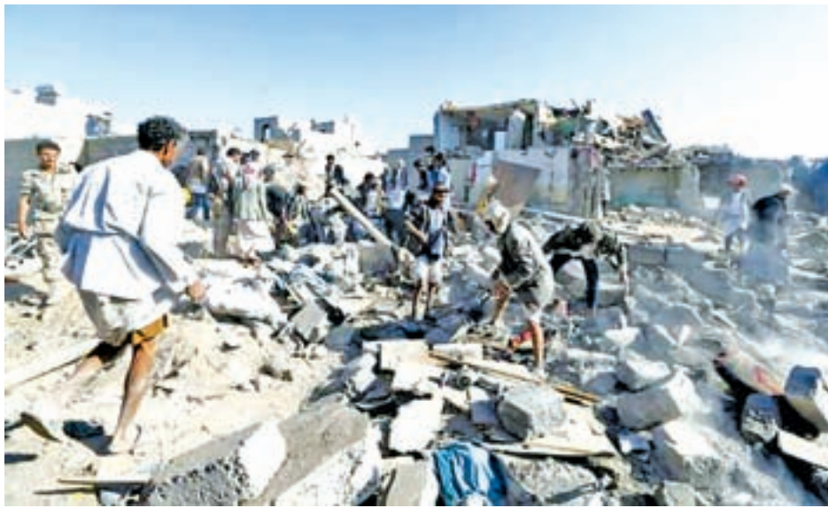
People search for survivors under the rubble of houses destroyed by an air strike near Sanaa Airport on 26 March, 2015.

SANAA, 26 March — Saudi Arabia and Gulf region allies launched military operations including air strikes in Yemen on