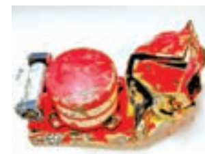
A black box voice recorder from the German Airbus operated by Lufthansa's Germanwings budget Airbus A320 crash is seen in this photo released on 25 March, 2015 by the BEA, France's Bureau d'Enquetes et d'Analyses.

The French prosecutor said Lubitz was not known as a terrorist and there were no grounds to consider the crash as a terrorist incident. Recordings suggested passengers' screams began just before the final impact, he said. Earlier, a German state prosecutor had said that just one of the two pilots of the