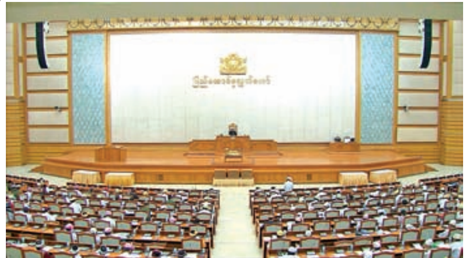
Representatives of Pyidaungsu Hluttaw emphasize raising salaries for government service personnel.—MNA

The first five-year plan includes rural development and poverty reduction, anti-corruption, reinforcement of rule of law, reconstruction of the country's economic institutions, state-owned investments, citizen investments, foreign investments and control of inflation.—MNA