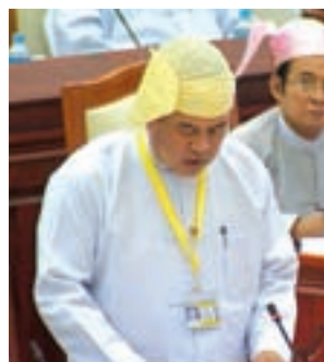
Deputy Minister for Sports U Thaug Htaik. MNA

NAY PYI TAW, 26 March — With regard to the question on arrangements for opening Sports University raised by U Thang Lein of Mindat Constituency, Deputy Minister for Sports U Thaug Htaik