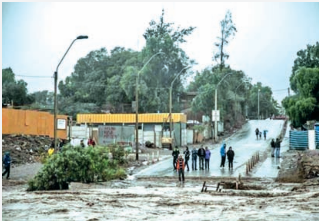
Locals gather near a flooded road after heavy rains in Copiapo city on 25 March, 2015.

SANTIAGO, 26 March — The heaviest rains to hit Chile's northern desert regions in 20 years have left at least two people dead and 24 missing as the torrential downpours caused mudslides and rivers to breach their banks, leaving thousands of residents stranded.