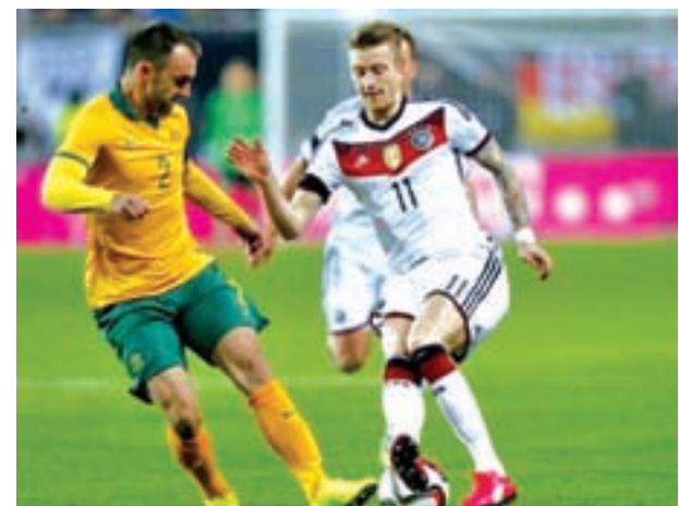
Germany's Marco Reus challenges Australia's Ivan Franjic during their international friendly soccer match in Kaiserslautern on 25 March, 2015.