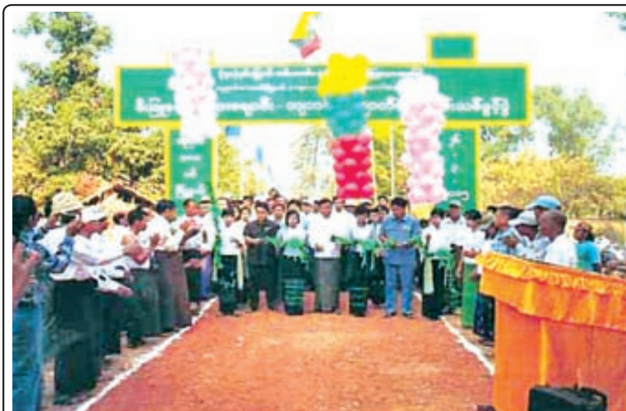
A laterite road was commissioned into service in Nyaunglebin Township, Bago Region, built by Metal Dragon Co., Ltd. with K130 million fund of the Department of Rural Development in 2014-15 FY, on Thursday. Zigongyi-Kyachaung-Zeebyukhin-Kyaban rural road is 2.5 miles long and 10 feet wide.