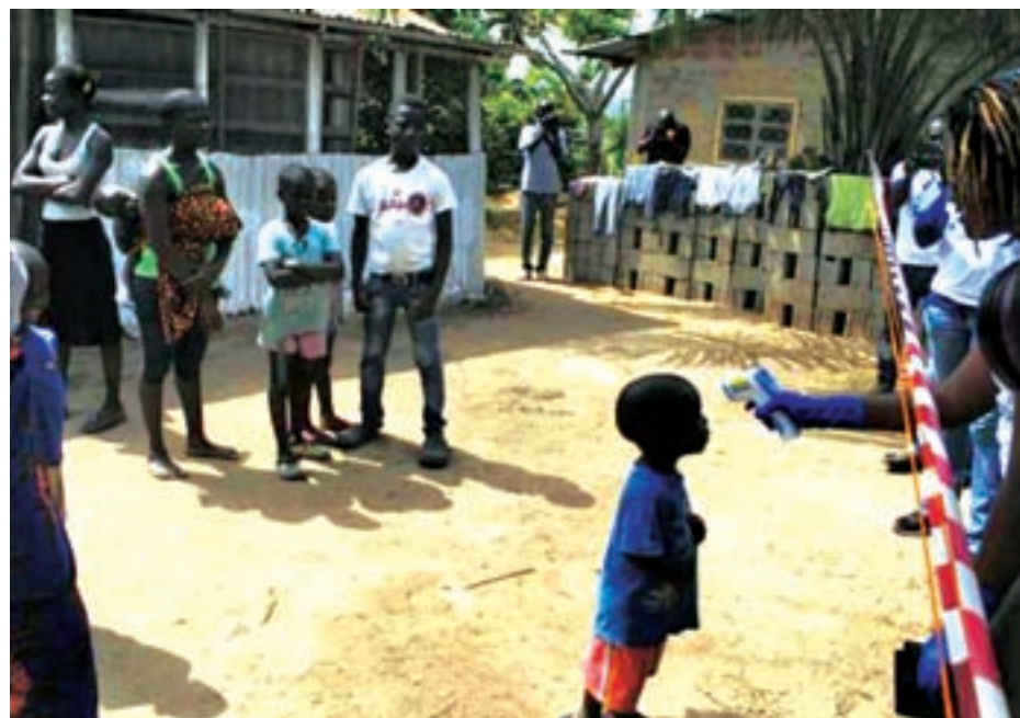
Health workers take the temperature of a boy who came in contact with a woman who died of Ebola virus in the Painesville neighbourhood of Monrovia, Liberia, on 21 Jan, 2015.

He said the findings about how children suffer more show the need to "evolve more dedicated and specialized means of caring for them in an Ebola outbreak".—Reuters