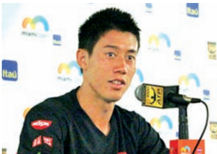
Japan's Kei Nishikori holds a Press conference in Miami, the United States, on 25 March, 2015, ahead of competing in the Miami Open Tennis tournament.

MIAMI, 26 March — Japan's Kei Nishikori said on Wednesday at the Miami Open that he aspires to be world No 1, but acknowledged it will take some doing to succeed the man who beat him last year here in the semifinals, Novak Djokovic.