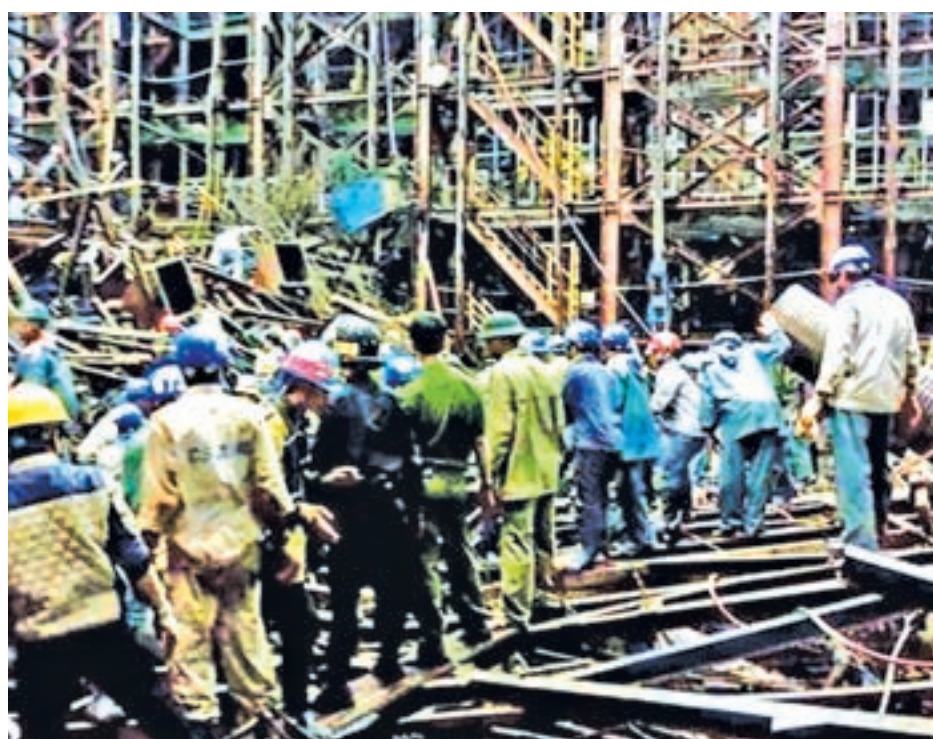
Rescuers and workers search for victims at a collapsed construction site in Ha Tinh Province, south of Hanoi on 25 March, 2015.