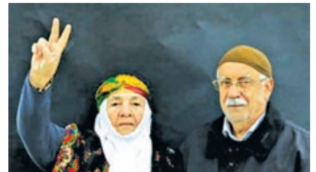
A Kurdish couple poses for a picture as they arrive for a gathering celebrating Newroz in Diyarbakir on 21 March, 2015.

DIYARBAKIR, (Turkey), 26 March — Kurds applauded last weekend's call from their jailed rebel leader Abdullah Ocalan to end a 30-year armed struggle against Turkey but deep suspicions on both sides could shatter dreams of peace. Ocalan began talks with Ankara in 2012 to end a conflict which has killed 40,000 people and stunted development in NATO-member Turkey's mainly Kurdish southeast, and impatience is growing in a peace process complicated by Kurds' involvement in fighting Islamic State in Syria and Iraq.