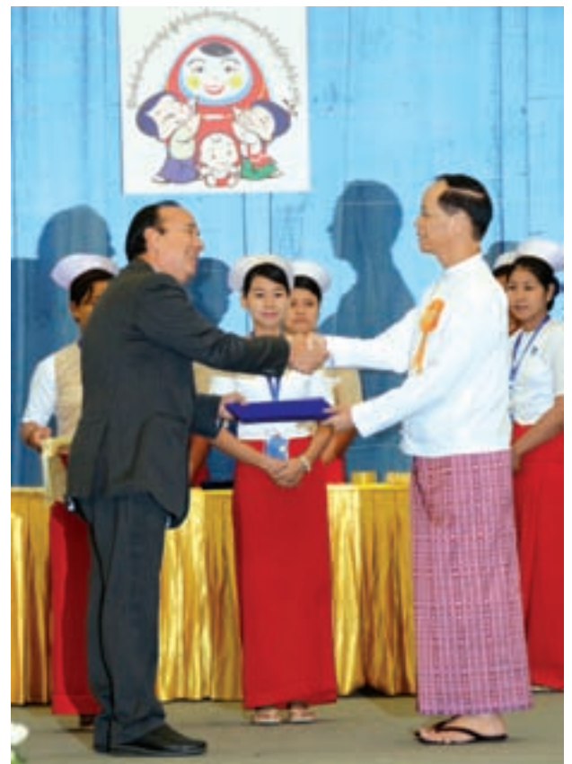
Vice President Dr Sai Mauk Kham presents certificate of honour to an official.

The vice president and the union minister for health presented certificates of honour to the organisations at the ceremony.