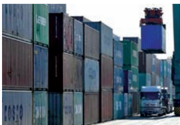
Trucks line up as containers are loaded at a port in Tokyo, on 19 Feb, 2015.

TOKYO, 26 March — Japan's exports struggled for the past two years due to lower demand for capital goods, a shift in production overseas and a loss of competitiveness, but these structural problems are fading away, the Bank of Japan said on Thursday.