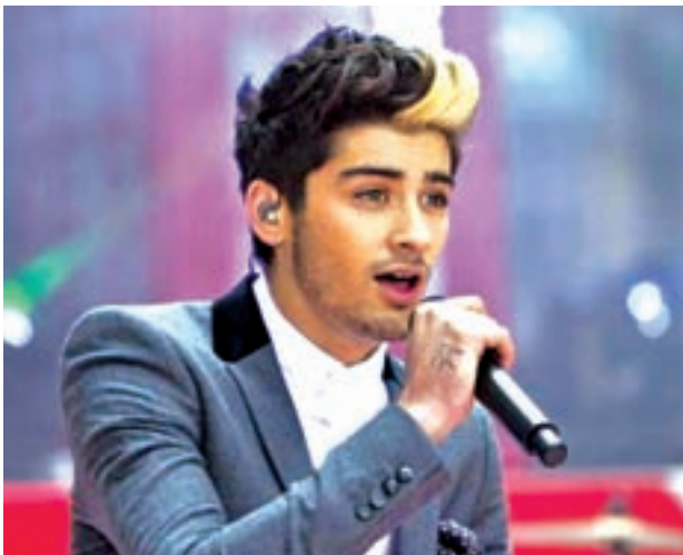
Zayn Malik performs with his band “One Direction” on NBC’s Today show in New York on 13 Nov, 2012.