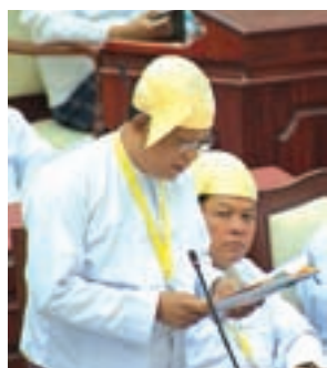
Deputy Minister for Health Dr Win Myint.—MNA

NAY PYI TAW, 26 March — With regard to the question on arrangements for opening Sports University raised by U Thang Lein of Mindat Constituency, Deputy Minister for Sports U Thaug Htaik