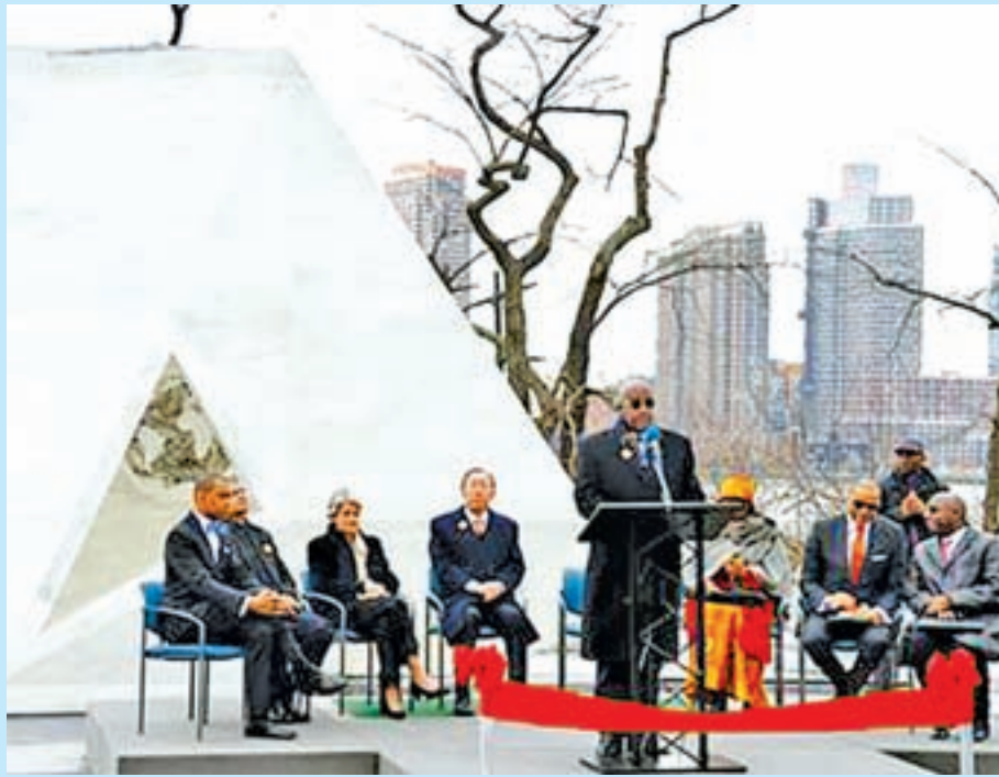
Sam Kutesa (standing), president of the United Nations General Assembly, addresses a ceremony at the UN headquarters in New York on 25 March, 2015, to unveil a memorial, the Ark of Return, to the victims of slavery and the Transatlantic slave trade. UN Secretary General Ban Ki Moon (4 th from L) is seen in the back.