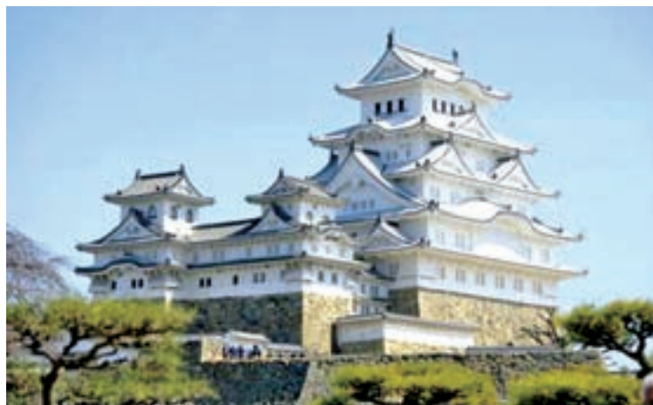
The renovated Himeji Castle, a world heritage site and national treasure, in the western Japan city of Himeji in Hyogo Prefecture, is shown in this 26 March, 2015 photo prior to its opening to the public from 26 March, 2015.