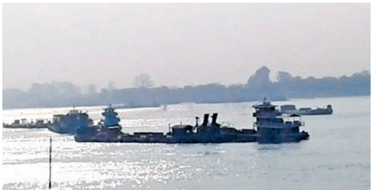
Vessels small and large stranded in Ayeyawady River during summer between Ywathit village in Ngazun Township and Nyaungyin village in Myinmu Township, Mandalay Region.