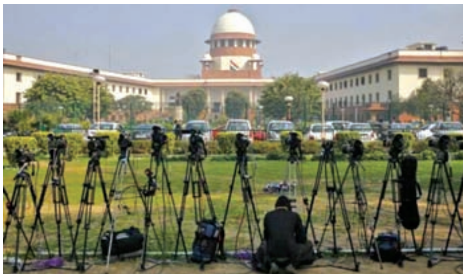
A television journalist sets his camera inside the premises of the Supreme Court in New Delhi on 18 Feb, 2014.

The petitioners argued the "draconian law" intro-