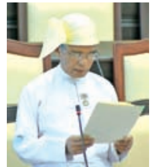
MP U Nu of Yangon Region Constituency No 10.