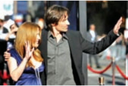
Cast members David Duchovny (R) and Gillian Anderson wave at fans at the movie premiere of 'The X-Files: I Want to Believe' at the Grauman's Chinese theatre in Hollywood, California on 23 July, 2008.

LOS ANGELES, 25 March — Cult television thriller "The X-Files" will return for a limited series with David Duchovny and Gillian Anderson reprising their FBI agent roles, Fox Broadcasting network said on Tuesday.