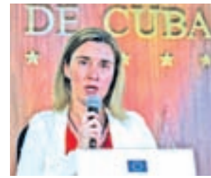
The European Union’s Foreign Policy Chief, Federica Mogherini, speaks at a news conference in Havana on 24 March, 2015.

“We decided today to speed up the rhythm of our negotiations, hopefully to manage to finalise the framework of our dialogue and agreement by the end