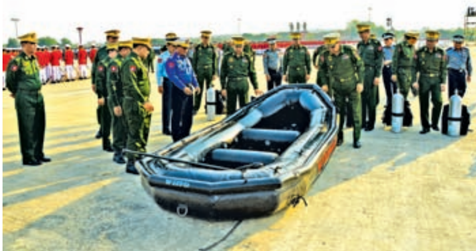
Vice-Senior General Soe Win views life boat to be displayed at 70 th Anniversary Armed Forces Day parade.—MYAWADY

NAY PYI TAW, 25 March — Deputy Commander-in-Chief of Defence Services Commander-in-Chief (Army) Vice-Senior General Soe Win inspected dressed rehearsal of military columns at the parade for the 70 th Anniversary of Armed Forces Day at Nay Pyi Taw Parade Ground, here, on Wednesday. The vice-senior general and party viewed participation of military servicemen from five columns in the dressed rehearsal parade led by Parade Commander Brig-Gen Phone Myat.—Myawady