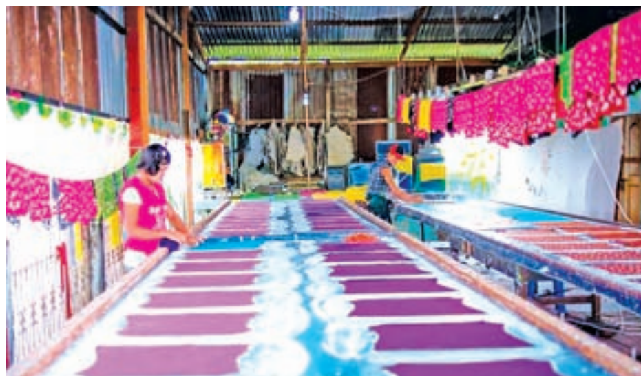
Photo of the workplace of a small business in Myanmar. Lack of access to finance is a major barrier for Myanmar's private firms, according to the World Bank.