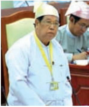
Deputy Minister U Soe Tint.—MNA