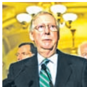
US Senate Majority Leader Mitch McConnell

WASHINGTON, 25 March — Senate Majority Leader Mitch McConnell said on Tuesday the US Senate would vote on a bill to toughen sanctions on Iran if international negotiators miss a deadline at the end of this month for reaching a framework nuclear agreement.