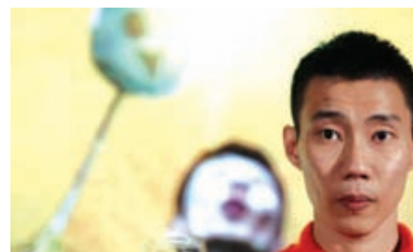
Malaysia's Lee Chong Wei looks on during a news conference in Bangkok on 21 Nov, 2014.

The 28th SEA Games will take place from 5-16 June with athletes from the 11 nations that make up Southeast Asia taking part in an eclectic mix of 36 sports including athletics, billiards, sepak takraw and swimming.—Reuters