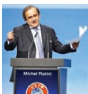
UEFA President Michel Platini delivers a speech after his reelection at the 39th Ordinary UEFA Congress in Vienna on 24 March, 2015.

In many ways, the day summed up the differing fortunes between the sport's European and world governing bodies.