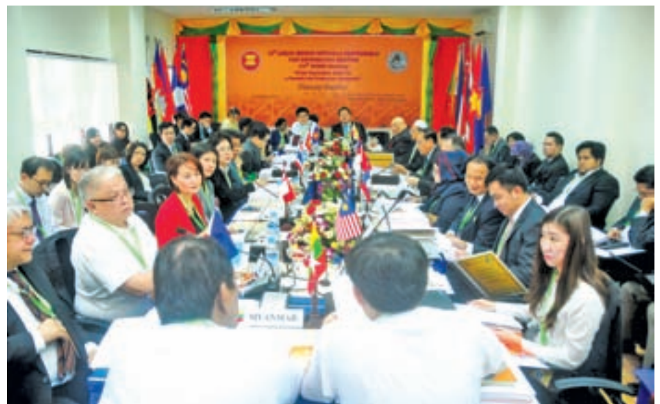
The plenary session 3 of 13 th Senior ASEAN Officials Responsible for Information Meeting in progress.