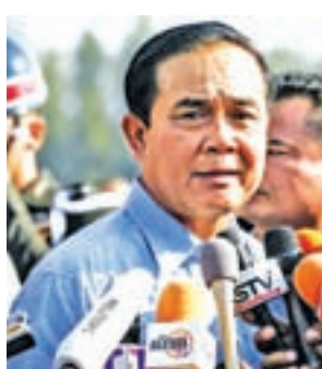
Thailand's Prime Minister Prayuth Chan-ocha

In January the junta forced a German foundation to cancel a forum on press freedom saying Thailand