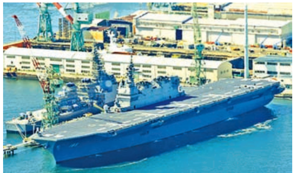
Photo taken on 25 March, 2015, from a Kyodo News helicopter shows the Japanese Maritime Self-Defence Force's largest ever helicopter-carrying destroyer, the Izumo , at the port of Yokohama. The 19,500-ton destroyer, measuring 248 metres in length and 38 metres in width, allows five helicopters to take off and land simultaneously.

Under the pacifist Constitution, Japan has taken