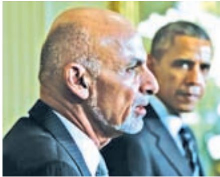
US President Barack Obama (R) and Afghanistan President Ashraf Ghani address a joint news conference in the East Room of the White House in Washington on 24 March, 2015.