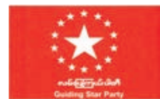
Emblem of Guiding Star Party