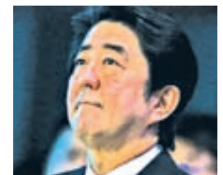
Japanese Prime Minister Shinzo Abe

Japan formally surrendered on 2 September, 1945 to the Allied powers