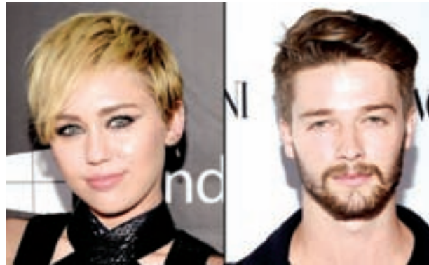
New couple Miley Cyrus and Patrick Schwarzenegger dined together after he was rumoured cheating on her.

While Cyrus kept mum on the matter, he had addressed it on Twitter, "Omg. It's one of my best friends girlfriend... Would NEVER do anything against my GF... Girls have guy friends and guys have friends that are girls..."