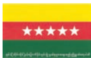
Emblem of Red Shan (Tailai) and Northern Shan Ethnic Solidarity Party