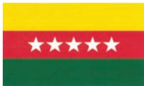
Flag of Red Shan (Tailai) and Northern Shan Ethnic Solidarity Party