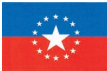
Flag of Guiding Star Party