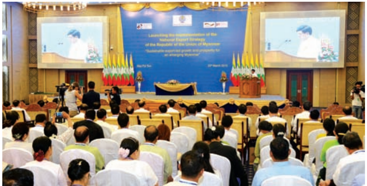
Vice President U Nyan Tun delivers address at implementation of the Myanmar National Export Strategy.