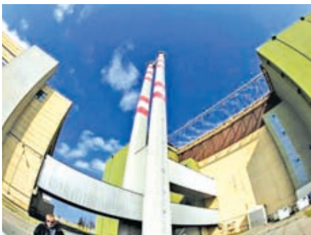
A general view of the Paks nuclear power plant reactor unit number four building in Paks, 120 km (75 miles) east of Budapest on 21 March, 2011.

The European Commission will also soon approve the fuel agreement, Lazar said after talks in Brussels with the EU’s Commissioner for Climate and Energy, Miguel Arias Canete. Under the agree-