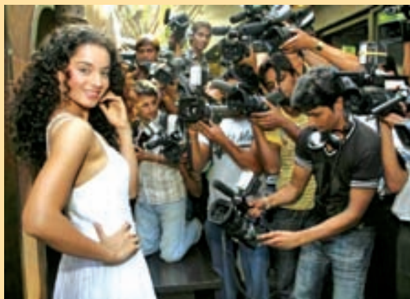
Bollywood actress Kangana Ranaut poses for a picture in Mumbai on 5 June, 2009.