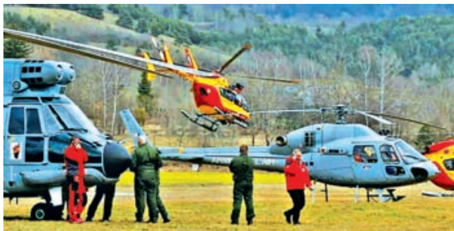
Rescue helicopters from the French Securite Civile and the Air Force are seen in front of the French Alps during a rescue operation near the crash site of an Airbus A320, near Seyne-les-Alpes on 24 March, 2015.

SEYNE-LES-ALPES, (France) 25 March — French investigators will sift through wreckage on Wednesday for clues into why a German Airbus ploughed into an Alpine mountainside, killing all 150 people on board including 16 schoolchildren returning from an exchange trip to Spain.