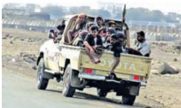
Militants loyal to Yemen's President Abd-Rabbu Mansour Hadi patrol in the southern port city of Aden on 23 March, 2015.