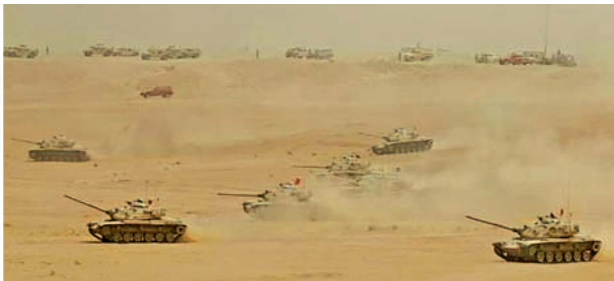
Tanks perform during Saudi security forces' Abdullah's Sword military drill in Hafar Al-Batin, near the border with Kuwait on 29 April, 2014.

The armour and artillery being moved by Saudi Arabia could be used for offensive or defensive purposes, two US government sources said. Two other US officials said the build-up