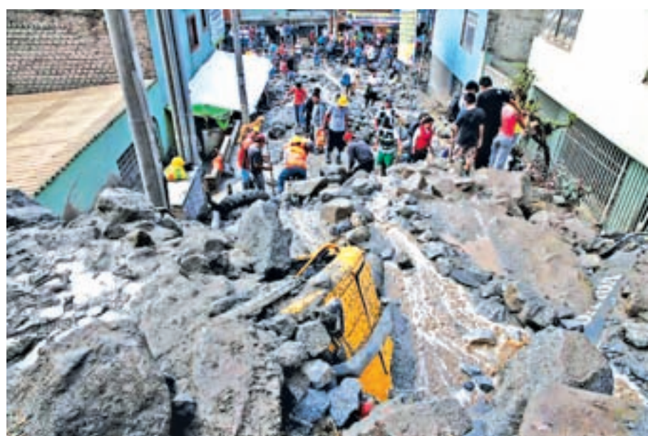
Rescuers work at the site of a landslide, in Chosica, Peru, on 24 March, 2015. At least nine people were killed and four others are still missing in Peru after a massive landslide buried parts of a town amid heavy rains on Monday, authorities said on Tuesday.