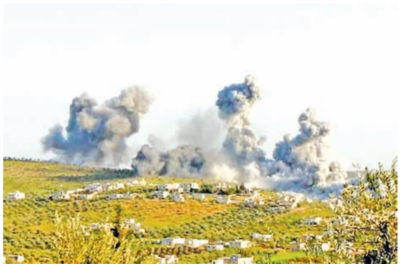
Smoke rises after what activists said was an airstrike on Atimah, Idlib Province on 8 March, 2015.

source said the army was working according to a new plan "focussed on directing concentrated blows against some of the positions of the terrorist gangs". "These strikes are achieving ex-