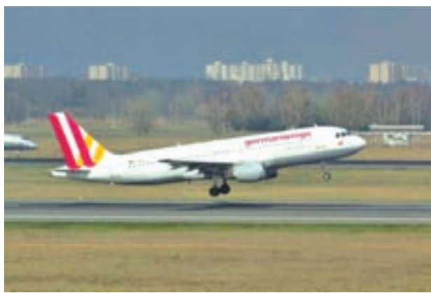
A Germanwings Airbus A320 registration D-AIPX is seen at the Berlin airport in this 29 March, 2014 file photo.

"There were 148 people on board," Hollande said. "The conditions of the accident, which have not yet been clarified, lead us to think there are no survivors."