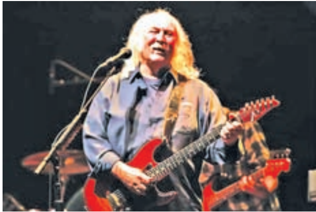
Musician David Crosby performs during a benefit concert to help defeat Proposition 32 on the State of California's November election ballot at Nokia theatre in Los Angeles, California on 3 Oct, 2012.

LOS ANGELES, 24 March — Legendary rock musician David Crosby struck and injured a jogger while driving his car in southern California at the weekend, police said on Monday.