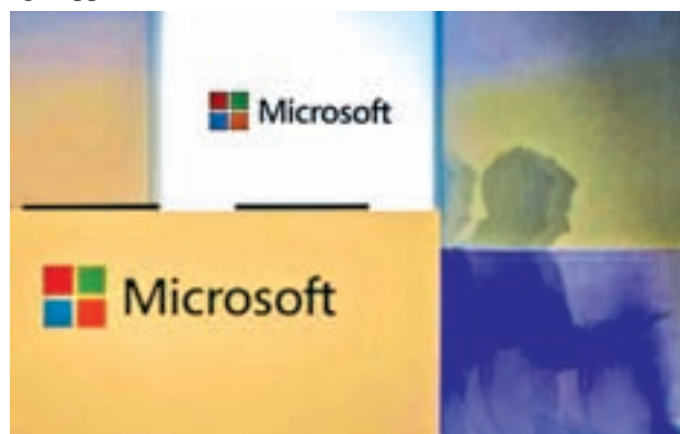
A shadow of a man using his mobile phone is cast near Microsoft logo at the 2014 Computex exhibition in Taipei on 4 June, 2014.

In the past, Microsoft preferred to pair its lucrative Office applications with its ubiquitous Windows operating system, but with the rise of mobile computing, Microsoft has been working hard to make its software available to users of Apple Inc's iOS and Google's Android, which dominate the tablet and smartphone markets.—Reuters