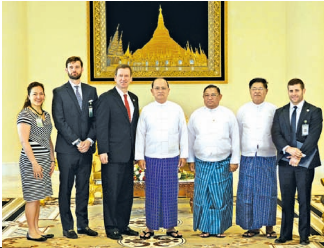
President U Thein Sein poses for documentary photo with Ambassador Mark Green, President of International Republican Institute (IRI).

Also present at the call were Union Ministers U Wunna Maung Lwin and U Soe Thane and departmental heads.