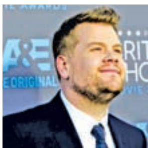
Actor James Corden, from the film “Into the Woods,” arrives at the 20th Annual Critics’ Choice Movie Awards in Los Angeles, California on 15 Jan, 2015.