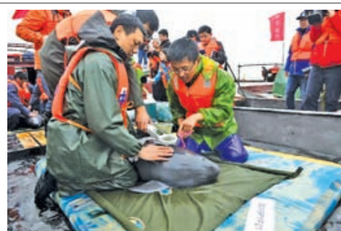
Researchers measure a cowfish on the Poyang Lake, east China's Jiangxi Province, on 19 March, 2015. Cowfish, the only hydrophilous mammal in the Yangtze River, is facing extinction as there are only about 1,000 left in China and is reducing at a rate of 13.7% each year. To call for protection of cowfish, the Ministry of Agriculture has started a programme recently. As part of the programme, researchers began to choose 8 cowfishes in Poyang Lake and change their habitat to nature reserves in Hubei and Hunan Provinces from 19 March.