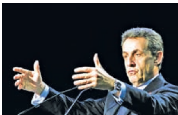
Nicolas Sarkozy, former French president and current UMP conservative political party head, attends a political rally in the Essonne department as he campaigns for French departmental elections in Palaiseau, near Paris on 16 March, 2015.