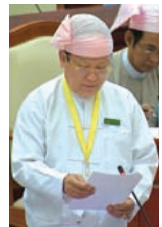
Deputy Minister at President Office U Aung Thein.

ion Election Commission responded that an increase of travel allowances would