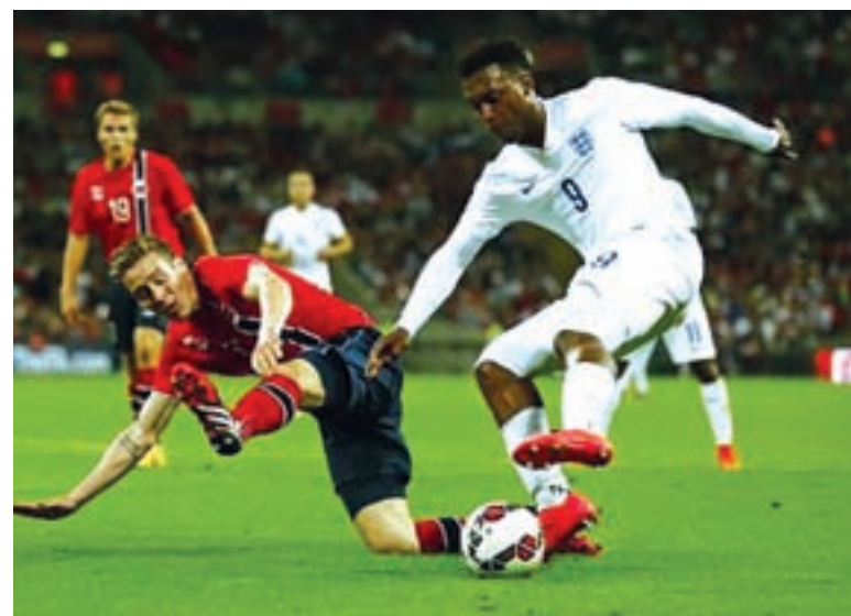
File photo of England's Daniel Sturridge (R) challenged by Norway's Stefan Johansen during their international friendly soccer match at Wembley Stadium in London on 3 Sept, 2014.

England, who top Group E with four wins from four matches, host Lithuania at Wembley on Friday before a friendly against Italy in Turin four days later.—Reuters