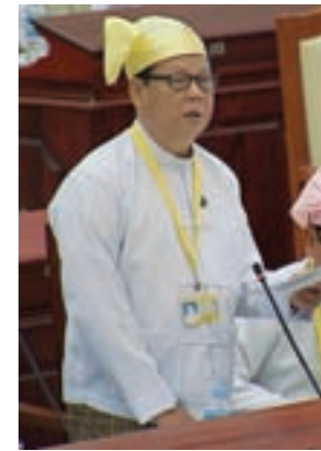
Deputy Minister for Livestock, Fisheries and Rural Development U Khin Maung Aye.