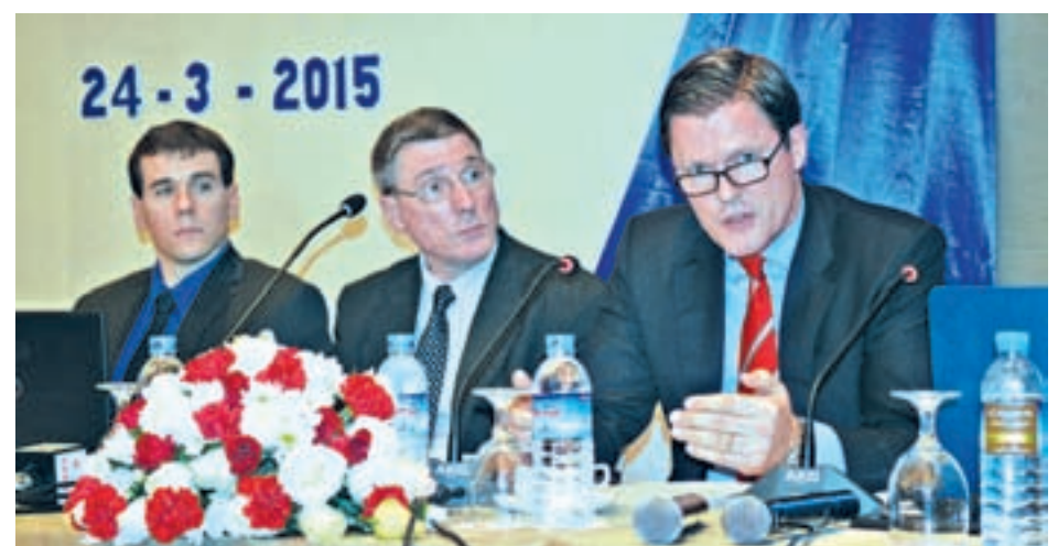
Winfried F. Wicklein, Asian Development Bank's country director for Myanmar, speaks at the press conference on Asian Development Outlook 2015: "Financing Asia's future growth and implications for Myanmar" in Yangon on Tuesday.

expected higher wages, which will increase domestic demand. Consumer price (See page 2)