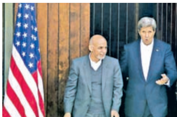
US Secretary of State John Kerry (R) and Afghanistan President Ashraf Ghani approach reporters before their diplomatic meetings at Camp David, Maryland on 23 March, 2015.

delivered an address to US soldiers and military families at the Pentagon and sought to reassure Americans of the value of their sacrifice in lives lost and money spent in the battle against al-Qaeda and other extremists in more than 13 years of war in Afghanistan.