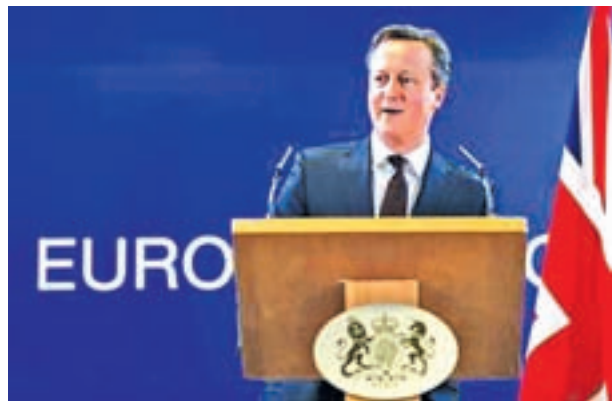
Britain's Prime Minister David Cameron addresses a news conference during a European Union leaders summit in Brussels on 20 March, 2015.

Cameron, 48, said possible successors included Theresa May, the interior minister, London mayor Boris Johnson, and finance