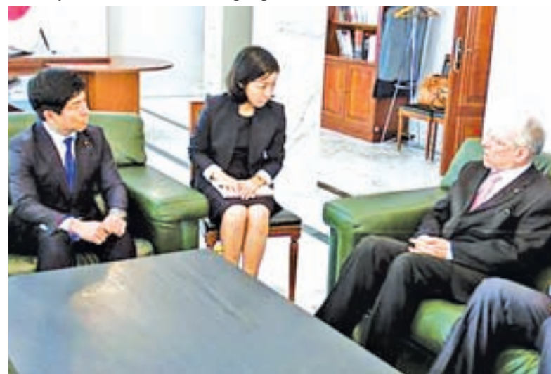
Japanese Parliamentary Vice Foreign Minister Kazuyuki Nakane (L) talks with Tunisian Foreign Minister Taieb Baccouche (R) at the Japanese Embassy in Tunis on 23 March, 2015.