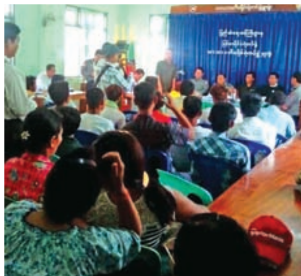
Officials meet with detainees before releasing them at Thayawady District Police Force Office.

NAY PYI TAW, 24 March—Authorities released 19 men and one woman Tuesday who were detained during a crackdown on student protestors earlier this month in Bago Region's Letpadan, 90 miles north of Yangon. They were turned over to their parents and relatives this morning, according to the Ministry of Home Affairs. The authorities have so far released 28 students and two reporters arrested in the crackdown after determining their roles in the protests.