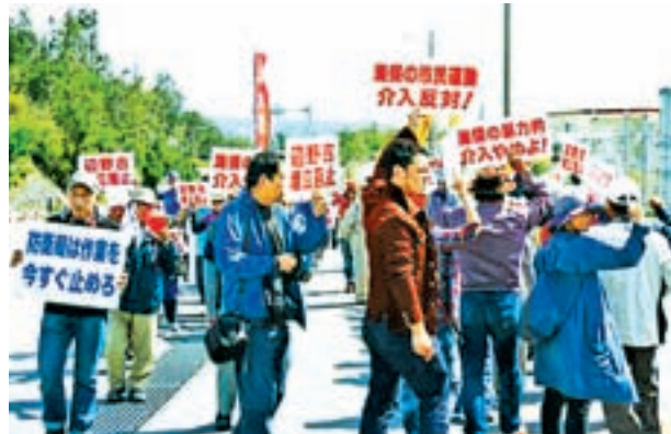
People stage a rally on 24 March, 2015, in front of the gate of the US Marine Corps' Camp Schwab in Nago, Okinawa Prefecture, against the Japanese government's continued preparations for relocating a US military base in the prefecture, effectively ignoring instructions to stop the work ordered by the local governor the previous day.

NAHA, (Japan) 24 March — The government on Tuesday continued preparations for relocating a US military base in Okinawa Prefecture, effectively ignoring instructions by the local governor to stop the work and deepening their rift over a land reclamation project.