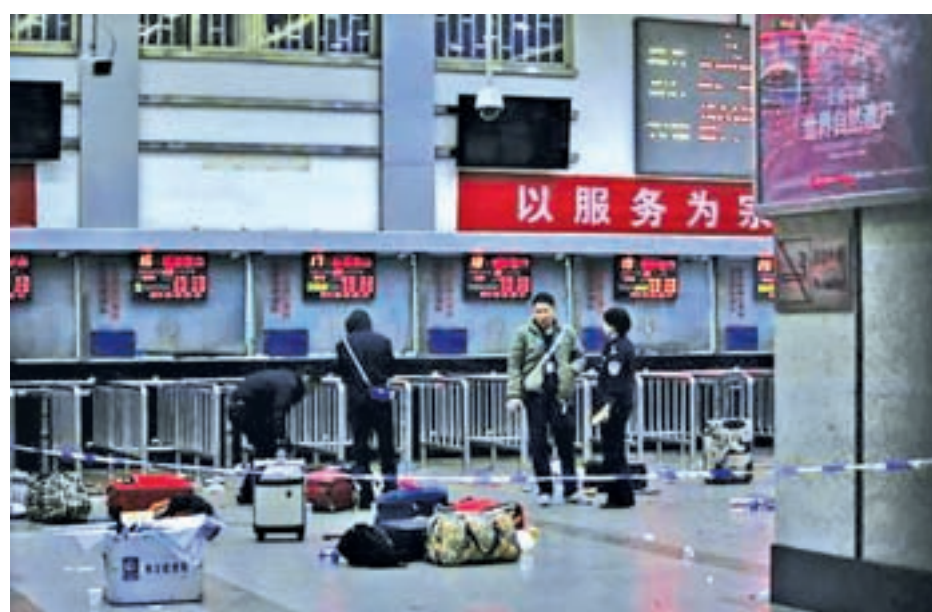
Police stand near luggage left at the ticket office after a group of armed men attacked people at Kunming railway station, Yunnan Province on 2 March, 2014.

Rights groups have expressed concern about executions and mass-sentencings carried out regularly since an upswing in violence blamed on Xinjiang militants took place last year.