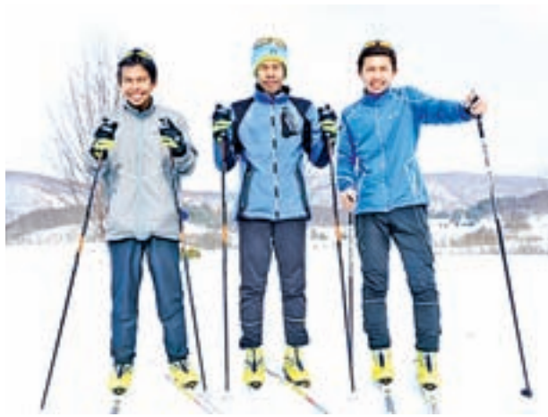
Three young Thais pose during cross-country skiing practice in Higashikawa on Japan's northernmost main island of Hokkaido on 5 March, 2015. The town office has launched a training programme for cross-country skiers from snowless countries to enhance its name recognition overseas.

While cross-country skiers of Japan's national team engage in intensive training in the town, a large number of residents enjoy the sport. The town, which has accepted many foreign students wishing to learn the Japanese language, launched the cross-country skiing programme to promote the sport in snow-free nations, hoping that it can increase its name recognition if skiers from such countries compete in Olympics. The three Thais had never skied before coming to the town. They were chosen for the programme by the Thai government because of their athletic ability and willingness to learn cross-country skiing. The town office has set up a team of five coaches including Yoshiyuki Yanbe, a 66-year-old former national coach, for them. For now, the