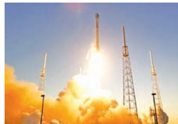
The unmanned Falcon 9 rocket, launched by SpaceX and carrying NOAA's Deep Space Climate Observatory Satellite, lifts off from launch pad 40 the Cape Canaveral Air Force Station in Cape Canaveral, Florida on 11 Feb, 2015.

James praised the review team's diligent and prompt work and said she