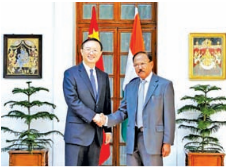
China's State Councilor Yang Jiechi (L) and India's National Security Advisor Ajit Doval shake hands during a photo opportunity before their meeting in New Delhi on 23 March, 2015.

China's foreign ministry said in a statement released on Monday both countries would build on the results of previous negotiations and push forward in "the correct direction".