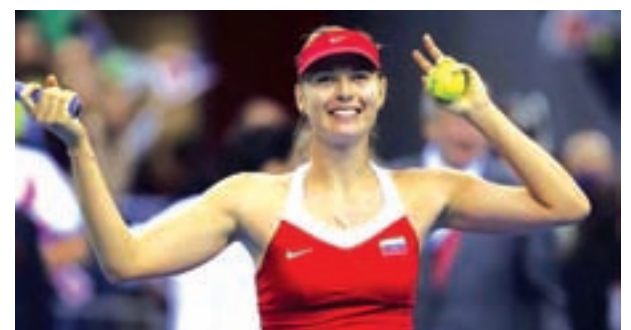
Maria Sharapova of Russia celebrates a point against Agnieszka Radwanska of Poland during their Fed Cup World Group quarterfinal tennis match between Poland and Russia at Tauron arena in Krakow on 8 Feb, 2015.

LONDON, 24 March — Maria Sharapova's life-changing move from Siberia to Florida as a seven-year-old propelled her on a path to fame and fortune but she says she would never turn her back on her mother country. It is sometimes easy to forget that five-times grand slam champion Sharapova, the world's highest-paid female athlete, is actually Russian until you witness her conduct a post-match Press conference in her native tongue.