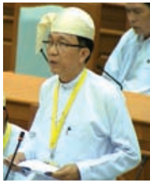
Union Minister for Finance U Win Shein.

The Pyidaungsu Hluttaw finalized decisions on a legal translation bill and a Myanmar Medical Council