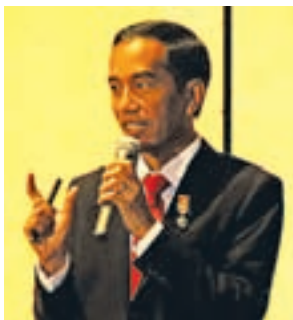
Indonesian President Joko "Jokowi" Widodo makes a speech at a business forum in Tokyo on 24 March, 2015, during his first visit to Japan since becoming president in October 2014.

Since taking office last October, Jokowi has focused primarily on strengthening Indonesia's maritime security and transforming