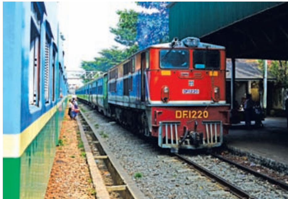
More than 100,000 people (about three per cent of more than six million population of Yangon) rely on the circular trains for their daily transportation needs.