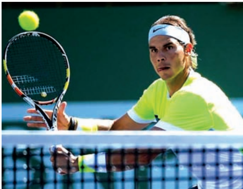
Rafael Nadal (ESP) during his quarter final match against Milos Raonic (CAN) in the BNP Paribas Open at the Indian Wells Tennis Garden in India Wells, CA, on 20 March, 2015. Raonic won 4-6, 7-6, 7-5.

LONDON, 24 March — Rafa Nadal will return to his old routine in a bid to recapture the Wimbledon crown later this year, confirming he has entered the traditional warm-up event at Queen's Club.