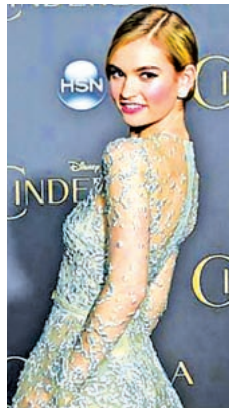
Lily James said she identified well with Cinderella.

The actress, whose father was also an actor, added she was sad that he had not lived to see her success.