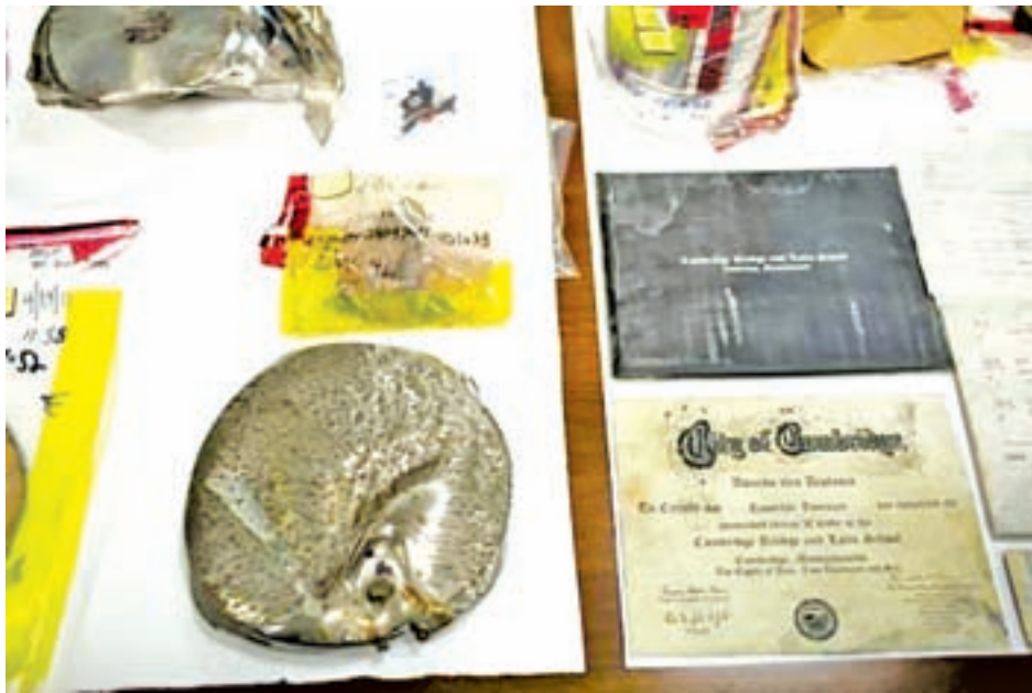
Evidence from the Boston Marathon bombing trial, including a pressure-cooker bomb recovered from the Watertown crime scene and a diploma for Tamerlan Tsarnaev, is seen at the Moakley Federal Courthouse in Boston, Massachusetts on 19 March, 2015.

BOSTON, 24 March — Boston Marathon bombing suspect Dzhokhar Tsarnaev was heavily influenced by al-Qaeda literature and lectures, some of which was found on his laptop, a counterterrorism expert testified at his trial on Monday.