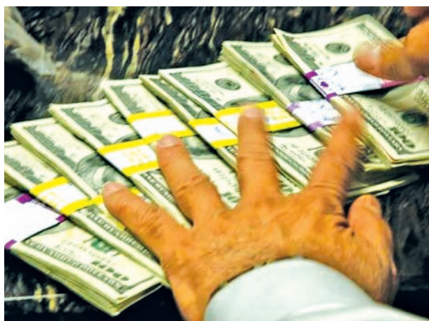
US dollars are counted out by a banker at a bank in Westminster, Colorado on 3 Nov, 2009.

Following behind it was the Deutsche X-trackers MSCI EAFE Hedged Equity (DBEF.P), with $2.7 billion in new assets.