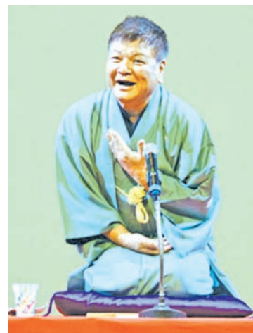
Japanese “rakugo” comic storyteller Katsura Takemaru performs in the Thai language, as seen in this file photo taken on 4 Sept, 2014, hoping to contribute to cultural exchanges between Japan and Thailand.