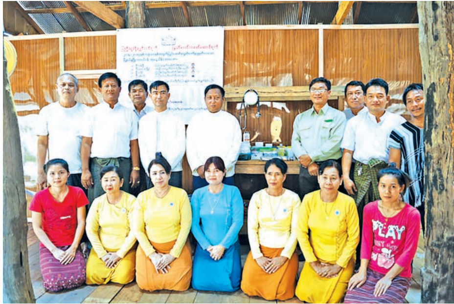
people from Baledo and its surrounding villages.

The dispensary, 50 feet long and 30 feet wide, will give health care services to