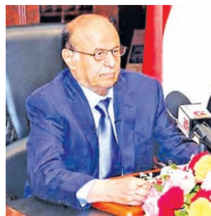
Yemen’s President Abd-Rabbu Mansour Hadi delivers a speech in the southern port city of Aden on 21 March, 2015.

ADEN / WASHINGTON, 22 March — Yemeni President Abd-Rabbu Mansour Hadi accused the Iranian-allied Houthi militia on Saturday of staging a coup against him and appealed to the United Nations for “urgent intervention”, even as the United States evacuated its remaining forces.