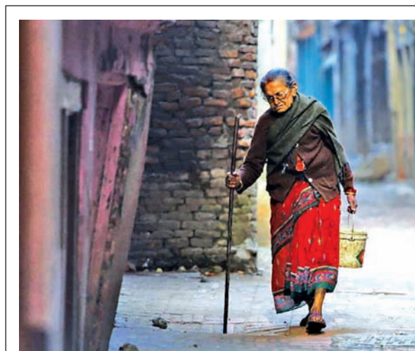
An elderly woman returns with a bucket of water from a tap nearby on the World Water Day in Kathmandu, Nepal, on 22 March, 2015. World Water Day is observed annually to bring the awareness globally to save, conserve and manage water resources for future generations.