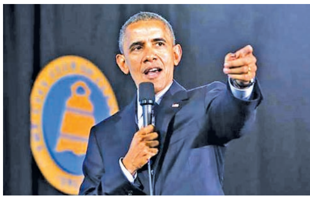
US President Barack Obama speaks to the City Club of Cleveland about middle class economics in Ohio on 18 March, 2015.

that we continue to believe that a two-state solution is the only way for the long-term security of Israel, if it wants to stay both a Jewish state and democratic," Obama said, in his first public comments on the issue.