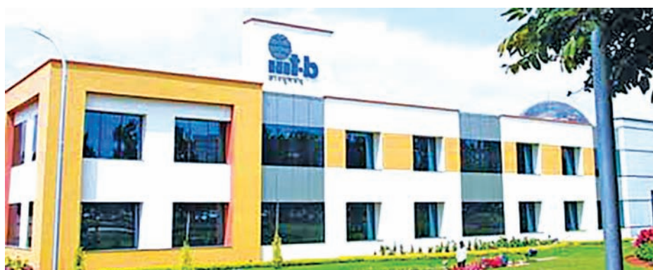
Photo shows International Institute of Information Technology, Bangalore (IIIT-B), India.

Indian investments in Myanmar for capacity building have scaled up to the tune of US$250 million. GNLM