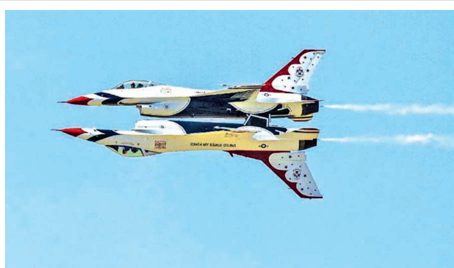
Planes of the US Air Force Thunderbirds perform during the Los Angeles County Air Show at William J Fox Airport in Lancaster, California, the US, on 21 March, 2015.