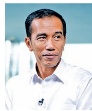
Indonesian President Joko "Jokowi"

Jokowi is also likely to seek Japan's aid in upgrading Indonesia's port infrastructure and enhancing