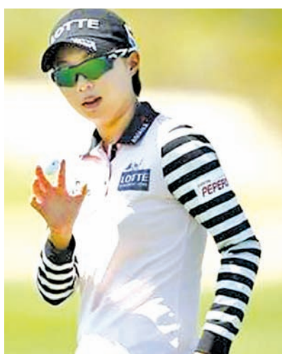
Hyo Joo Kim makes birdie at the 5 th hole during round two action of the JTBC Founders Cup at Wildfire Golf Club at JW Marriott Phoenix Desert Ridge Resort & Spa, Phoenix, AZ, USA on 20 March, 2015.

hole but stormed back immediately with a hat-trick of birdies.