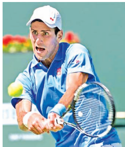
Novak Djokovic (SRB) during his semi final match against Andy Murray (GBR) during the BNP Paribas Open at the Indian Wells Tennis Garden, Indian Wells, CA, USA on 21 March, 2015.

Djokovic, who has won three times in Indian Wells, looked sharp right from the outset while Murray made just two first serves in six points in his opening service game. Murray made a series of unforced errors, and having fallen a set behind, he struggled to find a way to turn the momentum in his direction. In a tight first set, Federer broke to go 6-5