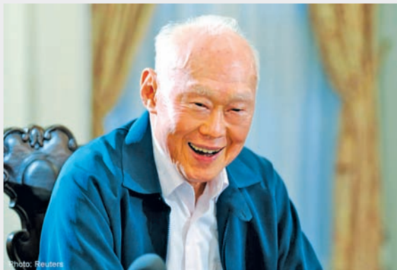
Singapore's former Prime Minister Lee Kuan Yew

SINGAPORE, 22 March — Singapore's ailing former Prime Minister Lee Kuan Yew's condition continues to weaken, the government said on Sunday.