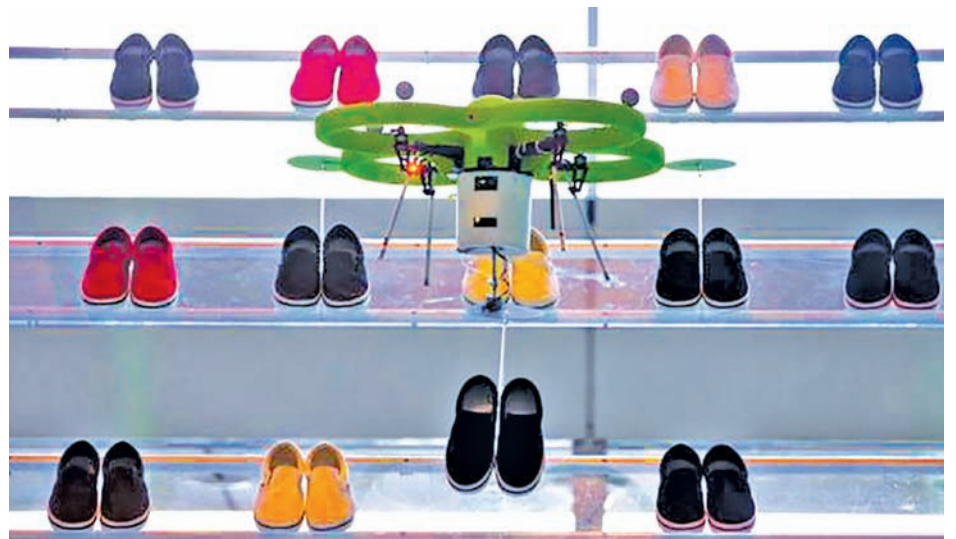
A drone picks up a pair of shoes during a presentation by the Crocs footwear company in Tokyo on 4 March, 2015.— REUTERS

In February, the FAA proposed rules that would lift the current ban on most commercial drone use. But industry representatives say it could be years before the ban is lifted, leaving businesses to follow the cumbersome exemption process for now.— Reuters