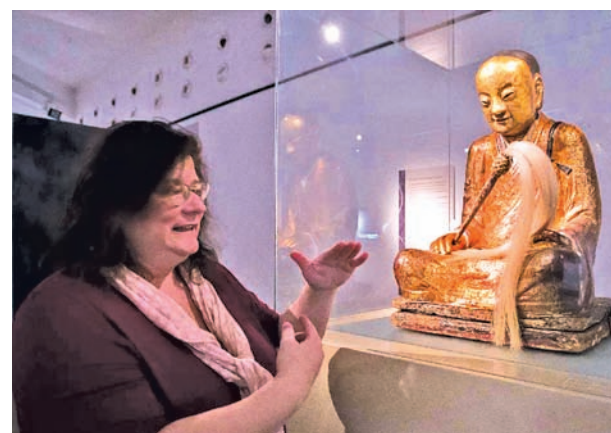
A Chinese Buddha statue with the mummified body of a Buddhist monk inside is on display at the Hungarian Natural History Museum in Budapest, Hungary on 3 March, 2015. According to the Chinese characters written on the pillow of the statue, the body inside the statue belonged to Chinese Buddhist monk Zhang Liuquan who lived around AD 1100.