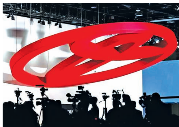
Members of the media are shown under a large Toyota logo during the first press preview day of the North American International Auto Show in Detroit, Michigan, on 12 Jan, 2015.