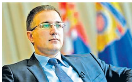
Serbian Minister of Interior Affairs Nebojsa Stefanovic

VIENNA, 22 March — Serbian Minister of Interior Affairs Nebojsa Stefanovic noted that the number of cit-