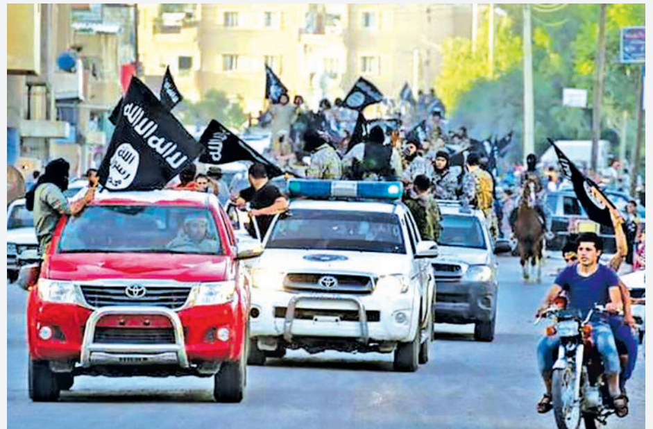
Militant Islamist fighters waving flags, travel in vehicles as they take part in a military parade along the streets of Syria’s northern Raqqa Province on 30 June, 2014.

The posting, addressed to disbelievers, Christians and “crusaders” in America, included what the group said were the names, military service branch, photos and street addresses of the individuals. The posting includes the military rank of some but not all of those named.—Reuters