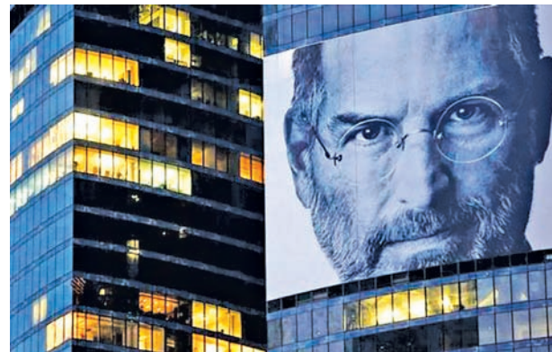
A portrait of Apple co-founder and former CEO Steve Jobs is placed on the Federation Tower skyscraper in Moscow’s new business district on 19 Oct, 2011.

The $7 billion deal to buy Pixar made Jobs Disney’s largest shareholder and put him on the enter-