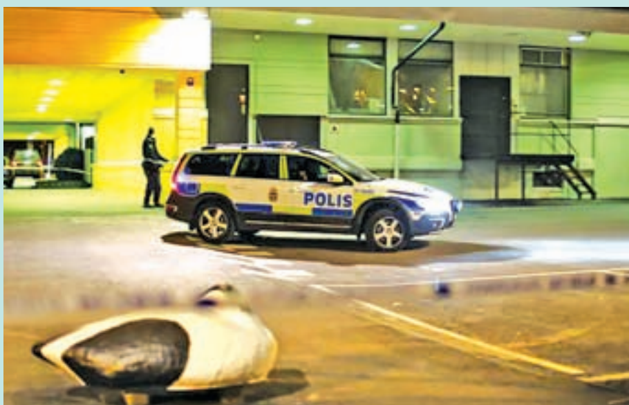
A police officer stands at the scene of a fatal shooting in Gothenburg on 18 March, 2015.

STOCKHOLM, 19 March — Several people were killed in a restaurant shooting in the Swed-