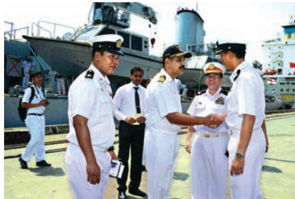
An Indian Navy hydrographic survey ship docks at Myanmar International Terminals Thilawa.