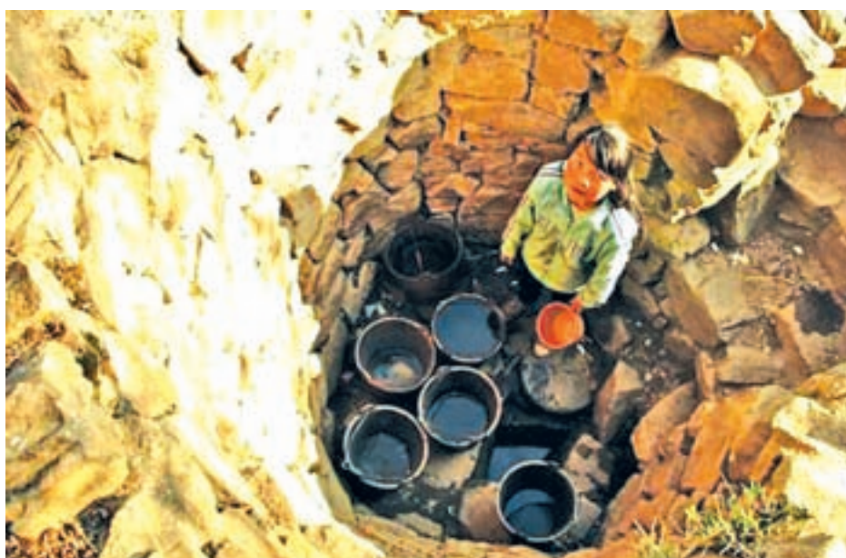
A girl looks up as she stands at a dried well in a village of Weining county, Guizhou Province, on 16 March, 2013. More than one million people in Guizhou and Gansu provinces are facing a drinking water shortage due to two lingering droughts, according to Xinhua News Agency.

Whether humans can adapt to declining water supplies depends on what new technologies for finding water are developed,