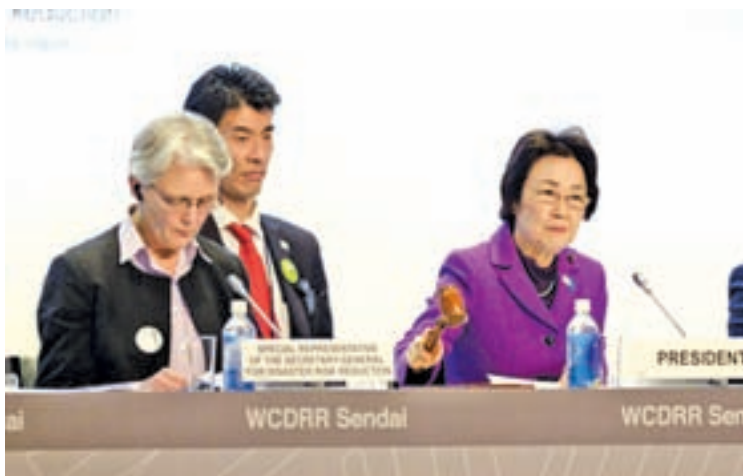
Japan's minister for disaster management Eriko Yamatani (R) marks the adoption a framework to mitigate the risks and damage of disasters on 18 March, 2015, at the UN World Conference on Disaster Risk Reduction in the northeastern Japan city of Sendai. At left is Margareta Wahlstrom, the UN secretary general's special representative for disaster risk reduction.

SENDAI, 19 March — A UN conference that wrapped up early Thursday in Sendai was the highest-level world meeting on disaster risk reduction held so far, but the resulting set of seven goals to combat disasters are far from ambitious, critics say.