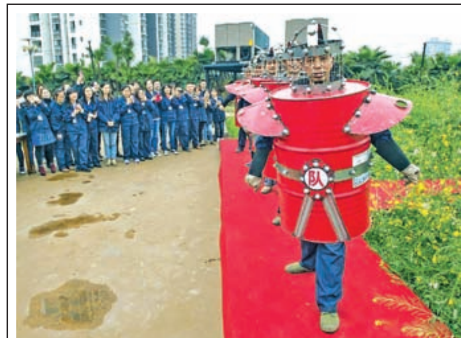
Employees present garments made of waste metal buckets during a garment show held by a company in Chongqing, southwest China on 19 March, 2015. More than 1,000 employees took part in the show and displayed the creative garments made of waste materials.—XINHUA