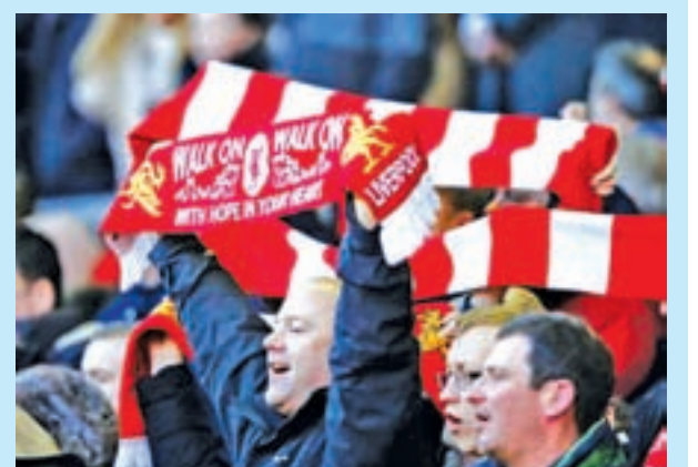
Liverpool fans during FA Cup Quarter Final at Anfield on 8 March, 2015.

at his former club Swansea City on Monday in which they kept a sixth successive clean sheet away.