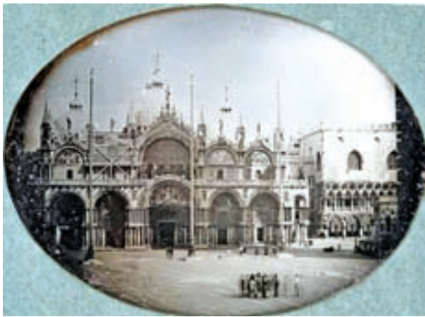
Saint Mark's Basilica and the Piazza in Venice are seen in this handout photograph of a daguerreotype circa 1845, released in London on 18 March, 2015.

"The discovery of 188 previously unknown John Ruskin daguerreotypes has been the most exciting of our career," photograph-