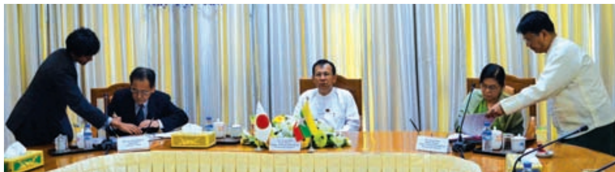
Union Minister for National Planning and Economic Development Dr Kan Zaw witnesses signing of funding agreement between Myanmar and Japan.—MNA

NAY PYI TAW, 19 March — Japan on Thursday agreed to provide some 6.38 billion yen (K 54.68 billion) for a port modernization project and the upgrading of water systems in Yangon and Mandalay.