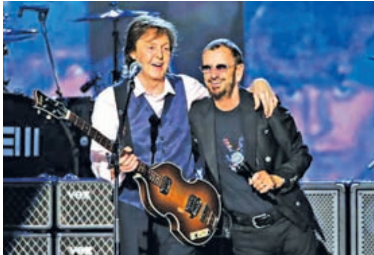
Paul McCartney (L) and Ringo Starr perform during the taping of "The Night That Changed America: A GRAMMY Salute To The Beatles", which commemorates the 50 th anniversary of The Beatles appearance on the Ed Sullivan Show, in Los Angeles in this 27 Jan, 2014 file photo.

Other 2015 inductees include rockers Joan Jett & the Blackhearts, who sang the rock classic "I Love Rock 'n Roll," rhythm and blues band the "5"