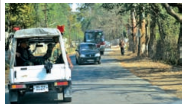
Vehicles travel on a road in Shillong, Meghalaya in India, where traffic drives on the left.

tended by the union minister, the chief minister, Commander of Central Command Maj-Gen Soe Htut, the deputy minister, members of region government, the ambassador and the officials.—MNA