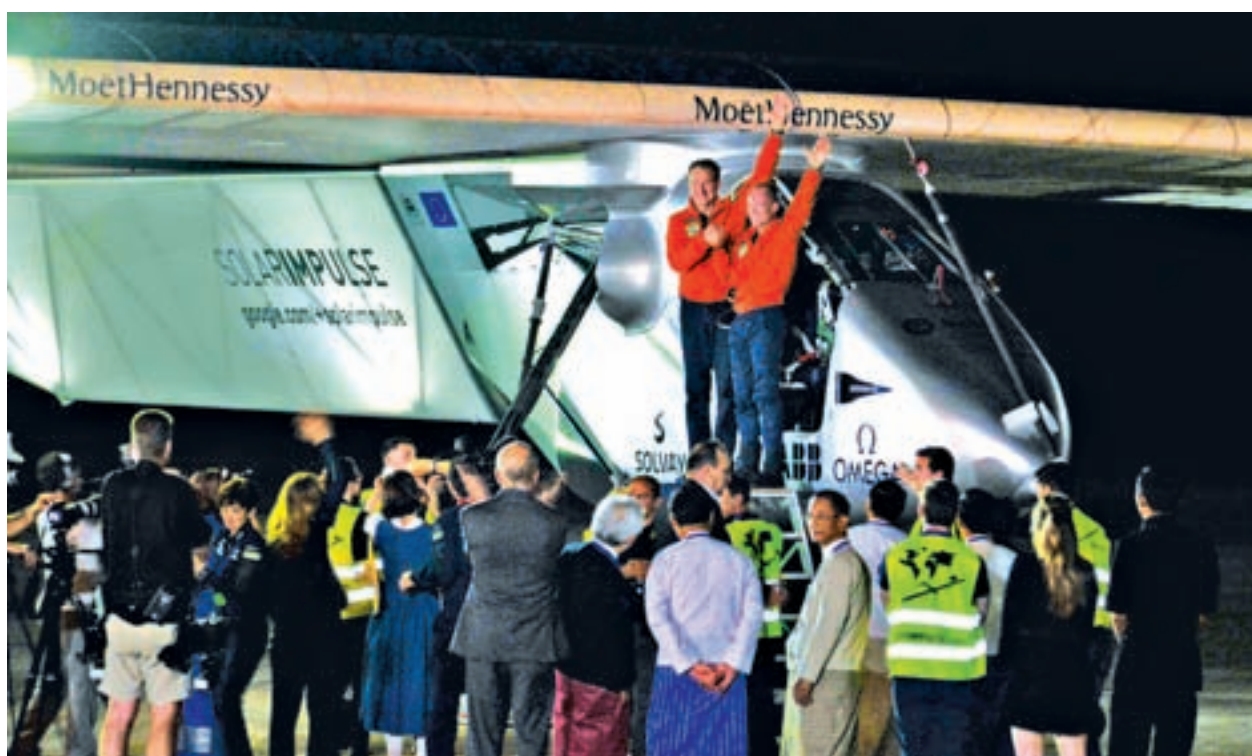
Solar Impulse-2 pilots wave at the welcoming party.—MNA

MANDALAY, 19 March — After flying 15 hours from Varanasi in India, Solar Impulse-2 arrived in Mandalay, cultural capital of Myanmar, at 8:30 pm on Thursday.