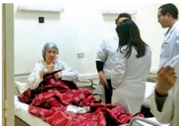
A woman (L), believed to be a Japanese national, receives treatment at a hospital in Tunis on 18 March, 2015, after gunmen stormed a museum in the Tunisian capital. Nineteen people — 17 foreign tourists and two Tunisians — were killed in the attack.

Essid said a manhunt was under way for two or