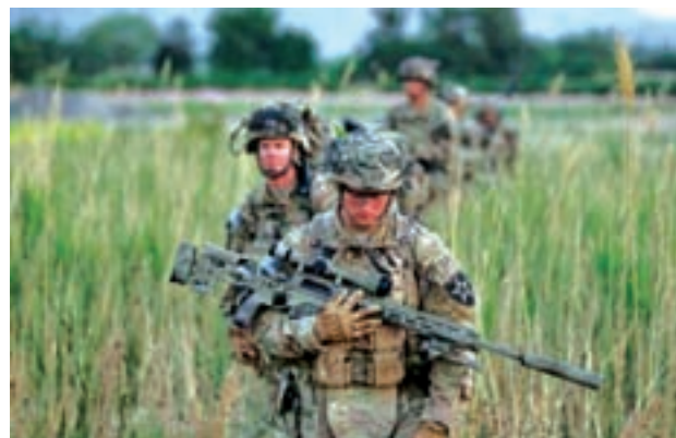
US soldiers from 5-20 infantry Regiment attached to 82nd Airborne walk while on patrol in Zharay District in Kandahar Province, southern Afghanistan on 24 April, 2012.