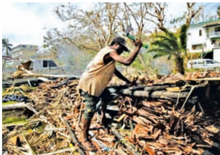
A worker chops up fallen trees next to a destroyed boat at a resident's compound days after Cyclone Pam in Port Vila, capital city of the Pacific island nation of Vanuatu on 19 March, 2015.

Aid workers and residents described how people buried food and fresh water as one of the strongest storms on record bore down on them, fleeing to churches, schools and even coconut drying kilns as winds and massive seas ripped their flimsy houses to the ground.