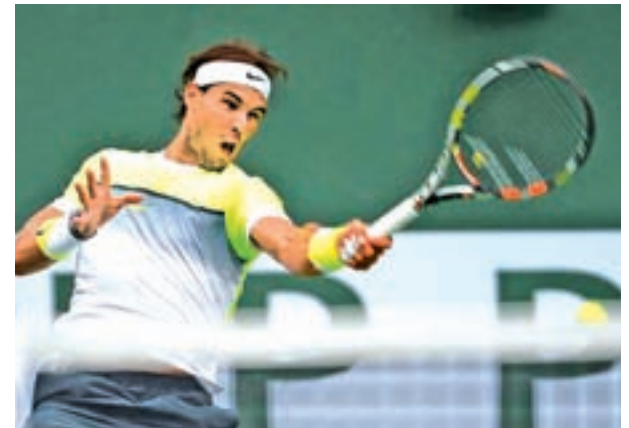
Rafael Nadal (ESP) during his match against Gilles Simon (FRA) in the BNP Paribas open at the Indian Wells Tennis Garden, Indian Wells, CA, USA on 18 March, 2015. Nadal won 6-2, 6-4.

INDIAN WELLS, (California), 19 March — Roger Federer and Rafa Nadal advanced to the quarter-finals of the BNP Paribas Open on Wednesday, joining Britain’s Andy Murray in the last eight, though Japan’s Kei Nishikori crashed out.