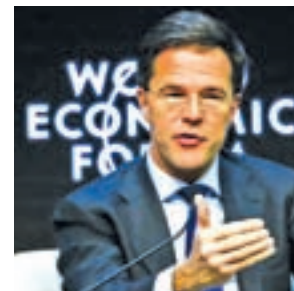
Netherlands' Prime Minister Mark Rutte

AMSTERDAM, 19 March — Leaders of the Dutch ruling coalition pledged to remain in government on Thursday despite losing provincial elections that will leave them scrambling to command a majority in the country’s Senate.