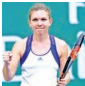
Simona Halep (ROU) reacts after winning her quarterfinal match against Carla Suarez Navarro (ESP) in the BNP Paribas Open at the Indian Wells Tennis Garden. Halep won 5-7, 6-1, 6-1 on 18 March, 2015.

The Romanian overcame a blistering start by 12 th seed Suarez Navarro at Indian Wells to move a step closer to what would be her