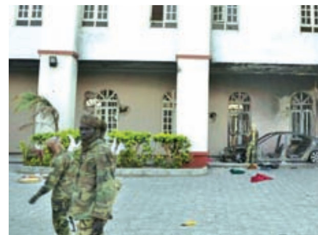
Chadian soldiers walk in front of a building that Boko Haram insurgents used as their base before being driven out by the Chadian military in Dikwa on 2 March, 2015.

“Single-handedly, no country can overcome this threat and therefore through pooling our resources together ...we are going to overcome this challenge,” Deby told reporters.— Reuters