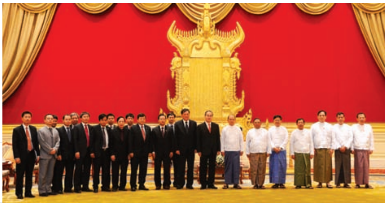
President U Thein Sein poses for documentary photo together with Vietnamese delegation led by Vietnam Communist Party Politburo member and Chairman of the Vietnam Fatherland Front Mr Nguyen Thien Nhan.

Also in attendance were Union Ministers U Wunna Maung Lwin, U Soe Thane, U Myint Hlaing, U Zeya Aung, Dr Kan Zaw, U Ye Htut and officials. The Vietnamese ambassador accompanied the Vietnamese delegation.