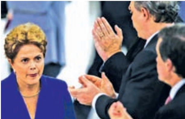
Brazil's President Dilma Rousseff attends the launching ceremony for the Anti-Corruption Package at the Planalto Palace in Brasilia on 18 March, 2015.