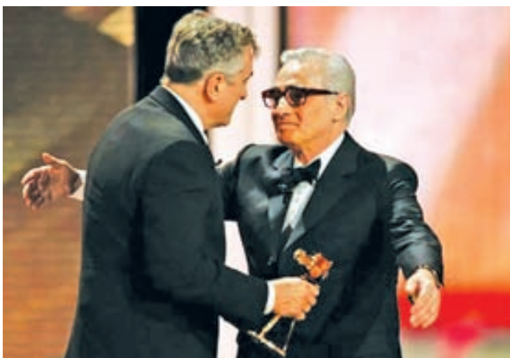
Robert De Niro (L) receives the 'Goldene Kamera' lifetime achievement award from director Martin Scorsese given by a popular German television magazine in Berlin on 6 Feb, 2008.

Nearly 100 feature-length films from 31 countries will be screened during the 14 th Tribeca Film Festival. The world premiere of "Live from New York!" about the NBC late-night comedy sketch show "Saturday Night Live," will open the festival on 15 April.