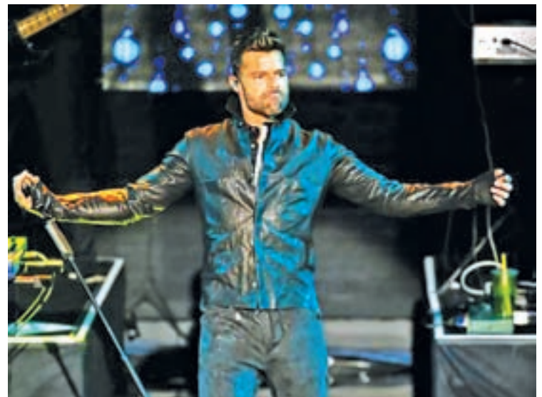
Singer Ricky Martin performs at the iHeartRadio Theater Los Angeles in Burbank, California on 10 Feb, 2015.

LOS ANGELES, 19 March — Thirty years after Ricky Martin got his start in music in the Puerto Rican kids' group "Menudo," the Grammy-winning singer uses his music and celebrity to help fight against the trafficking of children.