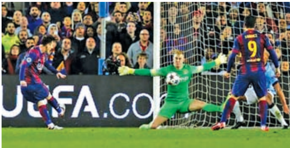
Manchester City’s Joe Hart saves from Barcelona’s Lionel Messi during their UEFA Champions League Second Round Second Leg at The Nou Camp, Barcelona, Spain on 18 March, 2015.

LONDON, 19 March — Manchester City were knocked out of the Champions League by Barcelona on Wednesday to leave the English Premier League without a representative in the last eight of Europe’s elite club competition for the second time in three years.