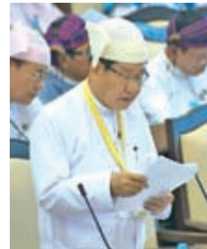
Deputy Minister U Khin Zaw.

An MP proposed compensation for farmlands destroyed by seawater in some parts of Rakhine State, with the Ministry of Agriculture and Irrigation saying farmland management committees will examine the damage in the