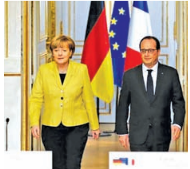
German Chancellor Angela Merkel (L) and French President Francois Hollande arrive to attend a joint news conference after talks at the Elysee Palace in Paris on 20 Feb, 2015.

More hawkish member states wanted an agreement to extend those sanctions now, while other governments wanted to wait until a June summit to give the Minsk accord a chance to work. Linking sanctions to full implementation of Minsk would effectively mean extending them at least until the end of the