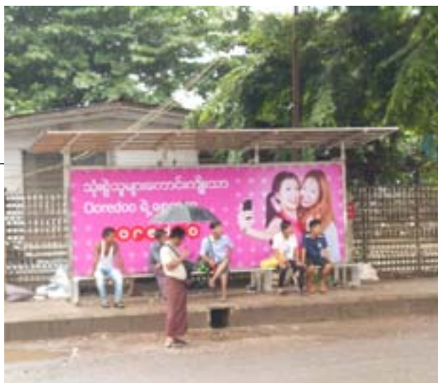
Ooredoo billboard seen hanging at a bus stop in downtown Yangon.

YANGON, 19 March — Mobile phone antennas in Myanmar pose no health risk to the community, while all of the country's network providers are operating