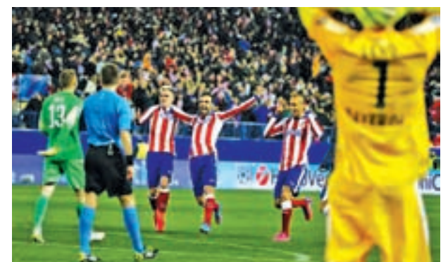
Atletico Madrid's goalkeeper Jan Oblak (L) celebrates with teammates after beating Bayer Leverkusen in their Champions League round of 16 second leg soccer match at the Vicente Calderon stadium in Madrid on 17 March, 2015.

Roared on by the home support, Diego Simeone's men came storming out of the blocks but Leverkusen refused to be intimidated and Suarez's deflected effort that went in off defender Omer Toprak was their first shot. It was more of the same in the second half with a fired-up Atletico pressing forward without really threatening and a well-organised Leverkusen looking to hit back on the counter attack. Atletico playmaker Arda Turan fired over with a volley on the run in the 69th minute after good work down the left from Antoine Griezmann and a Koke free kick evaded everyone and almost sneaked inside the post a minute later. The players clearly tired and chances were scarce in extra time. Atletico midfielder Raul Garcia had the clearest in the 106th minute when he blasted an angled shot straight at keeper Bernd Leno while Leverkusen captain Simon Rolfes lashed a long-range effort just wide in the 111th.—Reuters