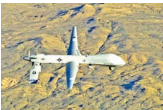
A US Air Force MQ-1 Predator unmanned aerial vehicle

WASHINGTON, 18 March — The United States lost one of its Predator drone