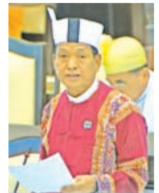
U Paw Hlan Lwin of Chin State Constituency-9.—MNA

Replying to a query from Upper House MP U Soe Aung about the plan to build a new road outside Meikhtila Township to link Myingyan and Mandalay, Union Minister U Kyaw Lwin said the Ministry of Construction will conduct a feasibility study with Mandalay region government to upgrade the 4-mile-long earth road.