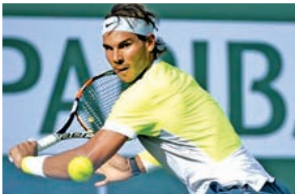
Rafael Nadal (ESP) returns the ball during his match against Donald Young (USA) in the BNP Paribas Open at the Indian Wells Tennis Garden on 17 March, 2015.

Ninth seeded Czech Tomas Berdych had earlier kicked off another sunny day of action with a straight-forward 6-4, 6-2