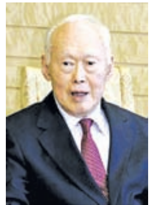
Ex-leader Lee Kuan Yew

He was Singapore's prime minister from 1959