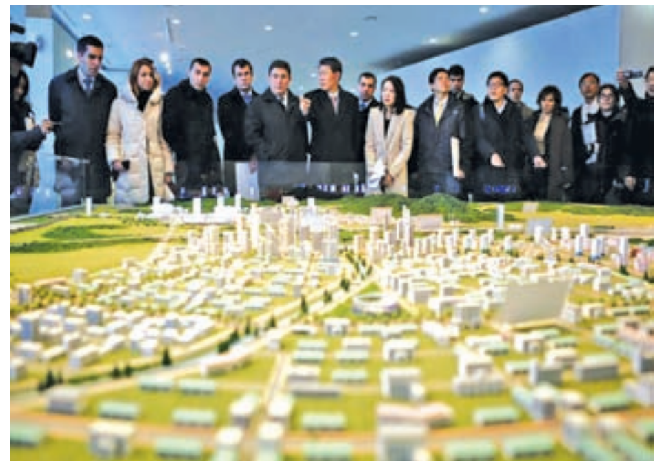
Officials from the G20 Seoul Conference look at miniature models of the Kaesong Industrial Complex (KIC) at the Kaesong Industrial District Management Committee office, a few miles inside North Korea in this 19 Dec, 2013 file photo.

South Korea has 125 companies in the zone, most of them small- and medium-sized firms, employing 53,000 relatively