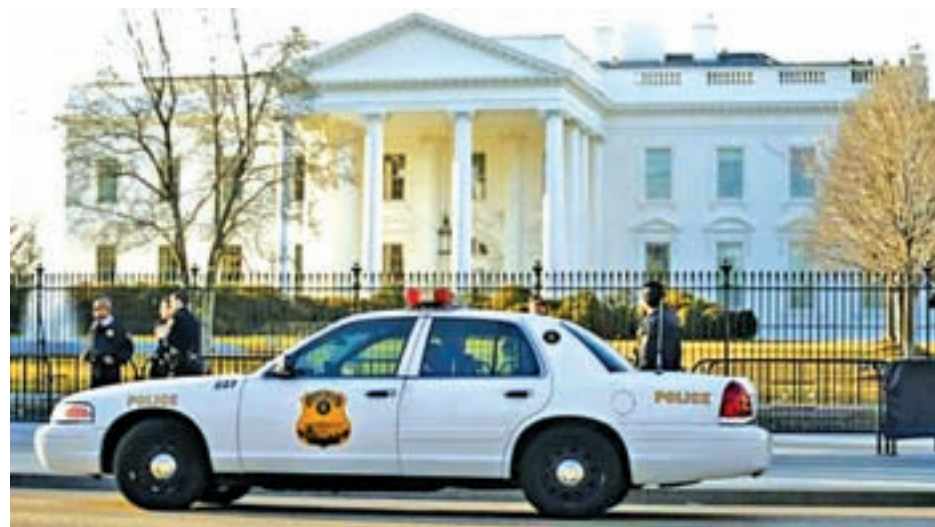
Members of the US Secret Service keep watch at the fence surrounding the White House in Washington on 12 March, 2015.

WASHINGTON, 18 March — An envelope mailed to the White House tested "presumptive posi-