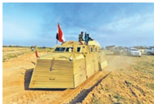
Shi'ite fighters ride an armoured vehicle in the town of al-Alam on 9 March, 2015.