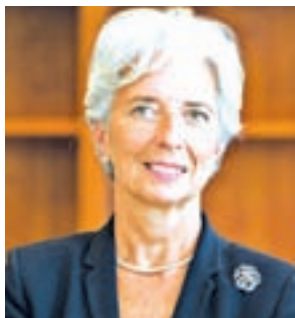
International Monetary Fund Managing Director Christine Lagarde

MUMBAI, 18 March — International Monetary Fund Managing Director Christine Lagarde met with Reserve Bank of India Governor Raghuram Rajan on Tuesday and said she felt positive about India's