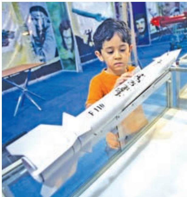
A boy looks at a model of an Iranian third-generation Fateh-110 (Conqueror) surface-to-surface missile while visiting a war exhibition held by Iran's Basij militia and revolutionary guard to mark the anniversary of the Iran-Iraq war (1980-88), also known in Iran as the "Holy Defence", at a Revolutionary Guards military base in south-eastern Teheran on 23 Sept, 2010.

Analysts say the long and porous border with Somalia has made the north-eastern region a soft target for al Shabaab, who often retreat into Somalia after raids.—Reuters