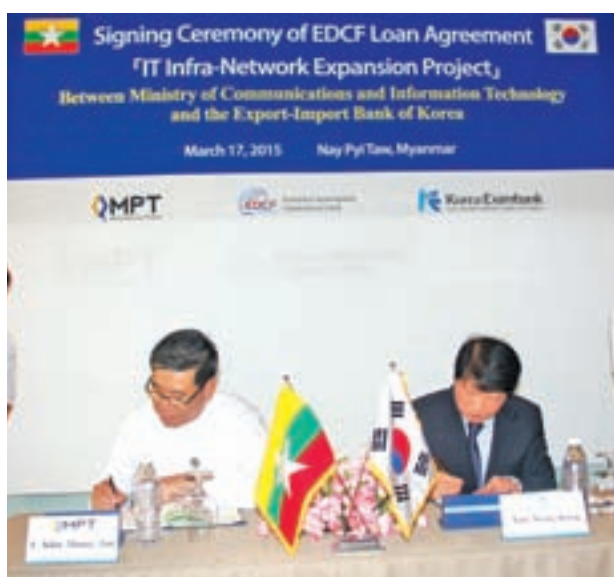
Ministry of Communication and Information Technology and the Export-Import Bank of Korea sign for IT project.—MNA