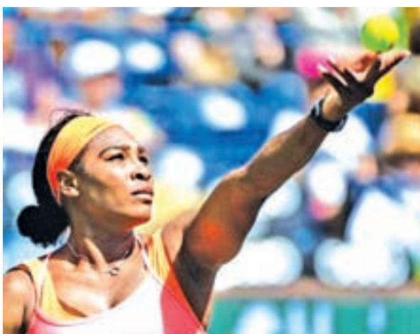
Serena Williams (USA) during her match against Sloane Stephens (USA) in the BNP Paribas Open at the Indian Wells Tennis Garden, on 17 March, 2015.

INDIAN WELLS, (California) 18 March — Maria Sharapova fell victim to an emotional Flavia Pennetta, who burst into tears before regaining her composure to stun the second seed 3-6, 6-3, 6-2 at the BNP Paribas Open on Tuesday.