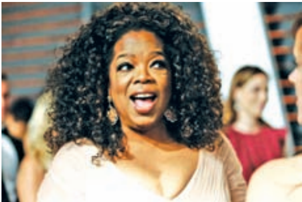
Oprah Winfrey arrives at the 2015 Vanity Fair Oscar Party in Beverly Hills, California on 22 Feb, 2015.