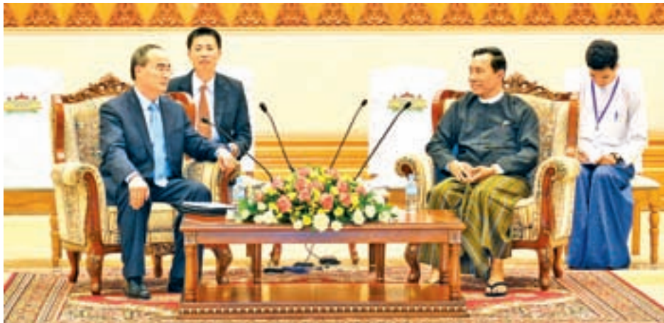
Speaker of Pyithu Hluttaw Thura U Shwe Mann receives Mr Nguyen Thien Nhan.

NAY PYI TAW, 18 March — Speaker of the Pyithu Hluttaw Thura U Shwe Mann received Vietnam Communist Party Politburo member and also the Chairman of Vietnam Fatherland Front Mr Nguyen Thien Nhan on Wednesday in the Hluttaw complex. Together with the speaker were Py-