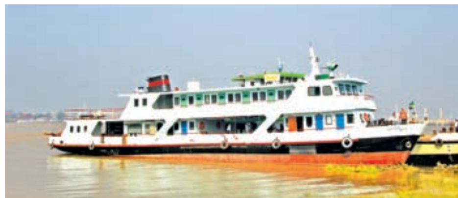
Aungdagon-7 double-decker ferry boat will ply in Rakhine State.

NAY PYI TAW, 18 March — Ministry of Transport is making arrangement to operate a new ferry boat from Sittway, capital city of Rakhine state, to nearby areas.