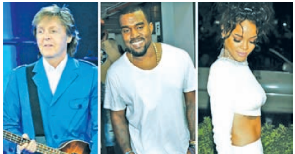
Heather Mills slammed Paul McCartney for working with Kanye, Rihanna.

West, 37, on “Only One” and “All Day” that will be featured on the rapper’s own full-length “So Help Me God”.