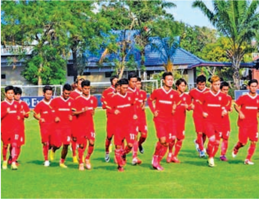
Myanmar U-22 team players participate in a team training session.

YANGON, 18 March — The Myanmar U-22 team, currently in training for the AFC U-23 Championship, and the Myanmar U-20 team, preparing for the U-20 World Cup, will play matches against the Malaysia U-22 team in Thuwunna Stadium in Yangon.