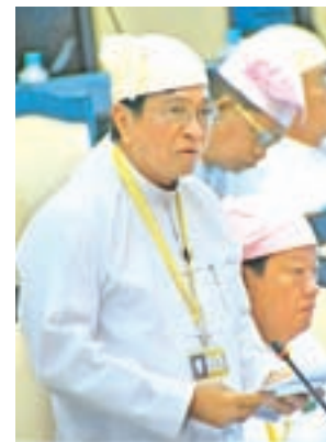
Union Minister U Kyaw Lwin.

NAY PYI TAW, 18 March — The Amyotha Hluttaw convened its 29th day meeting of the 12th regular session on Wednesday, with discussion of road construction in Mandalay region and promotion of tourism through improved transportation in Chin State.