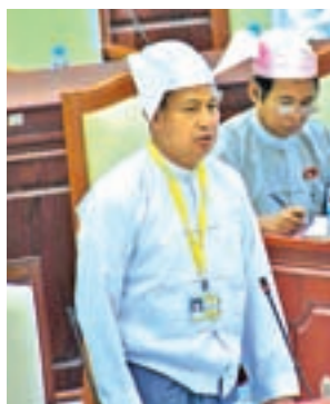
Union Minister U Ye Htut.—MNA

Responding to the query of Lower House MP U Thein Nyunt, Union Minister for Information U Ye Htut also said relevant min-