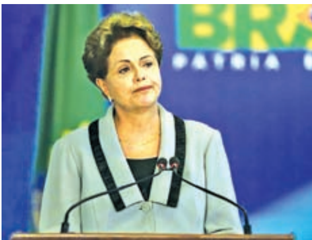
Brazil's President Dilma Rousseff reacts during the signing ceremony of the Civil Procedure Code, at the Planalto Palace in Brasilia on 16 March, 2015.