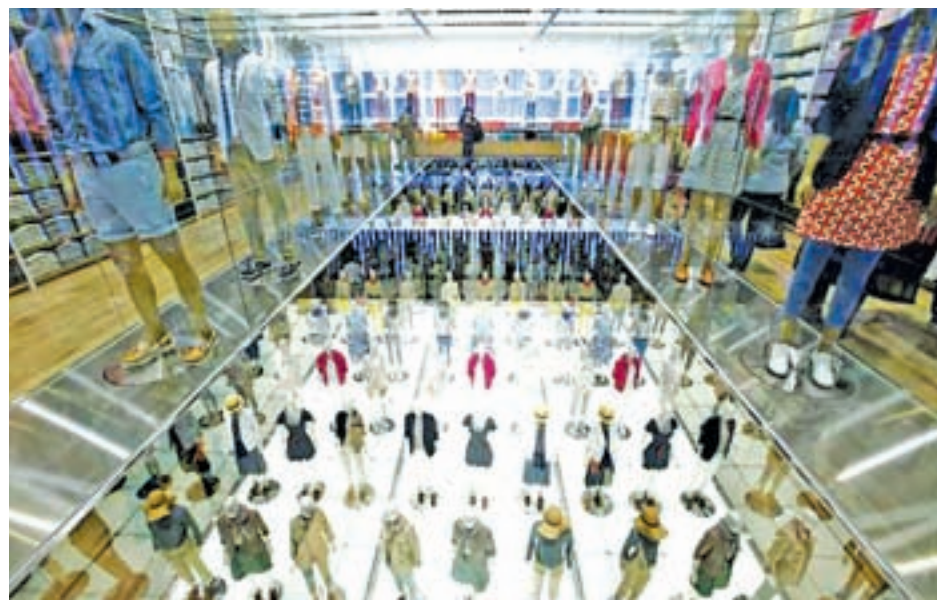
Mannequins are displayed at Fast Retailing's new flagship Uniqlo store at Tokyo's Ginza district in this 16 March, 2012 file photo.