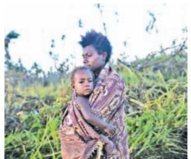
A woman carrying her baby walks past fallen trees in Tanna on 18 March, 2015.

Aid agencies have begun trying to access the country's small outer islands, but flooding has stopped their planes from