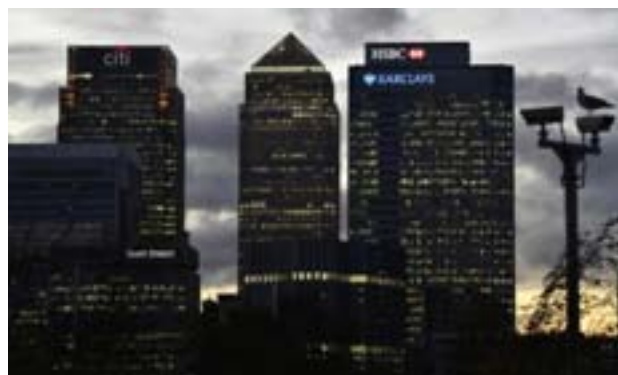
The Canary Wharf financial district is seen at dusk in east London in this file photo taken on 7 Nov, 2014.