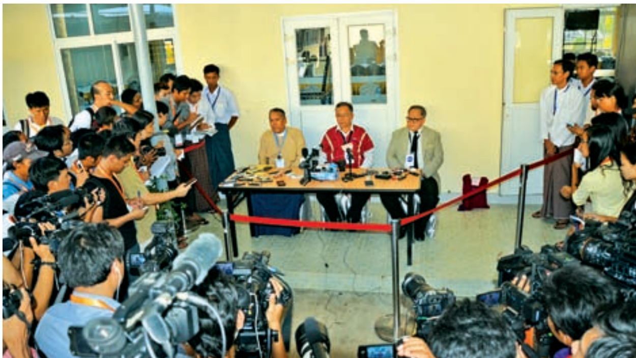
Representatives of UPWC and NCCT hold a press conference on March 18 at Myanmar Peace Centre after their seventh meeting on nationwide ceasefire agreement.

YANGON, 18 March — The seventh meeting between the Union Peace-making Working Committee and Nationwide Ceasefire Coordination Team was a favourable step towards nationwide ceasefire agreement to end armed conflicts, leaders of both sides told the media at the Myanmar Peace Centre on 18 March.