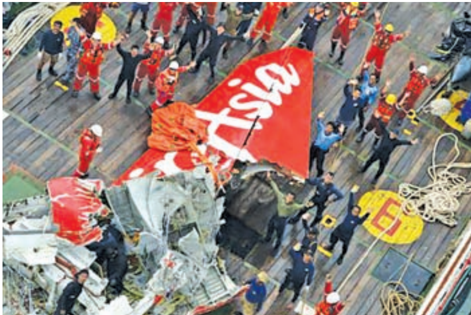
The tail of AirAsia QZ8501 passenger plane is seen on the deck of the Indonesian Search and Rescue (BASARNAS) ship Crest Onyx after it was lifted from the sea bed, south of Pangkalan Bun, Central Kalimantan in this 10 Jan, 2015 file photo.