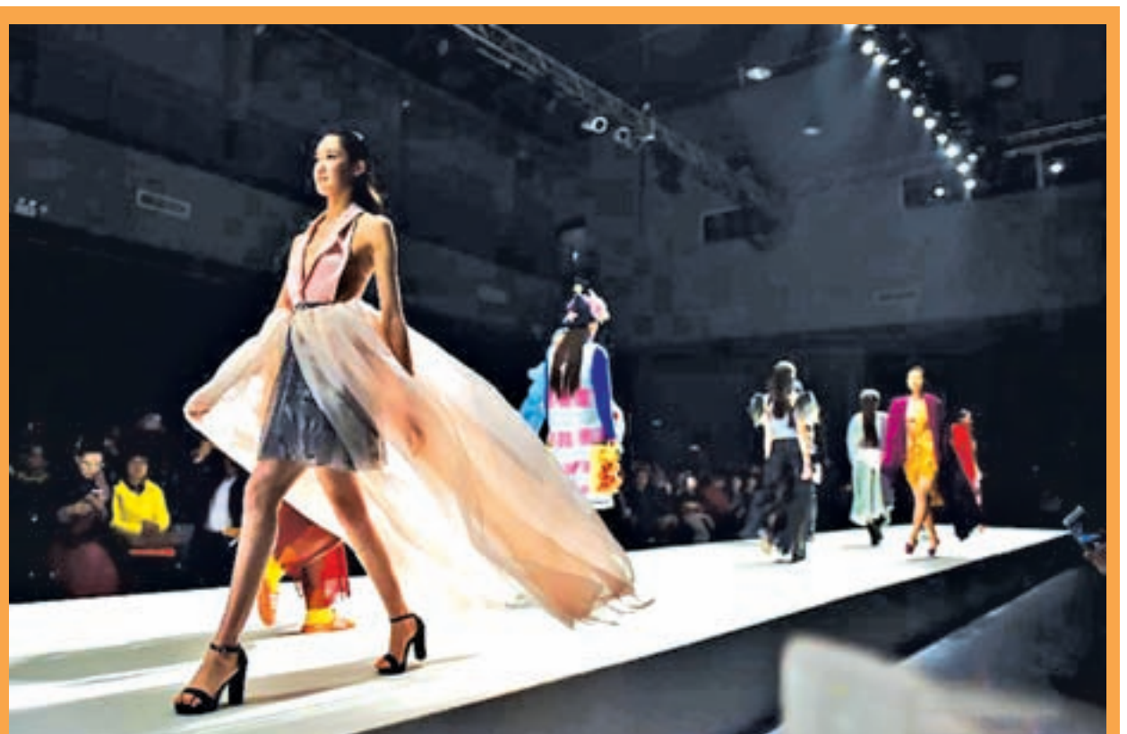
Models present fashion creations designed by graduates of Beijing Institute of Fashion Technology during the “Already Here” fashion week in Beijing, capital of China on 17 March, 2015. Seven fashion shows and one exhibition will be held during the fashion week that kicked off in the institute on Tuesday.