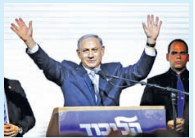
Israeli Prime Minister Benjamin Netanyahu waves to supporters at the party headquarters in Tel Aviv on 18 March, 2015.

"Reality is not waiting for us," Netanyahu said. "The citizens of Israel expect us to quickly put together a leadership that will work for them regarding security, economy and society as we committed to do - and we will do so." —Reuters