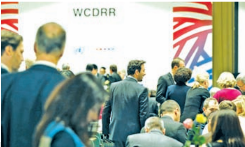
Delegates from around the world gather for the last day of the UN World Conference on Disaster Risk Reduction in the northeastern Japan city of Sendai on 18 March, 2015.

SENDAI, 18 March — Countries gathering for a UN disaster conference in Sendai are set to agree on Wednesday on seven