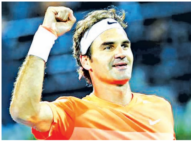
Roger Federer of Switzerland celebrates after winning his final match against Novak Djokovic of Serbia at the ATP Championships tennis tournament in Dubai, on 18 Feb, 2015.

INDIAN WELLS, (California), 16 March — Roger Federer wasted little time easing into the third round of the BNP Paribas Open on Sunday but his fellow Swiss Stan Wawrinka became the first big name to be sent packing at the elite men's event. World number two Federer launched his bid for a record fifth title at the Indian Wells Tennis Garden with a clinical 6-4, 6-2 victory over Argentina's