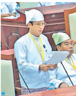
Deputy Minister U Win Myint.

NAY PYI TAW, 16 March — Deputy Minister for Social Welfare, Relief and Resettlement U Phone Swe said the ministry has