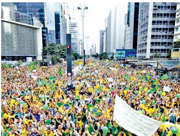
Demonstrators attend a protest against Brazil's President Dilma Rousseff at Paulista avenue in Sao Paulo on 15 March, 2015.