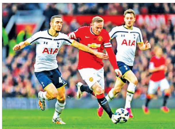
Manchester United's Wayne Rooney in action with Tottenham's Nabil Bentaleb during their Barclays Premier League at Old Trafford on 15 March, 2015.