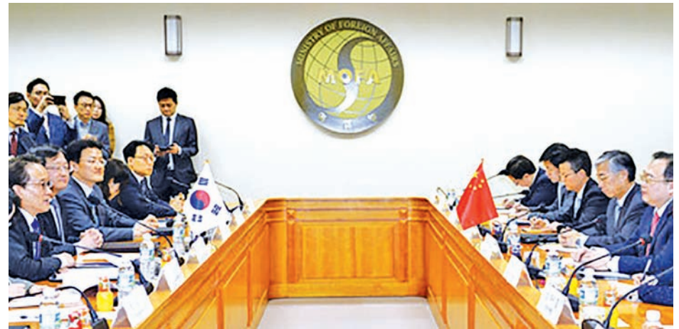
Chinese Assistant Minister of Foreign Affairs Liu Jianchao (far R) and South Korean Deputy Foreign Minister for Political Affairs Lee Kyung Soo (far L) attend a meeting at the ministry in Seoul on 16 March, 2015, over the issue of deploying an advanced US missile-defence system in South Korea.

US officials maintain the system is purely defensive and its deployment