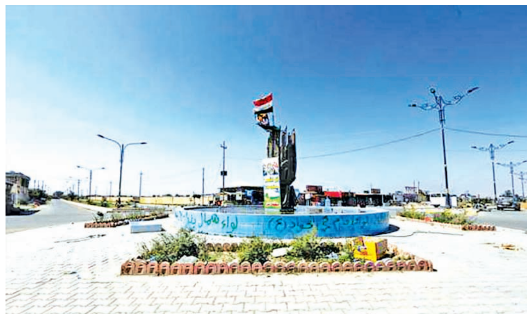
A general view shows an Iraqi national flag fluttering in al-Alam Salahuddin Province on 15 March, 2015.

More than 20,000 troops and Iranian-backed