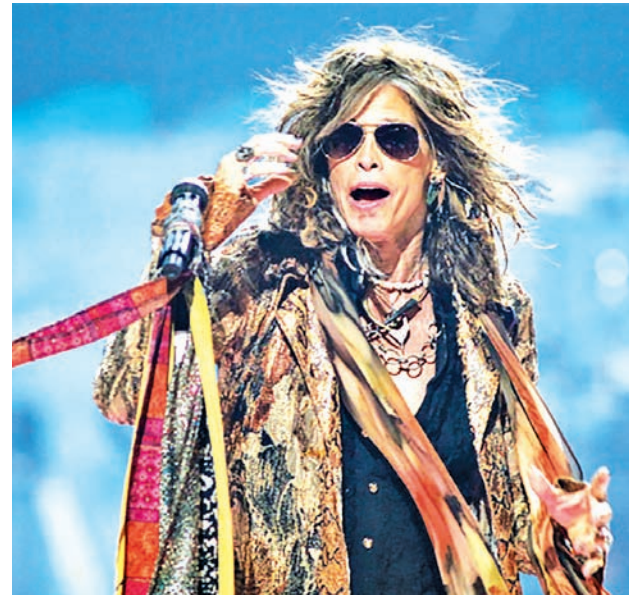
Rock band Aerosmith frontman Steven Tyler

LOS ANGELES, 16 March — Rockband Aerosmith frontman Steven Tyler is currently working on a country album that is planned to be released later this year or early 2016.