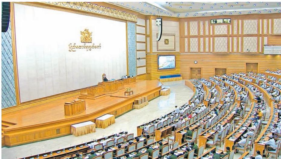
Pyidaungsu Hluttaw MPs debates budgets for ministries.—MNA

NAY PYI TAW, 16 March — Union level officials explained the budgets for ministries at the Pyidaungsu Hluttaw session on Monday.