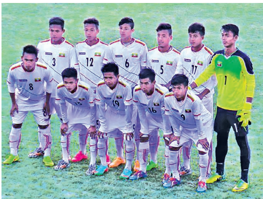
Photo shows Myanmar U-20 team that will play against Malaysian U-22 team in soccer friendly.