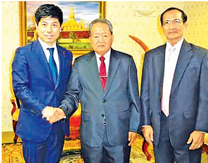
Kazuyuki Nakane (L), Japan's parliamentary vice foreign minister, shakes hands with Lao Deputy Prime Minister Asang Laoly (C) prior to their talks on 16 March, 2015 at the Lao Embassy in Tokyo, as Lao Minister of Natural Resources and Environment Noulin Sinbandhit looks on.

The Mekong River Commission is an inter-governmental agency that works with Cambodia, Laos, Thailand and Viet-