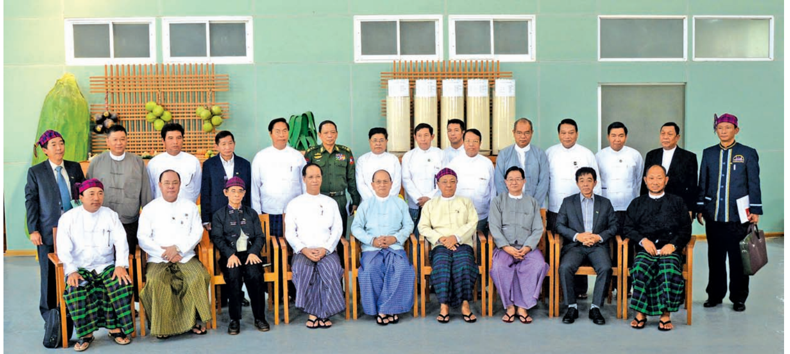
President U Thein Sein poses for documentary photo together with KIO leaders.

The 7 th talks between the NCCT and UPWC will hear the viewpoints of all NCCT members, and both