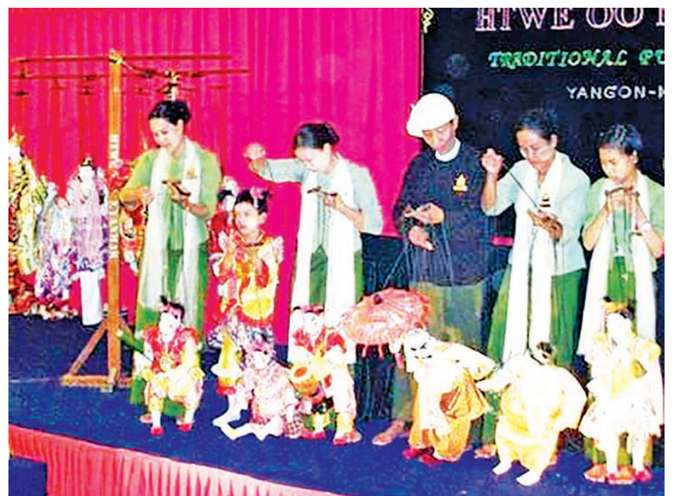
Myanmar traditional marionette troupe performing a puppet show at theater in Yangon.

Myanmar has taken part in the market since (See page 2)