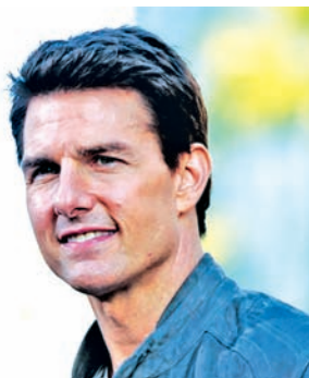
Hollywood star Tom Cruise will reportedly pile on the pounds to play a spy in a gory thriller "Mena".