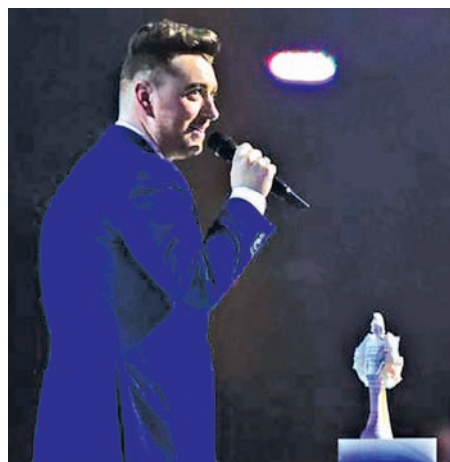
Sam Smith receives the award for British Breakthrough Act at the BRIT music awards at the O2 Arena in Greenwich, London, on 25 Feb, 2015.

It finished more than 12,000 sales ahead of this week's highest new entry, second-placed "Rebel Heart" by Madonna. Ed Sheeran's "X" was a non-mover in third. In the singles chart, British electronica trio Years and Years slipped one spot to second place with "King",