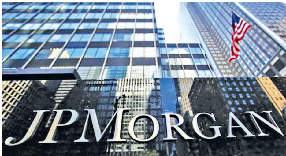
A sign outside the headquarters of JP Morgan Chase & Co in New York, on 19 Sept, 2013.

NEW YORK, 16 March — Federal authorities investigating the data breach at JPMorgan Chase & Co are increasingly confident that a criminal case will be filed against the hackers in the coming months, the New York Times reported, citing people briefed on the investigation.