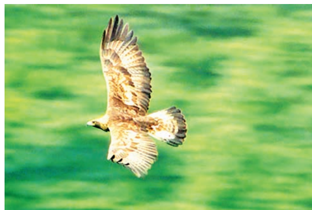
Supplied photo taken in 2010 shows a golden eagle flying in Toyama Prefecture, central Japan. The endangered Japanese golden eagle population has fallen dramatically to just around 500 birds nationwide amid environmental changes, according to a research group.

TOKYO, 16 March — The endangered Japanese golden eagle population has fallen dramatically to just around 500 birds nationwide amid environmental changes, according to a study by a research group. The Society for Research of Golden Eagle Japan’s head, Toshiki Ozawa, warned that the subspecies is facing the threat of extinction, its numbers having been in gradual decline since 1986. “The biggest issue is the reduced breeding success rate due to a lack of prey,” he said. The Tokyo-based society’s research shows the number of breeding pairs has fallen by one-third over the past