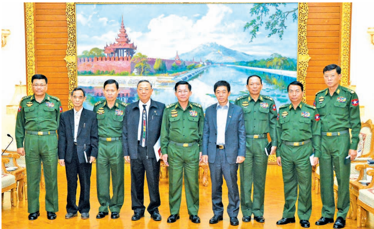
Senior General Min Aung Hlaing poses for documentary photo with KIO delegation.