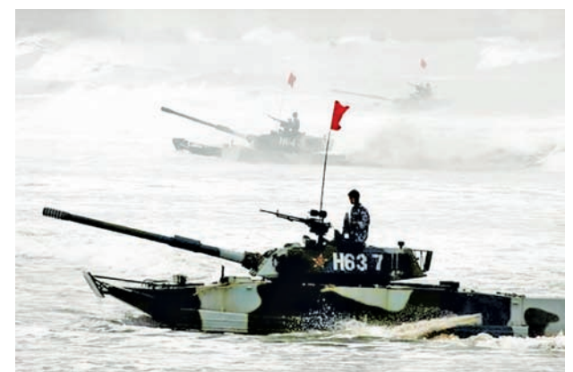
Chinese amphibian armoured vehicles take part in China-Russia joint military exercise in eastern China’s Shandong peninsula.—REUTERS

“We have reports coming in of horizontal rain and a fierce sea rising rapidly,” said Higgs.— Xinhua