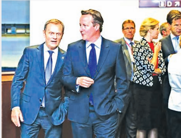
Poland's Prime Minister Donald Tusk (L) and Britain's Prime Minister David Cameron (R) arrive at a group photo during a EU summit in Brussels on 27 June, 2013.

"We need unanimity between 28 member states, in the European