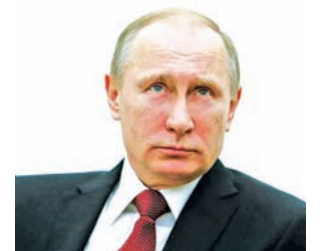
Russian President Vladimir Putin

The West and Kiev accuse Russia of supplying arms and soldiers to sup-