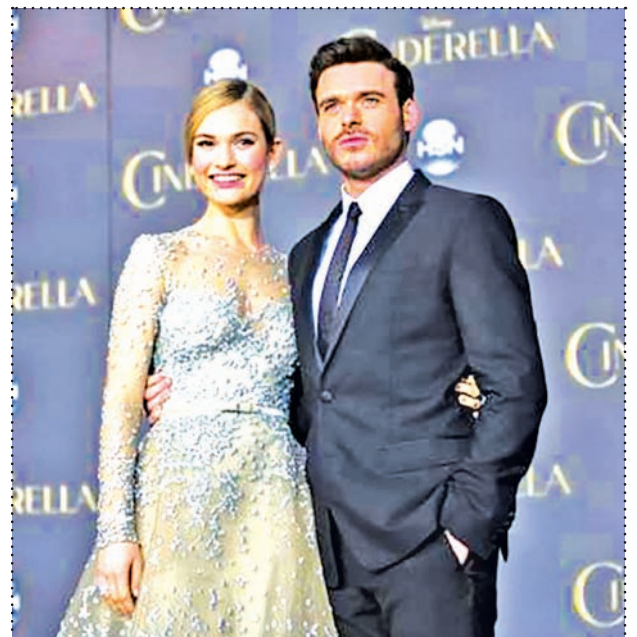
Cast members Lily James and Richard Madden pose at the premiere of "Cinderella" at El Capitan theatre in Hollywood, California on 1 March, 2015.

Rounding out the 10 most-popular movies this week were "Focus" (5.8 million dollars), "Chappie" (5.8 million), "The Second Best Exotic Mari-gold Hotel" (5.7 million), "Spongebob Squarepants" (5.7 million), "Kingsman: The Secret Service" (4.1 million), "McFarland USA" (3.7 million), "American Sniper" (2.9 million) and "The Duff" (2.9 million).—Xinhua