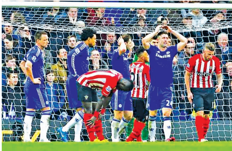
Chelsea's Gary Cahill looks dejected after John Terry (L) misses a chance to score during their Barclays Premier League match vs Southampton at Stamford Bridge on 15 March, 2015.