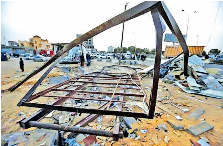
People are seen at the scene of an explosion at a checkpoint at the eastern entrance to the city of Janzour in Tripoli on 15 March, 2015.

TRIPOLI, 16 March — Militants loyal to Islamic State claimed a bomb attack on a police checkpoint in the Libyan capital on Sunday, the latest in a series of attacks in Tripoli.