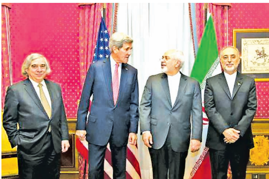
US Energy Secretary Ernest Moniz, US Secretary of State John Kerry, Iran's Foreign Minister Mohammad Javad Zarif and the head of the Atomic Energy Organization of Iran Ali Akbar Salehi (L-R) pose for a photograph before resuming talks over Iran's nuclear programme in Lausanne on 16 March, 2015.

LAUSANNE, 16 March — US Secretary of State John Kerry and his Iranian