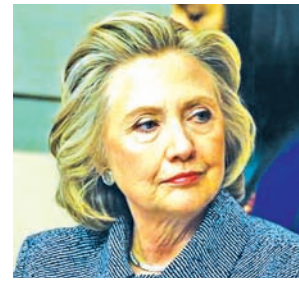
Former US Secretary of State Hillary Clinton

Clinton's failure to use a government email address has sparked a storm of criticism even as she lays the groundwork for an expected 2016 presidential bid. At a news conference last Tuesday, she said her private email address was a "convenience" so she would not have to carry two mobile devices. Also on Tuesday, Clinton's office released a