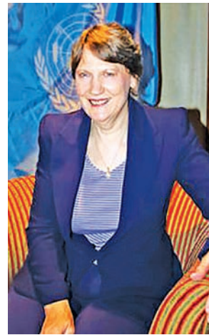
UN Development Programme Administrator Helen Clark is interviewed by Kyodo News on 15 March, 2015 in Sendai, northeastern Japan, where a five-day UN world conference on disaster risk reduction is taking place. Clark said the international community needs to invest more in pre-emptive measures to reduce risks from natural disasters, rather than spending a lot after they happen.