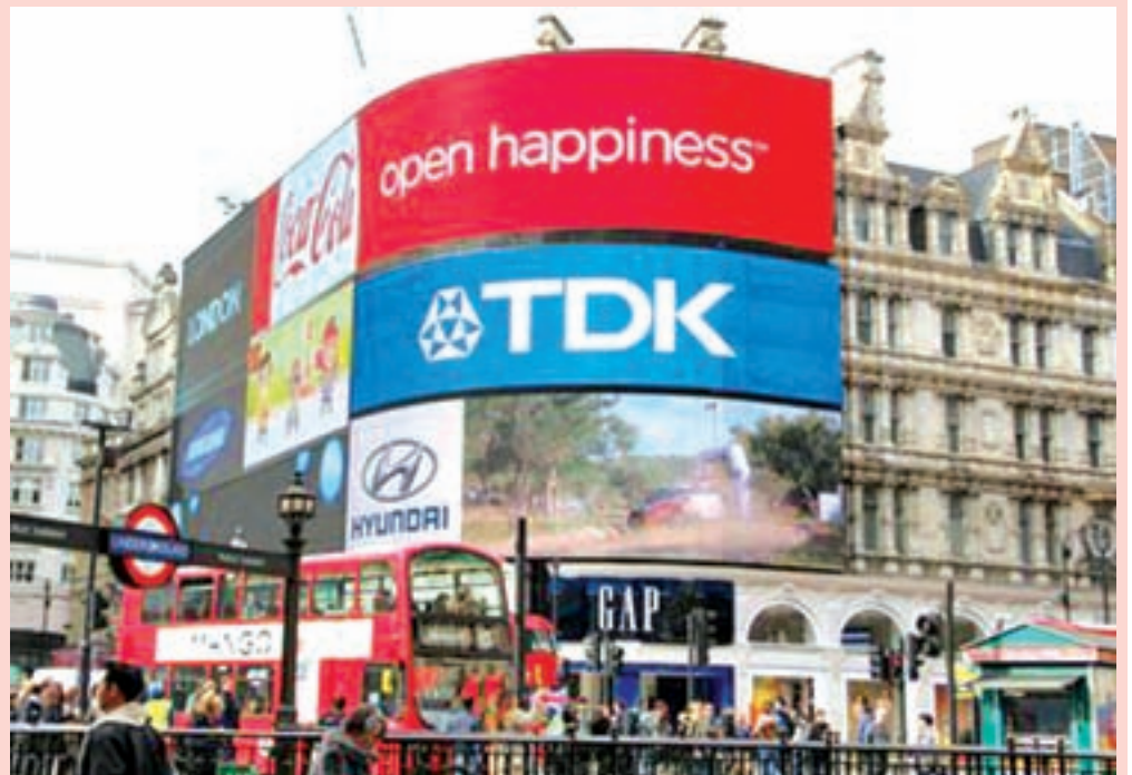
Photo taken on 13 March, 2015, shows electronic signboards in London's Piccadilly Circus. Japanese electronics maker TDK Corp is taking down its neon sign from Piccadilly Circus on 24 March, spelling the end of a Japanese presence in one of the world's most prestigious advertising locations.