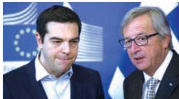
European Commission President Jean-Claude Juncker welcomes Greek Prime Minister Alexis Tsipras (L) ahead of a meeting at the EU Commission headquarters in Brussels on 13 March, 2015.

“If one country leaves this union, the markets will