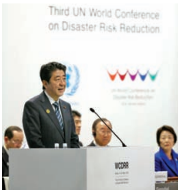
Japanese Prime Minister Shinzo Abe speaks in the opening session of the UN World Conference on Disaster Risk Reduction in the northeastern Japan city of Sendai on 14 March, 2015. The meeting began three days after Japan marked the fourth anniversary of the 11 March, 2011, earthquake, tsunami and nuclear disasters that devastated the area.

SENDAI, (Japan) 14 March — Prime Minister Shinzo Abe said on Saturday Japan will offer $4 billion in aid for global efforts to enhance disaster management over four years through 2018, including support for building infrastructure in developing countries.