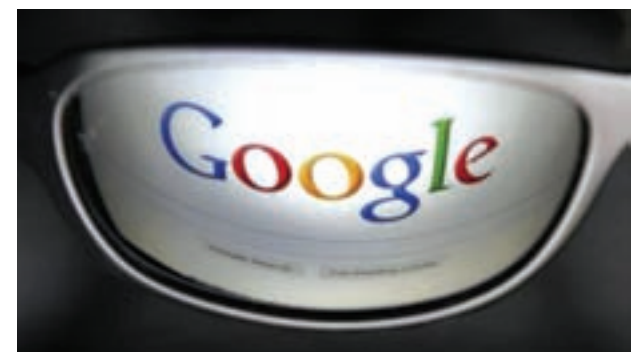
A Google search page is reflected in sunglasses in this photo illustration taken in Brussels on 30 May, 2014.