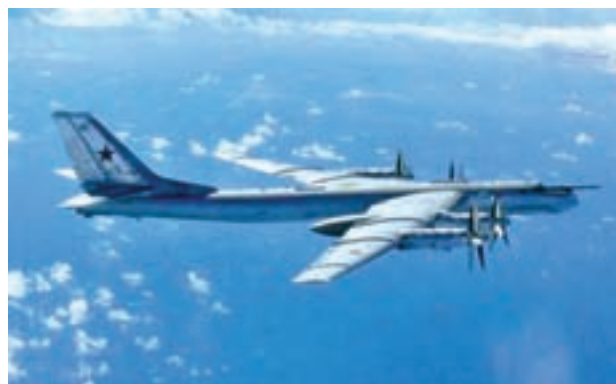
A Russian TU-95 bomber flies through airspace northwest of Okinoshima island, Fukuoka prefecture in the southern island of Kyushu, in this picture taken by Japan Air Self-Defence Force and released on 22 Aug, 2013.—REUTERS

The Vietnamese government has not responded to requests by Reuters for comment.— Reuters