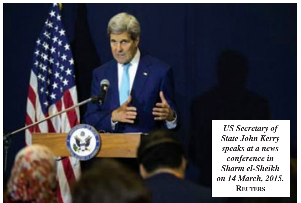
US Secretary of State John Kerry speaks at a news conference in Sharm el-Sheikh on 14 March, 2015.

SHARM EL-SHEIKH, (Egypt), 14 March — US Secretary of State John Kerry said on Saturday on the eve of fresh talks with Iran over its nuclear-power programme that it was unclear whether an interim