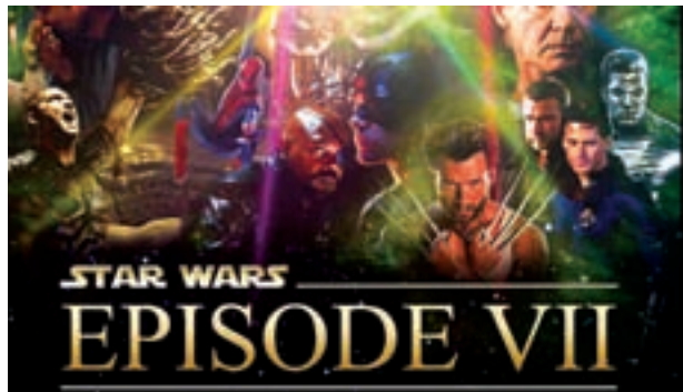
A stand-alone movie based on the Star Wars world that is due on 16 Dec, 2016, and directed by Gareth Edwards, will be called “Rogue One”.

“We absolutely love this movie,” he said.