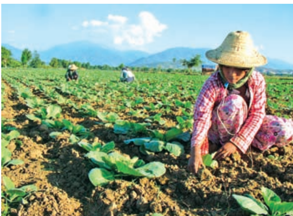
A farmer works in a cabbage field near Nay Pyi Taw. Local farmers grow mainly cabbage, onions and peas and pulses as second crops of the year.

Officials said four social organizations—Myanmar Christian Council of Churches, Rakhine Fellowship Organization, Free Funeral Service Society (Yangon) and Myanmar Disabled Leading Group—shared their opinions on the education amendment bill.—MNA