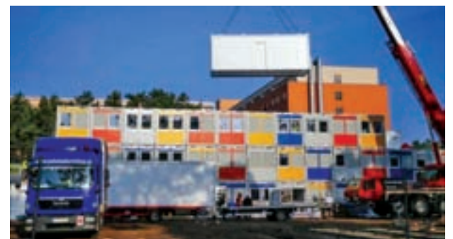
A crane lifts up a container at a construction site for a refugee centre to house asylum seekers in the Koepenick district of Berlin on 27 Nov, 2014.

“The idea is to establish camps in Africa, on the other side of the Mediterranean Sea, that would deal with the requests of asylum seekers,” Italian Home Affairs Minister Angelino Alfano told reporters in