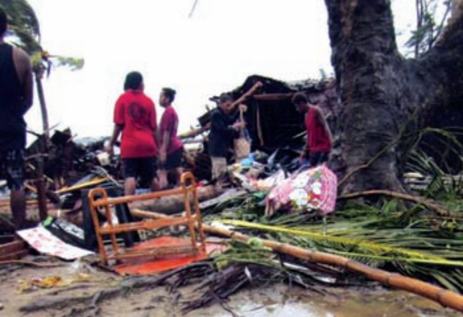
Local residents look through the remains of a small shelter in Port Vila, the capital city of the Pacific island nation of Vanuatu on 14 March, 2015.

SYDNEY, 14 March — One of the Pacific Ocean’s most powerful ever storms devastated the island nation of Vanuatu on Saturday, tearing off roofs, uprooting trees and killing at least eight people with the toll set to rise, aid officials said. The United Nations was preparing a major relief operation and Australia said it was ready to offer its neighbour whatever help it could. With winds up to 340 kph (210 mph), Cyclone Pam left Vanuatu cut off, with little power, poor communications and a looming threat of hunger and thirst. Unconfirmed reports said the number of dead could run into dozens but aid workers said it would be days or weeks before the full impact was known. “It felt like the world was going to end,” Alice Clements, a spokeswoman for the UN Children’s Fund (UNICEF), said from Vanuatu. “It’s like a bomb has gone off in the centre of the town. There is no power. There is no water.” Tom Skirrow, country director for the Save the Children aid group, told Reuters that Vanuatu’s