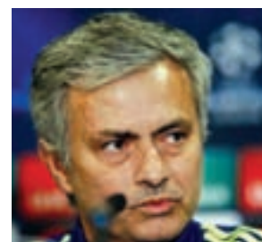
Chelsea manager Jose Mourinho during the Chelsea Press Conference at Stamford Bridge, London, England on 10 March, 2015.

LONDON, 14 March — Chelsea will win the Premier League this season with the same players who are being criticised for going out of the Champions League to Paris St Germain, their manager Jose Mourinho promised on Friday.