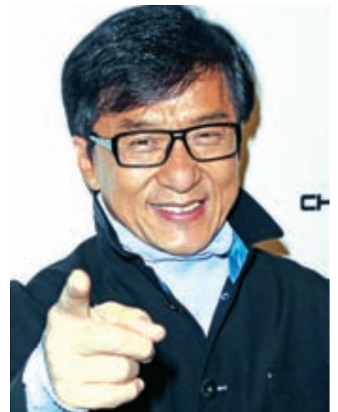
Movie star Jackie Chan

It’s not Chan’s first foray into Olympic singing. The action star performed “We Are Ready”, recorded and released