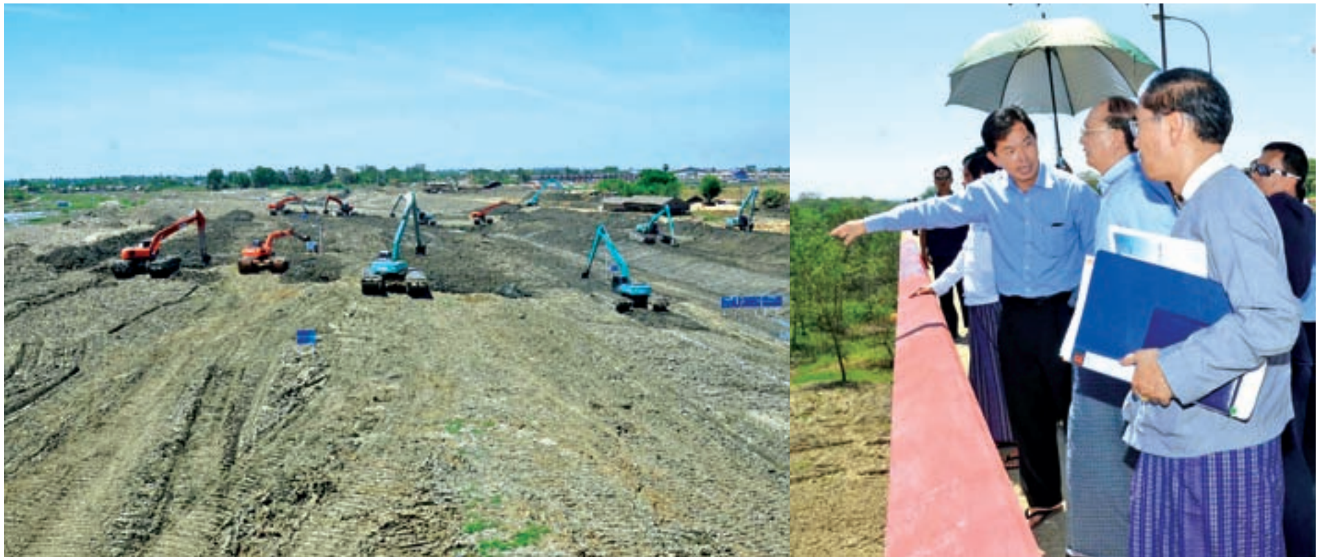
President U Thein Sein inspects waterway conservation of the 35-mile long Pan Hlaing River

YANGON, 14 March — President U Thein Sein on Saturday inspected waterway conservation of the 35-mile long Pan Hlaing River that passes through Yangon