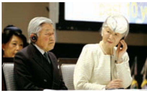
Emperor Akihito (L) and Empress Michiko attend the opening session of the UN World Conference on Disaster Risk Reduction in the northeastern Japan city of Sendai on 14 March, 2015. The meeting began three days after Japan marked the fourth anniversary of the 11 March, 2011, earthquake, tsunami and nuclear disasters that devastated the area.—KYODO NEWS

"We can watch that number grow as more people suffer. Or we can dramatically lower that figure