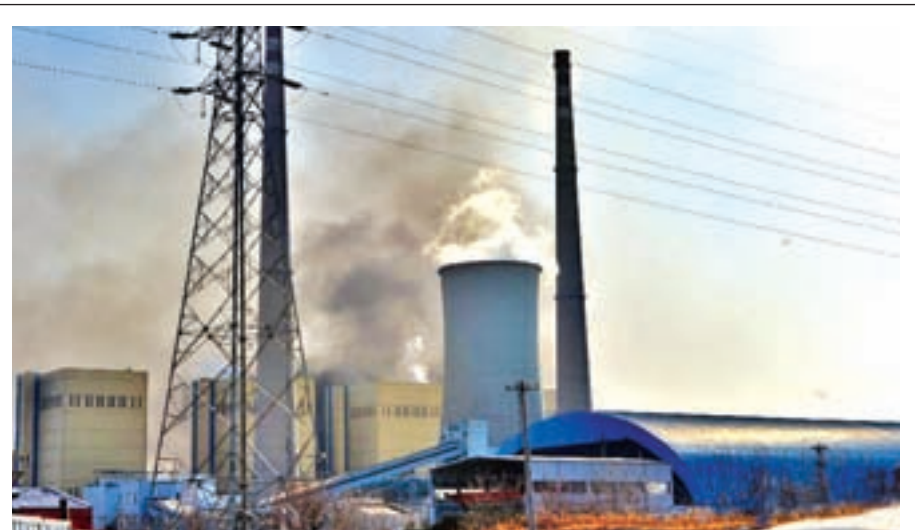
Smoke rises from a burning power plant in east Beijing, capital of China, on 13 March, 2015. By far, the fire has been brought under control. No casualties were reported. —XINHUA