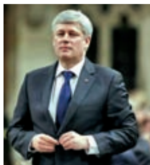
Canada's Prime Minister Stephen Harper

But the political debate over the bill, broadly condemned by pundits as unnecessary but supported by skittish Canadians, has shifted from security to the place of Muslims in Canadian society, with the