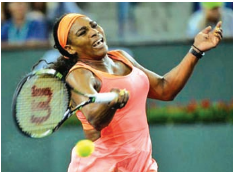
Serena Williams (USA) during her match against Monica Niculescu (ROU) at the BNP Paribas Open at the Indian Wells Tennis Garden, Indian Wells, CA, USA on 13 March, 2015. Williams won 7-5, 7-5.