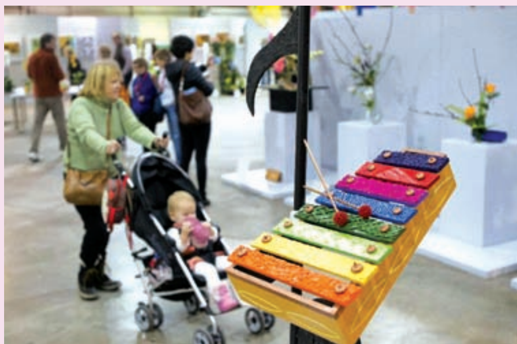
People visit the 2015 Canada Blooms in Toronto, Canada, on 13 March, 2015. As Canada's largest flower and garden festival, the 10-day event kicked off on Friday to exhibit the accomplishments in Canadian gardening and floral design.