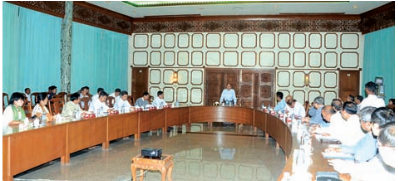
President U Thein Sein discusses construction of an international standard artistic centre with artistes in Yangon—MNA

The Ministry of Agriculture and Irrigation has implemented the conservation project since April