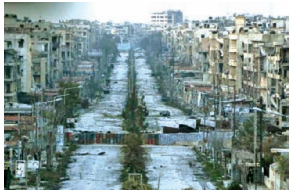
A general view shows a damaged street with sandbags used as barriers in Aleppo's Saif al-Dawla District on 6 March, 2015.