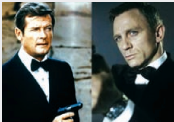
James Bond depicts Daniel Craig and Rodger Moore are set to join forces to poke fun at the spy franchise in a skit for Comic Relief.

LONDON, 14 March — James Bond depicts Daniel Craig and Rodger Moore are set to join forces to poke fun at the spy franchise in a skit for Comic Relief.