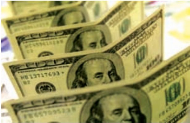
US dollar bank notes are seen in a bank in Budapest on 8 Aug, 2011.

NEW YORK, 14 March — The dollar surged on Friday as weak inflation data failed to stem expectations the Federal Reserve will move to tighten monetary policy, and the greenback's rise pressured stocks and commodities.