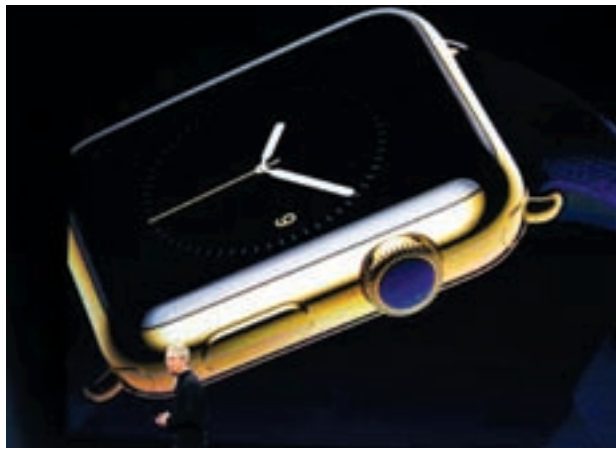
Apple CEO Tim Cook introduces the Apple Watch during an Apple event in San Francisco, California on 9 March, 2015.

It allows users to check email, listen to mu-