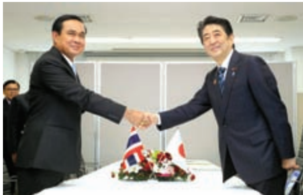
Japanese Prime Minister Shinzo Abe (R) and his Thai counterpart Prayut Chan-o-cha shake hands when they meet on the sidelines of the UN World Conference on Disaster Risk Reduction in Sendai, northeastern Japan, on 14 March, 2015. The two leaders agreed to speed up bilateral talks on developing a high-speed railway in the Southeast Asian country.

Japan is offering support for infrastructure development in Thailand as part of efforts to increase regional connectivity, as Thailand and nine other members of the Association of Southeast Asian Nations are trying to establish a more integrated ASEAN Economic Community this year.