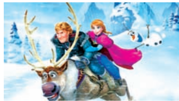
“Frozen 2” was announced during the Mouse House’s annual shareholders meeting.

Kristen Bell who voices Anna and Josh Gad who voices Olaf the Snowman gleefully respond to the news. “Dreams really do come to!!! #FROZEN2 #itsofficial,” the former tweeted along with a picture of her smiling while lying on a bag of ice.