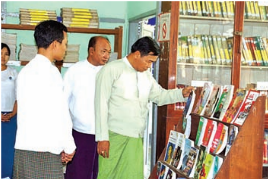
HINTHADA, 14 March — Deputy Minister for Information U Pike Ht-way on his trip to Hinthada Township on 12 March instructed officials and

staff of the Information and Public Relations Department to deliver daily newspapers to the township library, schools and offices, increase subscribers of dailies and encourage borrowing of books at the library.