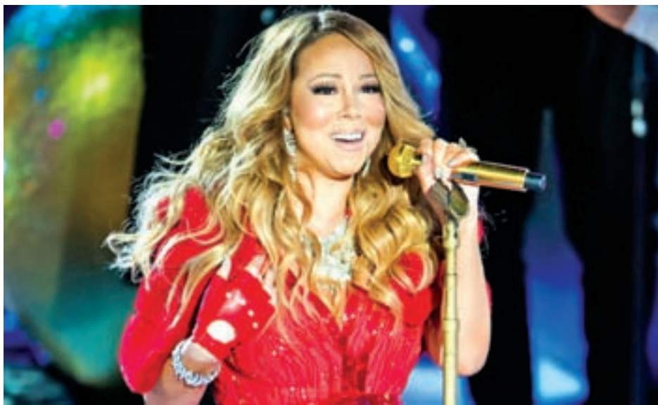
Pop star Mariah Carey

Carey’s Las Vegas residency starts on 6 May. While she’s gearing up for the upcoming shows and for the “#1’s” compilation, she has reportedly started working on another project for Epic. According to a source, the 44-year-old star is already recording new music in Los Angeles.