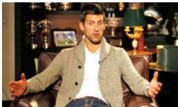
Tennis player Novak Djokovic of Serbia talks during an interview in Belgrade on 1 March, 2015.

INDIAN WELLS, 13 March — The French Open is the only grand slam title to have eluded Novak Djokovic and the steely-eyed Serb has adopted a philosophy of reverse psychology in a bid to claim the coveted crown at Roland Garros.