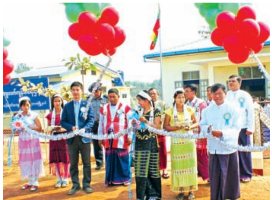
Officials cut the ribbon to inaugurate rural health branch in Paww-Htaw village in Hpa-an Township.