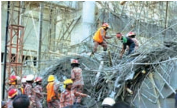
Rescue workers are seen at the scene of a collapsed cement factory in the port town of Mongla, southwest of Dhaka, on 12 March, 2015.

DHAKA, 13 March — Rescuers in Bangladesh searched through the wreckage of a factory warehouse on Friday, a day after it collapsed killing at least seven