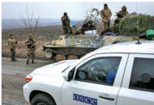
A vehicle of Special Monitoring Mission of the Organization for Security and Cooperation (OSCE) to Ukraine rides along a convoy of Ukrainian armed forces in Paraskoviivka, eastern Ukraine, on 26 Feb, 2015.

The OSCE said then that it could not confirm the withdrawal of weapons by either side, because it had not been given access to all locations where weapons might be stored. The OSCE monitoring mission