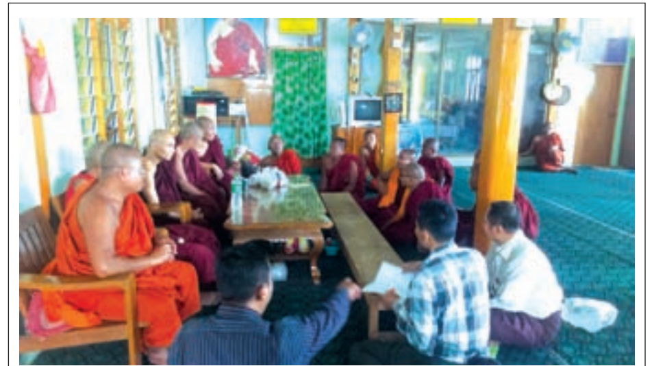
Ten Buddhist monks who participated in the student protests in Letpadan on 10 March pledged to abide by the instructions issued by the State Sangha Maha Nayaka Committee. On 11 March, the monks left Aungmyay Beikman, a monastery, in Letpadan for their respective regions.