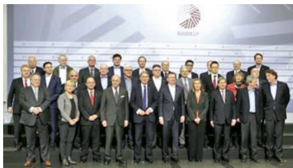
European Union Foreign Ministers pose for the media during their informal European Union Ministers of Foreign Affairs meeting (Gymnich) in Riga on 6 March, 2015.

"What will be the final point we will see in the Council (summit) but I don't think there is unanimity at all for the rollover of sanctions, the sanctions that are due in July," the official, briefing reporters on condition of anonymity, said.