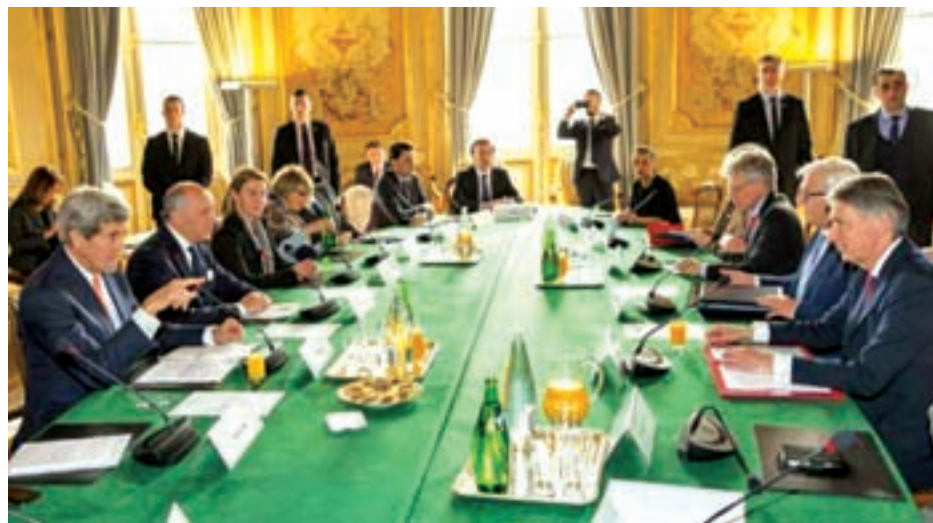
US Secretary of State John Kerry (L) and foreign ministers, Laurent Fabius of France (2 nd L), Philip Hammond of Britain (R) and Frank-Walter Steinmeier of Germany (2 nd R), meet in Paris on 7 March, 2015.

Iran sees their removal as crucial as UN measures are a legal basis for more