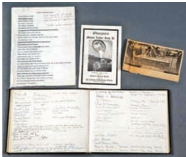
Martin Luther King Jr memorabilia are shown in this image courtesy of Quinn's Auction Galleries in Falls Church, Virginia, and released to Reuters on 4 March, 2015.—REUTERS

When Belafonte tried to auction it off in 2008, King's children objected, and the sale was canceled. The two sides became embroiled in a