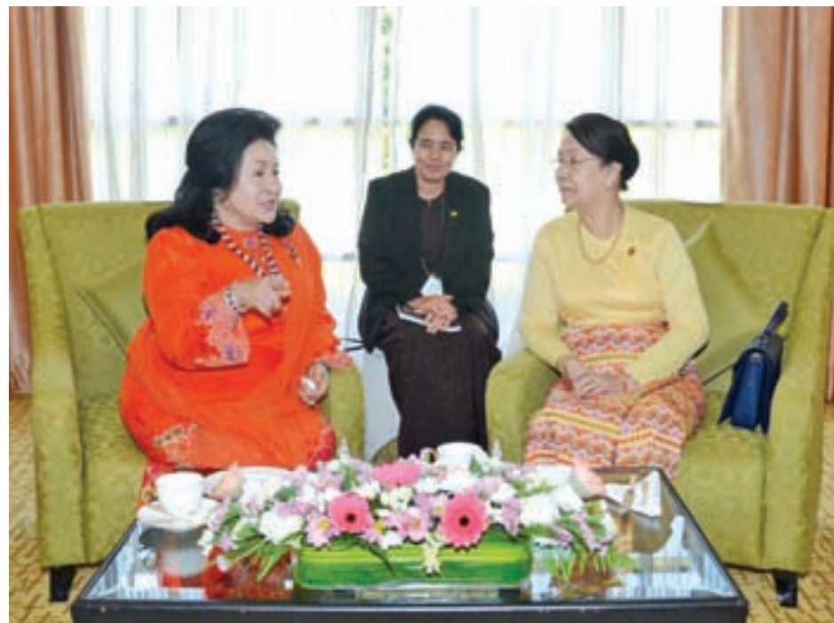
Daw Khin Khin Win, wife of President U Thein Sein, meets with wife of the Malaysian Prime Minister.