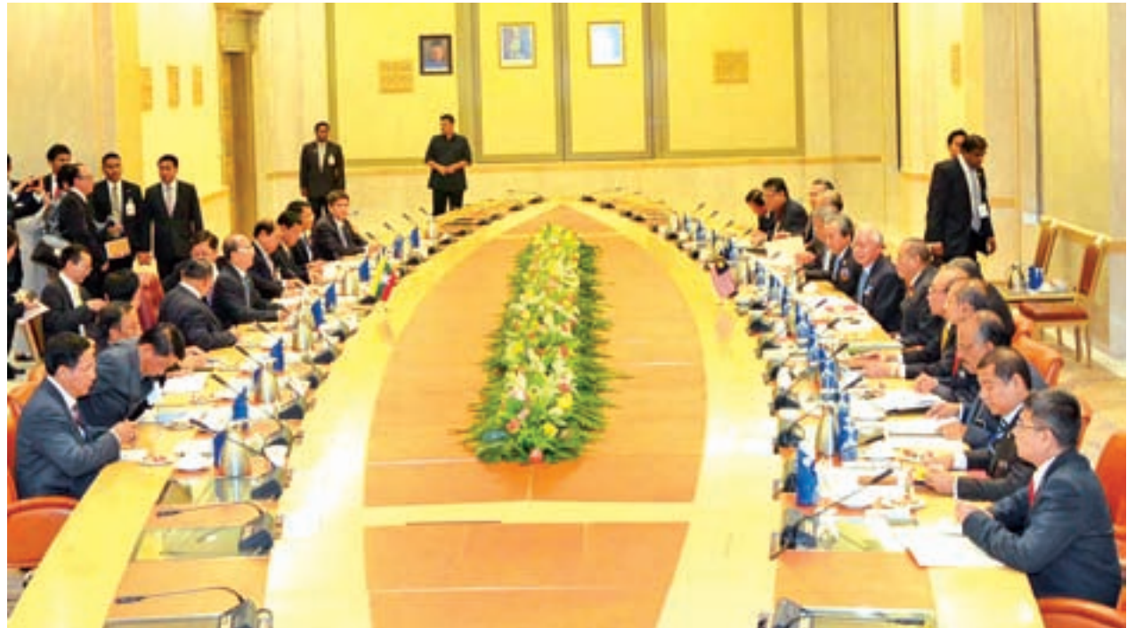
Myanmar delegation led by President U Thein Sein holds talks with Malaysian delegation led by Malaysian Prime Minister Mr Najib Razak.