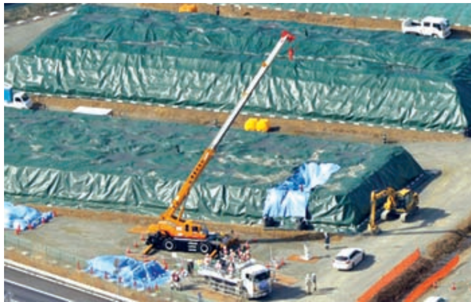
Photo taken from a Kyodo News helicopter on 13 March, 2015, shows workers making preparations for the transfer of decontamination waste from a temporary storage space in the northeastern Japan city of Okuma to a planned construction site for interim storage facilities. The starting date of construction remains unknown.

Environment Minister Yoshio Mochizuki told a news conference Friday, “The start of delivery marks a major step forward for the rebirth and recon-