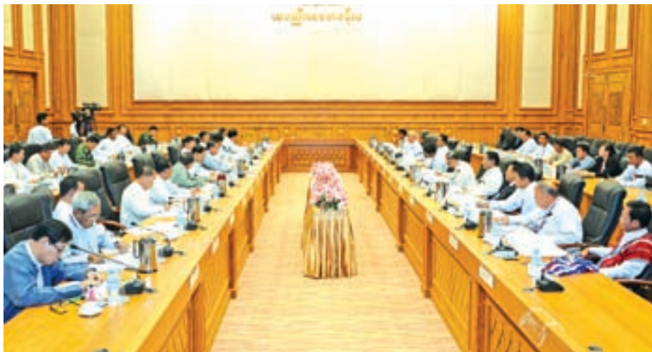
Amyotha Hluttaw Bill Committee hears suggestions and opinions from political parties on national education amendment bill.

The Bill Committee said the national education bill is concerned with all the people residing in the country and as a result deserves special care and thorough consideration. Drafting bills needs to comply with the constitutional legislation and other existing laws while taking into consideration their practicality and benefits to the country and the people,