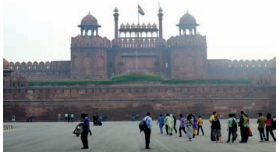
The Red Fort, photographed Friday, is one of the most popular tourist destinations in Old Delhi, India.

nations, Mr. Anil Wadhwa, Secretary (East) of India's Ministry of External Affairs, affirmed that India (See page 2)