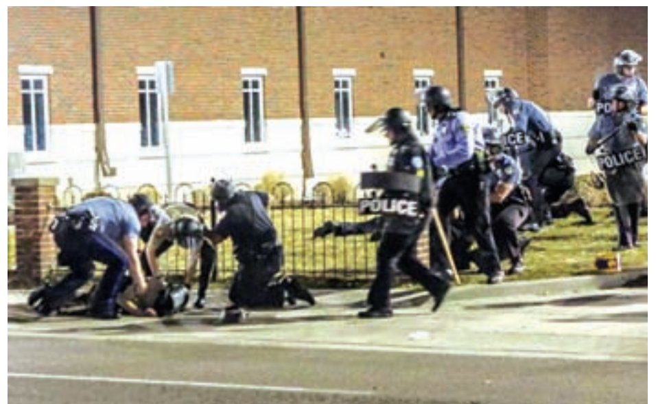
Police officers respond to a fellow officer hit by gunfire outside the Ferguson Police Headquarters in Ferguson, Missouri on 12 March, 2015.