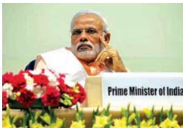
India’s Prime Minister Narendra Modi attends an event organized by the Christian community to celebrate the beatification of two Indians by Pope Francis late last year, in New Delhi on 17 Feb, 2015.