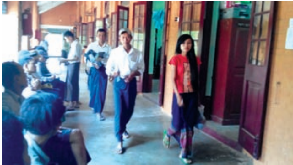
Protestor students and parents leave Thayawady District General Administration Department after handover ceremony.

NAY PYI TAW, 13 March — Authorities on Friday released nine students and two reporters engaged in recent protests at the National Education Law in the township of Letpadan, Bago Region, according to officials. On 12 March, authorities returned 17 students to their parents, making a total of 28 including two reporters.