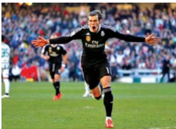
Real Madrid's Gareth Bale celebrates after scoring against Cordoba during their Spanish First Division soccer match at El Arcangel stadium in Cordoba, on 24 Jan, 2015.

Bale has not scored for the European champions in nine matches since he converted a penalty against