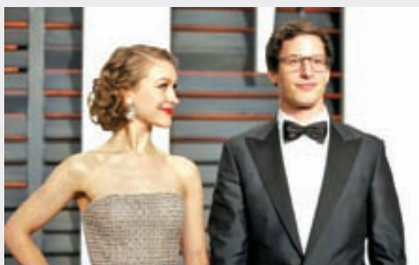
Actor Andy Samberg and wife, actress Joanna Newsom arrive at the 2015 Vanity Fair Oscar Party in Beverly Hills, California on 22 Feb, 2015.

NEW YORK, 13 March — Andy Samberg, a star of the comedy TV show “Brooklyn Nine-Nine,” will host the 2015 Primetime Emmy Awards, the highest honours in US television, organizers of the show said on Thursday.