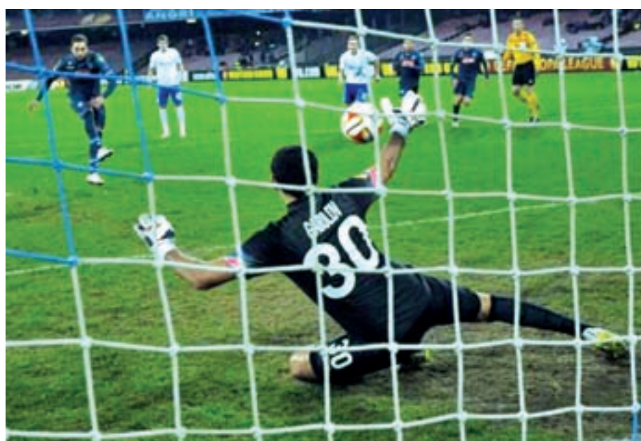
Napoli's Gonzalo Higuain (L) shoots and scores a penalty as Dynamo Moscow goalkeeper Vladimir Gabulov (C) tries to block during their Europa League round of 16 first leg soccer match at the San Paolo stadium in Naples on 12 March, 2015.