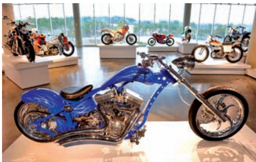
A motorcycle built by students of Chelsea High School is seen at in Barber Vintage Motorsports Museum in Birmingham, Alabama, the United States, on 12 March, 2015. With a collection of over 1200 motorcycles, the Barber Vintage Motorsports Museum was named the largest motorcycle museum in the world by the Guinness Book of World Records in 2014.