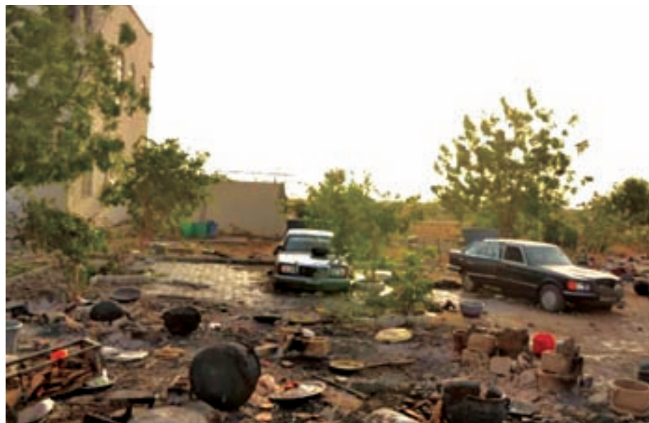
Debris is scattered in front of a building that Boko Haram insurgents used as their base before being driven out by the Chadian military in Dikwa on 2 March, 2015.