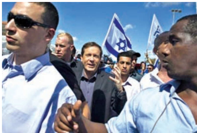
Isaac Herzog (C) is escorted by bodyguards during a campaign stop at a fruit and vegetable market in Lod near Tel Aviv on 3 March, 2015.

The survey showed 71 percent thought the Joint Arab List, which groups four Arab parties and enhances their electoral clout,