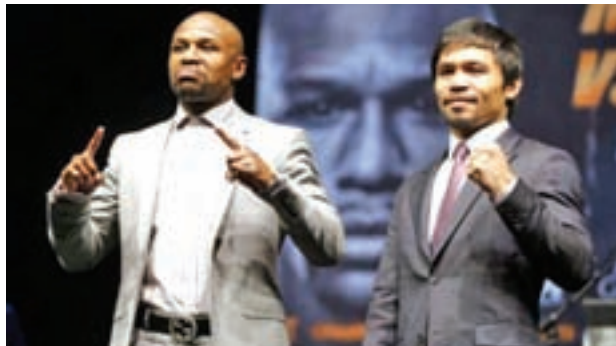
Eleven-time, five-division world boxing champion Floyd 'Money' Mayweather (L) and eight-division world champion Manny 'Pac-Man' Pacquiao pose at a news conference ahead of their upcoming bout, in Los Angeles, California on 11 March, 2015.

"This is what you are waiting for since five years ago," said Pacquiao, who has held world titles in eight different weight divisions. "The fight is on and we're very excited ... we will do our best on 2 May to make you happy." —Reuters