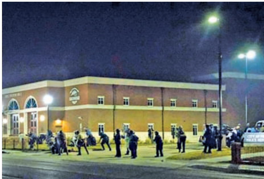
Police stand guard moments after gun shots were fired outside the City of Ferguson Police Department and Municipal Court in Ferguson, Missouri early on 12 March, 2015.

FERGUSON, 12 March — Two police officers were shot during a protest outside the Ferguson, Missouri police headquarters early on Thursday, police said, just hours after the city's police chief quit following a damning justice report into his department.