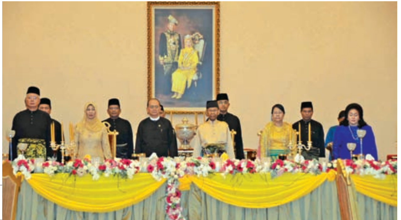
President U Thein Sein and wife Daw Khin Khin Win attend a dinner hosted by Malaysian Sultan and wife.