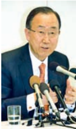
UN Secretary General Ban Ki-moon

NEW YORK, 12 March — UN Secretary General Ban Ki-moon on Wednesday expressed hope that an upcoming multilateral conference in Japan will produce a “strong and ambitious” framework to curb disaster risks, calling it essential for achieving the global organization’s sustainable development goals.