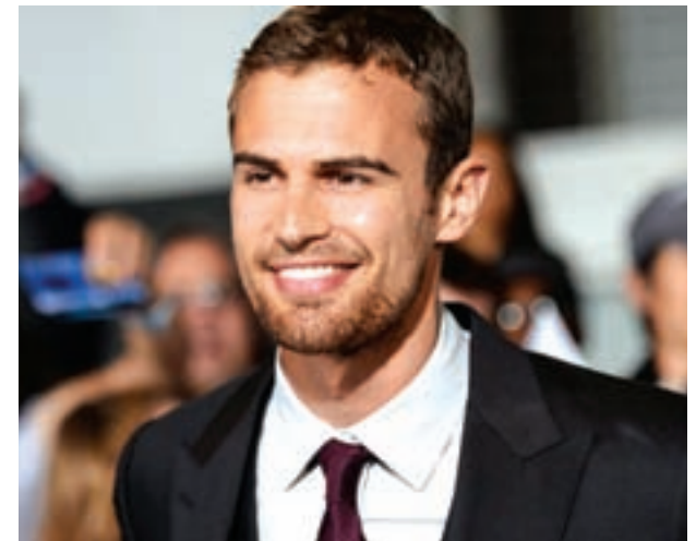
Theo James, 30, who reprises his role as Four in this month's ‘Insurgent’, said that he is now unlikely to return for the sequel.

LONDON, 12 March — Actor Theo James will not star in ‘Underworld: Next Generation’. It was reported last year that the fifth ‘Underworld’ movie would focus on James's vampire character David, who was introduced in 2012's ‘Underworld: Awakening’. But James, 30, who reprises his role as Four in this month's ‘Insurgent’, said that he is now unlikely to return for the sequel.