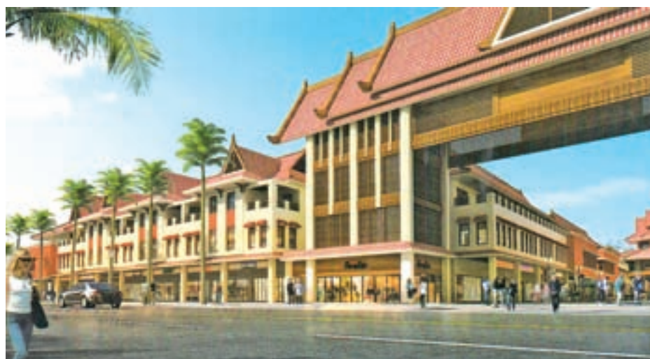
Modern Myanmar-style shopping area.