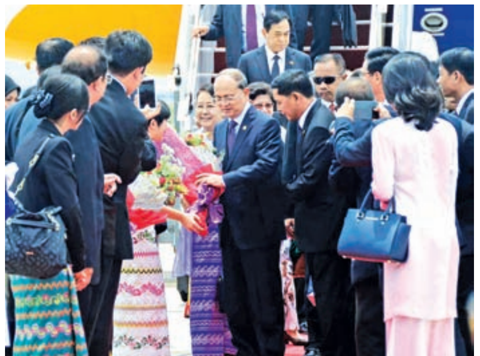
President U Thein Sein and wife Daw Khin Khin Win being welcomed by a Myanmar girl at Kuala Lumpur International Airport.—MNA