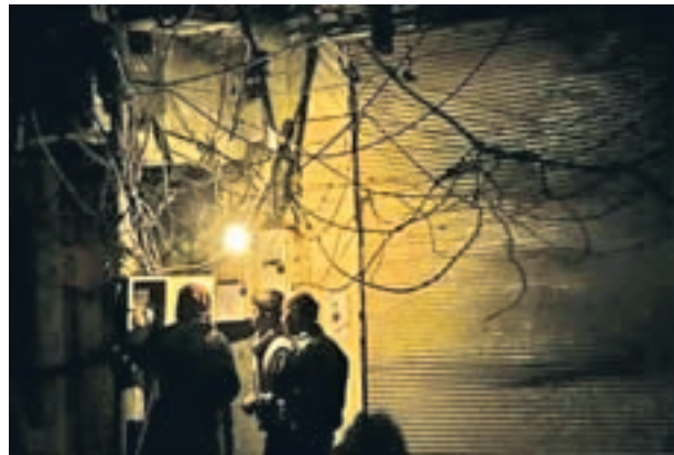
Residents manage an electric box for electricity distributed by generators in eastern al-Ghouta, near Damascus on 19 Nov, 2014.

"The electricity infrastructure itself is in need of wholesale re-building and repair after incessant