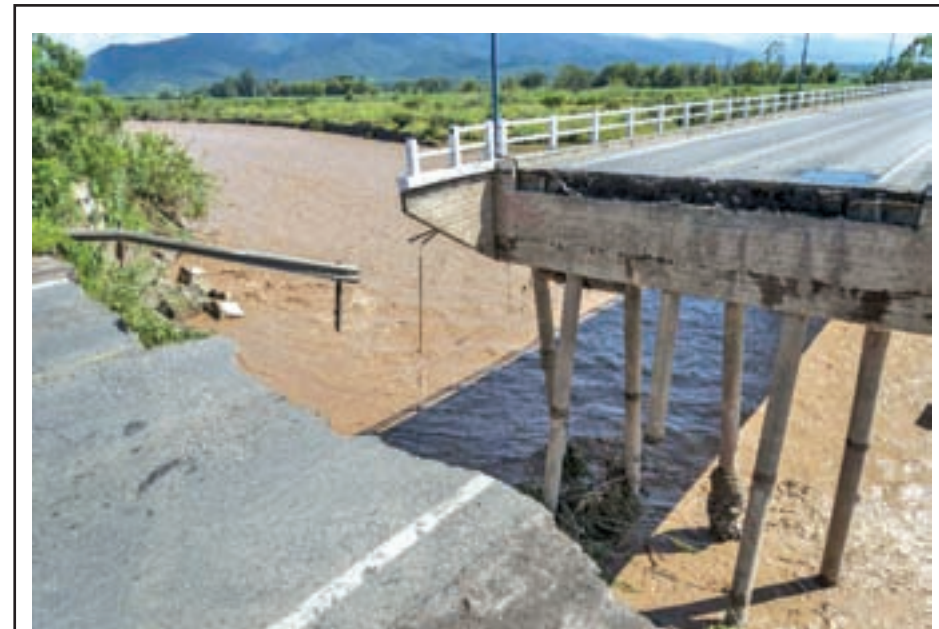
A bridge is damaged by the flooding of the Lules river, in Tucuman Province, Argentina on 11 March, 2015. The heavy rains caused the damage of nine bridges and roads in Tucuman, leaving several villages being cut off.