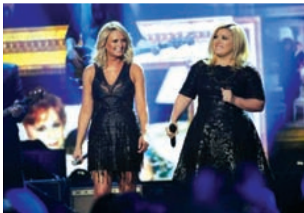
Miranda Lambert (L) and Kelly Clarkson perform during the American Country Countdown Awards in Nashville, Tennessee on 15 Dec, 2014.

Close behind at No. 2 was the soundtrack to