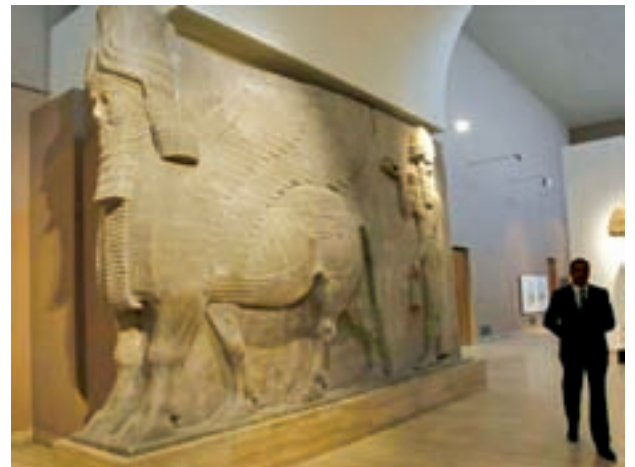
A man walks past human-headed winged bull statues from Khorsabad, at the Iraqi National Museum in Baghdad on 8 March, 2015.

BAGHDAD, 12 March — Islamic State militants have desecrated another ancient Iraqi capital, the government said on Wednesday, razing parts of the 2,700-year-old city of Khorsabad famed for its colossal statues of human-headed winged bulls.