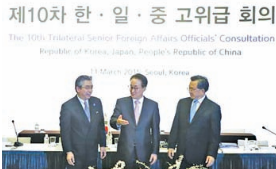
South Korea's Deputy Minister for Political Affairs Lee Kyung-soo (C) leads Japan's Deputy Minister of Foreign Affairs Shinsuke Sugiyama (L) and China's Vice Minister of Foreign Affairs Liu Zhenmin during the tenth Republic of Korea-Japan-China Trilateral Senior Foreign Officials' Consultation at a hotel in central Seoul on 11 March, 2015.

"If the trilateral foreign ministers' meeting is held soon, it will undoubtedly give us the opportunity to re-establish the groundwork for trust-building and common prosperity," South Korea's deputy foreign minister Lee Kyung-soo said.