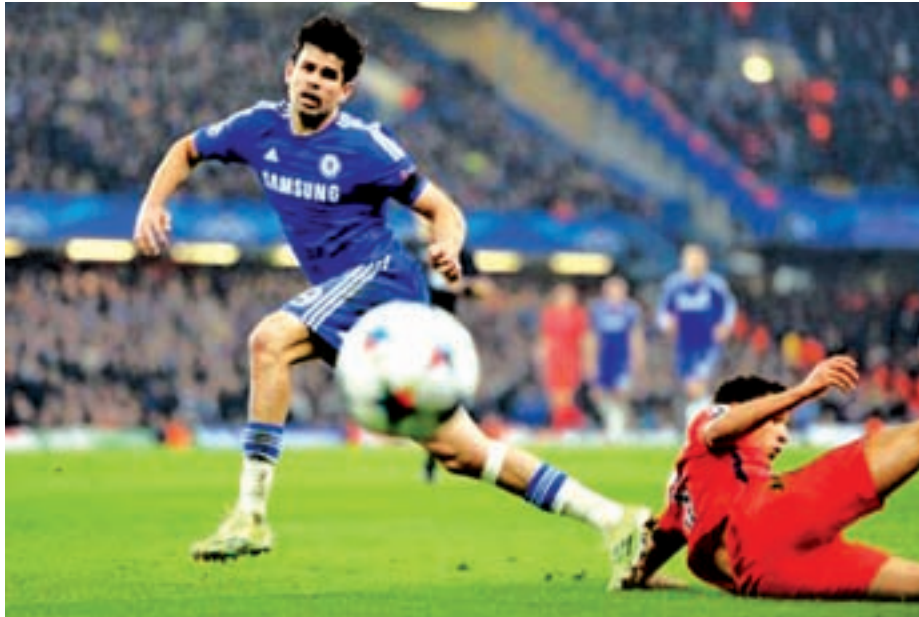
Chelsea's Diego Costa in action during UEFA Champions League Second Round Second Leg at Stamford Bridge, London, England on 11 March, 2015.

The pendulum seemed to swing Chelsea's way when Ibrahimovic saw red for a clumsy challenge on Chelsea midfielder Oscar, but the visitors never gave up the fight against the side that knocked them out at the quarter-final stage last year.