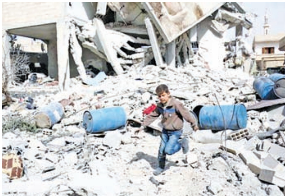
A boy runs over rubble at a site hit on Tuesday by what activists said were airstrikes by forces loyal to Syria's President Bashar al-Assad in the rebel-controlled area of Deir al-Asafir town, near Damascus on 11 March, 2015.