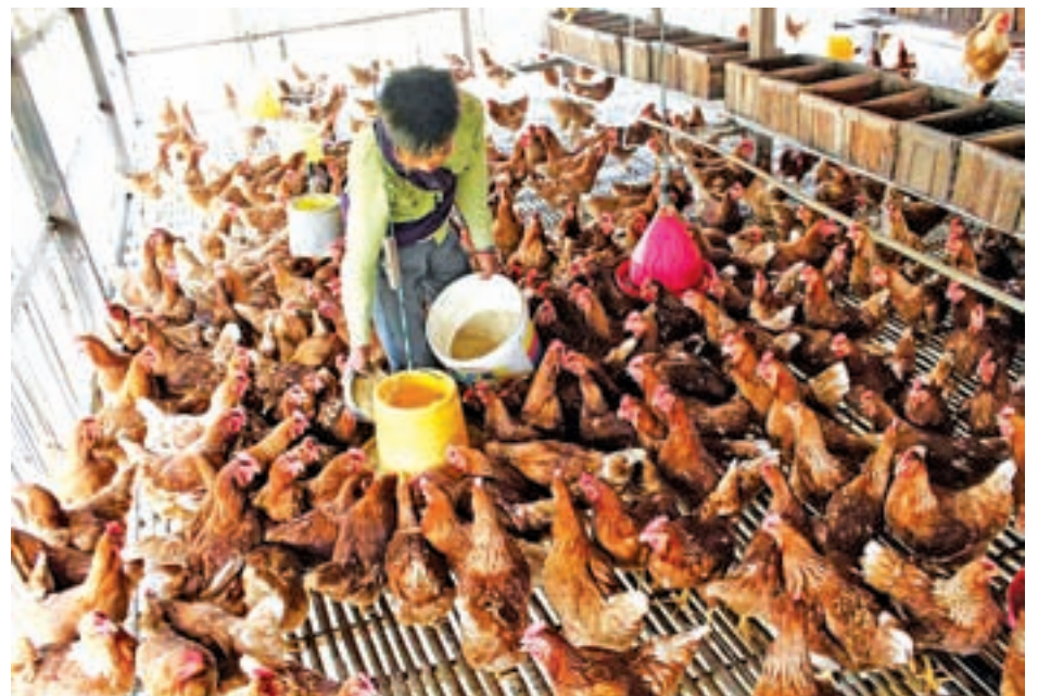
Ministry of Health and Ministry of Livestock, Fisheries and Rural Development are working closely together to prevent H5N1, urging people to follow their instructions on preventing a pandemic.