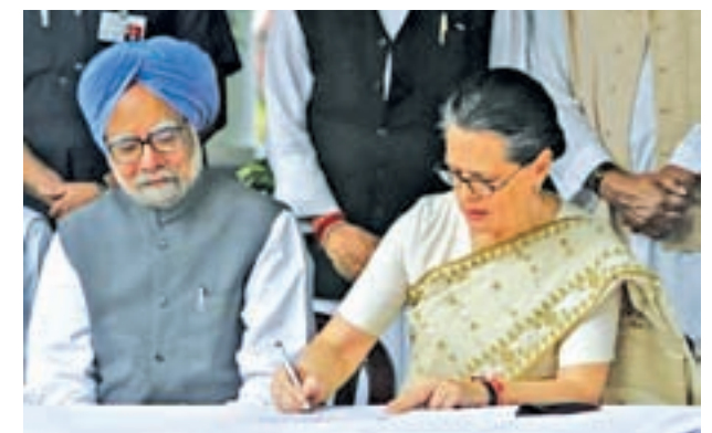
India's ruling Congress party president Sonia Gandhi watched by Prime Minister Manmohan Singh (L) fills nomination papers seeking to retain her post as the party chief at her residence in New Delhi on 2 Sept, 2010.

NEW DELHI, 12 March — The top leadership of India's Congress party including its enigmatic president Sonia Gandhi walked to former Prime Minister Manmohan Singh's home on Thursday in a unusual display of support after he was summoned to court in a corruption case.