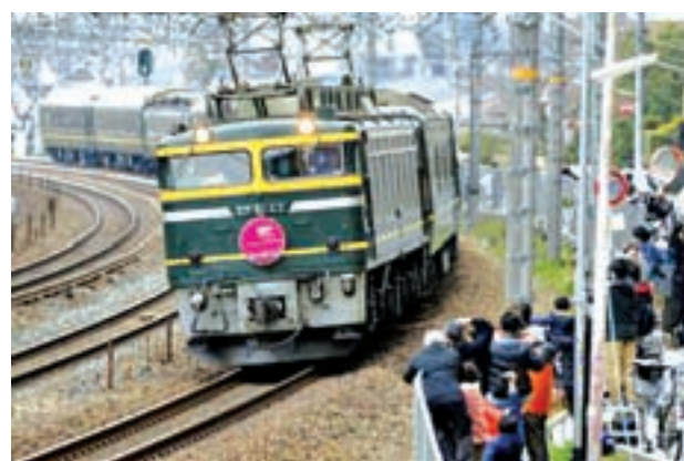
Fans watch the Twilight Express luxury sleeper train in Shimamoto, Osaka Prefecture on 12 March, 2015, its final day of service after running for 26 years between Osaka and Sapporo.