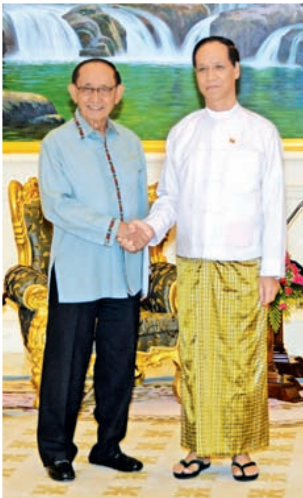
Vice President Dr. Sai Mauk Kham cordially greets former president of the Philippines Mr. Fidel V Ramos.

NAY PYI TAW, 12 March — Vice President Dr. Sai Mauk Kham received a delegation led by former president of the Philippines Mr. Fidel V