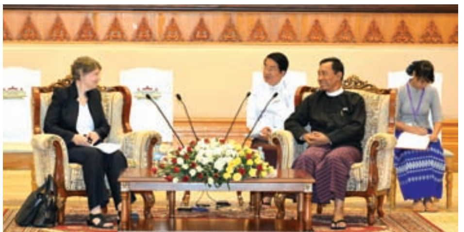
Speaker Thura U Shwe Mann meets Helen Clark, Administrator of the United Nations Development Programme.

The UN delegation was led by Helen Clark, Administrator of the United Nations Development Programme, and Ertharin Cousin, Executive Director of the UN World Food Programme.