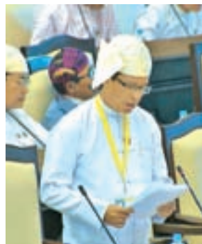
Deputy Minister U Zin Yaw.—MNA