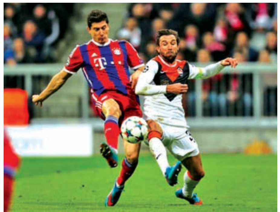
Bayern Munich's Robert Lewandowski (L) vies for the ball during the UEFA Champions League Round of 16 second leg match against Shakhtar Donetsk in Munich, Germany, on 11 March, 2015. Bayern Munich won 7-0.

The Germany international joined Mario Gomez on 26 goals as the top all-time German scorers in the competition.