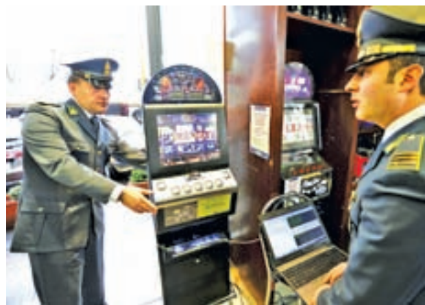
Italian Finance Policemen inspect a slot machine with their computer in a local coffee bar in Rome on 5 Feb, 2015.

ROME, 12 March — Legalizing gambling in Italy was supposed to help curb the mafia. Unfortunately, prosecutors say, it has only created new opportunities for the mob.