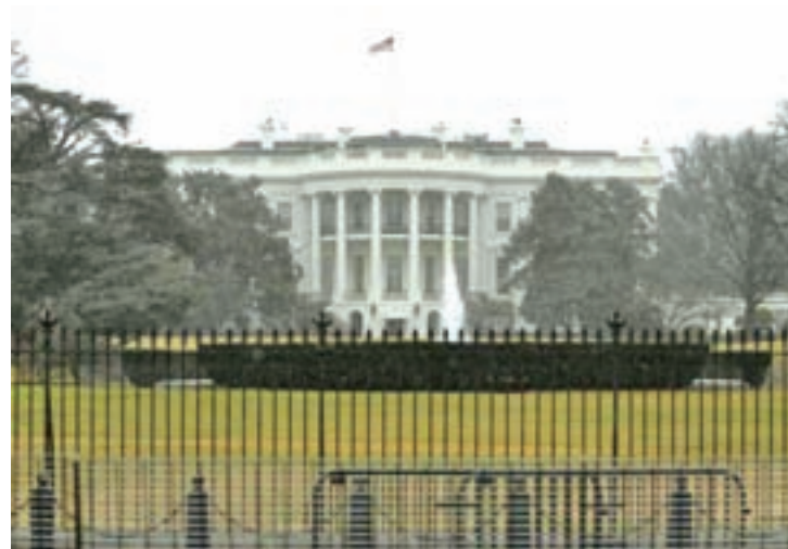
The South Lawn of the White House is pictured in Washington on 26 Jan, 2015.