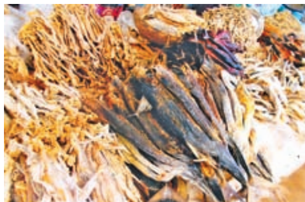
Dried fish on sales at market in Natogyi Township.

Avian influenza was recently reported at some poultry farms in Sagaing Region.—Htay Myint Maung