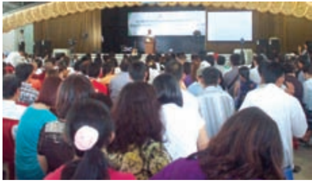
A press conference on handling of student protests by police in progress.

YANGON, 12 March — Civic groups including the Free Funeral Service Society (Yangon) have held a vigil in response to the recent police crackdown on student