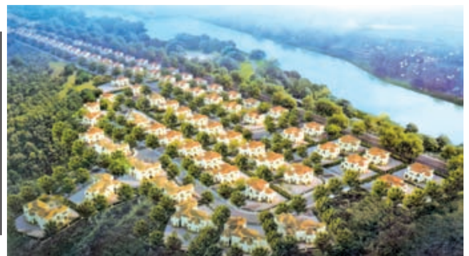
Scale model of villa area included in project of Muse Central Economic Zone.