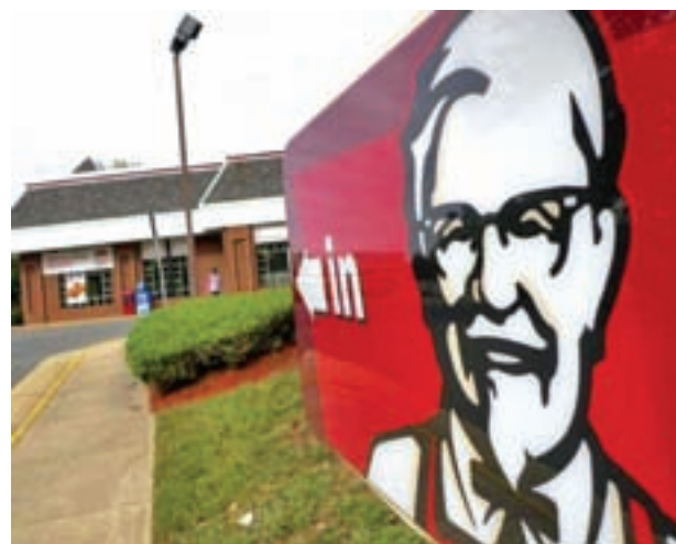
A Kentucky Fried Chicken sign shows the direction to its restaurant in Fairfax, Virginia on 5 Oct, 2010.