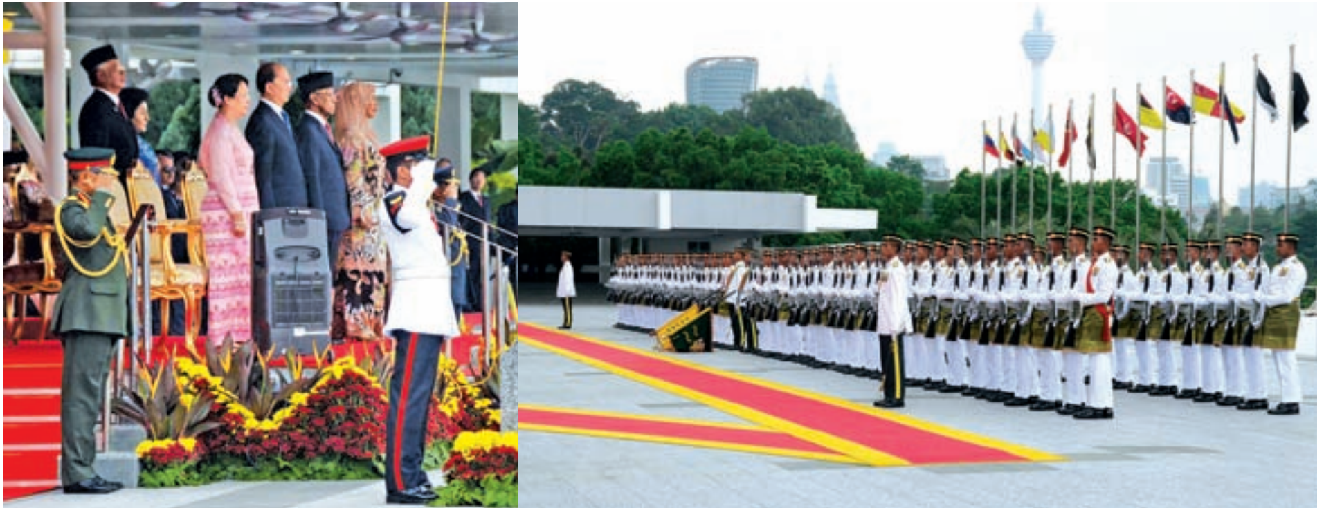
President U Thein Sein and Sultan His Majesty Abdul Halim Mu'adzam Shah of Malaysia take salute of the Guard of Honour at Parliament Square in Kuala Lumpur.

NAY PYI TAW, 12 March — President U Thein Sein began a two-day state visit to Malaysia on Thursday, bringing a Myanmar delegation including cabinet ministers and senior officials. Sultan His Majesty Abdul Halim Mu'adzam Shah and Her Majesty the Raja Permaisuri Agong Tuanku Hajah Hamidah welcomed President