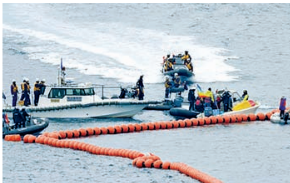
A Japan Coast Guard vessel (L) confronts a boat carrying opponents of the resumption of a seabed-boring survey by the Okinawa Defence Bureau off the Henoko district of Nago in the southernmost prefecture of Okinawa on 12 March, 2015.

In Okinawa, which hosts the bulk of US military installations in Japan, opponents of the plan to build a base on reclaimed