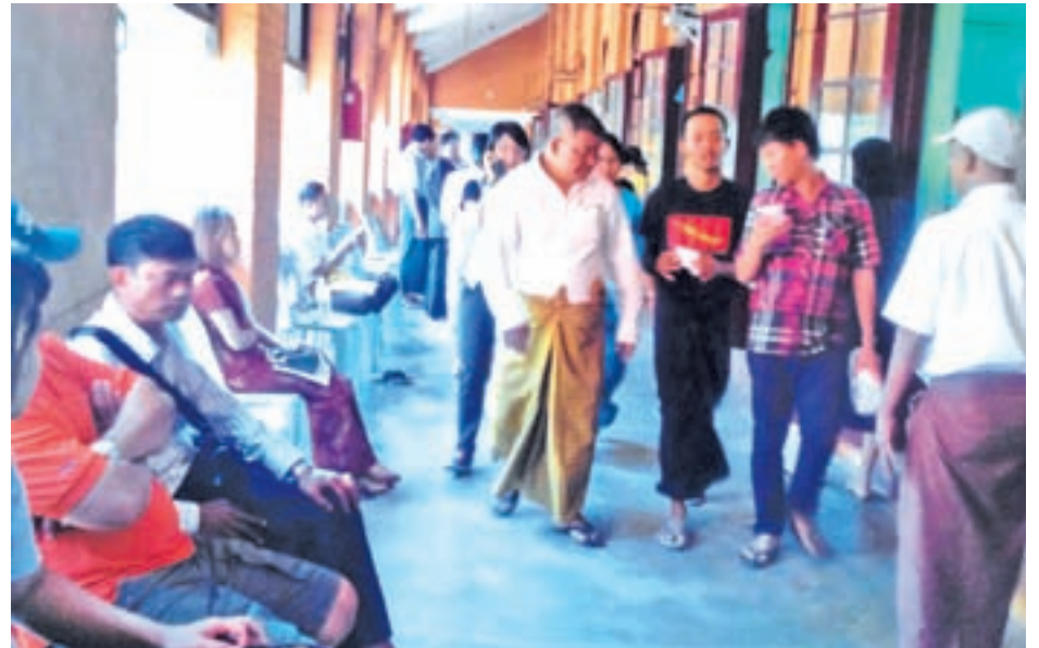
Parents and relatives take 17 student protestors handed over by officials.