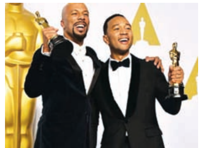
Rapper-actor Common has been on cloud nine since his Oscar win as it has finally made him a household name, after being in the showbiz industry for more than 20 years.

LOS ANGELES, 12 March — Rapper-actor Common has been on cloud nine since his Oscar win as it has finally made him a household name, after being in the showbiz industry for more than 20 years.