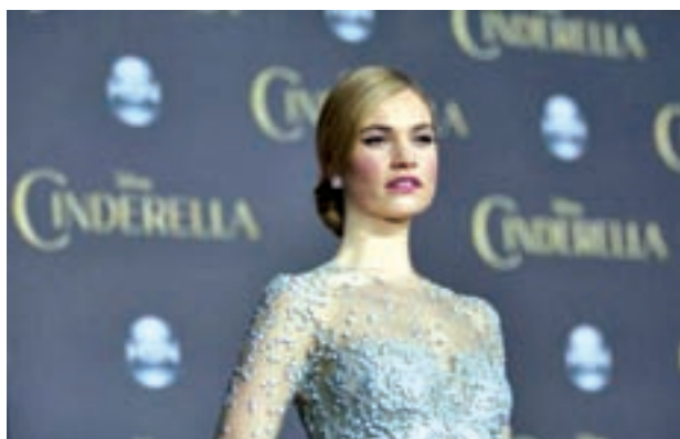
Cast member Lily James poses at the premiere of “Cinderella” at El Capitan theatre in Hollywood, California on 1 March, 2015.

LOS ANGELES, 12 March — Fairy tales and frothy princess gowns might be the perfect draw