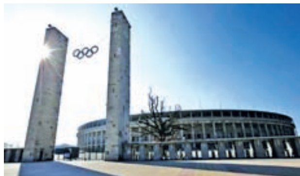
The main entrance of the Olympic stadium is pictured with the Olympic rings in Berlin on 9 March, 2015.