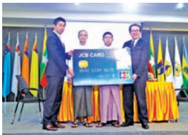
Officials from JCB, MPU and the Central Bank of Myanmar at signing ceremony of master licence agreement for MPU-JCB co-branded card issuing in Myanmar.