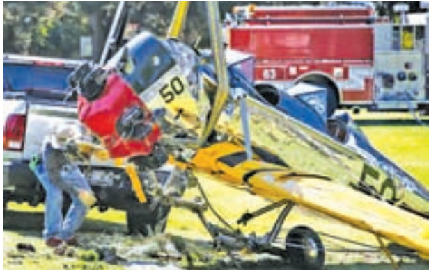
Actor Harrison Ford's damaged airplane is taken away after its crash landing at Penmar Golf Course in Venice, Los Angeles California on 6 March, 2015.