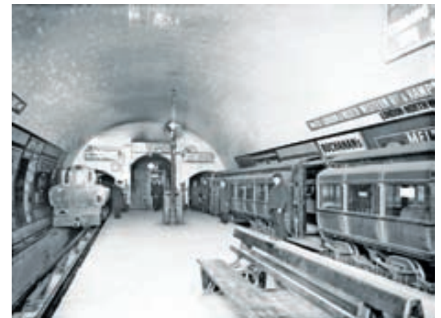
Old underground railway station

In Yangon and perhaps in Mandalay too, we have to