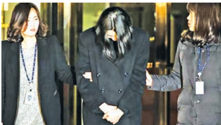
Cho Hyun-ah (C), also known as Heather Cho, daughter of chairman of Korean Air Lines, Cho Yang-ho, leaves for a detention facility after a Korean court ordered her to be detained, at the Seoul Western District Prosecutor’s office on 30 Dec, 2014.

Heather Cho, the airline’s former head of in-flight service and daughter of chairman Cho Yang-ho, was sentenced to a year in jail last month after she was found guilty of violating aviation law over an on-board incident New York’s John F Kennedy airport on 5 December. She had demanded the flight crew chief be expelled from the plane because she was upset over the way she had been