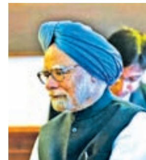
Former India's Prime Minister Manmohan Singh talks to Lesotho's Prime Minister Tom Thabane (not pictured) during a meeting in New Delhi on 11 March, 2014.