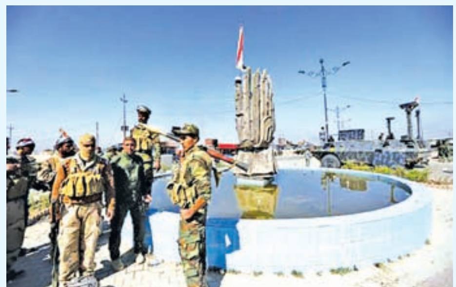
Militias known as Hashid Shaabi stand with their weapons in the town of al-Alam on 10 March, 2015.

There have been fears that the Shi’ite-dominated security forces and militia would seek revenge on lo-