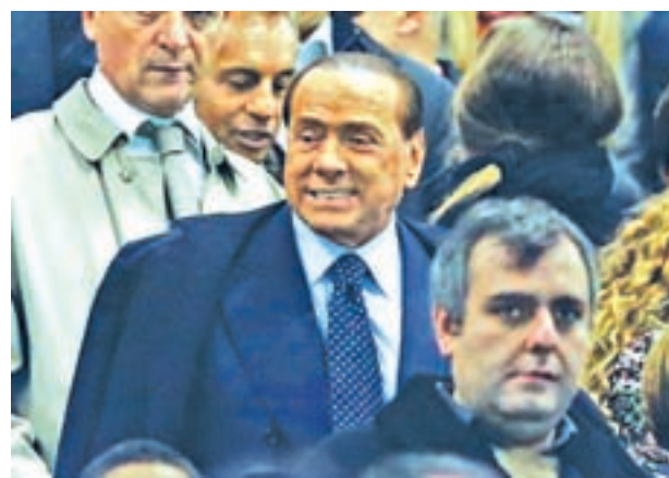
AC Milan's president and former Italian Prime Minister Silvio Berlusconi arrives before the match against Fiorentina at San Siro stadium in Milan, on 26 Oct, 2014.

Berlusconi was accused of paying for sex with former teenage nightclub dancer Kharima El Mahroug, known by her stage name "Ruby the Heartstealer", during "bunga bunga" erotic parties at his palatial home near Milan when he was prime