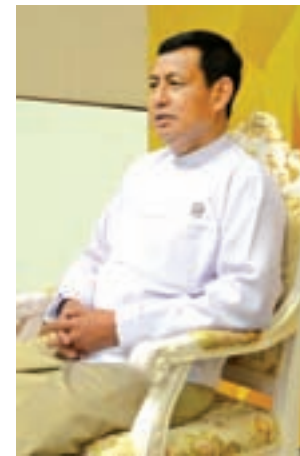
Union Minister for Information U Ye Htut.

The information minister said the government’s handling of the protest will have no impact on democratic reform, stating that when demonstrators on Wall Street were removed by police, or when pro-