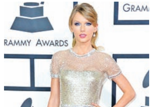
Taylor Swift was said to be "embarrassed" when she found out how much her legs were worth.

LOS ANGELES, 11 March — Pop star Taylor Swift has reportedly got her legs insured for USD 40 million.