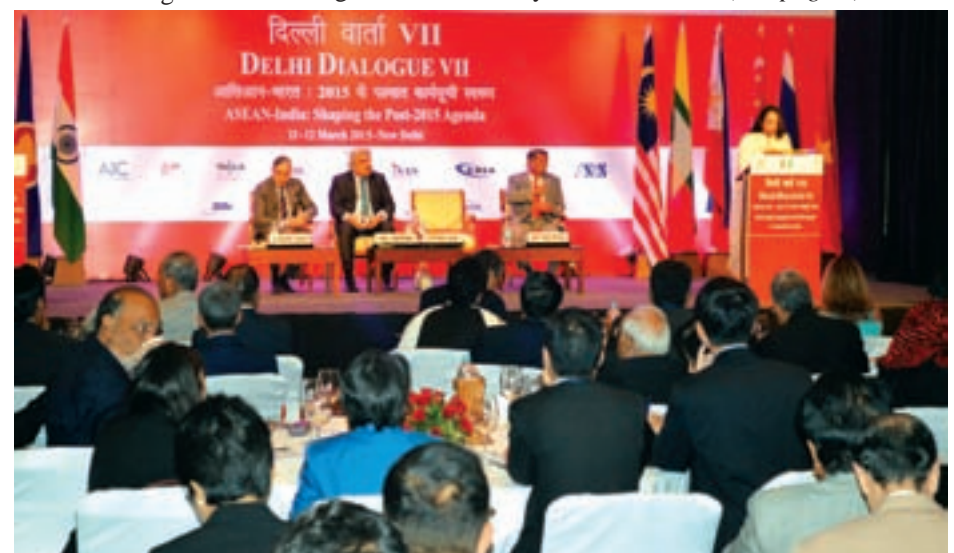
Delegates discuss business cooperation between ASEAN and India on the first day of Delhi Dialogue VII in New Delhi.

opening day of a meeting to strengthen relations between the 10-member (See page 9)