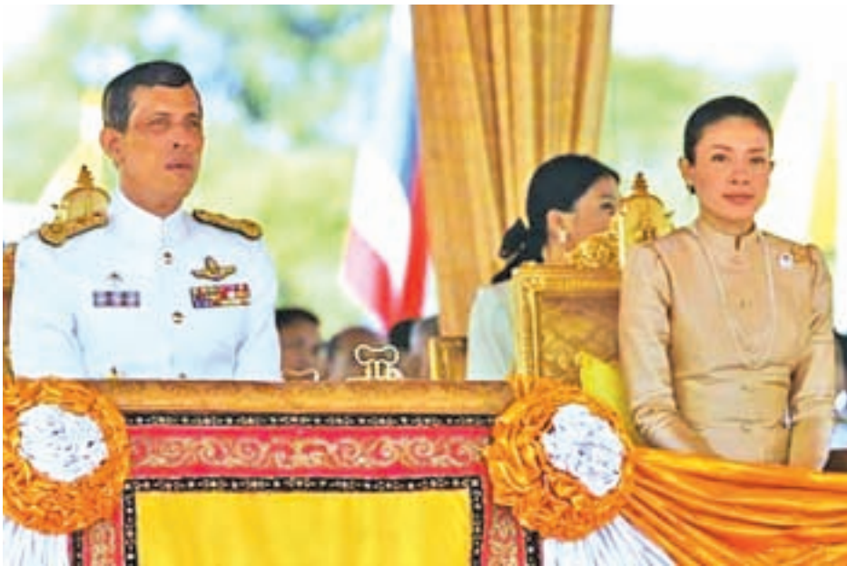
Thailand's Crown Prince Maha Vajiralongkorn (L) and Royal Consort Princess Srirasmi watch the royal ploughing ceremony in Bangkok on 9 May, 2008 in this file picture.

BANGKOK, 11 March — The parents of a former Thai princess were jailed for 2-1/2 years on Wednesday for defaming the monarchy following investigations into the actions of several family members accused of corruption and misusing their royal connection.