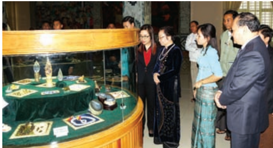
Vietnamese Vice President Madam Nguyen Thi Doan visits Myanmar Gems Museum in Nay Pyi Taw.

NAY PYI TAW, 11 March — Vice President Madam Nguyen Thi Doan of the Socialist Republic