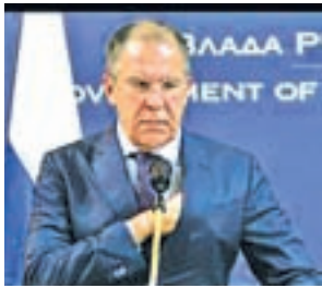
Russian Foreign Minister Sergei Lavrov

Moscow, 11 March — We wish our Western partners paid equal attention to international law issues in the bombing campaign against Yugoslavia, situation in Kosovo and Libya's collapse as they do when they speak about Crimea, Russian Foreign Minister Sergei Lavrov said on Tuesday.