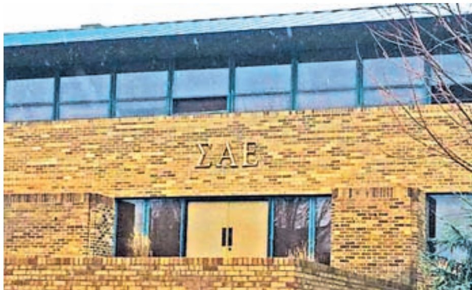
The Sigma Alpha Epsilon fraternity is seen at the University of Oklahoma in Norman, Oklahoma on 9 March, 2015.

OKLAHOMA CITY, 11 March — The University of Oklahoma has expelled two students for playing a leadership role in singing a racist song at a fraternity-linked event that was captured on video and viewed worldwide, the school's president said on Tuesday.