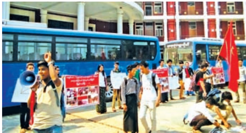
Students of Yadanabon University stage protest without permission.