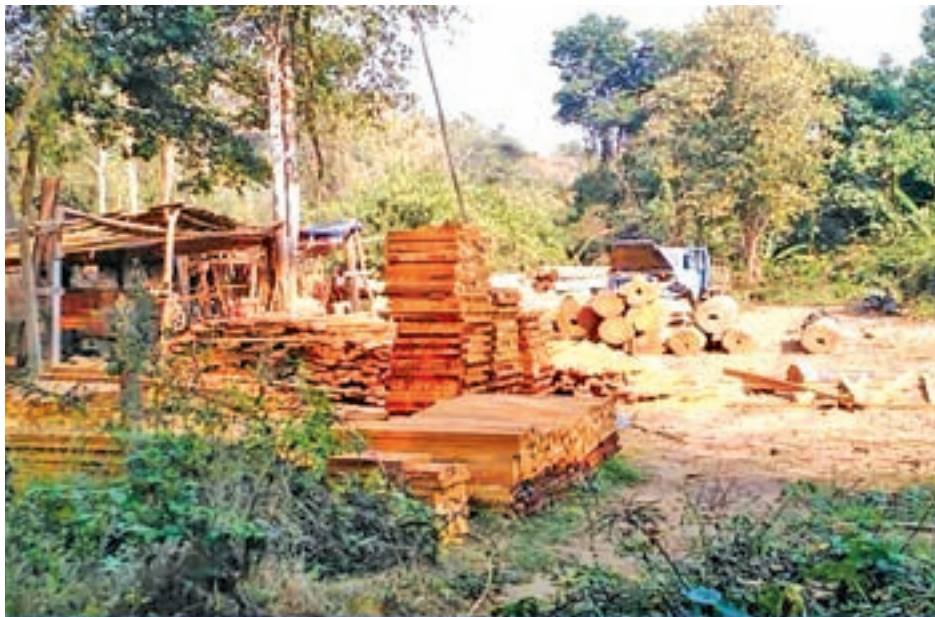
Military columns seize teak logs, saw mills, vehicles and pieces of sawn timber in military operations.

NAY PYI TAW, 11 March — Military columns confiscated teaks, vehicles and saw mills in Kachin and Shan states from February 15 to March 10. Defence Services personnel are taking part in control of illegal trafficking in drug and natural resources in cooperation with other departmental officials.