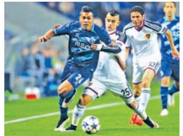
Porto's Alex Sandro Lobo (L) fights for the ball with FC Basel's Derlis Gonzalez during their Champions League round of 16 second leg soccer match at Dragao stadium in Porto on 10 March, 2015.

With Porto beginning to get up a head of steam, the match was broken up by a serious injury to the hosts' captain Danilo, who was flattened by his own keeper Fabiano, as the Brazilian came to head a long ball away.—Reuters