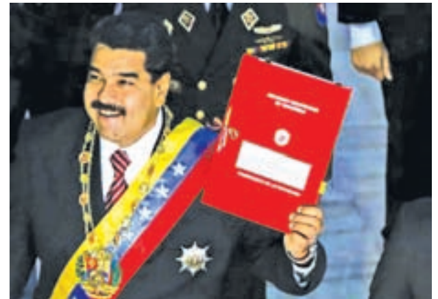
Venezuela's President Nicolas Maduro shows up his petition for decree powers while arriving at the national assembly in Caracas on 10 March, 2015.

A visa ban and financial block were slapped on seven officials, ranging from the head of national intelligence and a state prosecutor to the national police chief and various military officers, for their alleged role in repressing Maduro's domestic opponents or corruption. Maduro hailed the seven as "heroes" and named one interior minister.