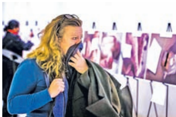
A woman reacts as she looks at a gruesome collection of images of dead bodies taken by a photographer, who has been identified by the code name “Caesar,” at the United Nations Headquarters in New York on 10 March, 2015. The pictures were smuggled out of Syria between 2011 and mid-2013.

An Israeli security official had said Musallam went to Syria to fight for Islamic State in October last year.—Reuters