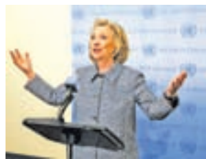
Former US Secretary of State Hillary Clinton speaks during a Press conference at the United Nations in New York on 10 March, 2015.

"I opted for convenience to use my personal email account, which was allowed by the State Department, because I thought it would be easier to carry just one device