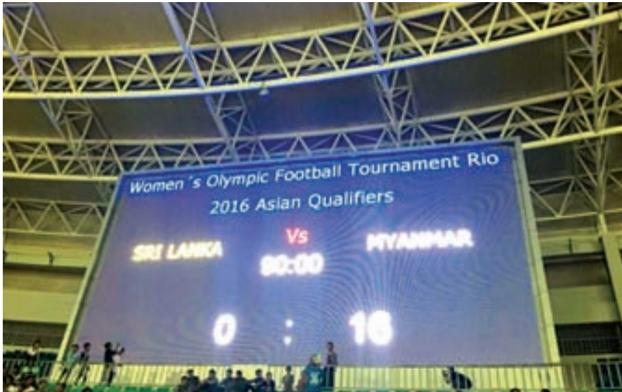
Myanmar women thrash Sri Lankans with 16-0 in Asian qualifiers of the Women's Olympic football tournament Rio 2016.