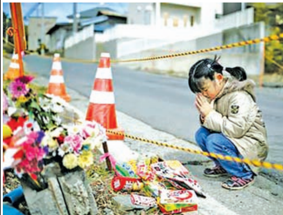
A girl in the northeastern Japan city of Ishinomaki prays on 11 March, 2015, for her friends killed in the deadly earthquake and tsunami that struck on the same day four years earlier. The disaster left more than 18,000 people dead or missing and triggered the continuing Fukushima nuclear crisis.