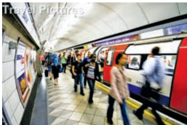
Modern underground railway station

tivity towards nation building. Arrival of new cars in Yangon and other cities must be welcome. Introduction of new vehicle import policies has benefited many middle class families, who otherwise could not have afforded sky rocket high car prices just 4 years ago. Government has adjusted the car policy several times over the last 3 years to mitigate the congestion of traffic in the big cities particularly in Yangon and Mandalay. Among many regulations in relation to car inputs and production, there should be one rule, very important to