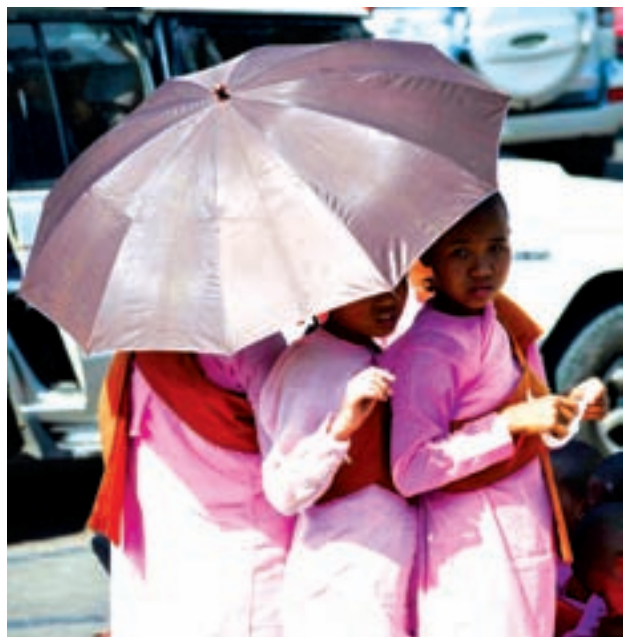
Buddhist nuns use an umbrella with UV protection to shield themselves from UV rays in Yangon.