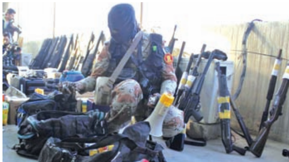
A paramilitary soldier displays weapons recovered during a raid on the Muttahida Qaumi Movement (MQM) political party’s headquarters in Karachi on 11 March, 2015.

MQM’s opponents say the party engages in extortion and frequently kills opposition activists. The MQM denies the allegations, saying its own party workers are targeted by others. Mehmood said the raid was not politically motivated, but prompted by news that several wanted men were at the headquarters, including one sentenced