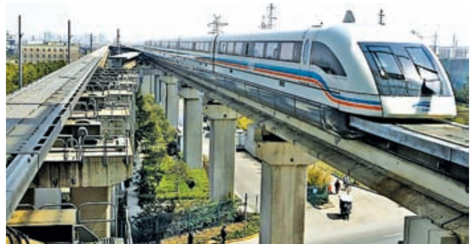
Modern sky train in operation

commercial vehicles which the owners want to continue using. They must nevertheless pass very stringent technical tests and licensing procedures and pay for double or triple annual license fees. Then gradually another regulation could as well be introduced that "only brand new vehicles will be imported or assembled or manufactured in the country". But the latter option could be still some years down the road. Regardless of whatever car policies are in place, we definitely cannot expect less traffic jams or reduced vehicles on the