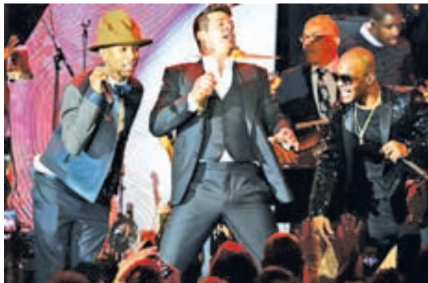
Pharrell Williams (L), Robin Thicke and TI perform at the Clive Davis Pre-Grammy Gala and Salute to Industry Icons, honoring Universal Music Group Chairman and CEO Lucian Grainge, in Beverly Hills, California in this 25 Jan, 2014 file photo.