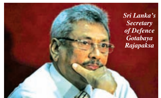
Sri Lanka's Secretary of Defence Gotabaya Rajapaksa

Gotabaya Rajapaksa, who oversaw the military defeat of Tamil Tiger separatists after a 26-year war, is also being investigated by police over abductions, assaults and murders during his brother's time in office. Government spokesman Rajitha Senarathne accuses Gotabaya Rajapaksa of maintaining a "private military" with the floating armoury. Gotabaya Rajapaksa, who has previously denied wrong doing, was not immediately available for comment.—Reuters