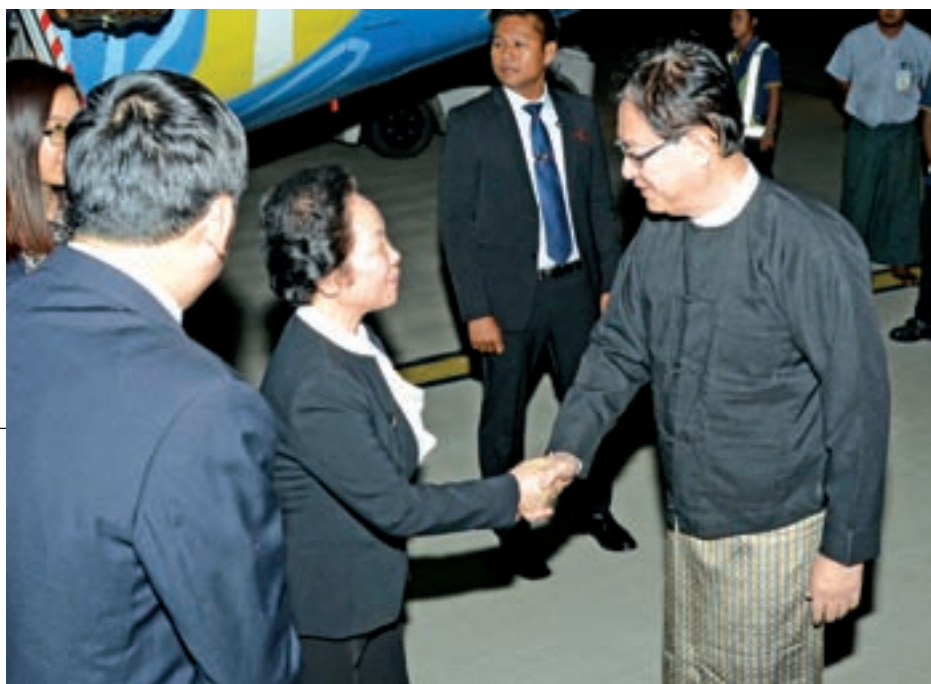
Deputy Minister U Thant Kyaw welcomes Vice President Madam Nguyen Thi Doan of SRV at Nay Pyi Taw International Airport.—MNA

The Vietnamese delegation was welcomed at the airport by Deputy Minister for Foreign Affairs U Thant Kyaw and officials.—MNA