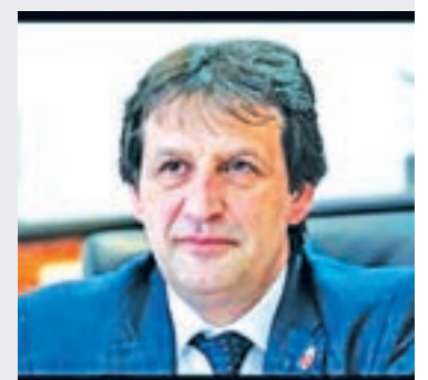
Defence Minister Bratislav Gasic

During the meeting, Gasic pointed to our country’s mil-