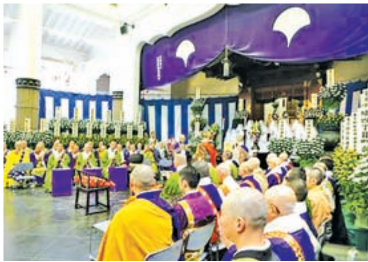
Photo taken on 10 March, 2015, in Tokyo shows a memorial service to commemorate the victims of the Great Tokyo Air Raid on its 70 th anniversary.

the United States attacked other cities and towns across Japan, before eventually dropping atomic bombs on Hiroshima on 6 August and on Nagasaki on 9