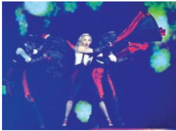
Singer Madonna performs at the BRIT music awards at the O2 Arena in Greenwich, London on 25 Feb, 2015.

The album's 19 tracks includes lush, lyrical ballads, such as "Devil Pray," "Ghosttown" and "Joan of