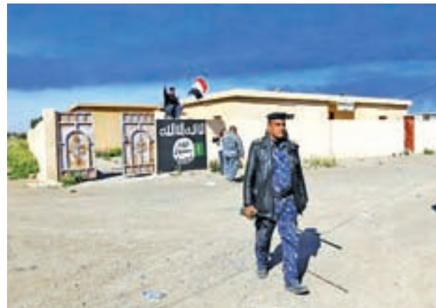
An Iraqi officer walks past a wall painted with the black flag commonly used by Islamic State militants, in the town of Tal Ksaiba, near the town of al-Alam on 7 March, 2015.