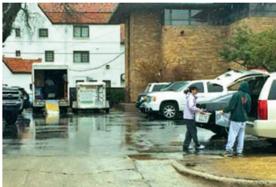
People load goods into moving trucks at the back of the Sigma Alpha Epsilon fraternity at the University of Oklahoma in Norman, Oklahoma, on 9 March, 2015.

It was not immediately clear when the video of students on a bus chartered for a date night was taped.