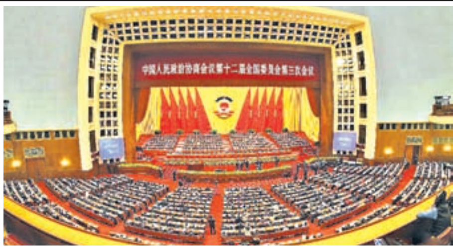
The third plenary meeting of the third session of the 12 th National Committee of the Chinese People's Political Consultative Conference (CPPCC) is held at the Great Hall of the People in Beijing, capital of China, on 10 March, 2015.