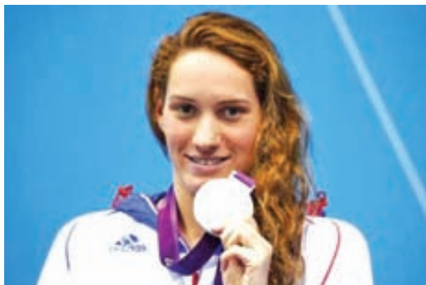
Olympic swimmer Camille Muffat

It added that several members of the ALP TV production company in-