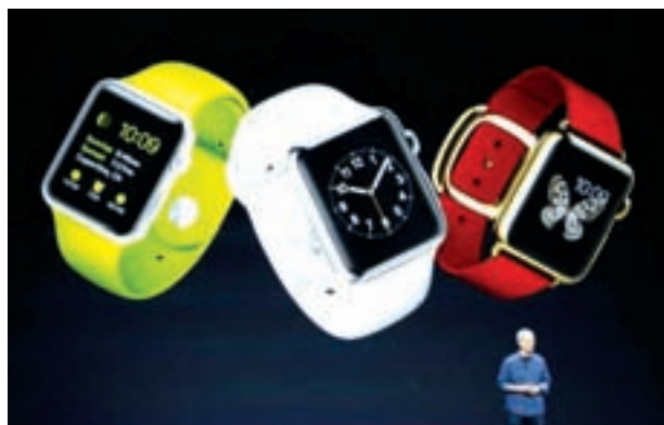
Apple CEO Tim Cook speaks about the Apple Watch during an Apple event at the Flint Center in Cupertino, California, on 9 Sept, 2014.

The Edition price tag which is inexpensive com-