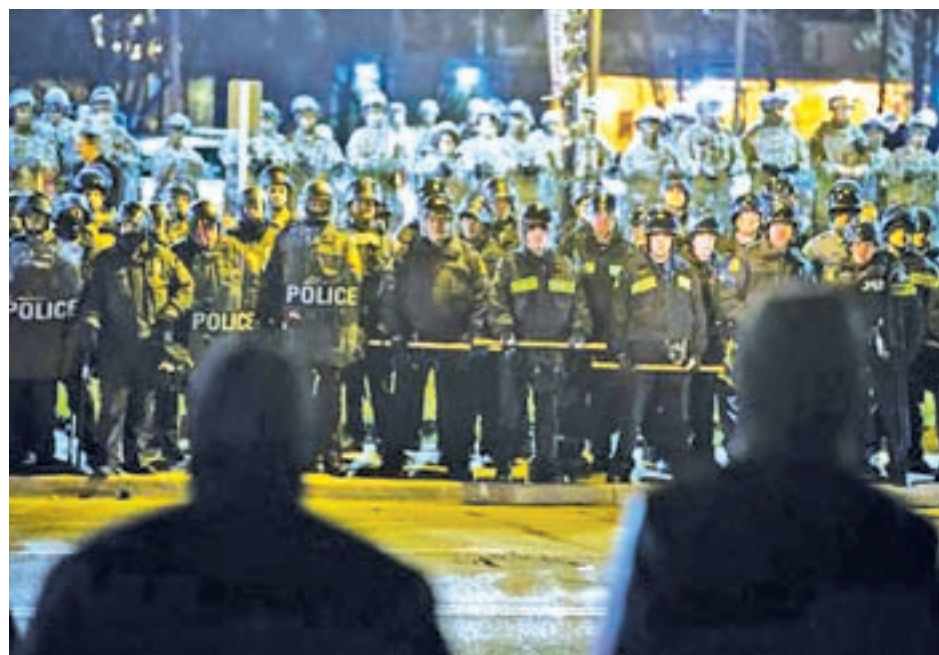
Protesters stare at a line of police officers and National Guard soldiers during a protest to demand justice for the killing of 18-year-old Michael Brown, outside the Ferguson Police Department in Ferguson, Missouri in this file photo taken on 28 Nov, 2014.