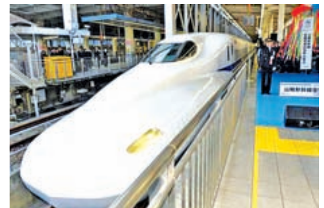
A Shinkansen bullet train departs JR Hakata station in Fukuoka Prefecture, southwestern Japan, on 10 March, 2015, during a ceremony to commemorate the 40th anniversary of the opening of the extended Sanyo Shinkansen Line. —KYODO NEWS

Insurance Australia Group (IAG.AX) is facing 3,500 claims totalling up to A$90 million ($70 million), although the state's mining and agricultural sectors suffered little damage. —Reuters