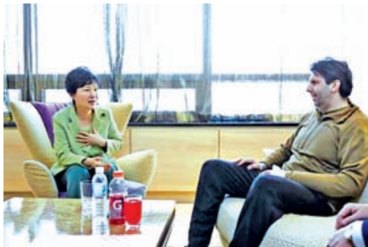
South Korean President Park Geun-hye (L) talks with US ambassador to South Korea Mark Lippert during her visits to a hospital where he is being treated after a knife attack, in Seoul in this handout picture provided by The Blue House and released by Yonhap on 9 March, 2015.

SEOUL, 10 March — The US ambassador to South Korea left a Seoul hospital on Tuesday, five days after he was slashed by a knife-wielding Korean nationalist with a history of violent protest, causing wounds that required 80 stitches to the envoy’s face.