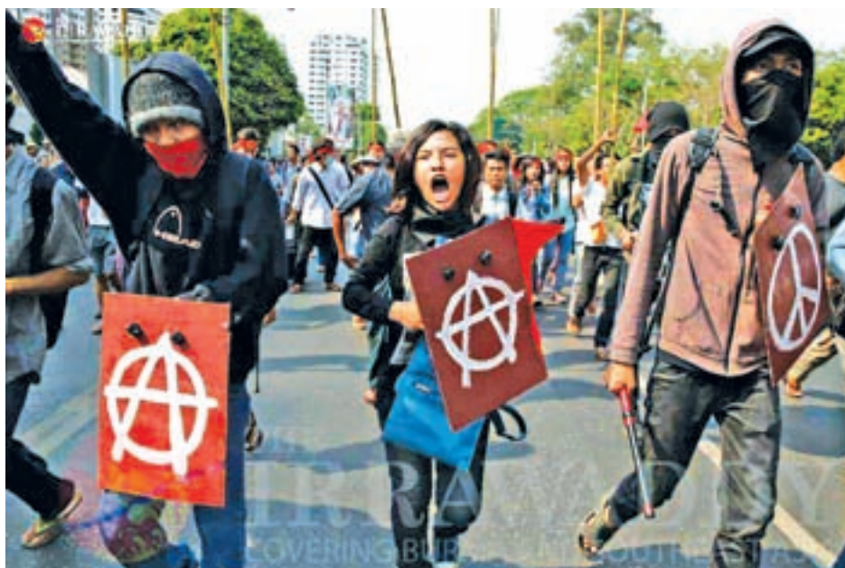
Protesters march near Hledan junction in Kamayut Township.

A participant said the rally called for coordination and negotiation on the disputed education law, raising concern over the negative effects the ongoing student protests might have on the matriculation examinations, which are scheduled for 11 March. The rally sought permission from local authorities.