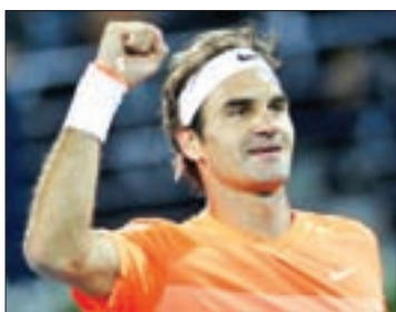
Roger Federer of Switzerland celebrates after winning his final match against Novak Djokovic of Serbia at the ATP Championships tennis tournament in Dubai, on 28 Feb, 2015.

NEW YORK, 10 March — Roger Federer is proud of all his grand slam singles titles, but if the Swiss master could add just one more to his record men's haul of