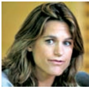
Former French tennis player Amelie Mauresmo speaks during a news conference at the French Open Tennis tournament at the Roland Garros stadium in Paris in this file photo taken on 8 June, 2014.

NEW YORK, 10 March — Amelie Mauresmo, a two-time grand slam winner and the first French woman to be ranked number one, was elected to the International Tennis Hall of Fame, organizers said on Monday.