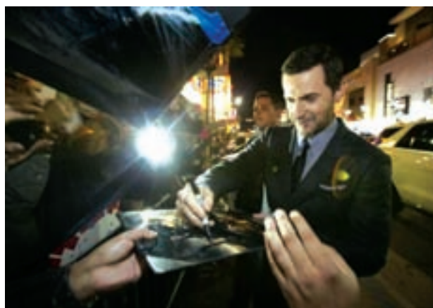
Cast member Richard Armitage signs autographs at the premiere of "The Hobbit: The Battle of the Five Armies" at Dolby theatre in Hollywood, California on 9 Dec, 2014.