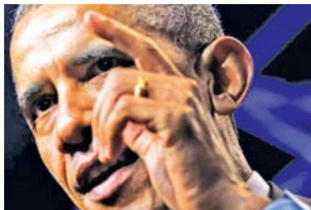
US President Barack Obama gestures as he delivers remarks at the National League of Cities annual Congressional City Conference in Washington on 9 March, 2015.

"We are deeply concerned by the Venezuelan government's efforts to escalate intimidation of its political opponents," he added.