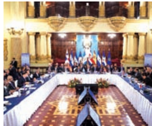
Guatemala's President, Otto Perez Molina (C) delivers a speech during the opening of the Summit of the Central American Integration System (SICA, for its acronym in Spanish) and Spain, in the National Culture Palace, in Guatemala City, capital of Guatemala, on 9 March, 2015. According to the local press, Spain's Prime Minister, Mariano Rajoy, is in Guatemala for an official two-day visit where he participates in the Summit of the SICA and Spain.