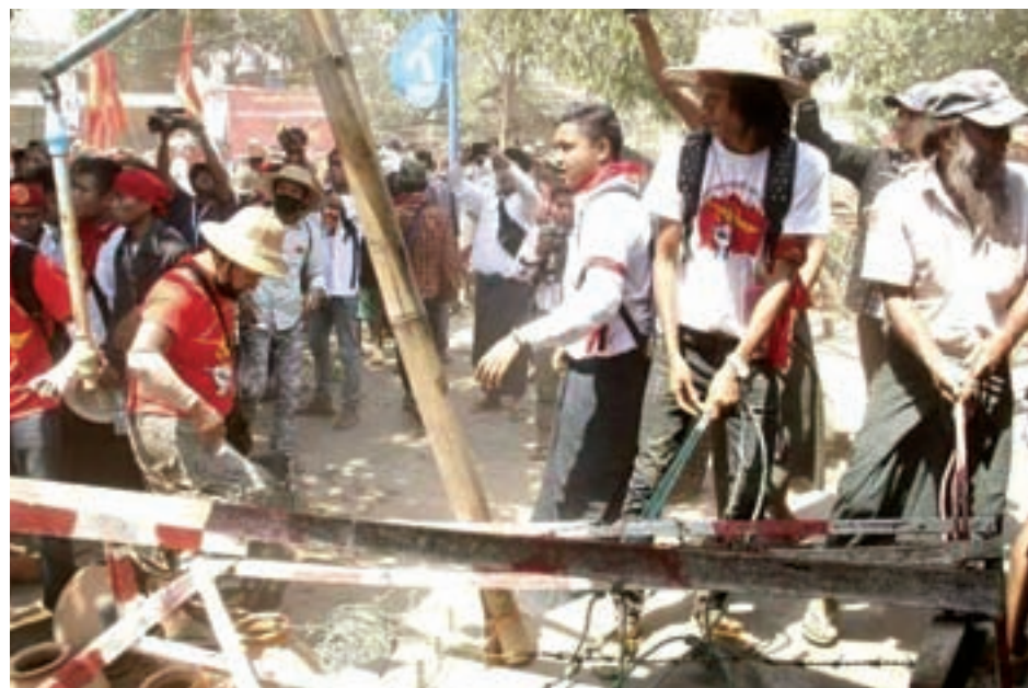
Protesters are violence in destroying police barriers at Letpadan protest site.