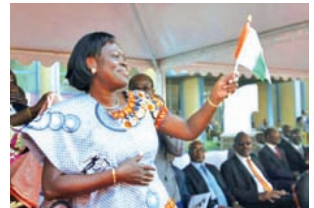
Simone Gbagbo, wife of former Ivory Coast’s President Laurent Gbagbo, gestures during the opening ceremony of celebrations marking the 50 th anniversary of the country’s independence, at the presidential palace in Abidjan on 31 Jan, 2010.

ABIDJAN, 10 March — A court in Ivory Coast on Tuesday found former first lady Simone Gbagbo guilty of charges related to her role in a 2011 post-election crisis in which around 3,000 people were killed, sentencing her to 20 years in prison, her lawyer said.