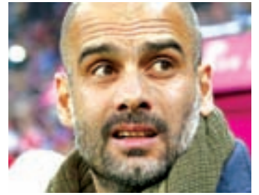
Bayern Munich's coach Pep Guardiola stands on the sidelines during their German first division, Bundesliga soccer match against FC Cologne, in Munich on 27 Feb, 2015.