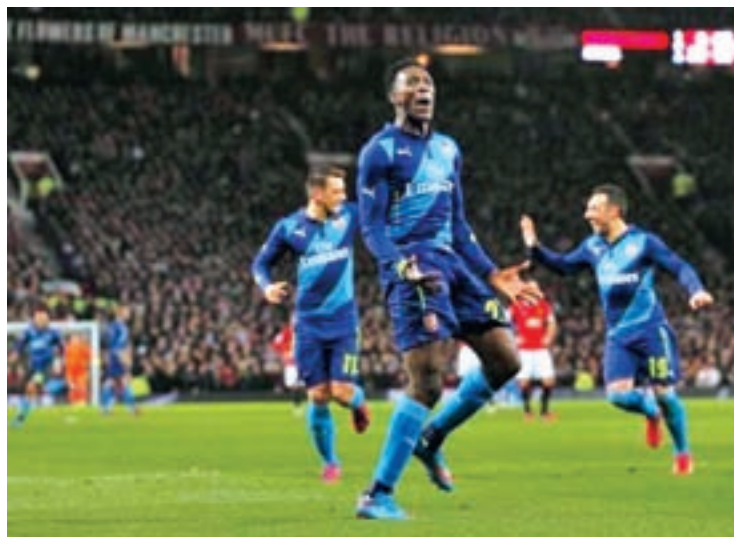
Arsenal's Danny Welbeck celebrates scoring their second goal during FA Cup Quarter Final at Old Trafford on 9 March, 2015.