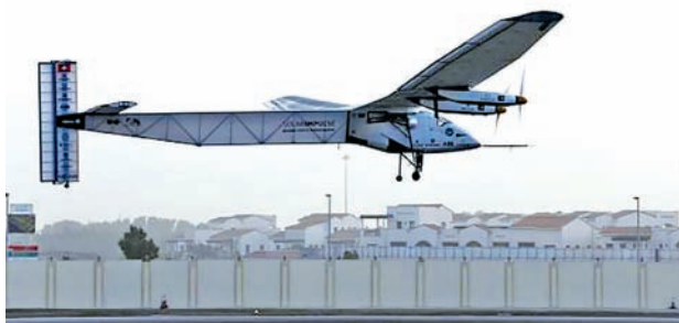
The Solar Impulse 2 takes off at Al Bateen airport in Abu Dhabi, at the start of an attempt to fly around the world in the solar-powered plane on 9 March, 2015.

DUBAI, 9 March — Two pilots attempting the first flight around the world in a solar-powered plane began the maiden leg of their voyage on Monday, the mission's official website said.