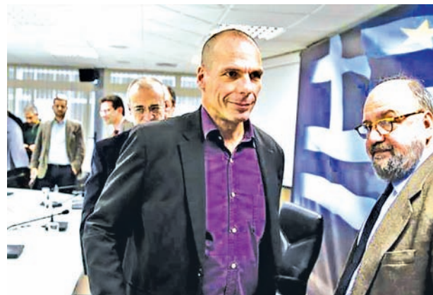
Greek Finance Minister Yanis Varoufakis leaves following a news conference to present the ministry's new general secretaries at the ministry building in Athens on 4 March, 2015.

later on Sunday, the Greek Finance Ministry said that Varoufakis was responding to a hypothetical question and that any referendum would "obviously regard the content of reforms and fiscal policy" and not whether to stay in the euro, as Corriere della Sera had suggested. Most Greeks want the country to keep the euro, but two-thirds also continue to back the government's tough stance to renegotiate the bailout package.