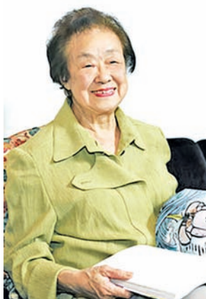
File photo taken in October 2010 shows Japanese children's book author Miyoko Matsutani, known for her work "Tatsunoko Taro" (Taro the Dragon Boy) and the "Chiisai Momo-chan" (Little Momo) series. Matsutani died of old age at a Tokyo hospital on 28 Feb, 2015, at 89, her family said on 9 March.