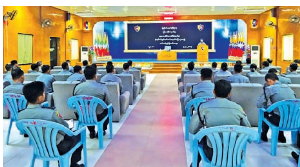
On-job training given to police officers to be able to discharge duty of rule of law and order.