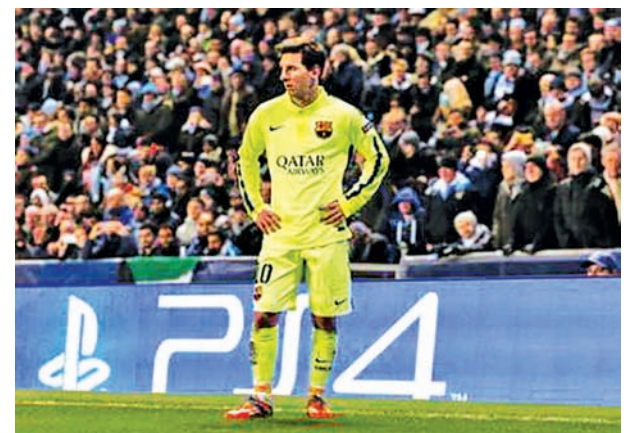
Barcelona's Lionel Messi during UEFA Champions League Second Round First Leg at Etihad Stadium, Manchester, England on 24 Feb, 2015.