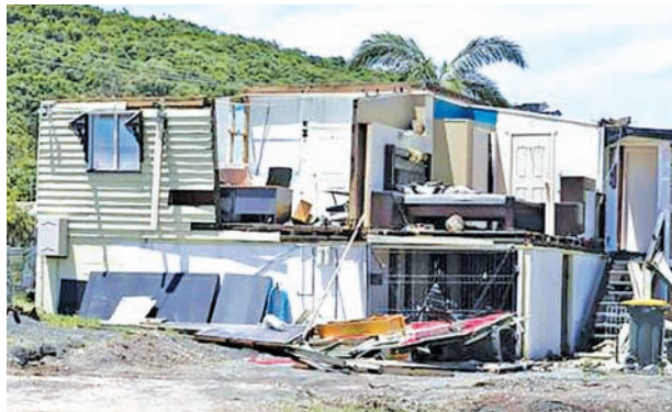
A home damaged by Cyclone Marcia is pictured without a roof and with some walls gone in the coastal town of Yeppoon, on 21 Feb, 2015.