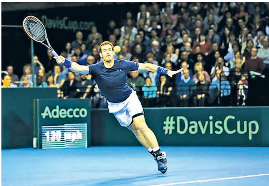
Great Britain's Andy Murray in action against United States of America during Davis Cup World Group First Round at Emirates Arena, Glasgow, Scotland on 8 March, 2015.

For the second year running Andy Murray led Britain to a first-round victory over