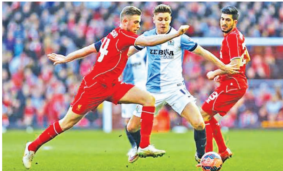
Blackburn Rovers Tom Cairney in action against Liverpool's Jordan Henderson.