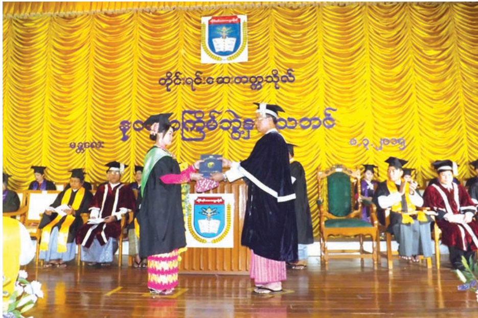
MANDALAY, 9 March — The latest crop of graduates from Mandalay's University of Traditional Medicine received their degrees recently at a convocation ceremony at the higher learning institution. Rector of the univer-