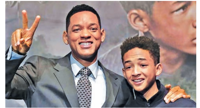
Will Smith's son Jaden has revealed his father is teaching him how to drive.

"When I was younger, my brother and I toured with my mom's band, Wicked Wisdom, so heavy metal was one of the first types of music I heard a lot and I'm still really inspired by it. "I'm into Lolawolf, Tune-Yards, the Runaways, Pink Floyd, and I freaking love Bikini Kill! My mom listens to my playlists on Hype Machine all the time and I listen to hers — that's how I found out about Radiohead and Lamb of God."