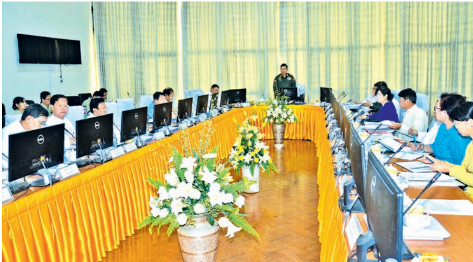
The meeting on compilation of human rights report in progress.

NAY PYI TAW, 9 March — The Leading Committee for Compiling the Human Rights Report on Myanmar held the second meeting at the Ministry of Home Affairs, here, on Monday, with an address by Chairman of the leading committee Union Minister for Home Affairs Lt-Gen Ko Ko.