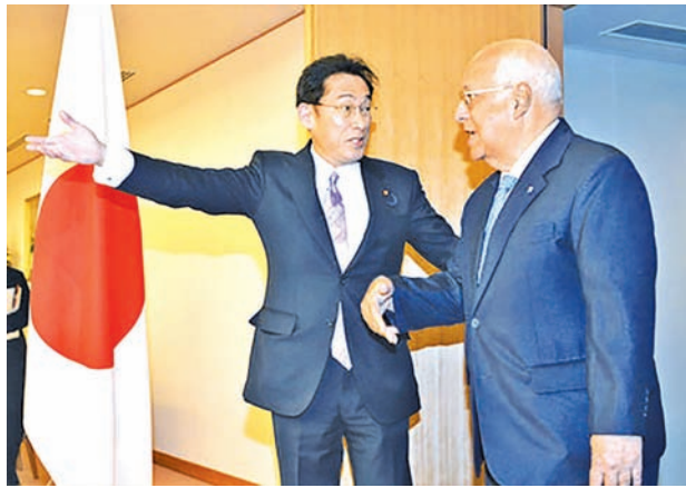
Japanese Foreign Minister Fumio Kishida (L) guides Ricardo Cabrisas, vice president of Cuba's Council of Ministers, into a room at the Foreign Ministry in Tokyo on 9 March, 2015.

“I would like to continue to strengthen our relations in wide-ranging areas and hold a frank dialogue,” Kishida was quoted by the Foreign Ministry as saying