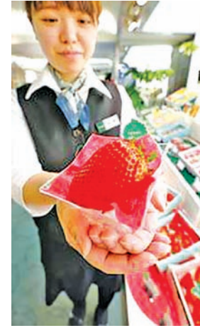
Photo taken on 5 March, 2015 shows a giant strawberry, called a "Skyberry," being sold at a fruit shop in Tokyo. Skyberry producers in the eastern Japan prefecture of Tochigi spent 17 years creating the new kind of strawberry.