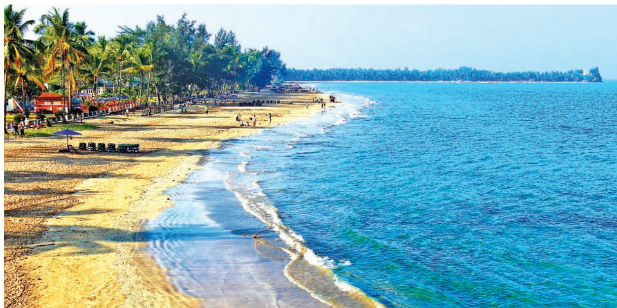
A panoramic view on Ngwehsaung Beach, nearly 48 km west of Pathein, with visitors.