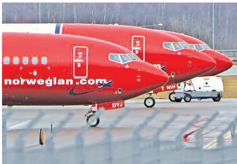
Parked Boeing 737-800 aircrafts belonging to budget carrier Norwegian Air are pictured at Stockholm Arlanda Airport on 6 March, 2015.