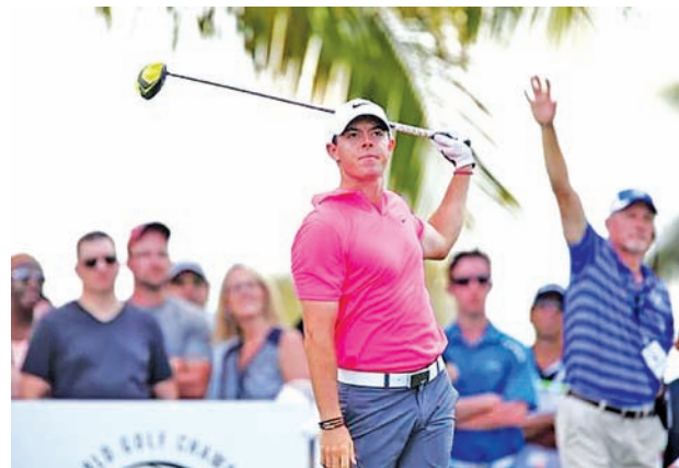
Rory McIlroy reacts to his tee shot on the second hole during the third round of the WGC in Cadillac Championship golf tournament at TPC Blue Monster at Trump National Doral, Miami, FL, USA on 7 March, 2015.

MIAMI, 9 March — With one tournament left to prepare for his bid to complete a career grand slam at next month's Masters, Rory McIlroy says he is disappointed with his form and his 'tentative' approach to shots.