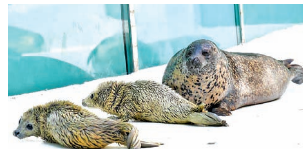
Newly-born harbor seal calves stay with their mother at Sunasia Ocean World in Dalian, northeast China's Liaoning Province, on 5 March, 2015. A harbor seal gave birth to twins on Wednesday morning, weighing 8.8 and 8.2 kilograms respectively. The elder calf was left to its mother and the younger one had to be sent to feeders for artificial breeding.

Wild harbor seals are found off the coasts of North America, Northern Europe and Northeast Asia. In China, they can be found around Liaodong Bay in the Bohai Sea.