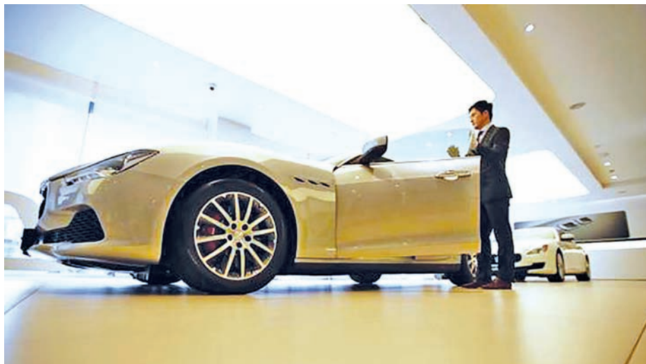
A car dealer checks a Maserati Ghibli car at its dealership in Seoul on 2 March, 2015.

dealership of Volkswagen (VOWG_p.DE) unit Bentley Motors was the top global seller of Flying Spur sedans, which start at just under quarter of a million dollars. The outlet, in Gangnam, ranked second in overall sales behind one in Dubai.