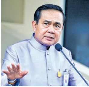
Thailand's Prime Minister Prayuth Chan-ocha

BANGKOK, 9 March — Prime Minister Prayuth Chan-ocha on Monday called on Thais to be the “eyes and ears” of security forces in order to boost international confidence in Thailand after the second explosion in the capital Bangkok in just over a month.