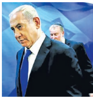
Israel's Prime Minister Benjamin Netanyahu (L) arrives at the weekly cabinet meeting at his office in Jerusalem on 8 March, 2015.

Netanyahu's office denied this, too, saying he has long adhered to a policy that "under current conditions