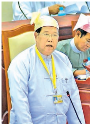
Deputy Minister U Soe Tint.—MNA

NAY PYI TAW, 9 March—Pyithu Hluttaw (Lower House) continued its 23 rd day session Monday.