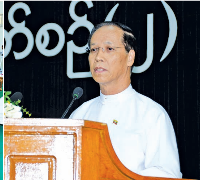
Vice President Dr Sai Mauk Kham delivers speech at opening of special refresher course for senior officials of ministries.

NAY PYI TAW, 9 March — Vice President Dr Sai Mauk Kham delivered an address at the opening of Special Refresher Course No. (2) for Senior Officials at the President Office Ministry in Nay Pyi Taw on Monday.