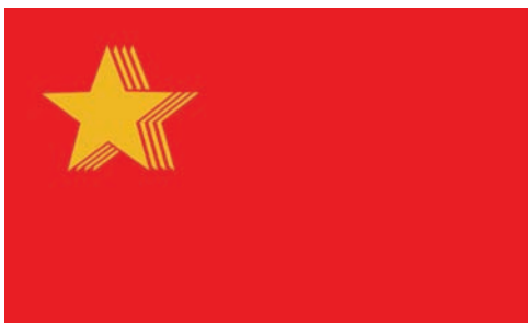
Flag of New Society Party

It is hereby announced that those who want to remonstrate with the UEC about the party's title, flag and seal may submit a complaint along with the strong evidences within seven days starting from issuance of this announcement in line with Section 14 (d) of the Political Parties Registration Rules.