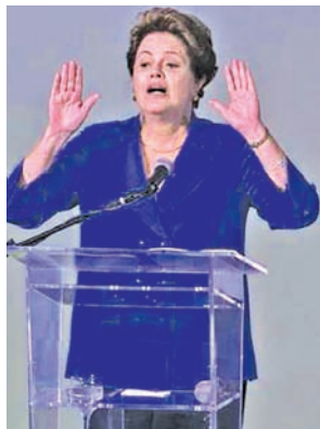
Brazil’s President Dilma Rousseff

That almost unprecipitated congressional