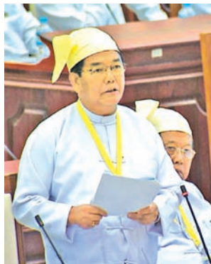
Deputy Minister U Ohn Than.

With regard to the question raised by U Htay Maung of Saw Constituency on number of townships facilitated with inter-town asphalt roads in the nation, Deputy Minister for Construction U Soe Tint replied that so far, Ministry of Construction has constructed inter-town roads