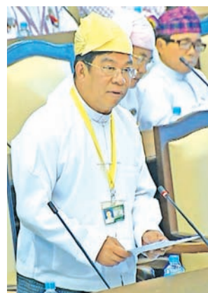
Deputy Minister U Thant Shin.