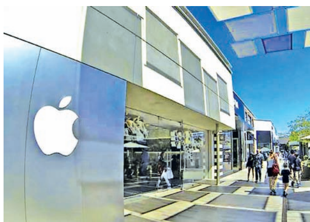
An Apple retail store is shown at a shopping mall in San Diego, California on 10 Sept, 2014.

Shares of Apple rose 0.15 percent to $126.60 on Friday, while those of