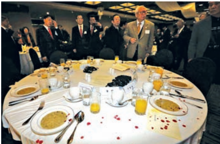
Blood stains from US ambassador to South Korea Mark Lippert are seen on a table, following Lippert's (not pictured) evacuation after being slashed in the face by an unidentified assailant at a public forum in central Seoul on 5 March, 2015.

SEOUL, 5 March — US Ambassador to South Korea Mark Lippert was attacked and injured by a knife-wielding man in downtown Seoul on Thursday morning, but the US State Department said his injuries are not life threatening.