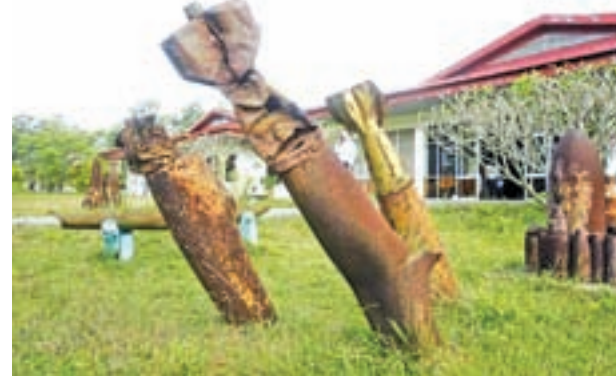
US bomb shells are seen at a mines and bombs museum in Vietnam's central Quang Tri Province on 2 March, 2015.

This week, Gottemoeller pushed the button and four simultaneous