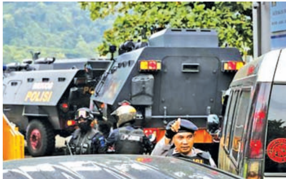
A policeman gestures as armoured police vehicles carrying two Australian prisoners wait to be loaded onto a ferry for the prison island of Nusa Kambangan, where upcoming executions are expected to take place, in Cilacap, Central Java on 4 March, 2015.