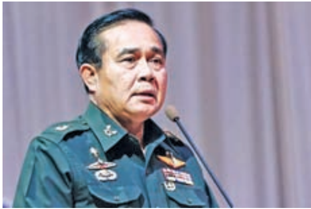
Thai Army chief General Prayuth Chan-ocha

The ban would take effect for members of the so-called National Council for Peace and Order