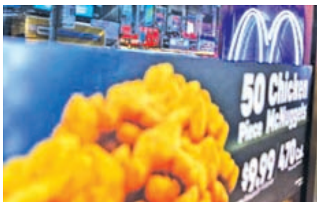
Neon McDonald's Golden Arches are seen at the Times Square location in New York in this 29 Jan, 2015.

The world's biggest restaurant chain announced on Wednesday that within two years, McDonald's USA will only buy chickens raised without antibiotics that are important to human medicine. The concern is that the overuse of antibiotics for poultry may diminish their effectiveness in fighting disease in humans. McDonald's policy will begin at the hatchery, where chicks are sometimes inject-