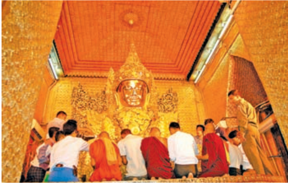
MANDALAY, 5 March — Pilgrims and other visitors converged on ancient religious monuments in Mandalay including the Maha Muni Buddha Image,

the Mandalay Hill pagoda, Phayani Pagoda, Shwekyemyin on Thursday for Taboung Fullmoon Day.