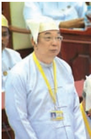
Deputy Minister Dr Maung Maung Thein.