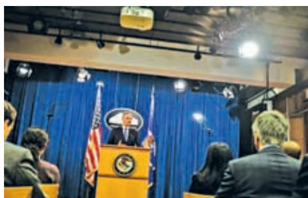
US Attorney General Eric Holder addresses the Justice Department's findings in two investigations regarding the Ferguson, Missouri shooting of Michael Brown by Darren Wilson, during a news conference in Washington on 4 March, 2015.

"Of course, violence is never justified," Holder