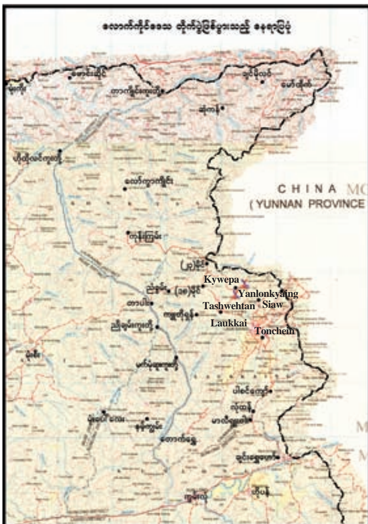
A map shows clashes between Tatmadaw columns and Kokang insurgents in Laukkai region. MYAWADY

On 3 March afternoon, a Tatmadaw column and police, acting on tip-off, searched the house of U Htein Hsan in Tonchein Village in Laukkai Township and seized one .38 pistol, one magazine, 16 bullets, two camouflage uniforms, four green uniforms, K515,000 and yuan 540.—Myawady