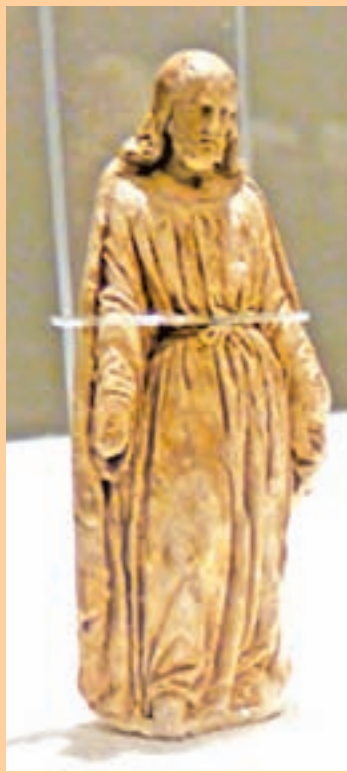
Photo taken on 19 Feb, 2015, at the Nagasaki Museum of History and Culture in Nagasaki, southwestern Japan, shows a statue of Jesus Christ that was confiscated from Christians of Urakami village, Nagasaki Prefecture, during Japan's persecution of Christians in the 1600s to 1800s and now in the possession of the Tokyo National Museum. The Tokyo museum has agreed to loan some 200 items to the Nagasaki museum for exhibition.

TOKYO, 5 March — More than 500 items confiscated from Japanese Christians during their brutal persecution in the 19 th century from the late Edo period to the early Meiji era have returned to Nagasaki, southwestern Japan, for the first time in about 150 years.