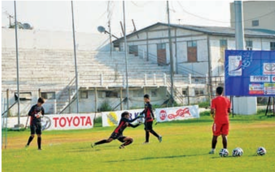
Players of Myanmar national women's team taking training as preparations for participating in Olympic qualifiers at Mandalay Thiri Stadium in Mandalay.