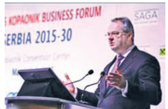
Minister of Economy Zeljko Sertic

KOPAONIK, 5 March — A total of 3,047 enterprises have been privatized in Serbia until 2015, the proceeds from them totalling EUR 3.7 billion, Minister of Economy Zeljko Sertic said on Wednesday.