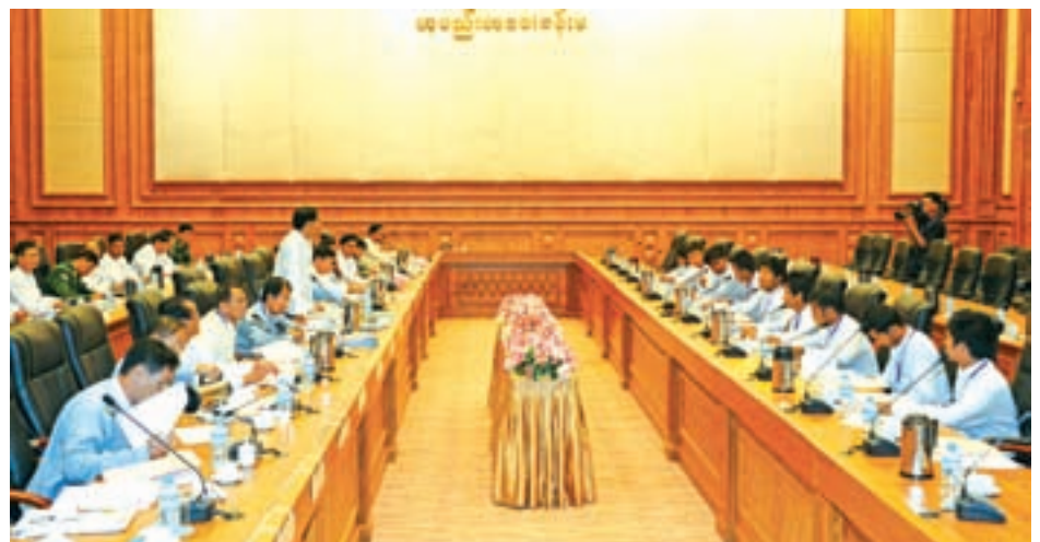
Amyotha Hluttaw Bill Committee officials meet students from ACDEM.

NAY PYI TAW, 5 March — Hearing for amendment bill of the national education law started at the Amyotha Hluttaw building on Thursday.