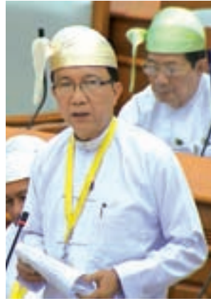
Union Minister for Finance U Win Shein. MNA