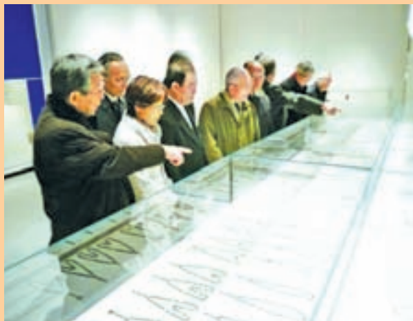
Members of the history committee of St Mary's Cathedral in Nagasaki, better known in Japan as the Urakami Cathedral, observe a collection of rosaries during a private viewing of an exhibition at the Nagasaki Museum of History and Culture in the southwestern Japanese city on 19 Feb, 2015. The rosaries, confiscated during Japan's persecution of Christians about 150 years ago, are among some 200 items on loan to the exhibition from the Tokyo National Museum.