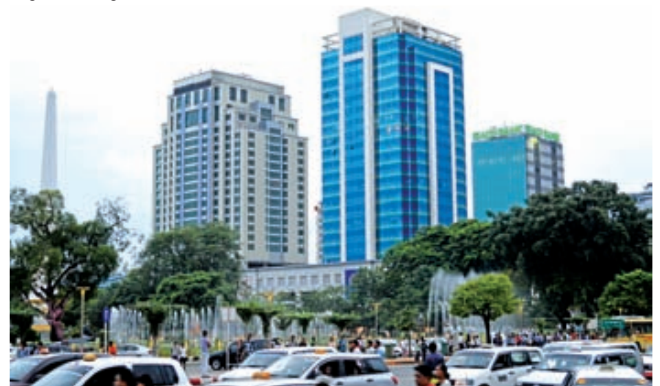
An air quality monitoring device will be placed in the heart of Yangon near Mahabandoola Park.