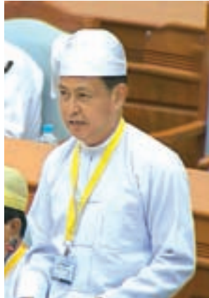
Union Minister for Information U Ye Htut.