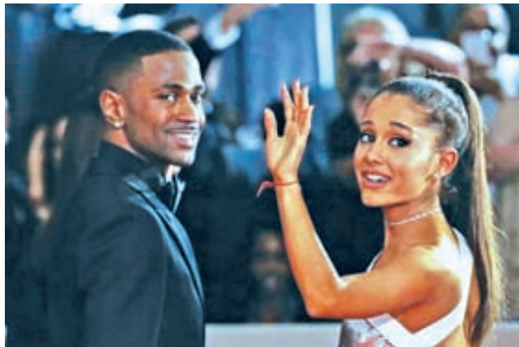
Big Sean and singer Ariana Grande arrive at the 57 th annual Grammy Awards in Los Angeles, California on 8 Feb, 2015.