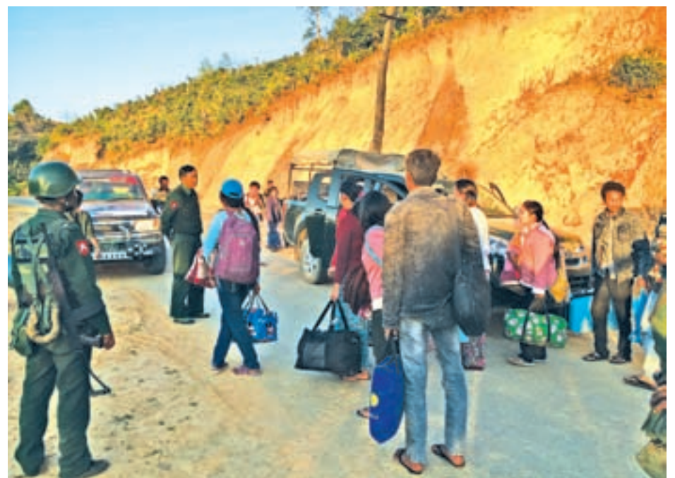
An official welcomes back IDPs and departmental personnel to Laukkai.