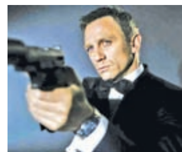
Italian environmental campaigners have thanked James Bond for forcing Rome's city officials to clean up its streets in preparation for shooting scenes for the upcoming movie 'Spectre'.