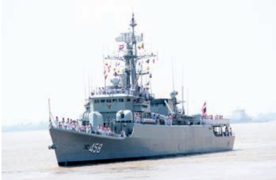
Photo shows HTMS Saiburi FF-458, a naval vessel of the Royal Thai Navy.