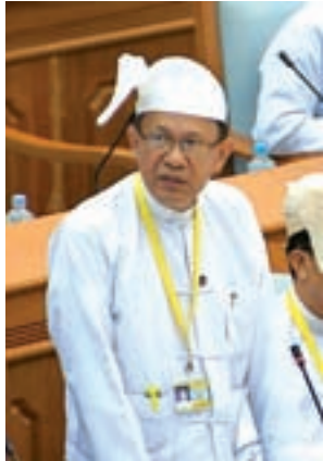
Union Minister for National Planning and Economic Development Dr Kan Zaw.