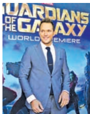
Cast member Chris Pratt poses at the premiere of "Guardians of the Galaxy" in Hollywood, California on 21 July, 2014. The movie opens in the US on 1 August.

This year's Oscar best picture contenders face off once again for MTV's top award of Movie of the Year, where "Boyhood," "Whiplash," "American Sniper" and "Selma" are up against "Guard-