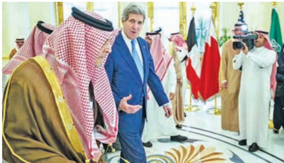
US Secretary of State John Kerry walks with Saudi Arabia's Foreign Minister Saud bin Faisal bin Abdulaziz Al Saud (L) during a meeting of Gulf foreign ministers at Riyadh Air Base on 5 March, 2015.

RIYADH, 5 March — US Secretary of State John Kerry met Gulf Arab foreign ministers in Riyadh on Thursday to brief them on progress in the nuclear talks with Iran and offer reassurance that any deal would not damage their interests.