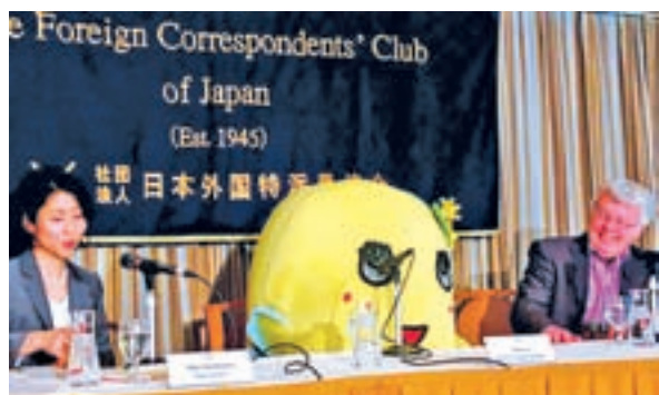
“Funassyi,” the unofficial mascot of the Chiba Prefecture city of Funabashi, holds its first Press conference in front of foreign media at the Foreign Correspondents' Club of Japan in Tokyo on 5 March, 2015.