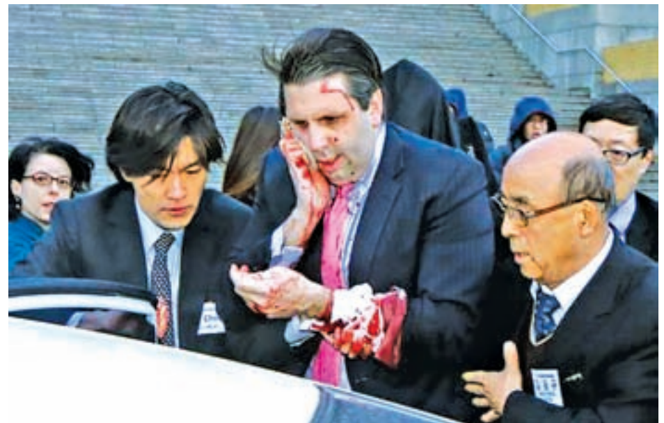
US Ambassador to South Korea Mark Lippert leaves after he was slashed in the face by an unidentified assailant at a public forum in central Seoul on 5 March, 2015.

South Korean President Park Geun-hye also denounced the incident as “an intolerable attack not only on a US ambassador