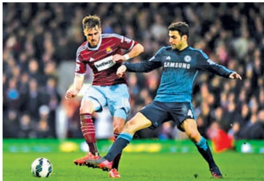
West Ham's Carl Jenkinson in action with Chelsea's Cesc Fabregas during their Barclays Premier League at Upton Park, England on 4 March, 2015.