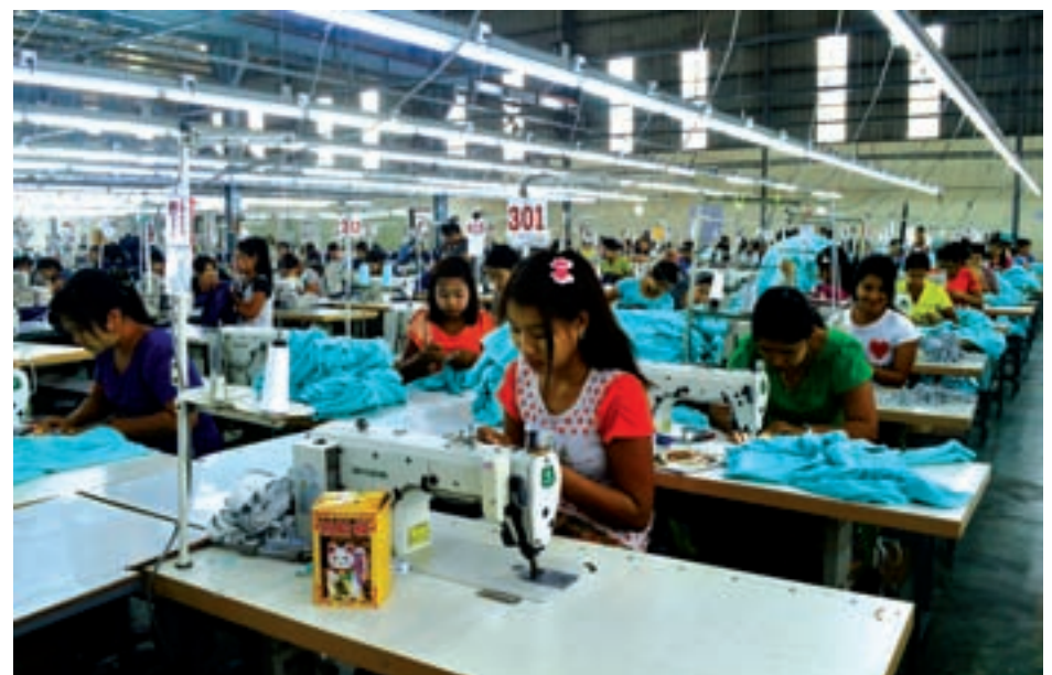
Garment workers make clothes at Ford Glory Garment Factory in Shwepyitha Industrial Zone.

A majority of factory workers involved in the strike for better wages are returning to work, and out of 1,200 Costec Garment Factory workers, 927, or (See page 2)