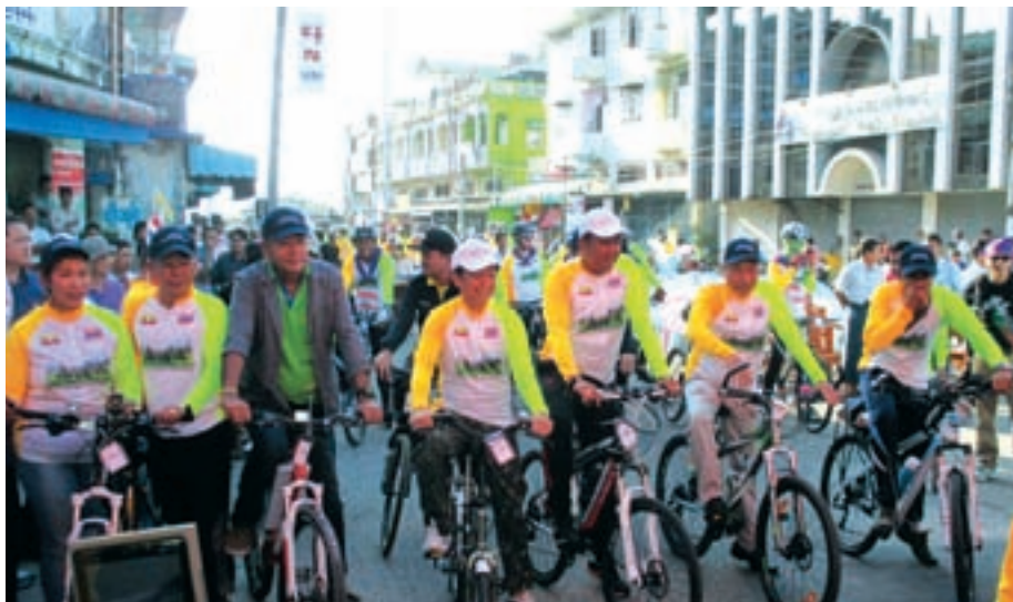
Thai amateur cyclists participate in Thai-Myanmar friendship cycling activity.