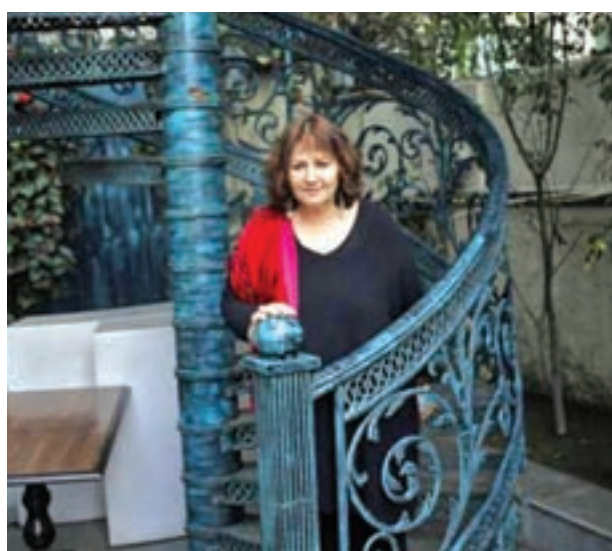
British filmmaker Leslee Udwin poses for a picture after addressing a news conference in New Delhi on 3 March, 2015.

Singh's comments in "India's Daughter" have grabbed headlines in Indian newspapers and sparked outrage on social media.