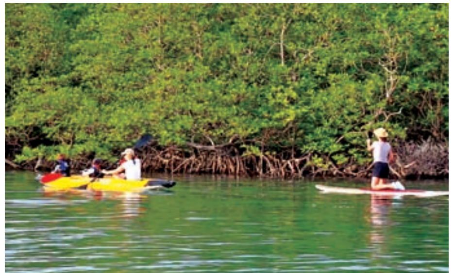
Tourists visiting mangrove forests in Kawthoung.