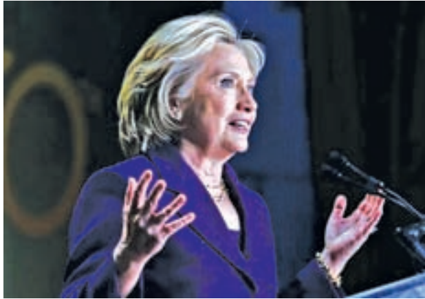
Former secretary of state Hillary Clinton delivers dinner remarks at EMILY's List 30th Anniversary Gala in Washington on 3 March, 2015.

WASHINGTON, 4 March — Democrats scrambled on Tuesday to contain the fallout for Hillary Clinton, their favoured 2016 presidential candidate, after allegations she inappropriately used her personal email for work while secretary of state. The Clinton camp quickly sought to discredit