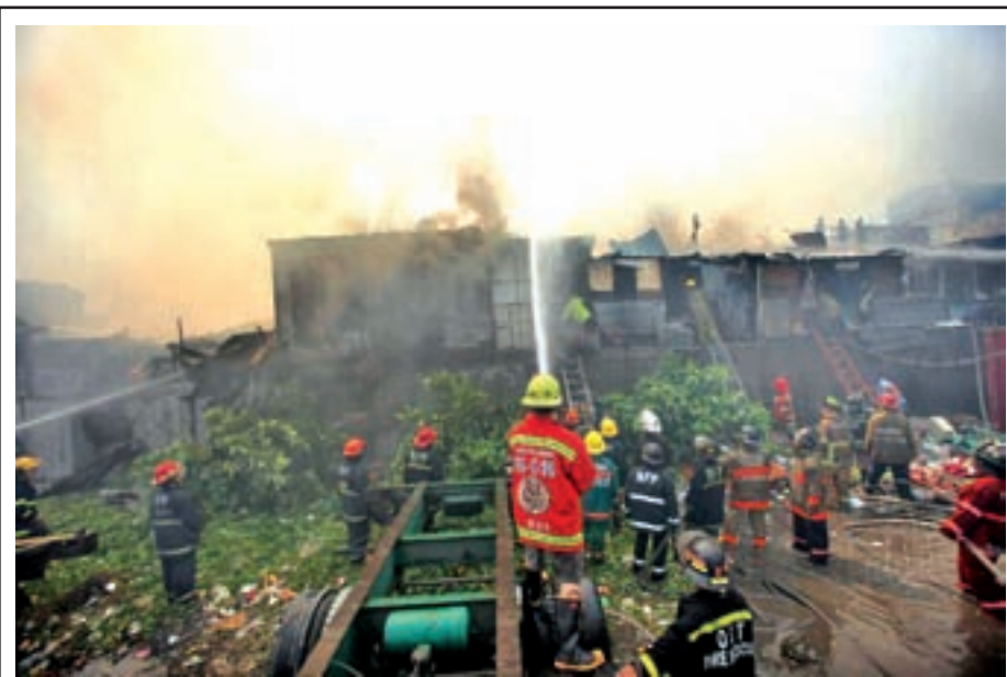
Firefighters try to put out a fire at a slum area in Manila, the Philippines, on 3 March, 2015. The fire razed 50 homes, hours after more than 5,000 shanties were razed in the same slum area. More than 10,000 families were displaced after a 12-hour fire destroyed 5,000 houses in Metro Manila, capital city of the Philippines, said local authorities on Tuesday.