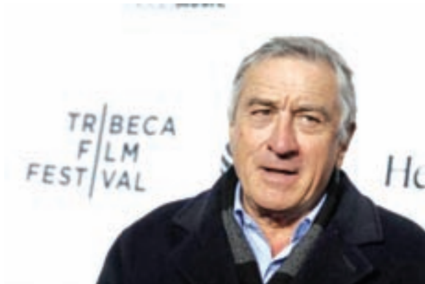
Robert De Niro poses on the red carpet upon arriving for the 2014 Tribeca Film Festival opening night screening of 'Time Is Illmatic' in New York on 16 April, 2014.