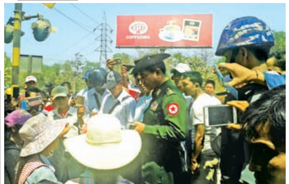
Officials meet with protesting workers.—MNA

The remaining detainees are still under investigation by Yangon region government.—MNA