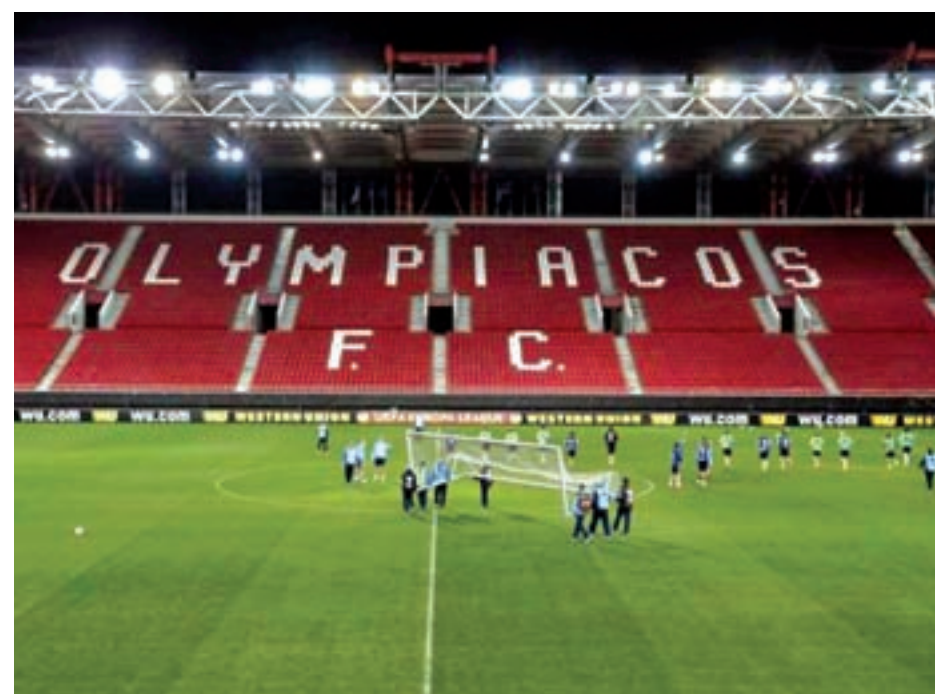
Dnipro's players attend a training session at Olympiakos' Karaiskaki stadium in Piraeus, near Athens on 25 Feb, 2015.

"You must win the league championship and the Greek Cup, nothing else is in my mind right now, and it should be the same for you all," he said.