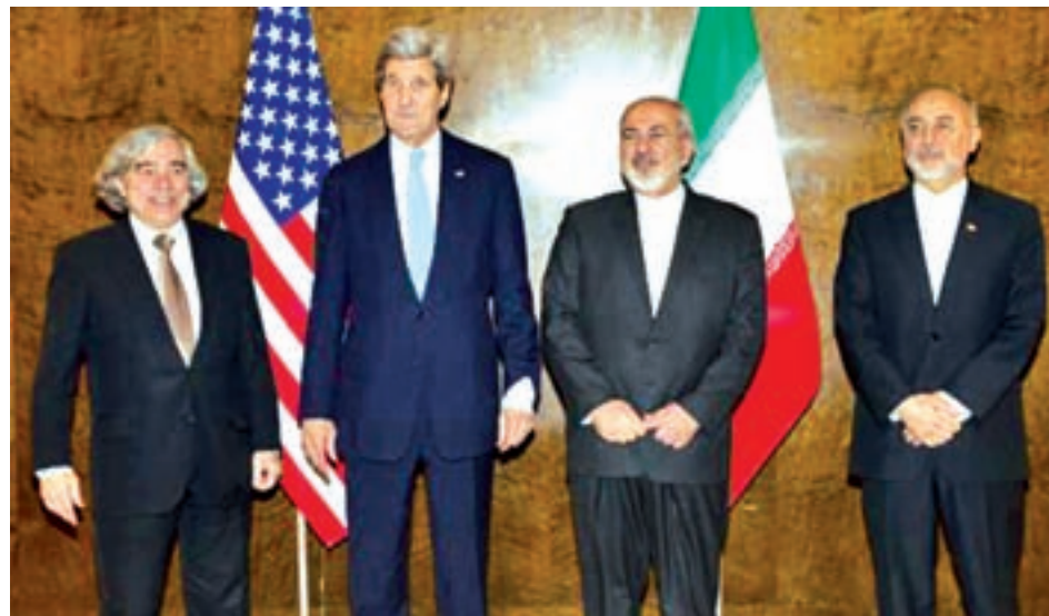
US Secretary of State John Kerry (2 nd L) meets his Iranian counterpart Mohammad Javad Zarif (2 nd R) for a new round of nuclear negotiations in Montreux on 2 March, 2015.

Netanyahu argued that rather than preventing Iran from acquiring nuclear arms, a deal would "all but guarantee" that it would one day get the atomic bomb, putting Israel, the wider