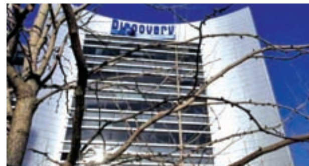
The Discovery Communications headquarters building is seen in Silver Spring, Maryland on 3 Dec, 2009.