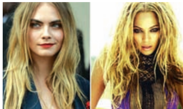
Pop star Beyonce Knowles and supermodel Cara Delevingne have hinted that they are planning to collaborate.—PTI

LOS ANGELES, 4 March — Pop star Beyonce Knowles and supermodel