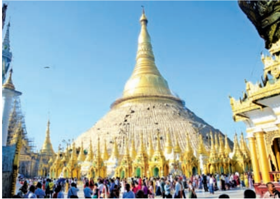
Pilgrims and local people visit Shwedagon Pagoda on Fullmoon Day of Taboung in Yangon.

YANGON, 4 March — Pagodas around Yangon were packed with pilgrims on the Fullmoon day of Taboung, which falls on Wednesday. Pilgrims took the five precepts, practised meditation, did meritorious deeds and offered food to