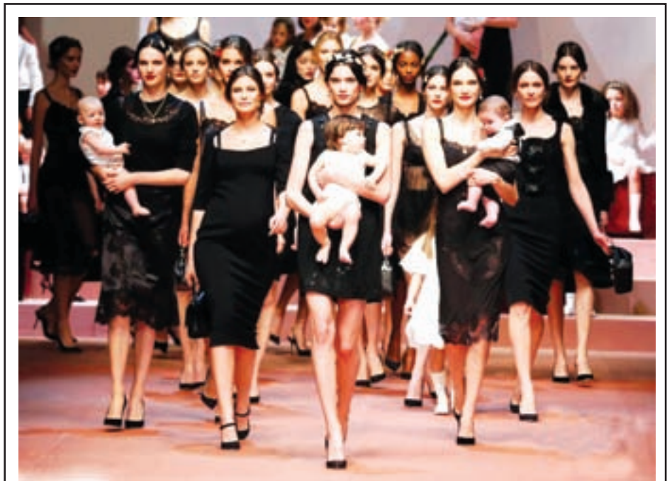
Dolce & Gabbana show on 1 March, 2015 at Milan Fashion Week takes inspiration from motherhood.