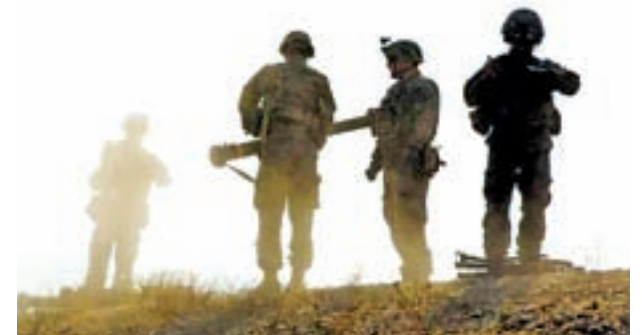
US soldiers from D Troop of the 3 rd Cavalry Regiment walk on a hill after finishing with a training exercise near forward operating base Gamberi in the Laghman province of Afghanistan on 30 Dec, 2014.

The ANSF also seized weapons and defused three roadside bombs planted by the militants over the same period, the statement said, without mentioning if there were any casualties on the side of the government security forces.—Xinhua