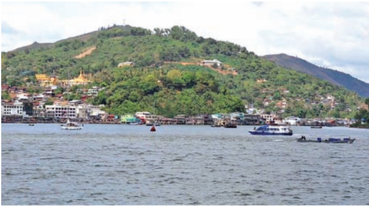
A panoramic view on Kawthoung, the southern most part of Myanmar seen with sea and mountain range in background.

KAWTHOUNG, 4 March — With stunning panoramas of ocean and rolling hills, Kawthoung has become a lure for sightseers at the southern