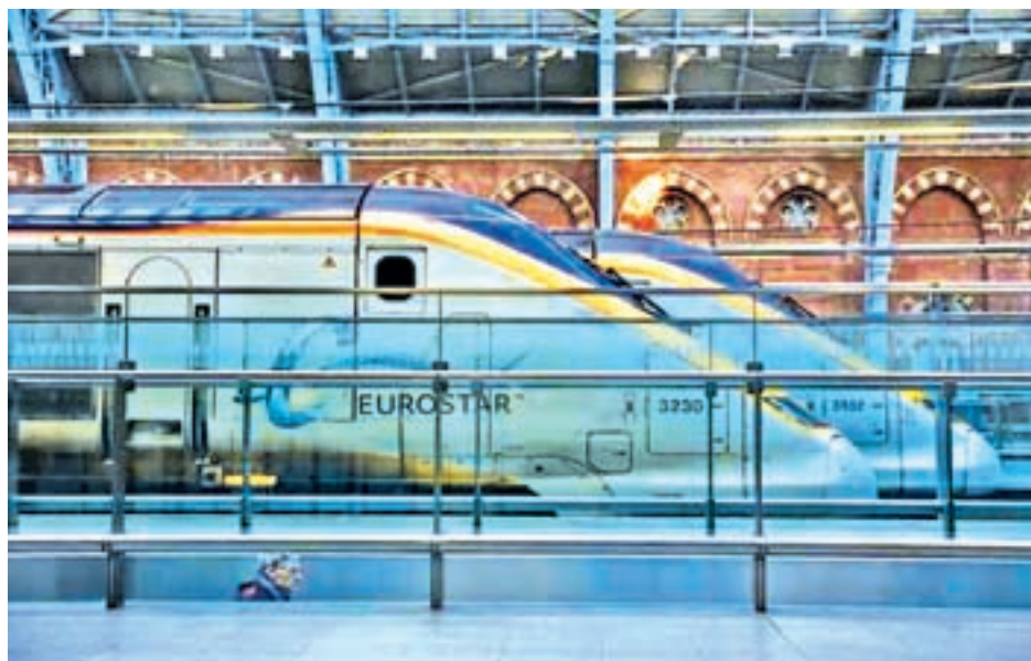
Eurostar trains stand at St Pancras International Station in London, on 17 Jan, 2015.

LONDON, 4 March — Britain agreed to sell its 40 percent stake in the Eurostar rail link for 585 million pounds ($899.79 million) to a consortium comprising the Canadian public pension fund Caisse de Depot du Placement du Quebec (CDPQ) and the British asset manager Hermes.