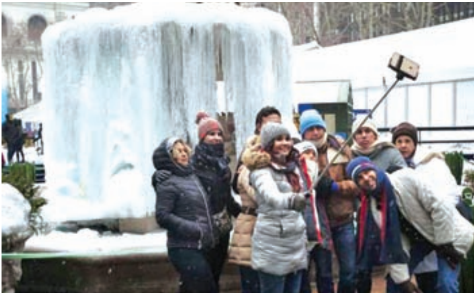
People use a ‘selfie’ stick to take a photo in front of the frozen fountain in Bryant Park in the Manhattan borough of New York on 14 Feb, 2015.