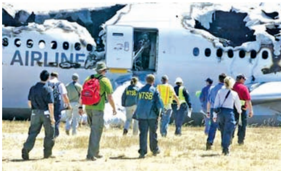
US National Transportation Safety Board (NTSB) investigators work at the scene of the Asiana Airlines Flight 214 crash site at San Francisco International Airport in San Francisco, California in this handout photo released on 7 July, 2013.