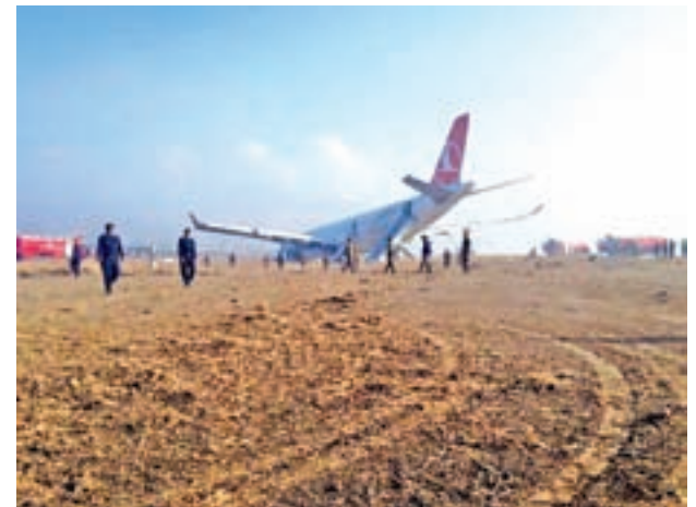
A Turkish Airlines plane lies on the field at Tribhuvan International Airport in Kathmandu, Nepal on 4 March, 2015.

Several domestic and international flights were affected due to heavy fog in the Nepal's only international airport following the incessant rainfall over the past three days.— Xinhua