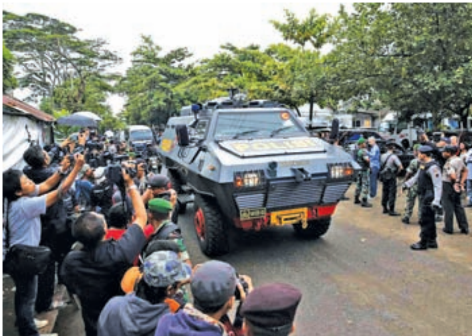
An armoured police vehicle believed to be carrying two Australian prisoners, arrives at the port to take a ferry to the prison island of Nusa Kambangan, where upcoming executions are expected to take place, in Cilacap, Central Java on 4 March, 2015.