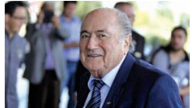
FIFA President Sepp Blatter arrives at Hotel Bourbon in Luque on 3 March, 2015.

ASUNCION, 4 March — The South American Football Confederation (CONMEBOL) will support Sepp Blatter's re-election as FIFA president in May, a CONMEBOL source told Reuters on Tuesday.