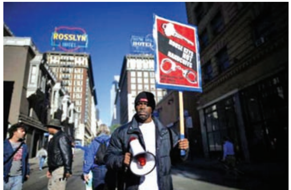
People protest against the killing of a homeless man by police in Los Angeles, California on 3 March, 2015.