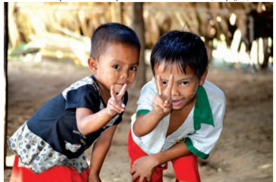
A cash benefit of K8, 000 per month for children aged 3-15 is one of the main features of Myanmar's first national social protection strategy. Some 11 million children are expected to be beneficiaries once the strategy is fully implemented.