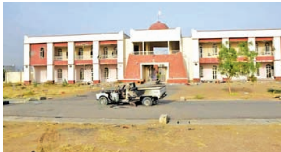
A burnt pickup truck is seen in front of a building that Boko Haram insurgents used as their base before being driven out by the Chadian military in Dikwa on 2 March, 2015.