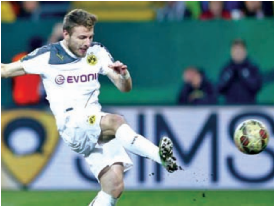
Borussia Dortmund's Italian striker Ciro Immobile scores a goal against Dynamo Dresden during German Cup (DFB Pokal) soccer match against in Dresden on 3 March, 2015.

BERLIN, 4 March — Borussia Dortmund's Ciro Immobile struck twice in the second half to secure a 2-0 victory at third tier Dynamo Dresden and a place in the German Cup quarter-finals on Tuesday.