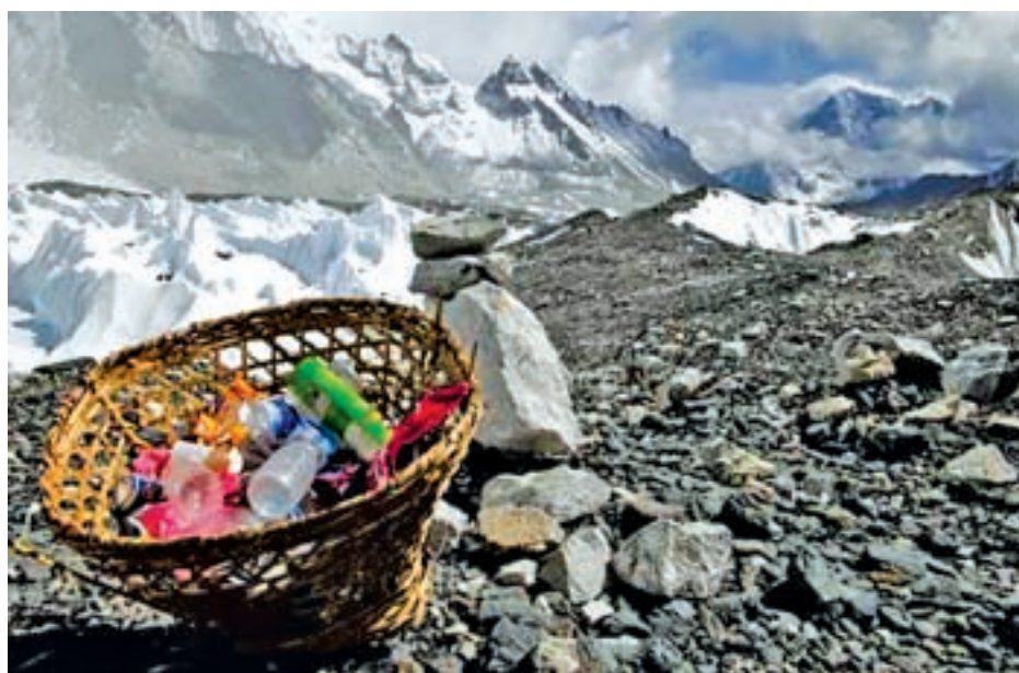
Rubbish collected at Everest base camp with the Himalayan range seen at the background in Nepal, on 3 May 2011.

But in the absence of toilets climbers must squat in the open or hunker down behind rocks to do their business. Now Nepal has threatened stricter enforcement of penalties to persuade climbers to clean up after themselves and carry litter back to base camp.