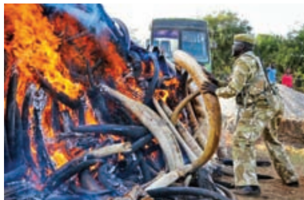
A Kenyan armed ranger puts an ivory into fire in Nairobi, Kenya, on 3 March, 2015. Kenyan President Uhuru Kenyatta on Tuesday set ablaze 15 tonnes of contraband ivory and vowed to intensify the ongoing war against wildlife crimes in the country. According to the UN Environment Program (UNEP), Africa was home to an estimated 500,000 elephants, but has been losing 30,000 annually from poaching.