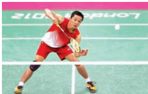
Indonesia’s Taufik Hidayat plays against Czech Republic’s Petr Koukal during their men’s singles group play stage badminton match at the Wembley Arena during the London 2012 Olympic Games on 28 July, 2012.—REUTERS

On his great rival, Lee, he added: “He’s not only my opponent, but also my good friend. I’m hopeful he will make a swift comeback.”—Reuters