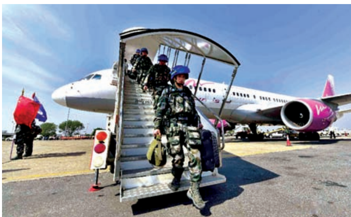
Members of China's peacekeeping infantry battalion of the United Nations Mission in the Republic of South Sudan (UNMISS) arrive at the airport in Juba, South Sudan, on 27 Feb, 2015. This marks the successful deployment of the whole detachment sent in advance. And it also shows China's peacekeeping infantry have had the ability of self keeping and self guarantee in the logistics support system of the UNMISS.