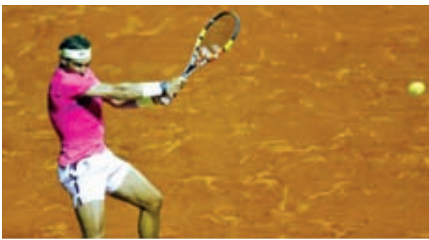
Spain's Rafael Nadal plays a shot during his tennis match against Argentina's Federico Delbonis at the ATP Argentina Open in Buenos Aires, on 27 Feb, 2015.

BUENOS AIRES, 28 Feb — Rafael Nadal, working his way back to top form after wrist problems last year, screamed with delight on reaching the Argentine Open semi-finals with a 6-1, 6-1 rout of Federico Delbonis