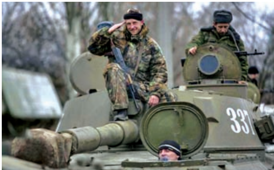
An armed man with the separatist self-proclaimed Donetsk People’s Republic army salutes from the top of a mobile artillery cannon as his convoy starts pulling back from Donetsk on 28 Feb, 2015.