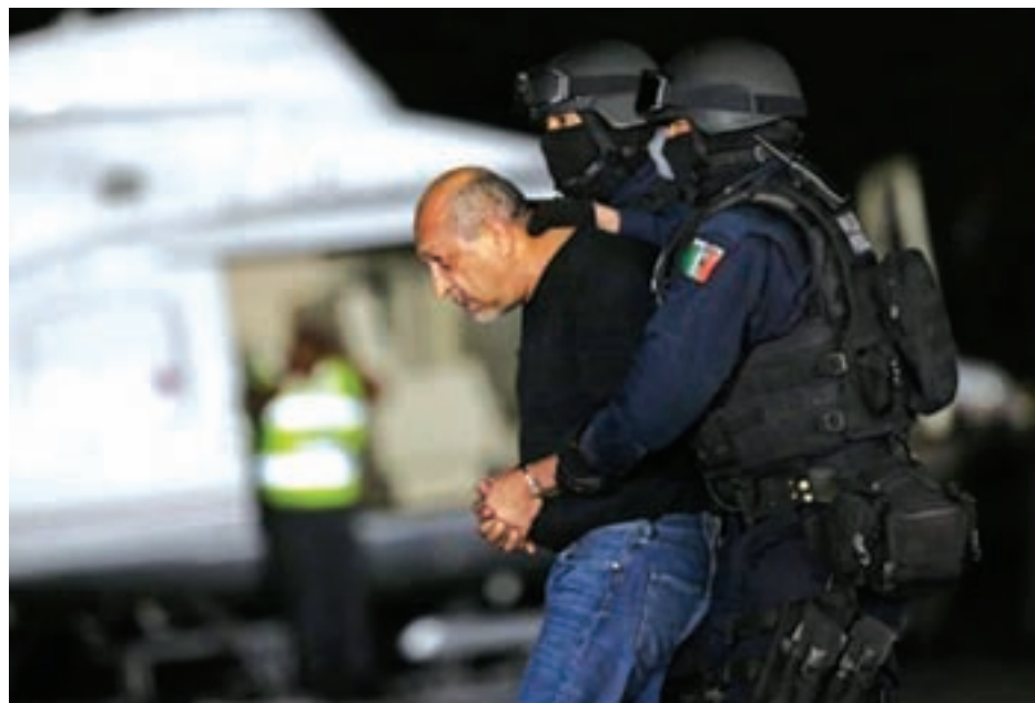
Servando 'La Tuta' Gomez is escorted by police officers during a media conference about his arrest in Mexico City on 27 Feb, 2015.