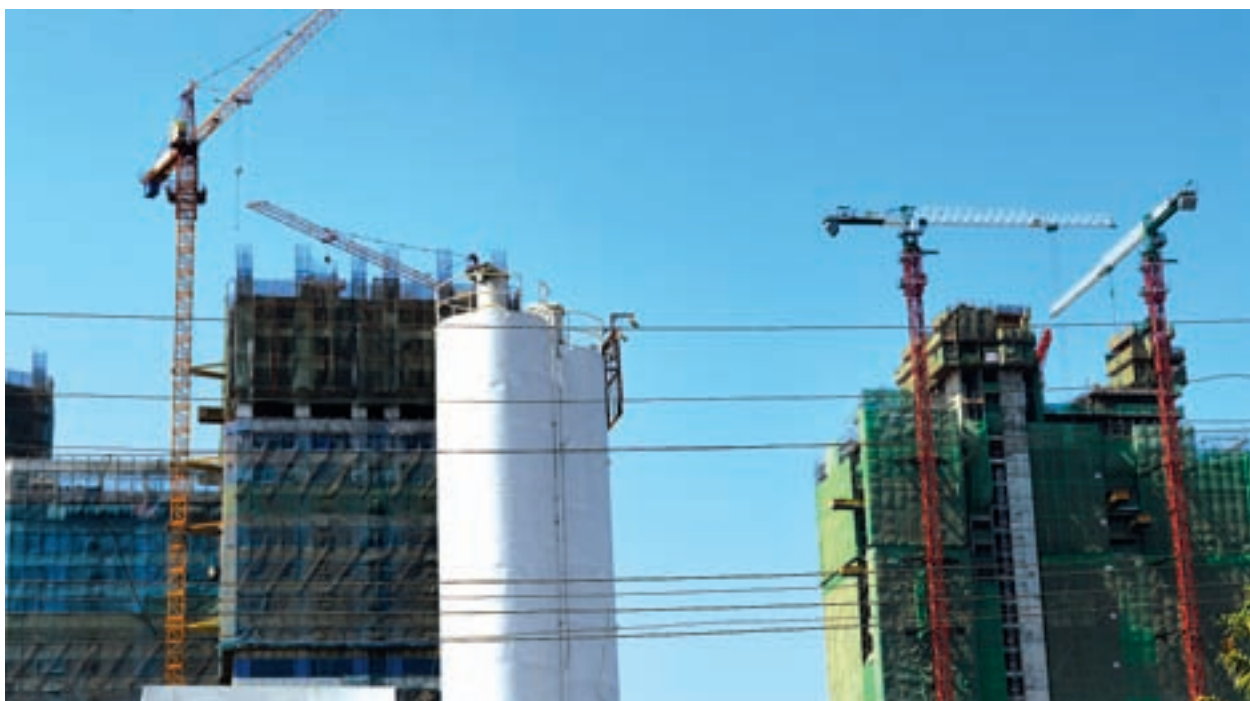
Photo of under-construction buildings being developed by foreign investors in Yangon.