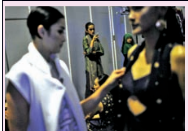
Models wait backstage during the Indonesian Fashion Week 2015 at Jakarta Convention Centre in Jakarta, Indonesia, on 26 Feb, 2015. Indonesian Fashion Week 2015 is held from 26 February to 1 March.