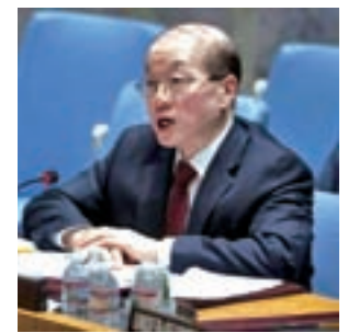
China's Ambassador to the United Nations Liu Jieyi speaks during a meeting of the Security Council at the United Nations in the Manhattan borough of New York on 17 Feb, 2015.

The core of the US draft resolution, obtained