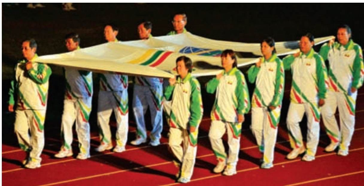
Flag bearers from the Ministry of Sports carrying National Sports flag from Wunna Theikdi stadium.

NAY PYI TAW, 28 Feb — Vice-President U Nyan Tun graced the closing ceremony of the 4 th Myanmar Sports Festival and presented trophies winning teams at Wunnatheikdhi Stadium on Saturday.