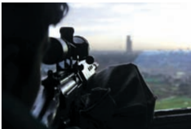
A rebel fighter aims his weapon at an area controlled by forces loyal to Syria's President Bashar al-Assad, from a rebel-controlled area in the northwestern Homs district of Al Waer on 18 Feb, 2015.

WASHINGTON, 28 Feb — The US military has begun vetting a group of Syrian rebels eligible for training and assistance in the fight against Islamic State militants, a step that paves the way for training to begin in weeks, the Pentagon said on Friday.