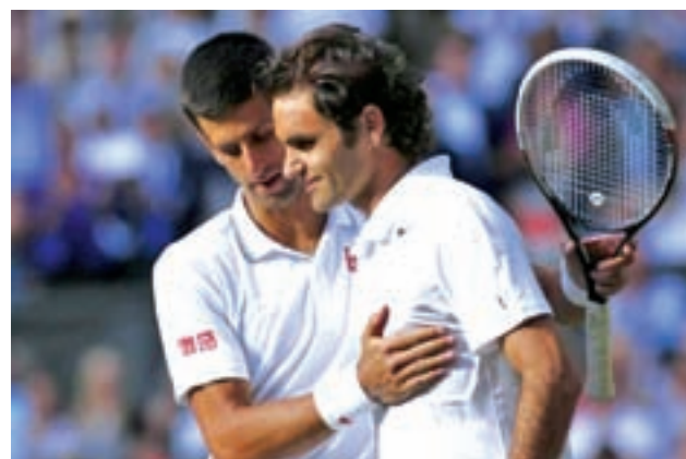
Novak Djokovic of Serbia speaks with Roger Federer of Switzerland after defeating him in their men's singles finals tennis match on Centre Court at the Wimbledon Tennis Championships in London on 6 July, 2014.

They have 10 Dubai titles between them and while Federer leads 19-17