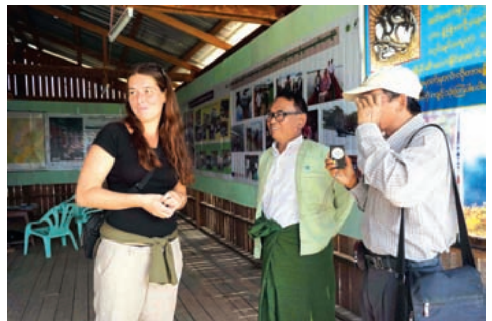
Officials explain environmental conservation activities at Indawkyi Lake sanctuary to a German tourist at the booth.

Departmental booths are kept open for public observation at the festival of the Buddha Pujaniya.