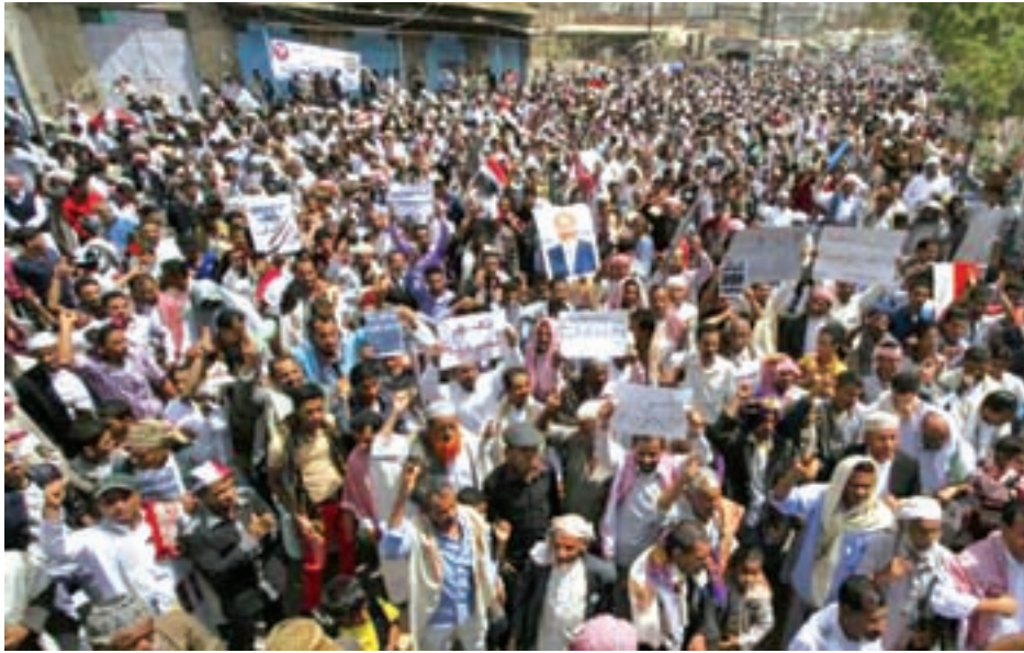
Protesters show support for Yemen's President Abd-Rabbu Mansour Hadi during a demonstration in the southwestern city of Taiz on 27 Feb, 2015.

for Foreign Affairs Anwar Gargash said the UAE had made its decision "in order to entrench constitutional legitimacy in Yemen, embodied by President Abd-Rabbu Mansour Hadi and his government", according to WAM news