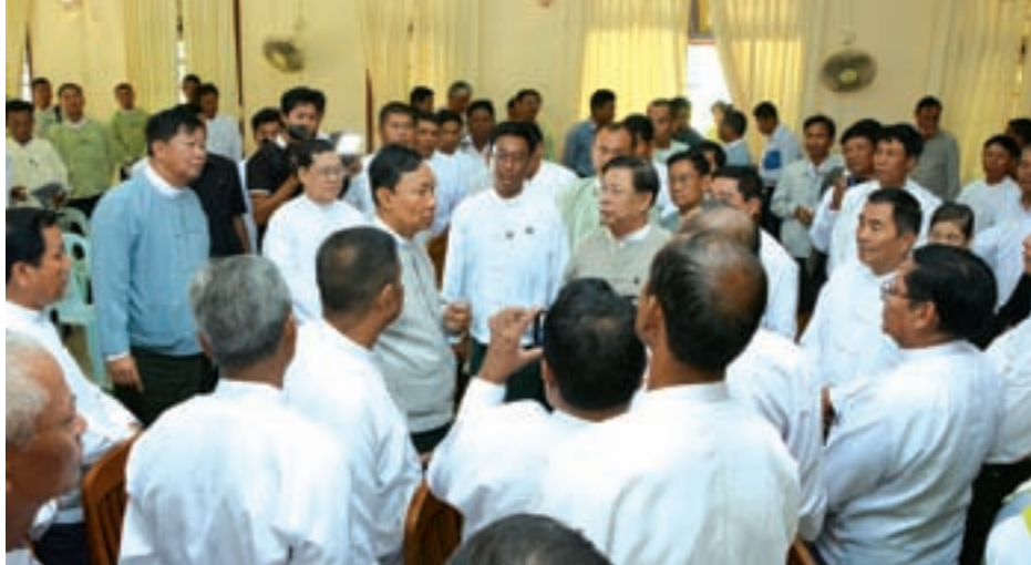
Speaker of Pyidaungsu Hluttaw and Pyithu Hluttaw Thura U Shwe Mann meets local officials and dignitaries in Phyu Township.

NAY PYI TAW, 28 Feb— Thura U Shwe Mann met local administrative officers, people and parliamentarians of Phyu Township, Bago region, Saturday. The meeting was at-