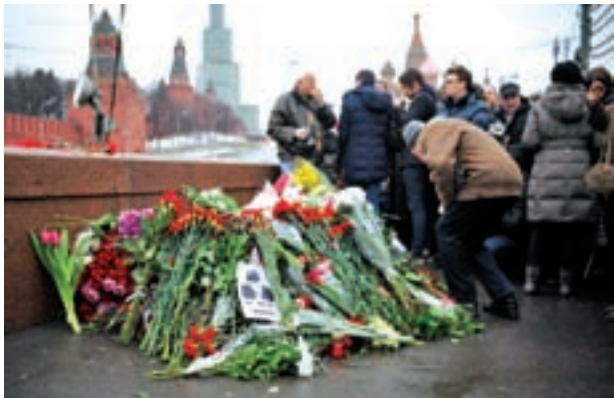
A man lays flowers on the murder site of Russian opposition leader Boris Nemtsov in Moscow, Russia, on 28 Feb, 2015. People came to the murder site of Boris Nemtsov for mourning on Saturday. Boris Nemtsov was shot and killed near the city center on 27 Feb, 2015.

MOSCOW, 28 Feb — Russian opposition leader Boris Nemtsov was shot and killed near the city center, according to local law enforcement agency.