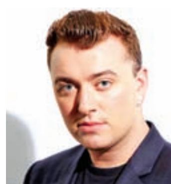
Pop star Sam Smith