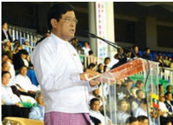
Vice President U Nyan Tun delivers speech at closing of 4 th National Sports Festival.—MNA