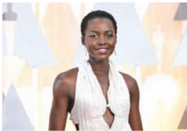
Actress Lupita Nyong'o wears a Calvin Klein gown and Chopard diamonds as she arrives at the 87th Academy Awards in Hollywood, California on 22 Feb, 2015.