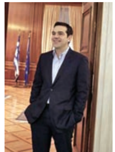
Greek Prime Minister Alexis Tsipras is seen before his meeting with the member of the European Parliament for The Greens Ska Keller (not pictured) at this office in Athens on 27 Feb, 2015.— REUTERS

More than two in three Greeks said they were satisfied with the way the government was negotiating with EU partners while 76 percent were positive about its overall performance so far, according to the survey for Parapolitika newspaper.— Reuters