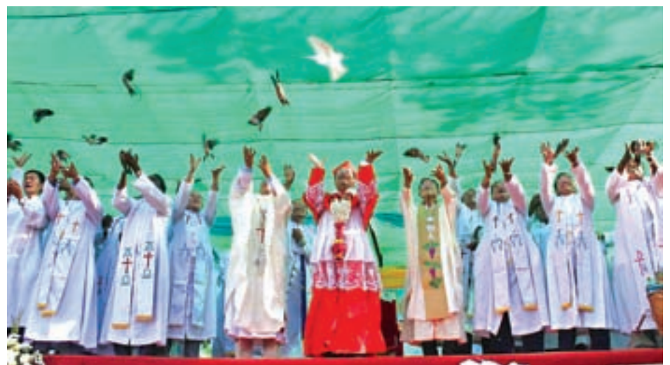
Cardinal Charles Maung Bo (centre), Bishops and Priests release doves for peace at the 113 th annual National Marian Pilgrimage in Nyaunglebin.

He will also work for the establishment of diplomatic relations between Myanmar and the Vatican.—GNLM