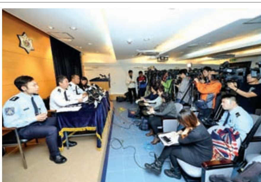
Photo taken on 27 Feb, 2015 shows a Press conference held by Macao Customs and Public Security Police Force in south China’s Macao. A ferry carrying 19 people capsized Friday off China’s Macao. According to the press conference, overload caused the capsizing.—XINHUA

The Laotian prime minister is scheduled to meet with Japanese Emperor Akihito and Prime Minister Shinzo Abe during his four-day visit.— Kyodo News