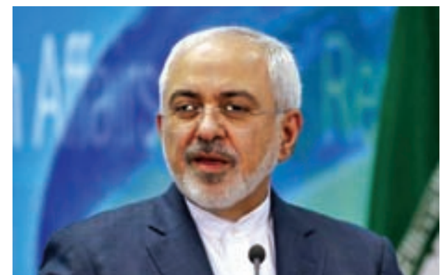
Iranian Foreign Minister Mohammad Javad Zarif speaks during a news conference with Iraqi Foreign Minister Ibrahim al-Jaafari (not pictured) in Baghdad, on 24 Feb, 2015.

BRUSSELS, 28 Feb — Senior officials from Iran and six powers negotiating with Teheran over its nuclear programme will hold more talks in Montreux, Switzerland, on 5 March, the European Union said on Friday.