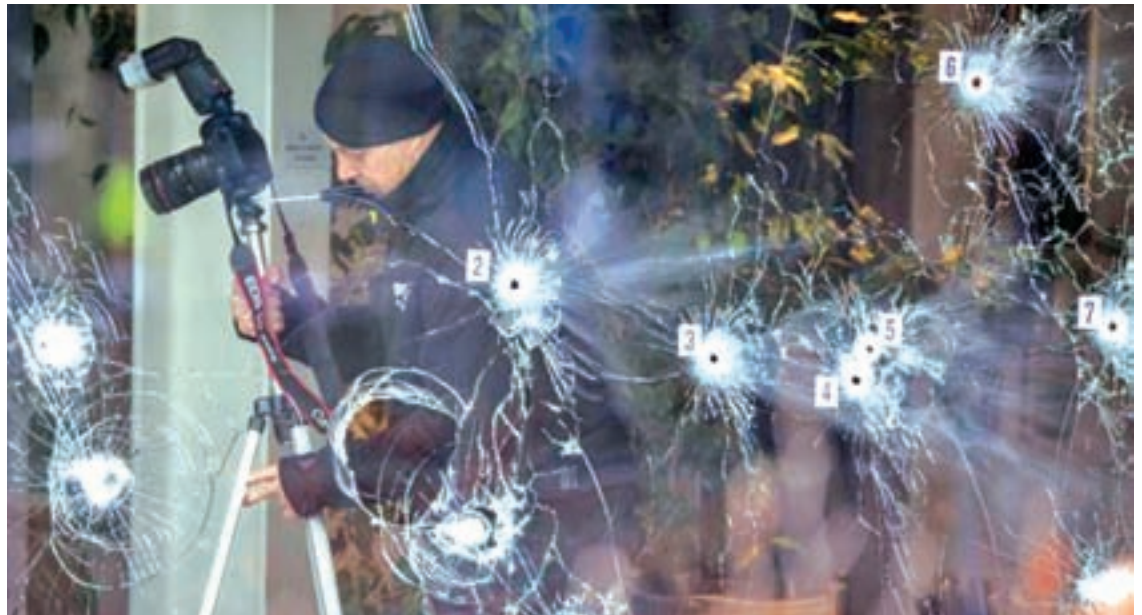
Investigative personnel work at the scene of a cafe shooting in Oesterbro, in Copenhagen on 15 Feb, 2015.— REUTERS

A preliminary legal hearing for the newly arrested man is to take place on Saturday.— Reuters