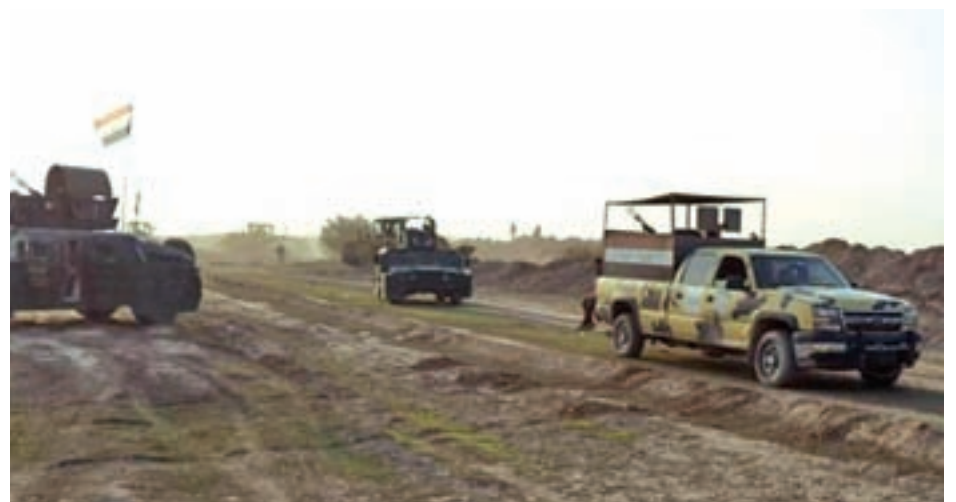
Iraqi security forces guard during the building of a new road between Diyala Province and Samarra on 21 Dec, 2014.