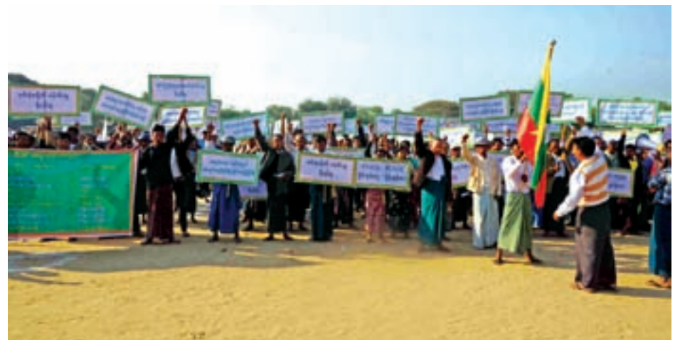
A mass rally in Myingyan calls for national stability and peace.