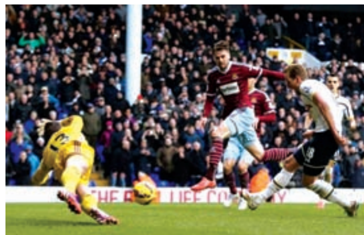
Harry Kane scores the second goal for Tottenham Hotspur against West Han United during their Barclays Premier League soccer match at White Hart Lane, London on 22 Feb, 2015.