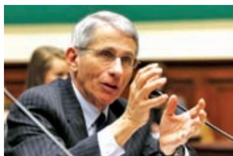
Anthony Fauci, Director of the National Institute of Allergy and Infectious Diseases

The trial, a joint effort by the Liberian government and the National Institute of Allergy and Infectious Diseases (NIAID), will be conducted in Liberia and the United