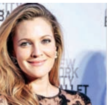
Actress Drew Barrymore

"I love stories that are humorous, emotional and welcoming, and that is my goal in writ-