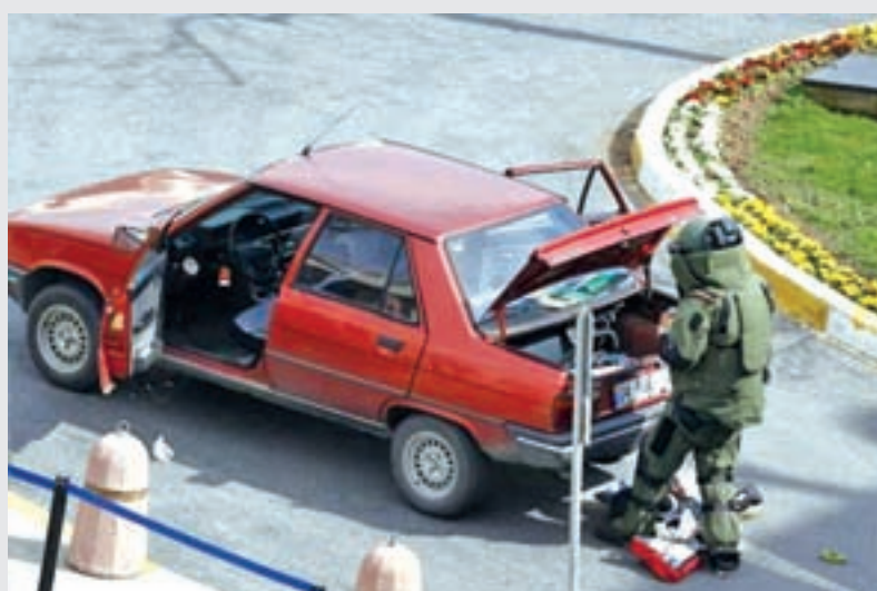
A member of a bomb disposal unit checks a vehicle near the US consulate in Istanbul on 27 Feb, 2015.

Istanbul has been on high security alert since January, when a suicide bomber blew herself up at a police station in the historic Sultanahmet district, killing one officer and wounding another.—Reuters