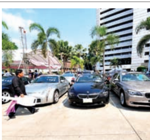
Thai people look at seized luxury cars during an auction at Thai Customs headquarters in Bangkok, Thailand, on 27 Feb, 2015. Altogether 232 seized luxury cars were auctioned on Friday with a total expected revenue of more than 300 million Thai baht (about 9 million US dollars).