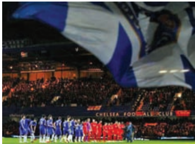
Chelsea (L) and Liverpool line up before their English League Cup semi-final second leg soccer match at Stamford Bridge in London in this file photo taken on 27 Jan, 2015.

"We believe Yokohama will play a key role in helping us drive our global expansion in international markets such