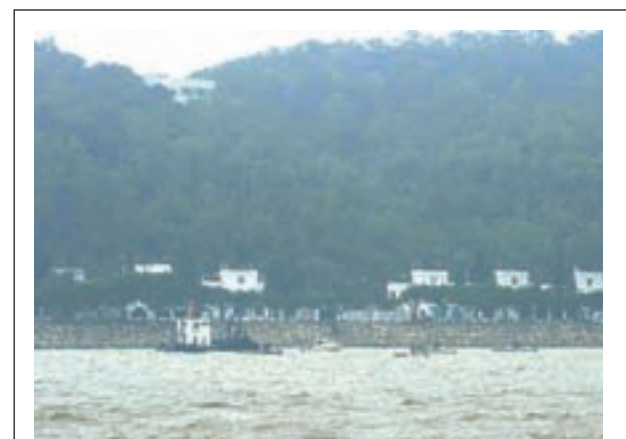
Rescuers search for the missing people on the capsized ferry on the sea in Macao, south China, on 27 Feb, 2015. A ferry carrying 19 people capsized Friday off China's Macao, and four people have been rescued, the customs said. The sunken ferry is a smuggling boat, with one captain, two sailors and 16 other stowaways on board, according to the customs. The four rescued are all stowaways, while other 15 people are still missing, said the customs.

"How we should review the entire past is important," he said. "The prime minister will include political decisions in the statement."— Kyodo News