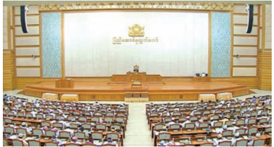
Pyidaungsu Hluttaw representatives debate national planning bill.

Regarding the human resources development for SME development, another presentation stressed the need for skilled workers and capacity building in the sector, calling for addressing skills gaps and