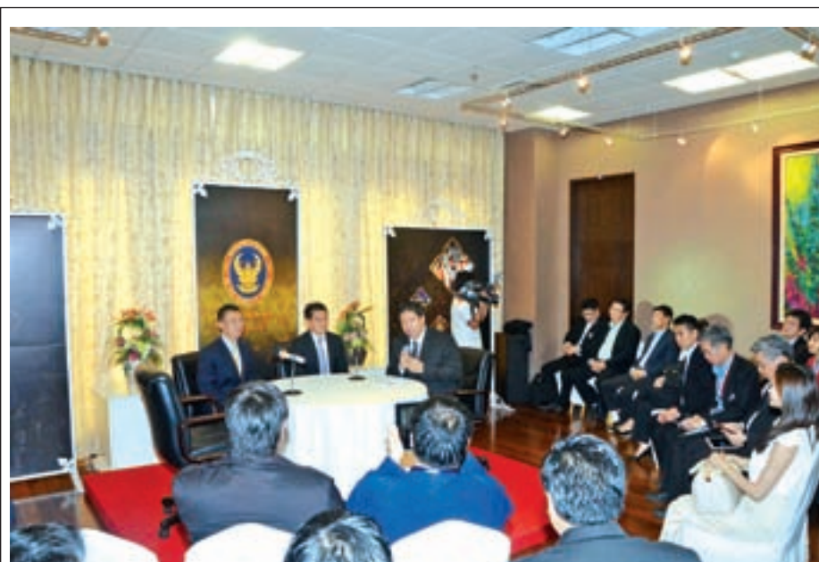
Myanmar-Thai businessmen hold discussions on experiences on bilateral trade and investment in Myanmar, and regulations for foreigner investors. (News on page 1)—MNA