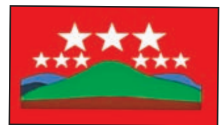
Flag of Danu National Organization Party