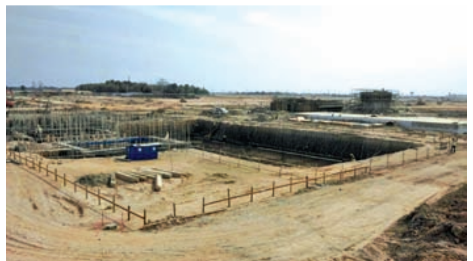
A worksite at Thilawa Special Economic Zone, Japan-Myanmar joint project being developed 23 km southeast of Yangon, the country's commercial city. The industrial complex is expected to be fully commercially operational in 2015.