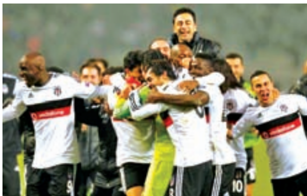
Besiktas players celebrate after victory in the penalty shootout during UEFA Europa League Second Round Second Leg, Istanbul, Turkey on 26 Feb, 2015.

LONDON, 27 Feb — Liverpool's Europa League campaign ended at the scene of one of their greatest European triumphs as they lost 5-4 on penalties to Besiktas in the Ataturk Stadium on Thursday on a woe-filled night for British clubs.