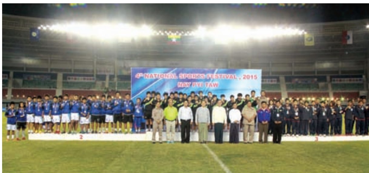
Union Ministers poses for documentary photo with prize winning football teams.

NAY PYI TAW, 27 Feb—Lt-Gen Sein Win and Lt-Gen Thein Htay of the Ministry of Defence together with officials enjoyed sports matches in Myanmar martial arts event, Karatedo, volleyball and boxing events in the 4 th Myanmar Sports Festival on Friday.