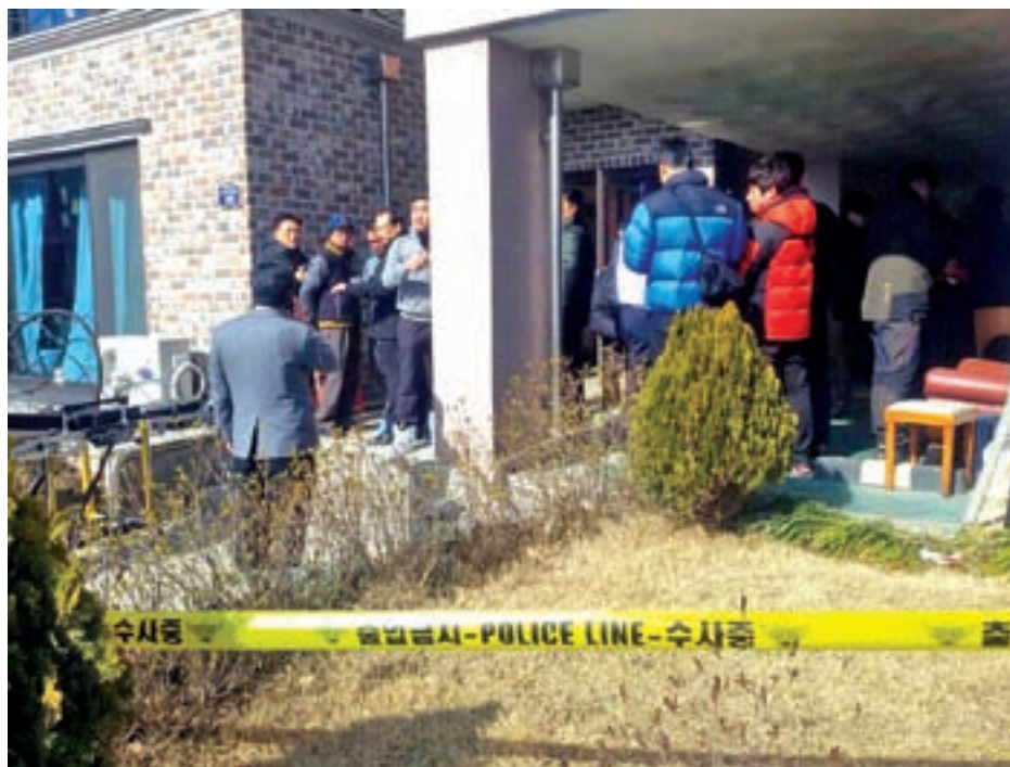
Police search the house where the shooting rampage happened in Hwaseong City, South Korea, on 27 Feb, 2015. Four people were killed and one was injured in a South Korean air-rifle shooting rampage in Hwaseong, Gyeonggy Province, Yonhap News Agency reported on Friday.

The daughter-in-law, who reported the case to police by phone, suffered a light injury as she jumped from the second-story house to escape from the scene.