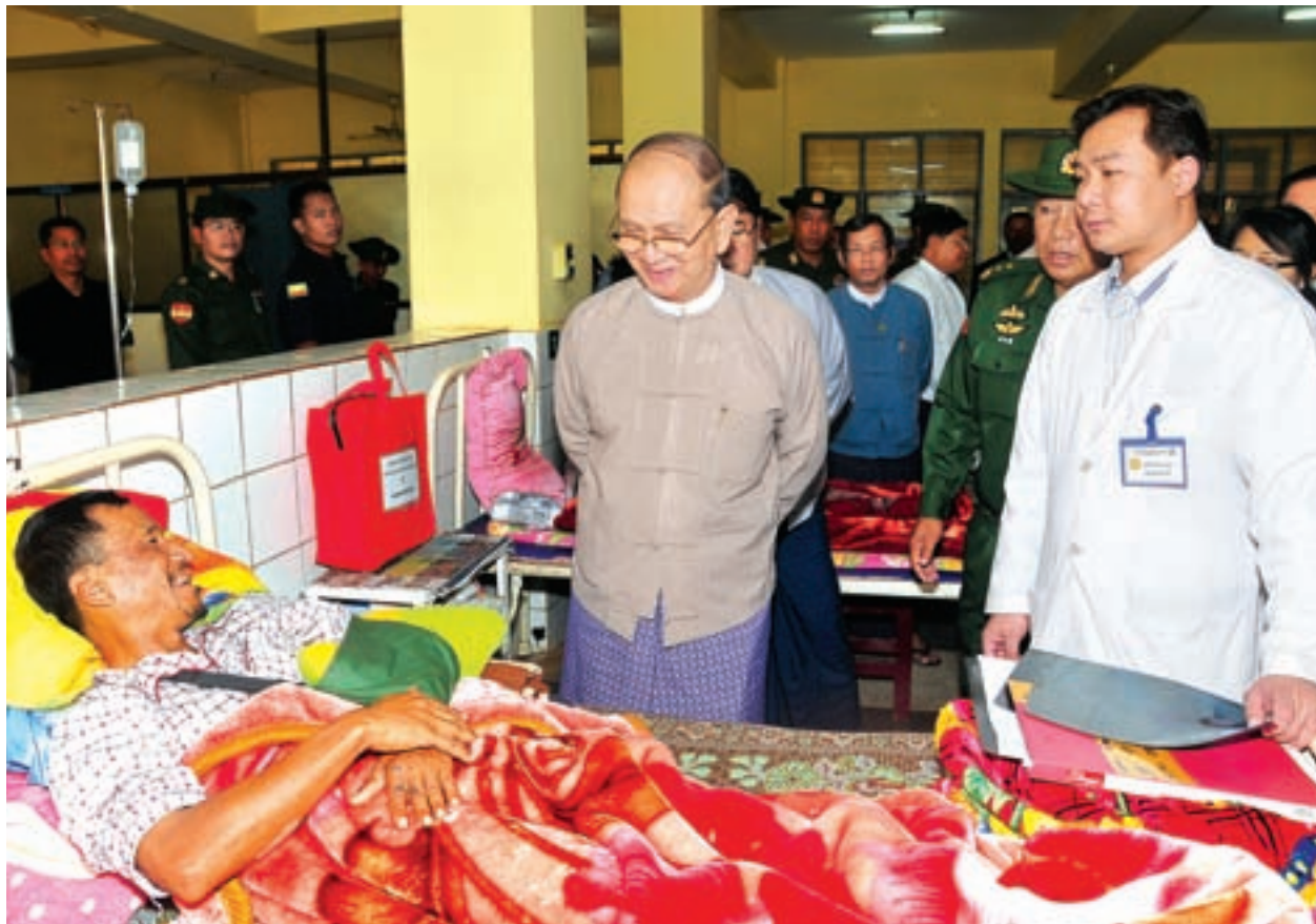
President U Thein Sein comforts a victim injured in Laukkai region at Lashio General Hospital.

The president visited a general hospital in