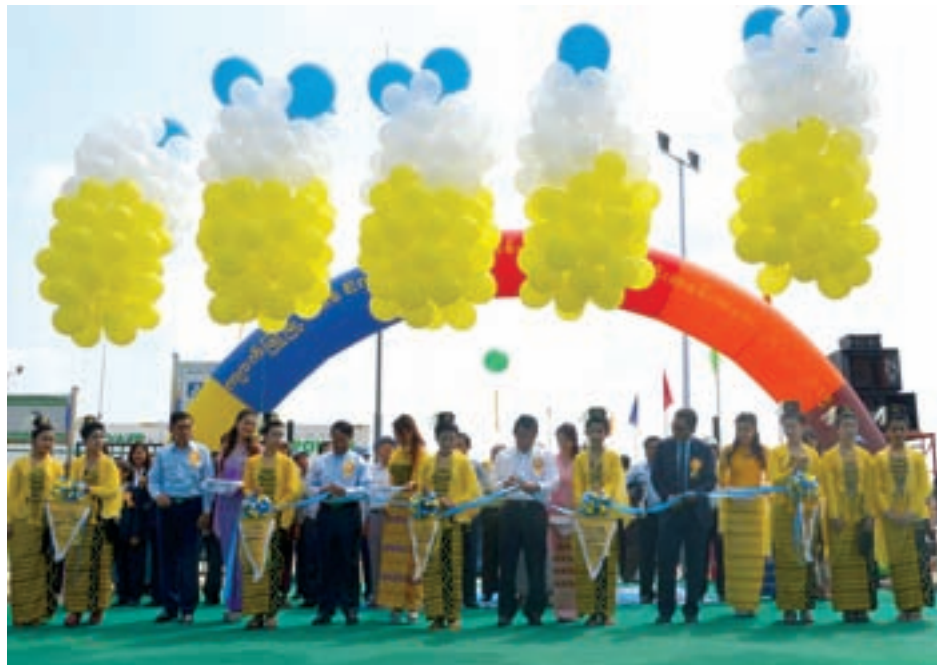
Union Minister U Khin Maung Soe and Chief Minister U Maung Maung Ohn cut the ribbon to launch Kyaukpyu gas turbines.

NAY PYI TAW, 27 Feb — A ceremony to mark the launch of sending electricity from gas turbines in Kyaukpyu to Rakhine State and national power grid was held in Kyaukpyu, Rakhine State, on Thursday.