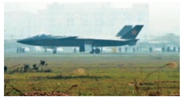
An aircraft that is reported to be Chinese stealth fighter J-20 is seen in Chengdu, Sichuan Province, in this picture taken on 7 Jan, 2011, and released by Kyodo news agency on 8 Jan, 2011.

It also shows female pilots and another new type of aircraft, the Y-20 military transport aircraft. While China is still only in the early stages of testing stealth technology and any deployment is likely years away, it could eventually help narrow the military gap with