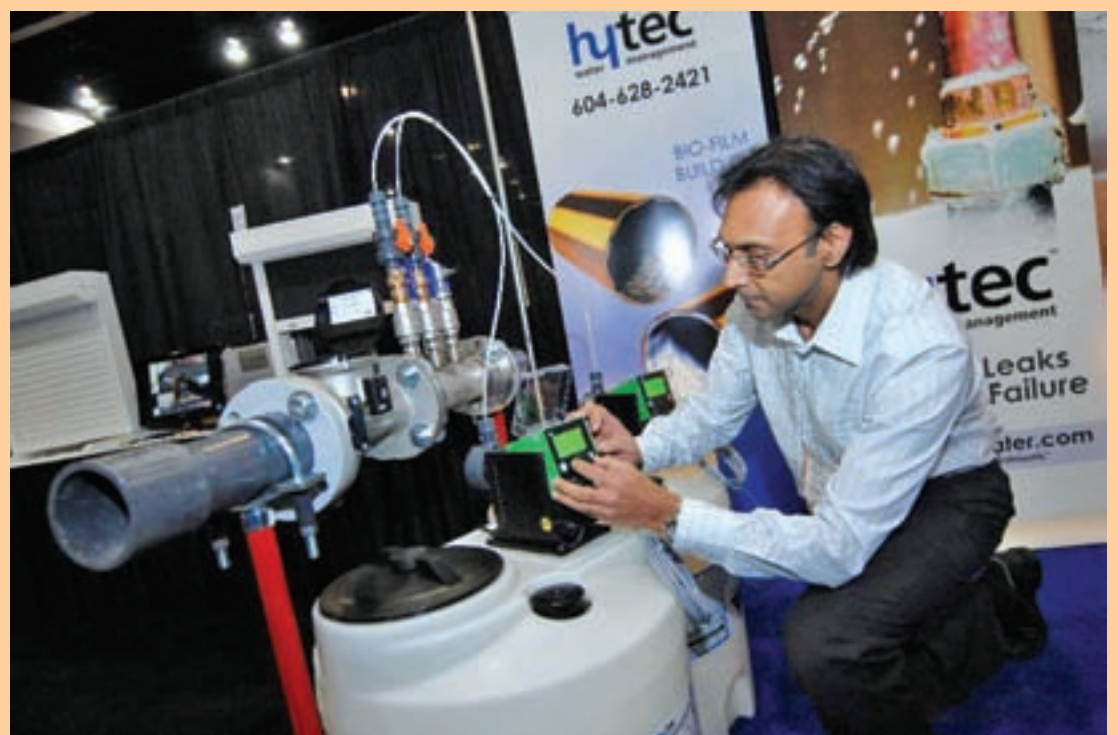
An exhibitor demonstrates new Hytec water management systems at the 2015 BUILDEX interior design, architecture and construction trade show in Vancouver, Canada on 25 Feb, 2015. BUILDEX Vancouver is one of Canada's largest tradeshow and conferences, welcoming over 15,500 design, construction and real estate management professionals each year.