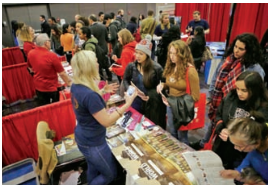
Students communicate with university representatives during the Study and Go Abroad Fair at Vancouver Convention Centre in Vancouver, Canada, on 22 Feb, 2015. The fair is the largest education expo in Canada. It showcases 122 universities from 30 countries that offer different subjects and courses for those who are looking for options in studying overseas.

For the establishment of such Zone, MAPCO is seeking the Proposal on Conducting Feasibility Study from those who are well-experienced in conducting Feasibility Study for intended project. Interested parties are to submit the Proposal by (24-4-2015), addressed to MAPCO Office, No 100, Wardan Port Area, on Concrete New Highway, Seikkan Township, Yangon. Enquiries can be made by email at bod@mapco-ygn.com or md@mapco-ygn.com or phone to Planning & Project Management Department, 01-2301652, 01-230 1653.