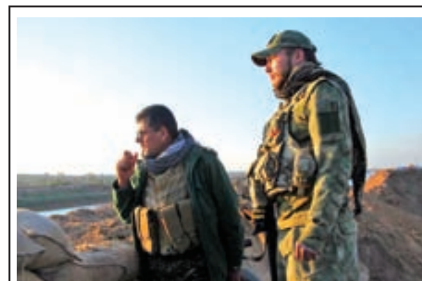
Government-backed Sunni Arab tribesmen from paramilitary groups look into the area controlled by Islamic State militants in Kirkuk, north Iraq, on 26 Feb, 2015.