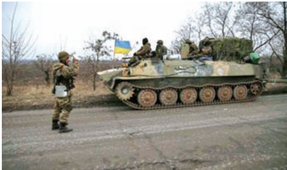
A convoy of Ukrainian armed forces including armoured personnel carriers, military vehicles and cannons prepare to move as they pull back from the Debaltseve region, in Paraskoviivka, eastern Ukraine, on 26 Feb, 2015.— REUTERS

Ukraine's military accused Russia last week of sending more tanks and troops towards the rebel-held town of Novoazovsk, expanding their presence on what it fears could be the next battlefield.— Reuters